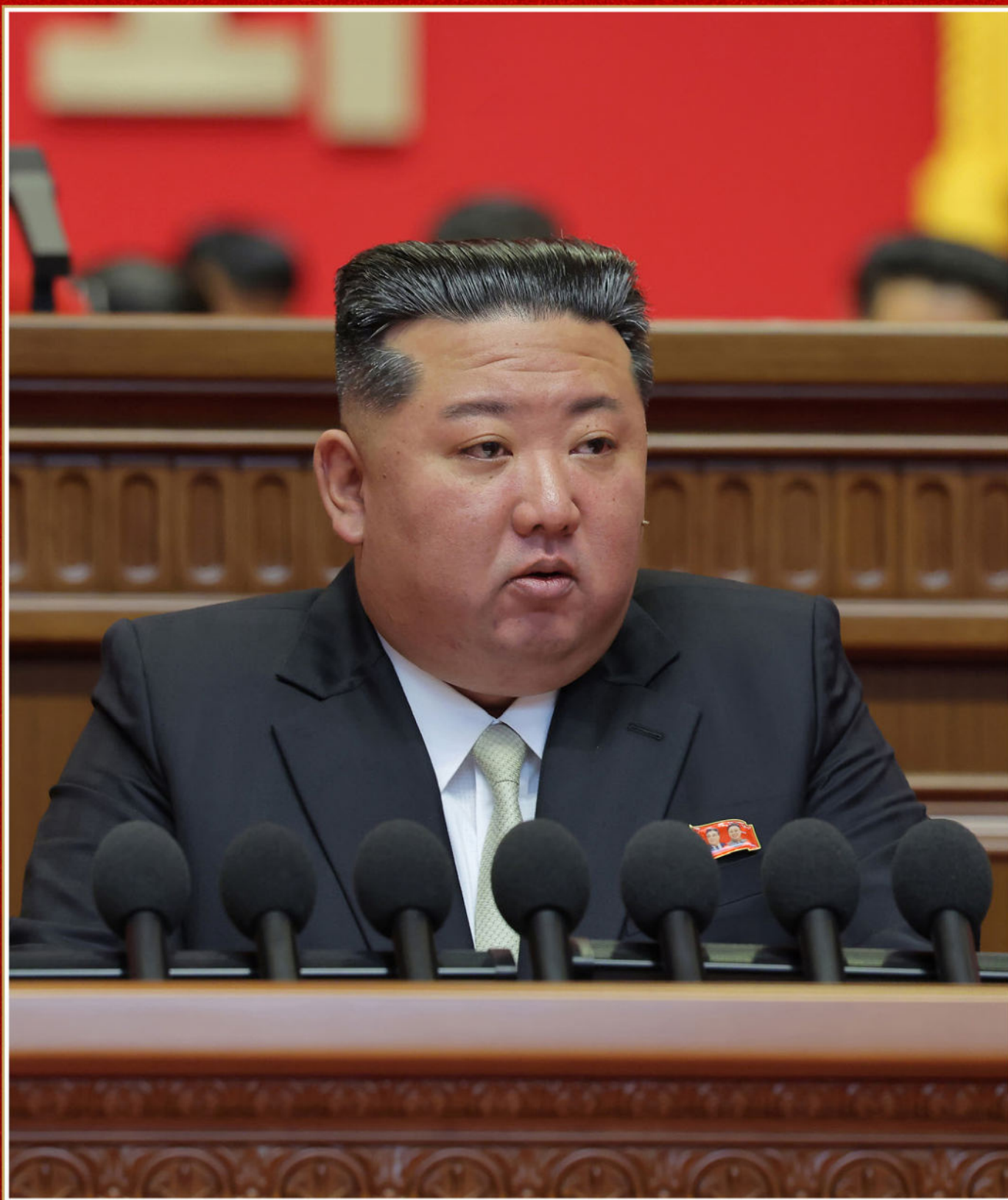
Kim Jong Un made a closing address at the Ninth Congress of the WPK.