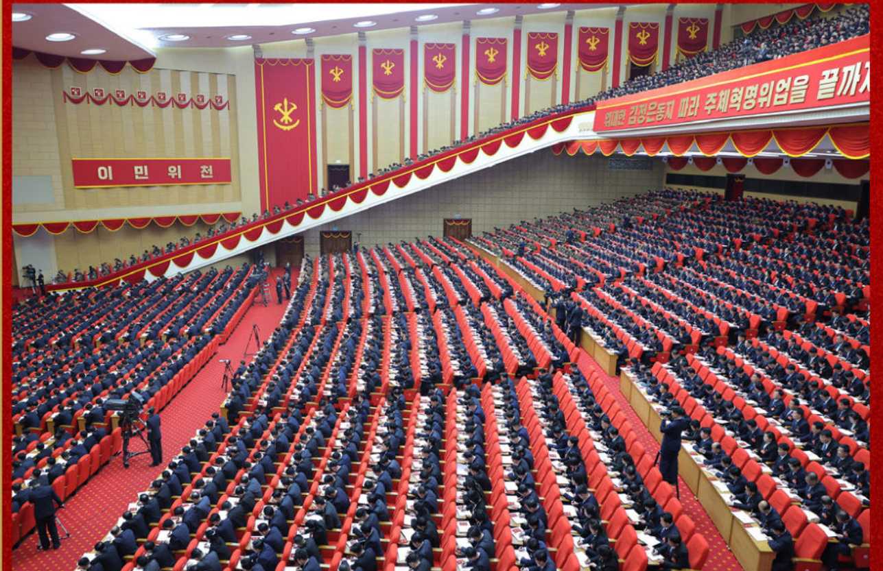
Kim Jong Un, general secretary of the Workers' Party of Korea, made an important concluding speech.

Noting that no challenge or change in situation can ever delay or check our advance, he ardently called on all the participants to fight vigorously to bring earlier the day, when our people's ideals and long-cherished desires will come true, by redoubling their enthusiasm and fighting spirit, full of confidence in the future of the socialist cause.