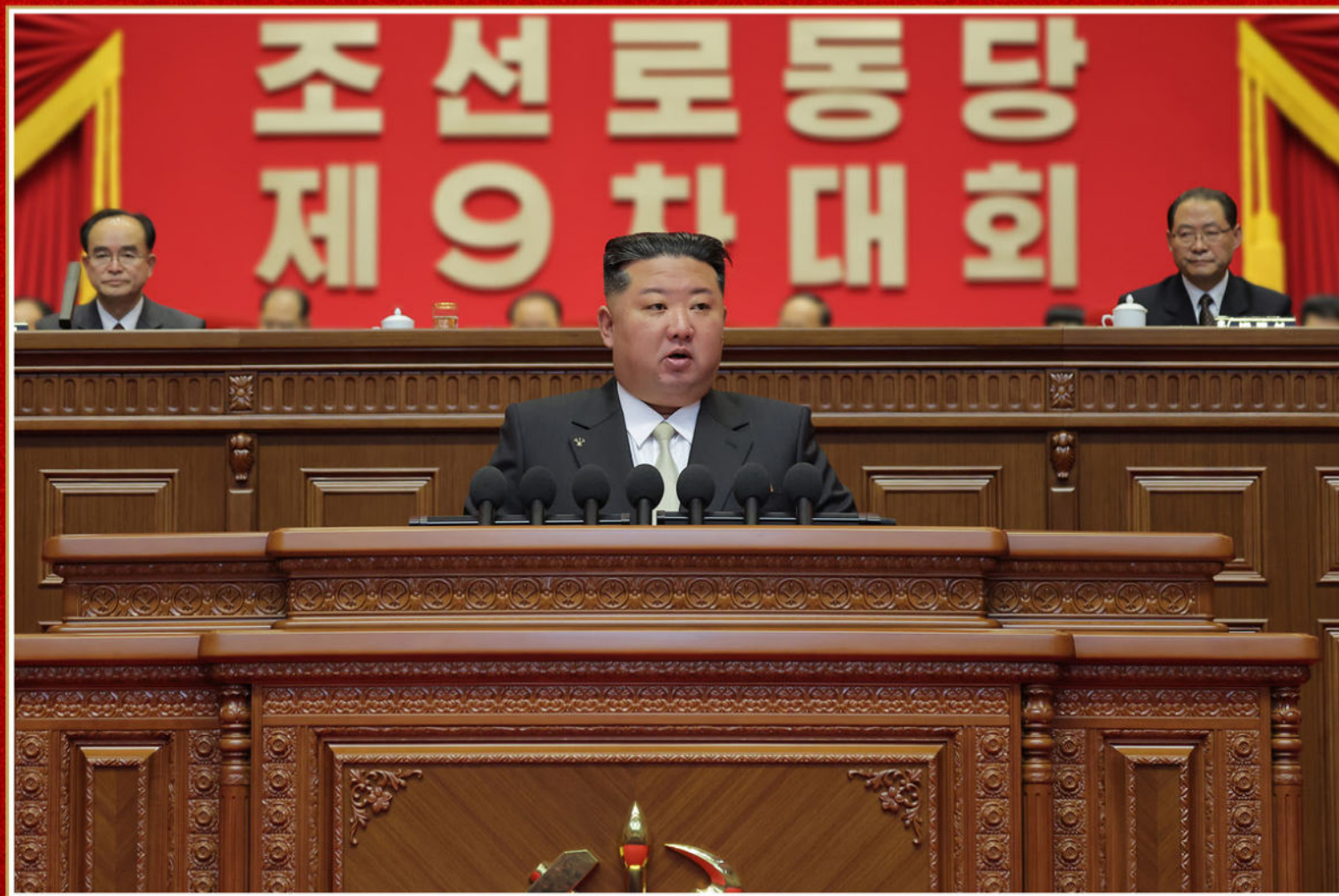
The respected Comrade Kim Jong Un delivered an opening address at the Ninth Congress of the Workers' Party of Korea.

He said that the past five years since the Eighth Congress of the WPK was a proud period when the whole Party and all the people brought about an epochal turn in accomplishing the socialist cause of a Korean style on the strength of solid unity. We convened the Eighth Congress of the WPK five years ago with the conviction, will and determination to break through the worst difficulties facing the revolution by our own efforts and usher in a new era of advance and development without fail, but today we are here at the Ninth Congress filled with optimism and confidence in the future, he said, adding that this is a great change and development as well as a success we can be proud of at the present stage.