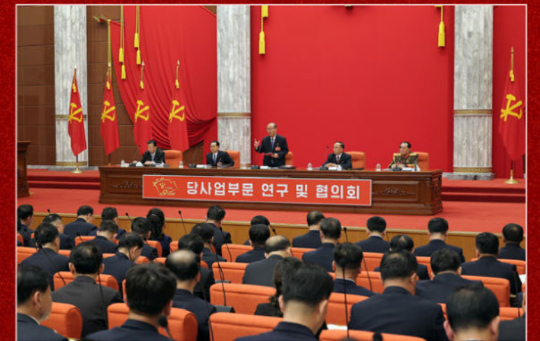
Sectional study and consultative meetings were held to take correct measures for implementing the new five-year plan and reflect them in the decisions of the Congress. At consultative meetings, the delegates fully displayed extraordinary Party consciousness and a high sense of responsibility so as to ensure that every paragraph of the plans of all the sectors serves as the most scientific and reasonable cornerstone for the perfect implementation of the struggle programme of the Party, and actively proposed innovative and creative opinions that would contribute to firmly guaranteeing the success of the new five-year plan.