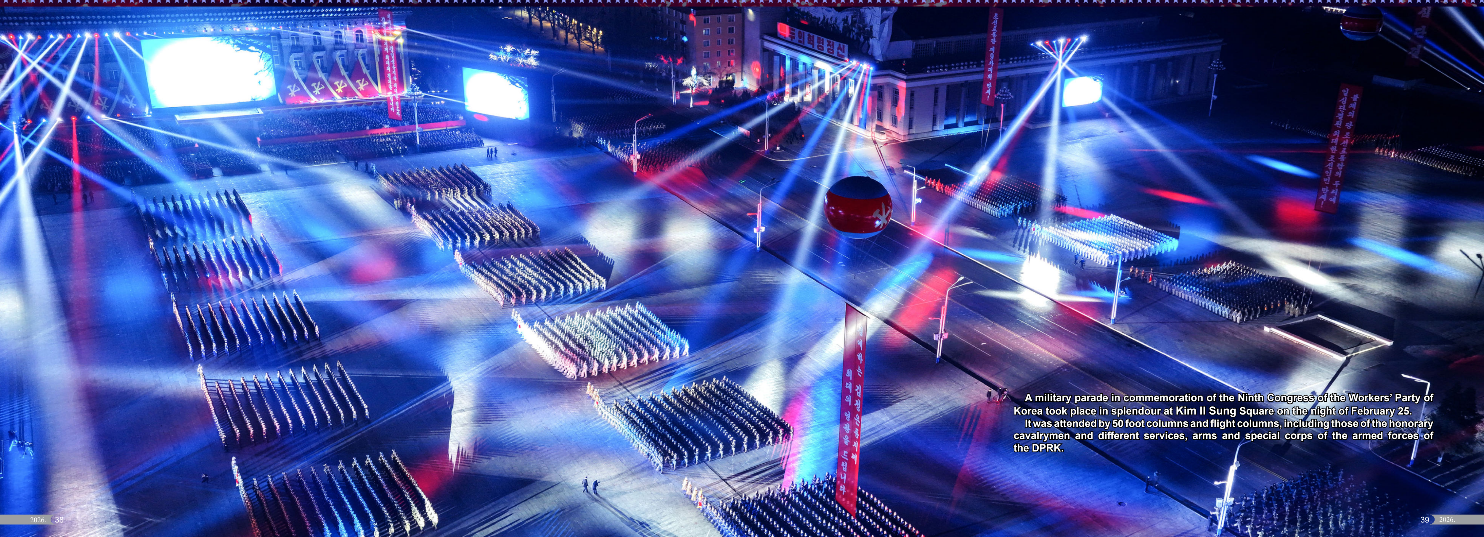
A military parade in commemoration of the Ninth Congress of the Workers' Party of Korea took place in splendour at Kim Il Sung Square on the night of February 25. It was attended by 50 foot columns and flight columns, including those of the honorary cavalymen and different services, arms and special corps of the armed forces of the DPRK.