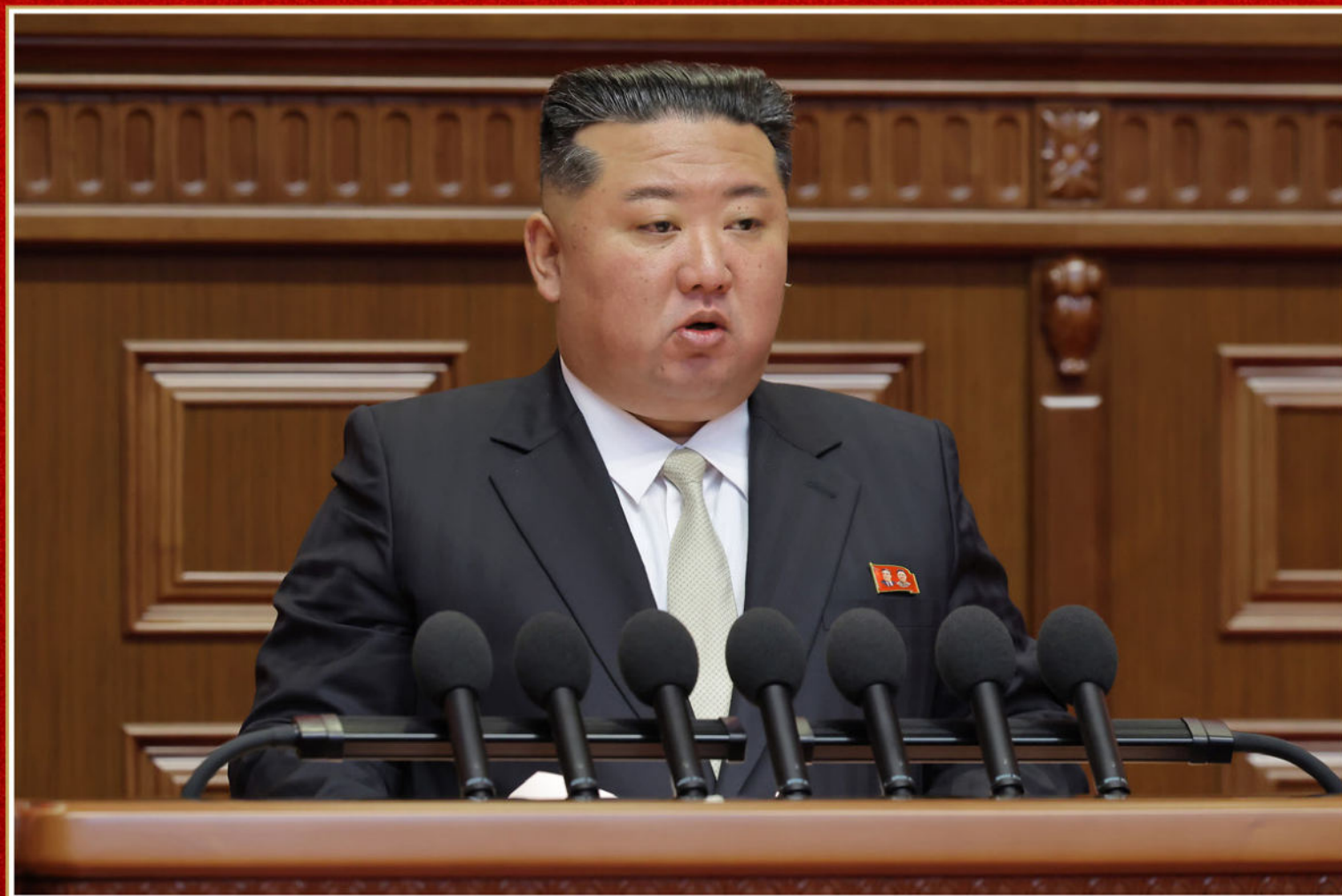
Kim Jong Un made a report on the review of the work of the Eighth Central Committee of the WPK.

The parts of his report on the review of the work of the Party Central Committee are as follows: