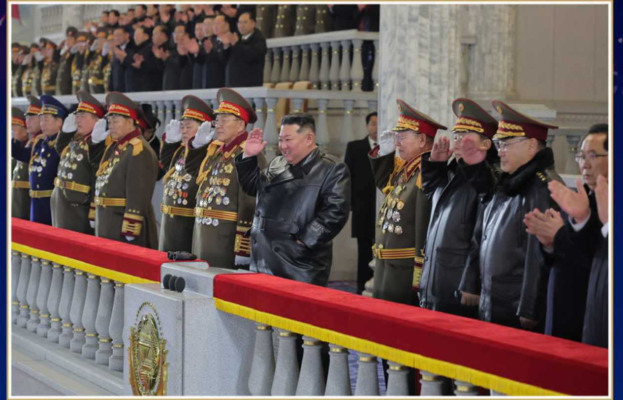
Kim Jong Un extended a militant salute to the elite units which performed undying feats that would shine forever in history, demonstrating to the world the political and ideological superiority and mightiness peculiar to the KPA regarding absolute loyalty to the WPK as its bloodline.