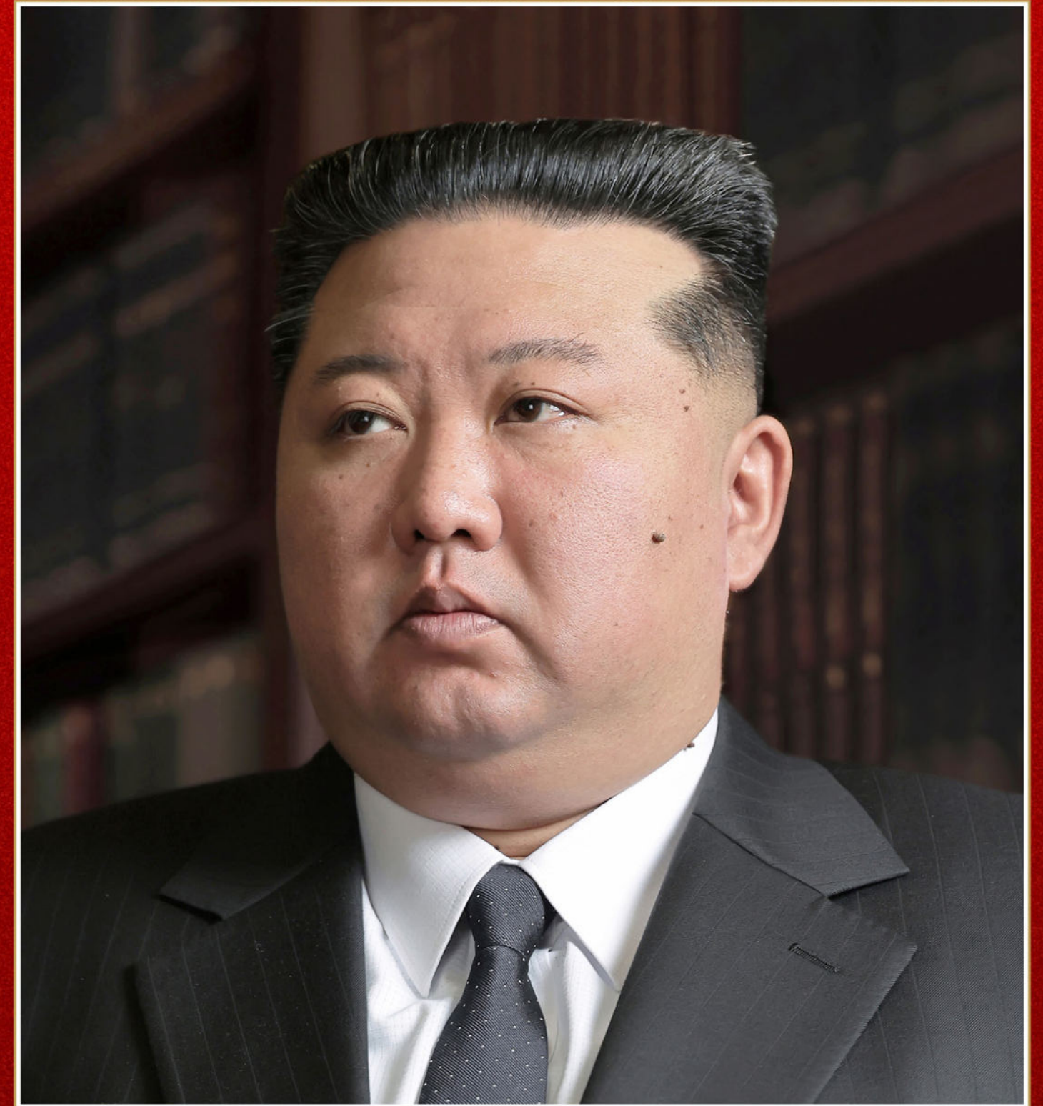
Kim Jong Un, general secretary of the Workers' Party of Korea

The delegates adopted with unanimous approval the decision on electing him general secretary of the WPK in reflection of the will of the entire Party.