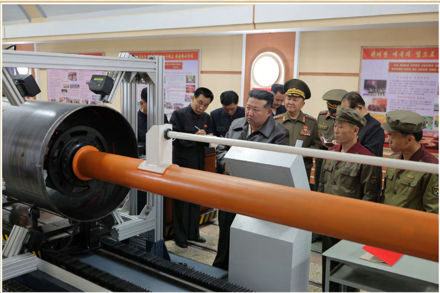
Kim Jong Un, general secretary of the Workers' Party of Korea and president of the State Affairs of the Democratic People's Republic of Korea, gave field guidance at major munitions enterprises under the Commission of the Second Economy to learn about the production of artillery shells and the actual state of the machine-building industry.