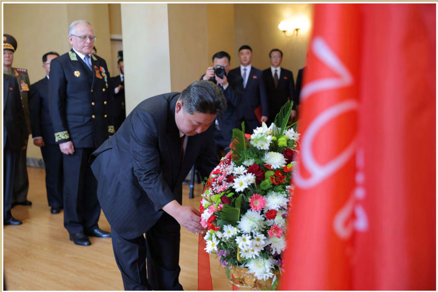
Kim Jong Un, general secretary of the Workers' Party of Korea and president of the State Affairs of the Democratic People's Republic of Korea, paid a congratulatory visit to the Russian embassy in Pyongyang on May 9 on the occasion of the 80 th anniversary of Russia's victory in the Great Patriotic War.