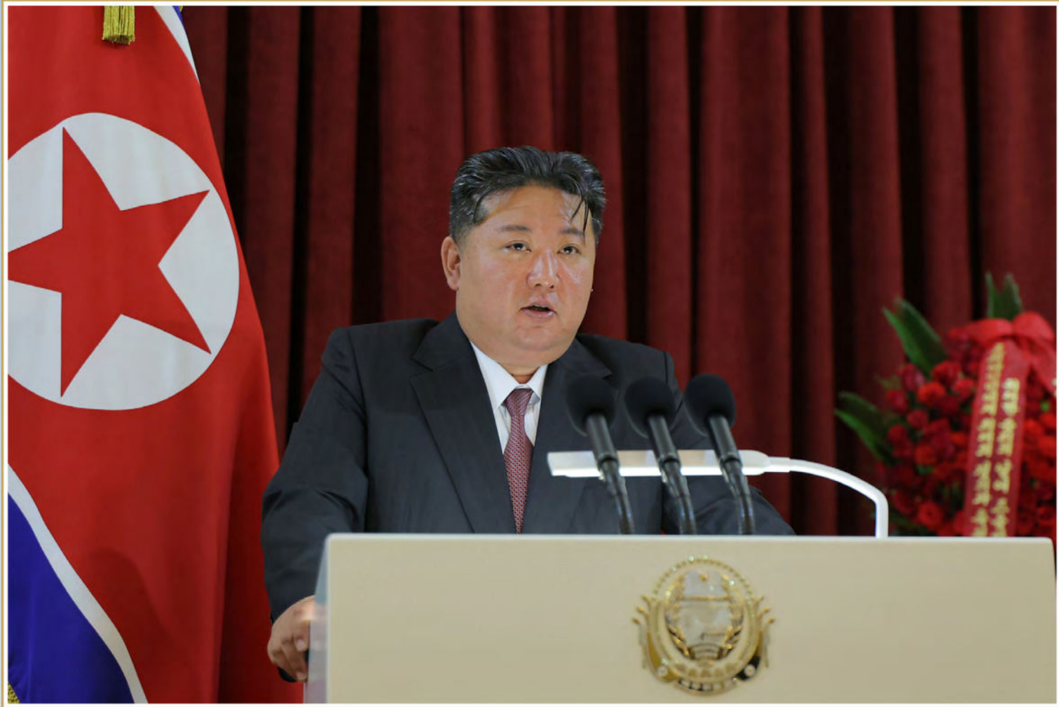
The respected Comrade Kim Jong Un made a congratulatory speech. He expressed his impression of having an opportunity to personally convey the tender feeling and intention of the Korean people to the Russian people on the occasion of Russia's great V-day. And on behalf of the Party and government, armed forces of the Republic and all the Korean people, he extended warm congratulations to the president of the Russian Federation, the leadership of Russia, the courageous Russian army, all the Russian people, war veterans and others who performed meritorious wartime service.