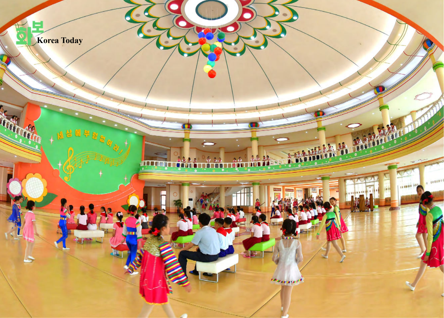
Schoolchildren are bringing their talents into full bloom in 30-odd groups.