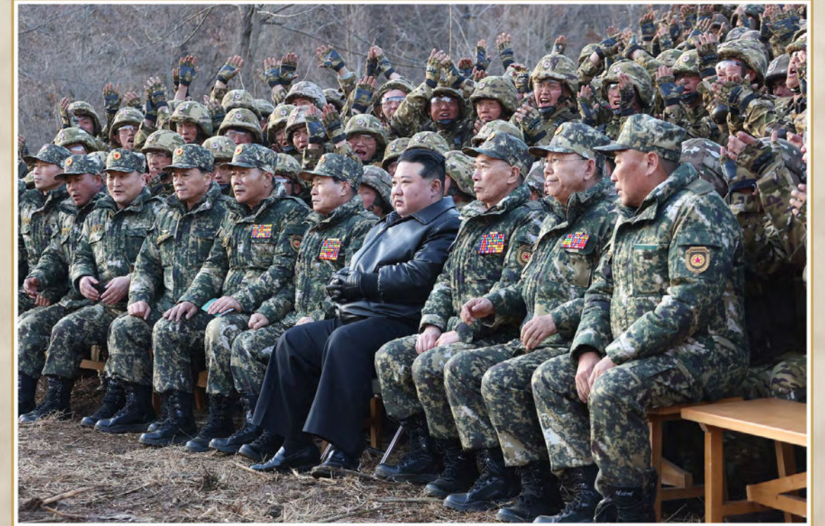
Kim Jong Un has a photo session with the dependable combatants who powerfully demonstrated a match-for-a-hundred fighting efficiency in the drill with their strong will and courage.