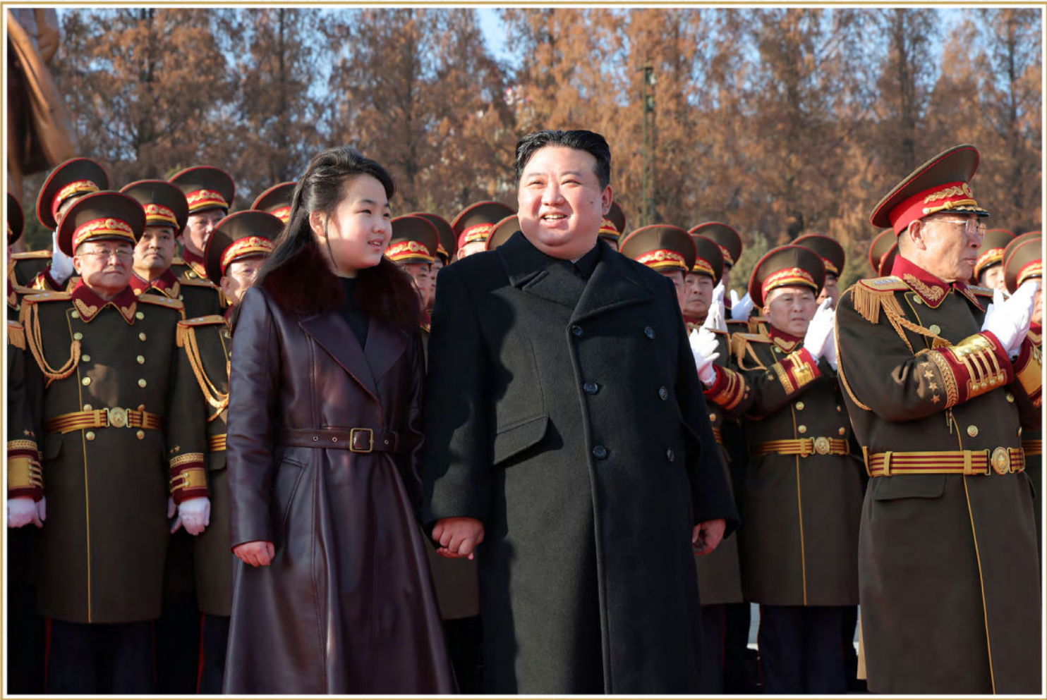
A ceremony of greeting Kim Jong Un, supreme commander of the armed forces of the DPRK, takes place. Kim Jong Un receives a salute from the head of the guard of honour of the KPA and reviews the guard of honour and the glorious colours of the three services.