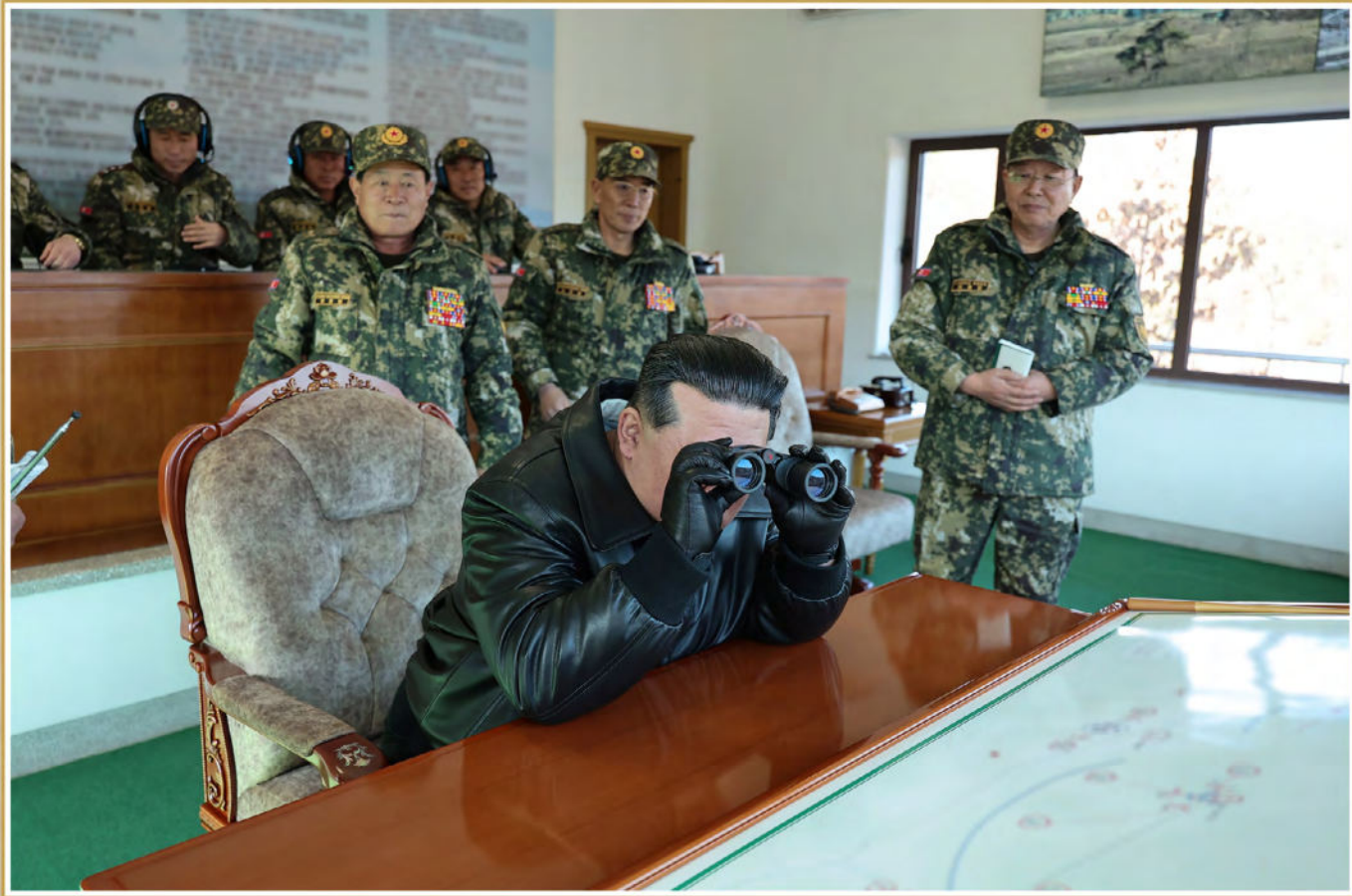
The respected Comrade Kim Jong Un mounts the observation post and receives a report on the program for actual manoeuvres of the units planned that day before guiding the drill.

military policy-oriented tasks set forth before the army by the Party Central Committee. And he stressed the need to make positive use of them so as to practically contribute to strengthening the combat capability of the People's Army, further consolidate the material and