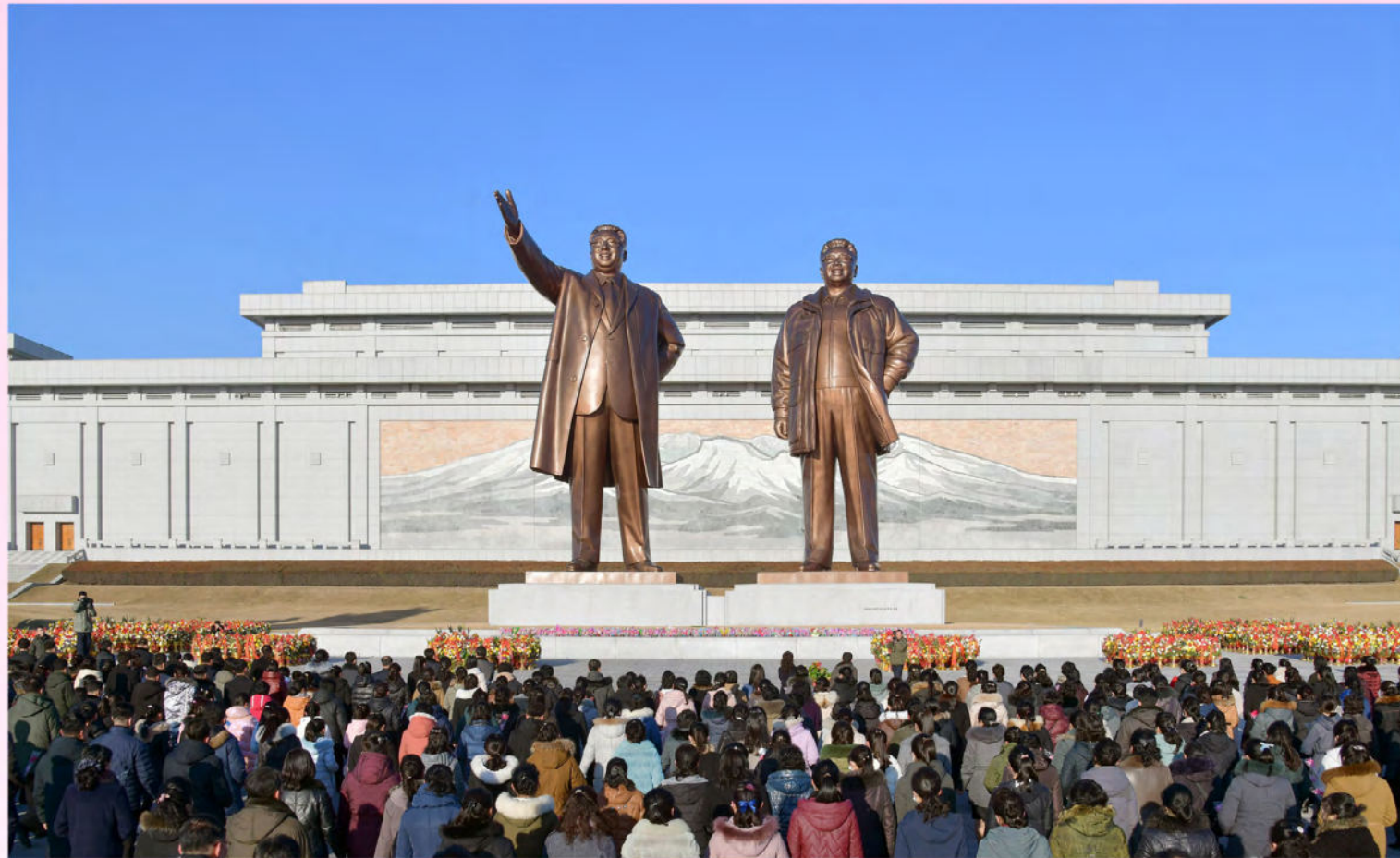
People from all walks of life place floral baskets and flower bouquets before the statues of President Kim Il Sung and Chairman Kim Jong Il on Mansu Hill on the occasion of the auspicious February holiday.