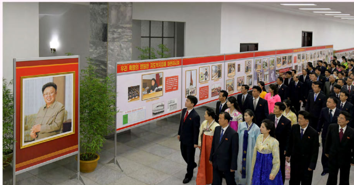
A national photo exhibition "Great leadership, immortal exploits" and a stamp show "Great life" are held.