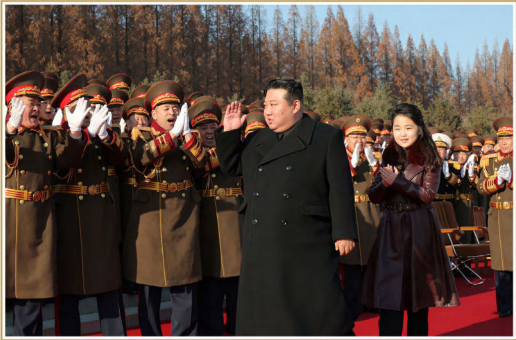
Kim Jong Un has a photo taken with the KPA generals to be recorded in the army-building history.