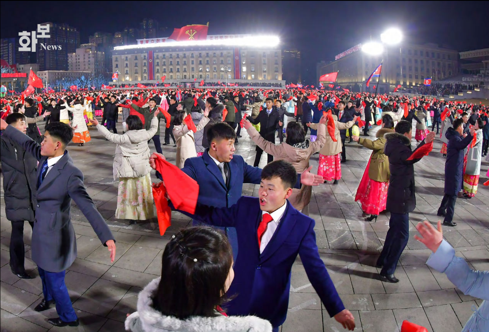
An evening gala of youth and students takes place.