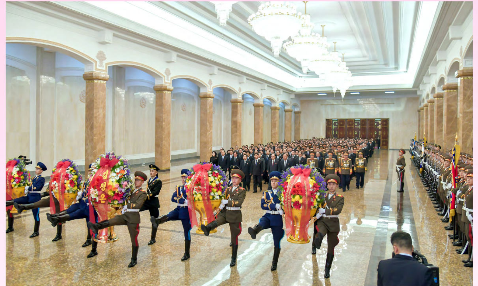
Senior Party and government officials visit the Kumsusan Palace of the Sun to pay homage to the great leaders.