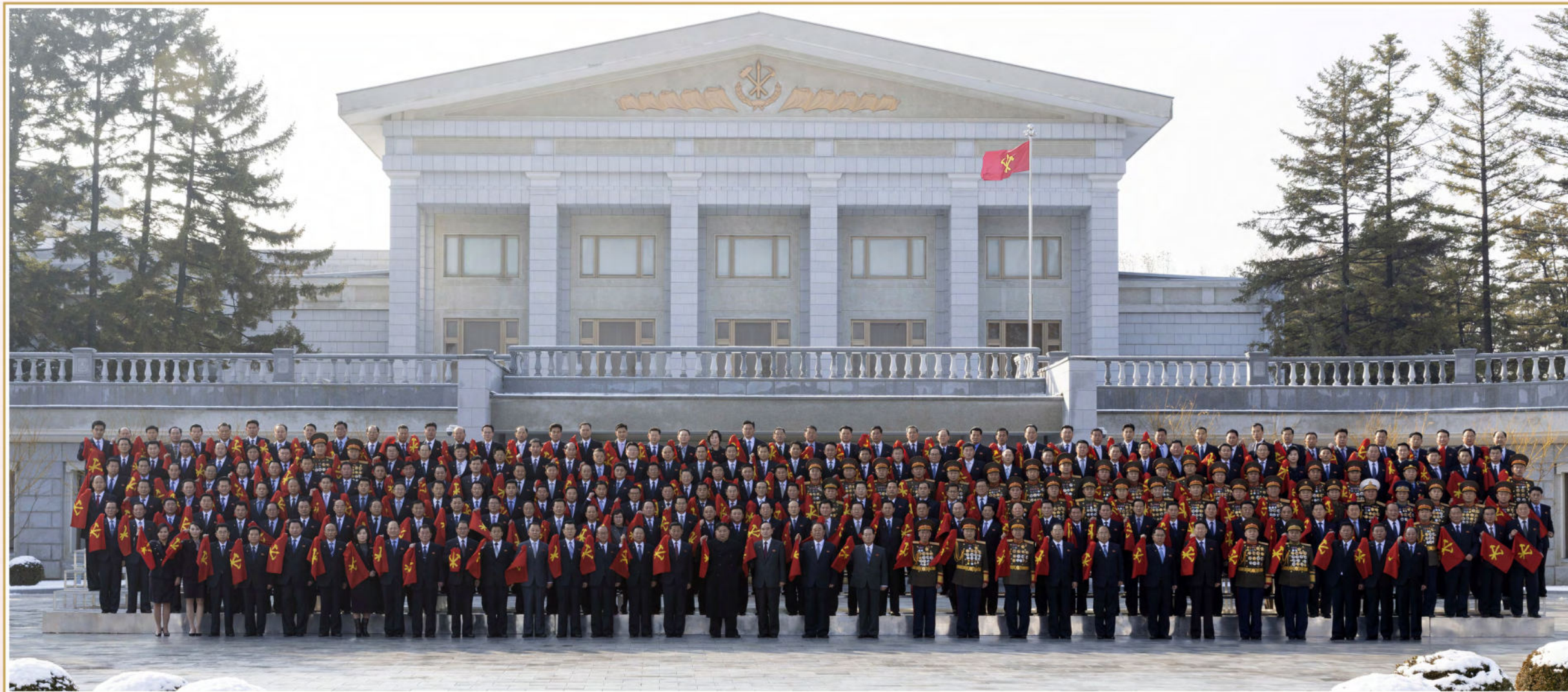
Kim Jong Un has a significant photo session with members of the leadership body of the Party Central Committee.