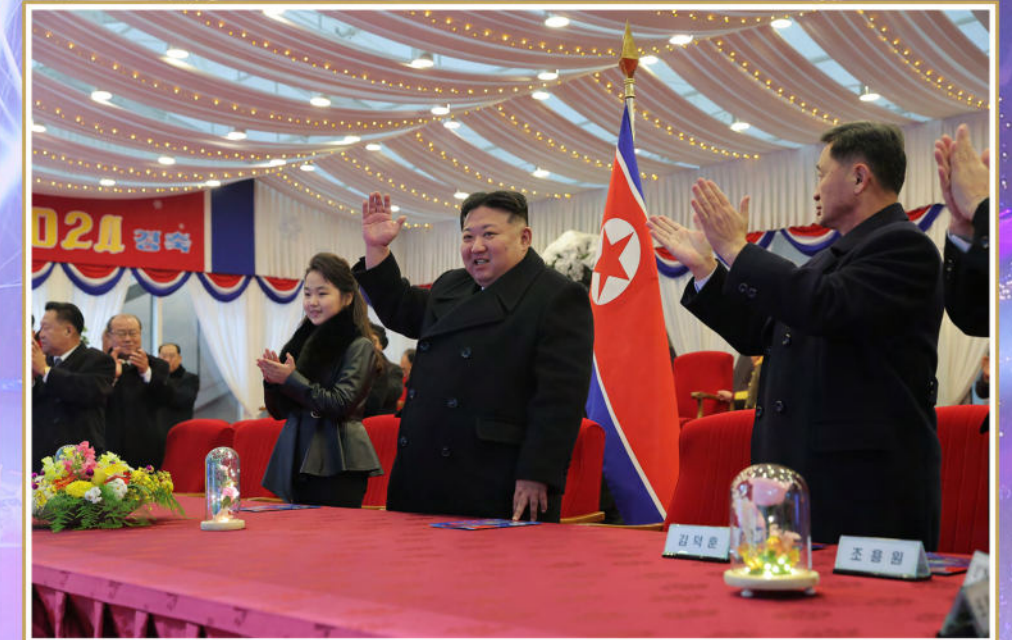
Kim Jong Un waves back to the enthusiastically cheering crowds as a token of his warm greeting of best wishes to all the audience and all the beloved people of the country seeing in the New Year.

He waved back to the enthusiastically cheering crowds as a token of his warm greeting of best wishes to all the audience and all the beloved people of the country seeing in the New Year.