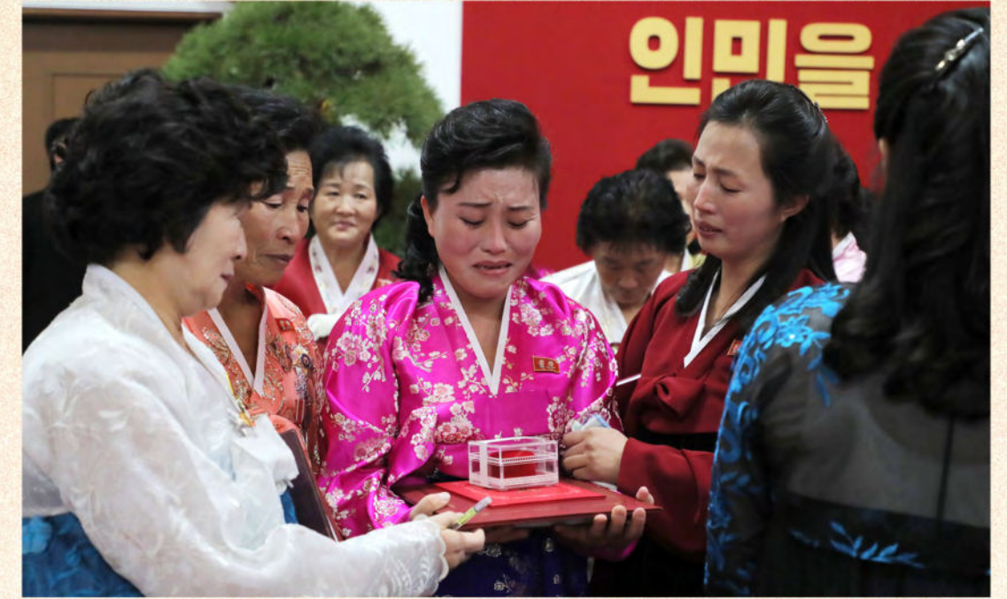
The newly-enacted Communist Mother Honour Prize awarded to the women who have made distinguished contributions to the prosperity of the country