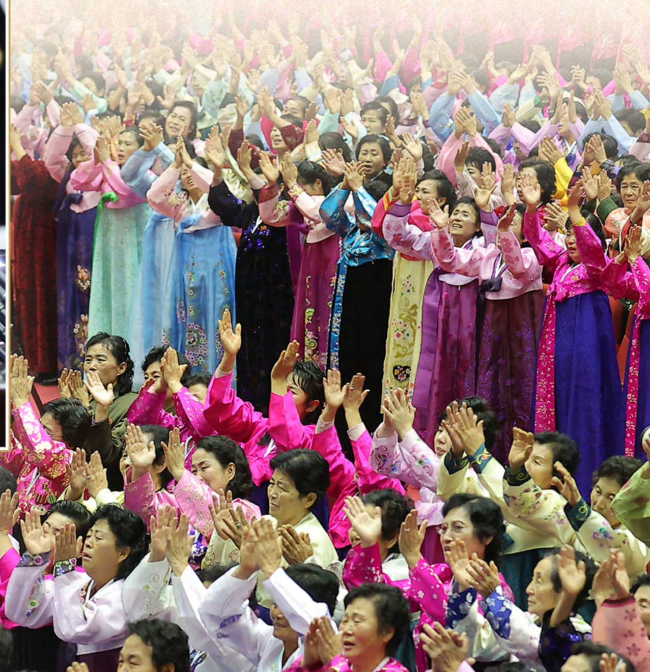
Kim Jong Un, general secretary of the Workers' Party of Korea and president of the State Affairs of the DPRK, attends the conference.

Saying that the small family groups the mothers have built up with such care out of a feeling of patriotism constitute a cornerstone that firmly supports the country, thanks to which the great socialist family remains solidly united and the country continues to grow in strength and highly appreciating that this is an enduring exploit performed by the mothers in Korea for the Party, the revolution and the country, Kim Jong Un, on behalf of the Party Central Committee and the Government of the Republic, offers his heartfelt gratitude and best wishes to all those present at the conference and to all other mothers in the country.