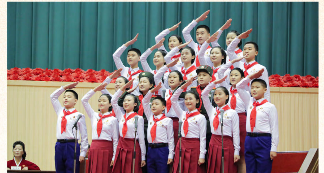
The congratulatory group of the Korean Children's Union reciting a congratulatory poem "We extend glory to the great mother"

socialist construction and a changed ideal society to come in near future.