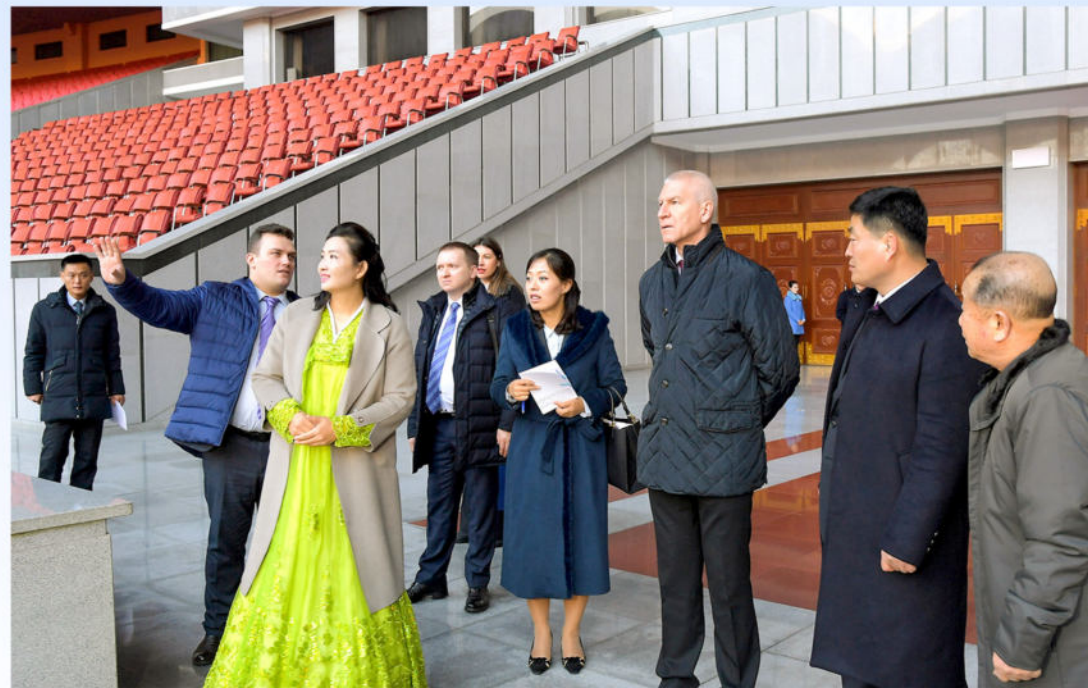
Russian Minister of Sports visits the May Day Stadium

technology took place in Pyongyang that day.