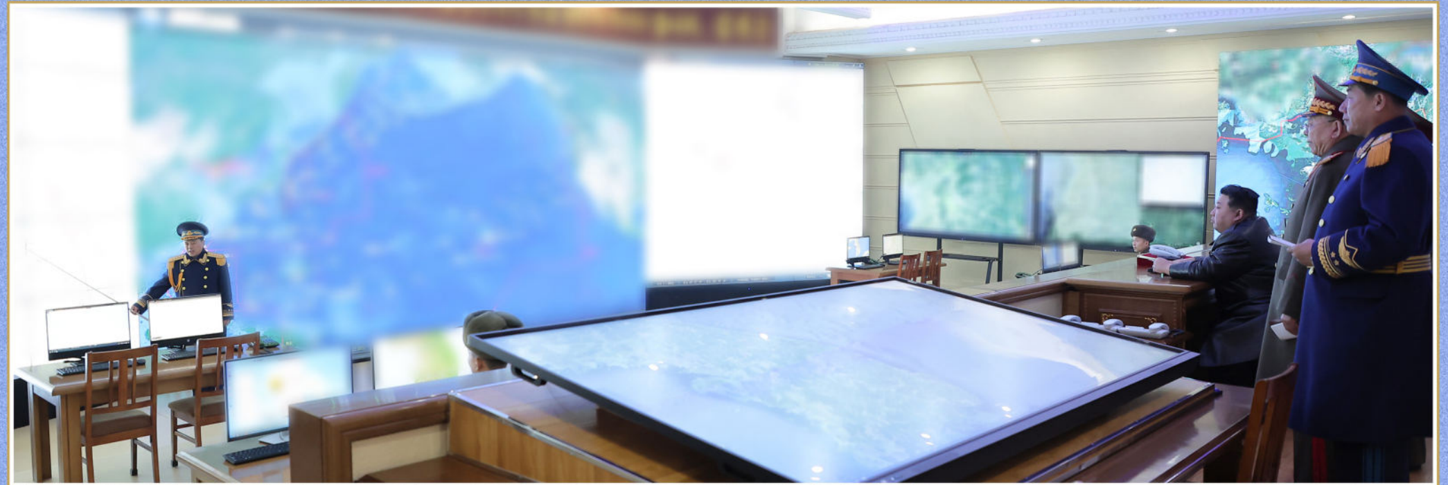
Kim Jong Un, guided by the commander of the Air Force, goes round the operation command post and the room for study of operational plan