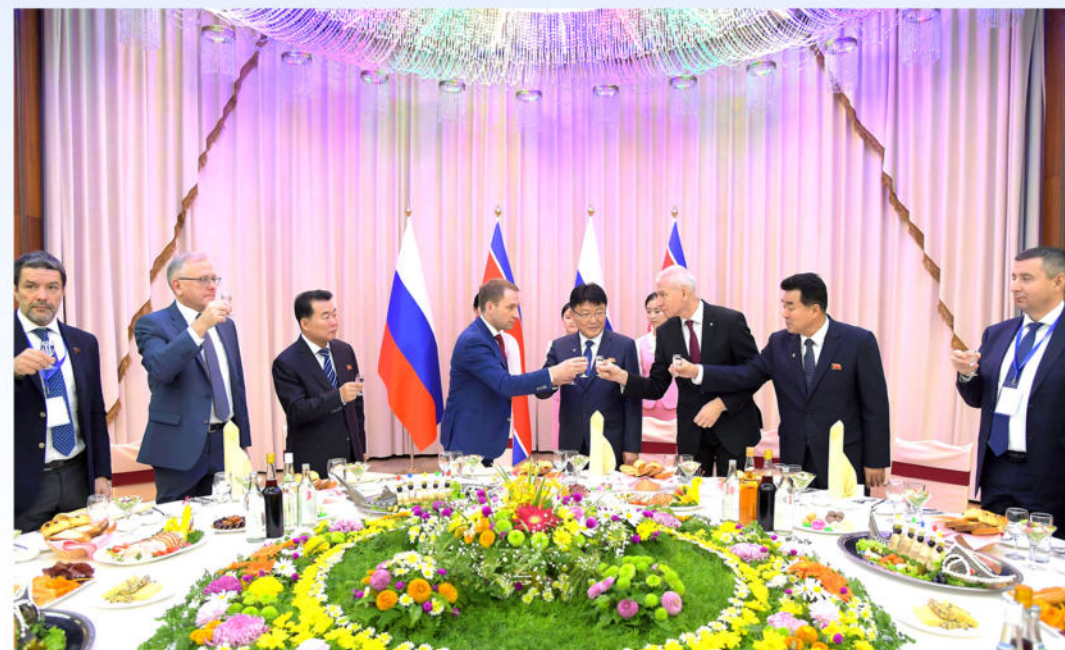
The DPRK government hosts reception to welcome the Russian delegation

The tenth meeting of the DPRK-Russia inter-governmental committee for cooperation in trade, the economy, science and