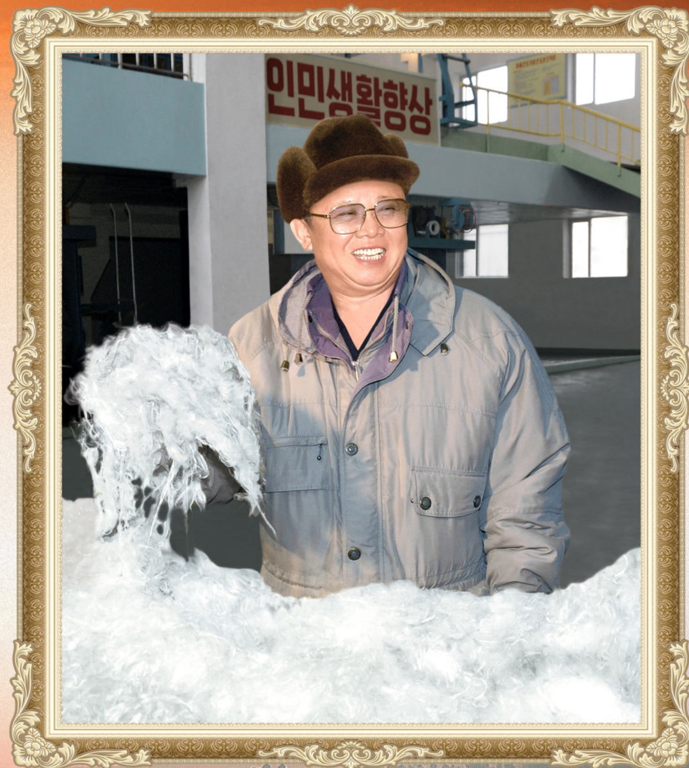
Kim Jong Il looking vinalon cotton at February 8 Vinalon Complex February Juche 99 (2010)

Though he was on the journey of field guidance, without relaxing even on holidays and red-letter days, he was always short of time.