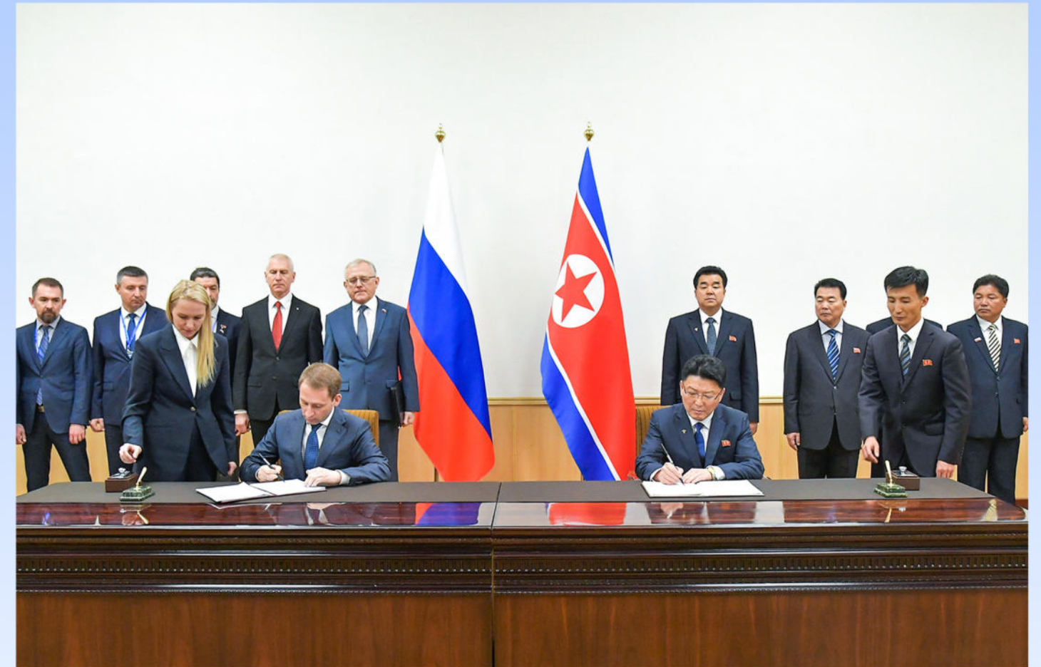
The protocol of the tenth meeting of the DPRK-Russia inter-governmental committee for cooperation in trade, the economy, science and technology is signed

The government delegation of the Russian Federation led by Alexandr Kozlov, minister of Natural Resources and Ecology, visited the DPRK between November 14 and 16 to attend the tenth meeting of the DPRK-Russia inter-governmental committee for cooperation in trade, the economy, science and technology.