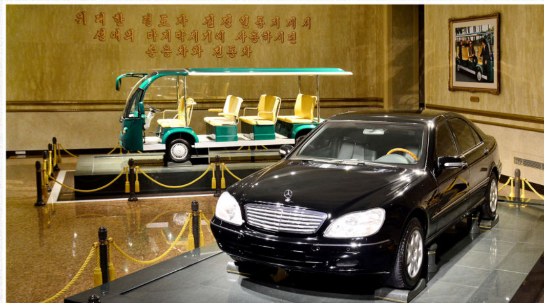
The car and battery-powered car used by the Chairman in the last days of his life