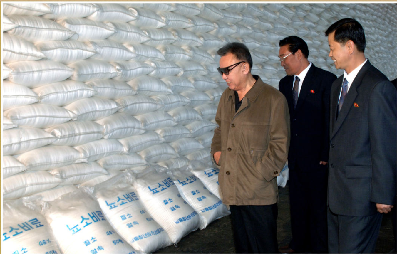
Kim Jong Il visiting Namhung Youth Chemical Complex June Juche 99 (2010)