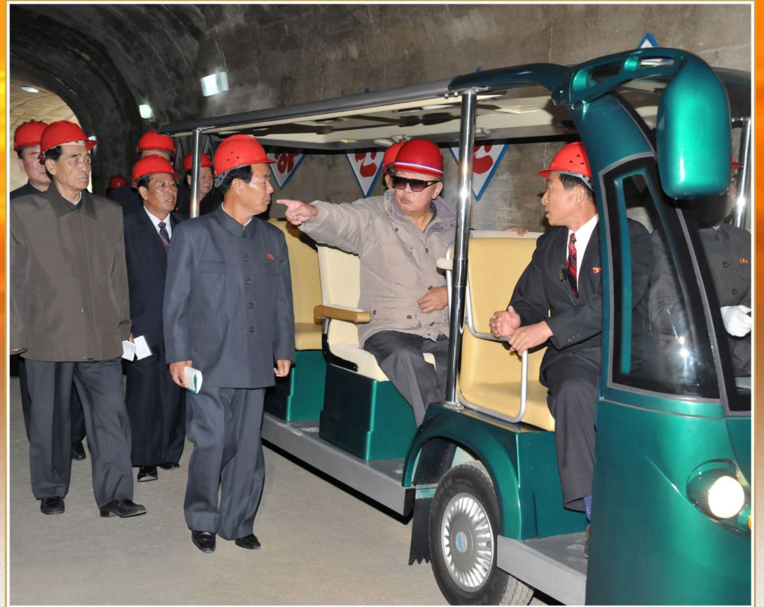
Kim Jong Il visiting Ryongyang Mine October Juche 100 (2011)

When he visited a province in the last days of his life, officials there said earnestly that he should not be on the journey in the cold weather. Saying to them not to worry because everything would be fine when he made frequent visits, he gave them a big smile.