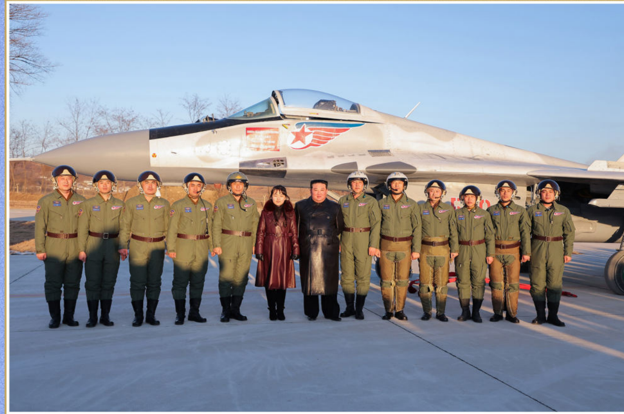
Kim Jong Un summons the airpersons who took part in the drill and has a photo session