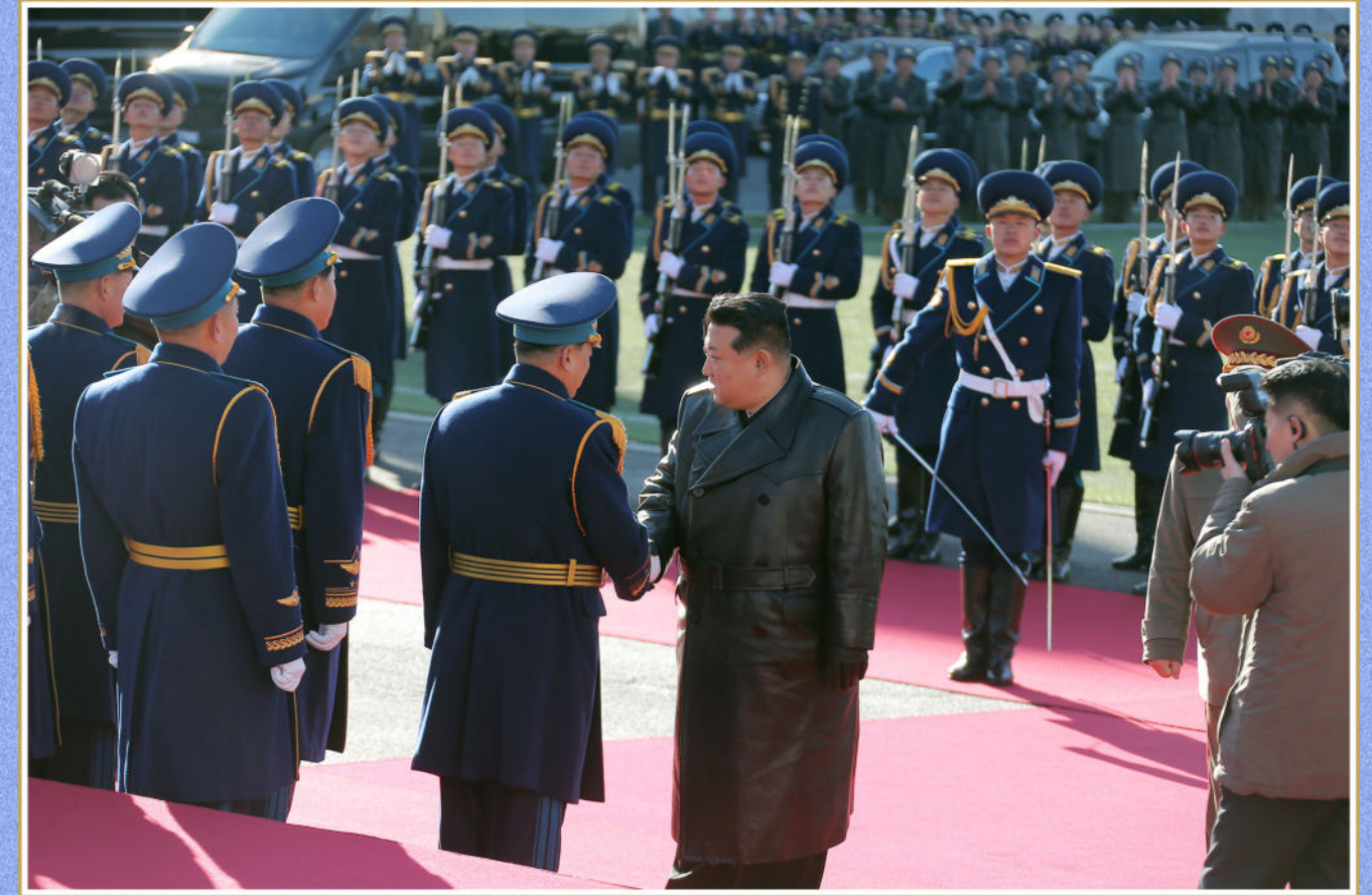
Kim Jong Un receives a salute from the head of the guard of honour of the KPA Air Force and reviews the guard