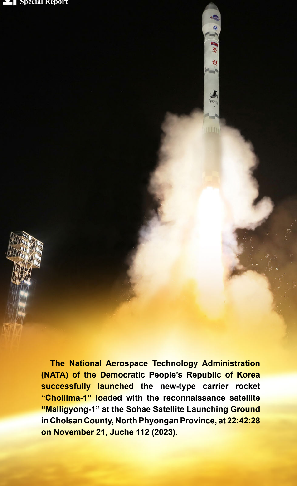
The National Aerospace Technology Administration (NATA) of the Democratic People's Republic of Korea successfully launched the new-type carrier rocket "Chollima-1" loaded with the reconnaissance satellite "Malligyong-1" at the Sohae Satellite Launching Ground in Cholsan County, North Phyongan Province, at 22:42:28 on November 21, Juche 112 (2023).