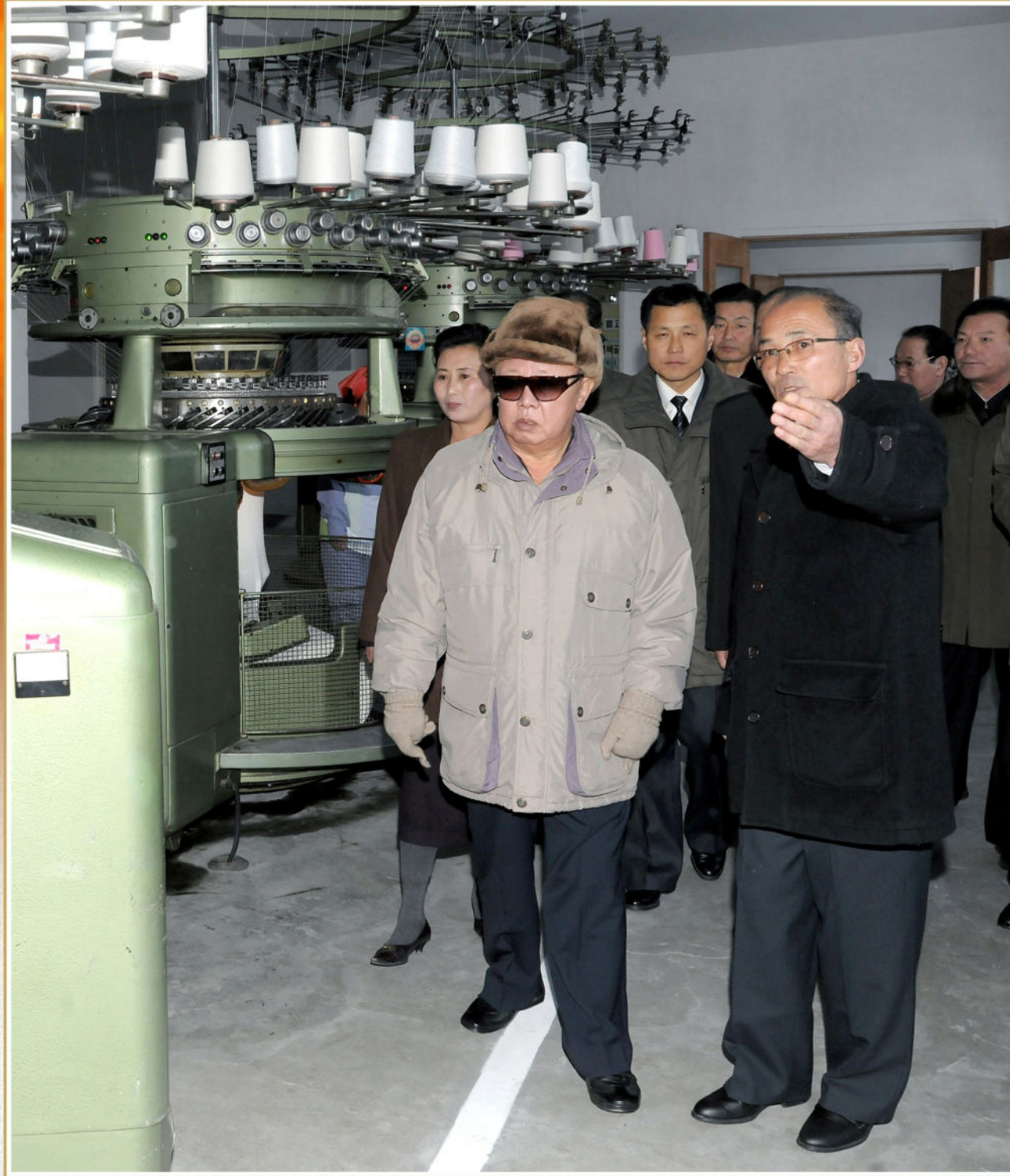
Kim Jong Il visiting Hamhung Knitwear Factory December Juche 100 (2011)