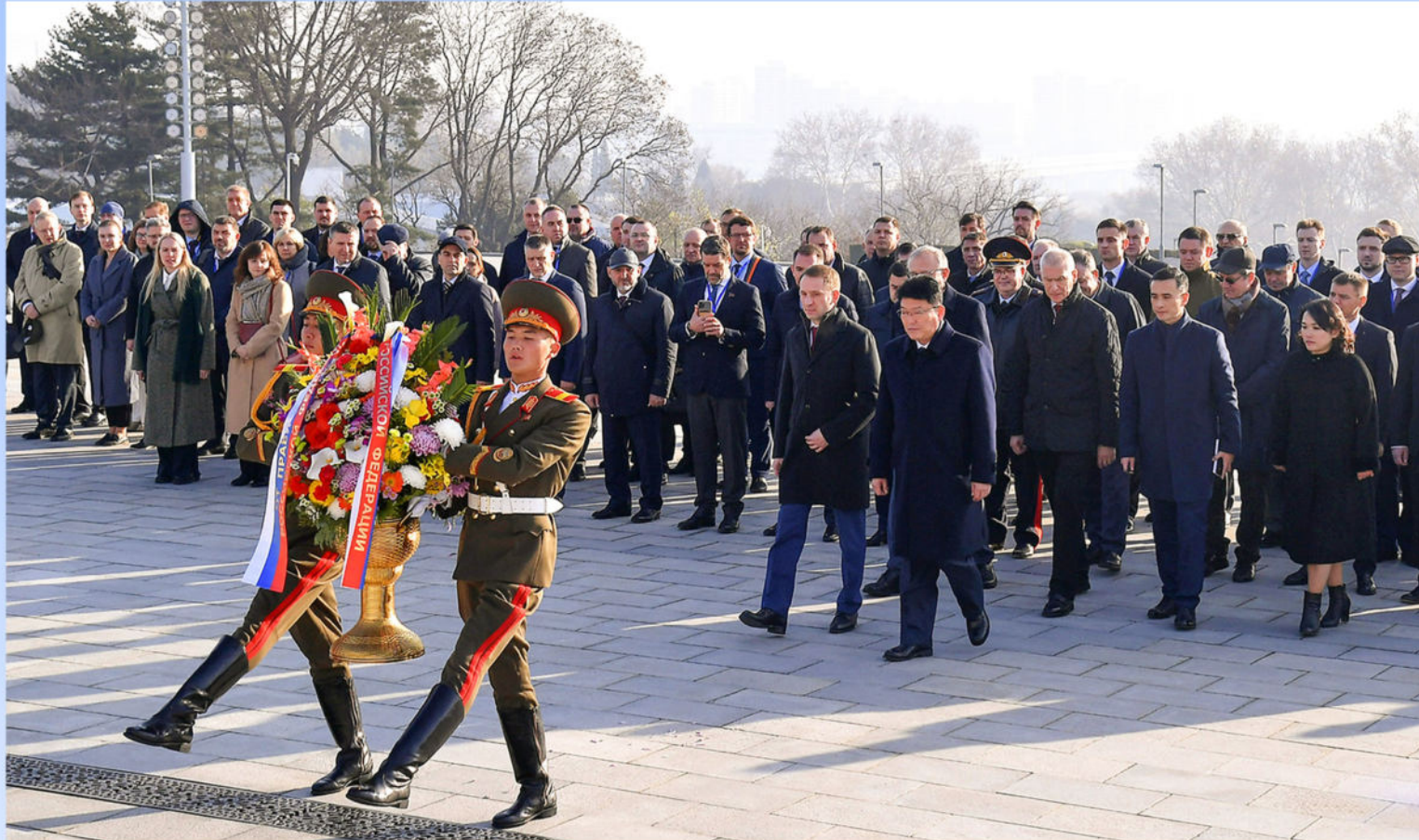
The Russian delegation lays a flower basket before the statues of President Kim Il Sung and Chairman Kim Jong Il on Mansu Hill