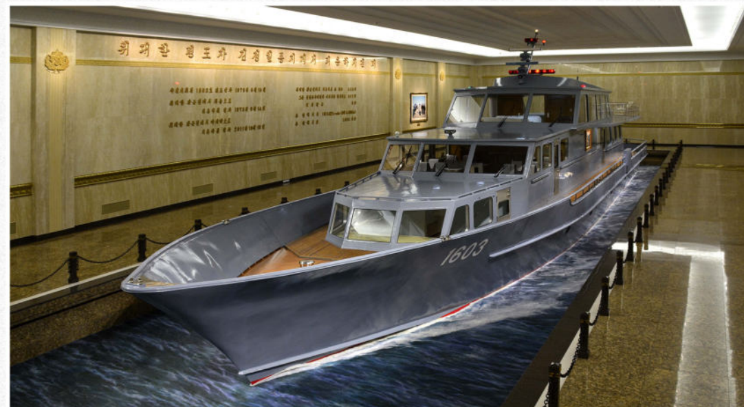
The boat used by the Chairman

The painstaking efforts he made while conducting energetic field guidance, rain or shine, created such new terms as the forced march in the blizzards, the forced march in the hottest days, and high-intensity forced march, which touch the hearts of the Korean people.