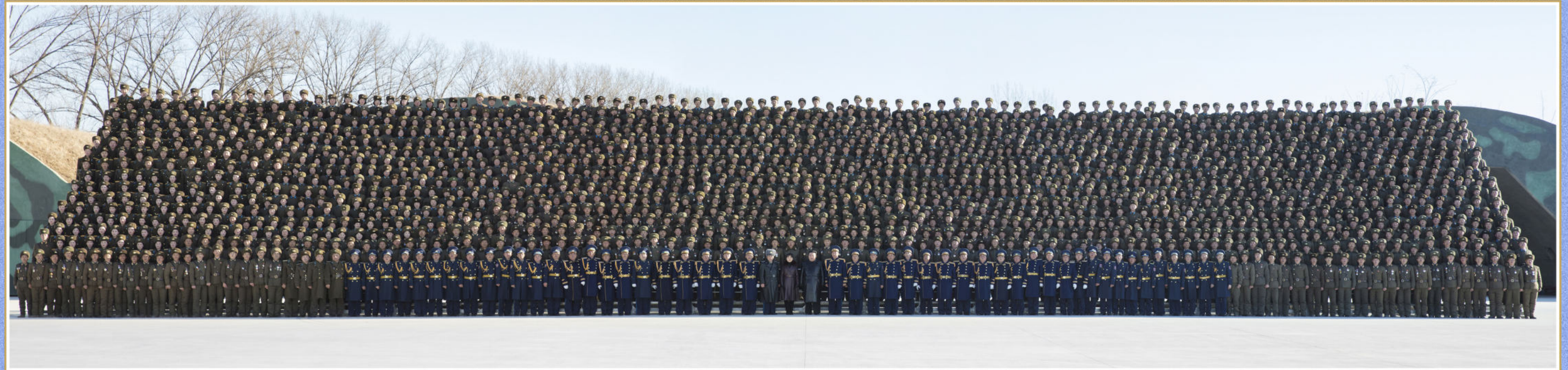
Kim Jong Un has photo sessions with airmen and other servicepersons of the unit and major commanding officers of the Air Force in commemoration of the Day of Airmen to be handed down to the history of the army building and warmly blesses the bright future of the people's air force