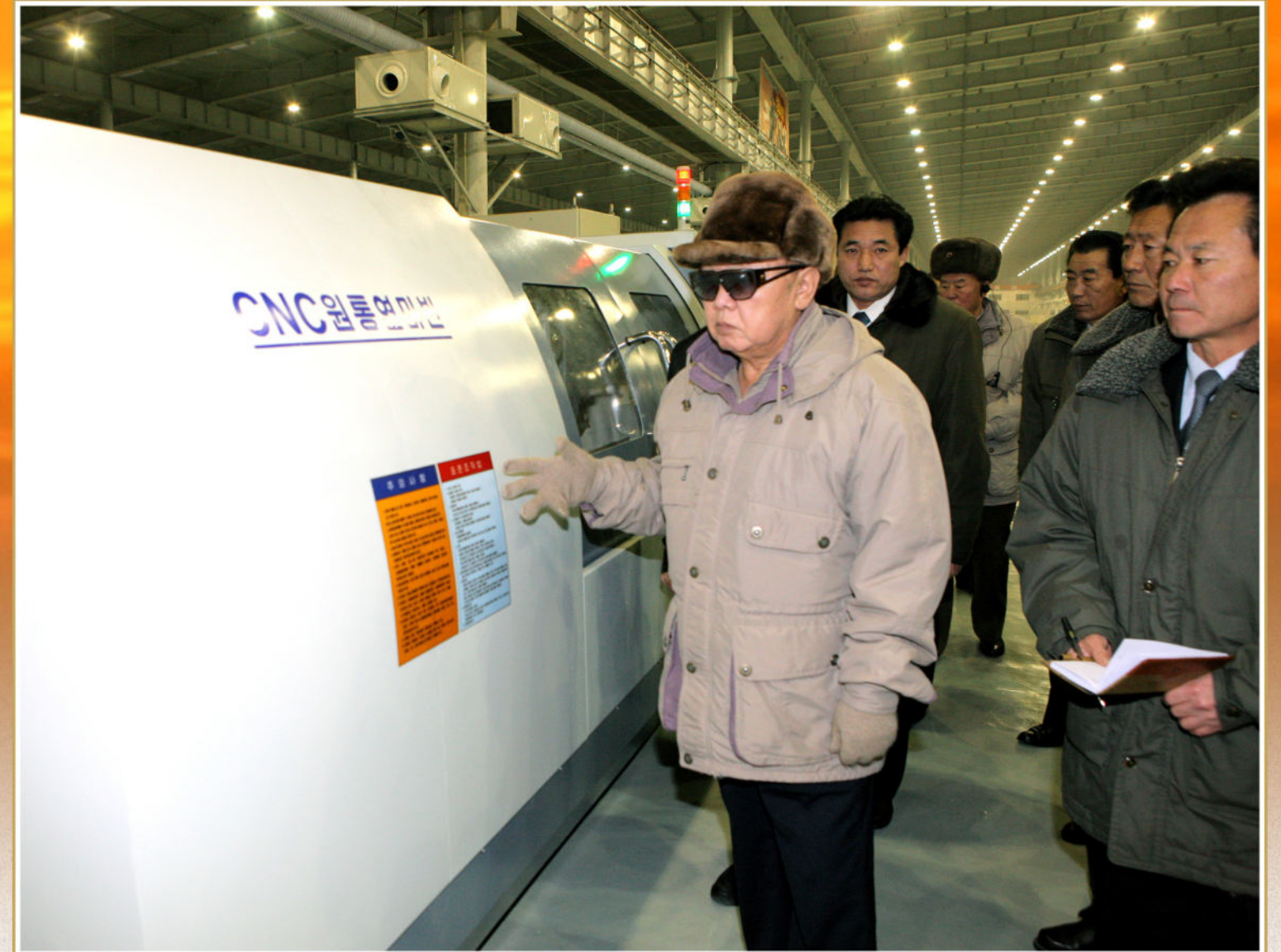
Kim Jong Il seeing new-type CNC machine tools December Juche 99 (2010)