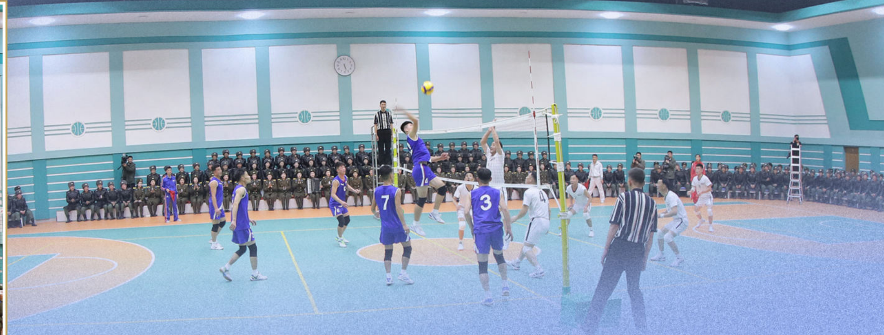
Kim Jong Un watches a volleyball game between the Air Force team and the Navy team and enjoys a performance given by the Song and Dance Ensemble of the KPA Air Force on the occasion of the Day of Airmen