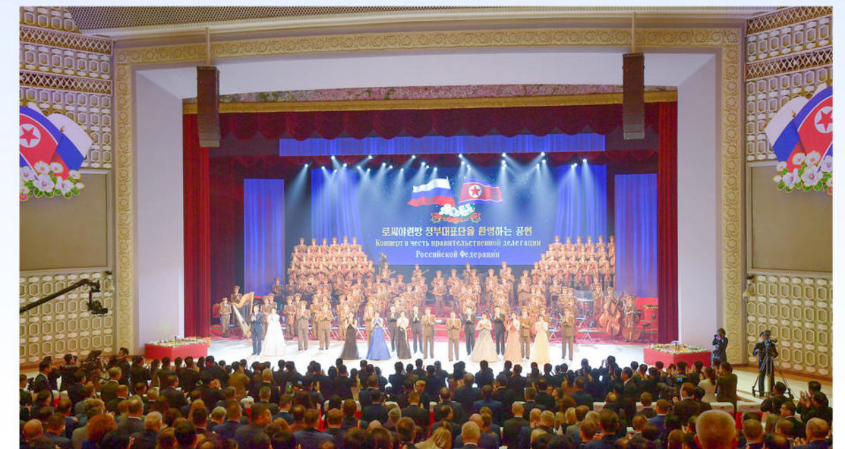
A performance is given at the Mansudae Art Theatre in welcome of the Russian delegation