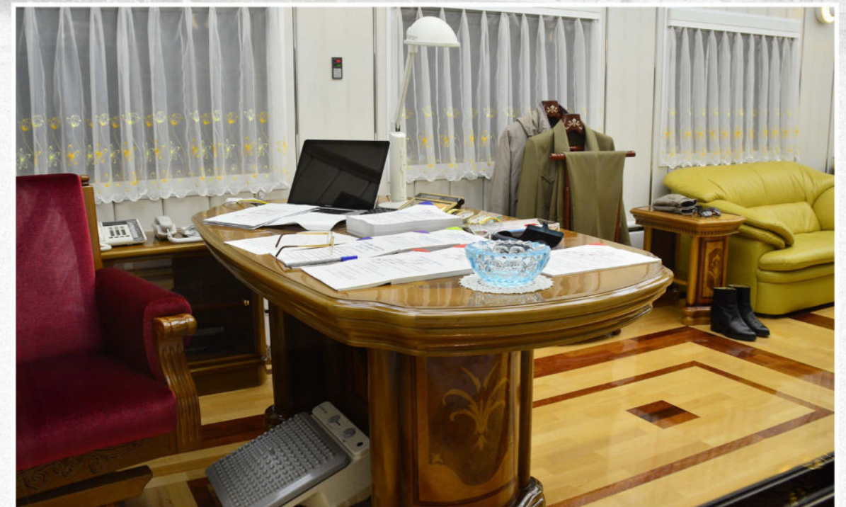
The coach used by Chairman Kim Jong Il