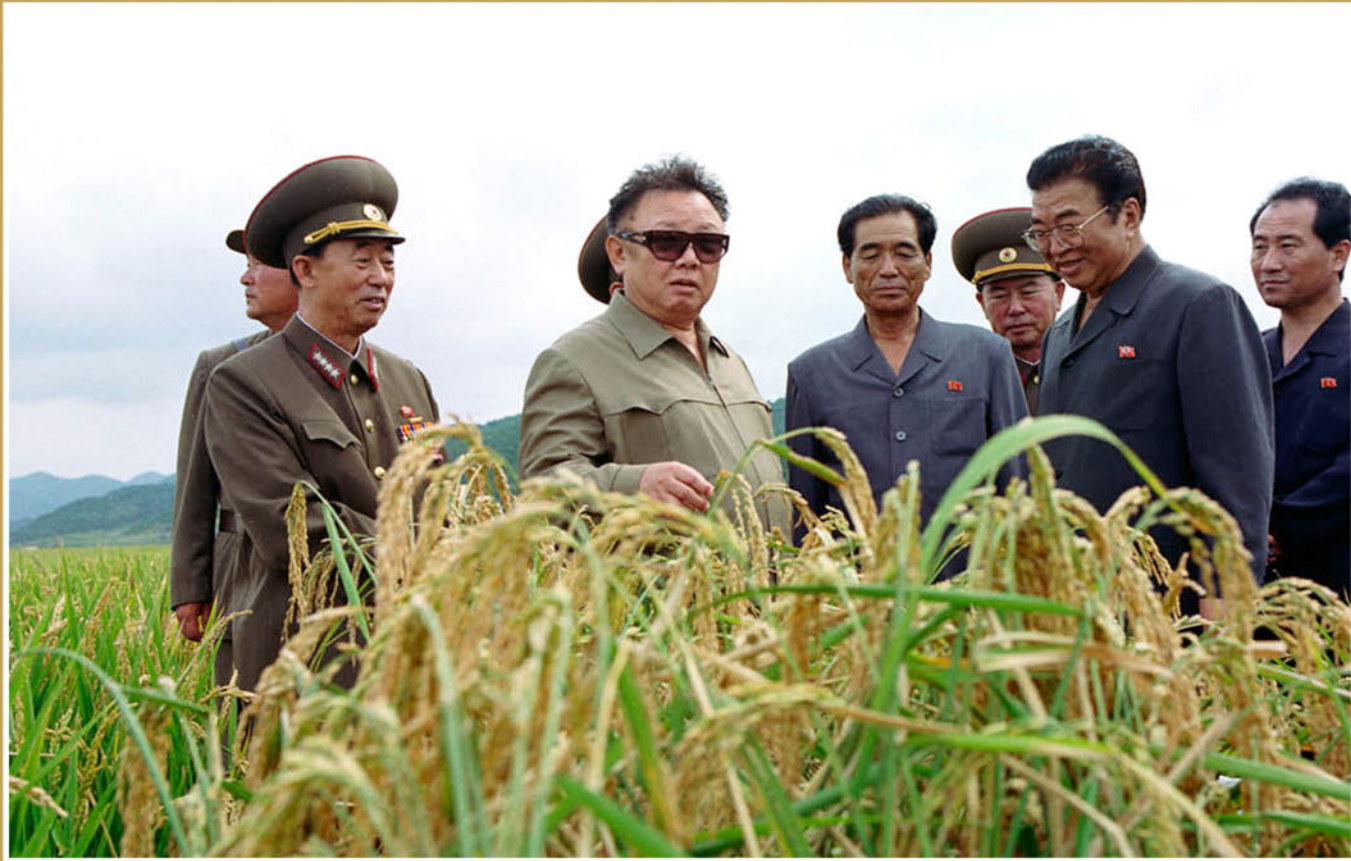
Kim Jong Il guiding the work in the field of agriculture September Juche 93 (2004)