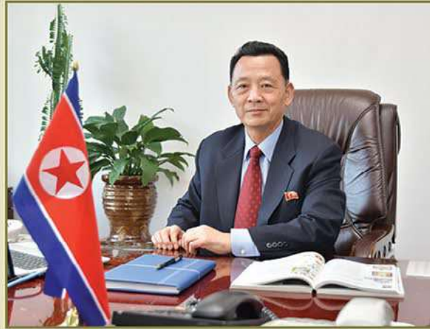
Ho Song Gil, director of the State Stamp Bureau of the DPRK

The State Stamp Bureau of the DPRK is a unitary postal security issuing organization in the DPRK, which engages in the design, issuance, collection, research and distribution of stamps, postal securities, philately-related publications, and 3D photos.