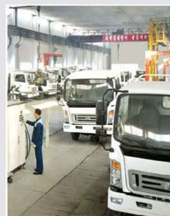
Sungni General Motor Enterprise