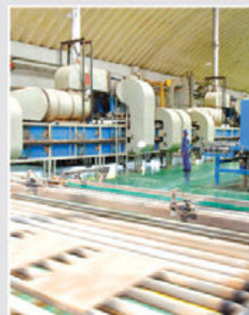
Pyongyang Building-Materials Factory