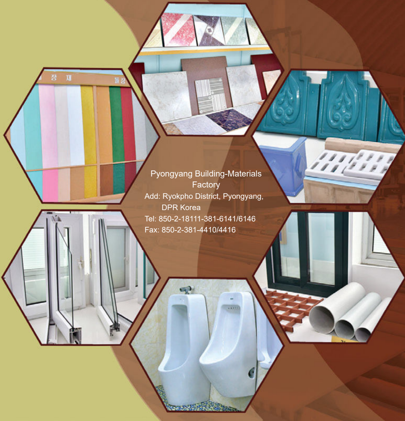
Pyongyang Building-Materials Factory Add: Ryokpho District, Pyongyang, DPR Korea Tel: 850-2-18111-381-6141/6146 Fax: 850-2-381-4410/4416

The machine-building industry of the DPRK is being further accelerated thanks to the strenuous efforts of the government to readjust and reinforce the foundations of independent and modern machine-building industry of the country and thus make it lead and drive the overall economy, and its future is very promising. □