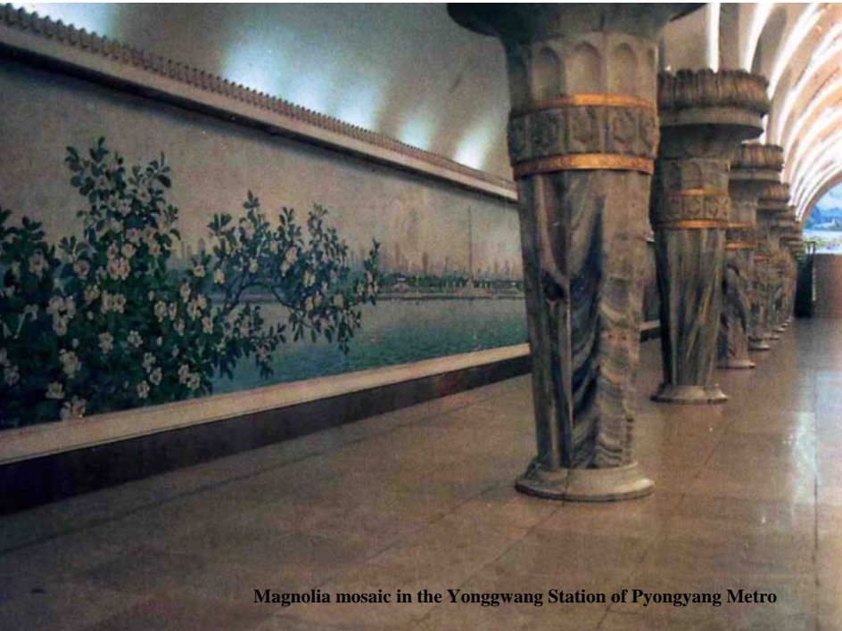
Magnolia mosaic in the Yonggwang Station of Pyongyang Metro