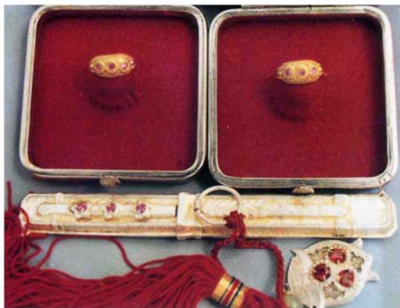
Triplets born in Korea receive a silver sword or a gold ring on which magnolia is carved.