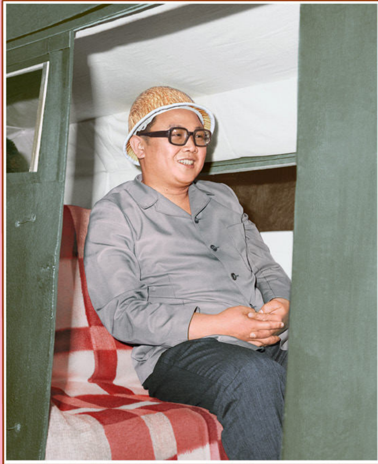
Chairman Kim Jong Il is sitting on a man car going down to a pit of the Komdok Mine on July 1 Juche 64(1975).