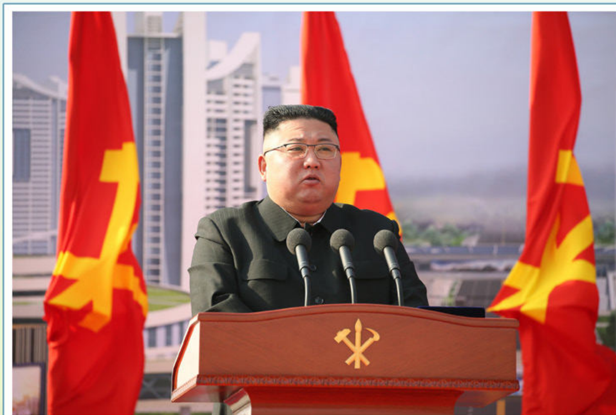
The respected Comrade Kim Jong Un delivers a meaningful speech at ground-breaking ceremony for construction project of 10 000 flats in Pyongyang on March 23 Juche 110(2021).

According to a grand plan put forward by the Eighth Congress of the Workers' Party of Korea, dwelling houses for 10 000 families are to be built in Pyongyang every year until 2025.