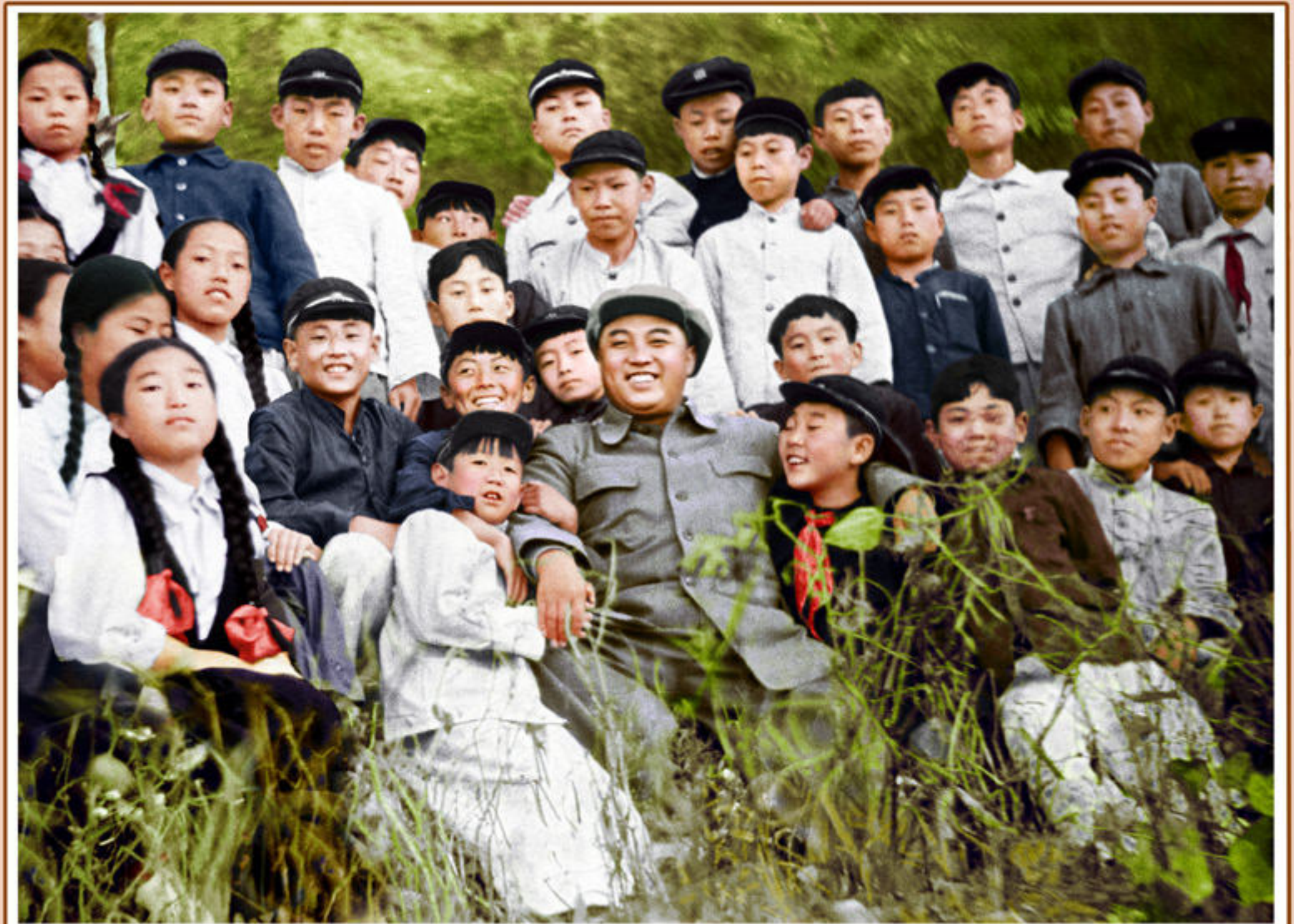
President Kim Il Sung gives field guidance to Tongju Middle School of Pyoktong County on October 10 Juche 46(1957).

Hence, not only the Korean people but the world's progressives are praising in an excited tone that the President's lifetime was the one for the future of the country.