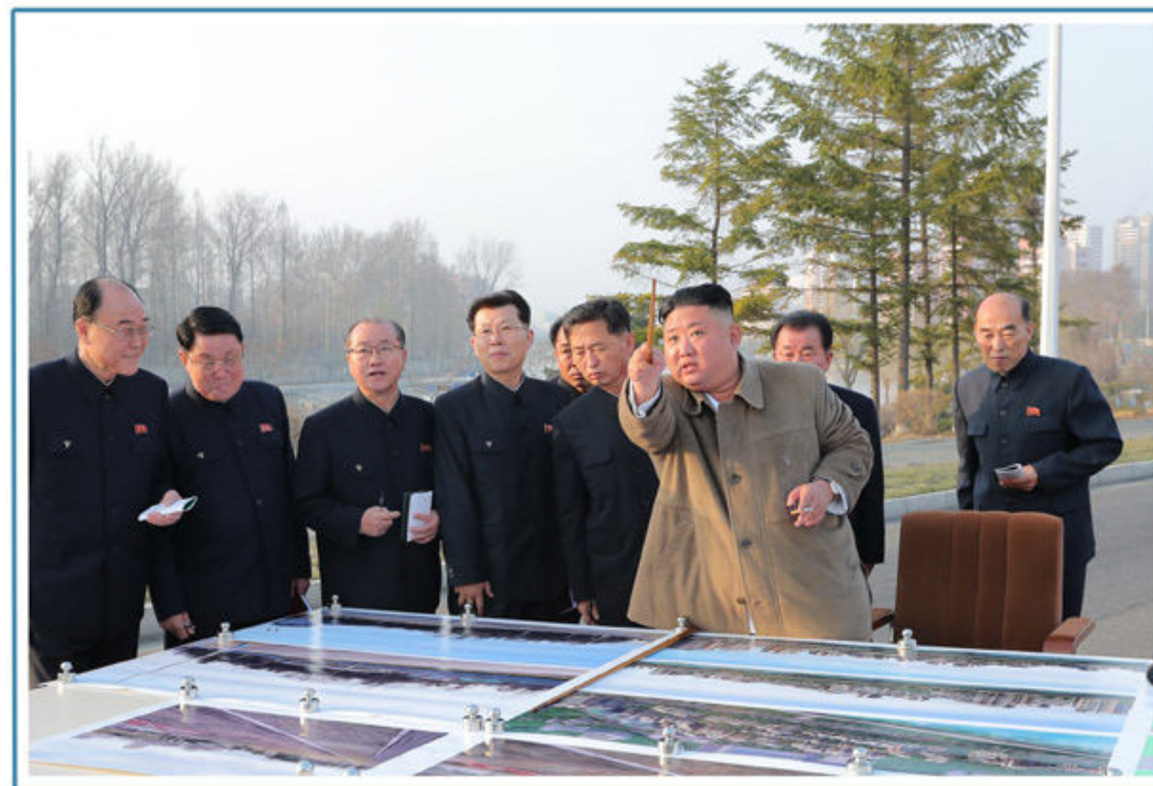
The respected Comrade Kim Jong Un unveils plan for building riverside terraced houses district near the Pothong Gate on March 25 Juche 110(2021).

The respected Comrade Kim Jong Un , General Secretary of the Workers' Party of Korea and President of the State Affairs of the DPRK, announced a plan for building a riverside terraced houses district near the Pothong Gate and looked around the site.