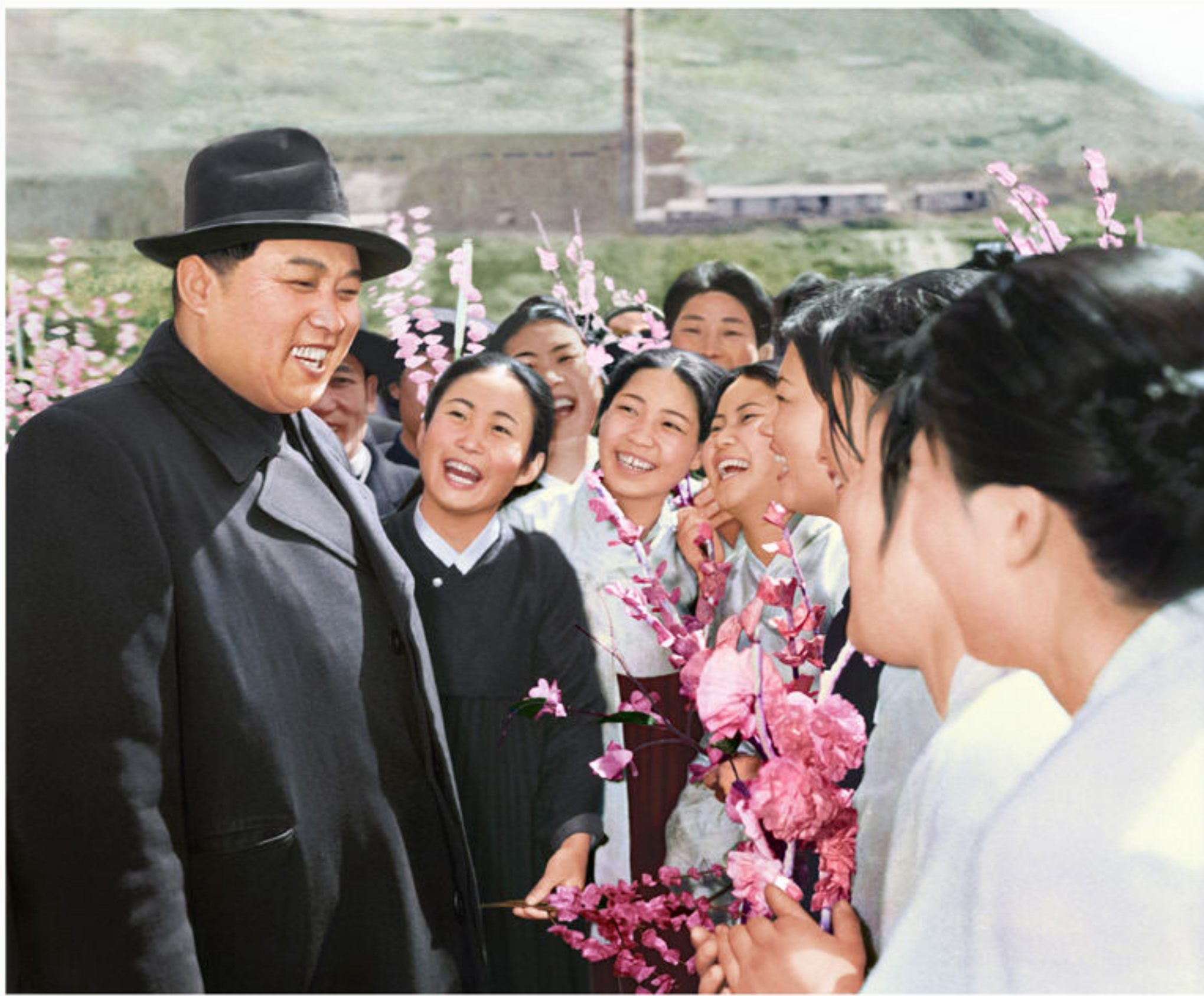
President Kim Il Sung gives field guidance to the Komdok Mine on April 5 Juche 50(1961).