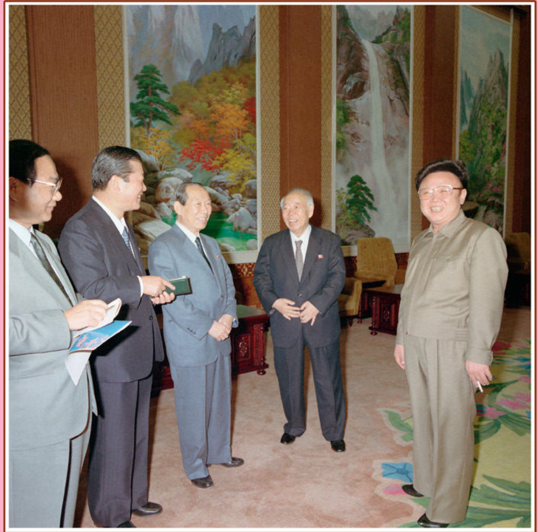
Chairman Kim Jong Il meets officials of the Central Standing Committee of General Association of Korean Residents in Japan (Chongryon) on April 28 Juche 81(1992).

Chongryon officials and other compatriots in Japan have keenly realized it as truth that victory, glory and eternal happiness are in store for them on the road of holding in high esteem and following the peerlessly great men, and are leading a fulfilling life on the road of patriotism under the leadership of the respected Comrade Kim Jong Un .