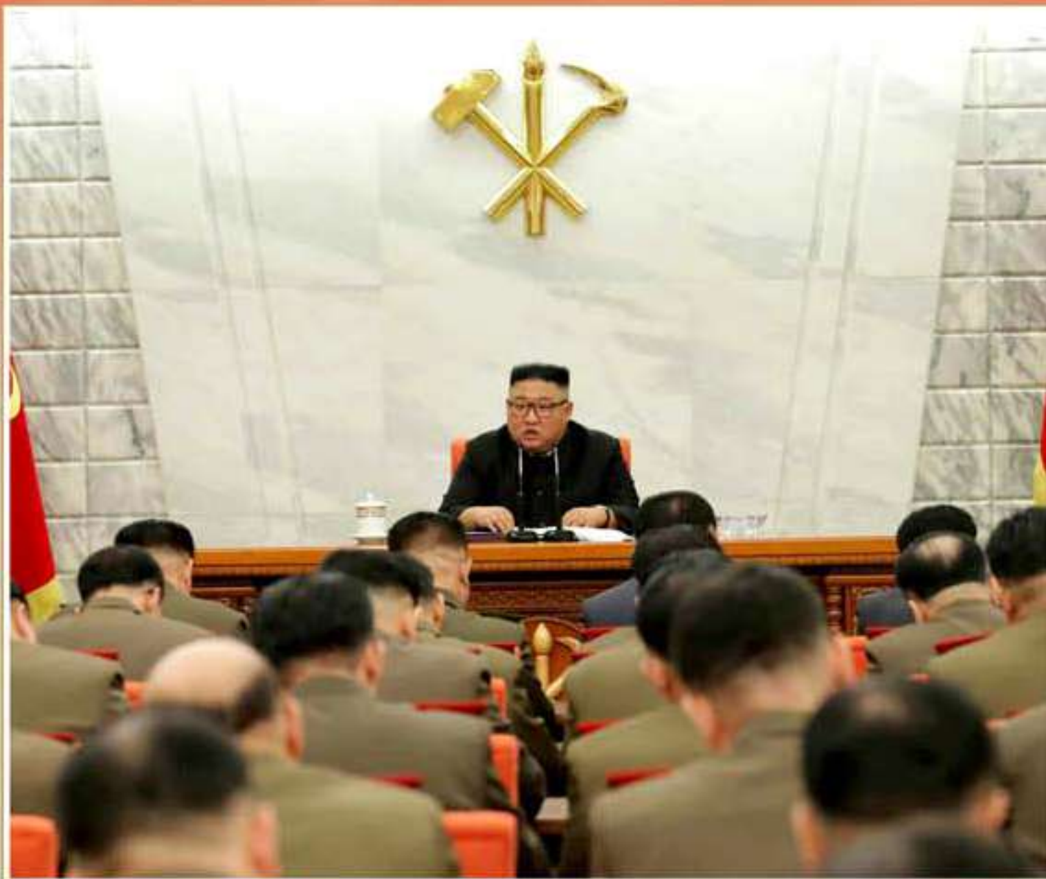
Kim Jong Un guided the First Enlarged Meeting of the Eighth Central Military Commission of the WPK.