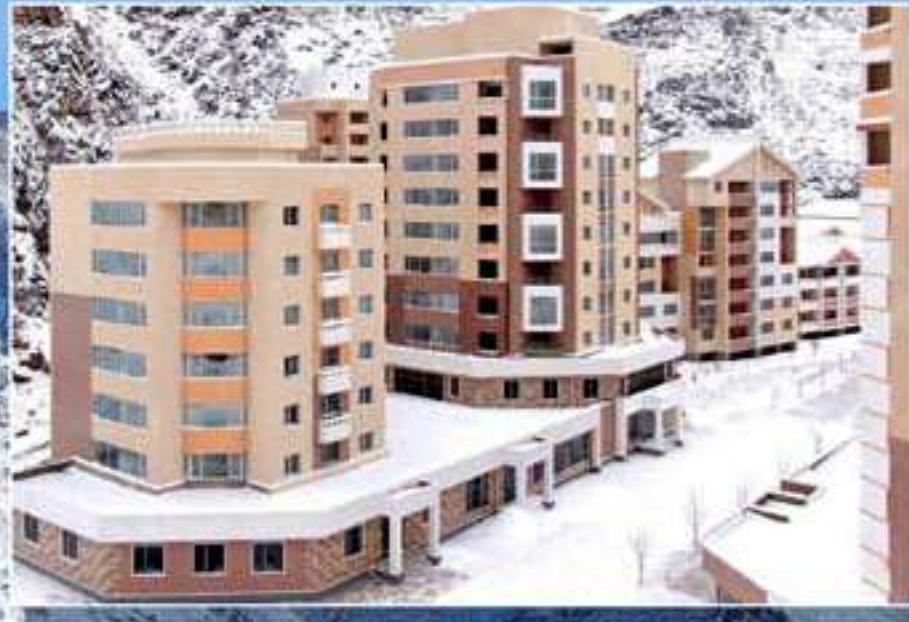
Thousands of houses built in the Komdok area in the northeastern part of the country