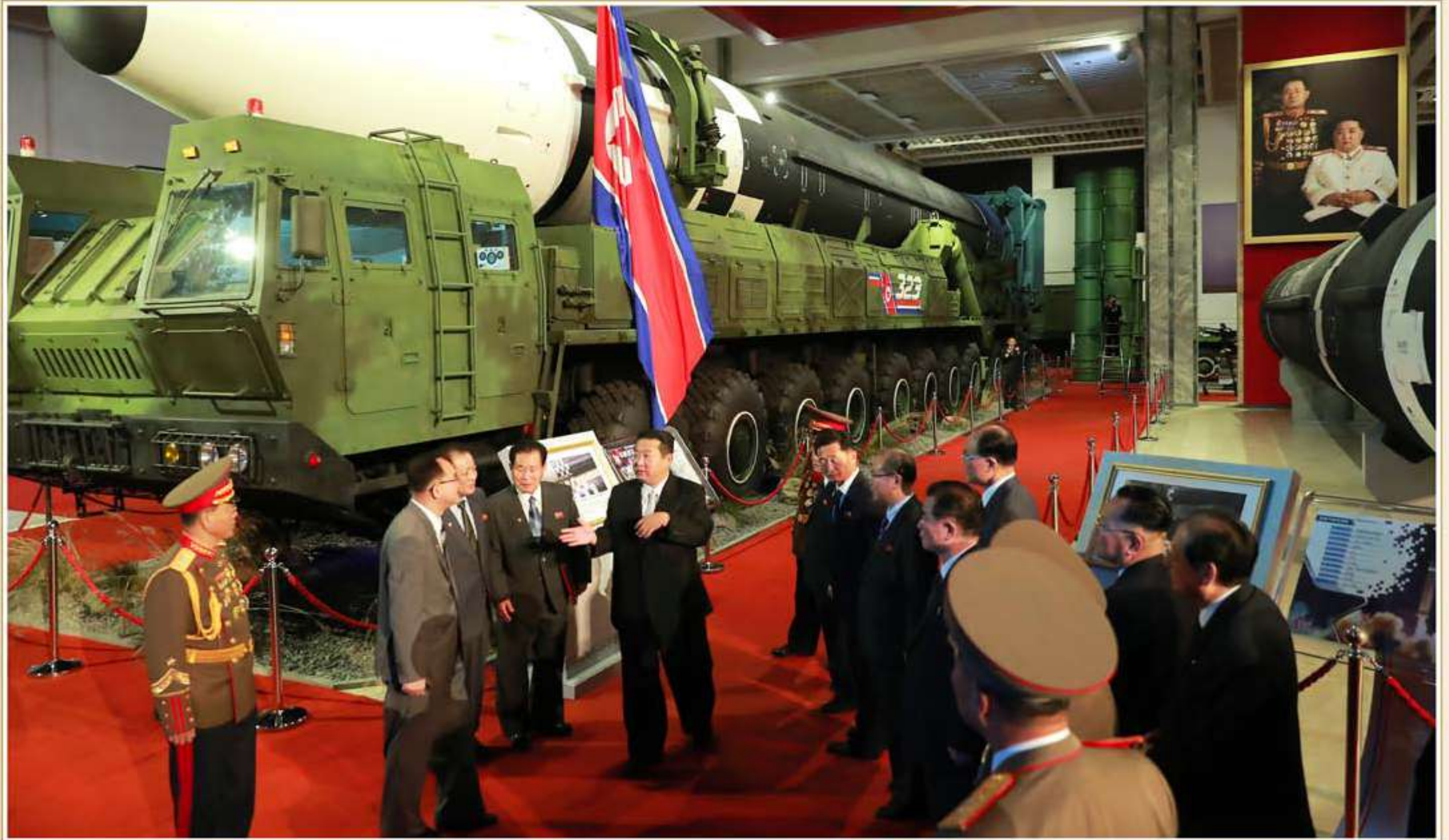
Kim Jong Un looked around the exhibition with the participants.