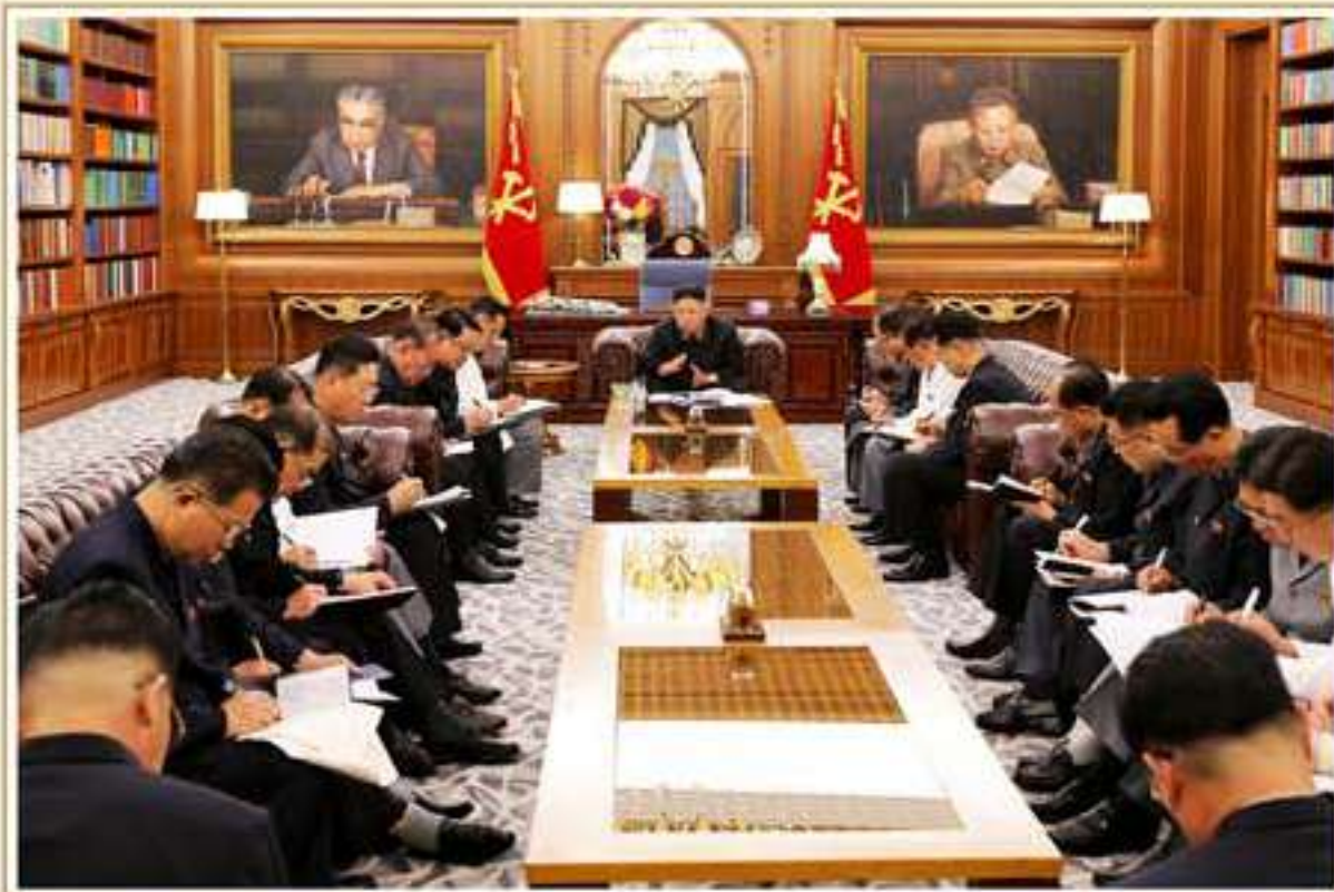
Kim Jong Un guided a consultative meeting of senior officials of the Central Committee and provincial committees of the WPK.