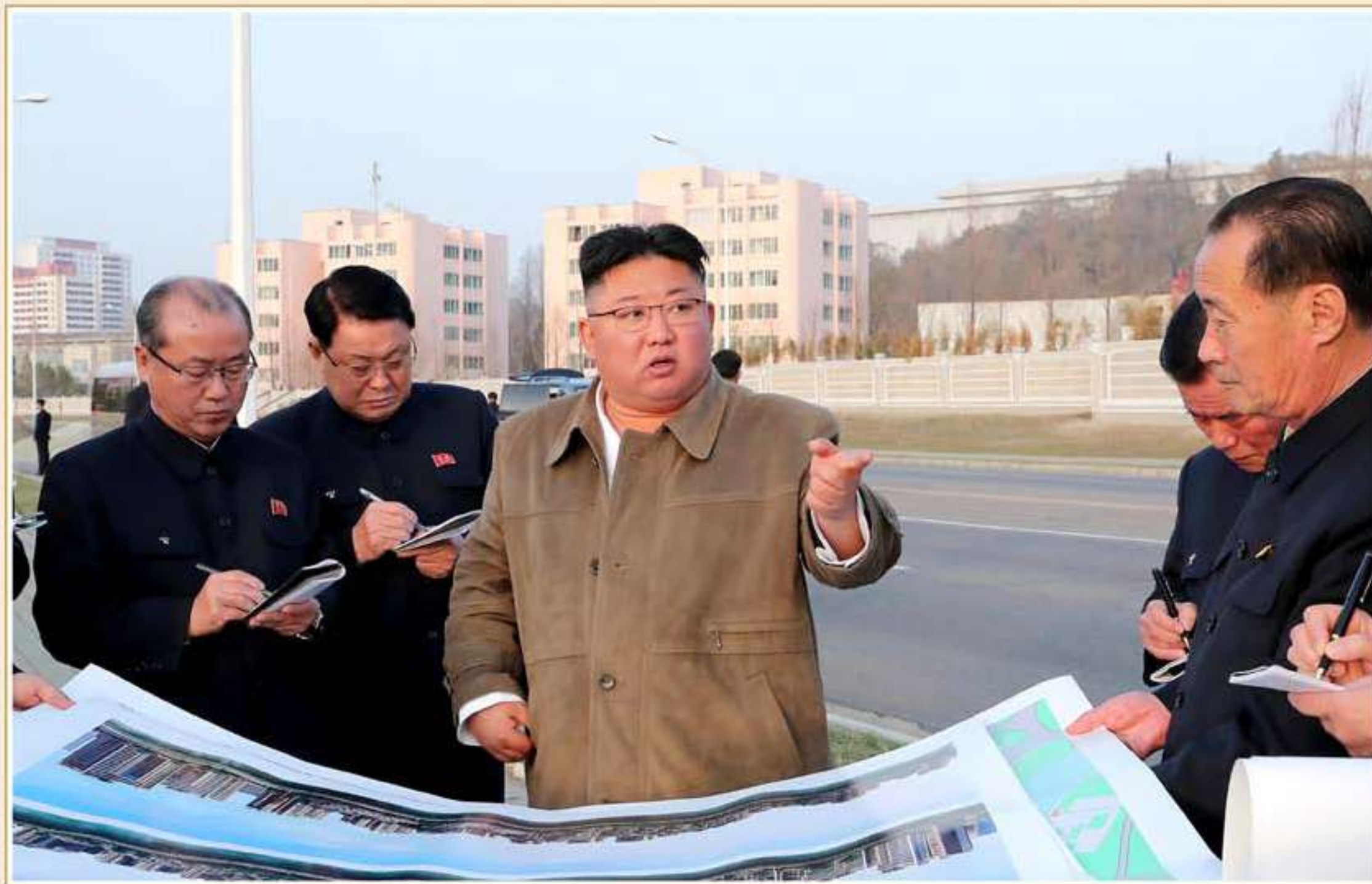
Kim Jong Un looked round again the construction site of the Pothong riverside terraced houses district.