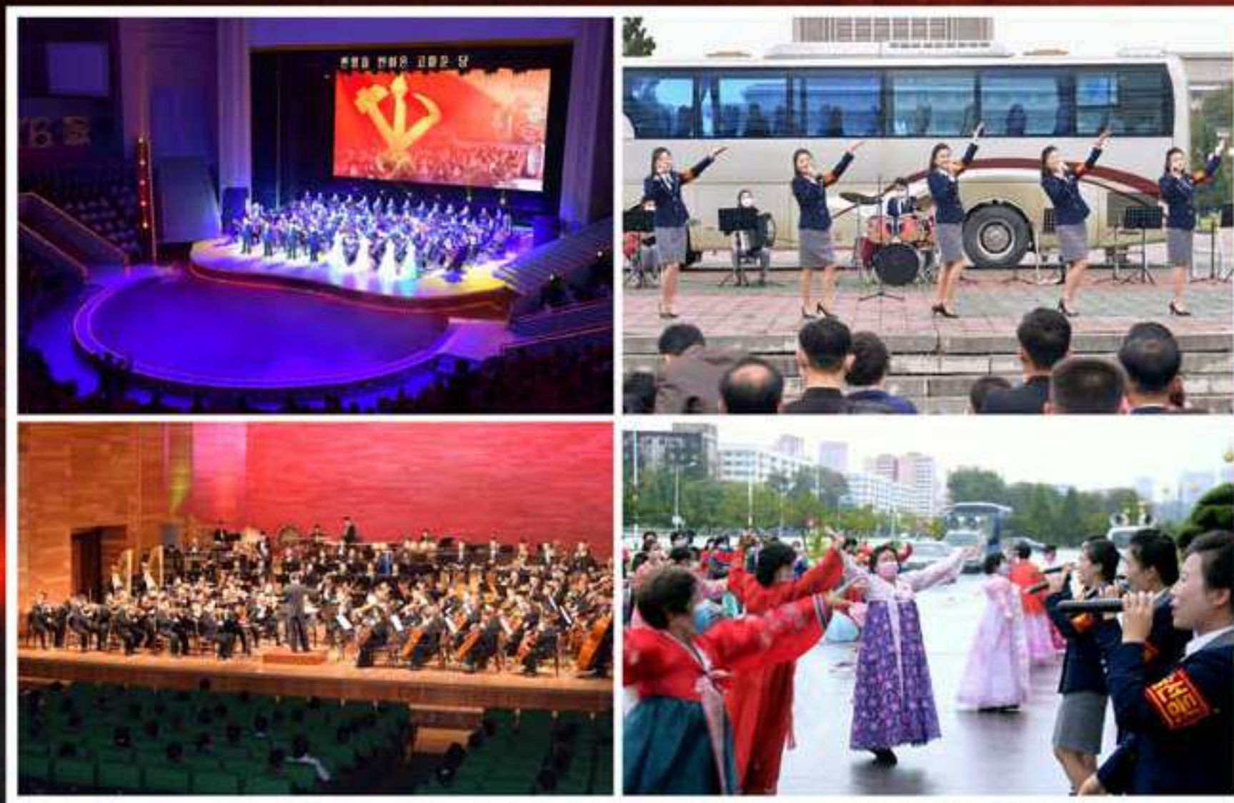
The whole country celebrated the 76 th founding anniversary of the WPK.