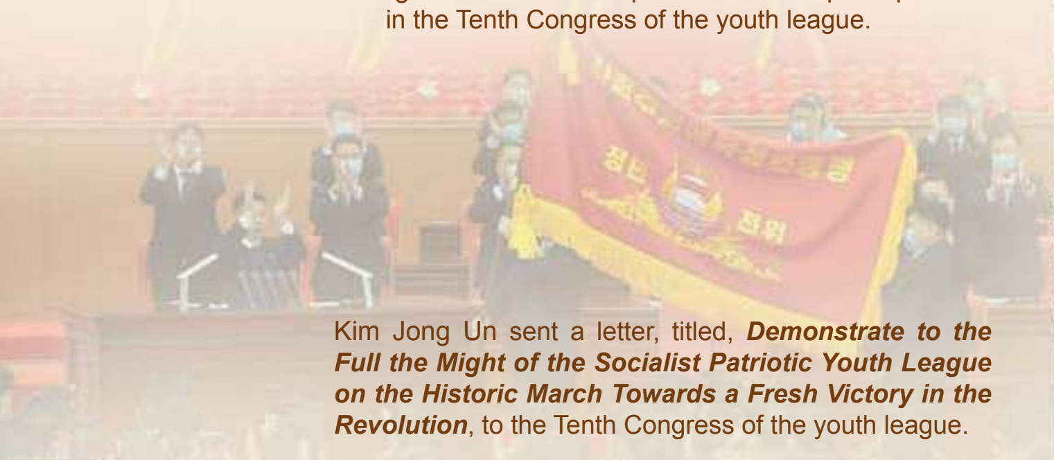
Kim Jong Un sent a letter, titled, Demonstrate to the Full the Might of the Socialist Patriotic Youth League on the Historic March Towards a Fresh Victory in the Revolution , to the Tenth Congress of the youth league.