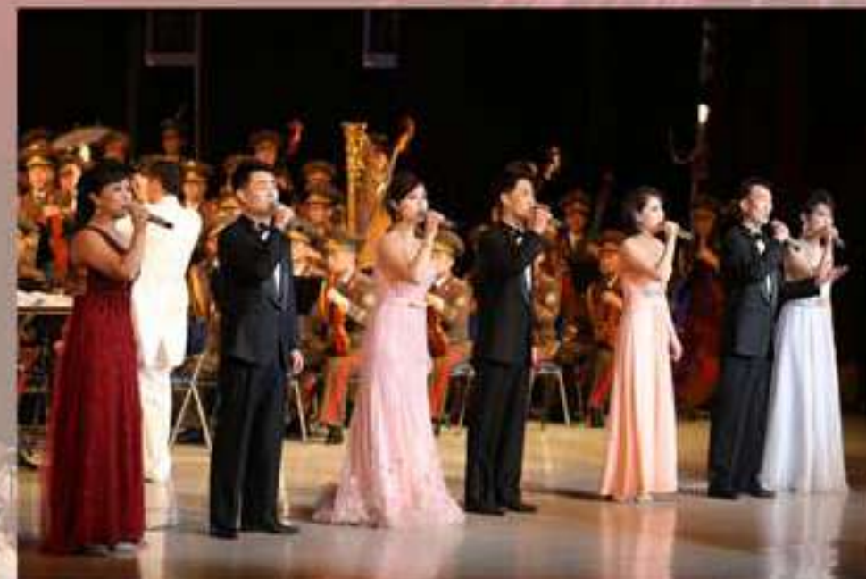
Kim Jong Un saw an artistic performance held in commemoration of the Day of the Shining Star.