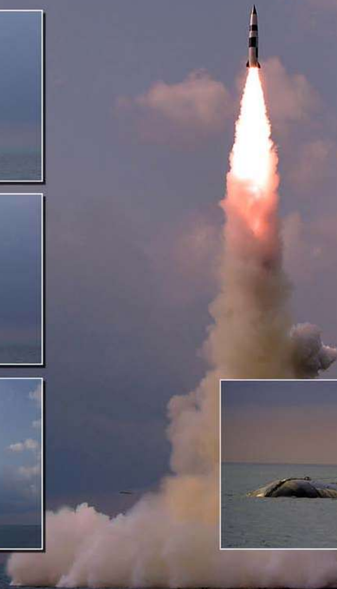
Test-fire of a new-type SLBM