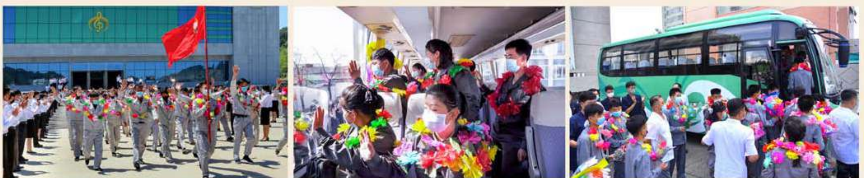
Young people in various parts of the country are volunteering to work at the major sectors of socialist construction.