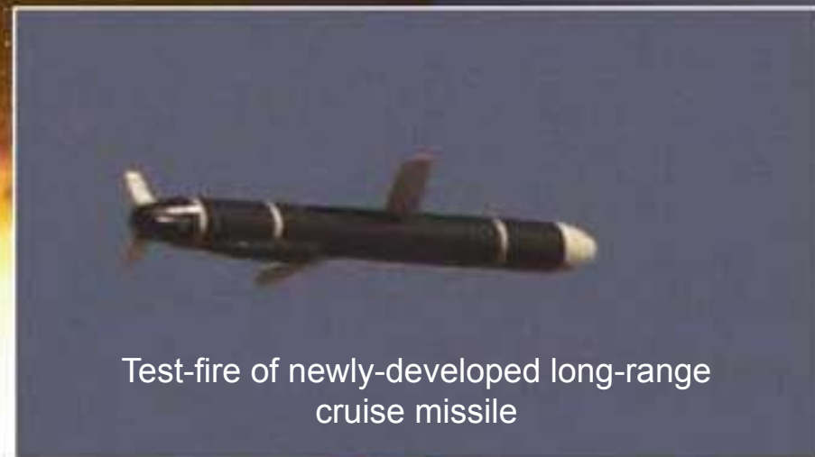
Test-fire of newly-developed long-range cruise missile