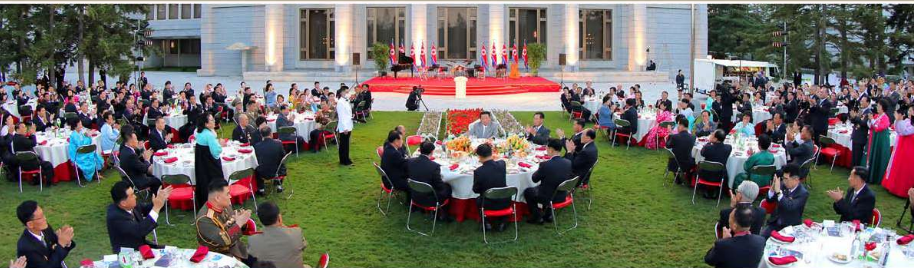
Kim Jong Un met the meritorious people and other labour innovators participating in the celebrations of the 73 rd founding anniversary of the DPRK, and congratulated them.