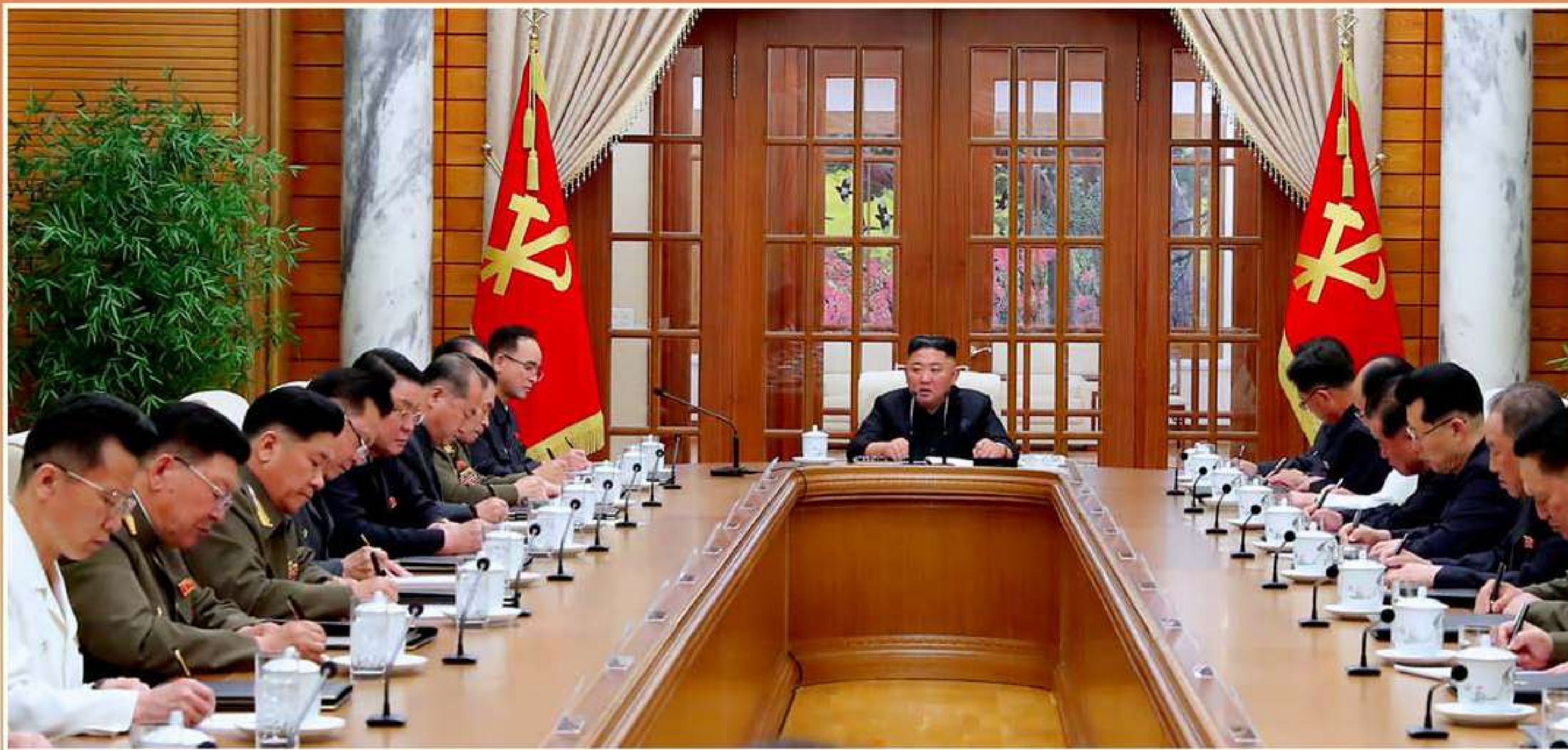
Kim Jong Un presided over the First Meeting of the Political Bureau of the Eighth Central Committee of the WPK.

First Meeting of the Political Bureau of the Eighth Central Committee of the WPK