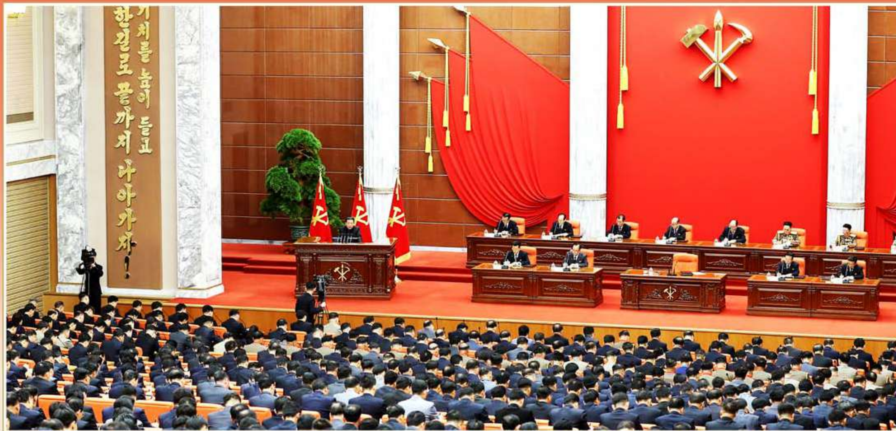
Kim Jong Un guided the Third Enlarged Meeting of the Political Bureau of the Eighth Central Committee of the WPK.

Third Enlarged Meeting of the Political Bureau of the Eighth Central Committee of the Workers' Party of Korea