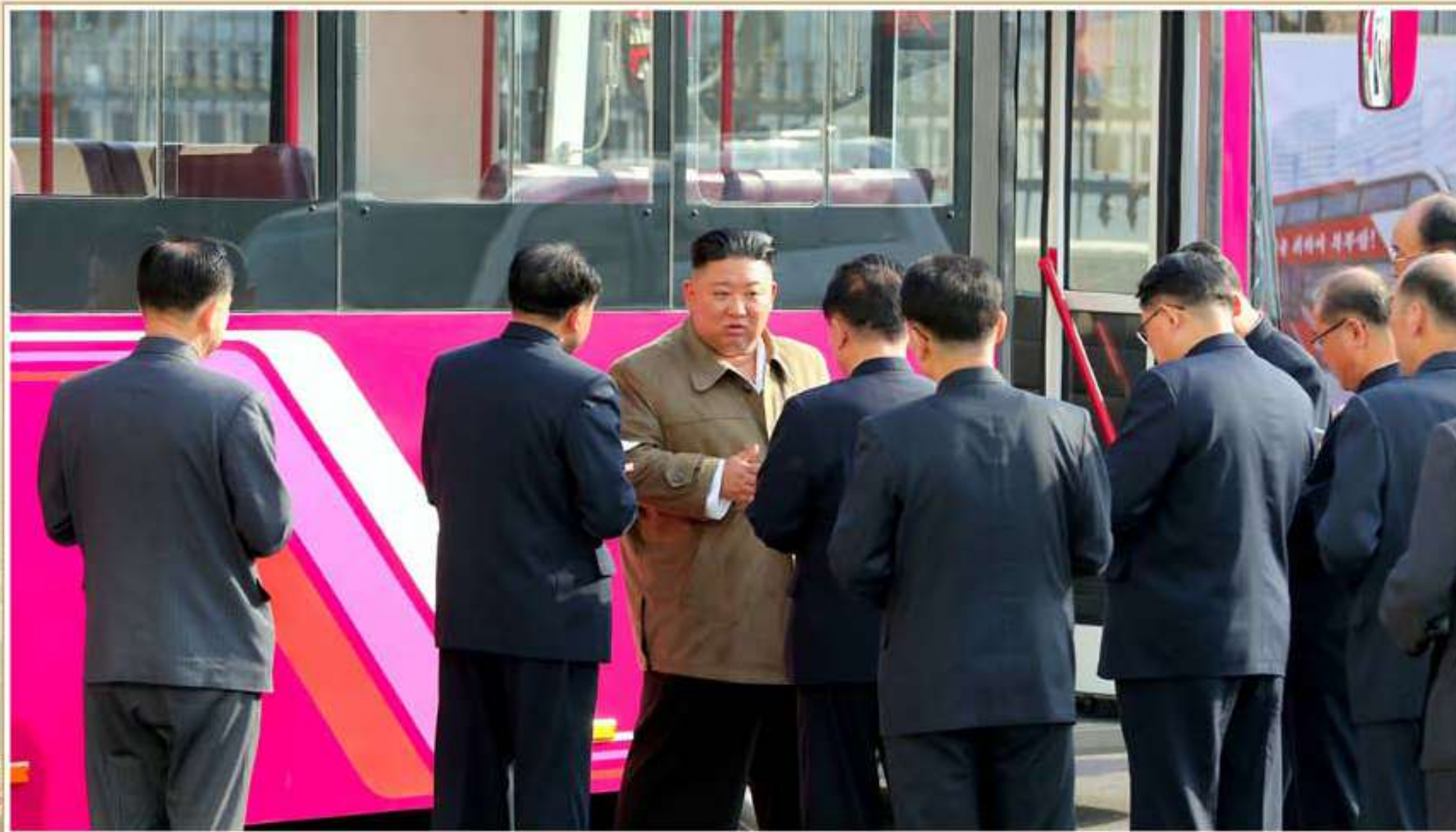
Kim Jong Un saw trial products of new passenger bus.