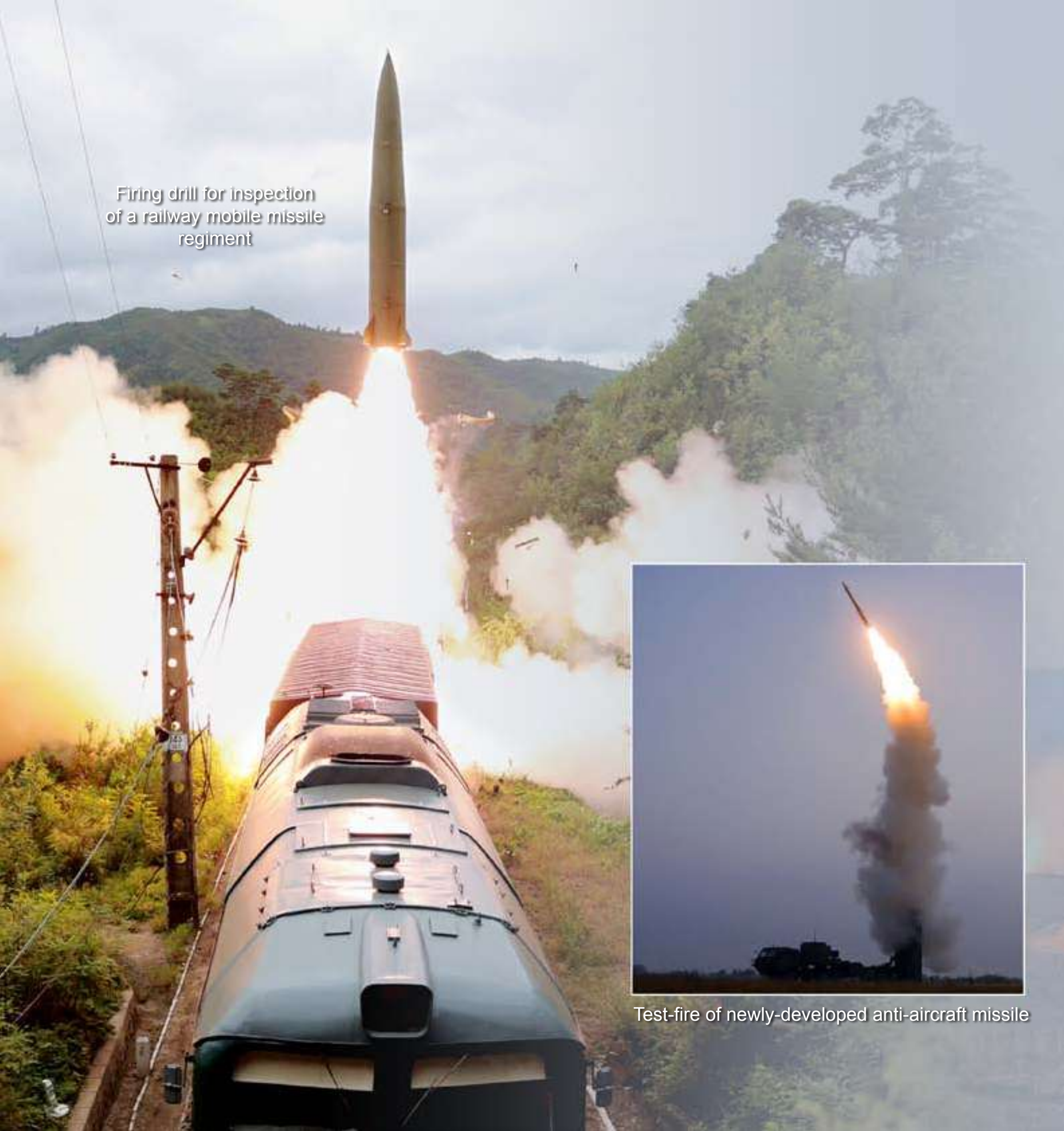
Firing drill for inspection of a railway mobile missile regiment