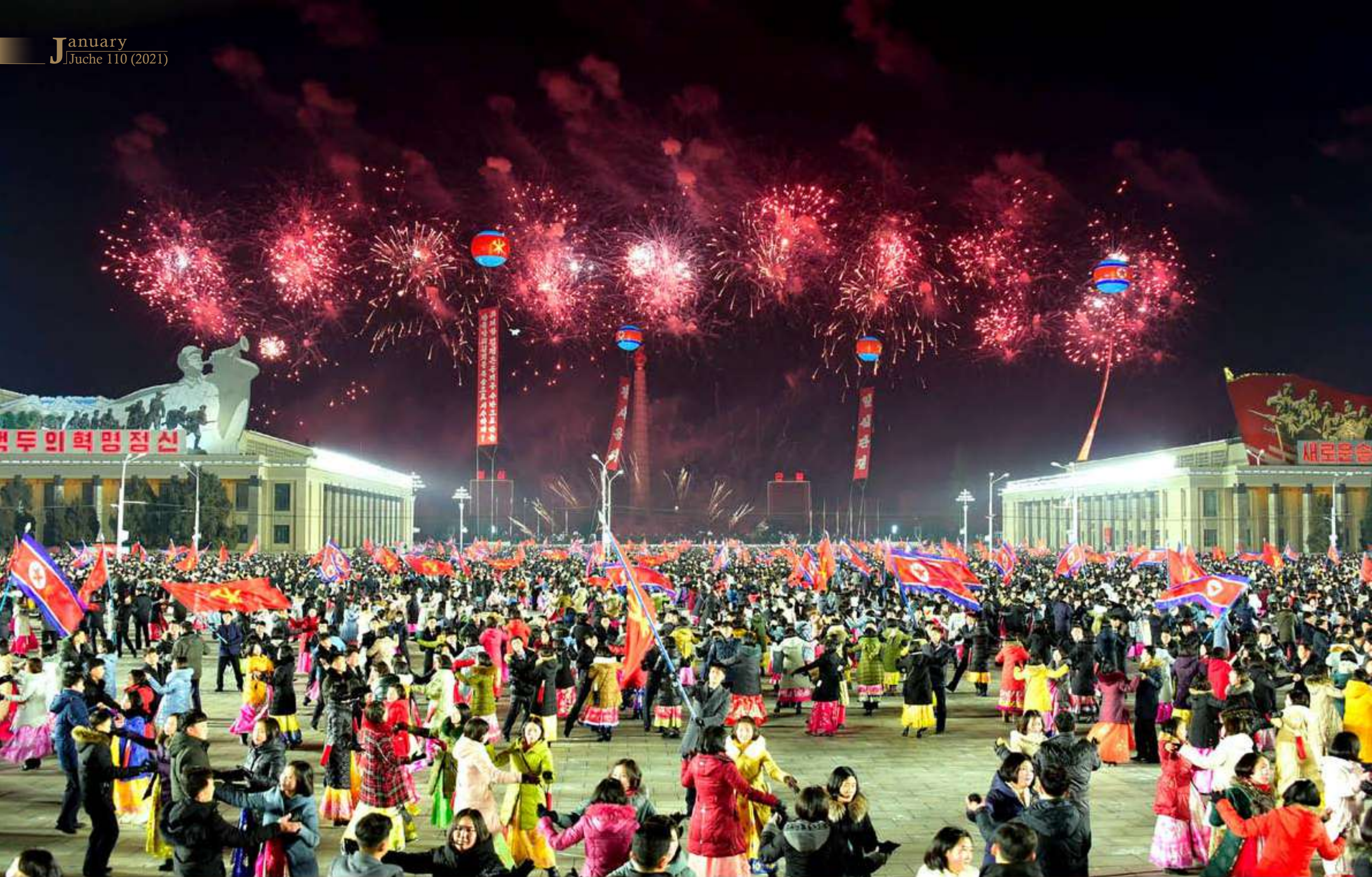
Amid the fireworks set off in celebration of the Eighth Congress of the WPK, a soiree of the masses started.