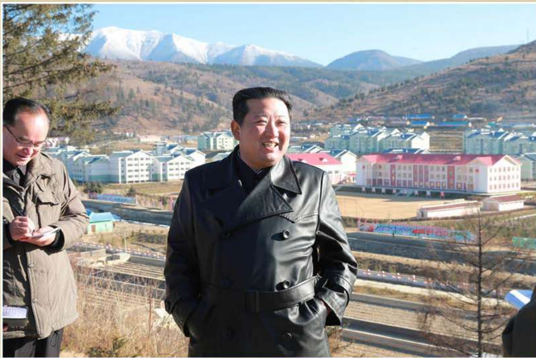
Kim Jong Un gave on-site guidance at the city of Samjiyon.