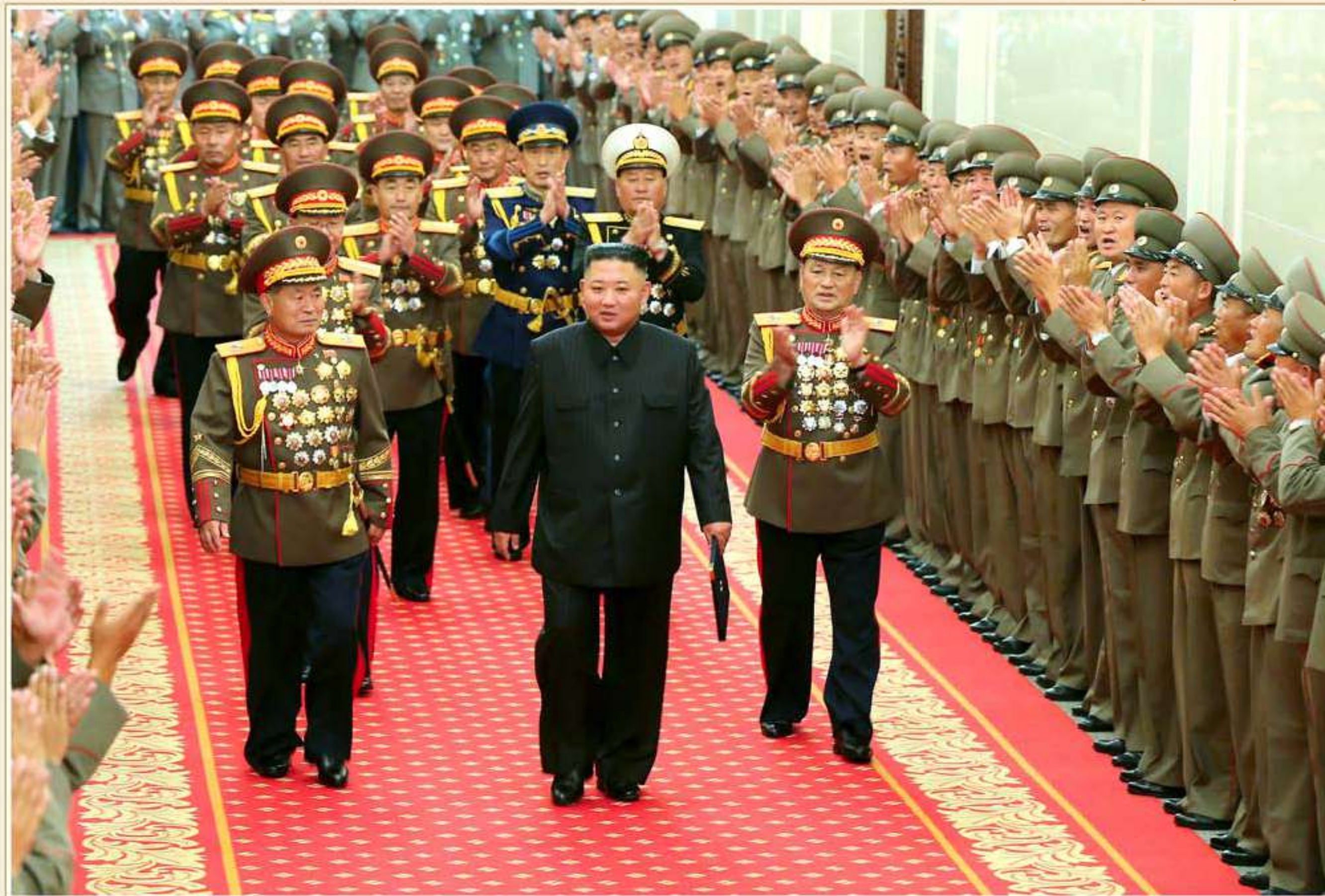
To guide the First Workshop of Military and Political Officers of the KPA, Kim Jong Un arrived at the April 25 House of Culture, its venue.