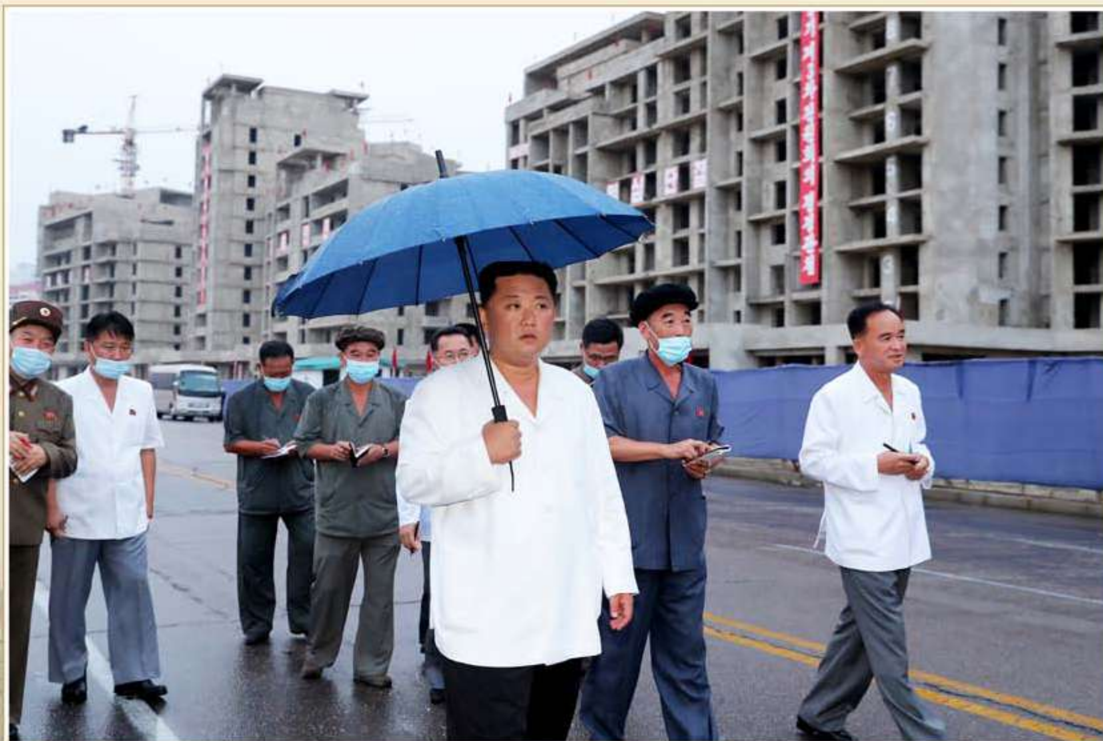
Kim Jong Un gave on-site guidance at the construction site of the Pothong riverside terraced houses district.