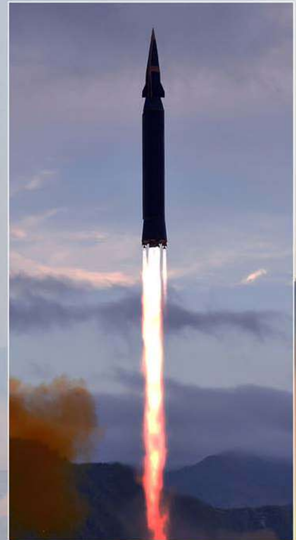
Test-fire of newly-developed hypersonic missile of Hwasong-8 type