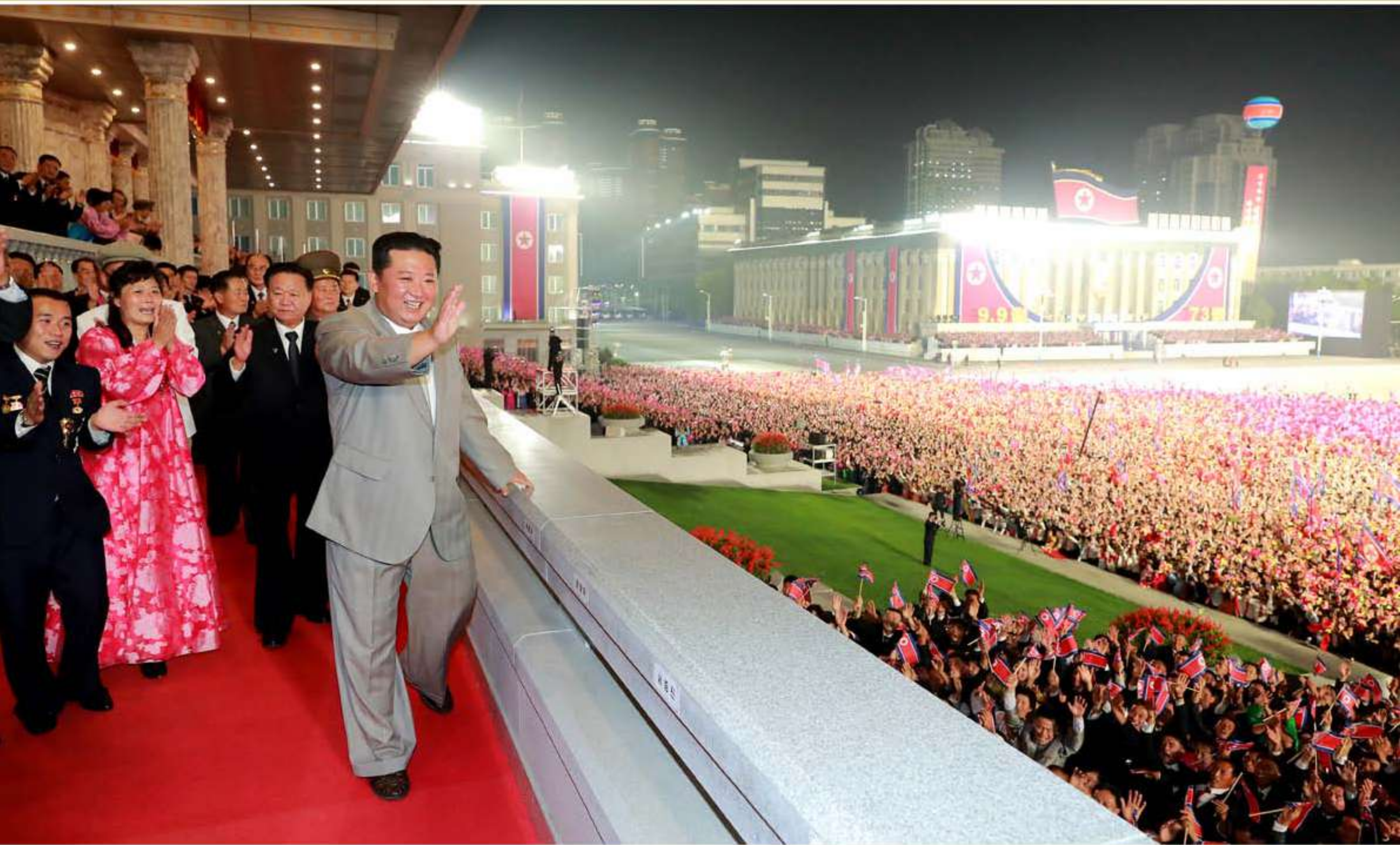
Kim Jong Un acknowledged the enthusiastic cheers by the people.