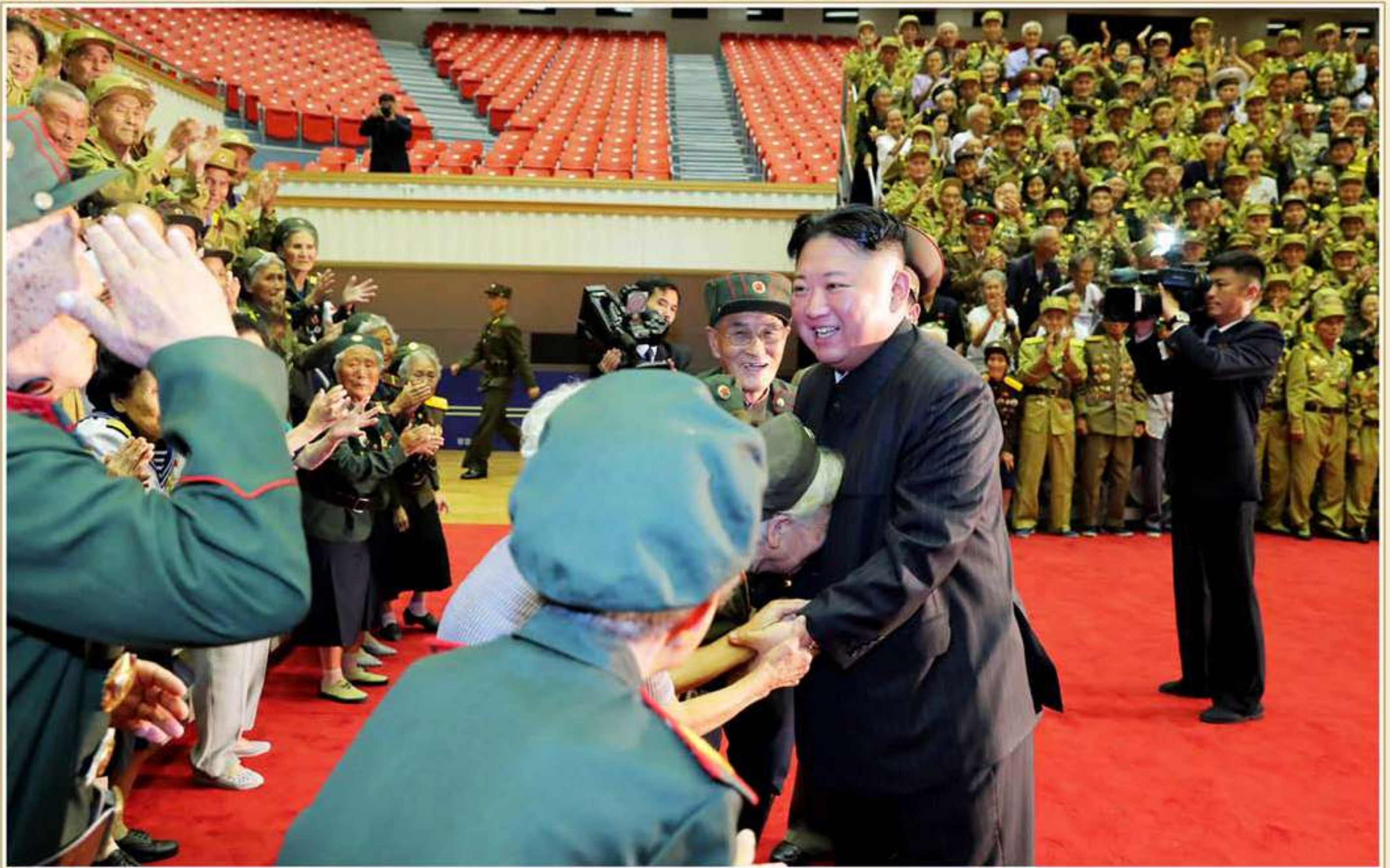
Kim Jong Un met the participants in the conference and had a photograph taken with them.