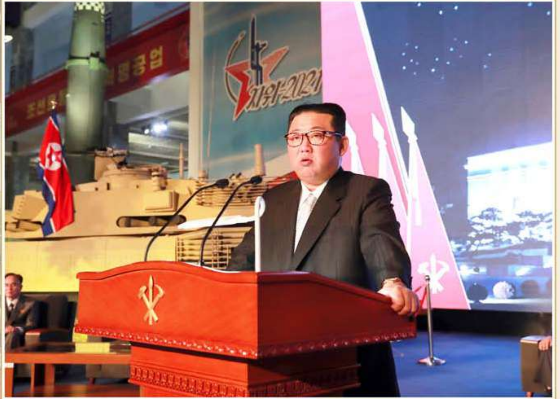
Kim Jong Un delivered a speech at the opening ceremony of the Defence Development Exhibition Self-Defense 2021 .

On display at the exhibition were weapons and other combat equipment developed over the past five years, which showcase the powerful defence capability of the DPRK.