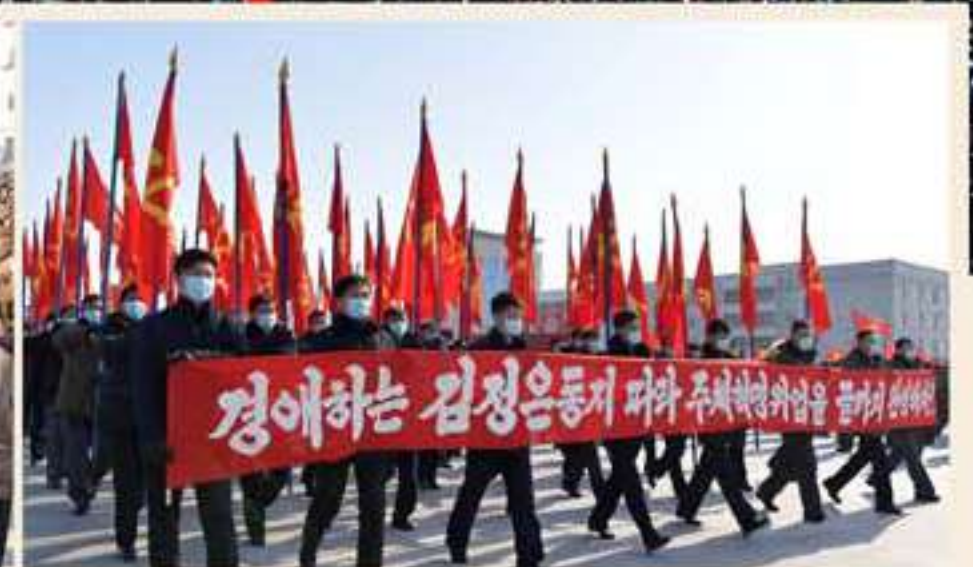
Army-people joint rallies for implementing the decisions adopted at the Eighth Congress of the WPK were held in various parts of the country.