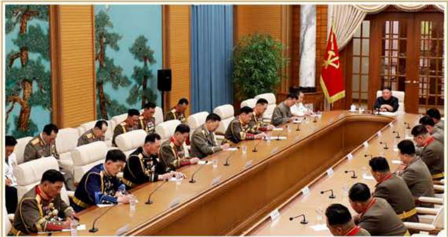
Kim Jong Un guided the Second Enlarged Meeting of the Eighth Central Military Commission of the WPK.