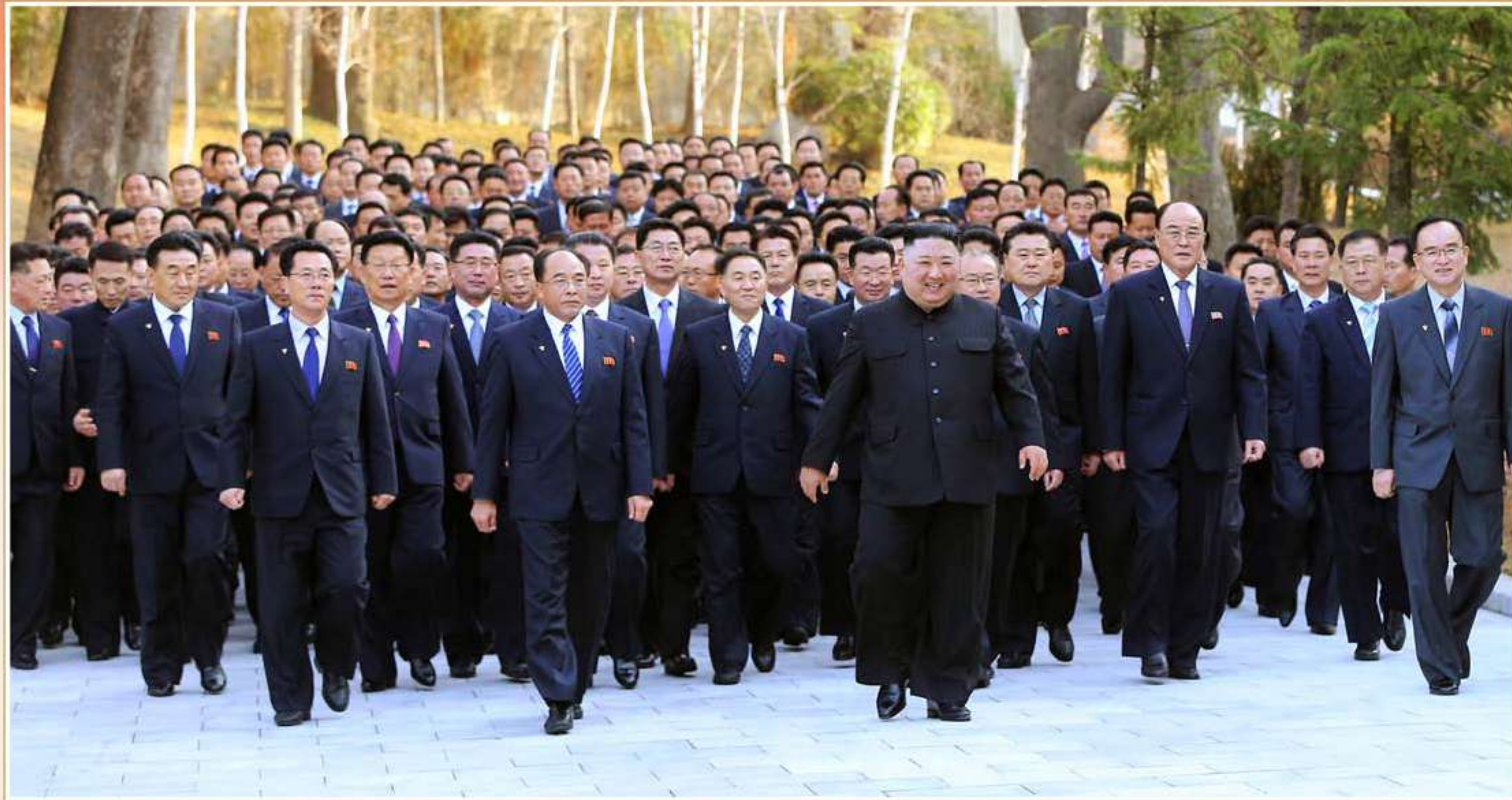
Kim Jong Un guided the First Workshop of Chief Secretaries of City and County Committees of the WPK.