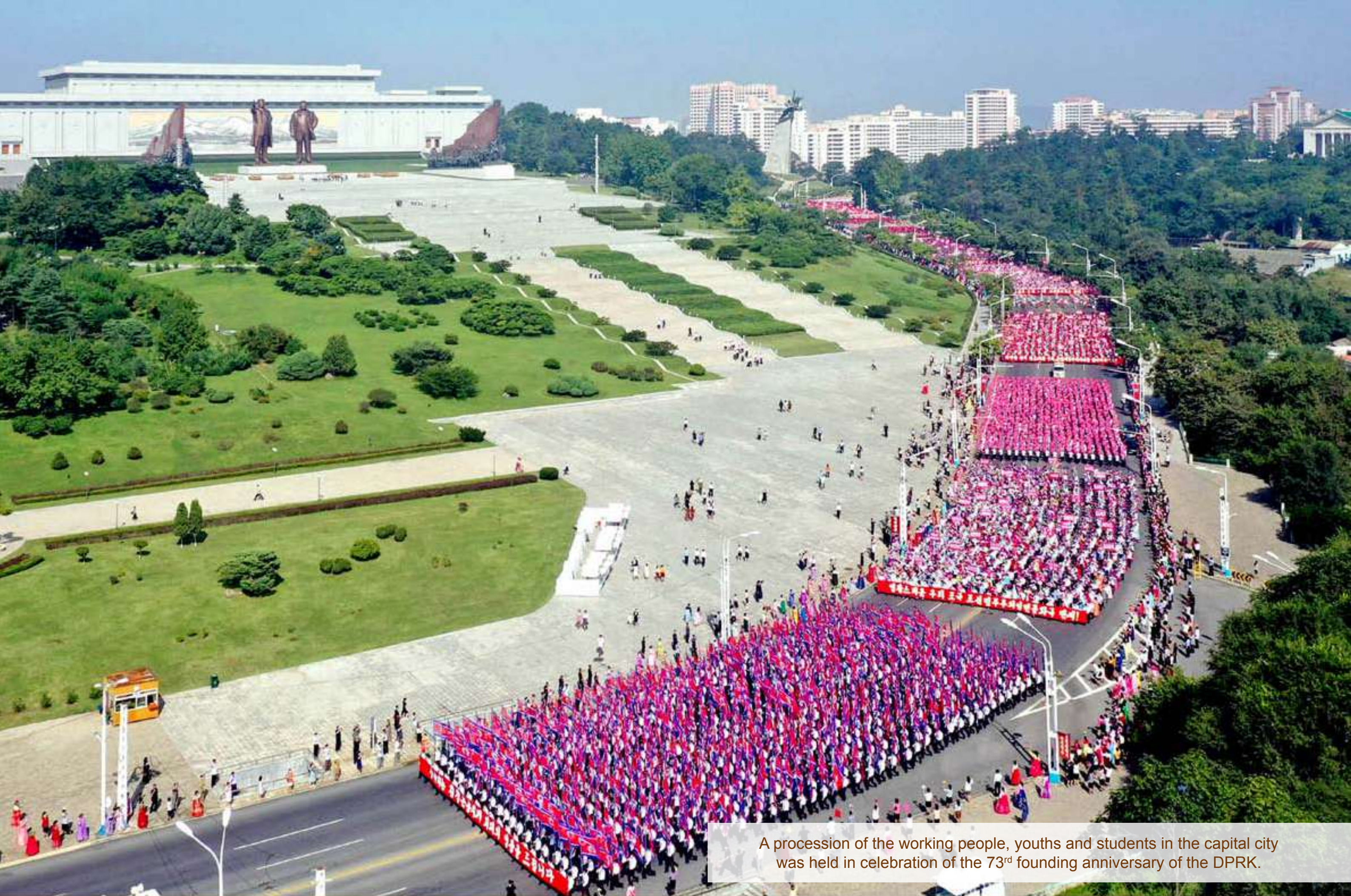
A procession of the working people, youths and students in the capital city was held in celebration of the 73 rd founding anniversary of the DPRK.