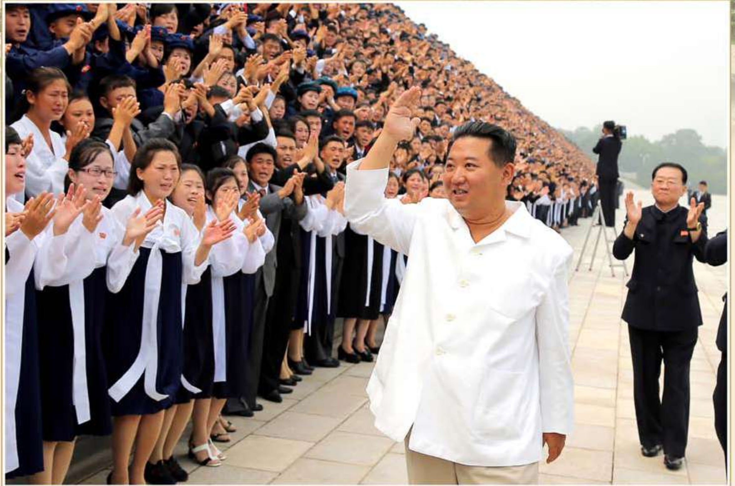
Kim Jong Un had a photograph taken with the delegates to the celebrations of Youth Day.