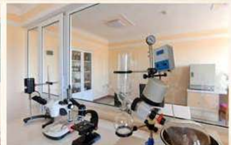
Some research institutes inaugurated in the compound of the Academy of Agricultural Science