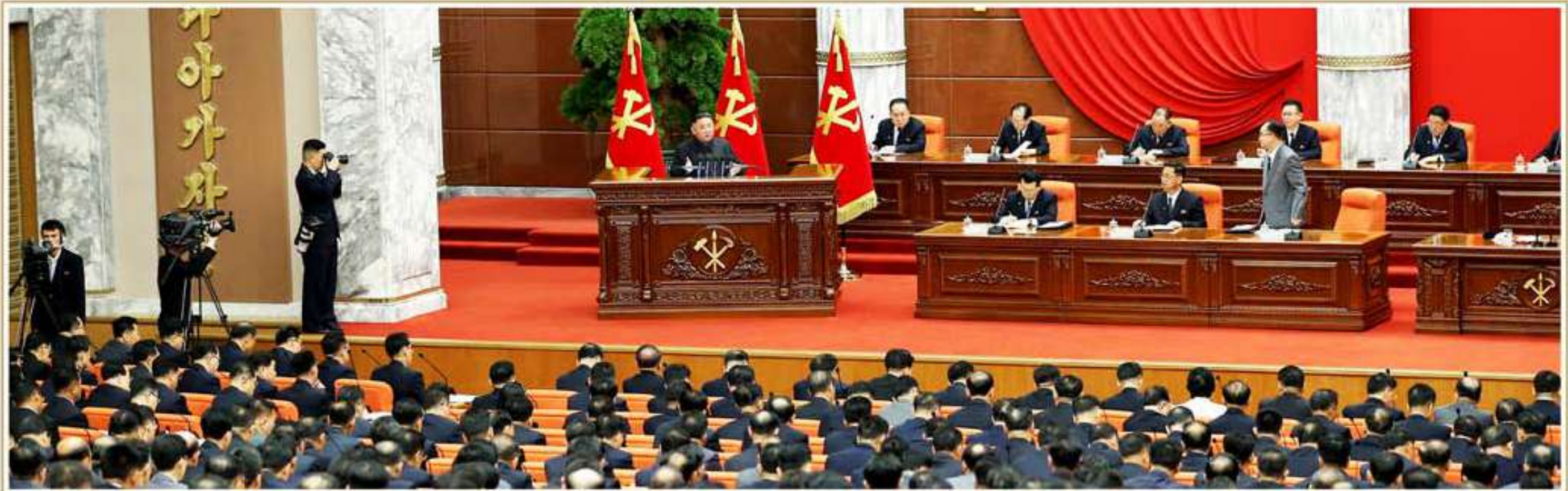
Kim Jong Un guided the Second Enlarged Meeting of the Political Bureau of the Eighth Central Committee of the WPK.