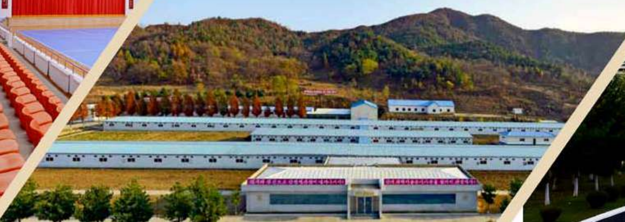
The Ryongchon Army-People Pig Farm renovated