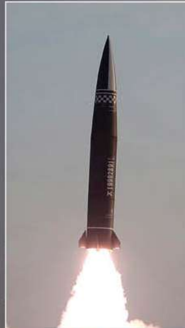
Test-fire of a new type of tactical guided missile