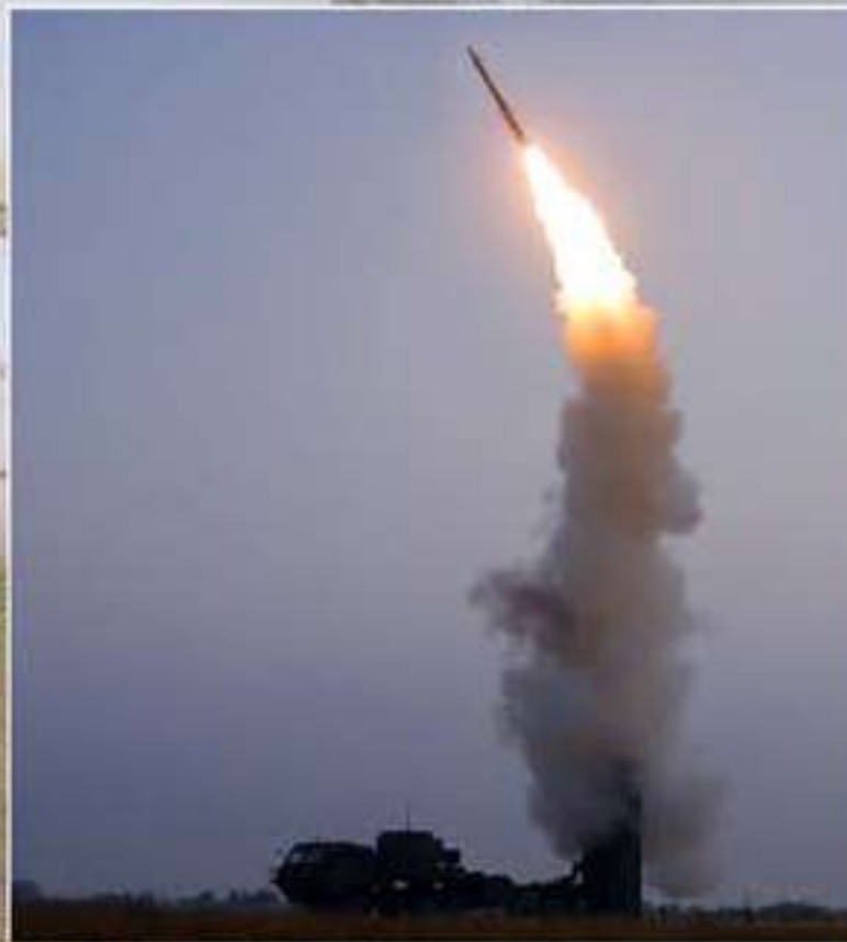
Test-fire of newly-developed anti-aircraft missile