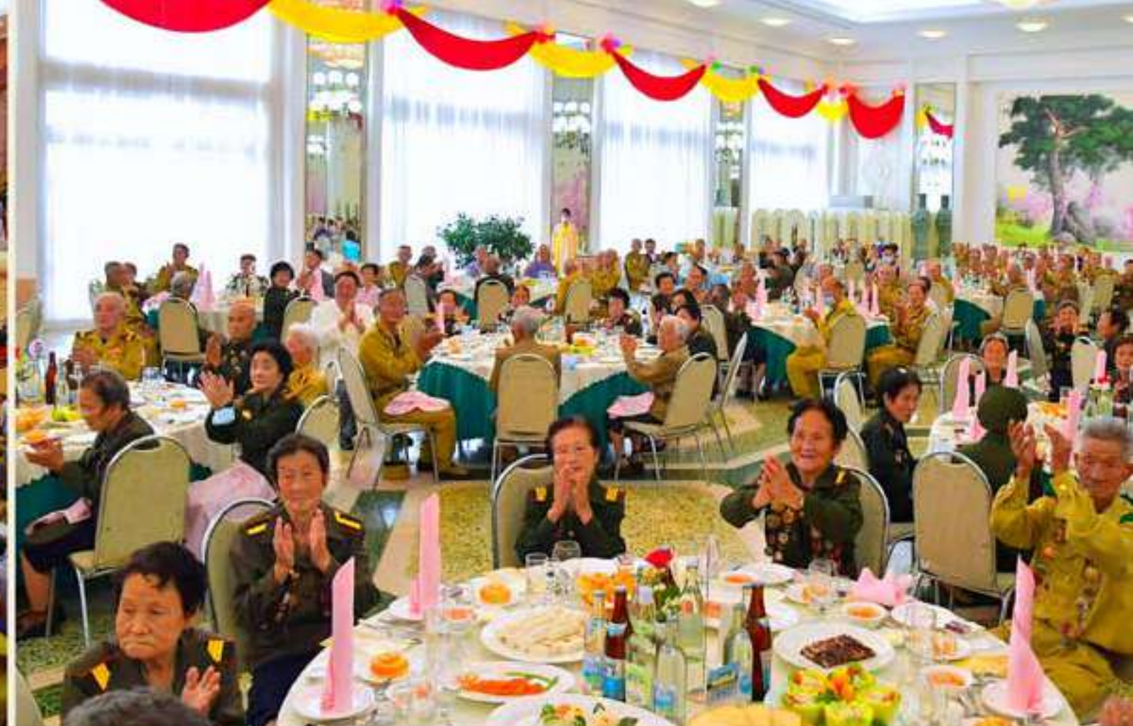
An artistic performance and banquet were held for the participants in the Seventh National Conference of War Veterans.