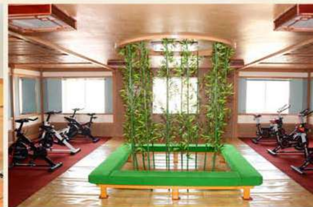
Old people's homes built in various parts of the country