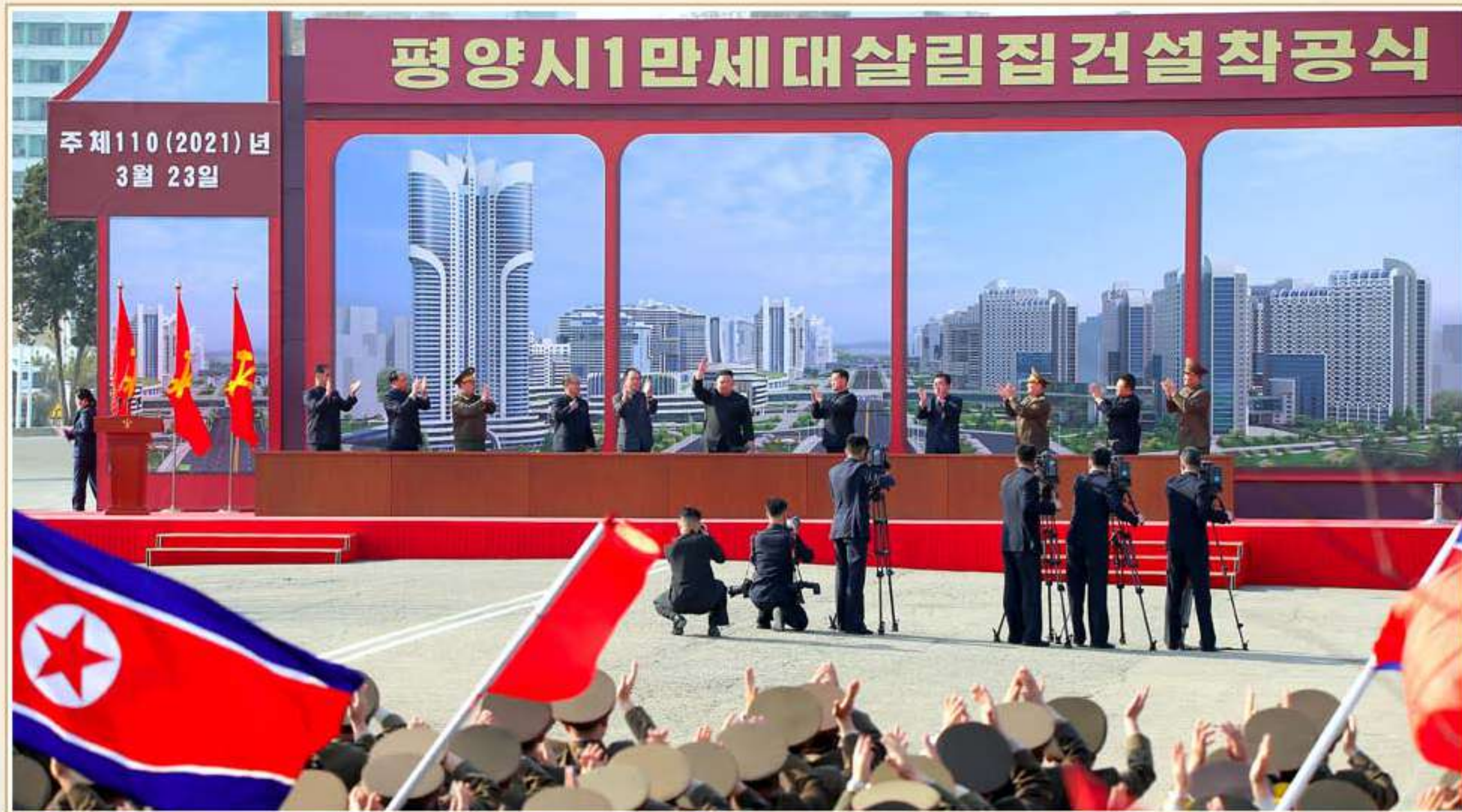
Kim Jong Un participated in the ground-breaking ceremony of the project for building 10 000 flats in Pyongyang.