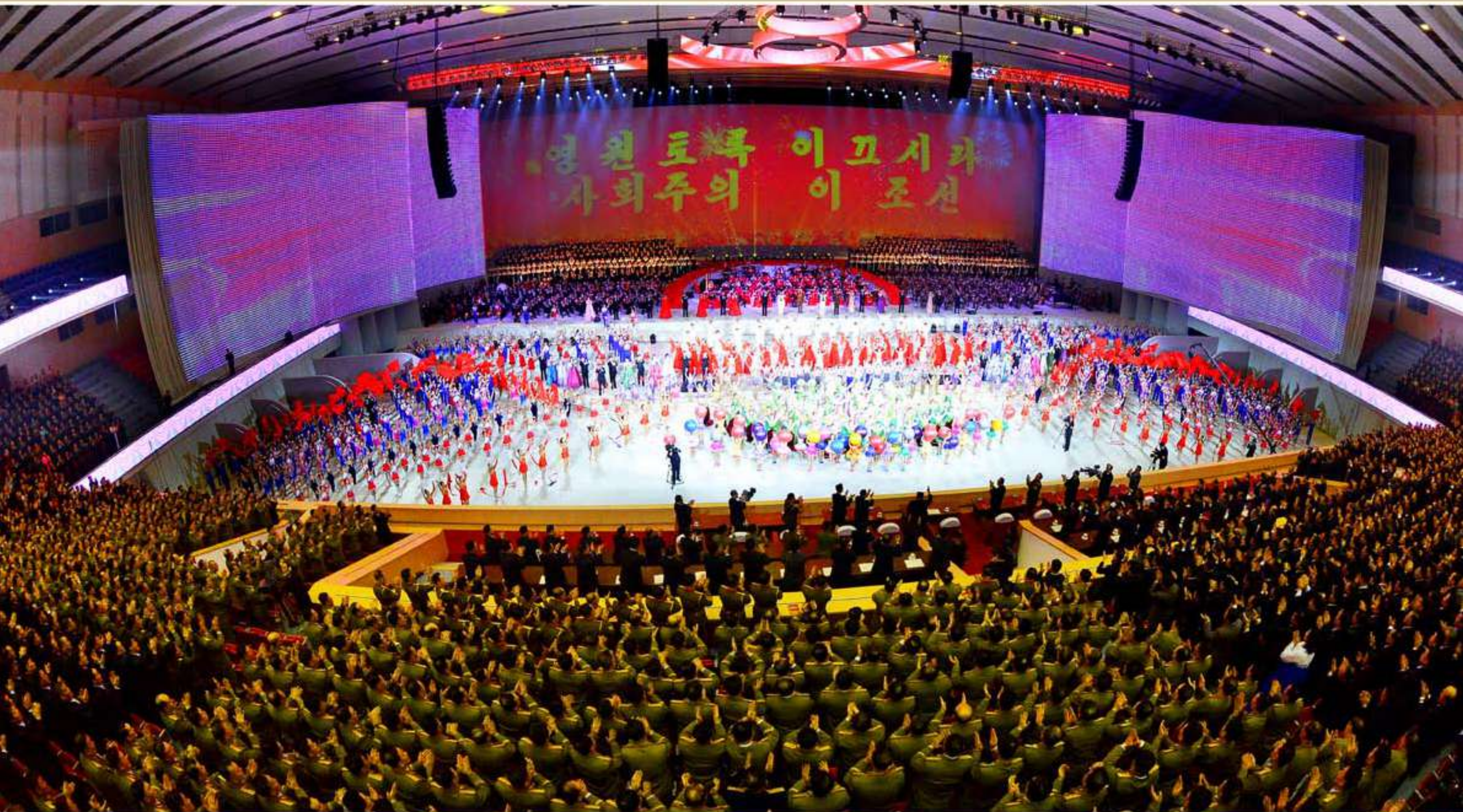
Kim Jong Un, with delegates to the Eighth Congress of the WPK, enjoyed the grand artistic performance We Sing of the Party held in celebration of the Congress.