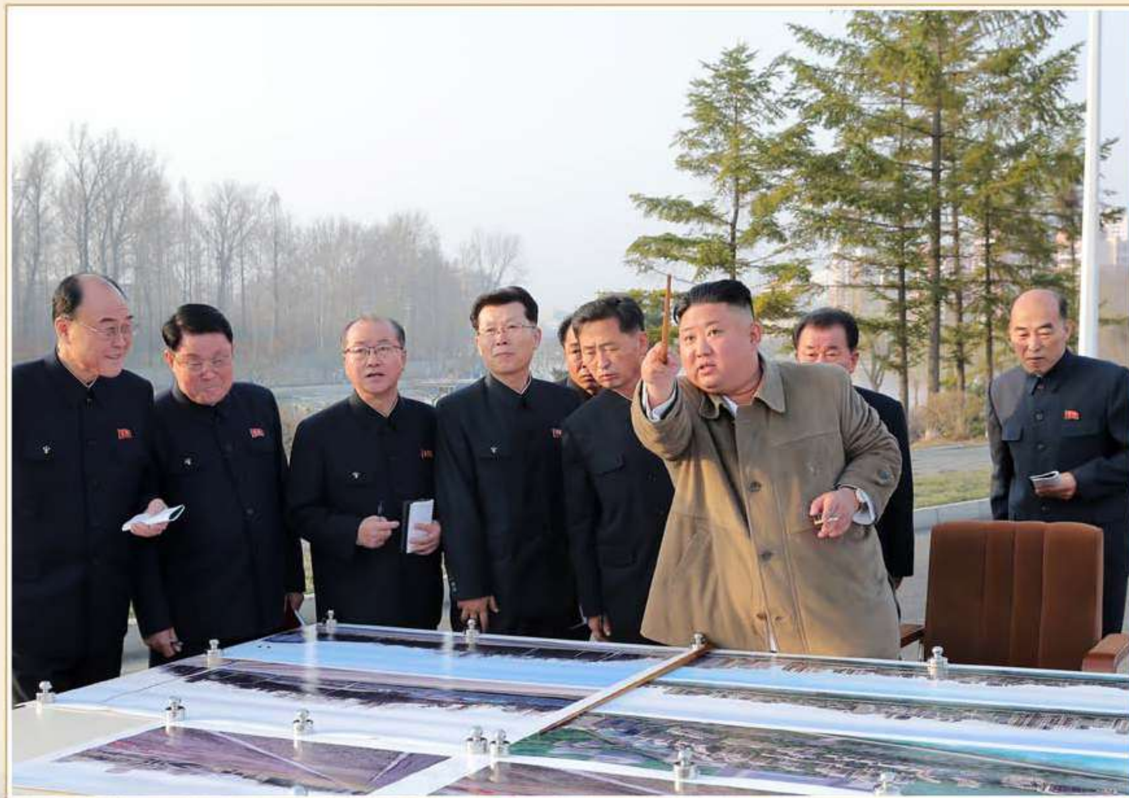
Kim Jong Un unfolded a plan for building a residential district of terraced apartment houses on the riverside near the Pothong Gate.