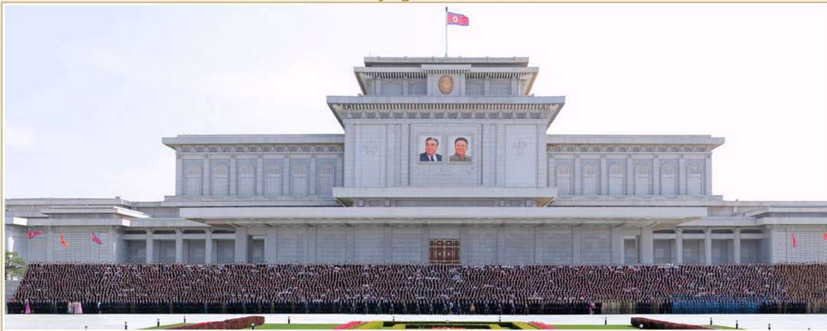
Kim Jong Un met and had a photo taken with participants in the Tenth Congress of the youth league.