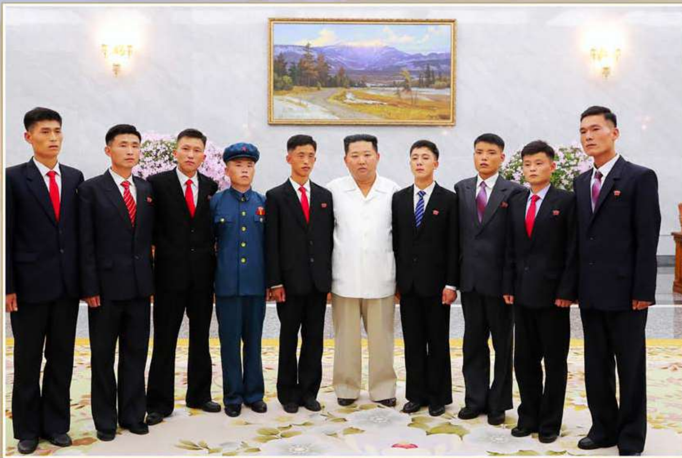
Kim Jong Un met young people, who volunteered to work in the most difficult and challenging sectors, and had a photograph taken with them.