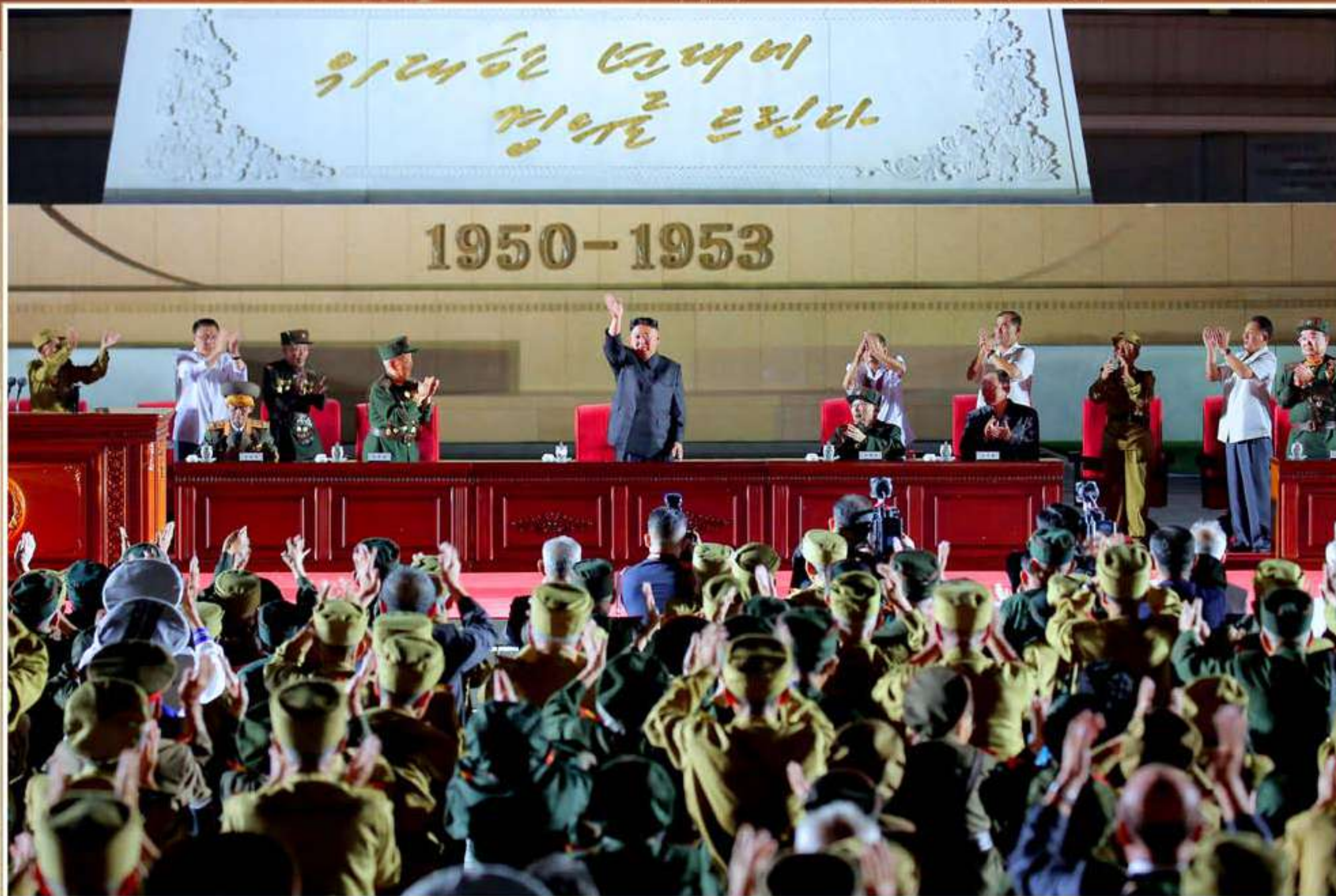
The Seventh National Conference of War Veterans was held in the presence of Kim Jong Un.