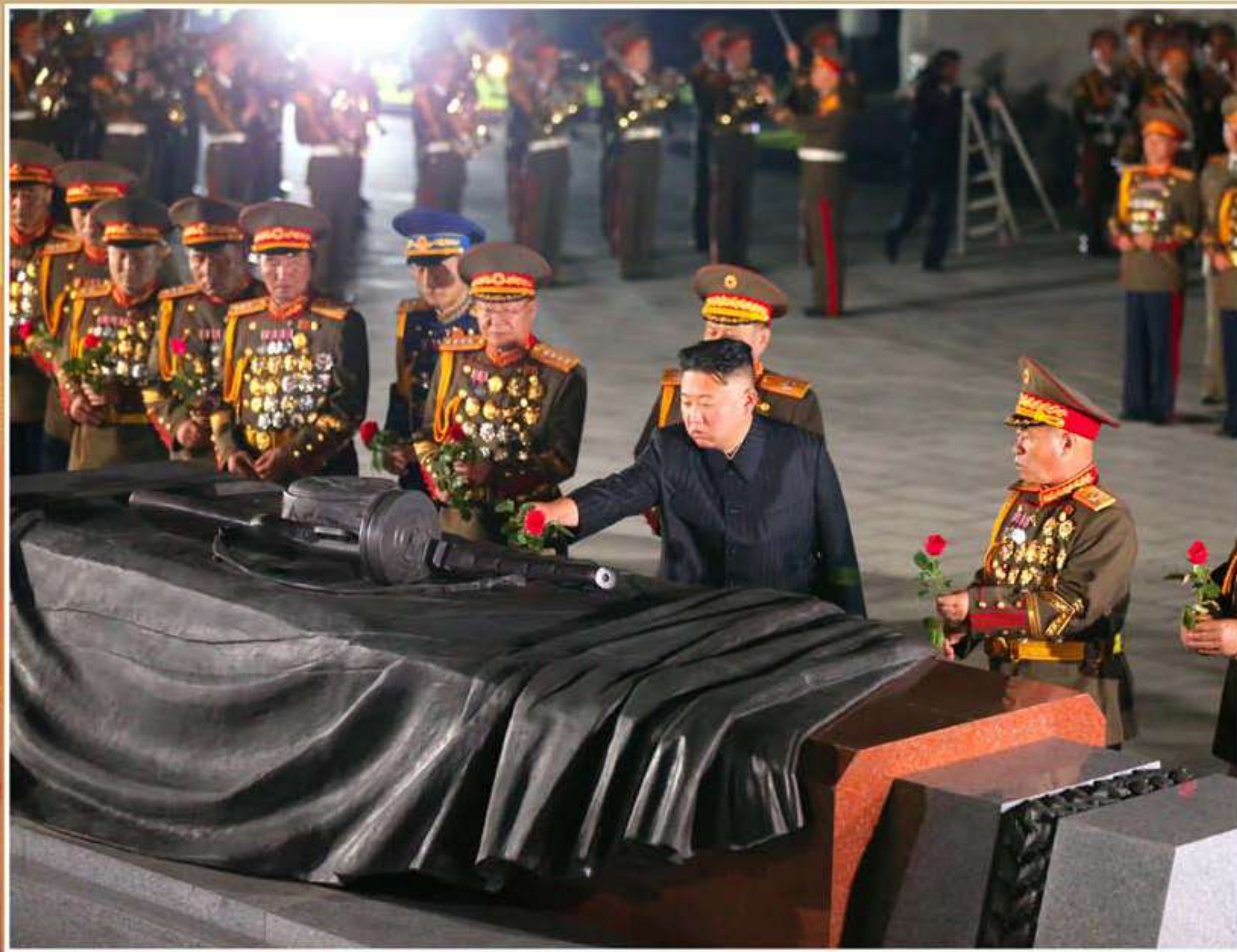
Kim Jong Un visited the Fatherland Liberation War Martyrs Cemetery on the occasion of the V-Day.