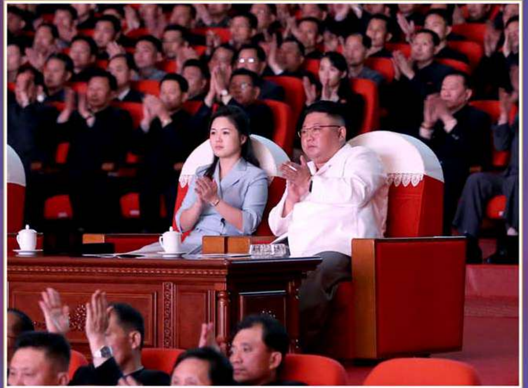
Kim Jong Un enjoyed a joint performance given by major art troupes in celebration of the Day of the Sun.