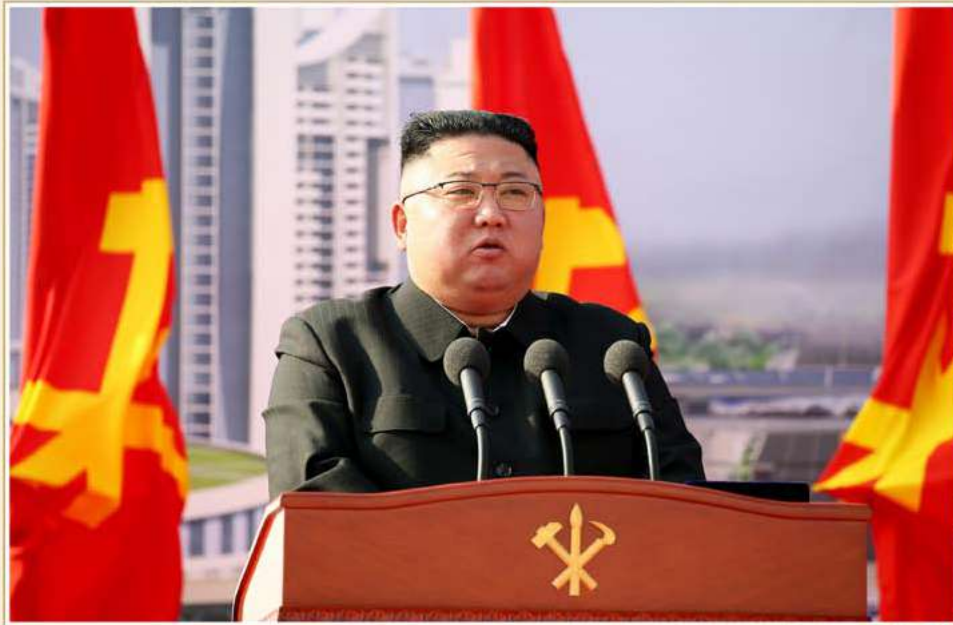
Kim Jong Un delivered a meaningful speech in the ground-breaking ceremony.