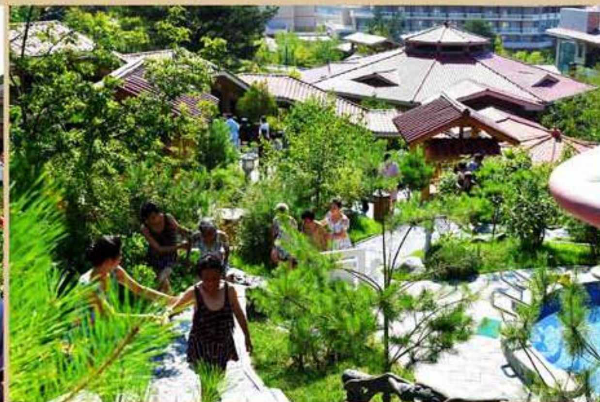
Participants in the Seventh National Conference of War Veterans had a pleasant time at the Yangdok Hot Spring Resort.