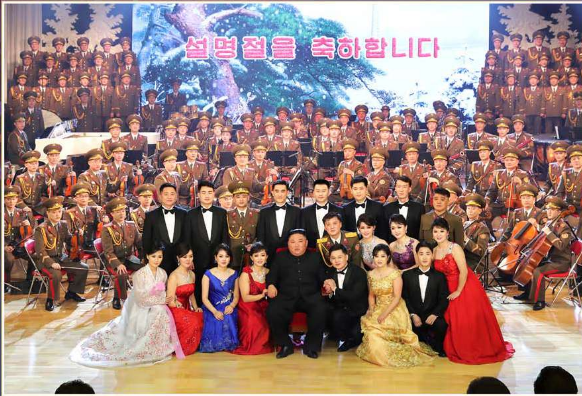
Kim Jong Un saw an artistic performance held in celebration of lunar New Year's Day and had a photo taken with the performers.