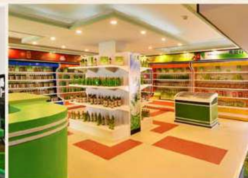
The Unjong Tea Factory inaugurated