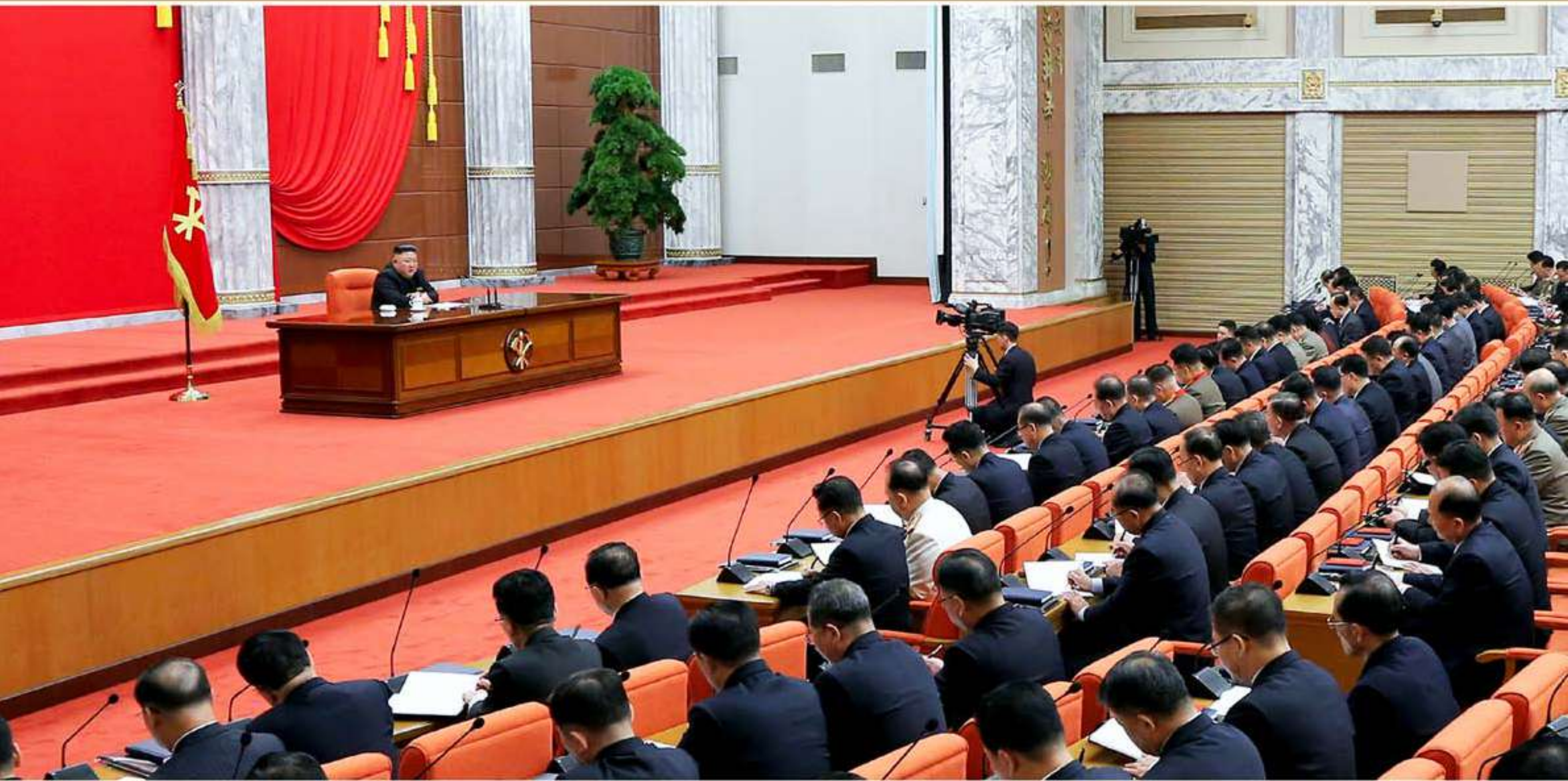
Kim Jong Un, General Secretary of the WPK, guided the First Plenary Meeting of the Eighth Central Committee of the WPK.