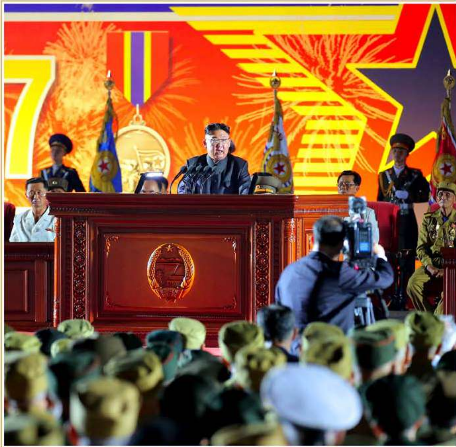
Kim Jong Un made a speech at the conference.