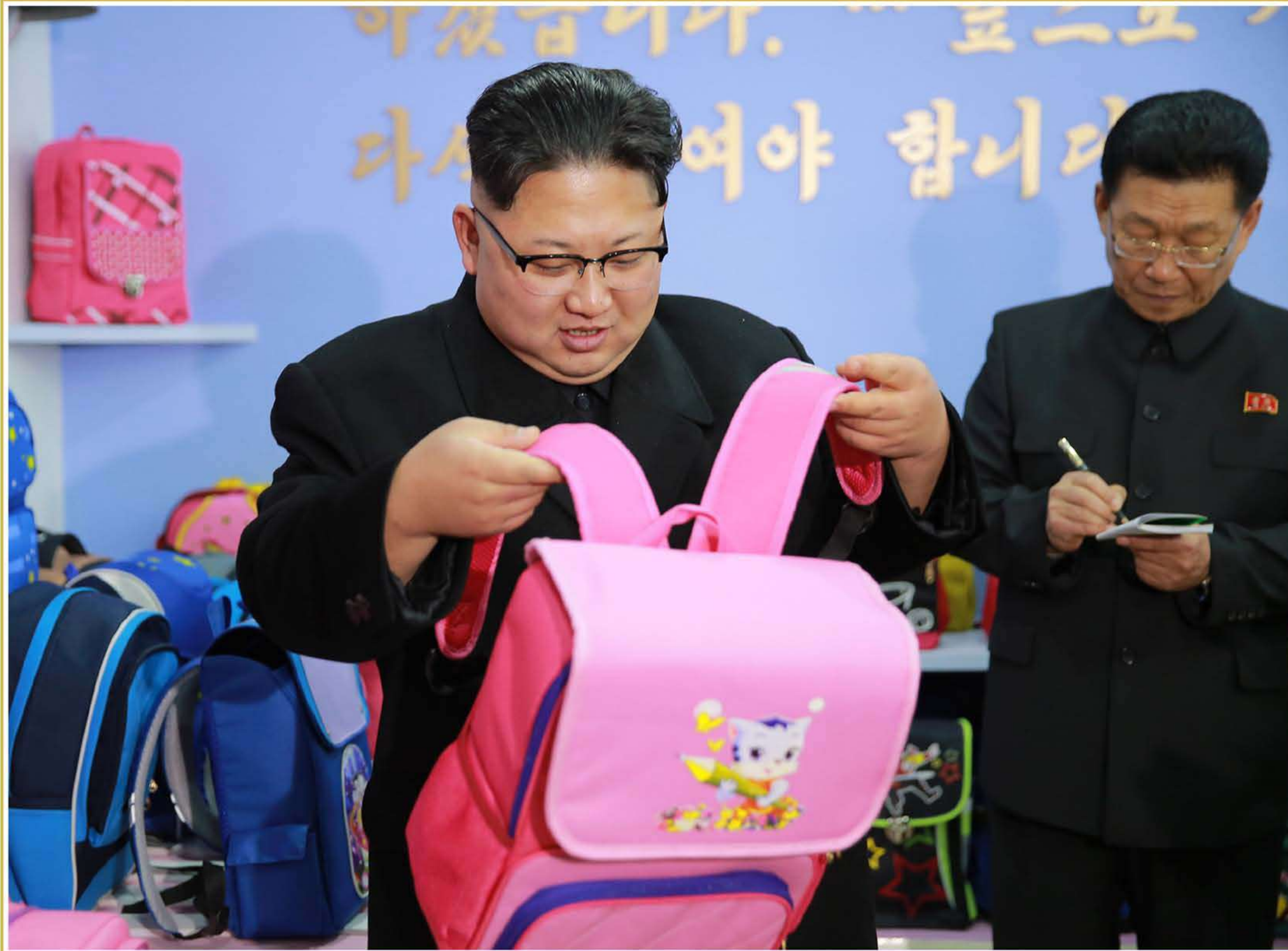
Kim Jong Un giving field guidance at the Pyongyang Bag Factory in January Juche 106 (2017)