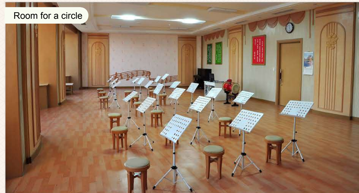
Room for a circle