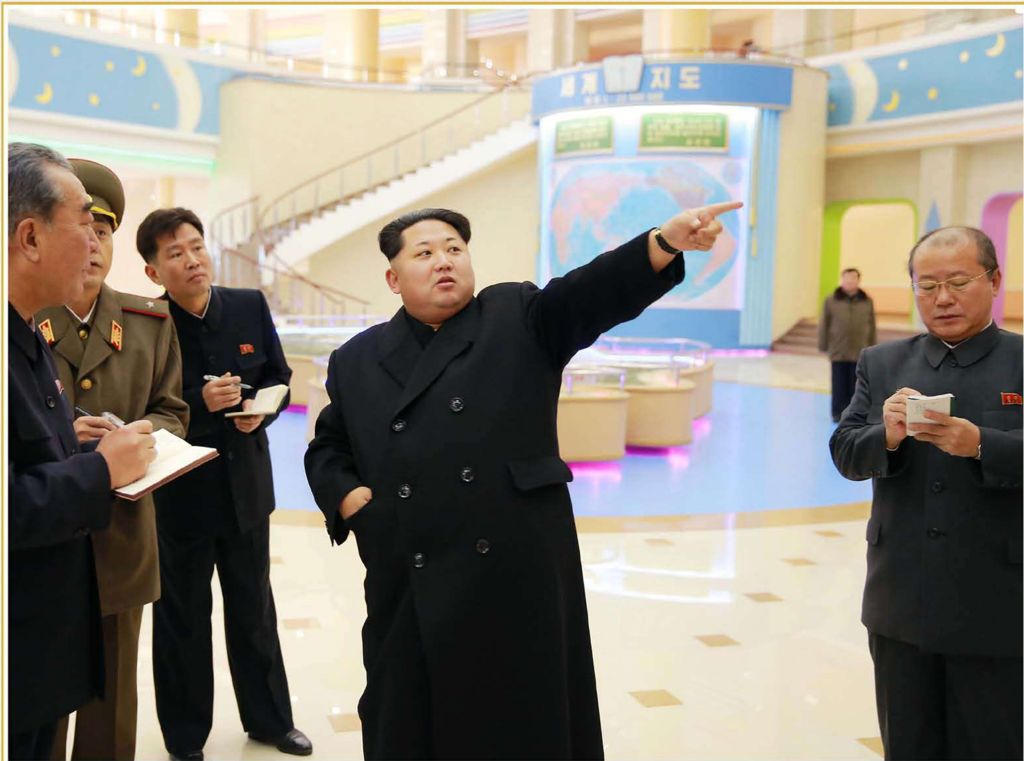
Kim Jong Un looking round the renovated Mangyongdae Schoolchildren's Palace in November Juche 104 (2015)