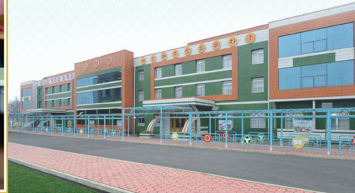
Kim Jong Un visiting the newly-built Pyongyang Primary School for Orphans in February Juche 106 (2017)