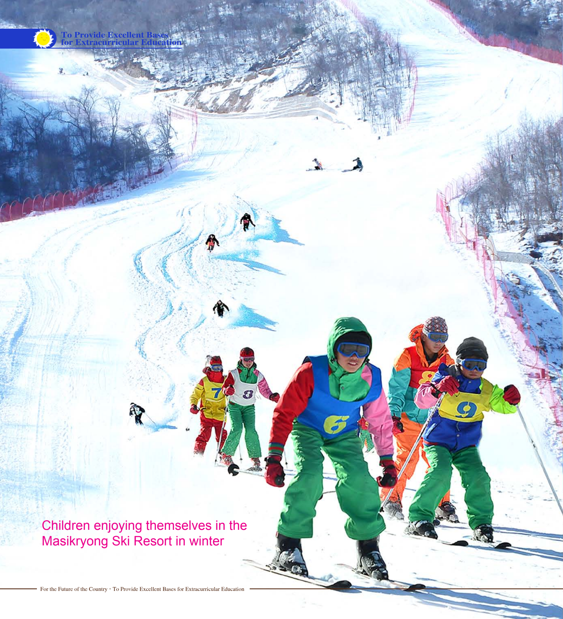
Children enjoying themselves in the Masikryong Ski Resort in winter