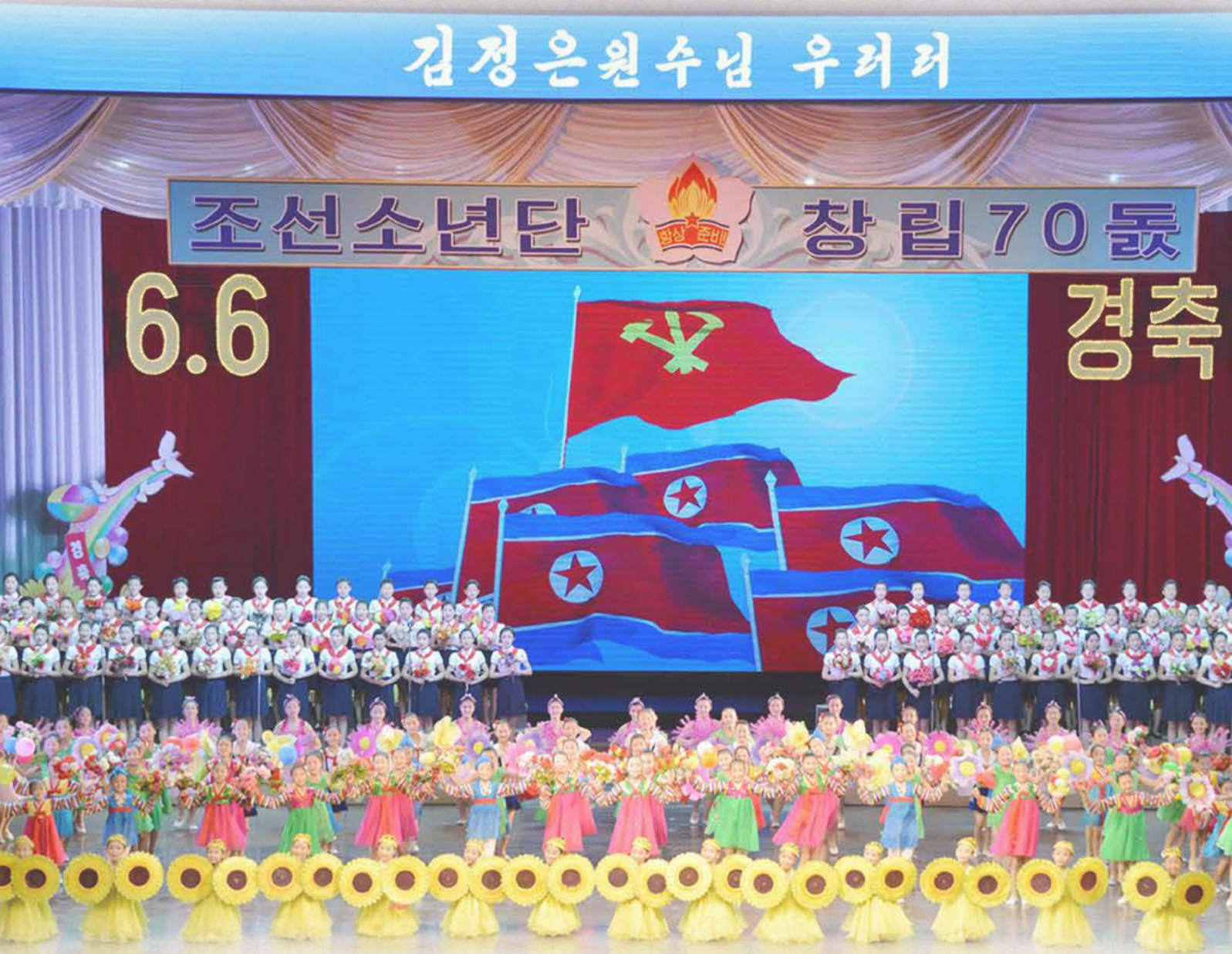
Kim Jong Un enjoying an artistic performance with delegates to the celebrations of the 70 th founding anniversary of the Korean Children's Union in June Juche 105 (2016)