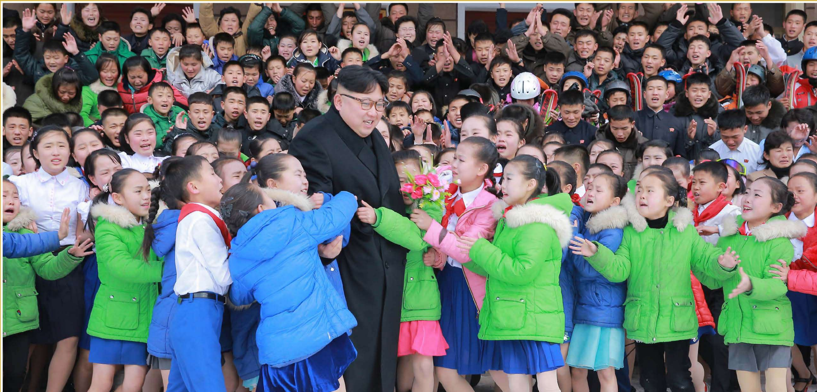
Kim Jong Un with the circle members of the Samjiyon Schoolchildren's Palace in November Juche 105 (2016)