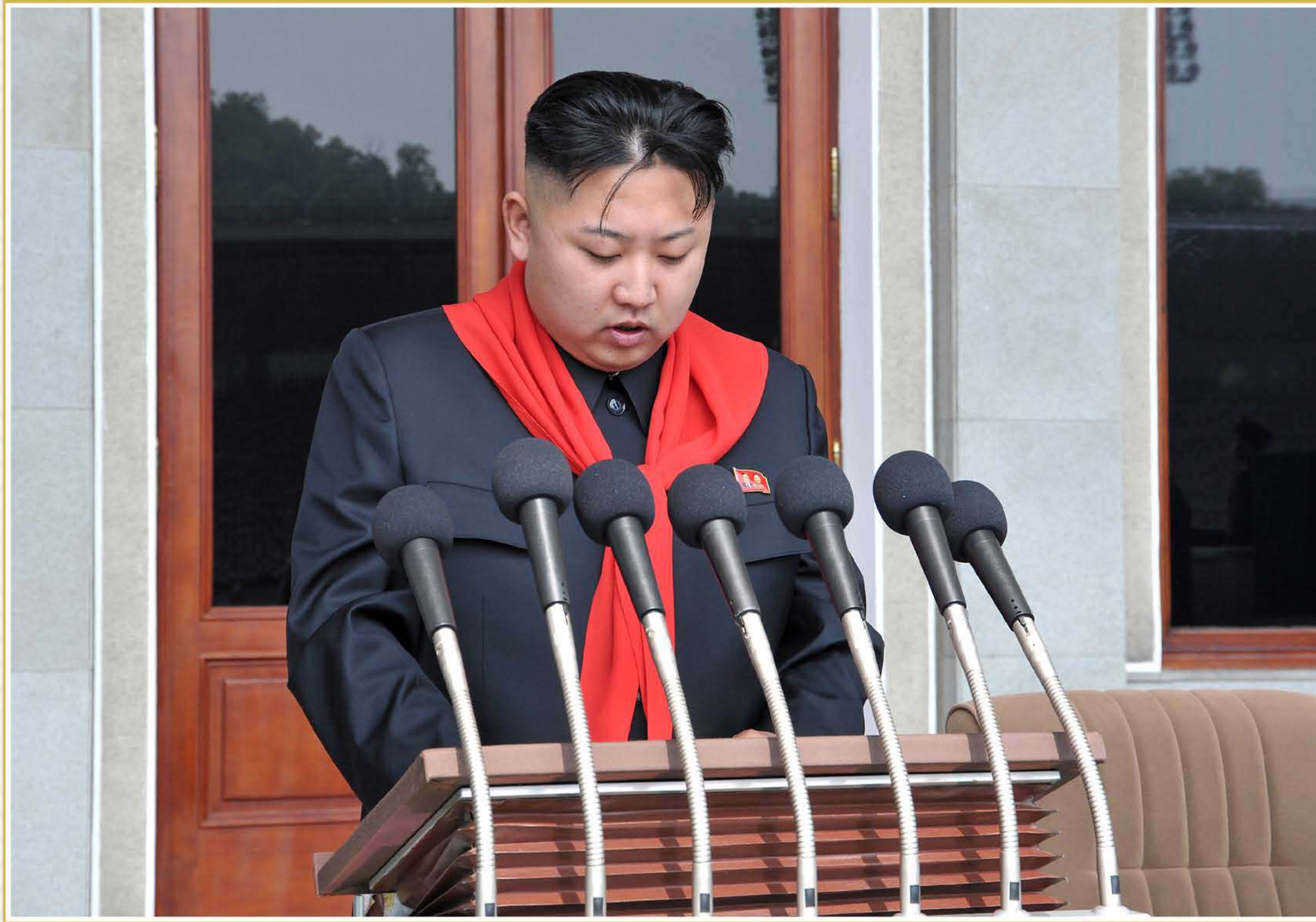
Kim Jong Un making a congratulatory speech at the Joint National Meeting of the Korean Children's Union Organizations held in celebration of the 66 th anniversary of its founding in June Juche 101 (2012)