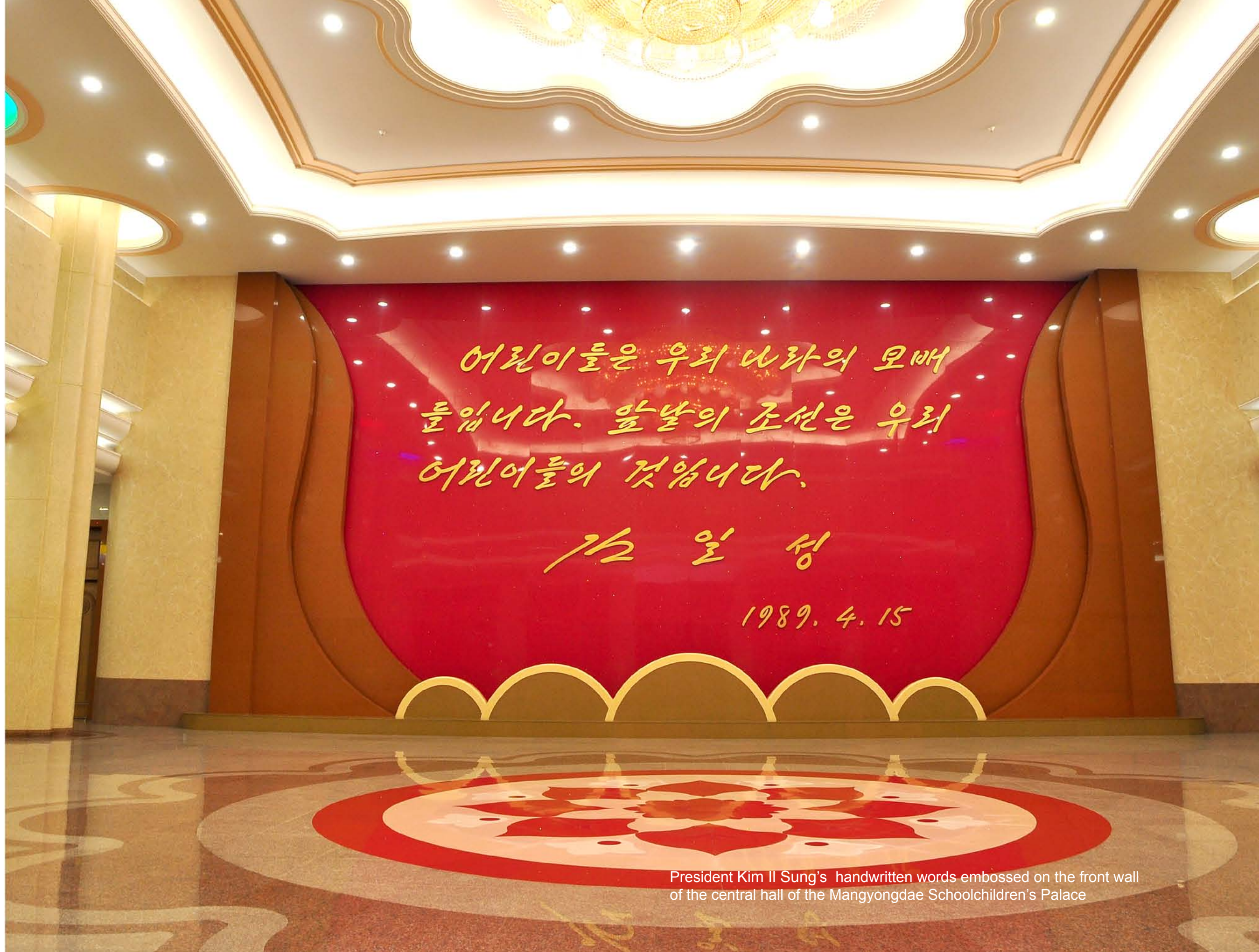
President Kim Il Sung's handwritten words embossed on the front wall of the central hall of the Mangyongdae Schoolchildren's Palace