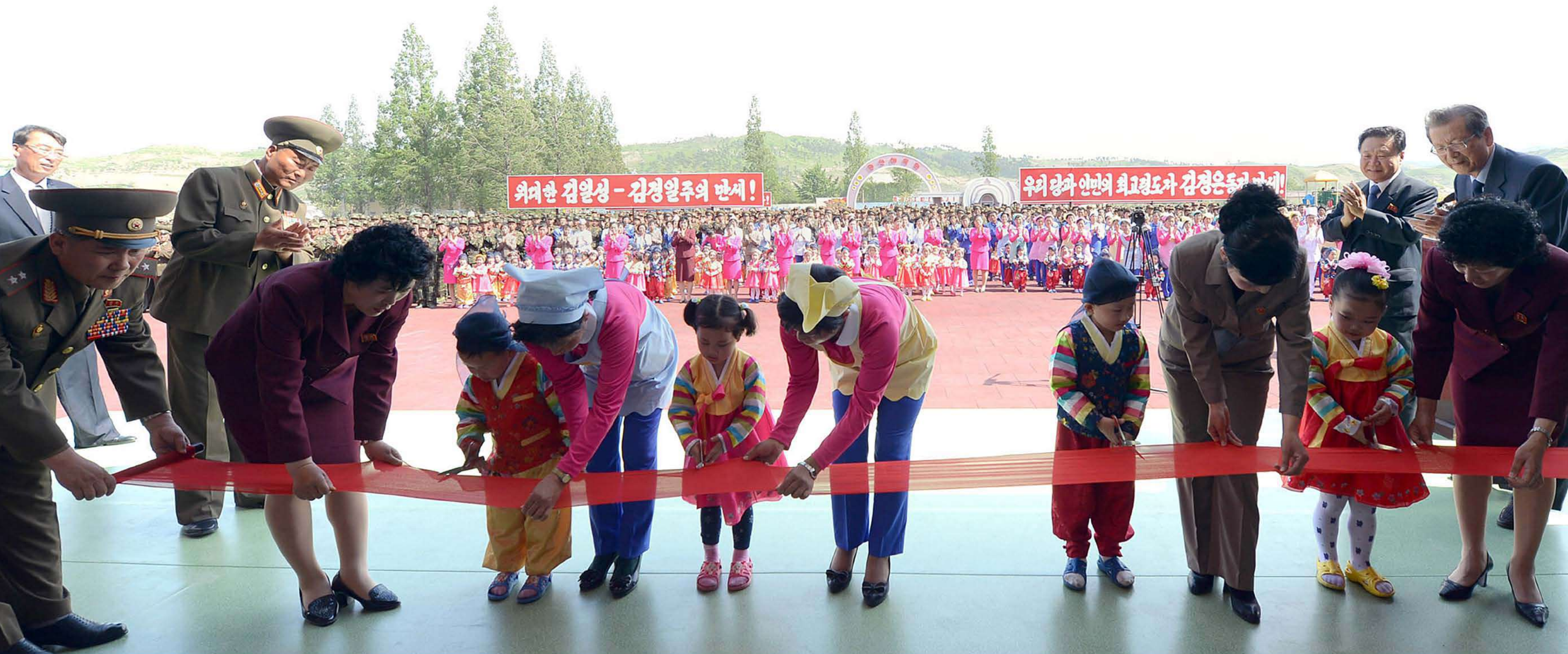
Orphans cutting the tape at the inauguration ceremony of the Wonsan Baby Home and Wonsan Orphanage in June Juche 104 (2015)