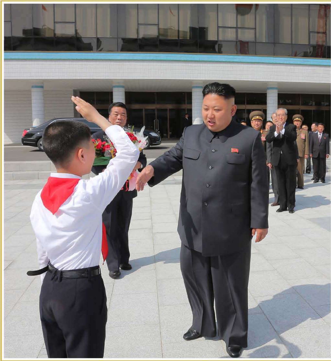
Kim Jong Un at the inauguration ceremony of the renovated Songdowon International Children's Camp in May Juche 103 (2014)