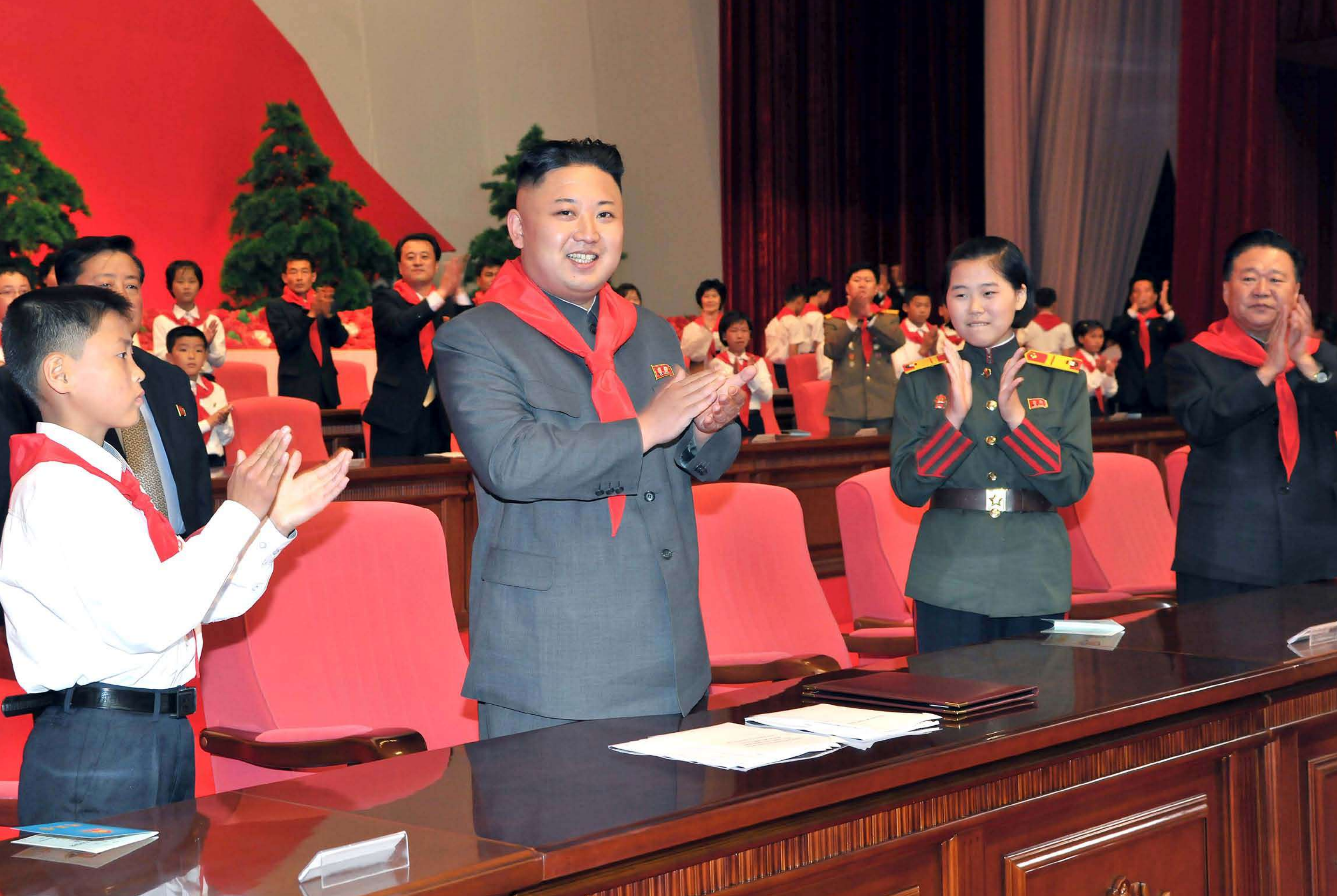
Kim Jong Un attending the Seventh Congress of the Korean Children's Union in June Juche 102 (2013)