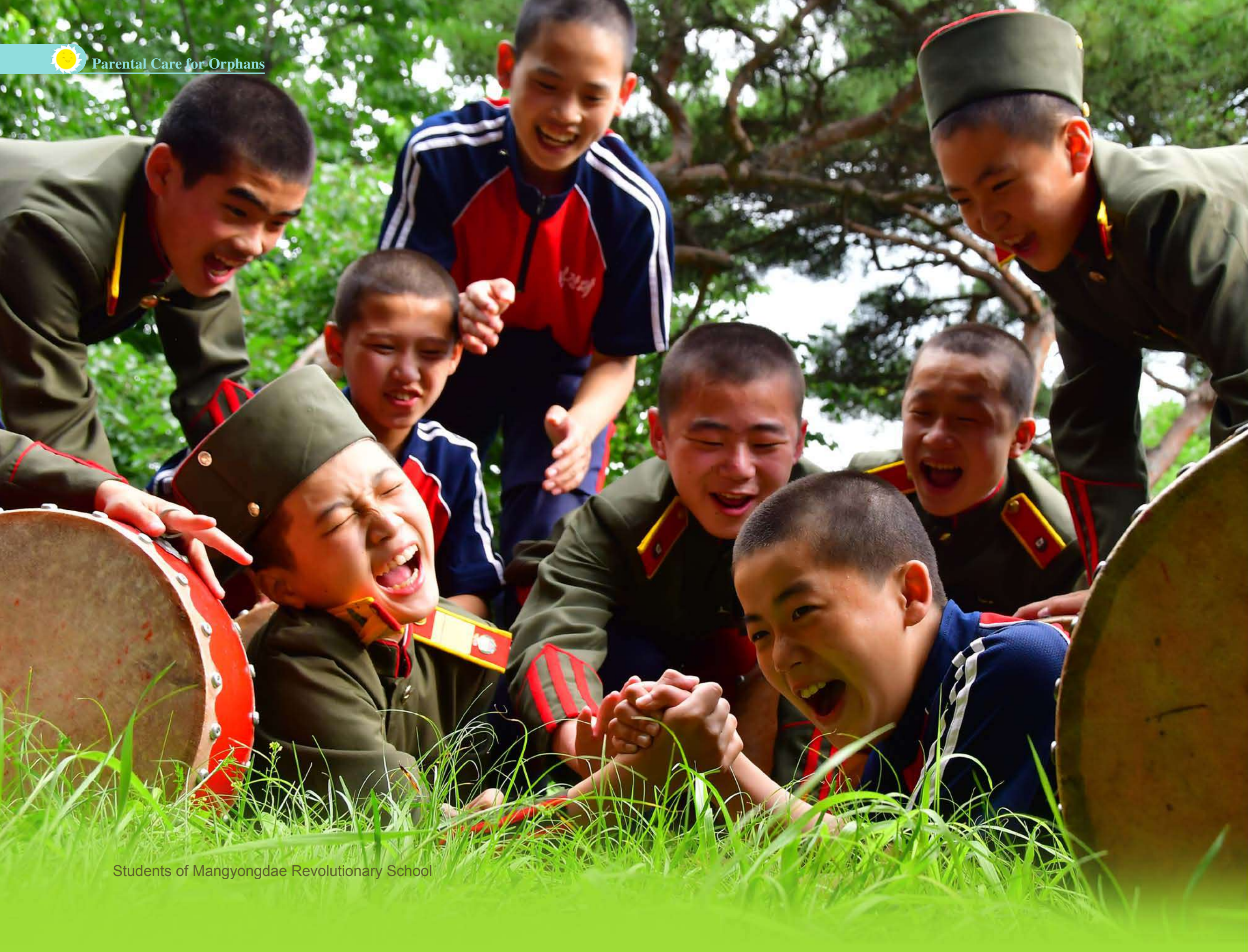
Students of Mangyongdae Revolutionary School