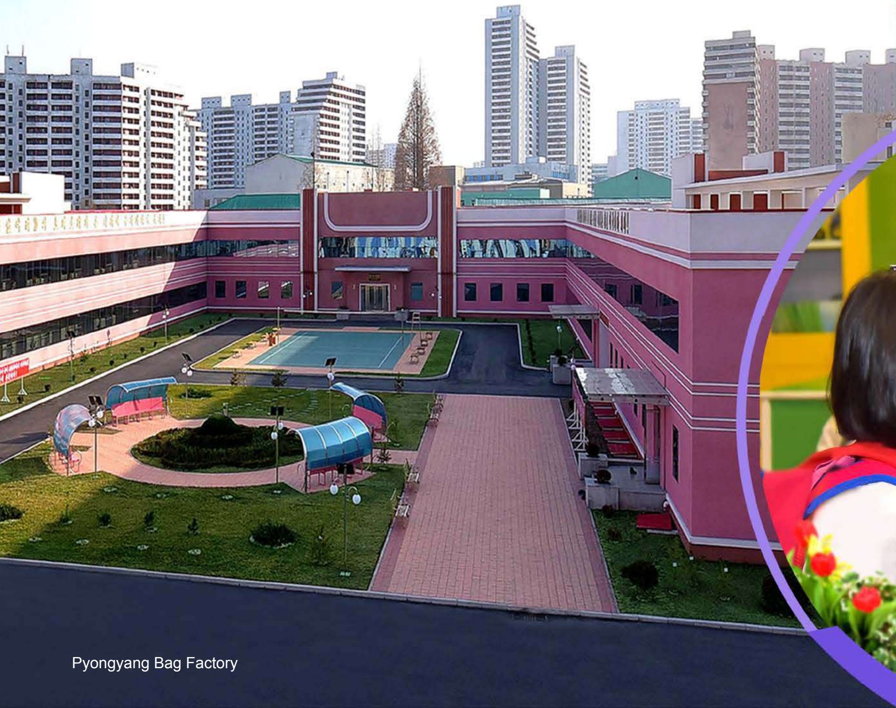
Pyongyang Bag Factory