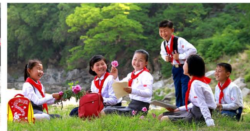
Schoolchildren are provided with new uniforms according to season and school things.