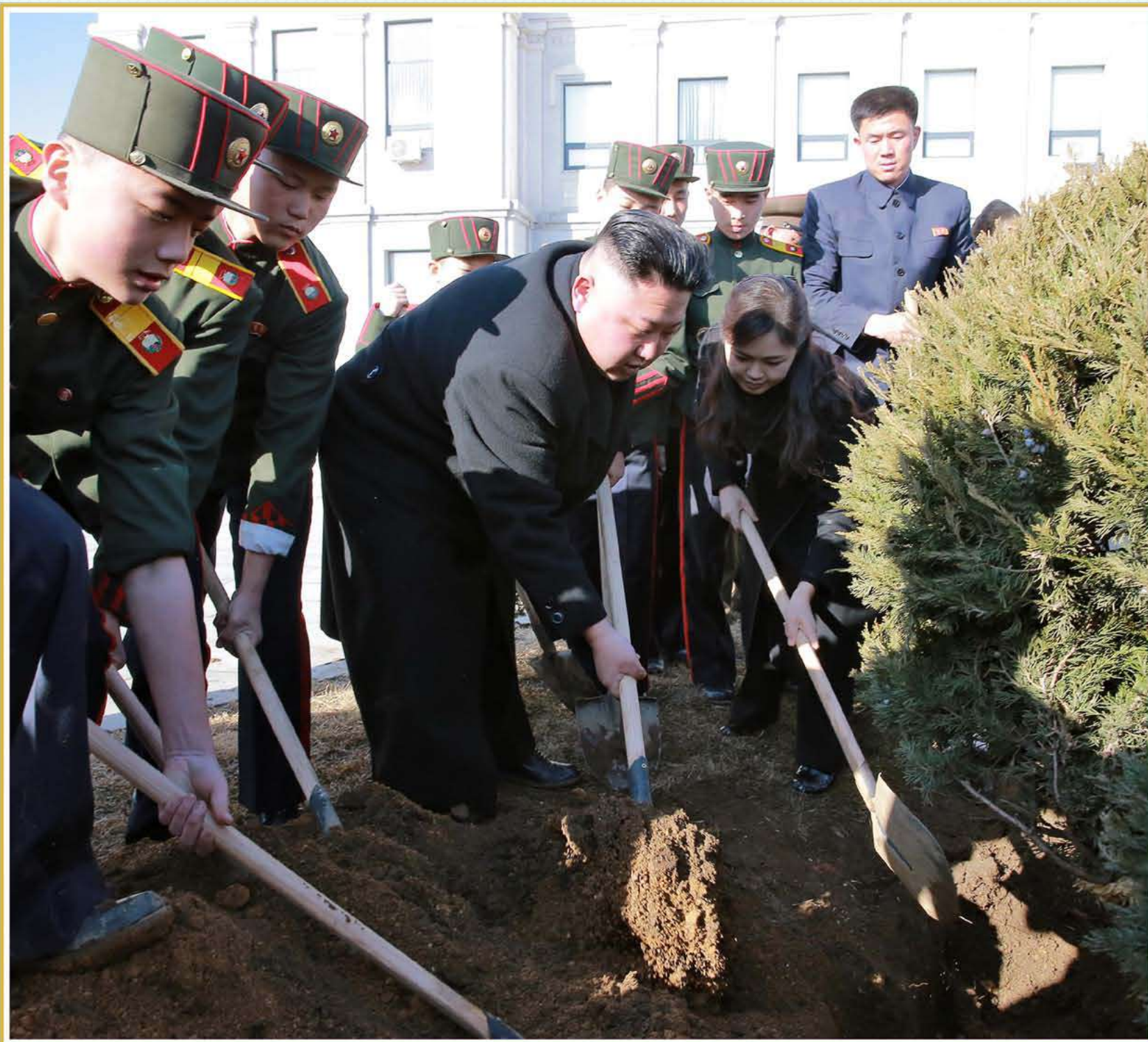
Kim Jong Un planting a tree with the students of Mangyongdae Revolutionary School in March Juche 106 (2017)