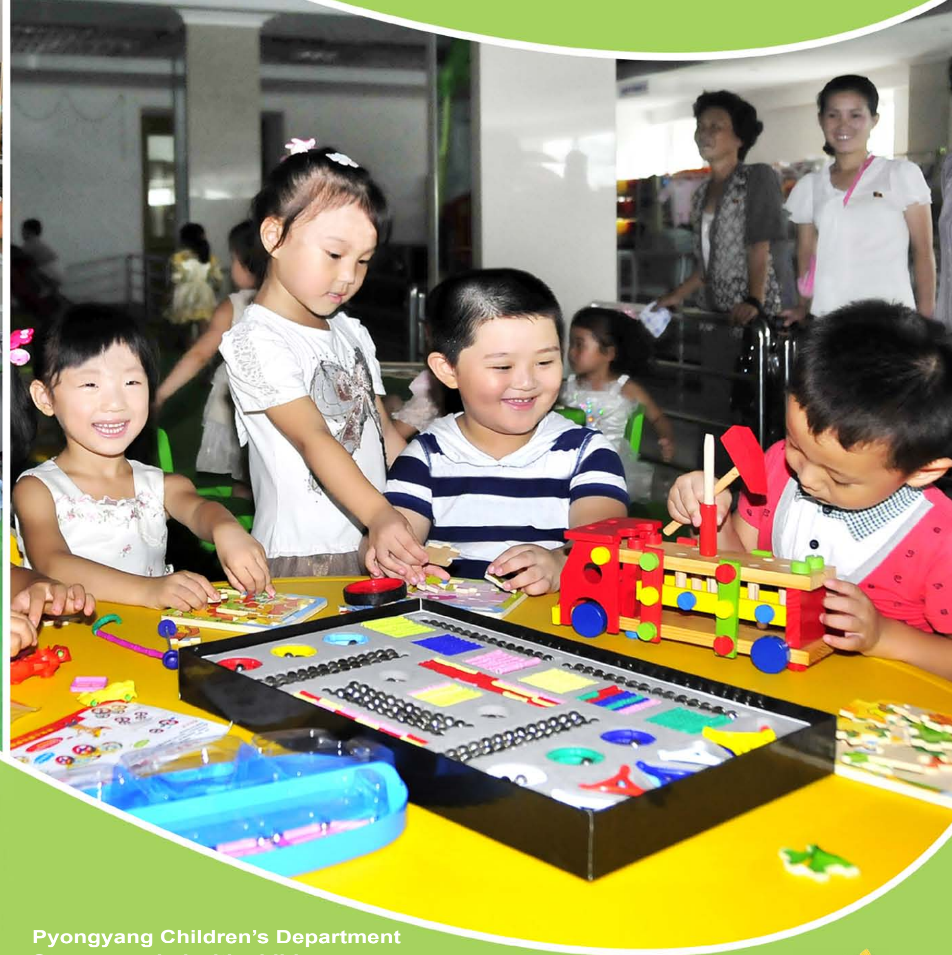
Pyongyang Children's Department Store crowded with children