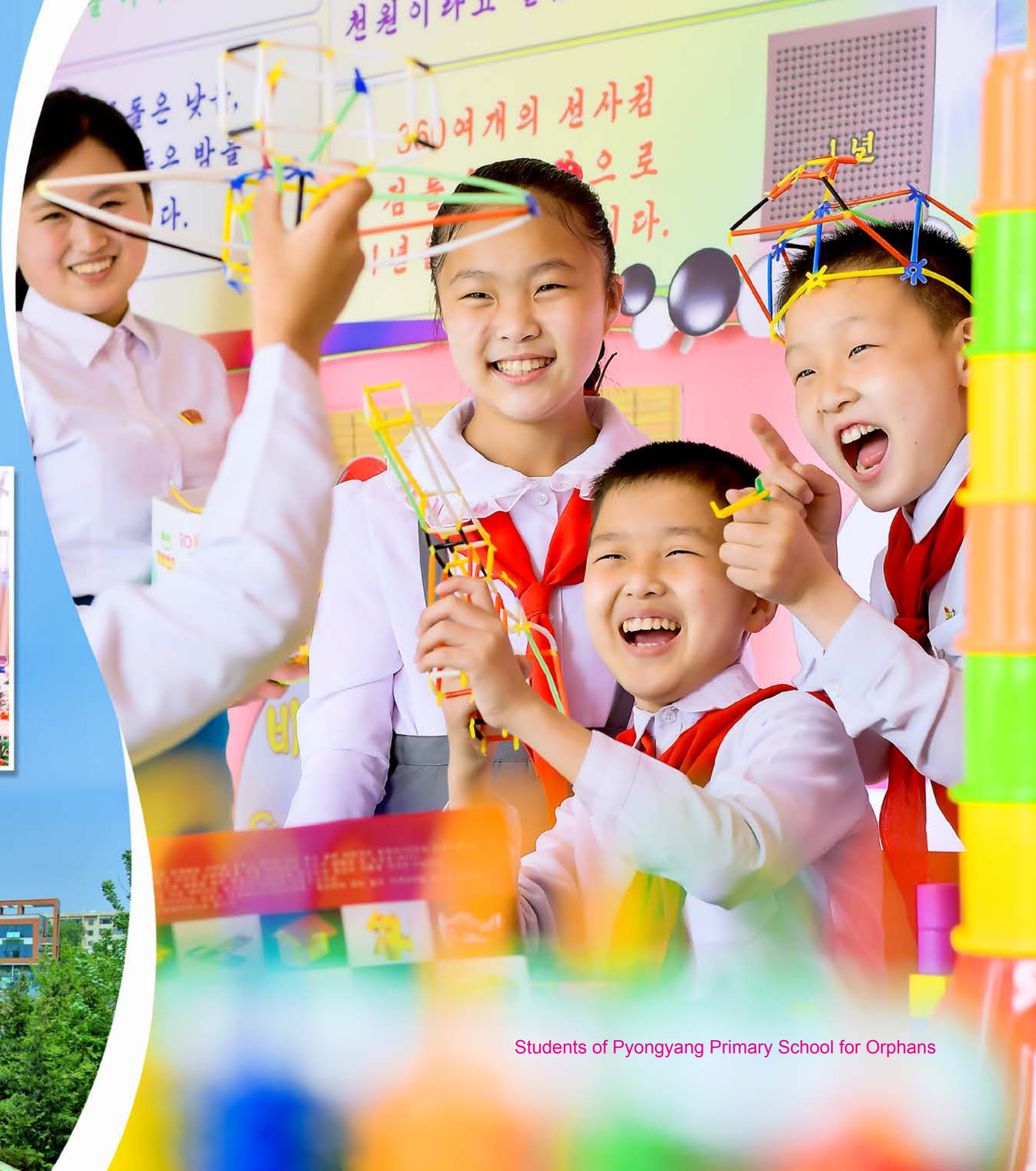
Students of Pyongyang Primary School for Orphans