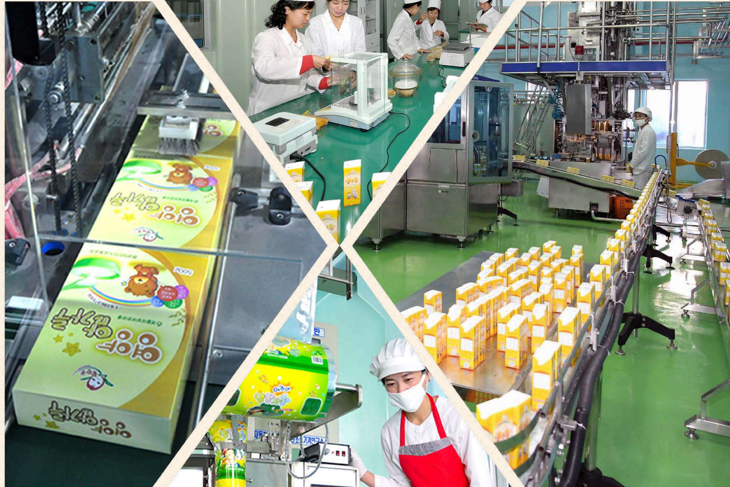
Pyongyang Children's Foodstuff Factory