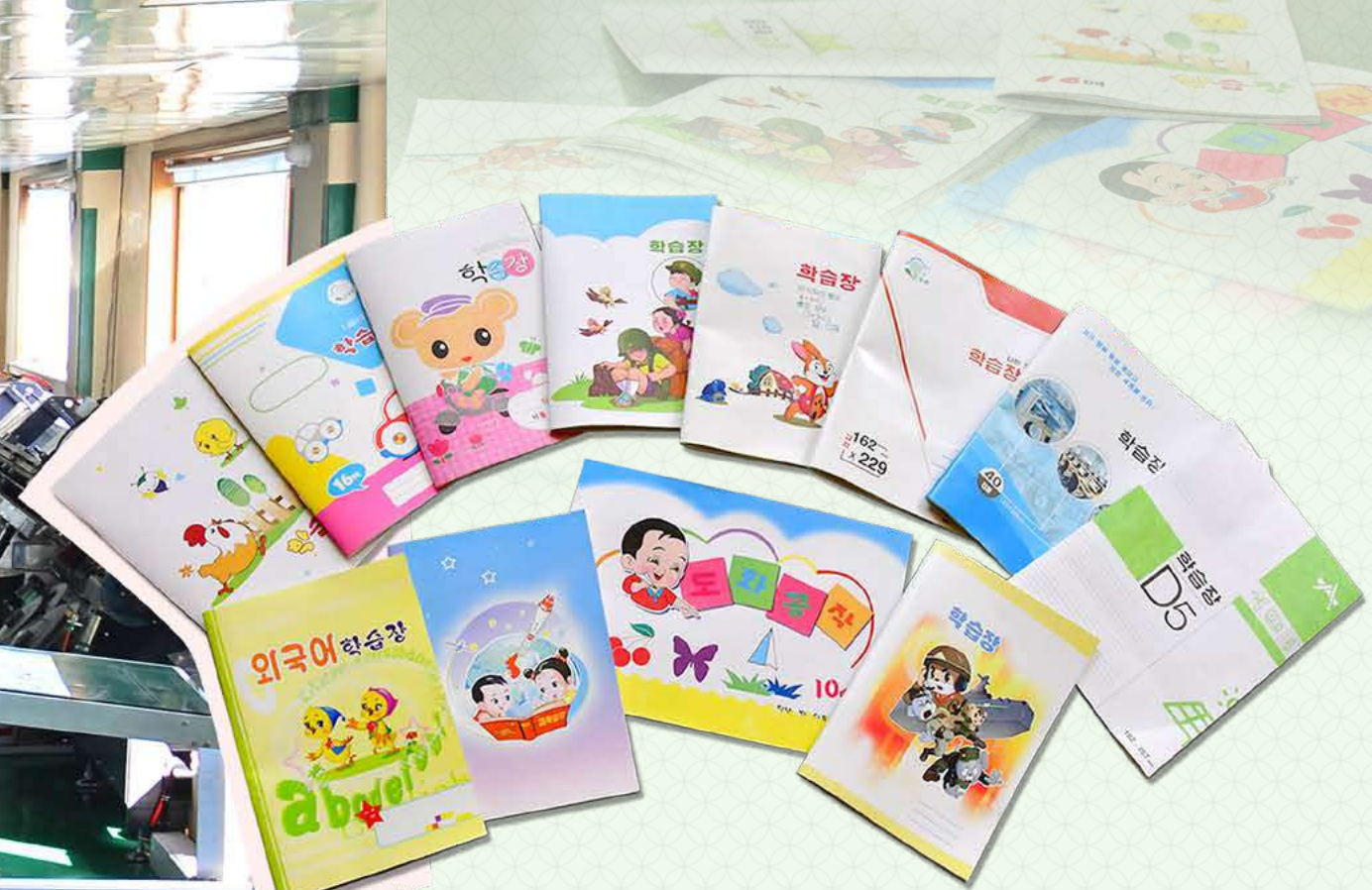
Mindulle Notebook Factory