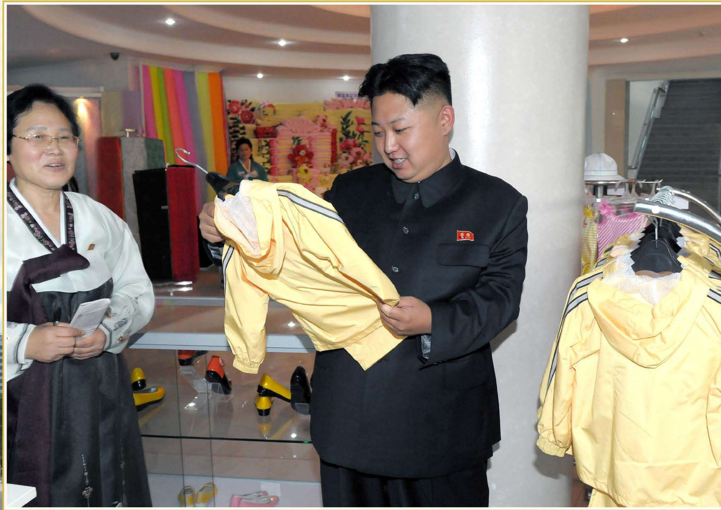
Kim Jong Un giving on-site guidance at the Pyongyang Children's Department Store in July Juche 101 (2012)