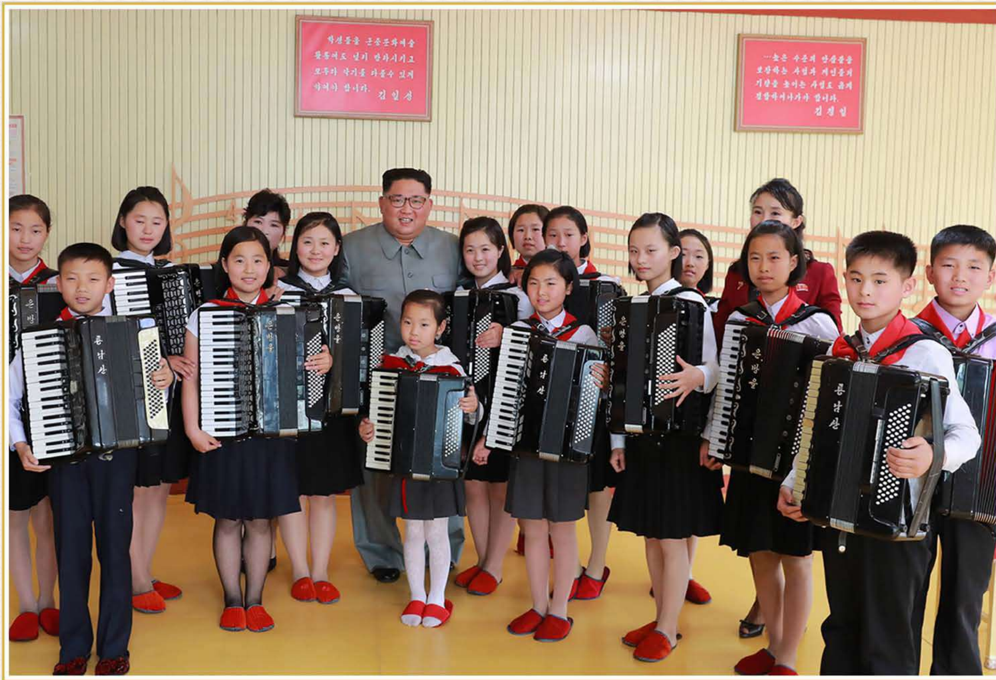
Kim Jong Un visiting the 1 000-ri Journey for Learning Schoolchildren's Palace in May Juche 108 (2019)