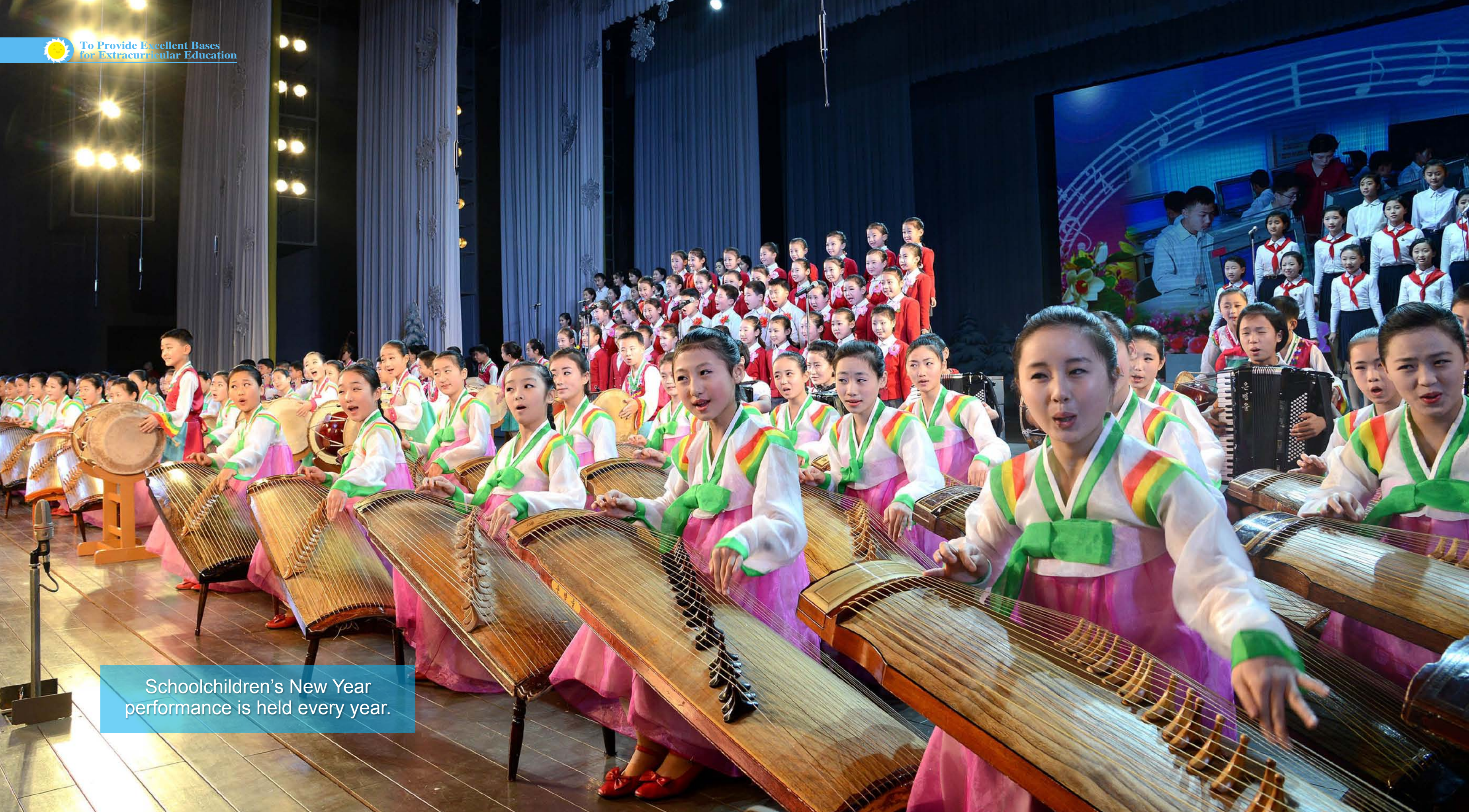
Schoolchildren's New Year performance is held every year.