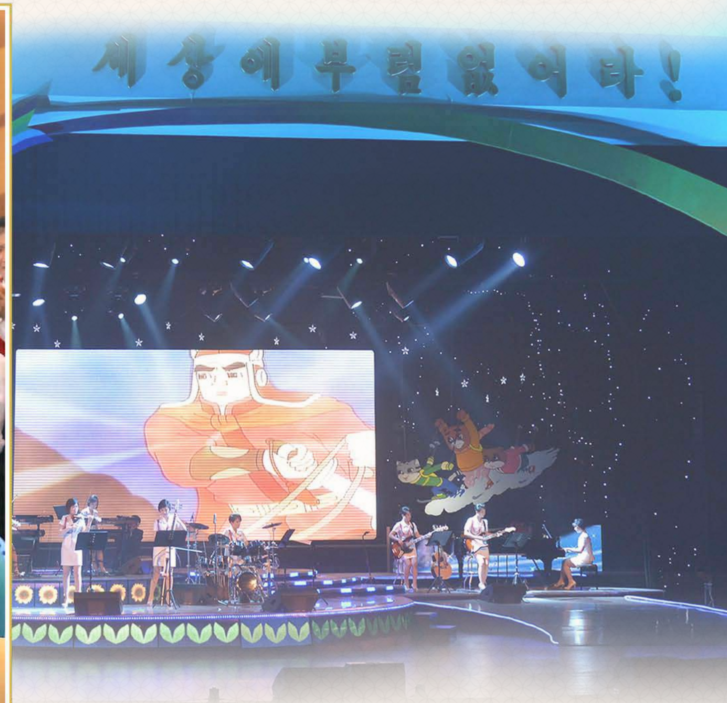
Kim Jong Un enjoying with schoolchildren an artistic performance held by the Moranbong Band in congratulation of the opening of the renovated Songdowon International Children's Camp in May Juche 103 (2014)