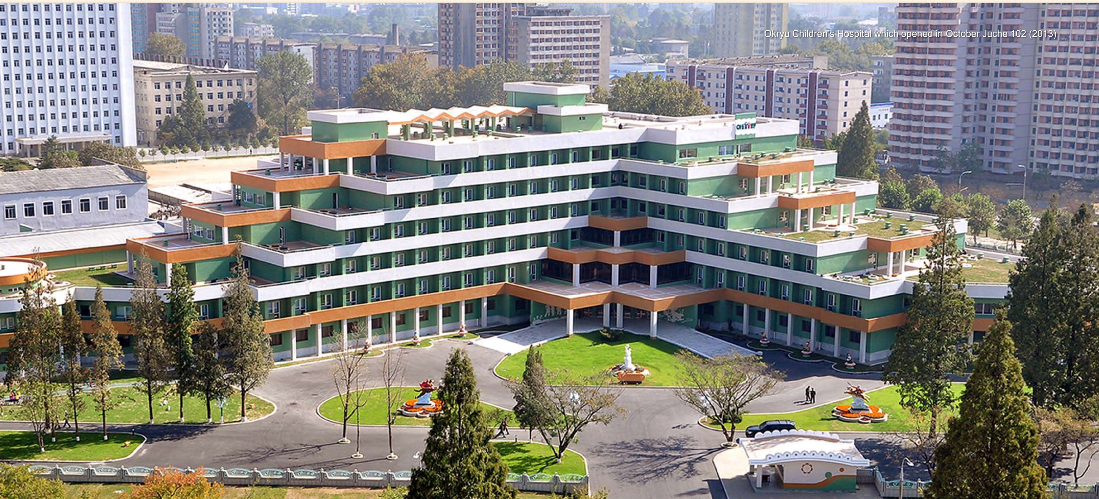
Okryu Children's Hospital which opened in October Juche 102 (2013)