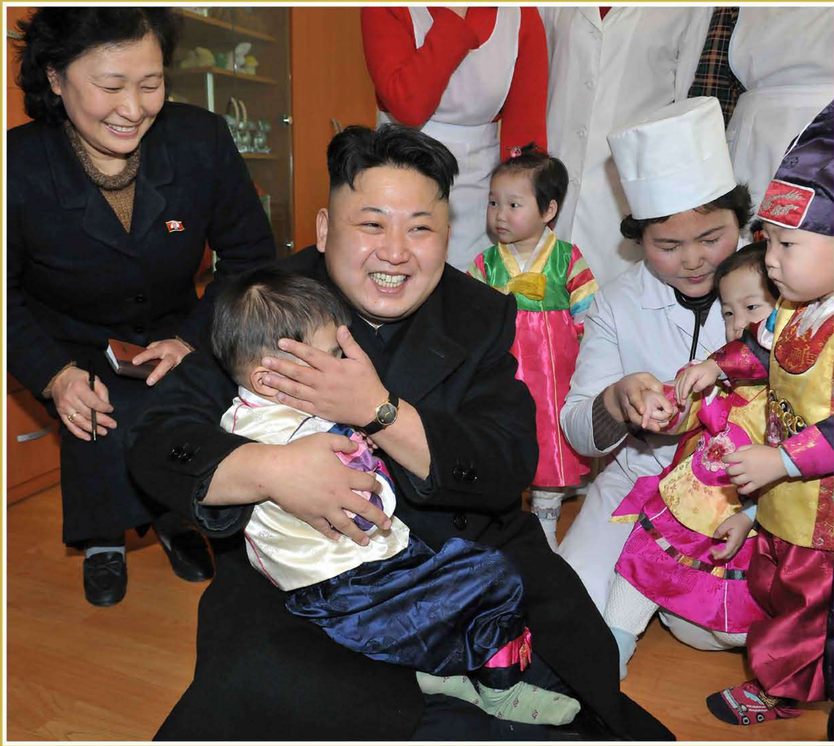
Kim Jong Un with the children at the Pyongyang Baby Home in February Juche 103 (2014)