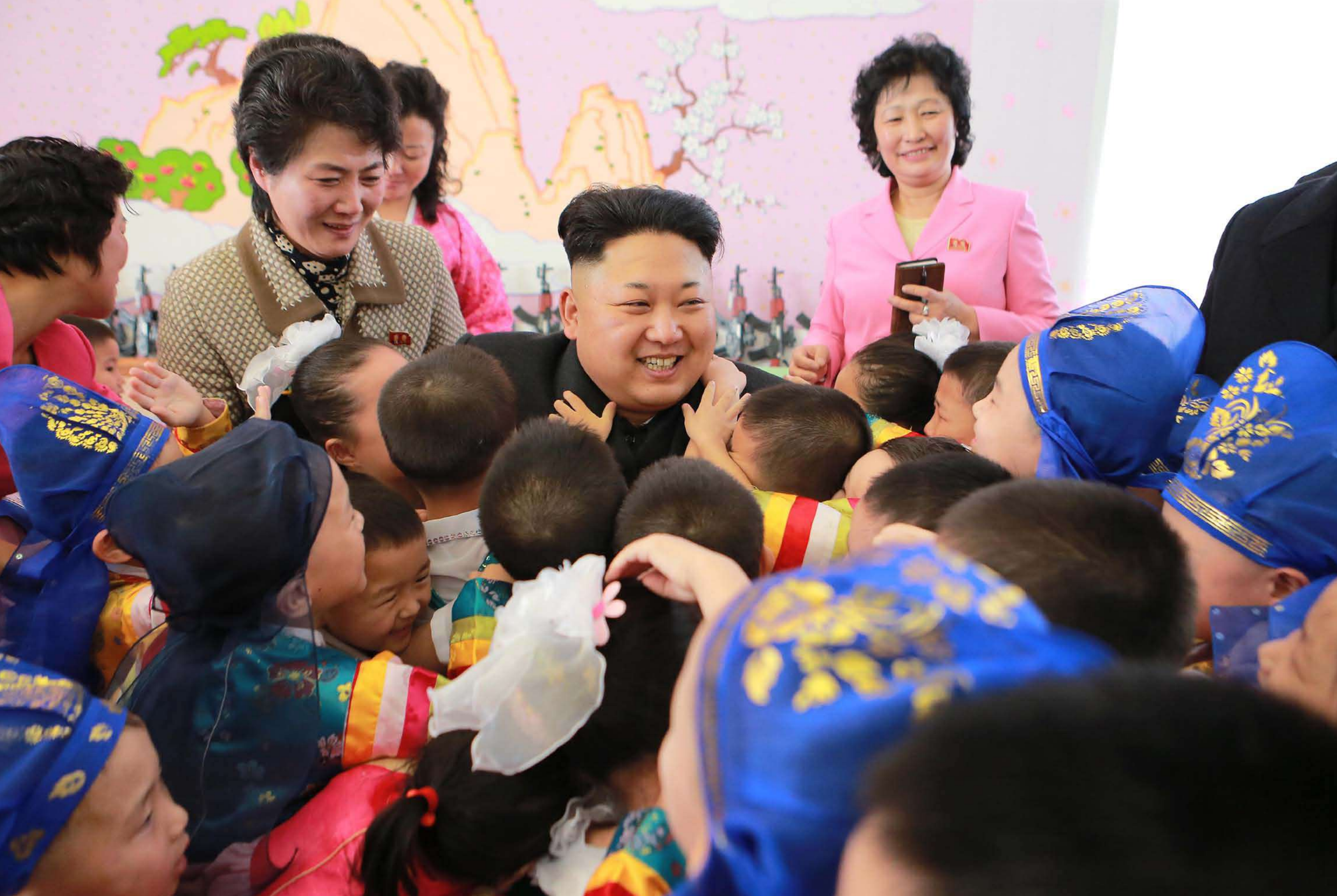
Kim Jong Un visiting the Pyongyang Baby Home and Pyongyang Orphanage to bless the orphans greeting the New Year in January Juche 104 (2015)