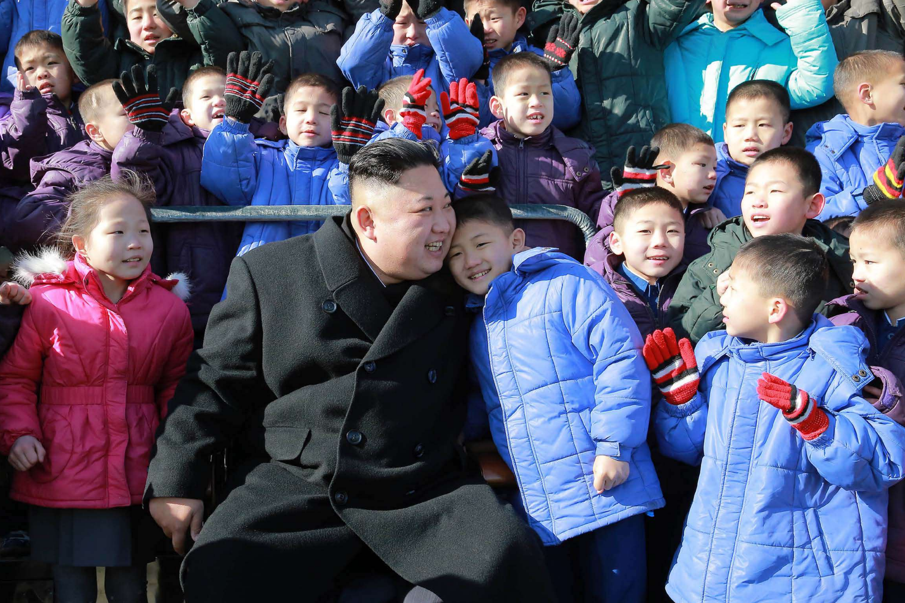
Kim Jong Un with the students of Pyongyang Primary School for Orphans in February Juche 106 (2017)