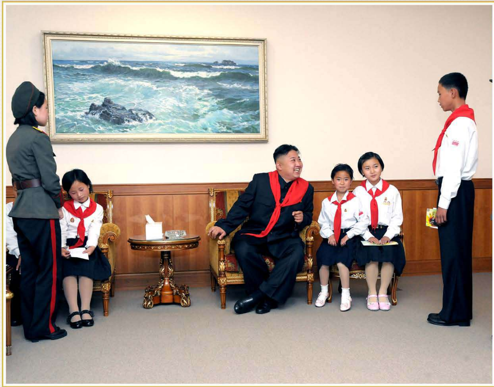
Kim Jong Un meeting delegates to the celebrations of the 66 th founding anniversary of the Korean Children's Union and blessing their future in June Juche 101 (2012)