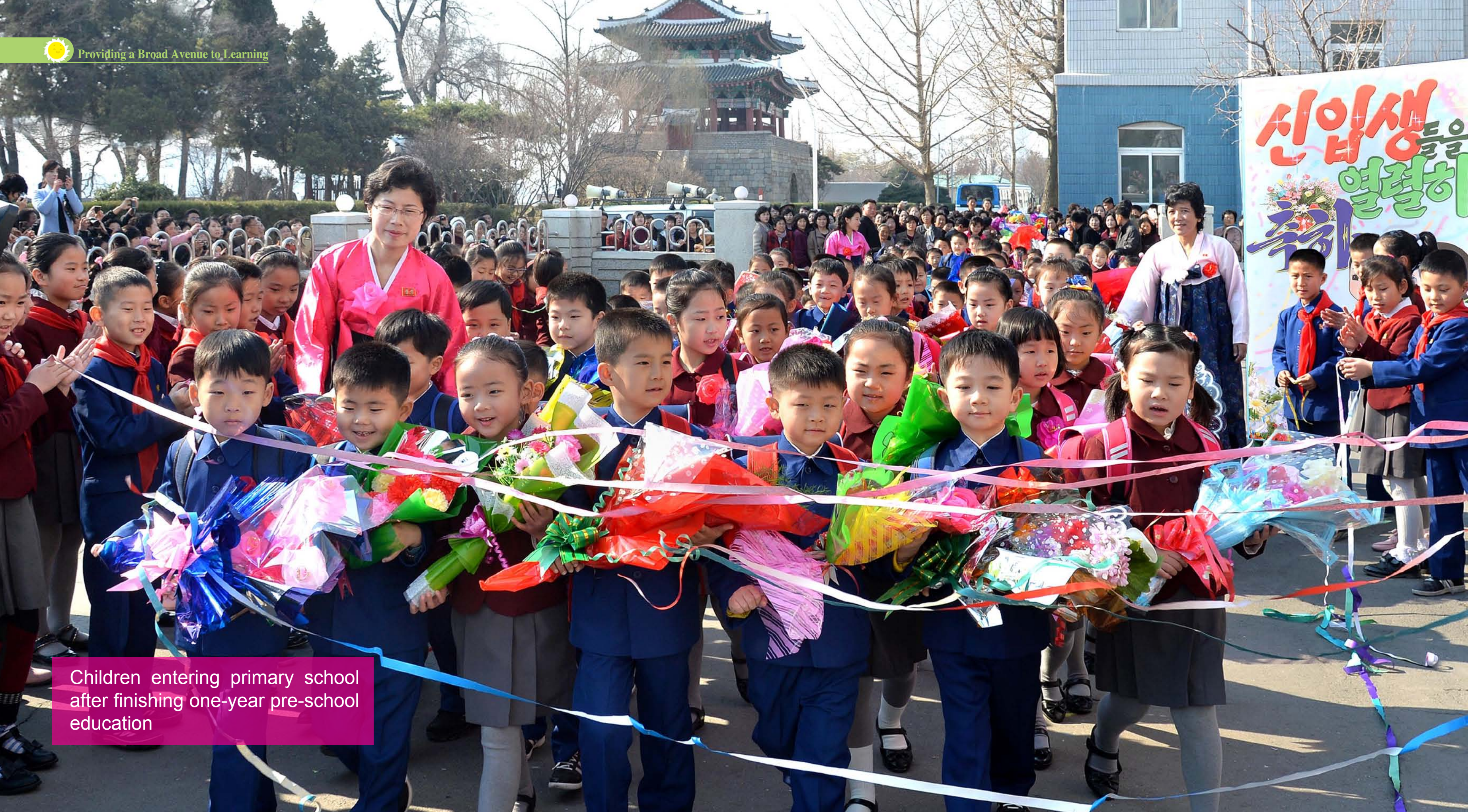
Children entering primary school after finishing one-year pre-school education