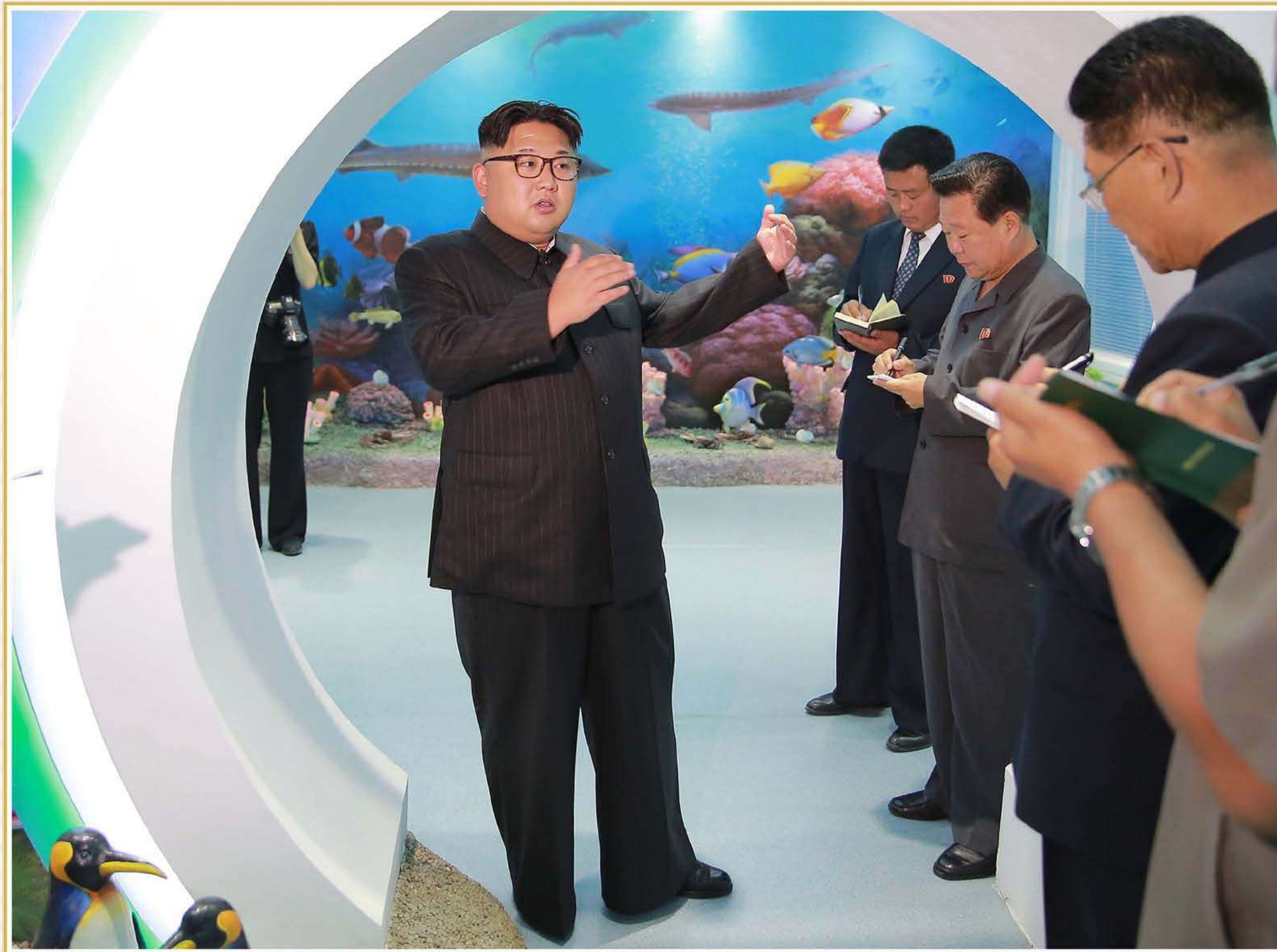
Kim Jong Un looking round the renovated Mangyongdae Children's Camp in June Juche 105 (2016)