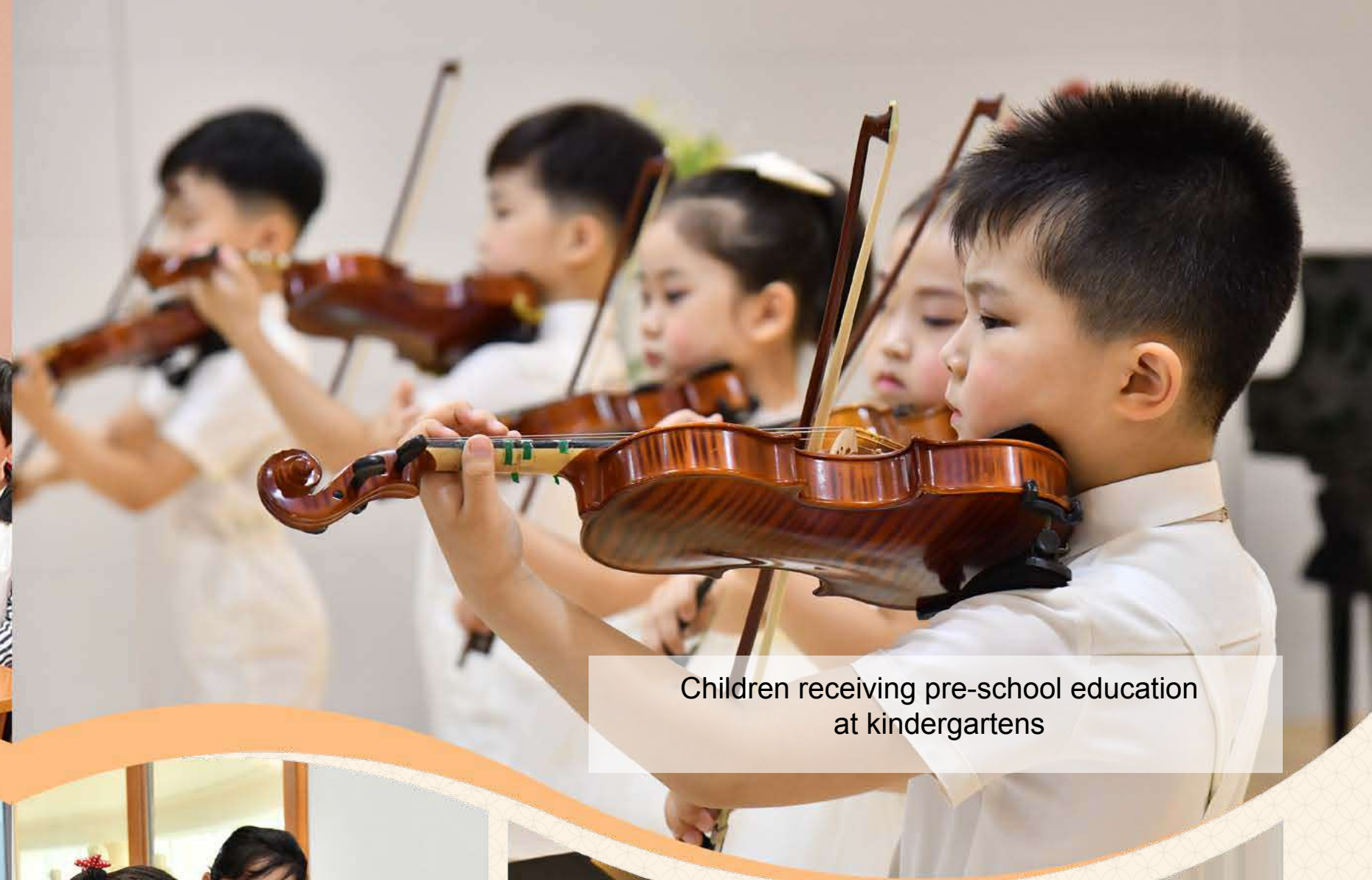
Children receiving pre-school education at kindergartens