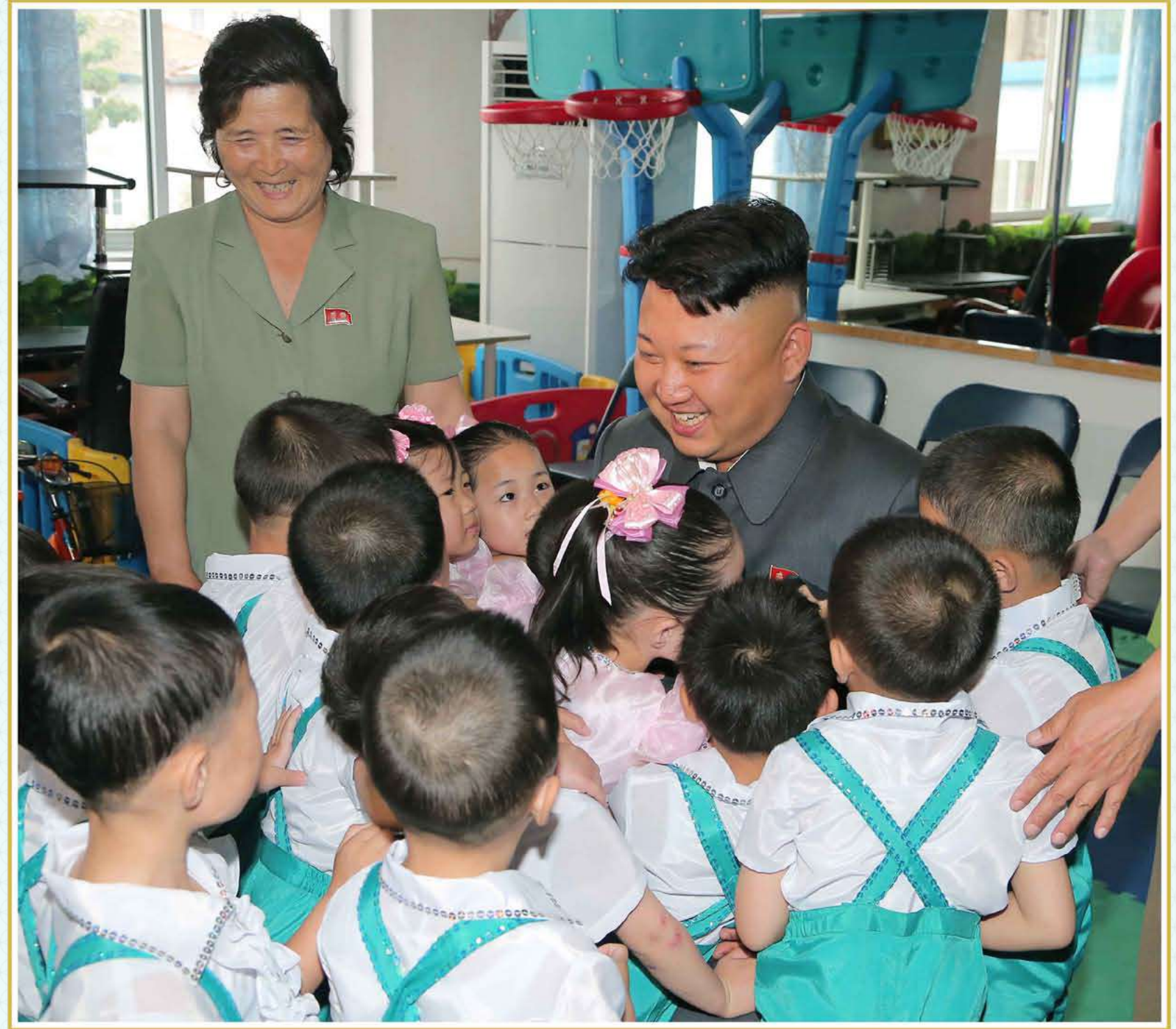
Kim Jong Un visiting the Pyongyang Orphanage to bless the children on International Children's Day in June Juche 103 (2014)