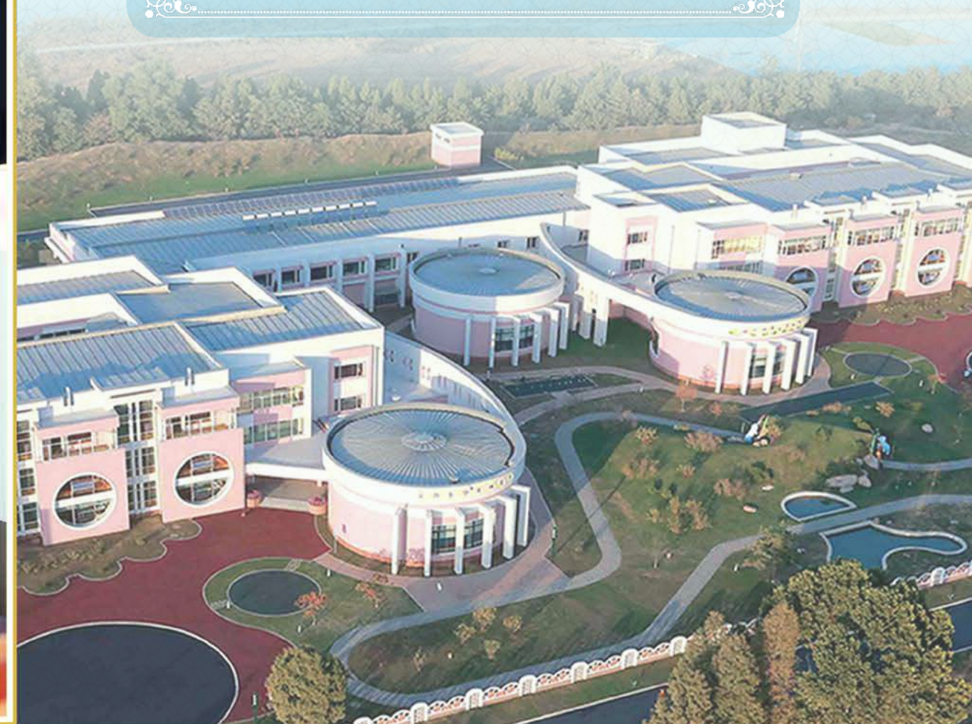
Kim Jong Un giving field guidance at the completed Pyongyang Baby Home and Orphanage in October Juche 103 (2014)

The orphans grow in good health in these palace-like homes which are permeated with Kim Jong Un's maternal love.