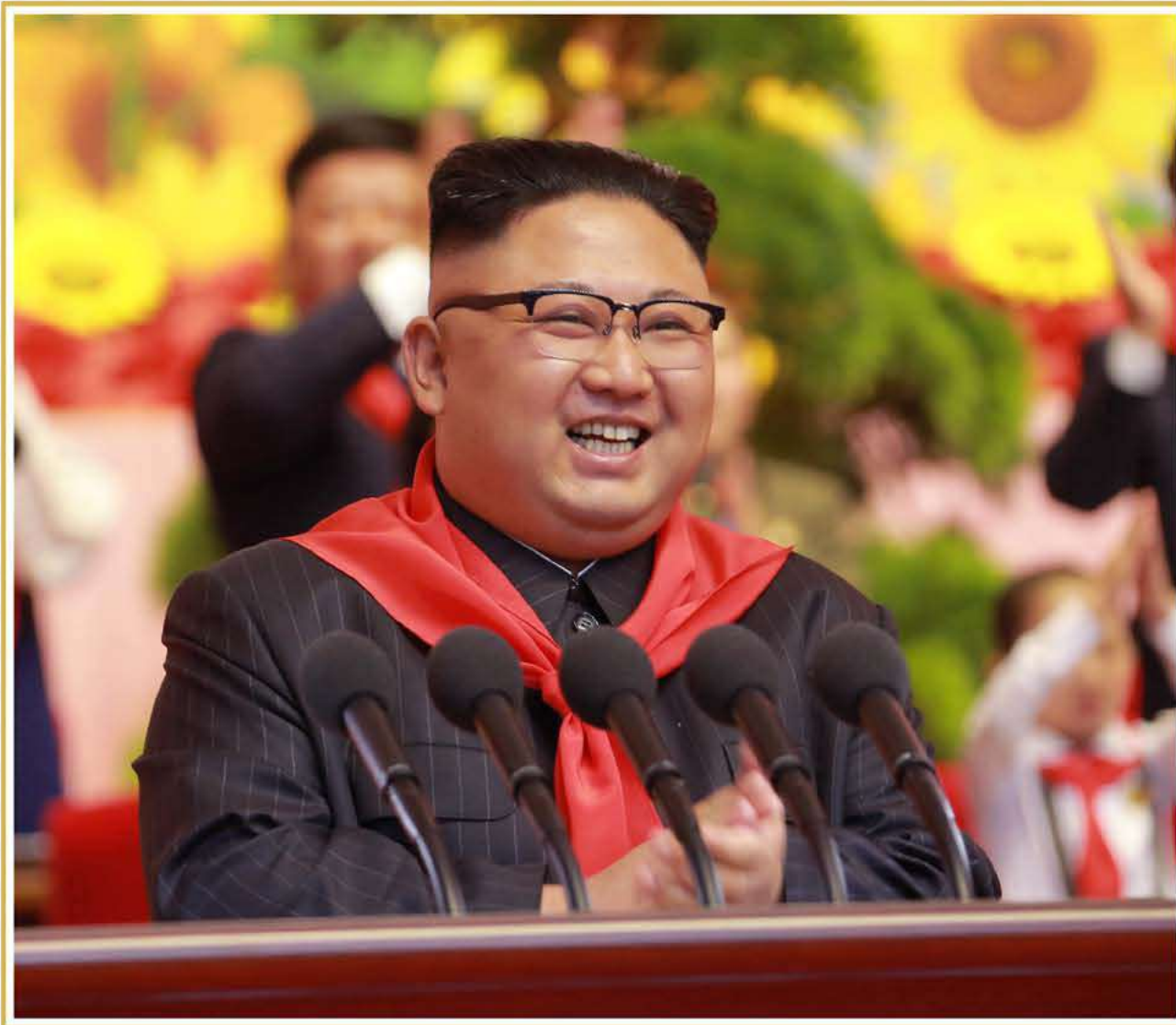
Kim Jong Un attending the Eighth Congress of the Korean Children's Union in June Juche 106 (2017)