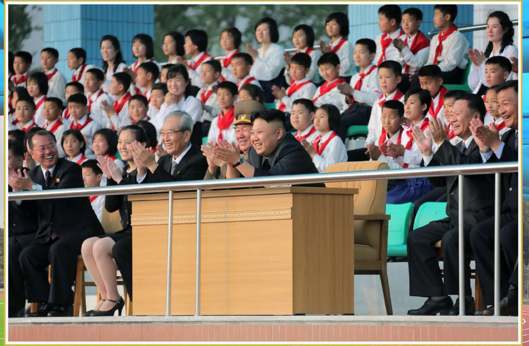
Kim Jong Un seeing with schoolchildren the final of the National Children's Soccer Games held in congratulation of the opening of the renovated Songdownon International Children's Camp in May Juche 103 (2014)