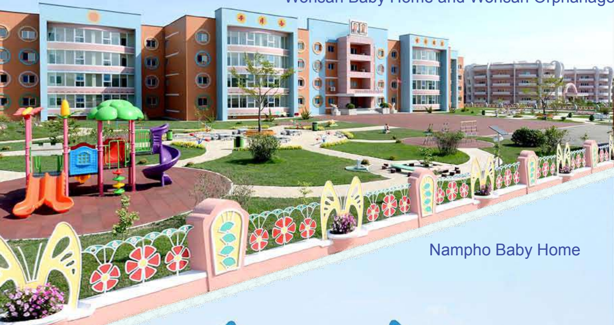
Nampho Baby Home