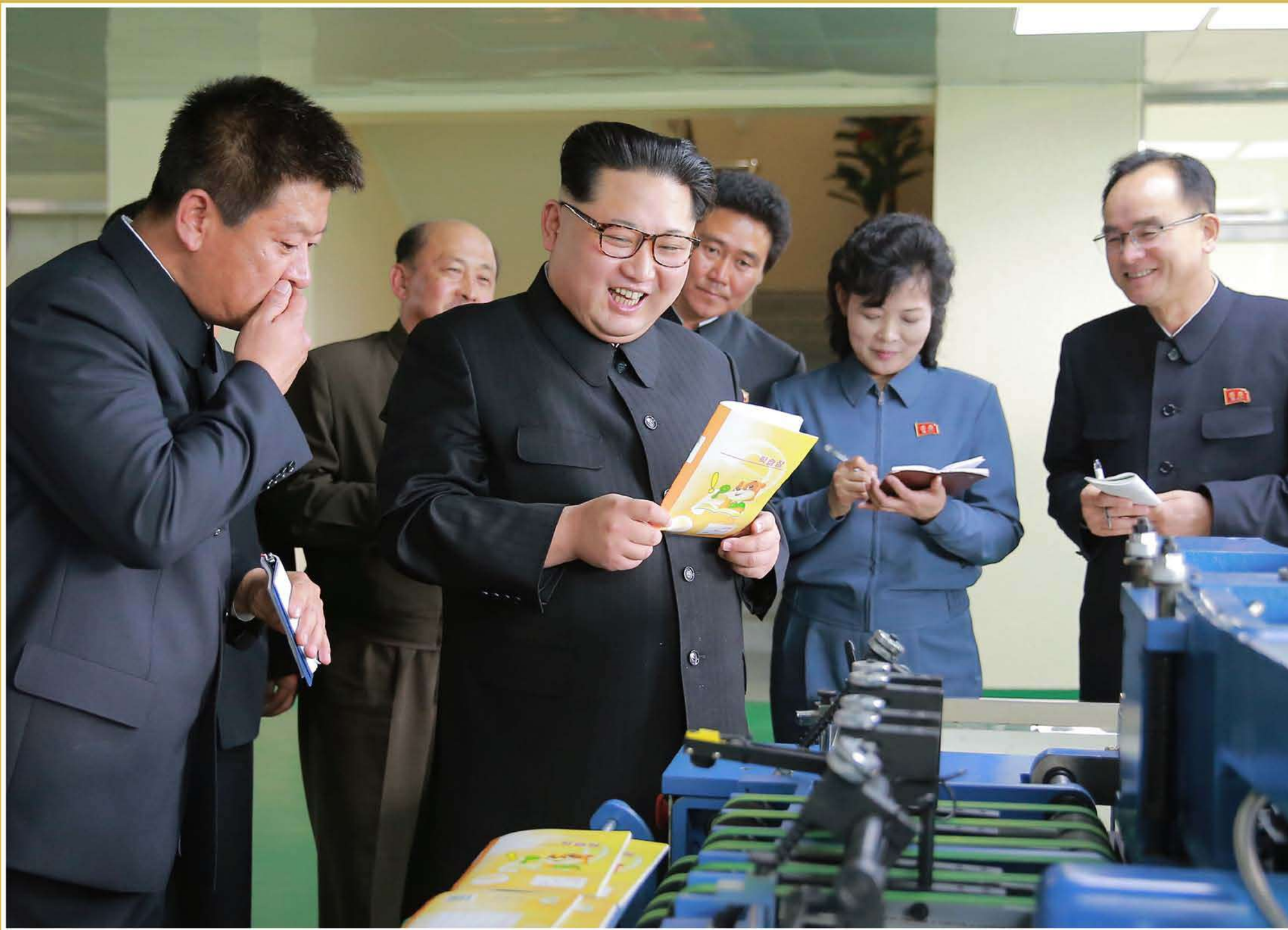
Kim Jong Un giving field guidance at the Mindulle Notebook Factory in April Juche 105 (2016)