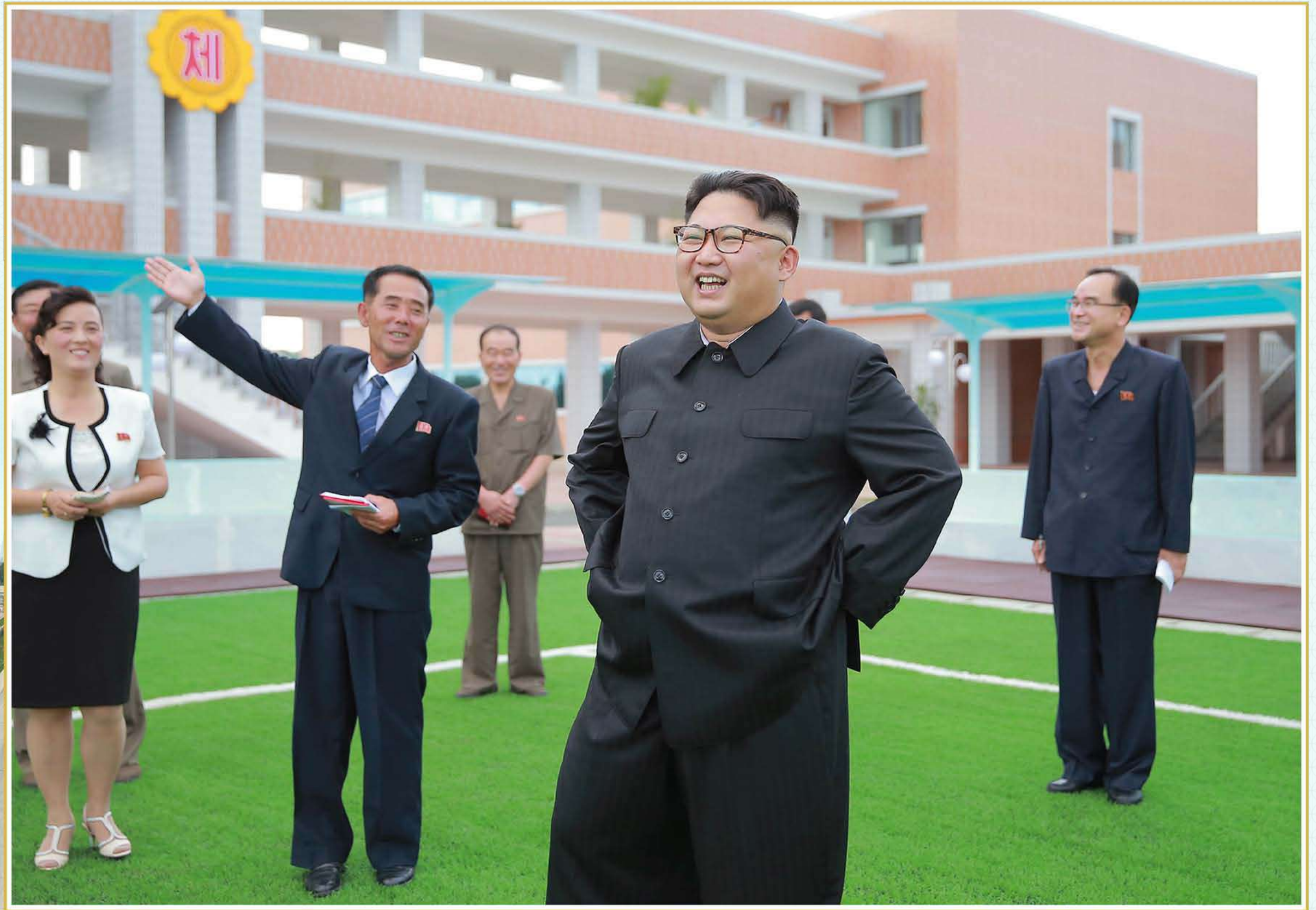
Kim Jong Un visiting the newly-built Pyongyang Middle School for Orphans in July Juche 105 (2016)