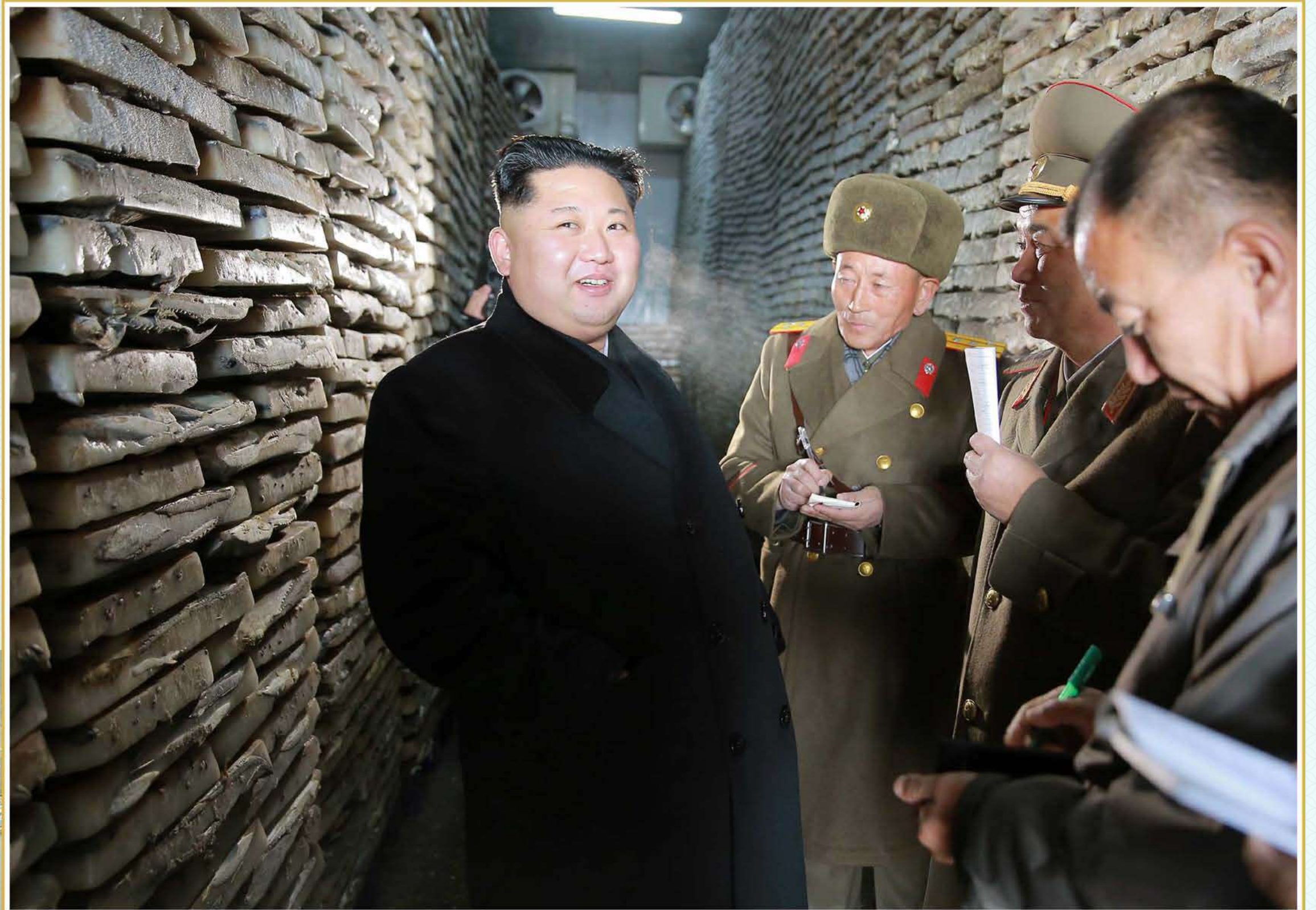
Kim Jong Un visiting the January 8 Fishery Station in November Juche 105 (2016)