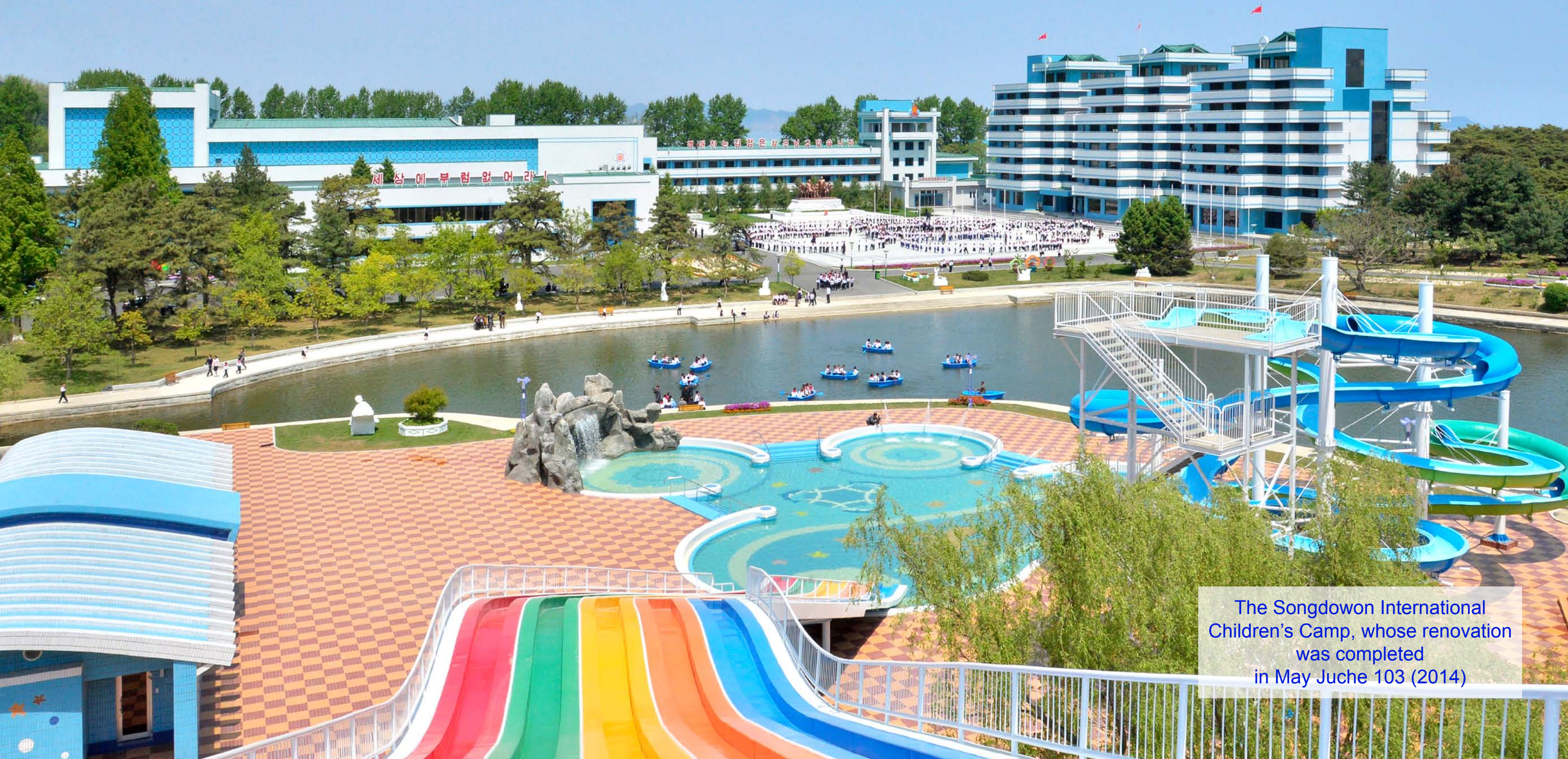
The Songdowon International Children's Camp, whose renovation was completed in May Juche 103 (2014)

To Provide Excellent Bases for Extracurricular Education