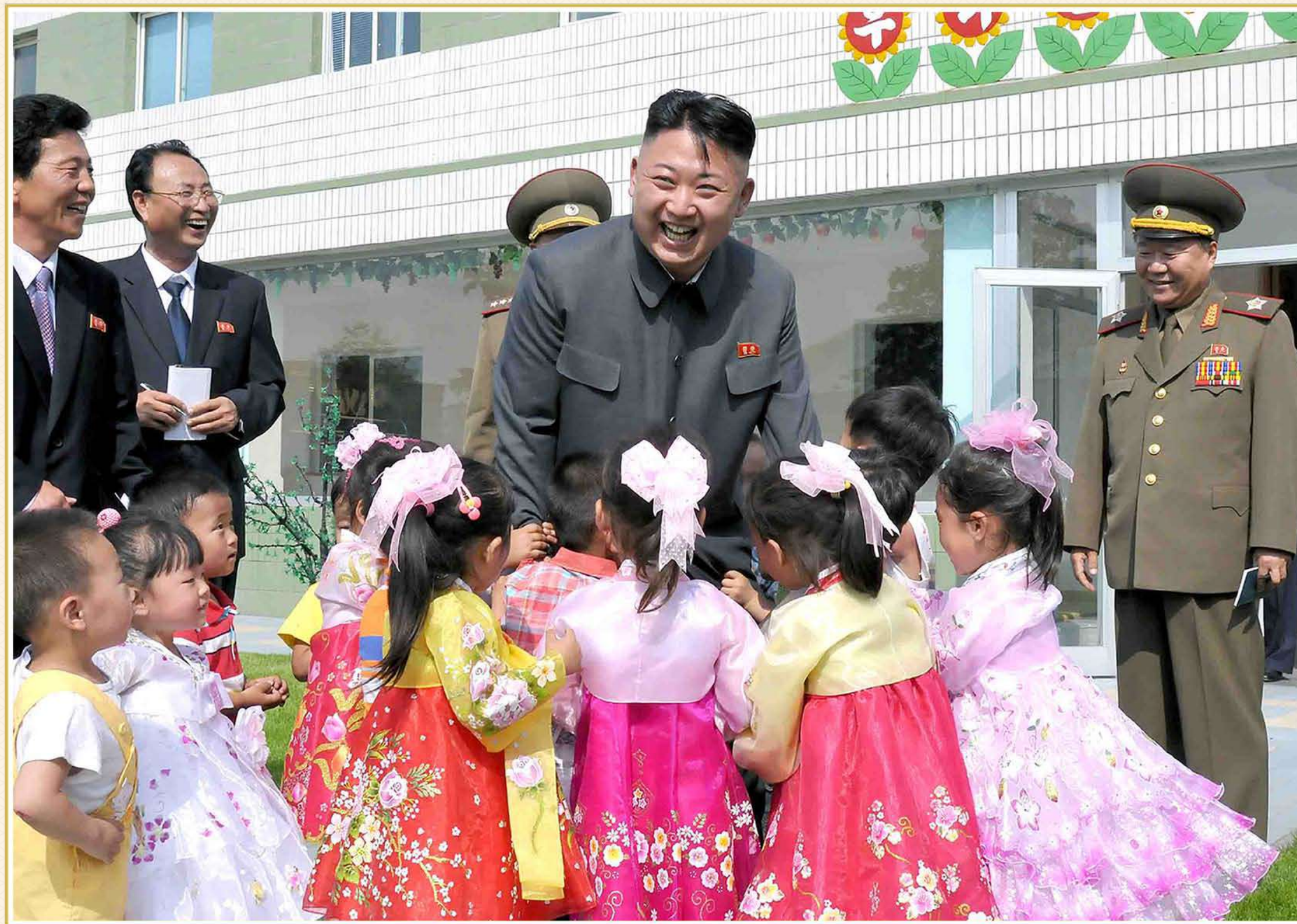
Kim Jong Un visiting the nursery of the Pyongyang Condiment Factory in June Juche 102 (2013)