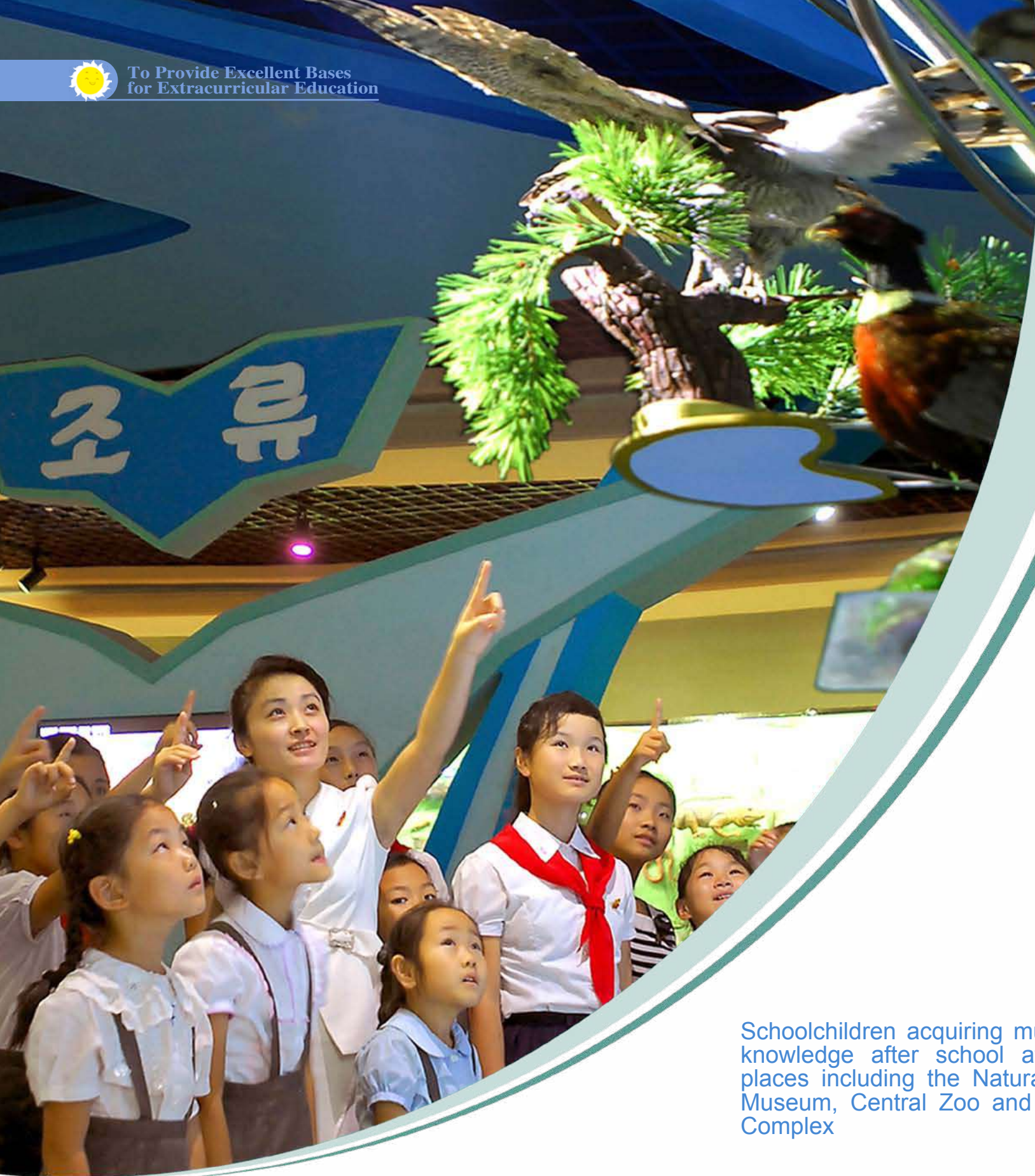
Schoolchildren acquiring multifarious knowledge after school at various places including the Natural History Museum, Central Zoo and Sci-Tech Complex