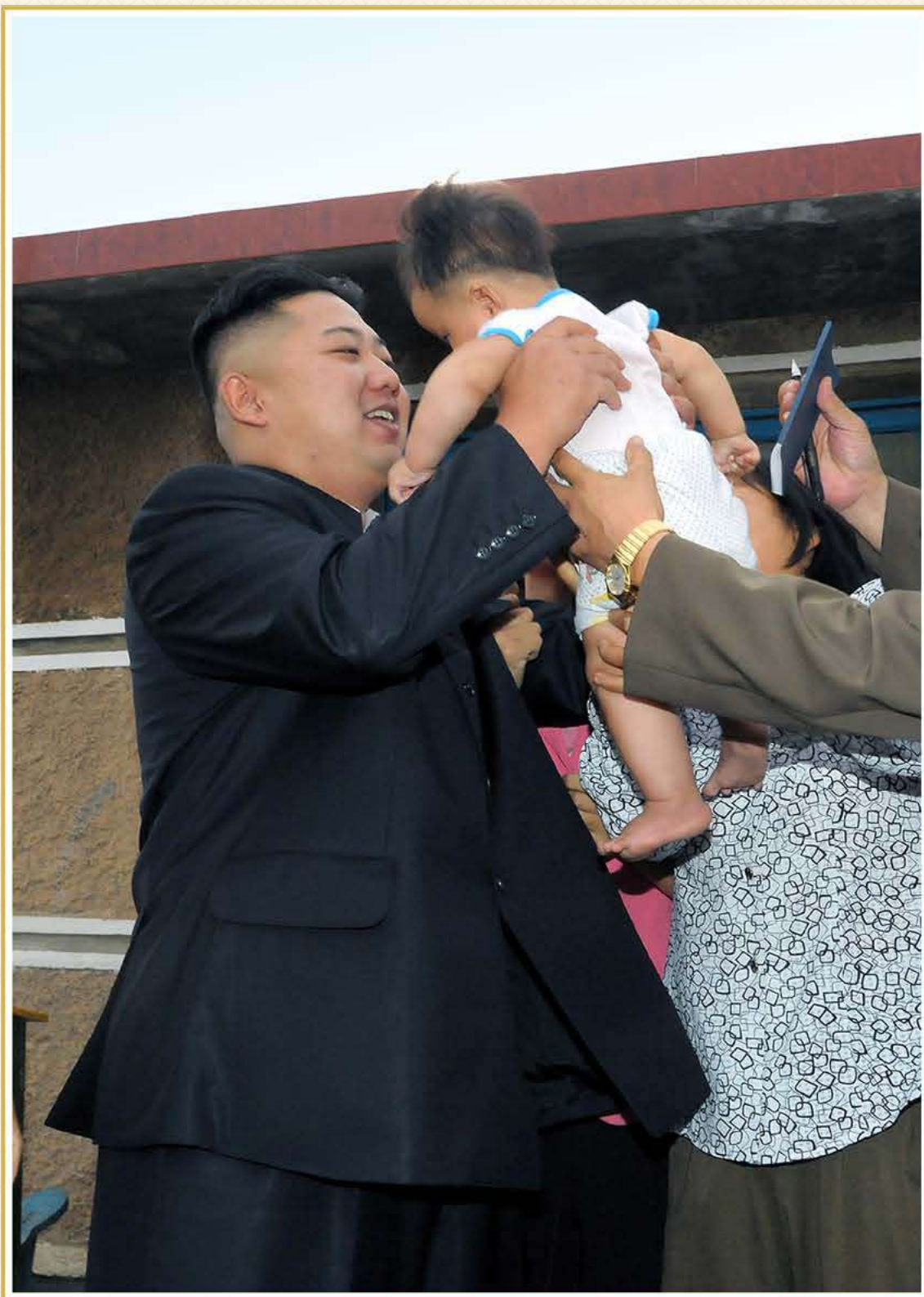
Kim Jong Un holding in his arms the son of a military officer during his inspection of an island-defending unit in August Juche 101 (2012)