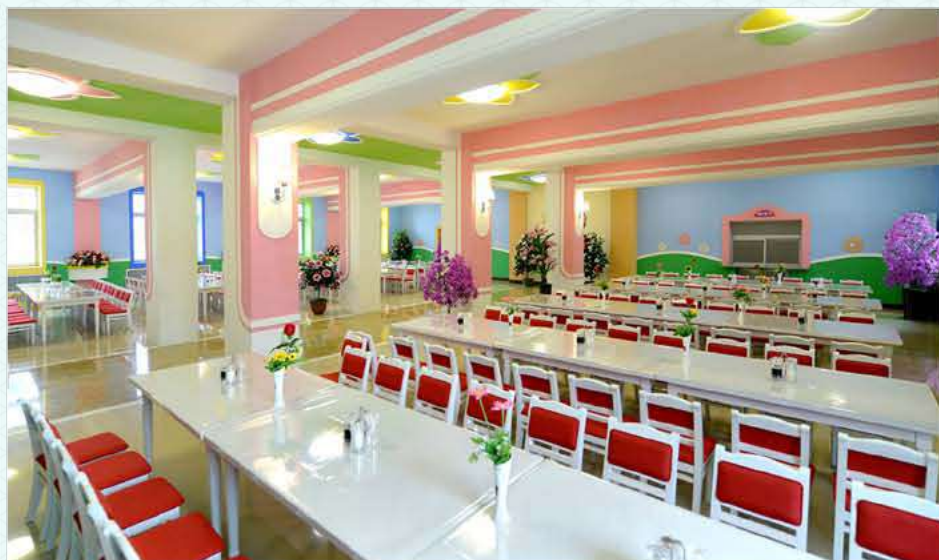
Pyongyang Primary School for Orphans