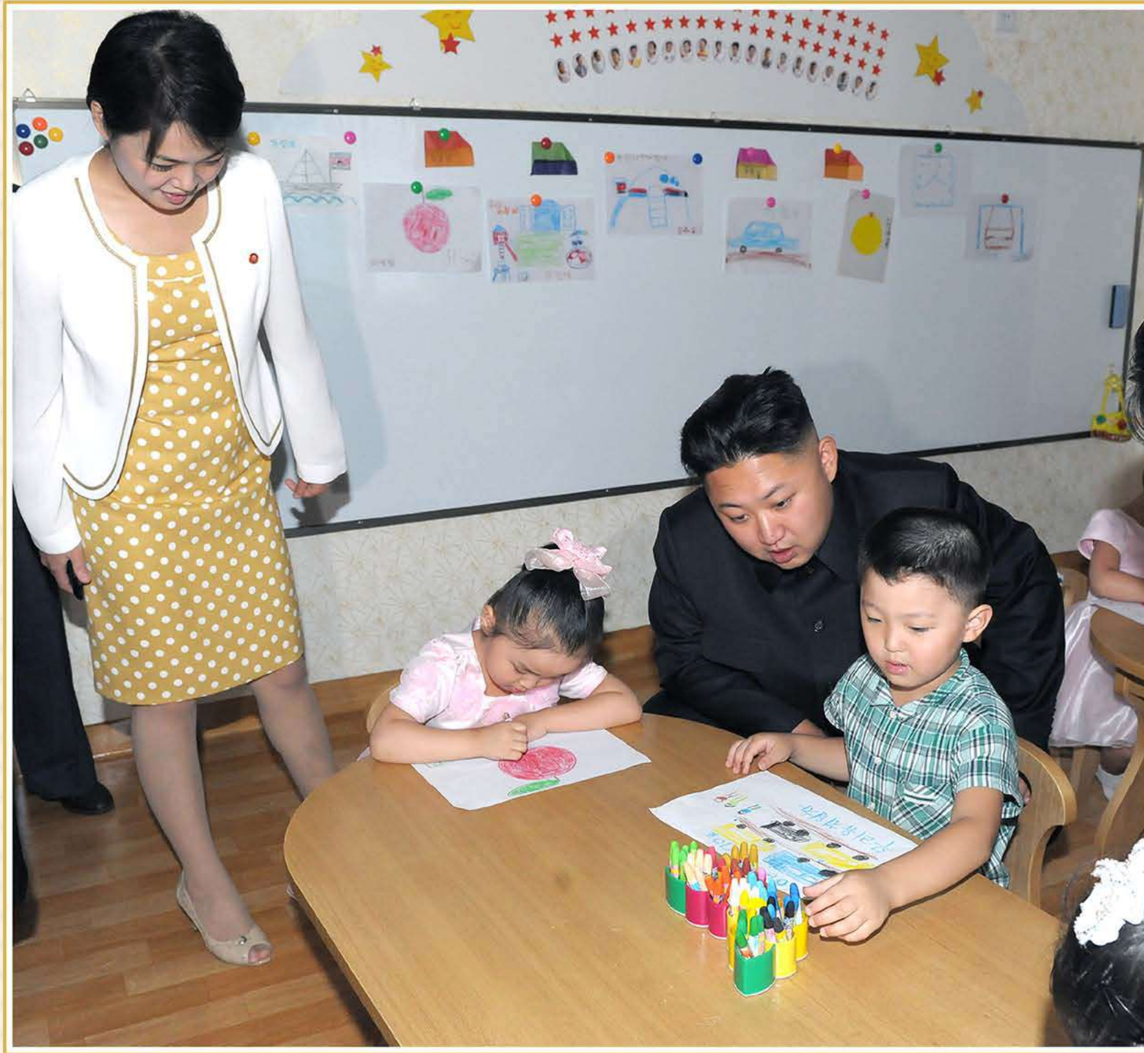
Kim Jong Un visiting Kyongsang Kindergarten in July Juche 101 (2012)