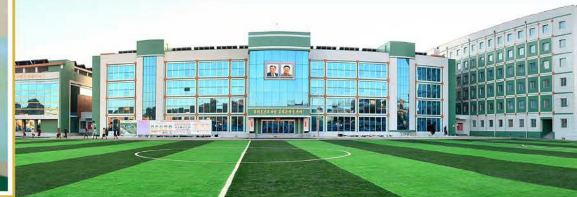
Kim Jong Un visiting renovated Pyongyang Teachers Training College in January Juche 107 (2018)

Kim Jong Un ensured that Pyongyang Teachers Training College, a “pedigree farm” for training teachers, was renovated. Visiting the renovated college, he said that pillars that could reliably shoulder the future of the country are produced from among the students taught by highly qualified teachers, stressing that the teaching staff of the college should devote pure conscience to their work.