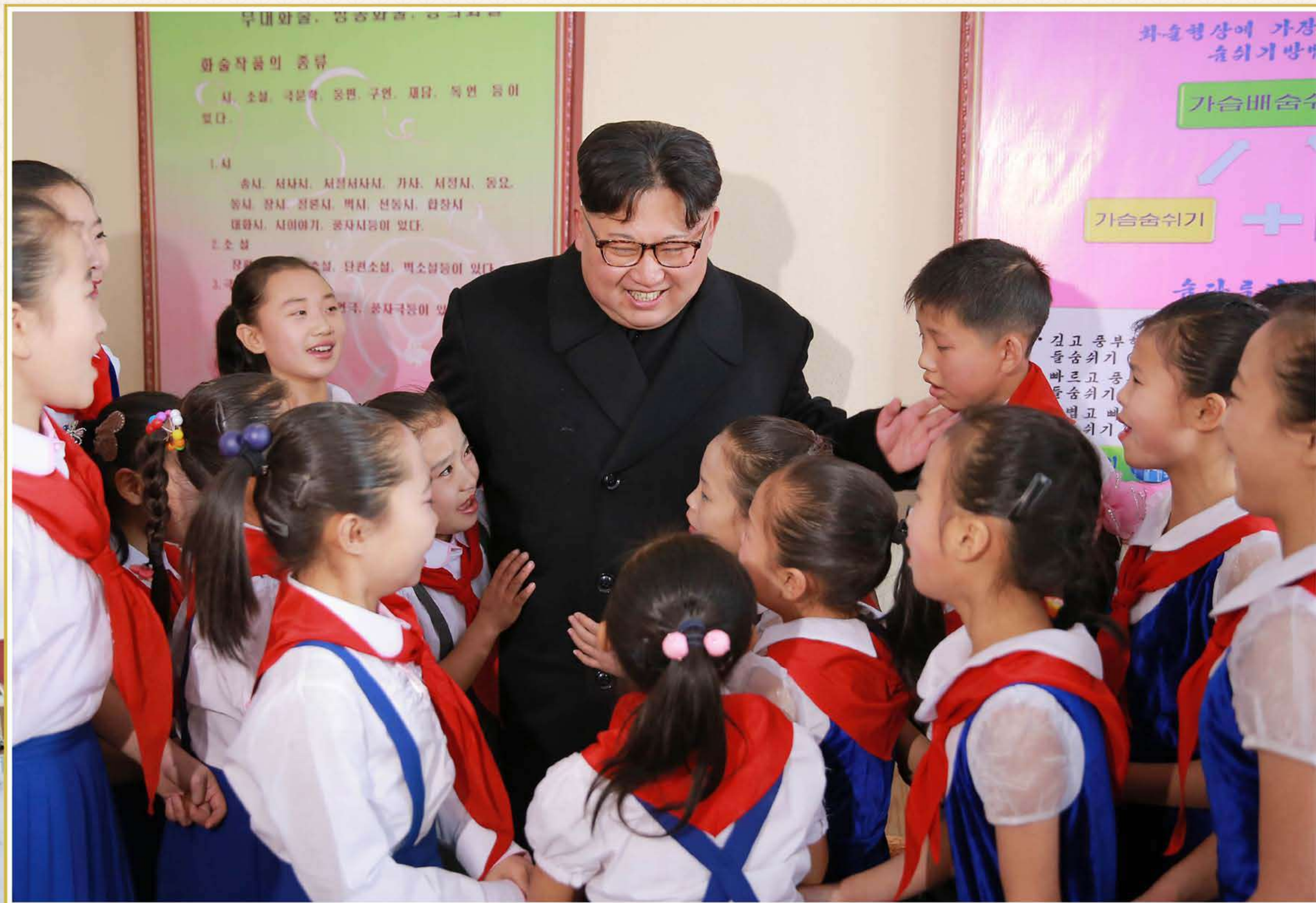
Kim Jong Un visiting the Samjiyon Schoolchildren's Palace in November Juche 105 (2016)