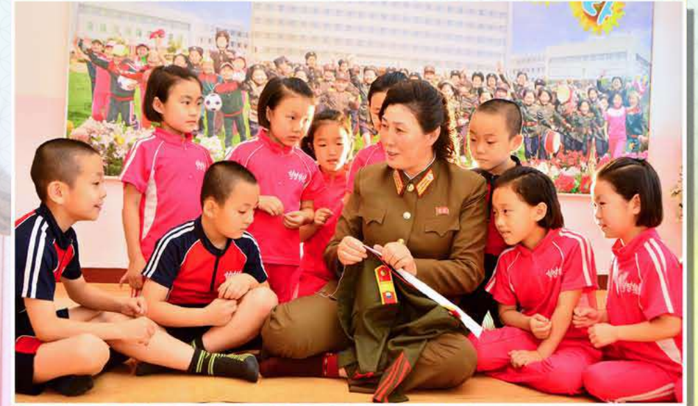
Students of Kang Pan Sok Revolutionary School