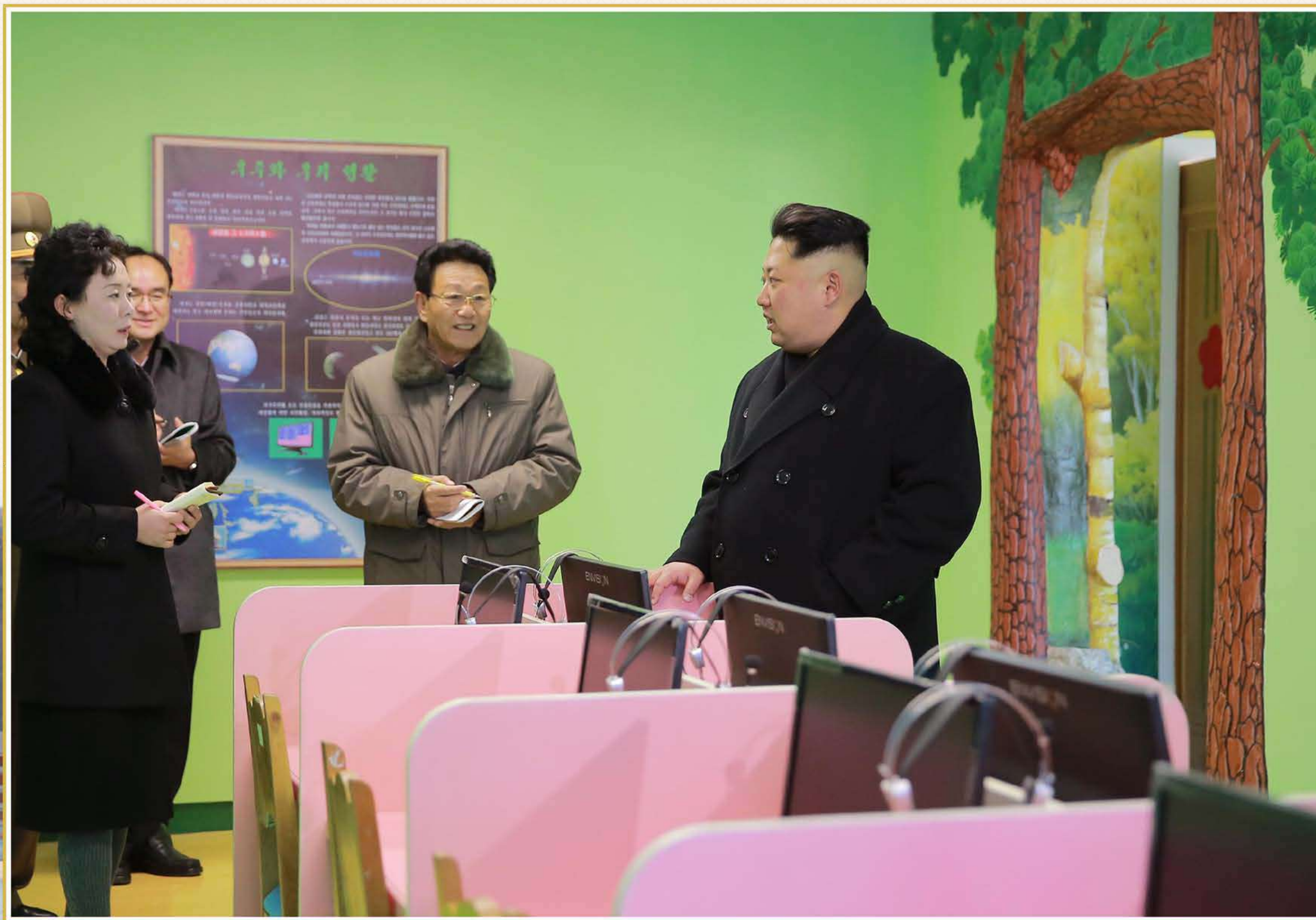
Kim Jong Un looking round the renovated December 6 Children's Camp in Kangwon Province in December Juche 105 (2016)