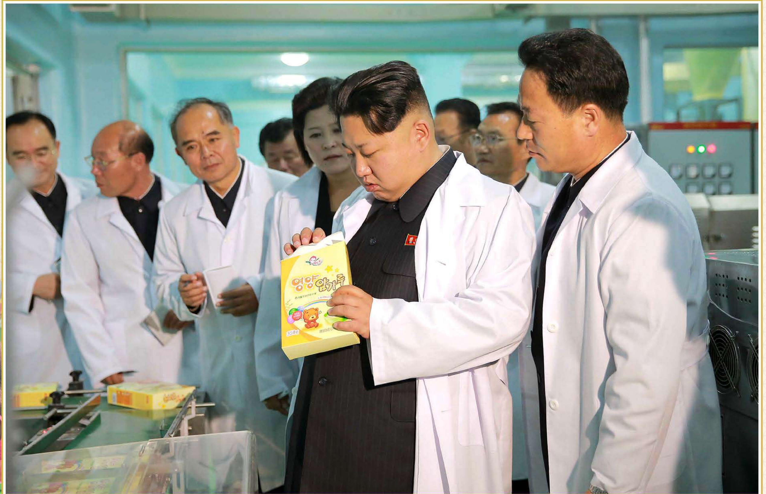
Kim Jong Un giving on-site guidance at the Pyongyang Children's Foodstuff Factory in November Juche 104 (2015)