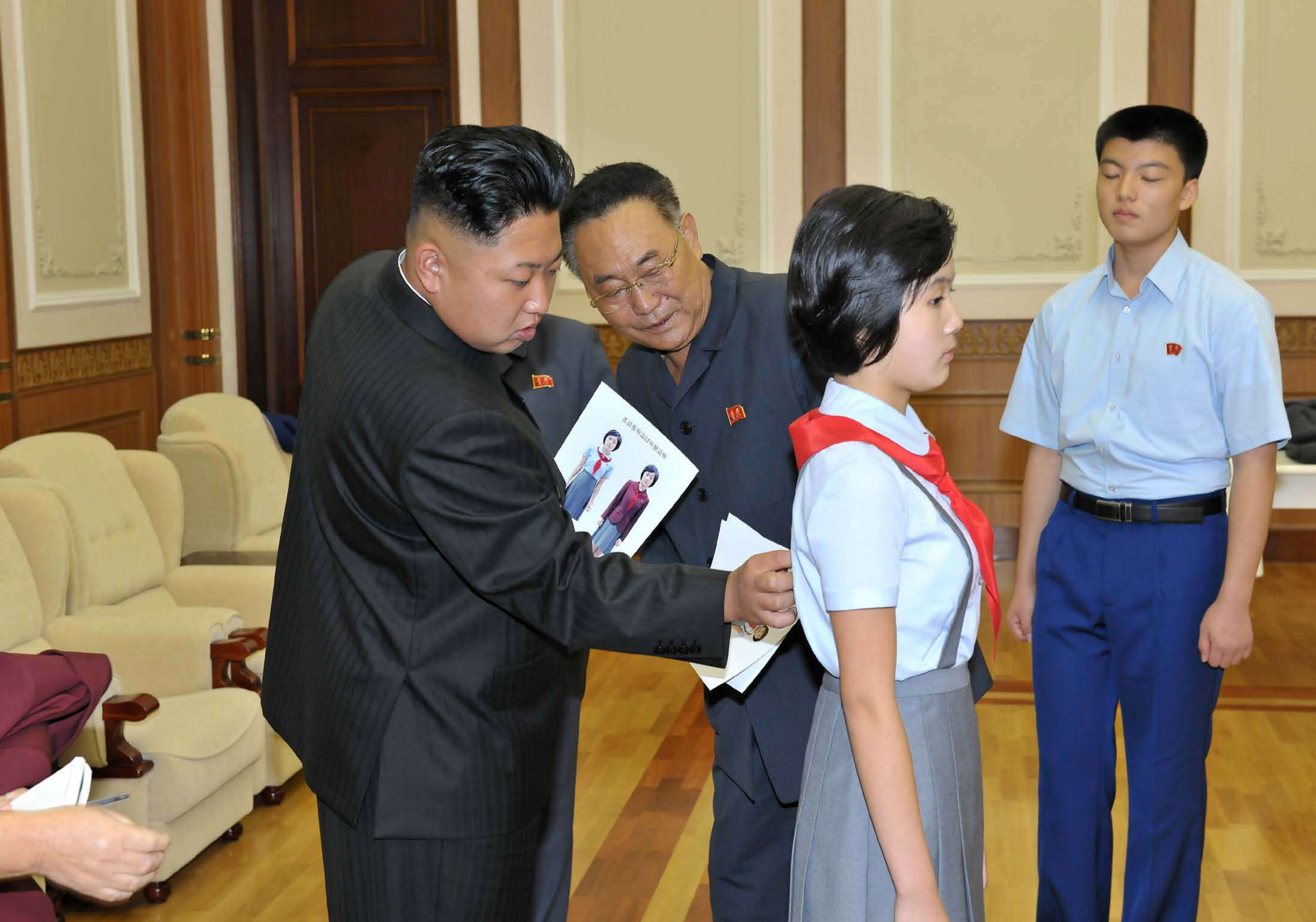
Kim Jong Un seeing sample school uniforms in September Juche 102 (2013)