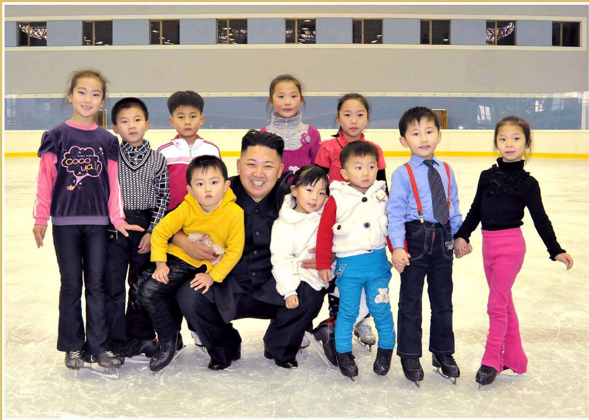
Kim Jong Un among children in November Juche 101 (2012)