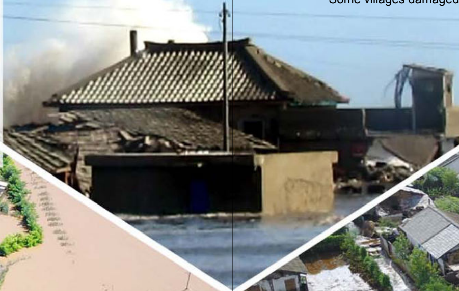
Some villages damaged by typhoons

Flooding and typhoons which hit the country in succession damaged dams, railways and railway bridges, farmland, roads, waterways, irrigation structures and rivers.