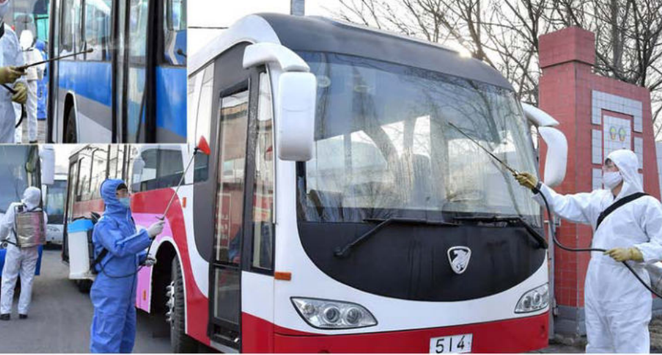
Intense pandemic prevention work