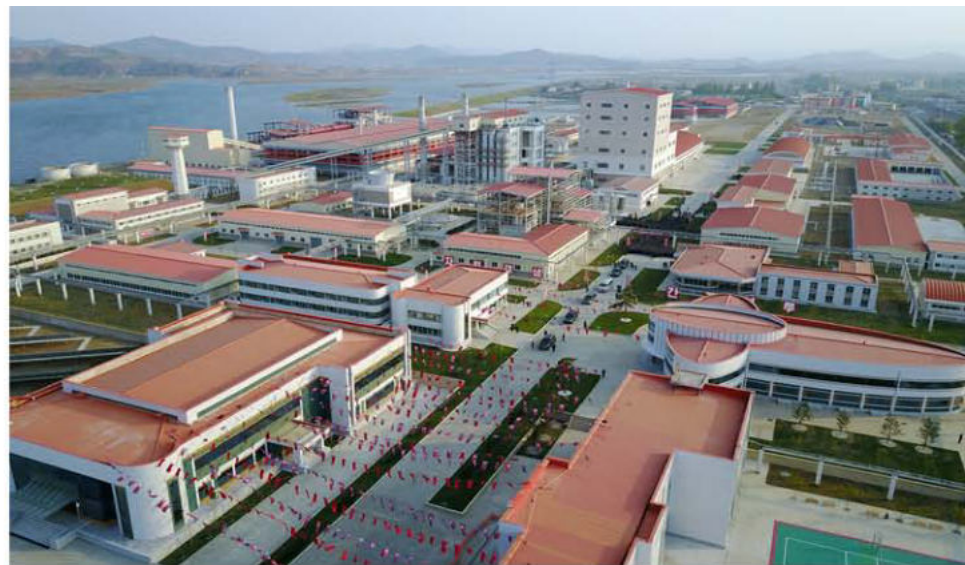
Sunchon Phosphate Fertilizer Factory

The completion of the Sunchon Phosphate Fertilizer Factory was the first success achieved on the economic front after the Fifth Plenary Meeting of the Seventh WPK Central Committee and served as an important occasion in bringing about a leap forward in the chemical industry.