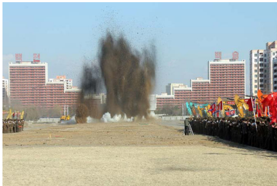
Ground-breaking ceremony of the Pyongyang General Hospital

Meanwhile, a chicken farm which would greatly contribute to