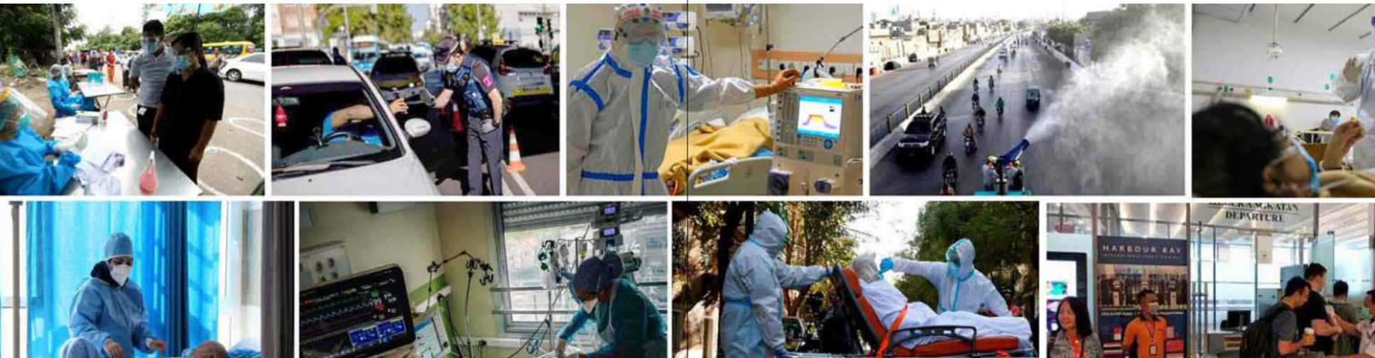
Global COVID-19 situation

grew with each passing day, threatening the people's lives.