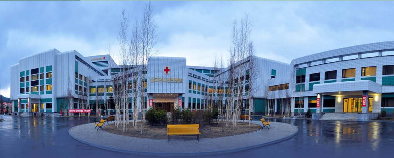
Renovated Samjiyon City People's Hospital