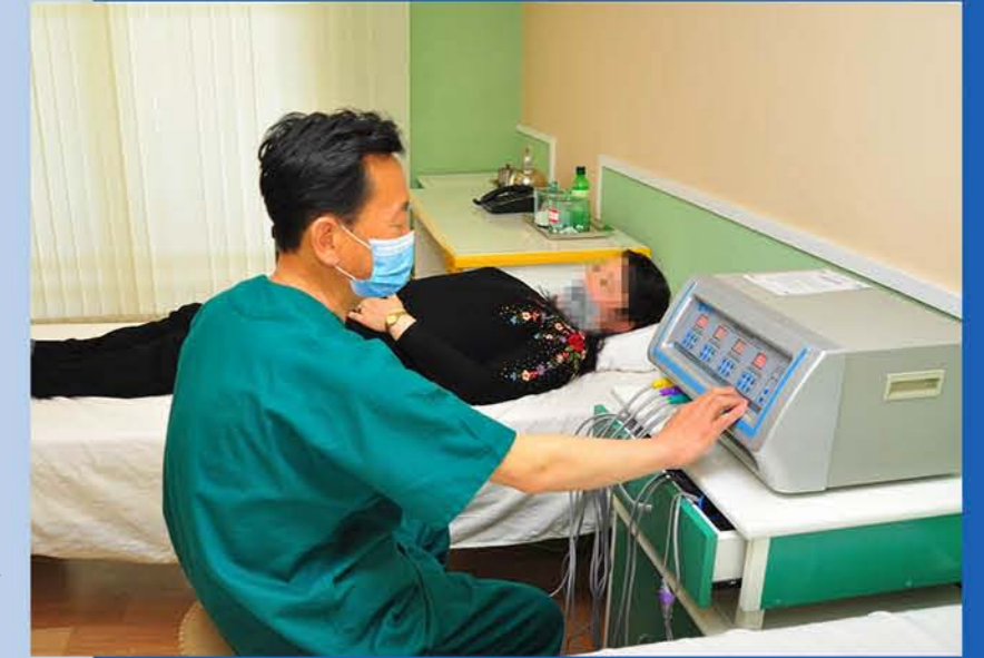
Physical Therapy Room