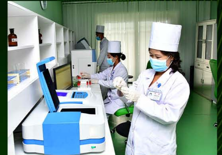
Blood Biochemistry Laboratory