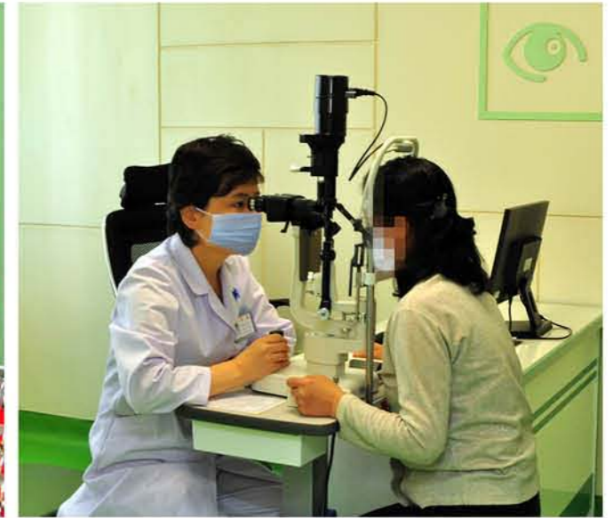
Ophthalmic Diagnosis Room