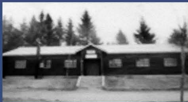
Hospital building built in 1961