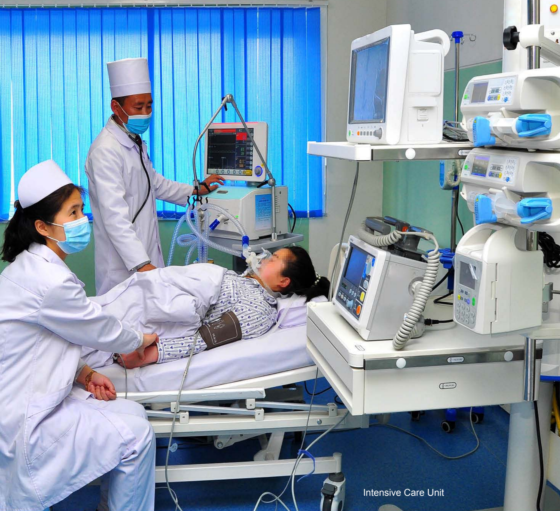
Intensive Care Unit