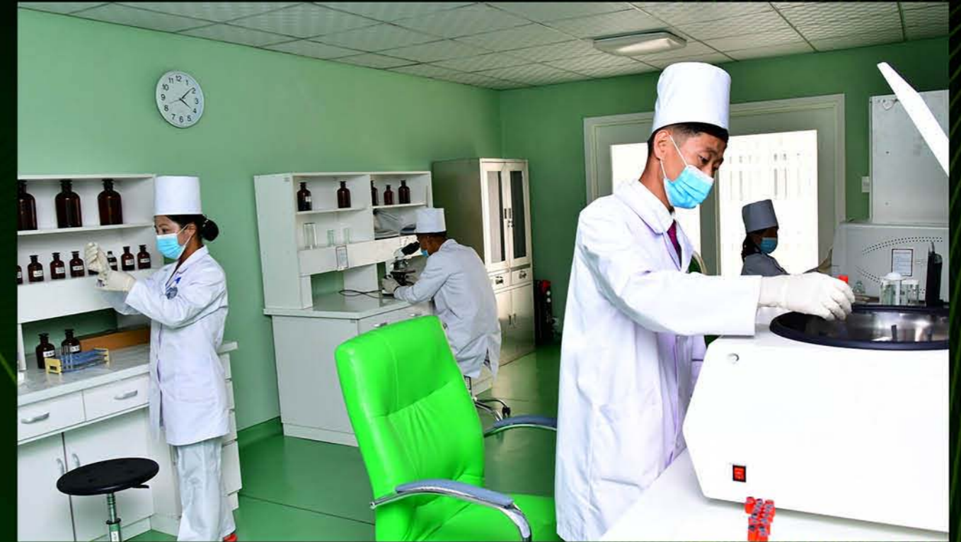
Urine Test Room