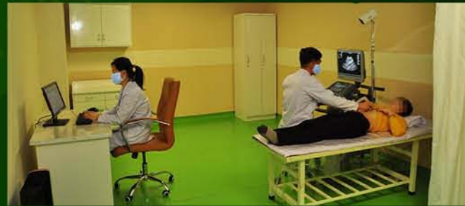
Abdominal Ultrasonography Room