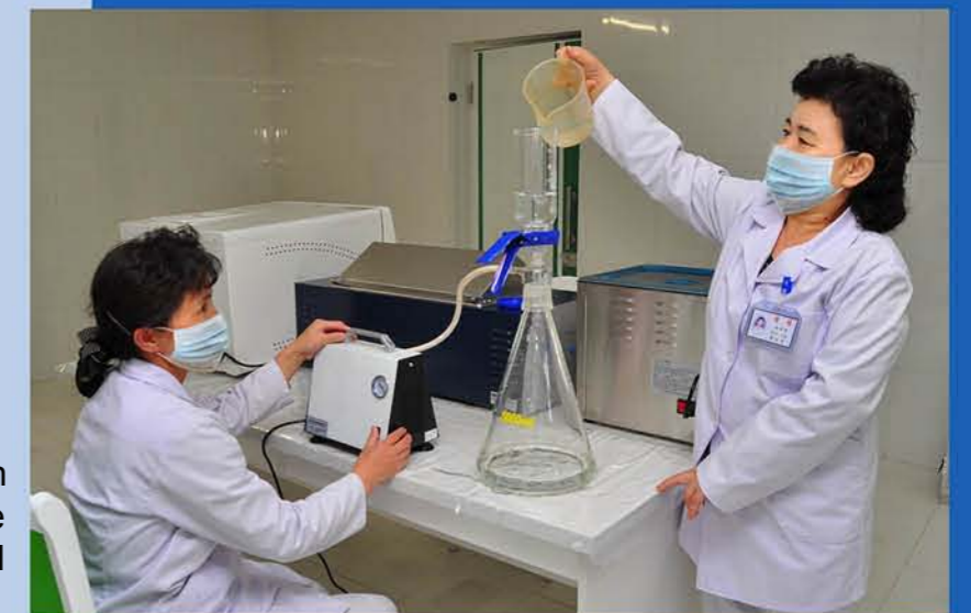
Room for Preparation of Medicine for External Application