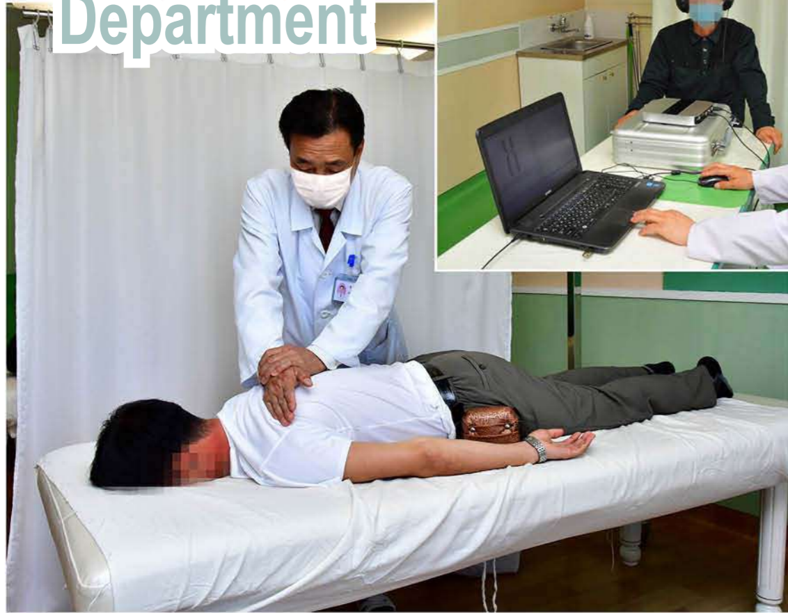
Hand Massage Room