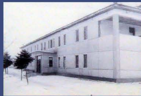
Samjiyon County People's Hospital built as a general hospital in 1975