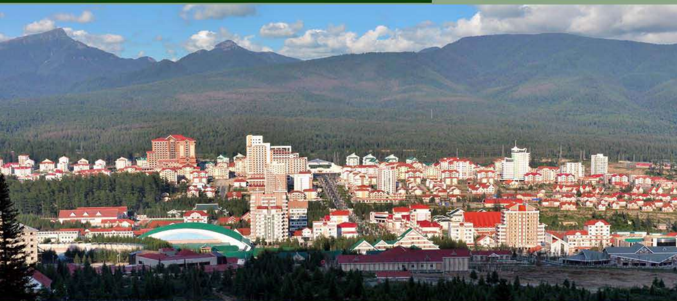
Part of the city of Samjiyon

The city under Paektu, the sacred mountain of the Korean revolution, is a historic place, which bears the imprints of the revolutionary struggle waged by President Kim Il Sung in the first half of the last century to liberate his country from the Japanese military occupation and where Chairman Kim Jong Il was born.