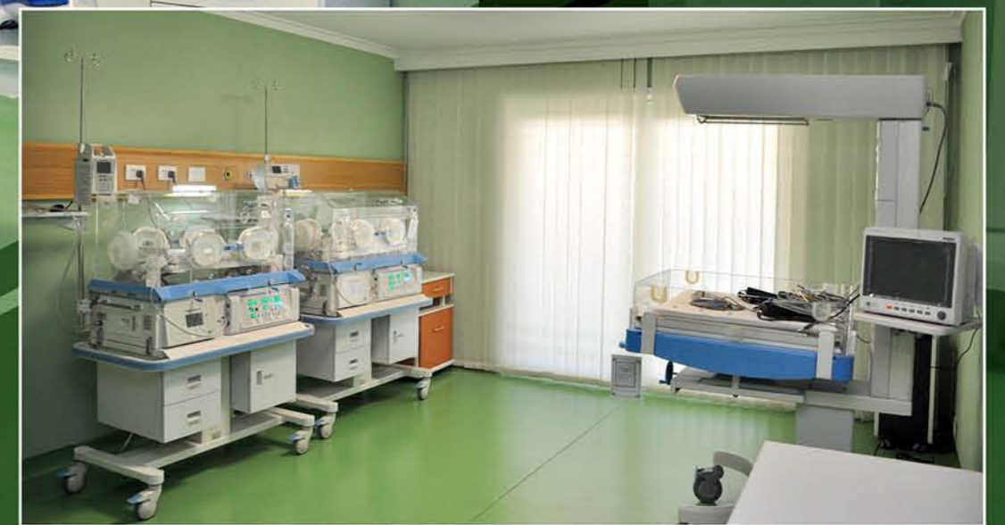
Baby Observation Room