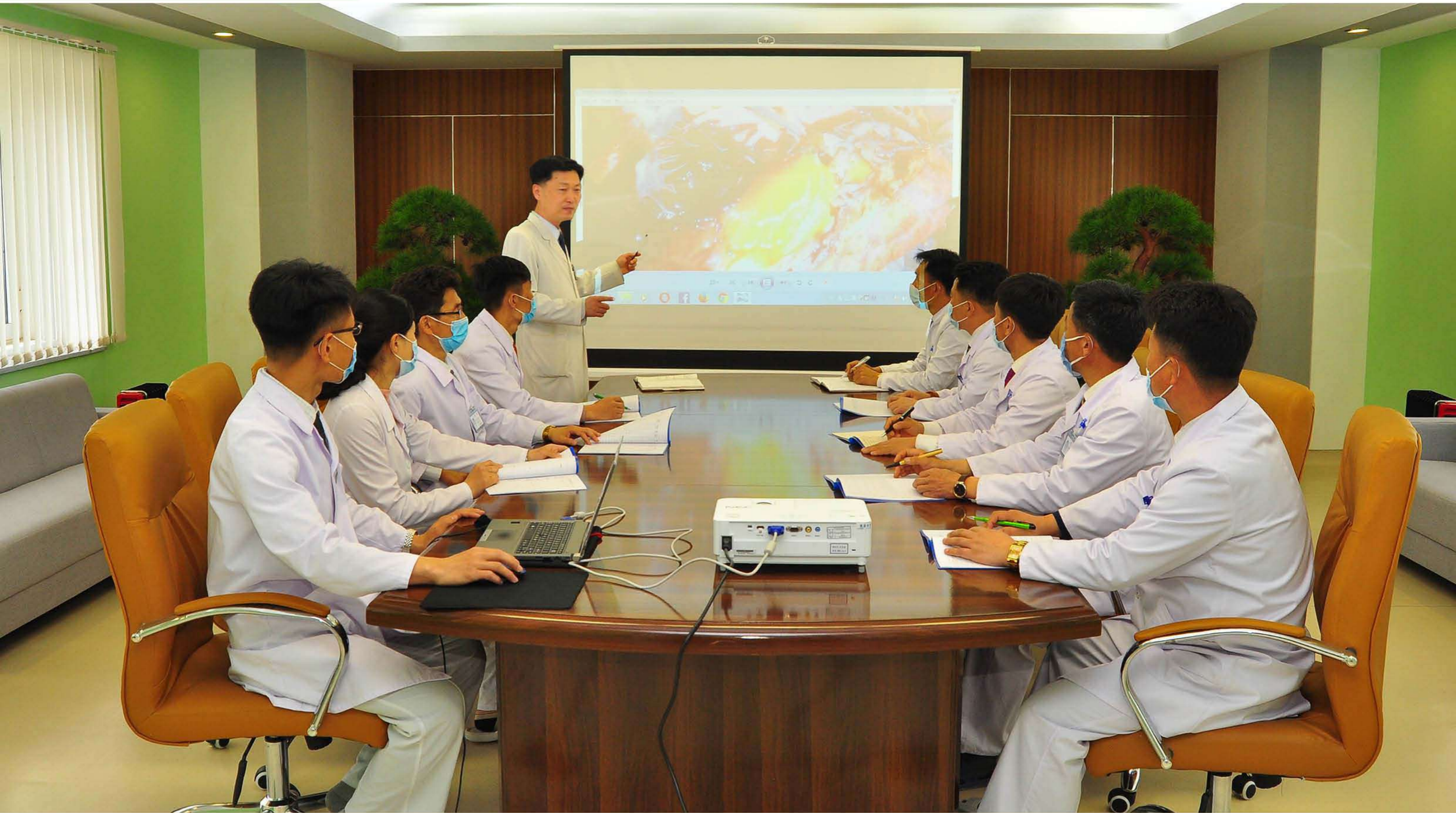
Doctors in consultation