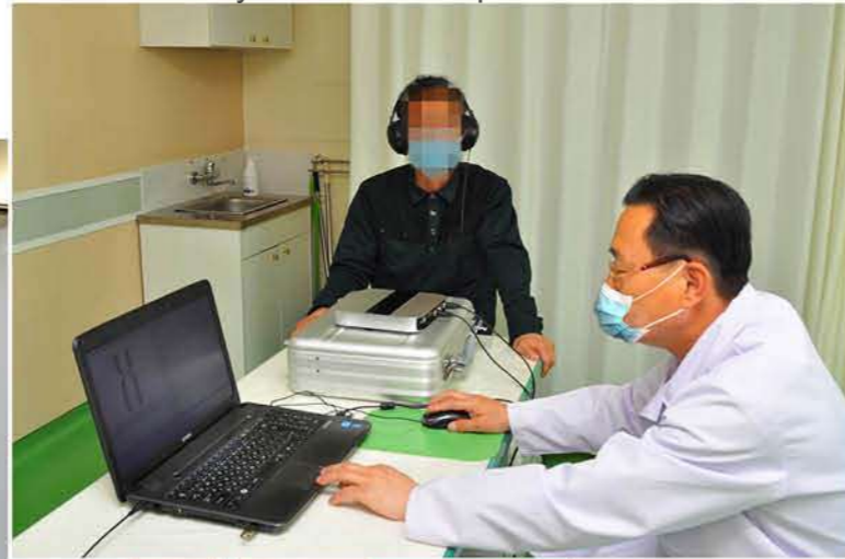
Traditional Koryo Medicine Department