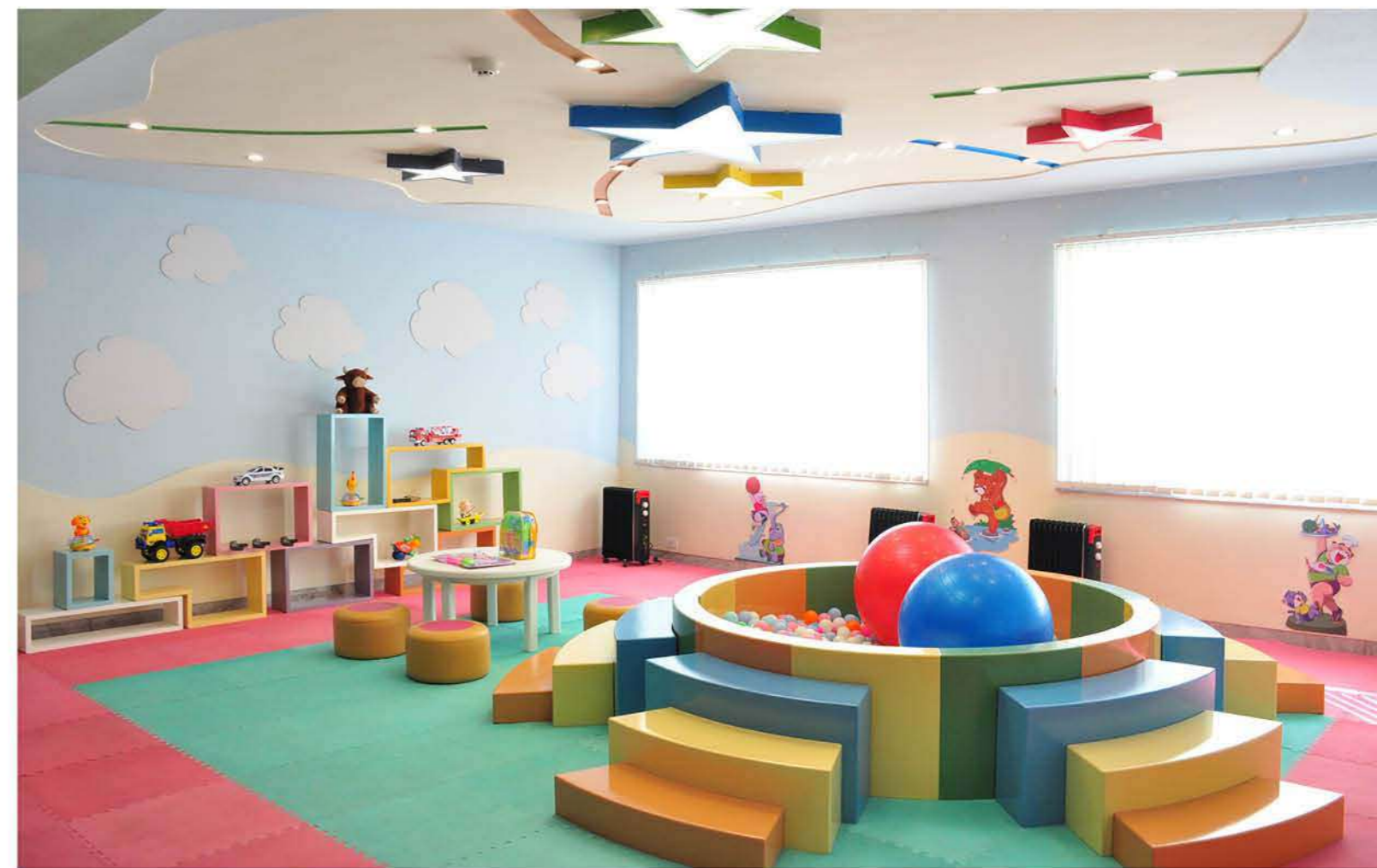
Kids' Playing Area

Today it is subdivided into branches of internal medicine, pediatrics, obstetrics and gynaecology, acupuncture, epidemiology, otorhinolaryngology, ophthalmology, diagnostics, pharmacology, tonics and so on.