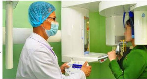
Jaw X-ray Room