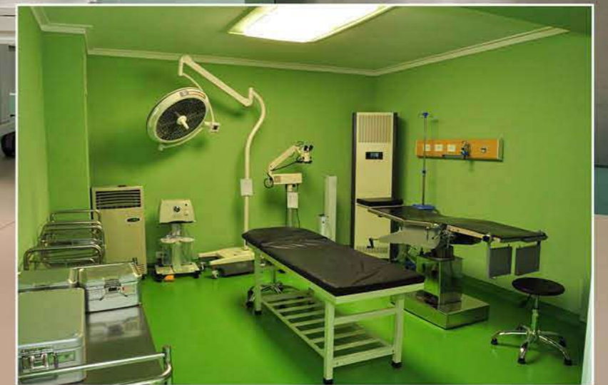
Minor Surgical Room