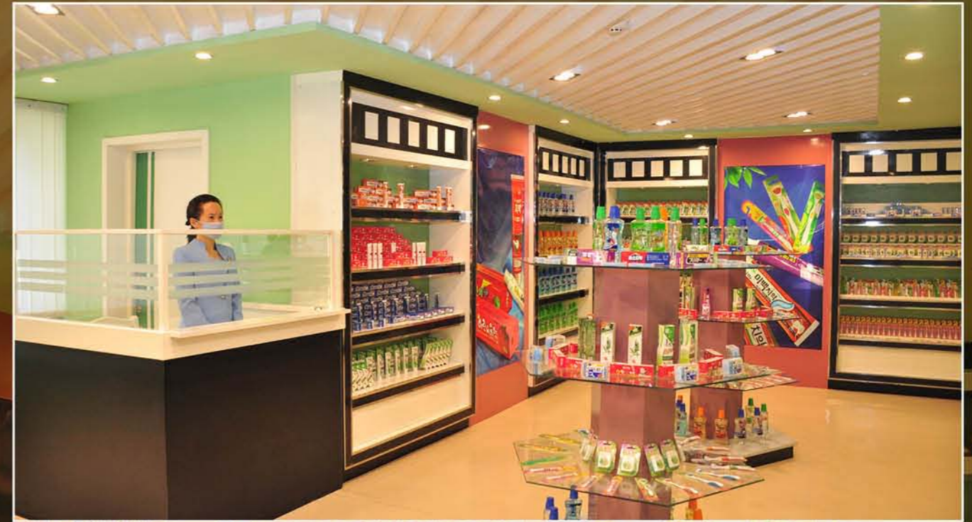
Dental Supplies Shop