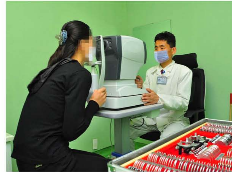
Ophthalmic Examination Room