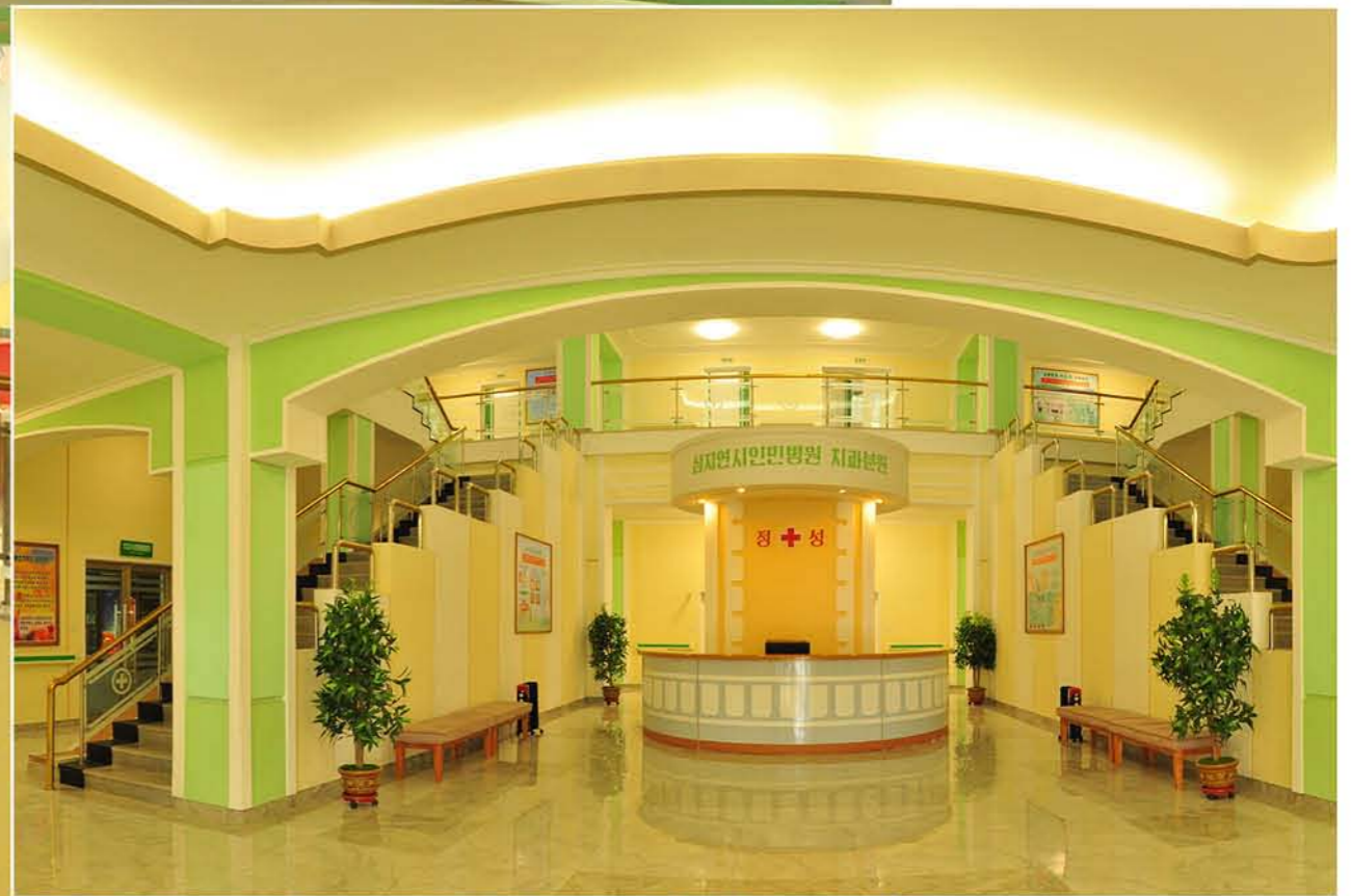
Hall in the Dental Branch Hospital