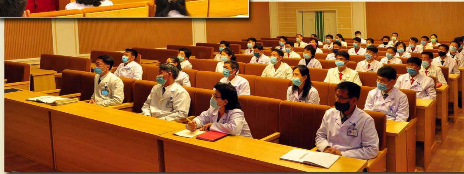
Medical science seminar