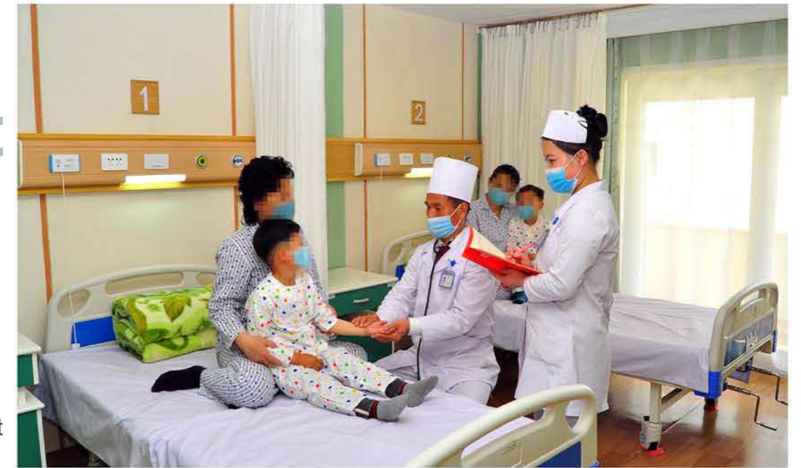
Pediatric In-Patient Ward