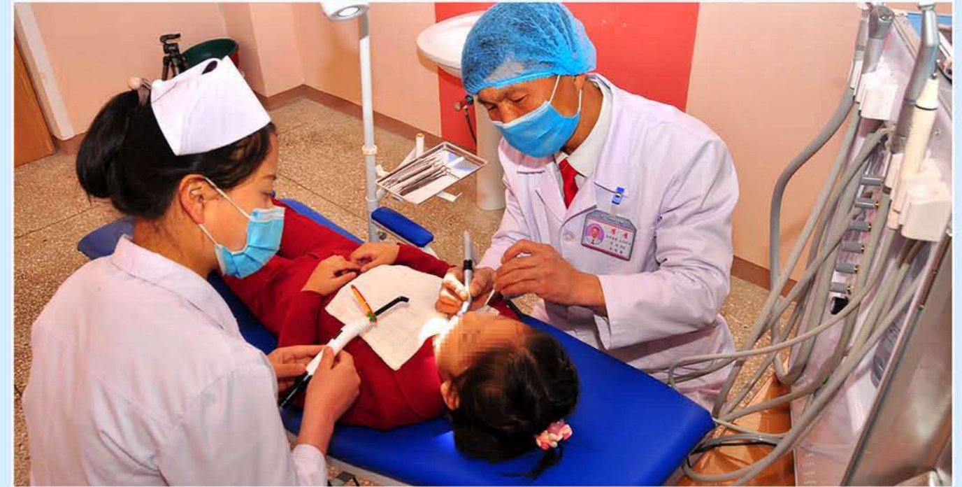
Medical workers of the hospital providing medical treatment and hygiene information to the students of schools in the city of Samjiyon

The doctors go to the households and workplaces under their charge and provide various kinds of medical service, like arranging the hygienic improvement of the working and living environment and conditions and taking measures for preventing and treating diseases.