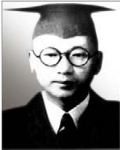
Kang Ryang Uk (December 7, 1904 – January 9, 1983)