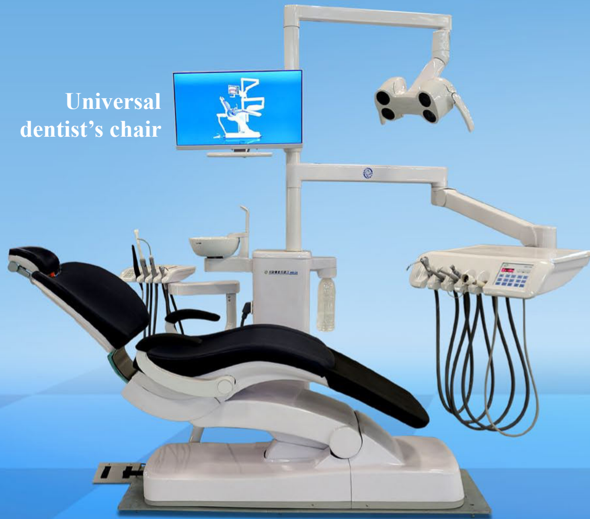
Universal dentist's chair