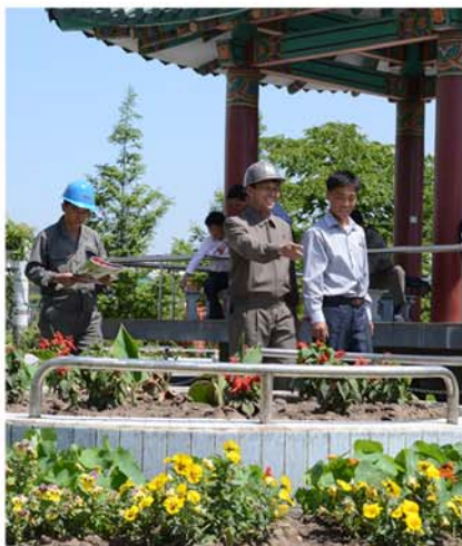
At a break.