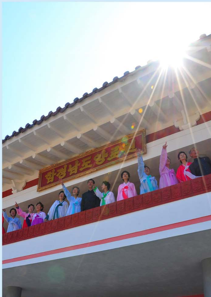
The elderly enjoy their life in good health.

cal examination every month. Our social system is really a good one for the sake of the people."