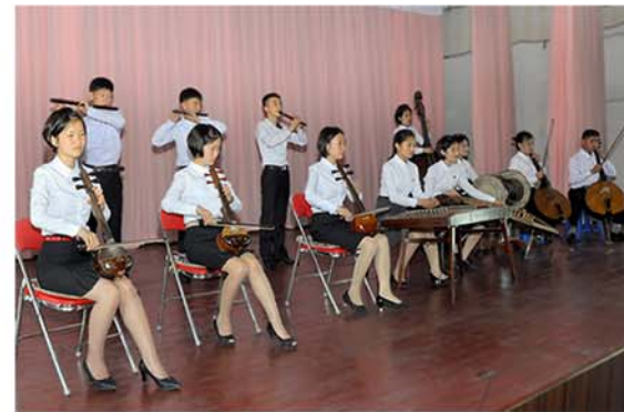
Students develop their talent.