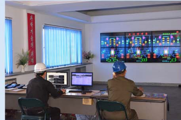
The general production control room.