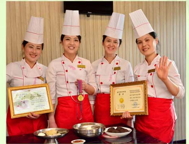
Proud of victory.

Their endeavour has led to the high appreciation at cooking contests including noodle contest that takes place every year.