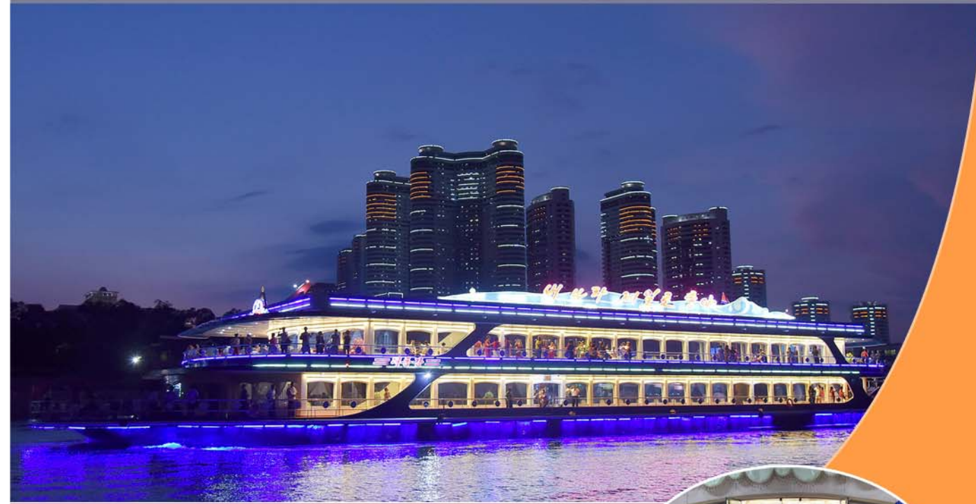
Floating restaurant Taedonggang is a tourist attraction.