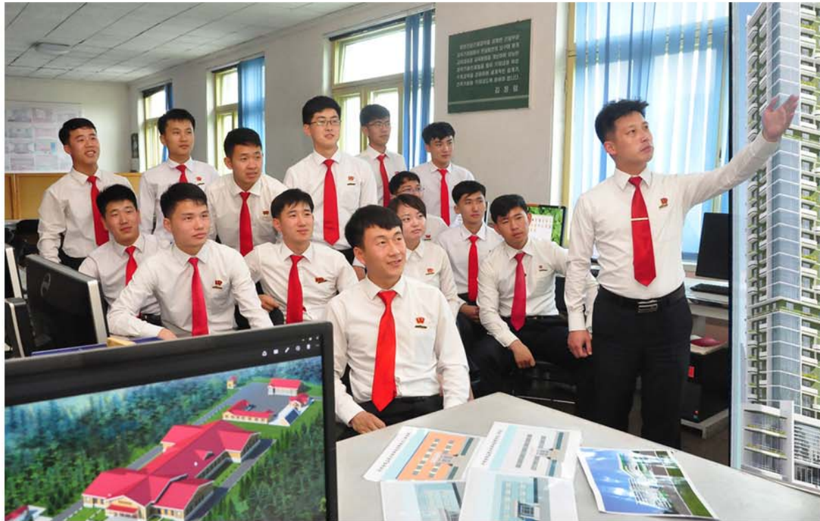
A joint discussion on an architectural design.

By March this year all members of Class 1 of the sixth grade of the architectural science department of the Architecture College of Pyongyang University of Architecture had won the scientific research prize. Some time ago I had an opportunity to meet them.