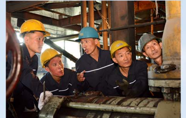
Joint efforts are directed to solving problems.

A GROWING NUMBER OF factories and enterprises are reaping benefits by relying on locally available materials and fuel and by dint of science and technology. This is the outcome of the policy of