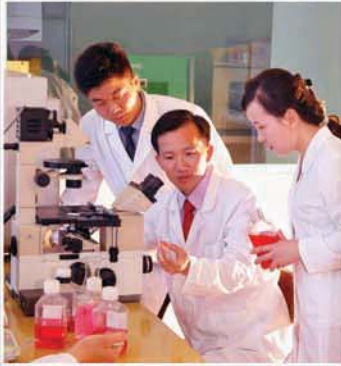
Front Cover: Young scientists work on stem cells transplantation