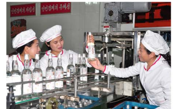
Pyongyang Soju is produced.