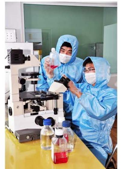
A new injection is developed.