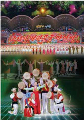
Back Cover: A scene from the grand mass gymnastics and artistic performance “The Land of the People”