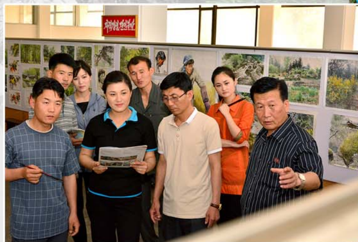
A panel discussion on works.

▶ precipitously high cliffs stood. Looking for the best pine of her picture, she climbed cliffs, sometimes losing her way. After all, she found out the best object and produced a painting of a pine on a cliff in a month.