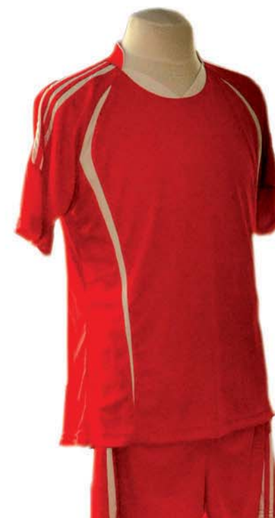
Different kinds of sporting goods are manufactured, and some of the products from the factory.