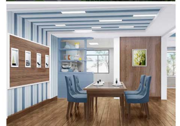
Some of the designs created by students.