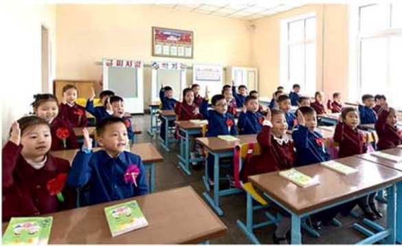
Children enter school on the first day of a new school year when the universal 12-year compulsory education is enforced fully.

After the establishment of a socialist system in the country, in particular, the leader thought deeply about how education should be done—its direction, principle, content and method—and how the educa-