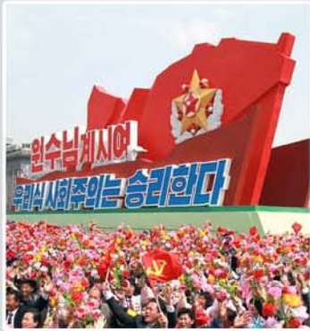
Front Cover: The demonstrators give vent to their trust in the Workers' Party of Korea