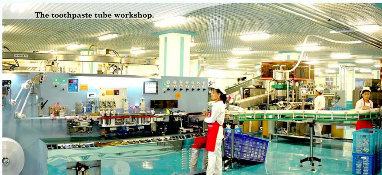
The toothpaste tube workshop.

SOME TIME AGO I VISITED the newly built Pyongyang Dental Hygiene Supplies Factory. Occupying not so large an area covered with trees and flowers, the factory consists of a production building, an office building and a welfare facility. The outer walls of the production building are covered with white and green tiles in good harmony, and the front wall features a mark of Paekhak (white crane), which the Korean people regarded as a sym-