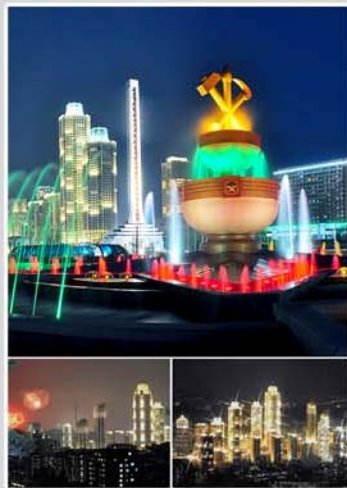
Back Cover: Ryomyong Street at night