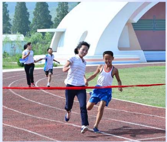
The campers enjoy themselves to their heart's content.