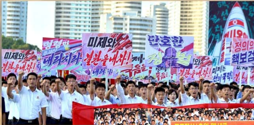
The Pyongyang citizens' mass rally and demonstration to fully support the DPRK government's statement in August 2017.