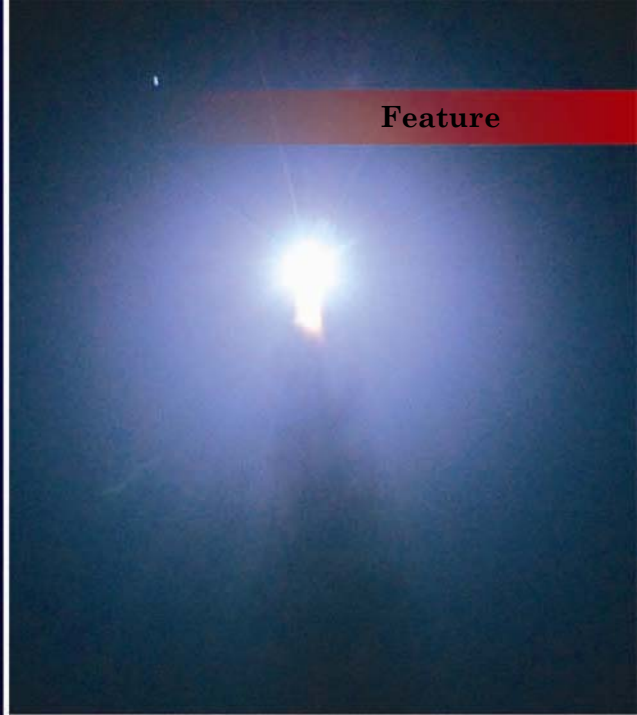
The successful second round of test fire of intercontinental ballistic missile Hwasong 14 on July 28, 2017.