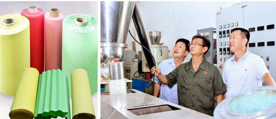
Functional paper goods are developed for the people's life and the economic development.

in the air to a hundred. Worldwide, the capability of lowering the number of bacteria per 1 ft 3 to 1 000 is defined as 1 000-level, and that of doing to 100 as 100-level. Considering the fact that the 100-level is recognized as the advanced, their success is very notable. This air-cleaning paper has a wide range of usage. In the medical sector, in particular, it can perfectly provide an operating theatre with a germ-free condition in case of operation. At present the paper is used in operating theatres of several hospitals including the Breast Tumour Institute of the Pyongyang Ma-