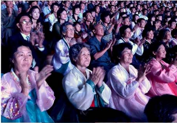
Elderly people celebrate the International Day of Older Persons.

My federation will continue to strive to make the elderly lead a worthwhile life and help further improve the State policy of protecting the elderly as required by the developing reality and the elderly. □