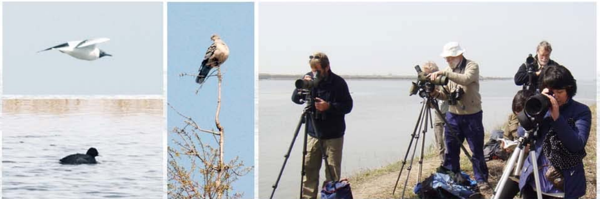
A joint survey of migratory birds is made.