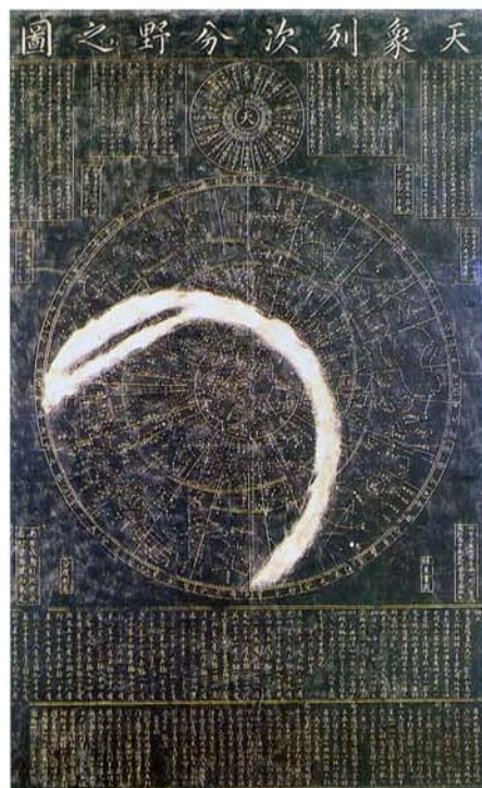
The astronomical chart Chonsangryolchabunyajido .

Medicine of Koguryo, too, was on a high level. Acupuncture and