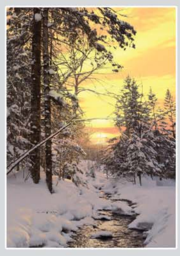
Back Cover: The Sobaek Stream in the glow