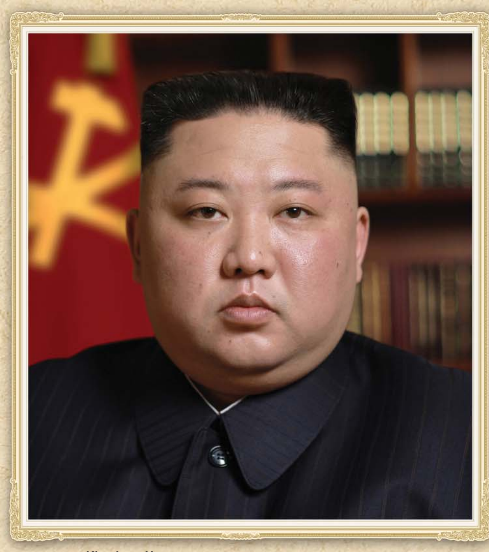
Kim Jong Un, general secretary of the Workers' Party of Korea.

EIGHTH CONGRESS OF THE THE Workers' Party of Korea discussed the fourth item on the agenda "Election of the central leadership body of the WPK".