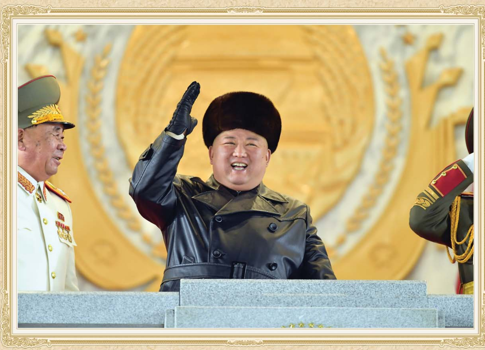
Kim Jong Un acknowledges the enthusiastic cheers of the participants in the military parade in January 2021.