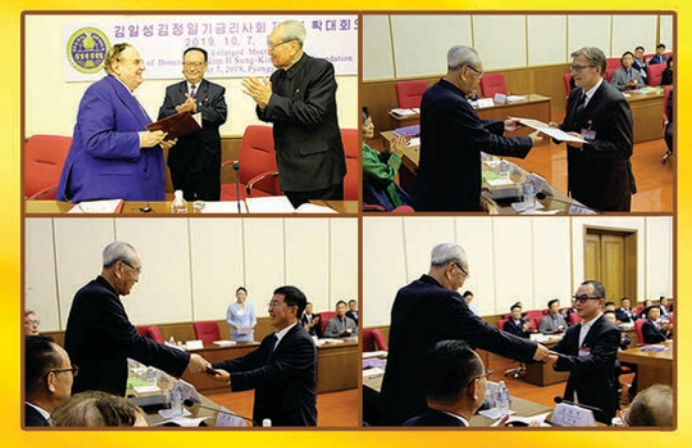
Certificates are awarded to the newly elected directors and members.