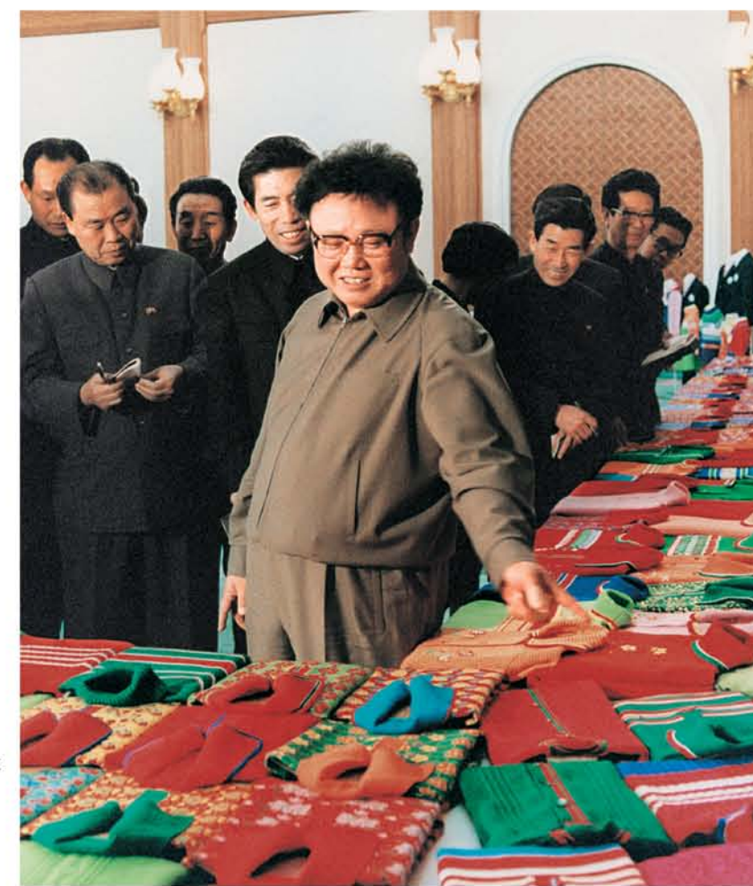
Chairman Kim Jong Il looking at the sample clothes for children (March 1984)