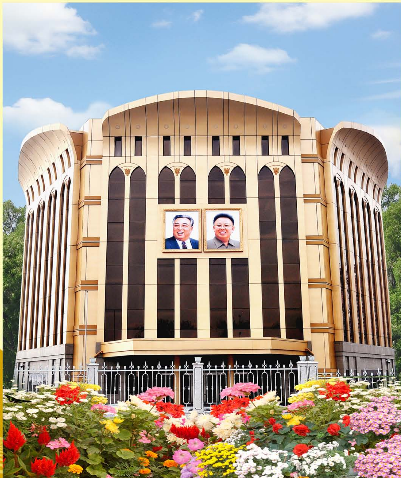
Headquarters of the Kim Il Sung-Kim Jong Il Foundation