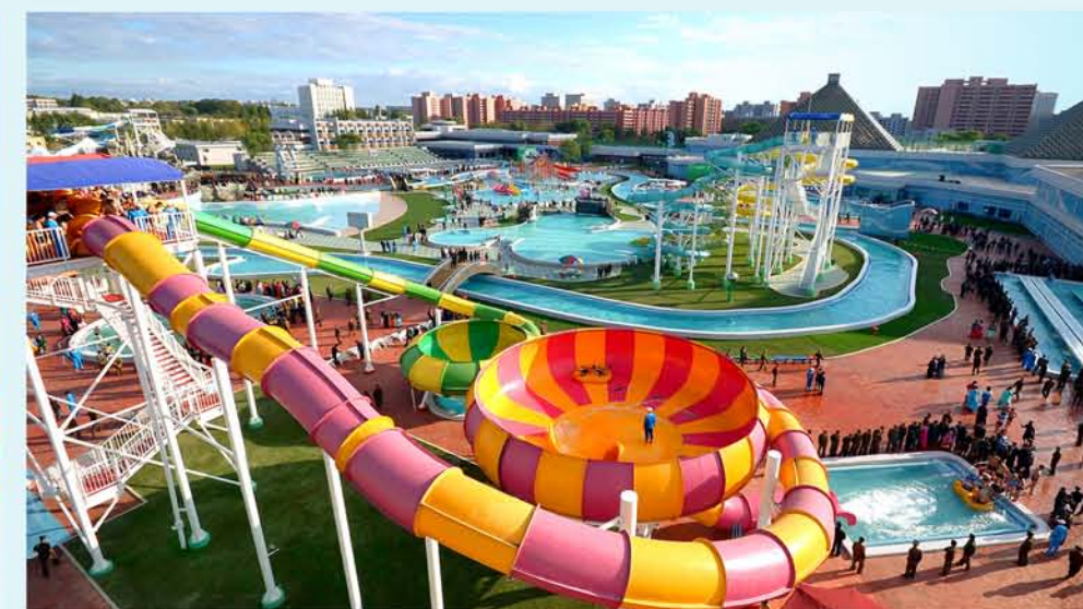
Munsu Water Park

In Juche 102 (2013) alone, Unha Scientist Street, Okryu Children's Hospital, Munsu Water Park, Mirim Riding Club, Masikryong Ski Resort and other world-level structures made their appearance under the loving care of supreme leader Kim Jong Un for the people.