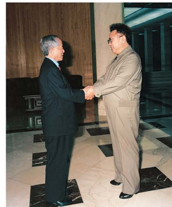
Chairman Kim Jong Il meeting Choe Hong Hui, the late president of the International Taekwon-Do Federation (October 2000)