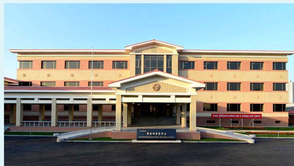
Central Mushroom Institute under the State Academy of Sciences