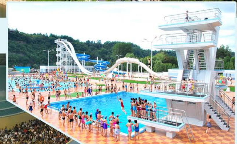
Rungna Water Park

In the Democratic People's Republic of Korea, the history of the great leaders' love for people go on thanks to the tireless efforts of supreme leader Kim Jong Un .