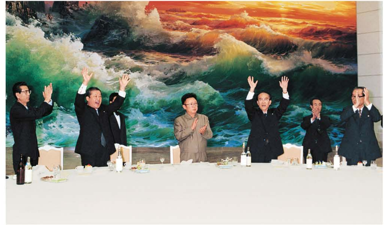
Chairman Kim Jong Il with officials of the General Association of Korean Residents in Japan (Chongryon) and compatriots in Japan (October 1995)