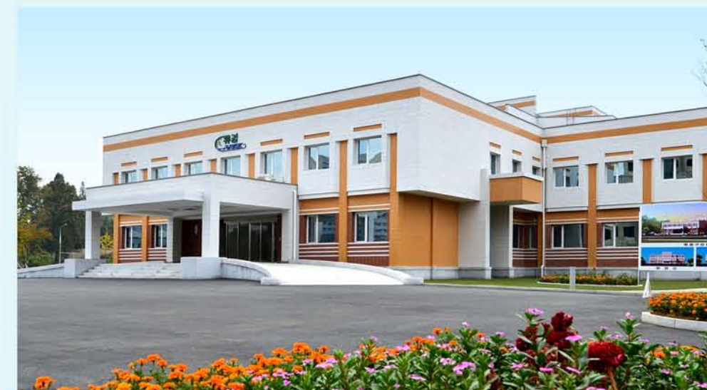
Ryugyong Dental Hospital