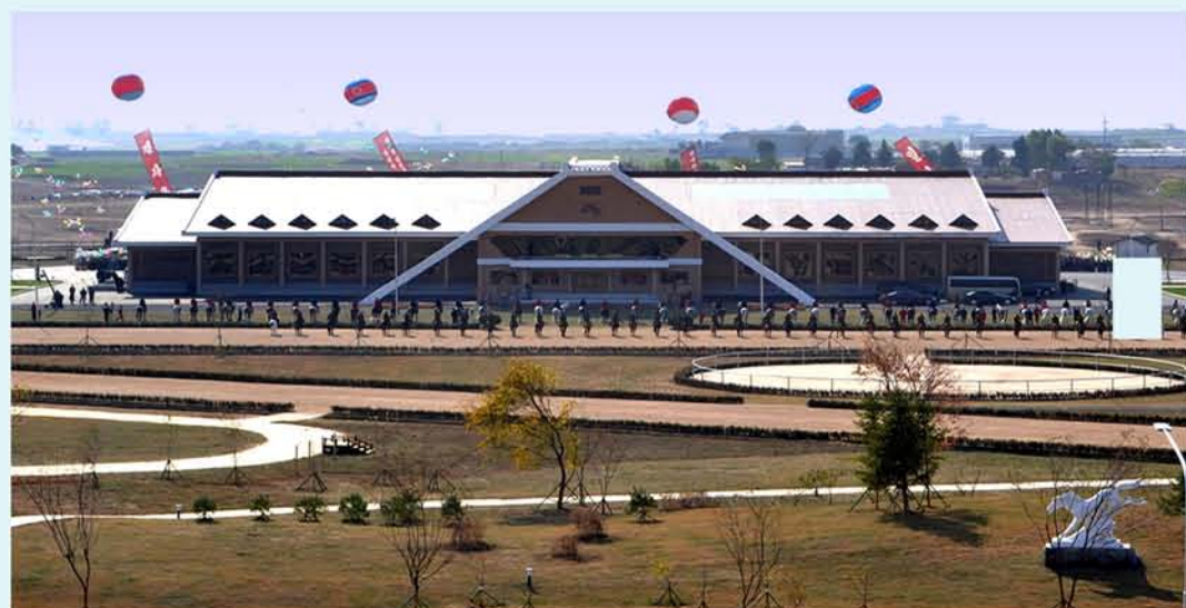
Mirim Riding Club