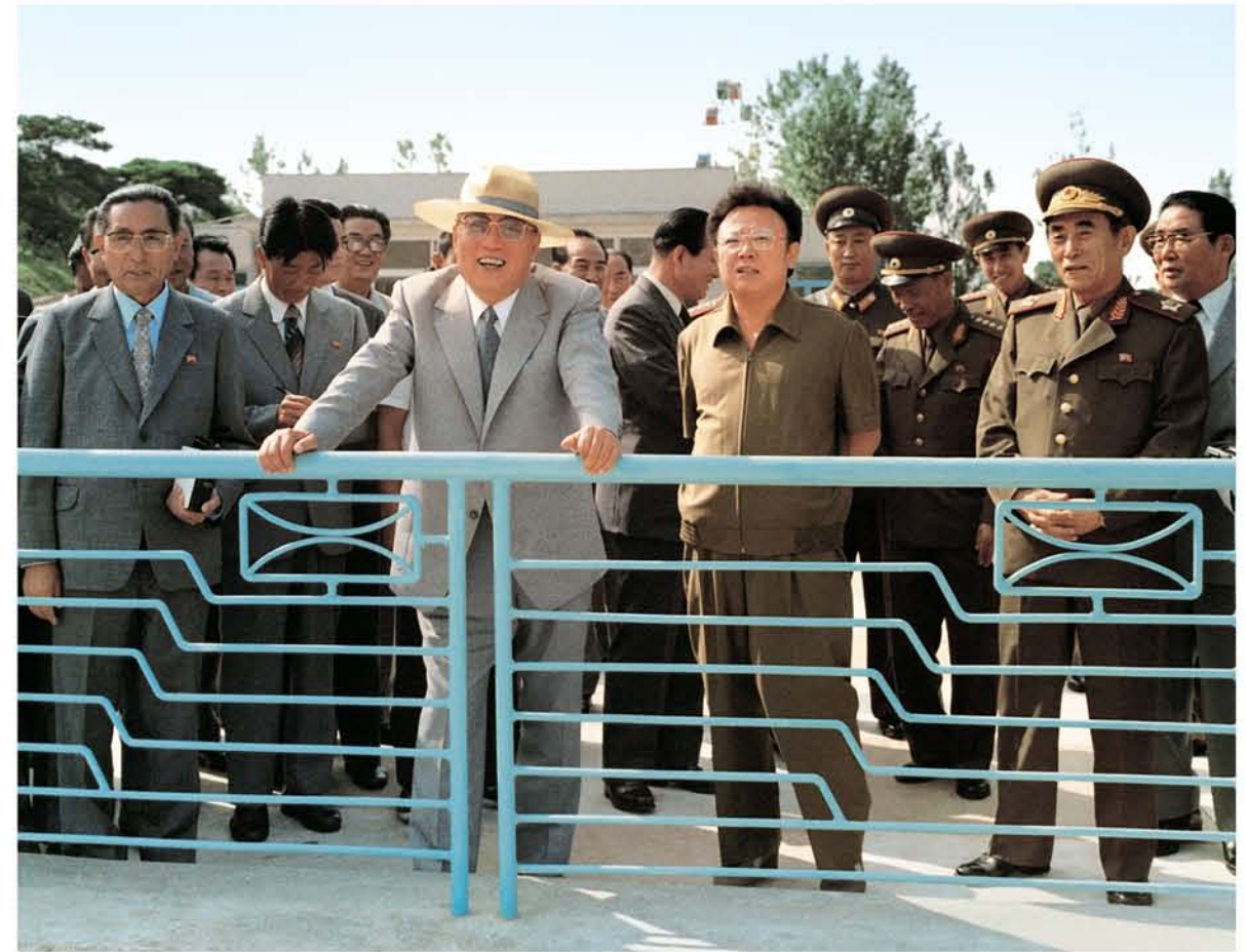
President Kim Il Sung and Chairman Kim Jong Il looking round the Mangyongdae Wading Pool (August 1985)