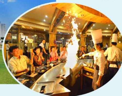
Haedanghwa Service Complex