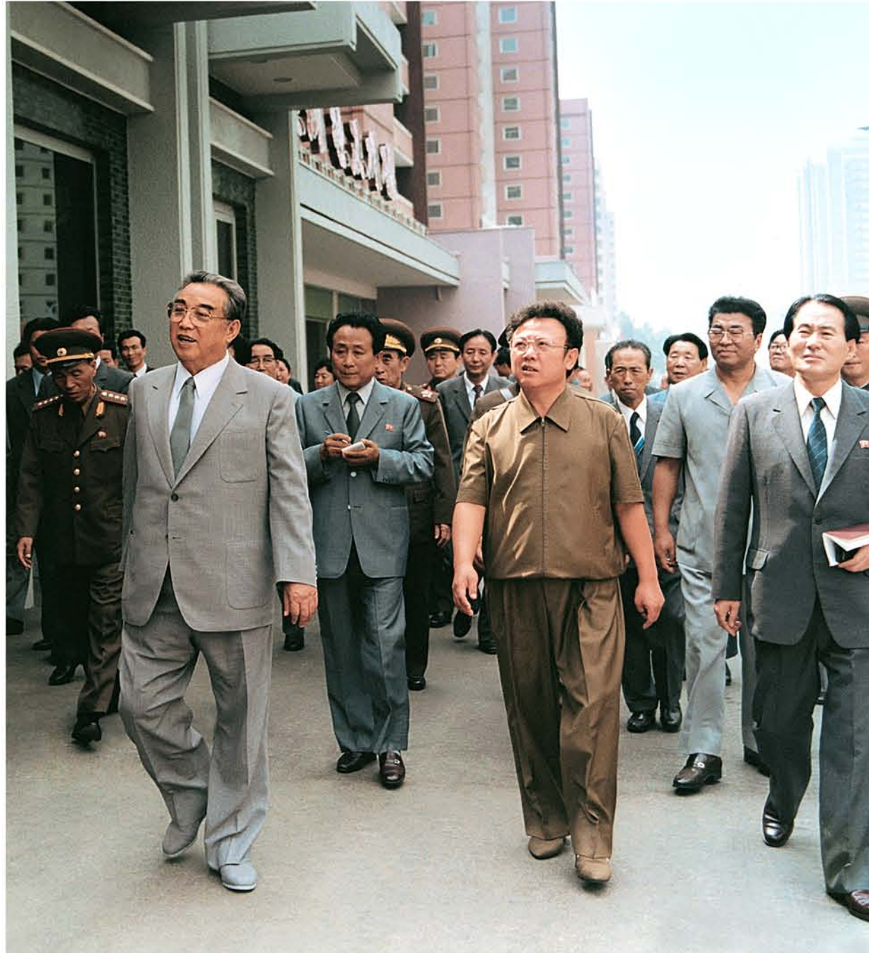
President Kim Il Sung and Chairman Kim Jong Il looking round the apartment blocks of the second-stage project in Changgwang Street (August 1985)