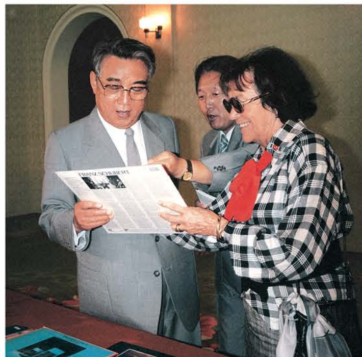
President Kim Il Sung meeting Luise Rinser, West German woman writer (August 1986)