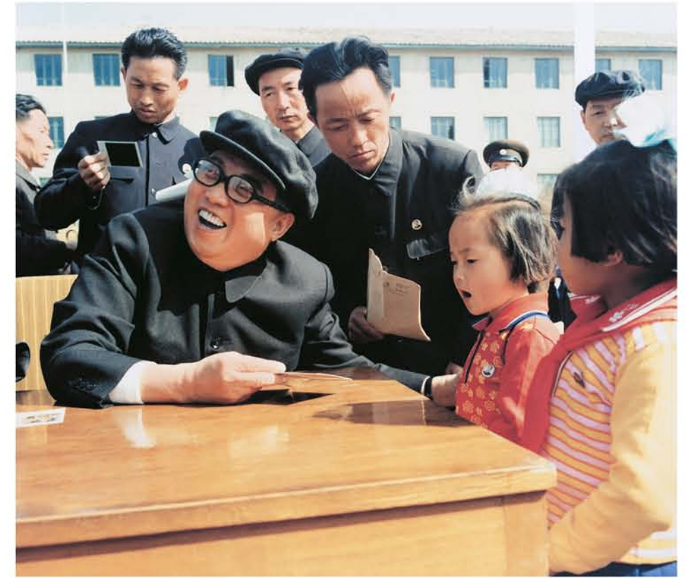
President Kim Il Sung after taking photos of students in new school uniforms at Yonphung Senior Middle School (April 1977)