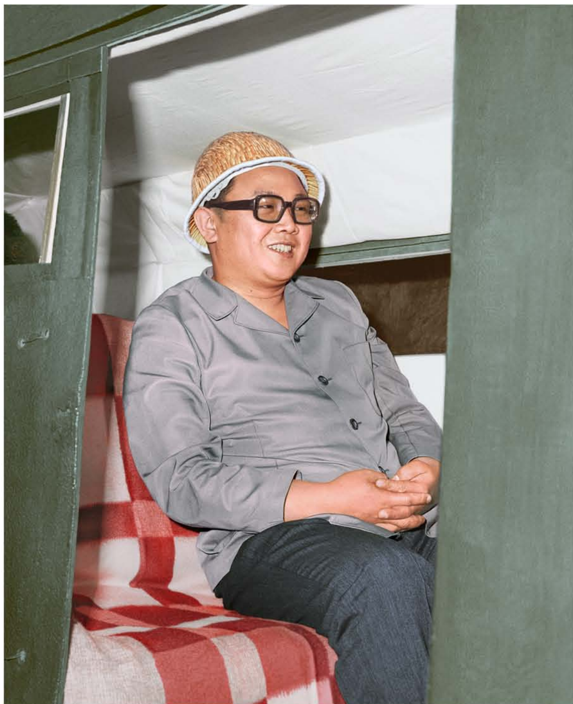
Chairman Kim Jong Il going down the pit on a man car at the Komdok Mine (July 1975)