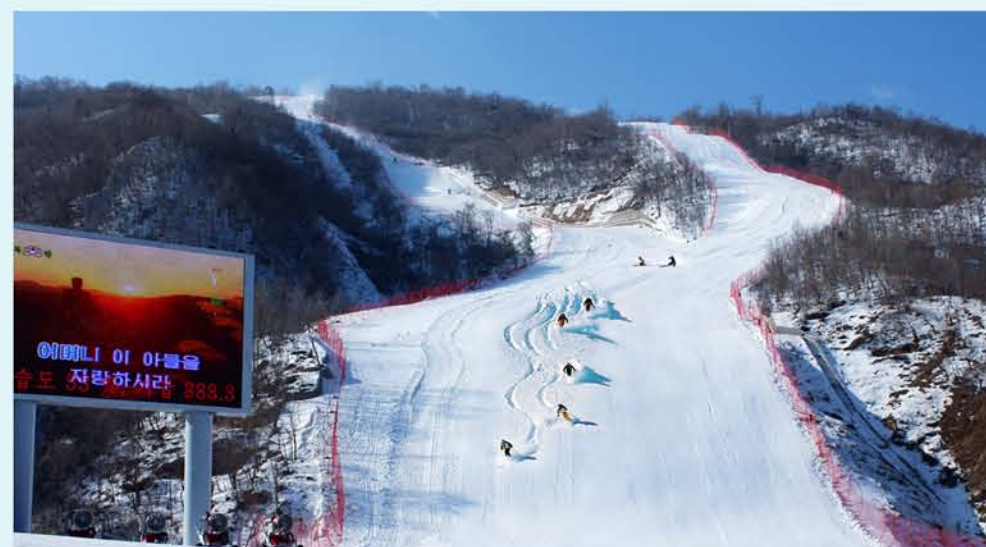
Masikryong Ski Resort