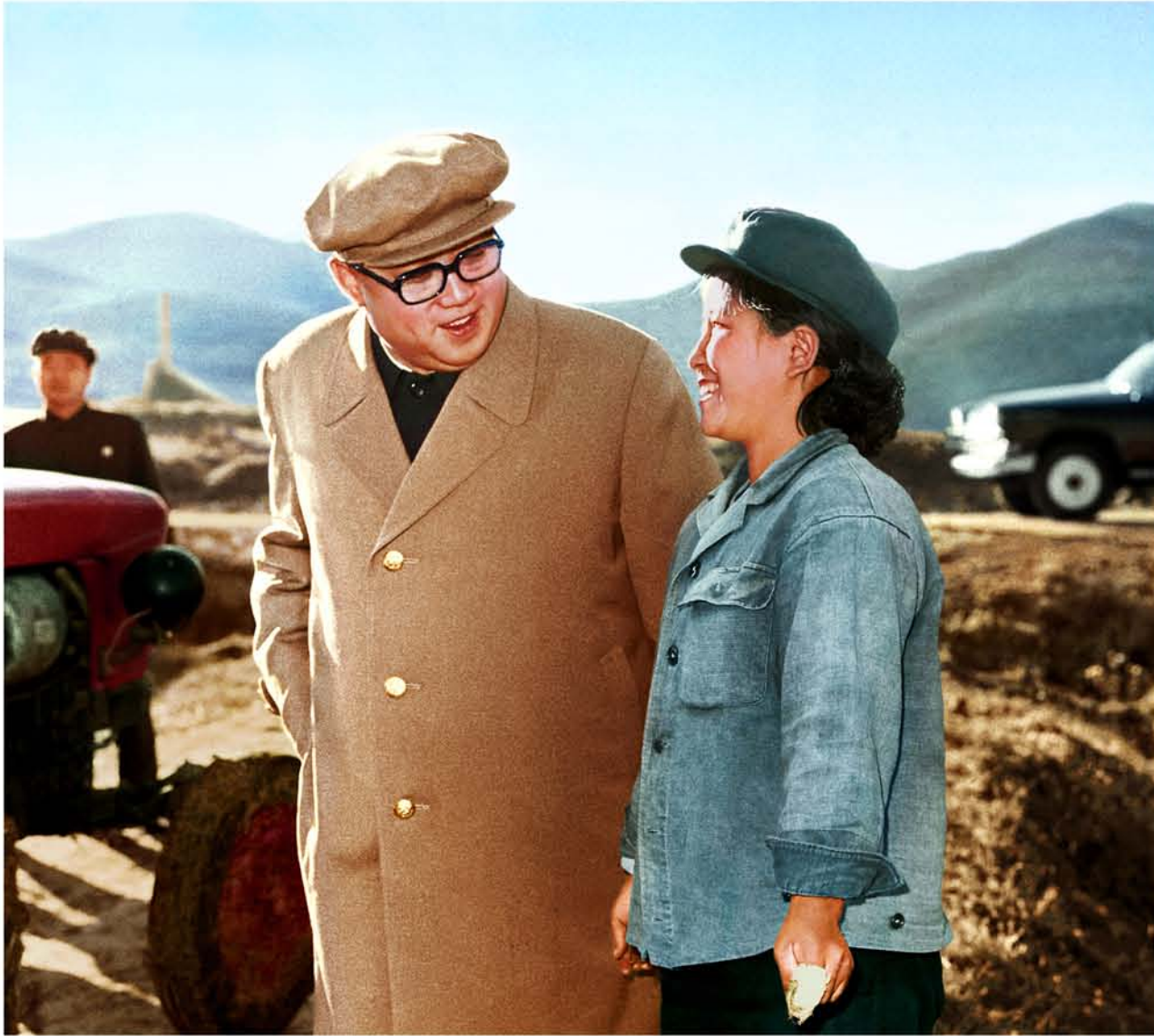
President Kim Il Sung encouraging a girl tractor driver on his on-the-spot guidance tour (November 1973)