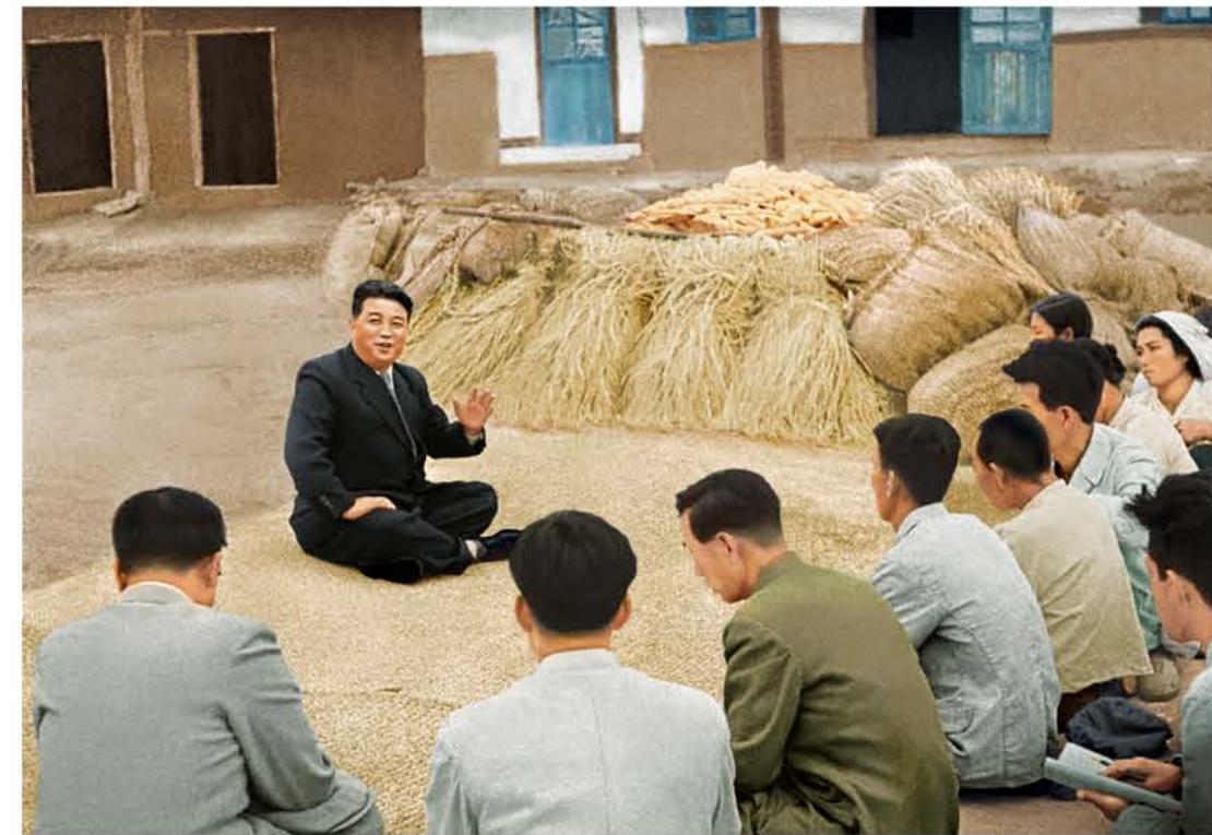
President Kim Il Sung discussing farm work with farmers of Chongsan-ri, Kangso County (October 1958)