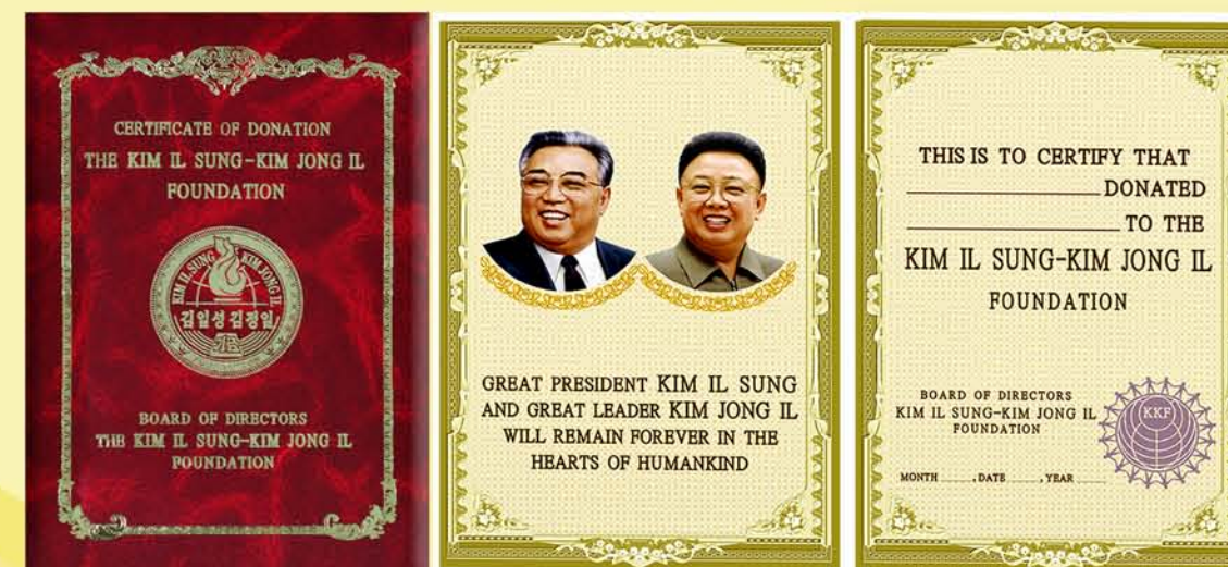
Certificate of Donation of the KKF