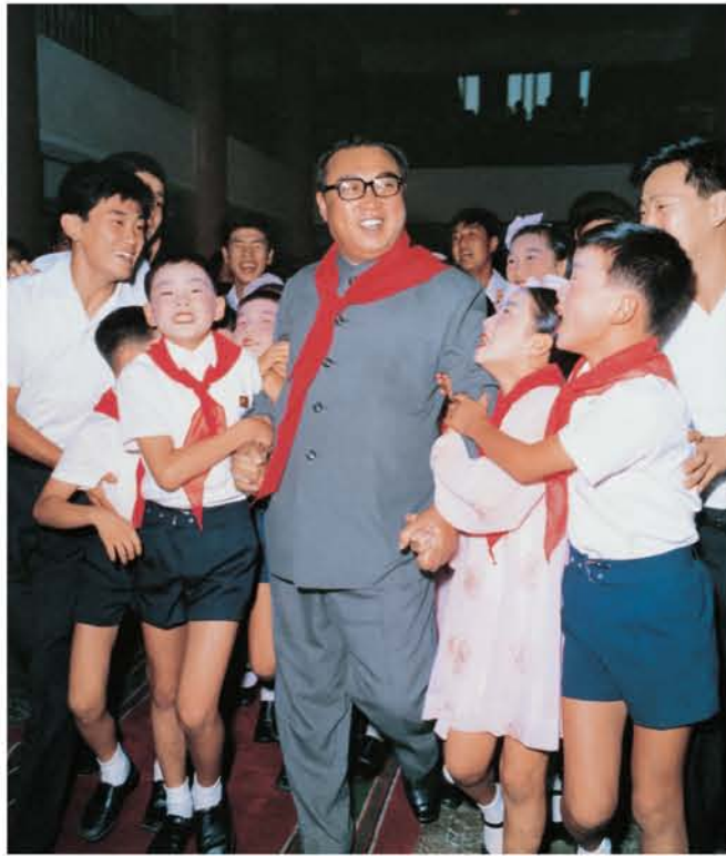
President Kim Il Sung among the visiting pupils from Korean Primary School in Yokohama, Japan (August 1972)