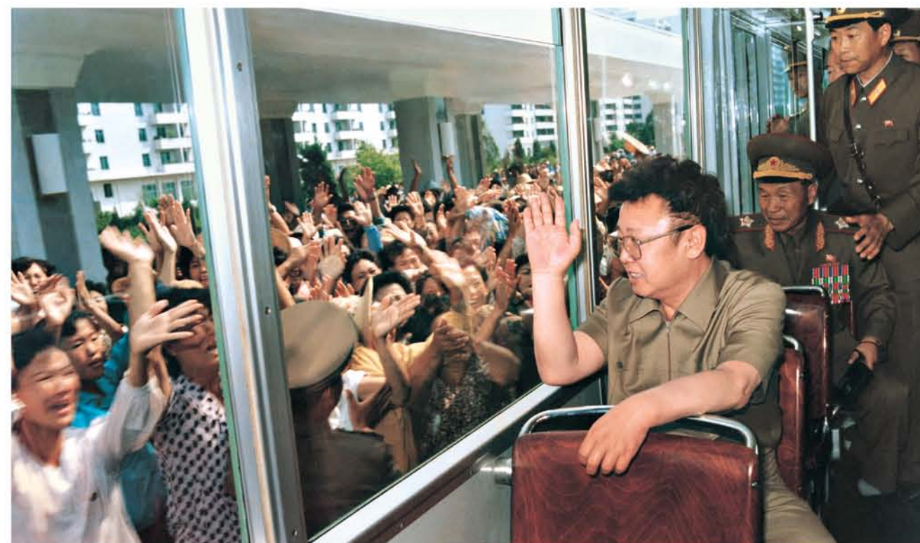
Chairman Kim Jong Il acknowledging the cheering crowds (July 1995)