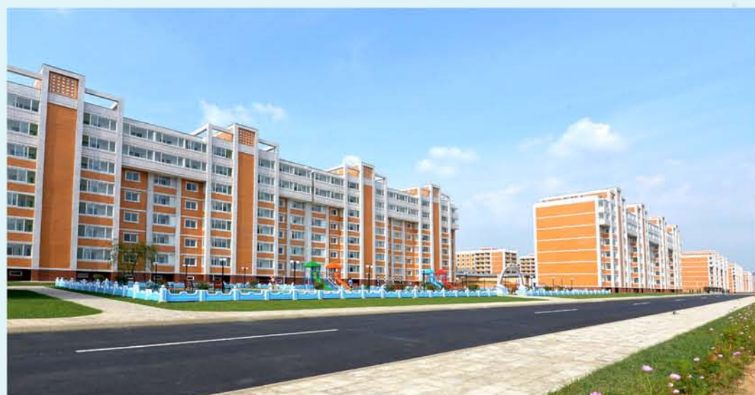
Unha Scientist Street