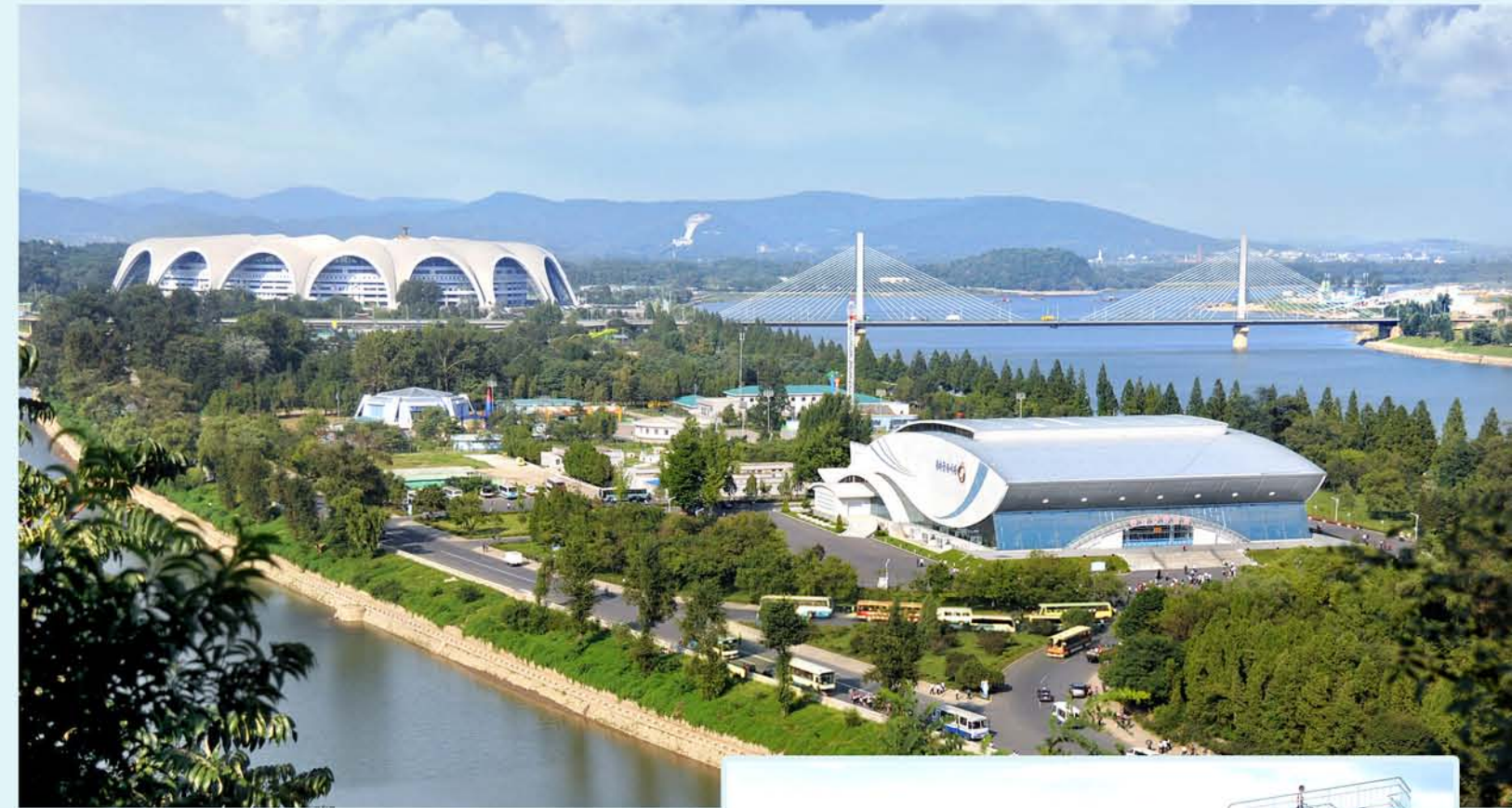
Rungna People's Pleasure Park