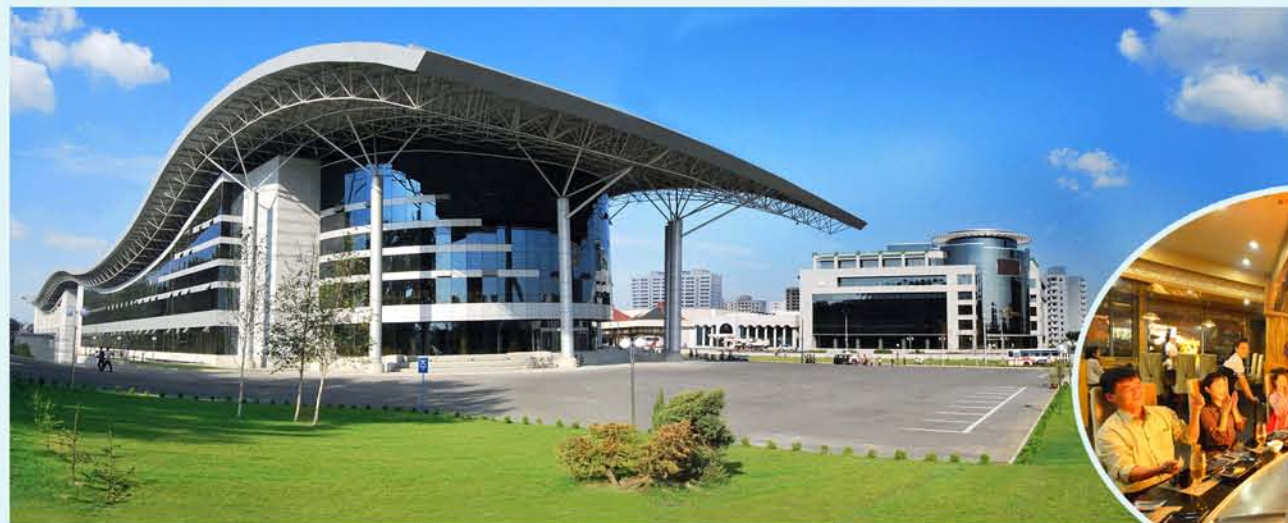
Ryugyong Health Complex