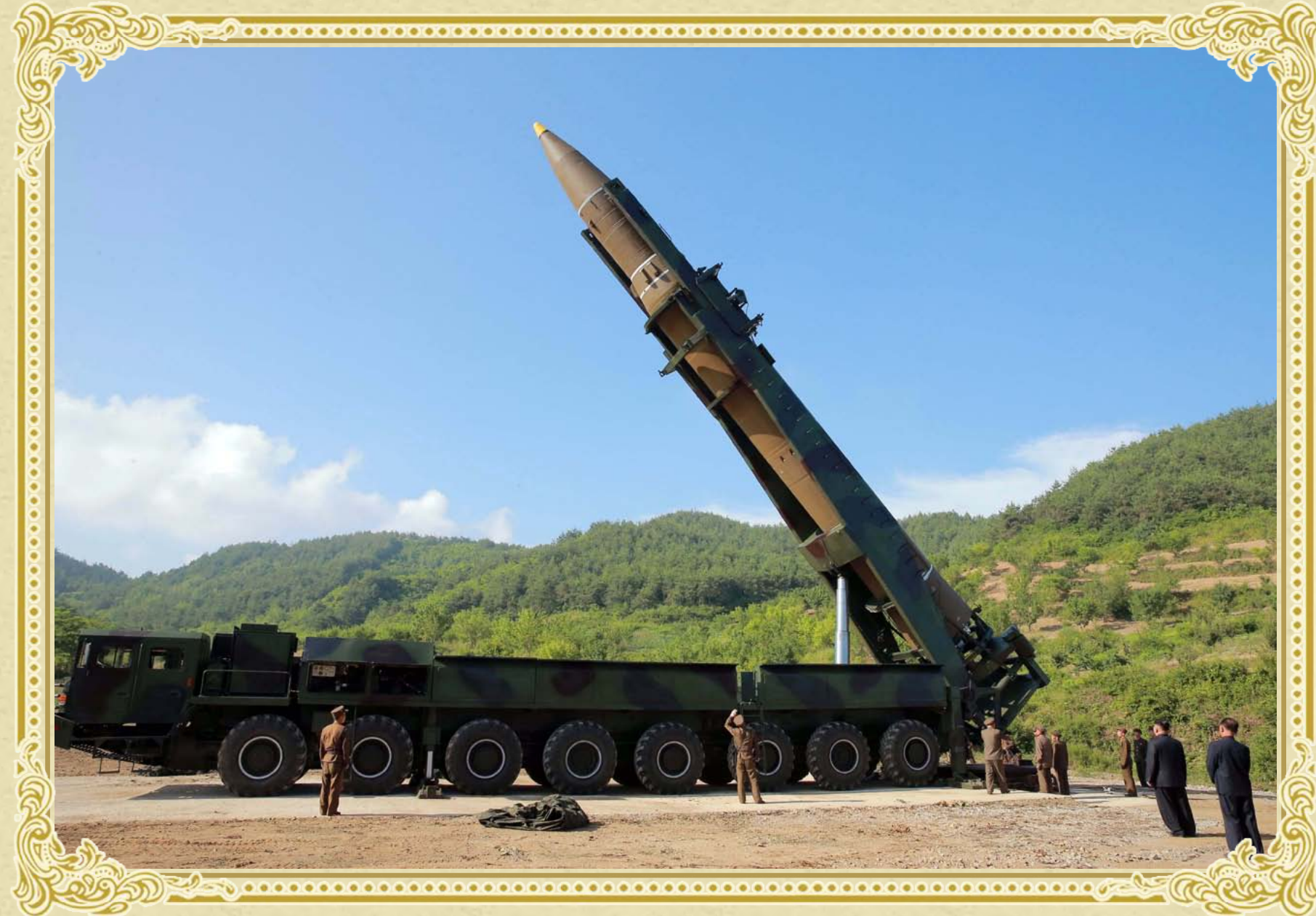
Kim Jong Un overseeing a test-firing of ICBM Hwasong 14 in July 2017