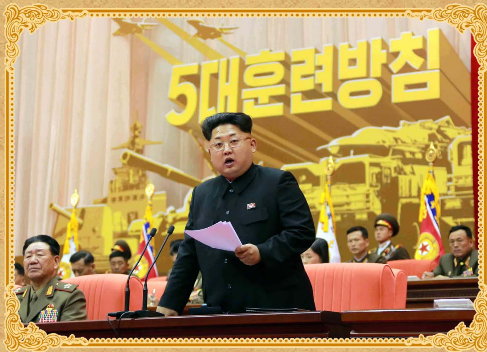
Kim Jong Un presiding over the Fifth Conference of the Training Officers of the KPA in April 2015