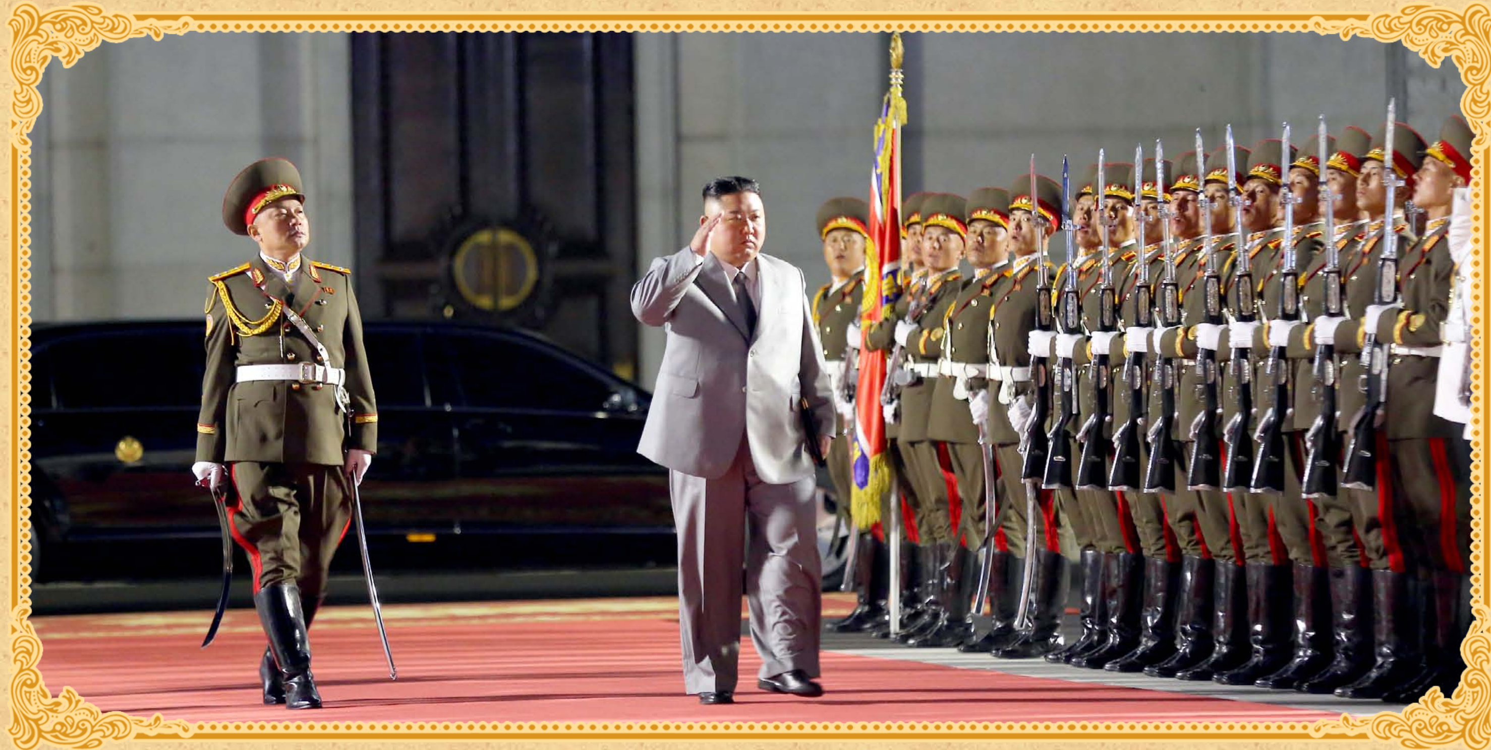
Kim Jong Un, chairman of the Workers' Party of Korea, chairman of the State Affairs Commission of the Democratic People's Republic of Korea and supreme commander of the armed forces of the DPRK, reviewing the honour guard of the Korean People's Army