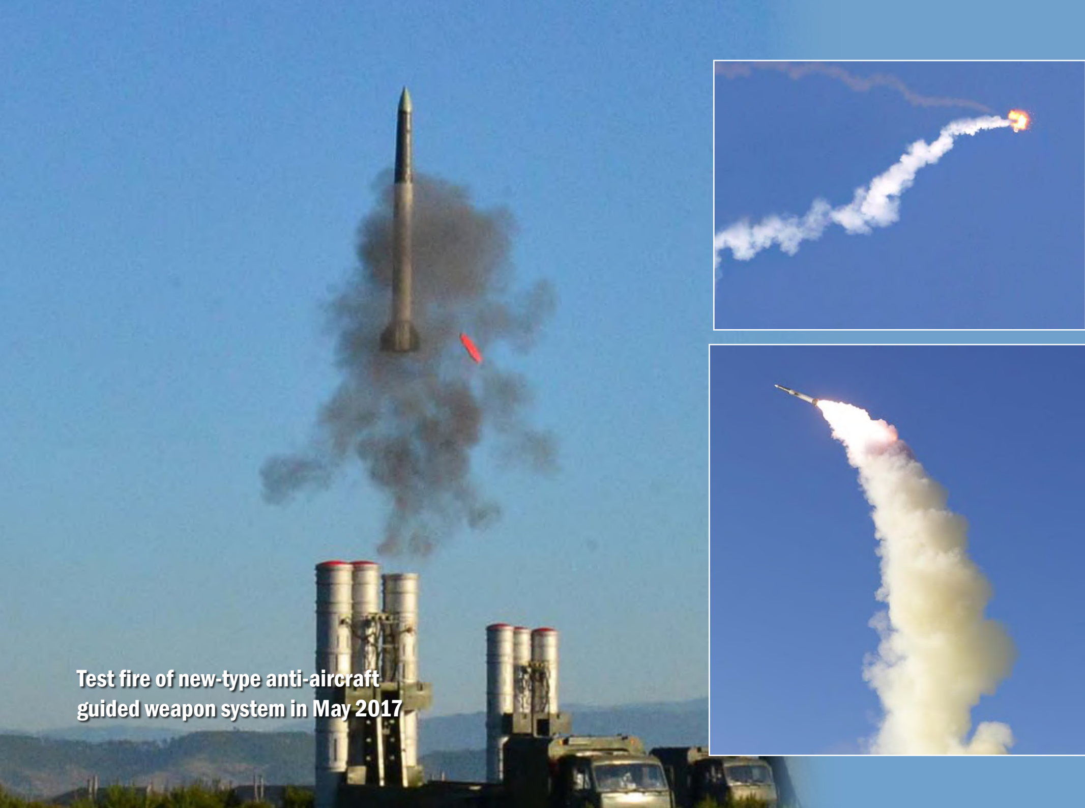
Test fire of new-type anti-aircraft guided weapon system in May 2017