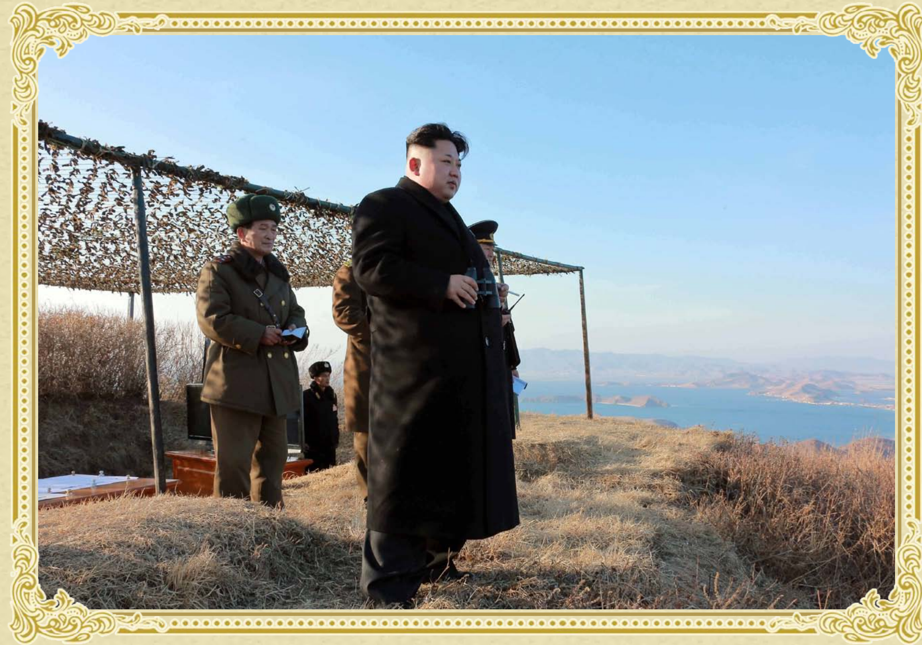
Kim Jong Un inspecting a launching drill of new-type anti-warship rocket in February 2015