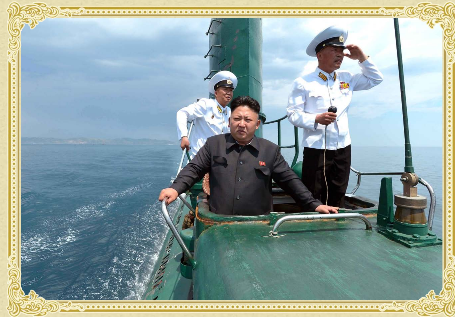
Kim Jong Un inspecting on board the manoeuvres of the KPA sailors in June 2014