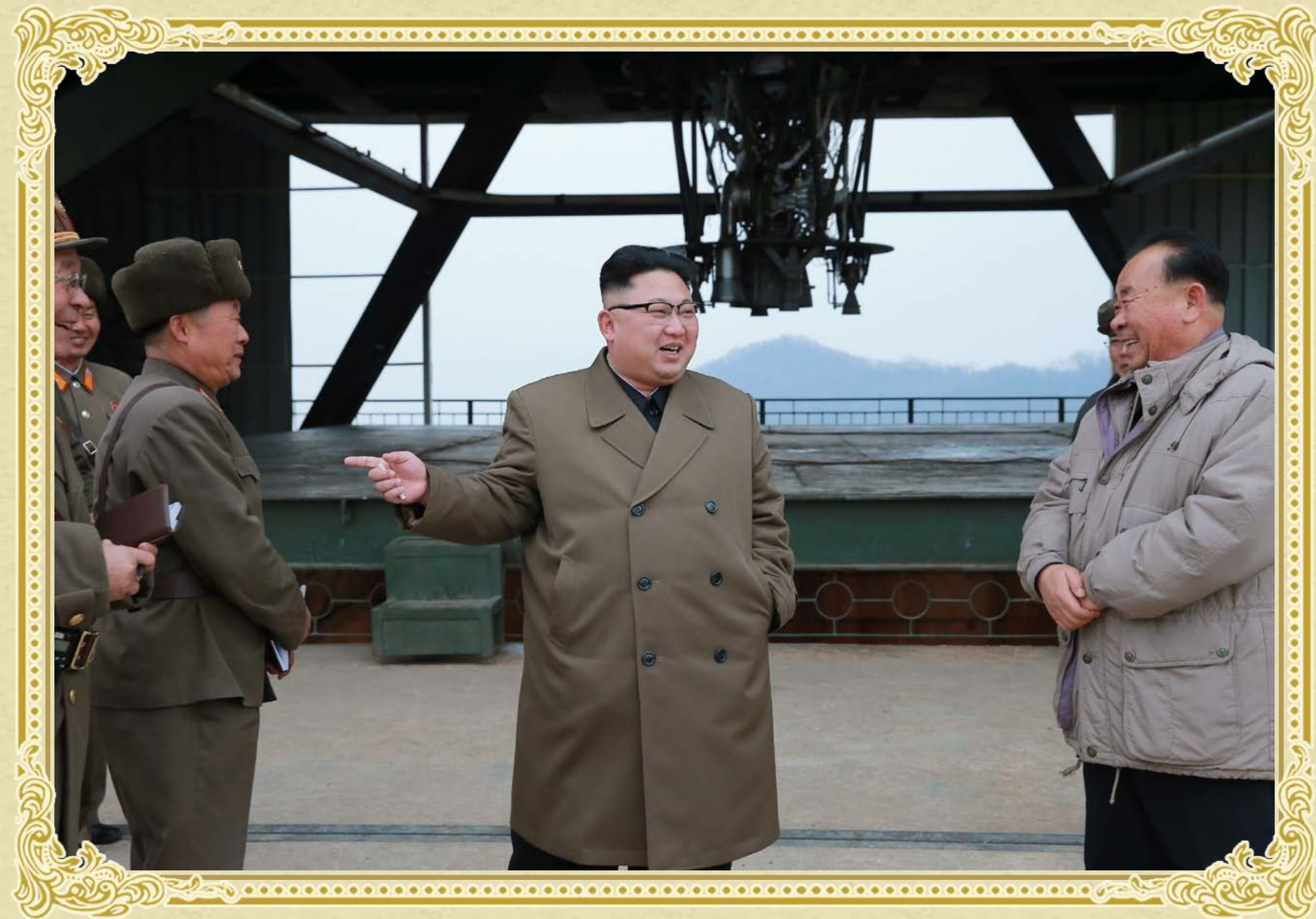
Kim Jong Un overseeing a static firing of Korean-style high-thrust motor newly developed by the Academy of Defence Science in March 2017