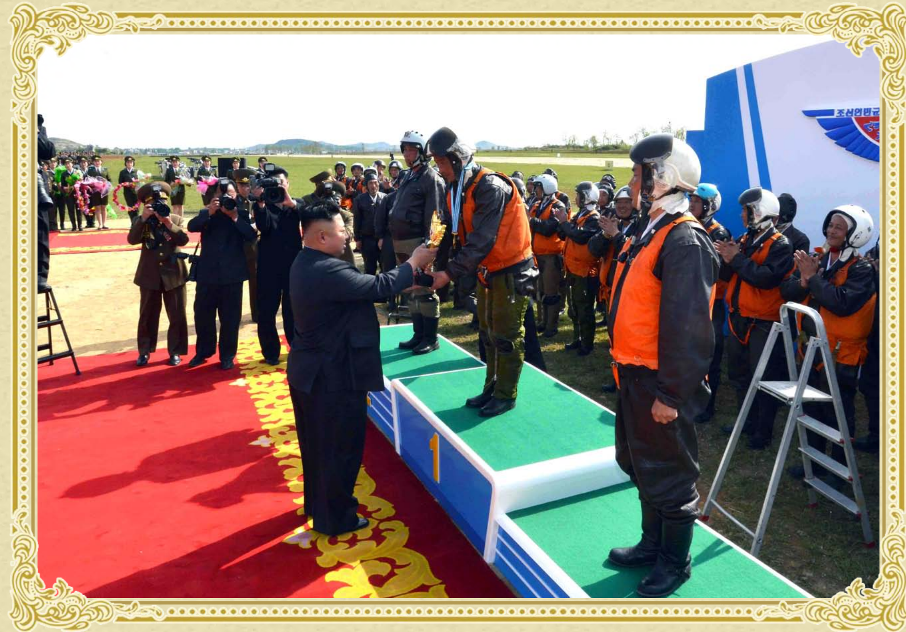
Kim Jong Un awarding prizes to commanding officers and units that won in the Combat Flight Contest-2014 of the flight commanding officers of the Air and Anti-Aircraft Force of the KPA in May 2014