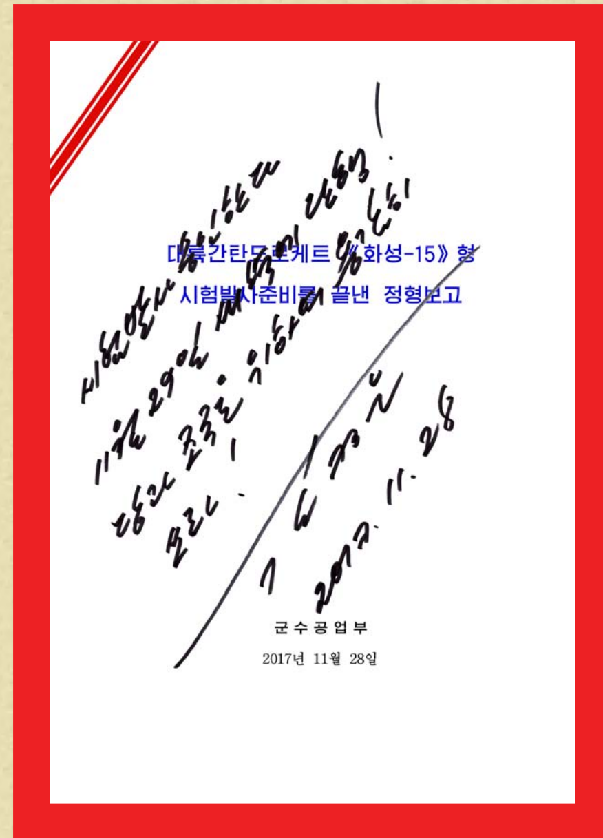
Kim Jong Un issuing an order to conduct a test launch of ICBM Hwasong 15 in November 2017