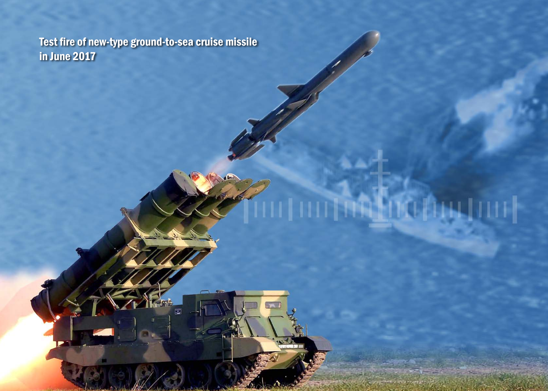
Test fire of new-type ground-to-sea cruise missile in June 2017