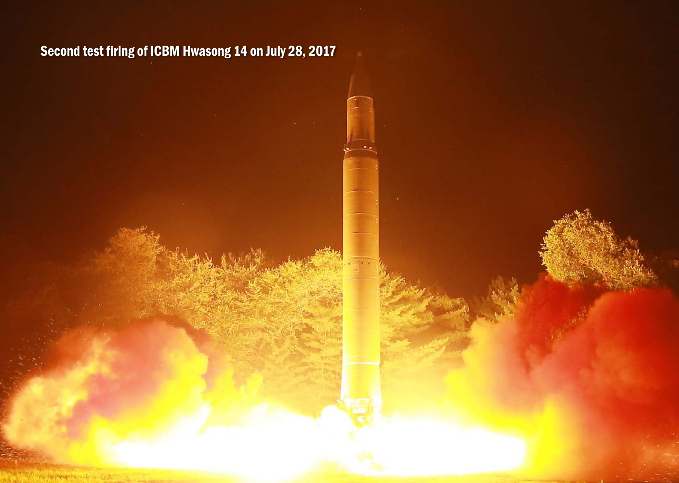
Second test firing of ICBM Hwasong 14 on July 28, 2017