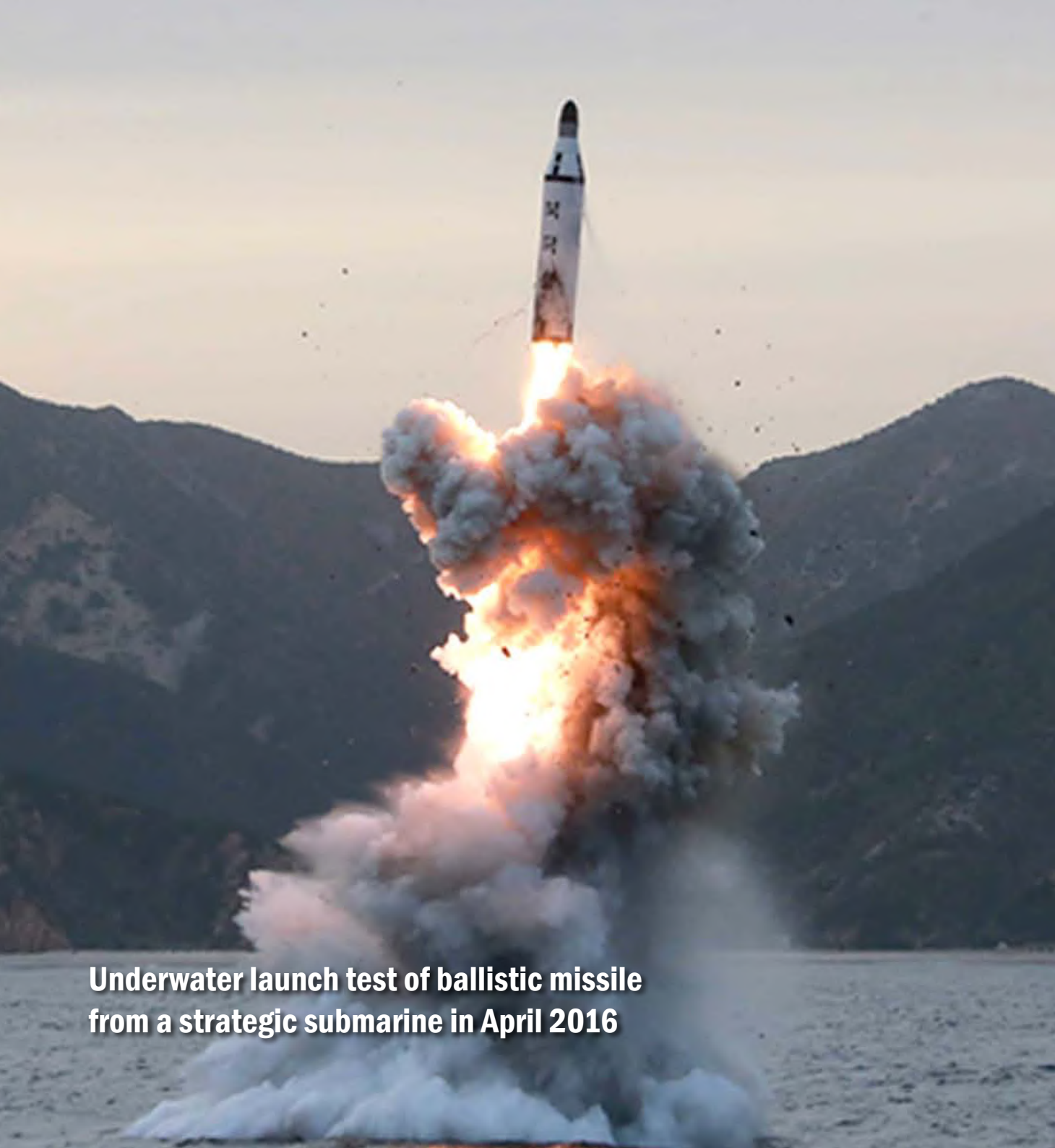
Underwater launch test of ballistic missile from a strategic submarine in April 2016