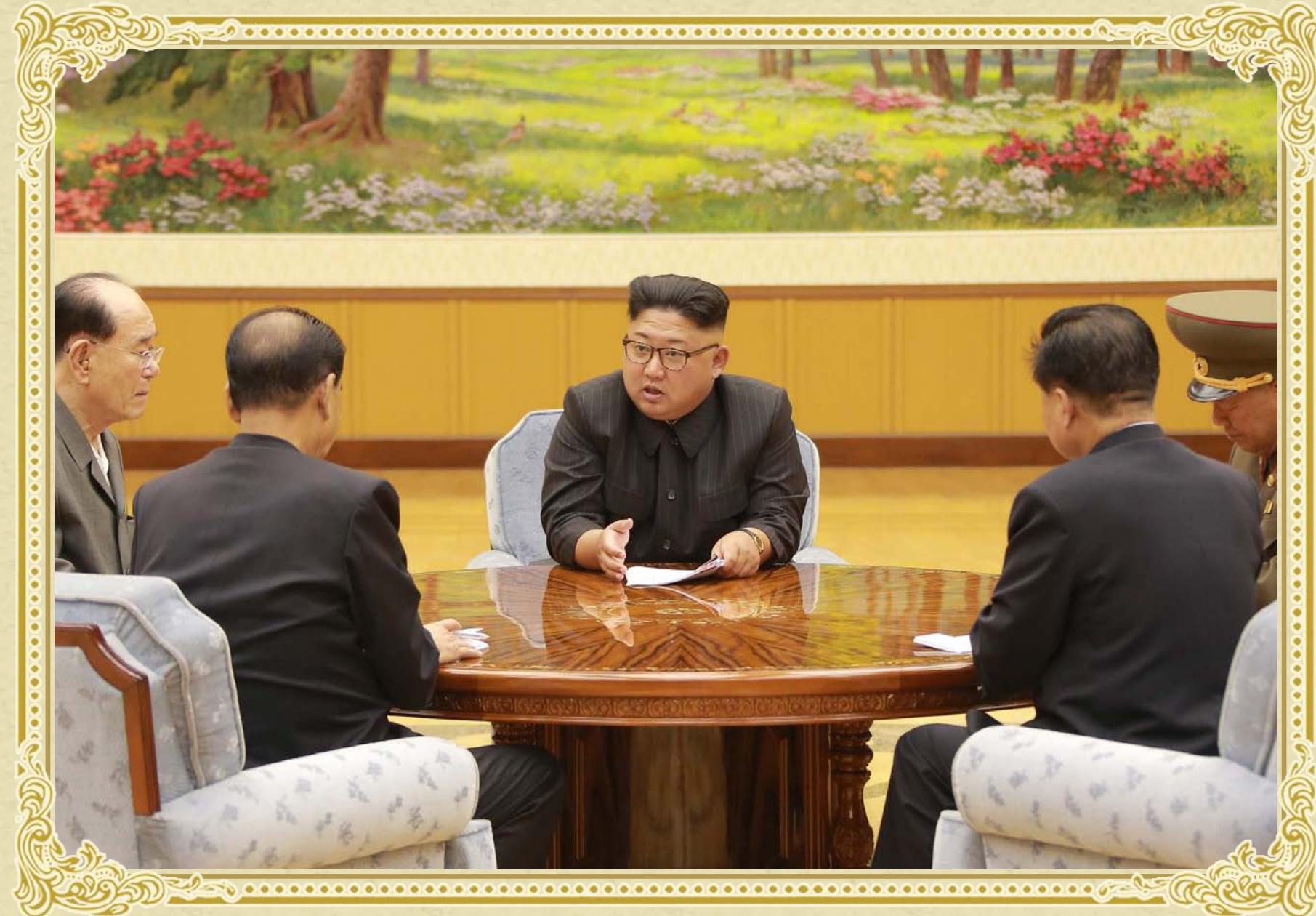
The Presidium of the Political Bureau of the Central Committee of the Workers' Party of Korea that took place on September 3, 2017 adopted a resolution on conducting a test of hydrogen bomb for intercontinental ballistic missile as part of the undertaking to complete the final stage of the country's nuclear arms programme.