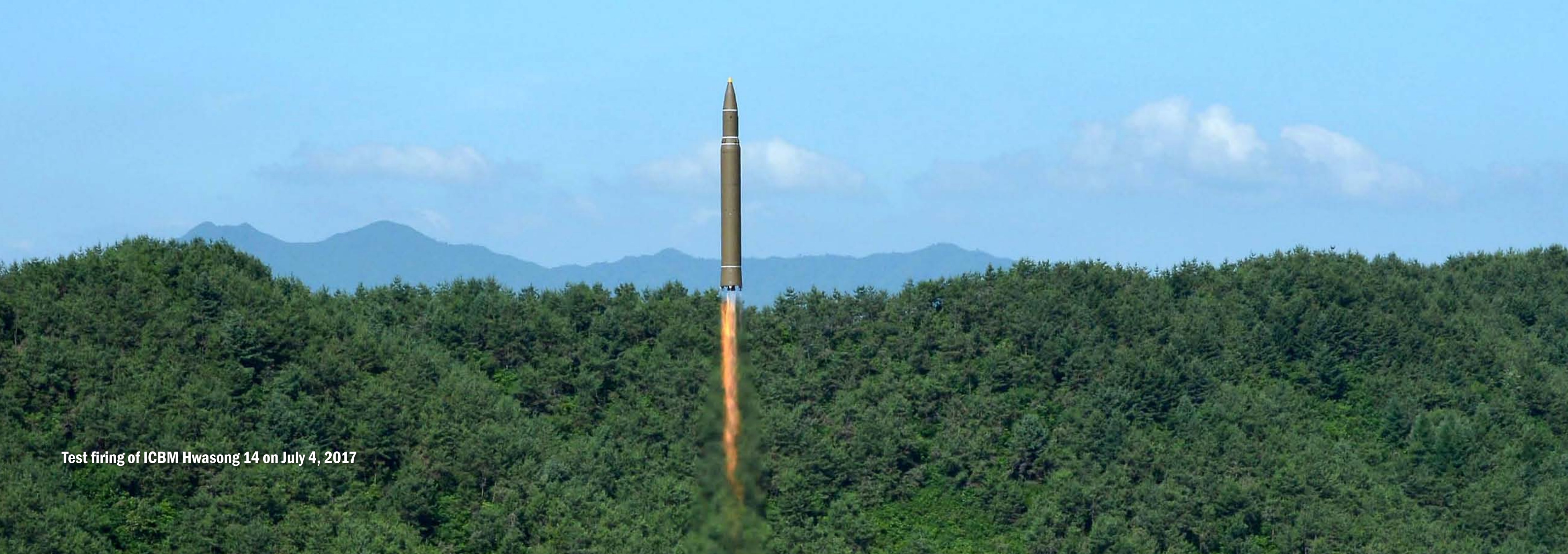
Test firing of ICBM Hwasong 14 on July 4, 2017