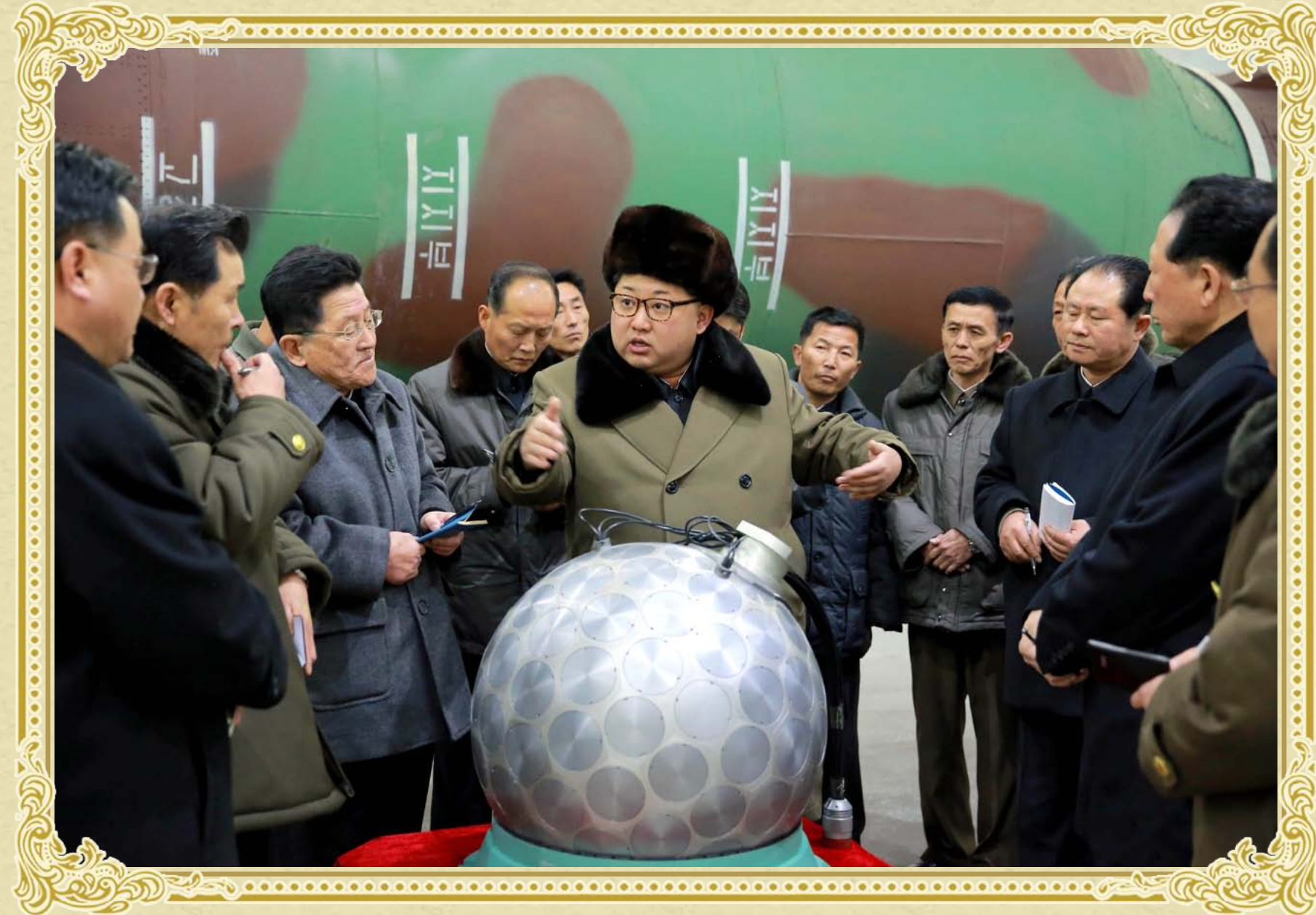
Kim Jong Un guiding the manufacturing of nuclear weapons in March 2016