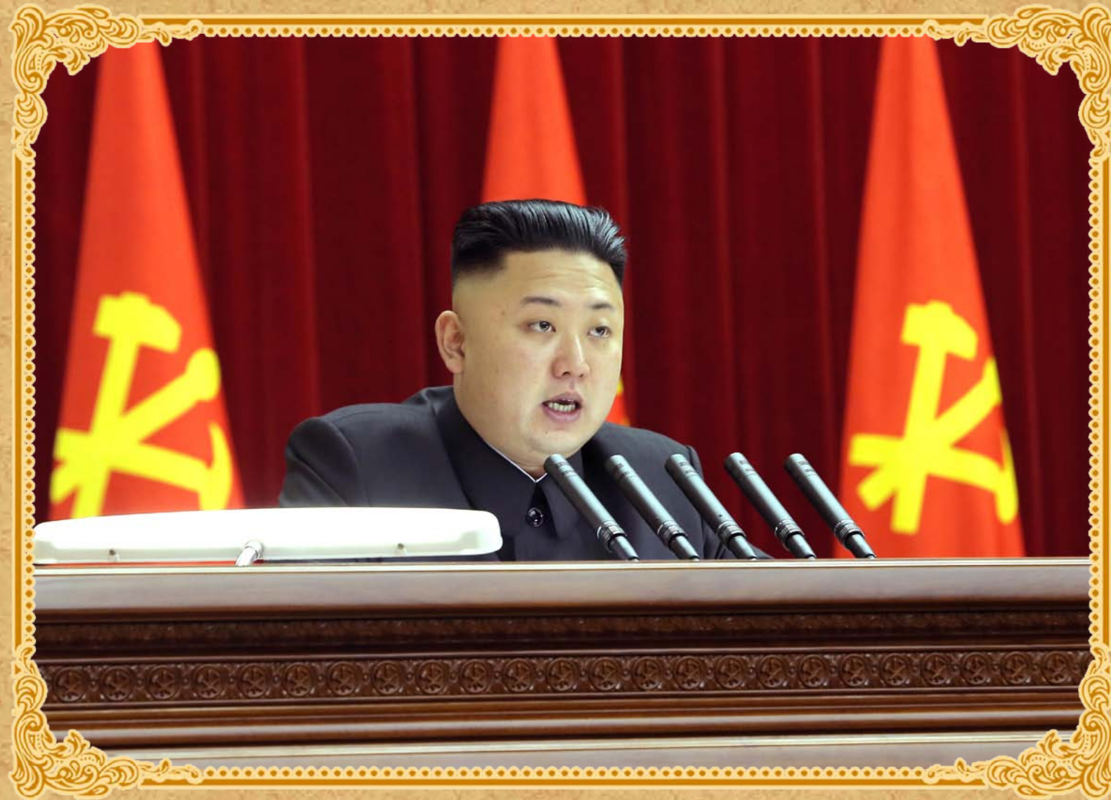
Kim Jong Un putting forth the line of simultaneously promoting economic construction and the upbuilding of the nuclear forces at the Plenary Meeting of the Central Committee of the WPK in March 2013