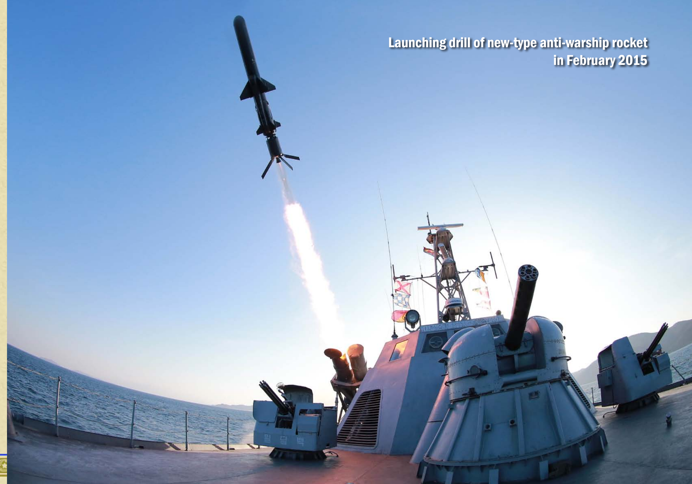
Launching drill of new-type anti-warship rocket in February 2015