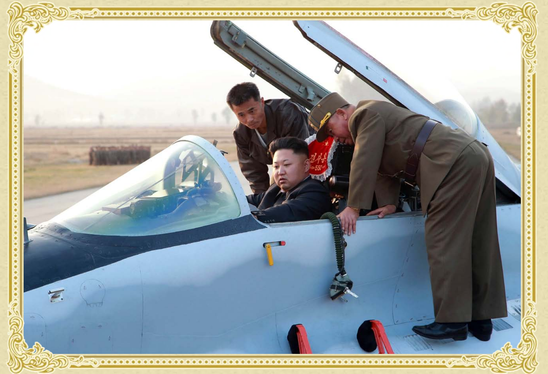
Kim Jong Un guiding the inspection flight drill of combat pilots of the Air and Anti-Aircraft Force of the KPA in October 2014