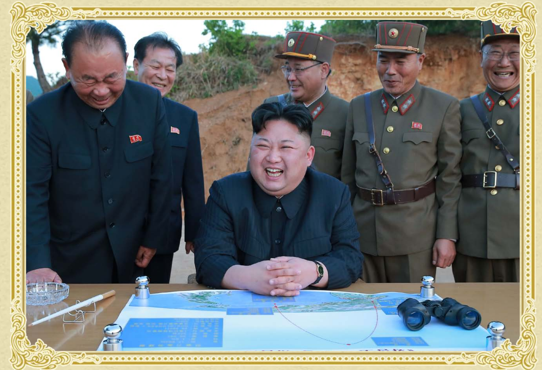
Kim Jong Un overseeing a firing test of ground-to-ground intermediate-range strategic ballistic rocket Hwasong 12 in May 2017