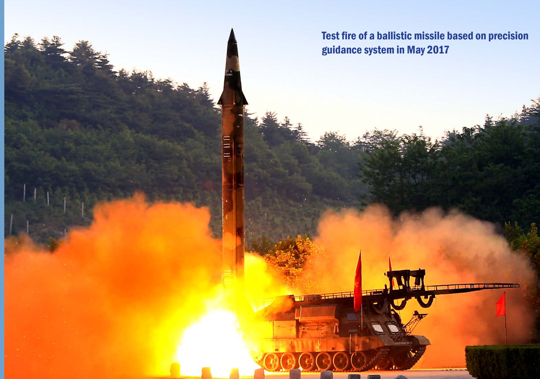
Test fire of a ballistic missile based on precision guidance system in May 2017