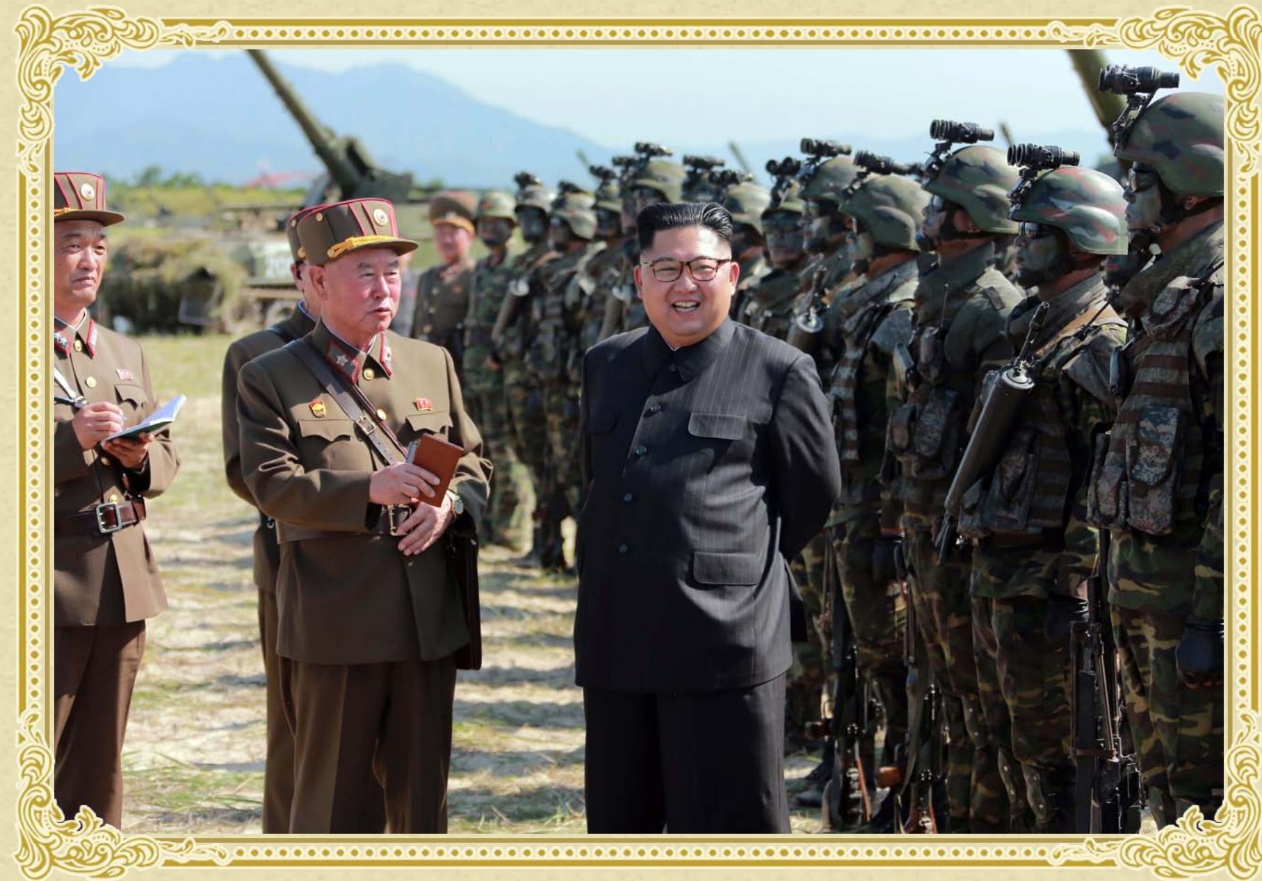
Kim Jong Un guiding the striking contest of KPA commando units to secure an island in August 2017