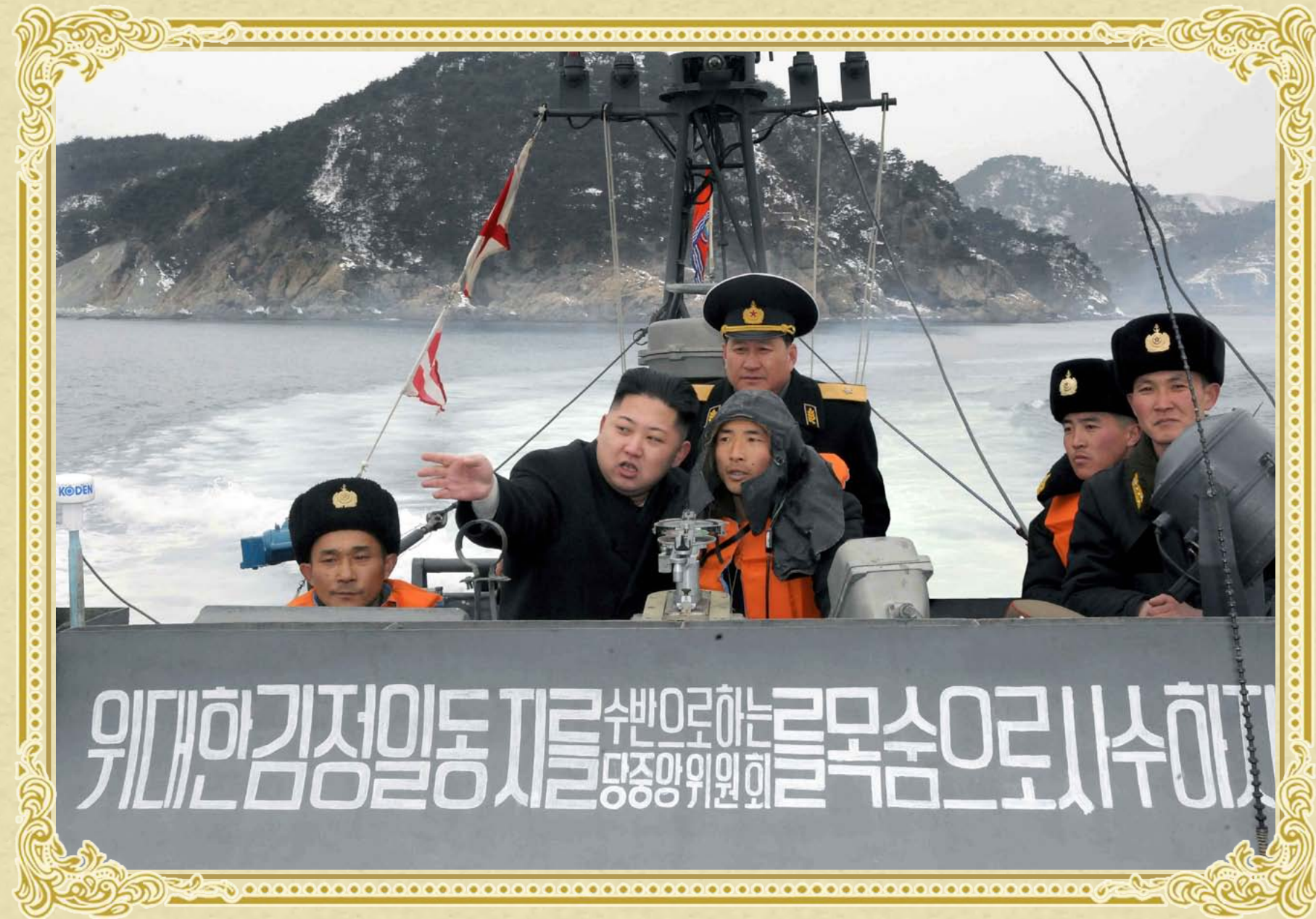
Kim Jong Un guiding a tactical training of the KPA sailors in February 2012