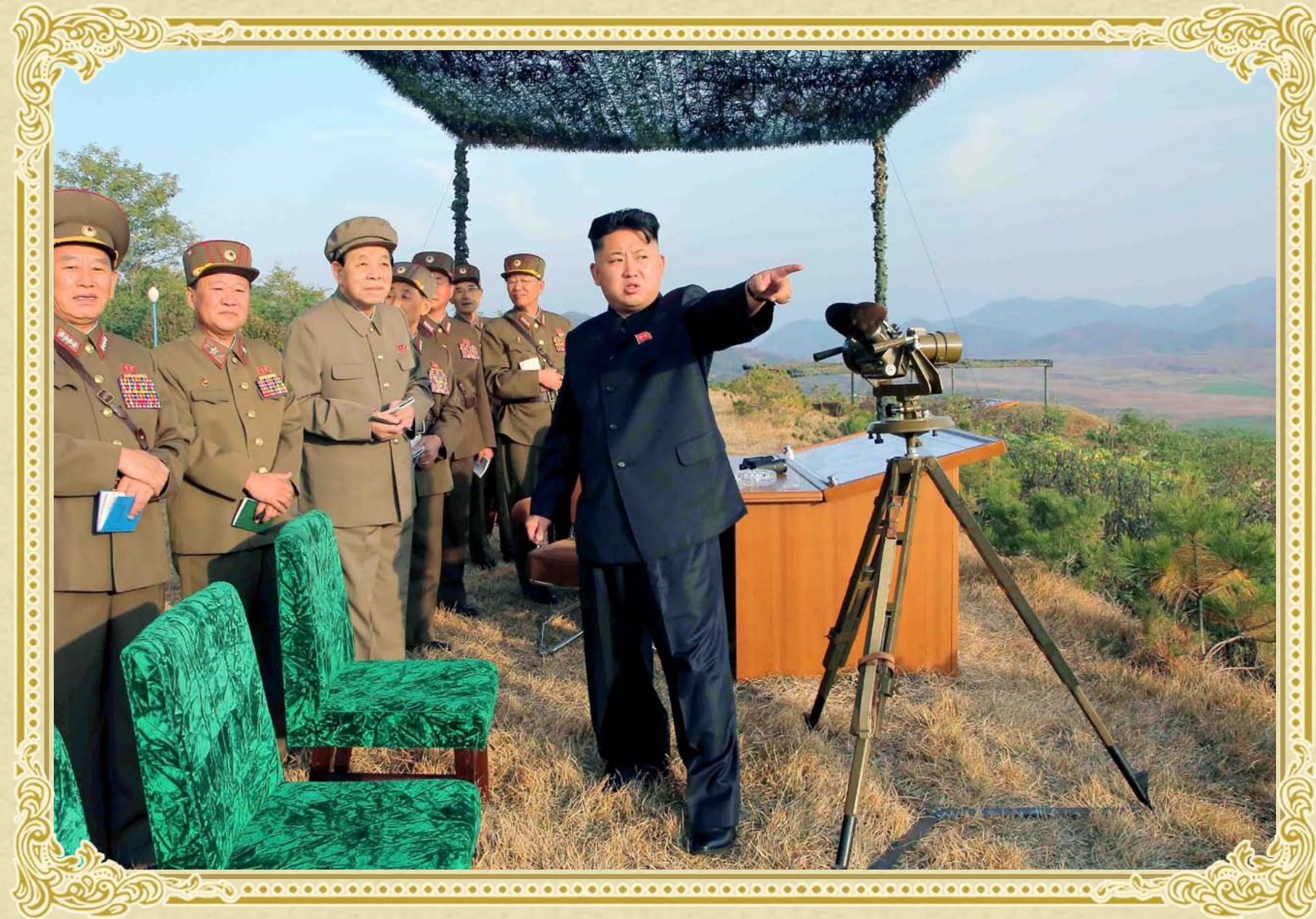
Kim Jong Un inspecting a fire strike drill of the KPA in October 2013