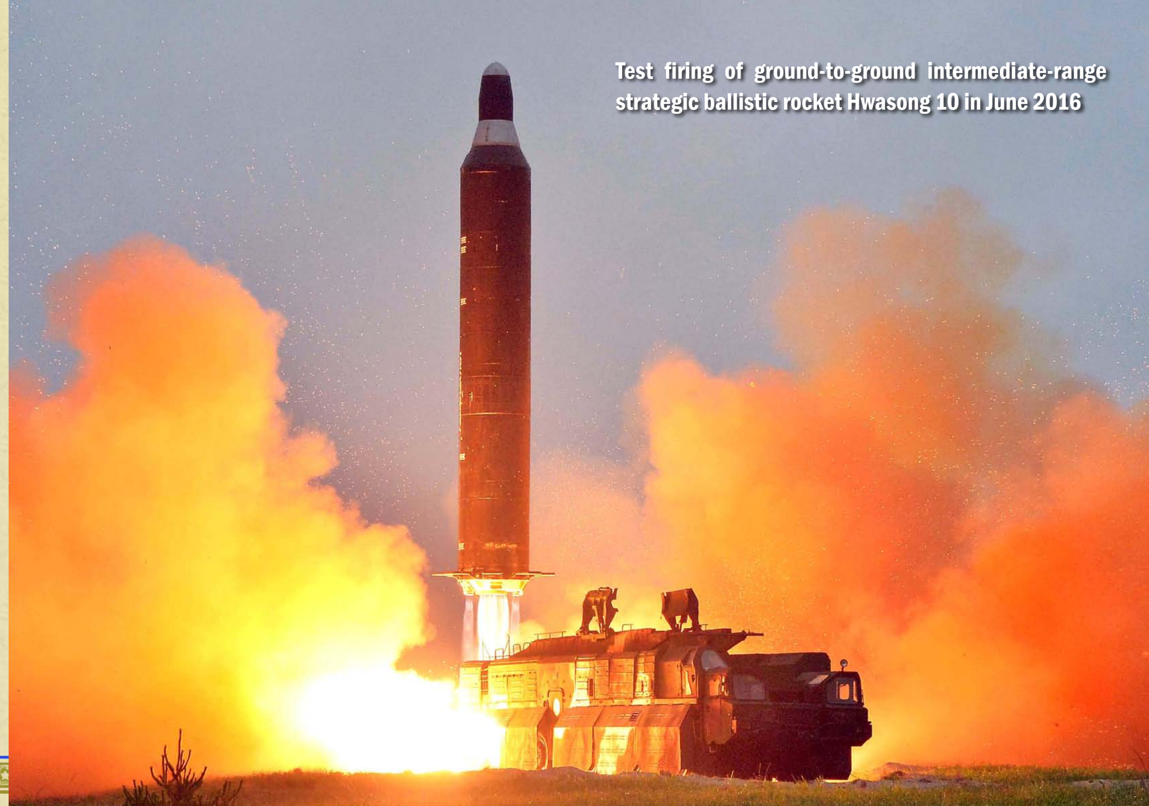
Test firing of ground-to-ground intermediate-range strategic ballistic rocket Hwasong 10 in June 2016