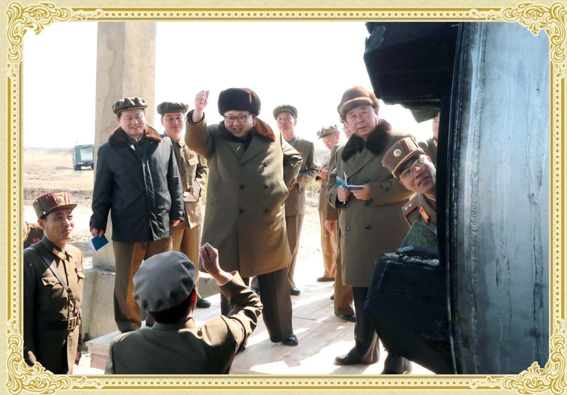
Kim Jong Un guiding a static firing test and stage separation test of a high-thrust solid-propellant rocket motor in March 2016