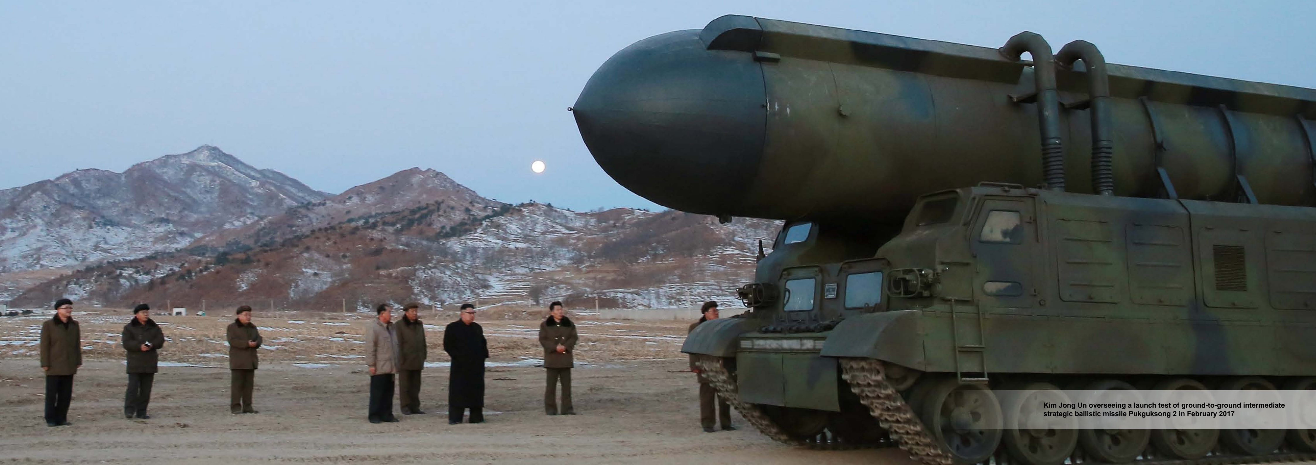
Kim Jong Un overseeing a launch test of ground-to-ground intermediate strategic ballistic missile Pukguksong 2 in February 2017