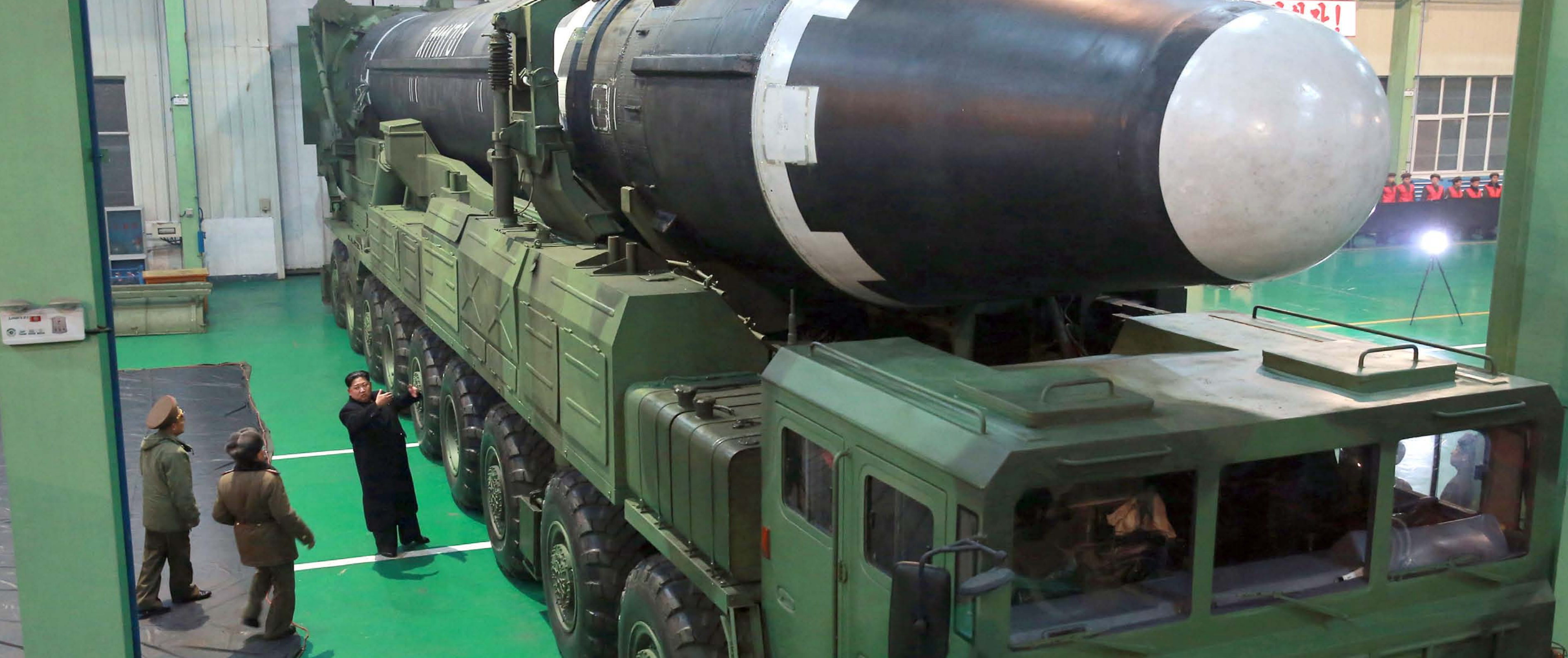
Kim Jong Un overseeing a test launch of ICBM Hwasong 15 in November 2017