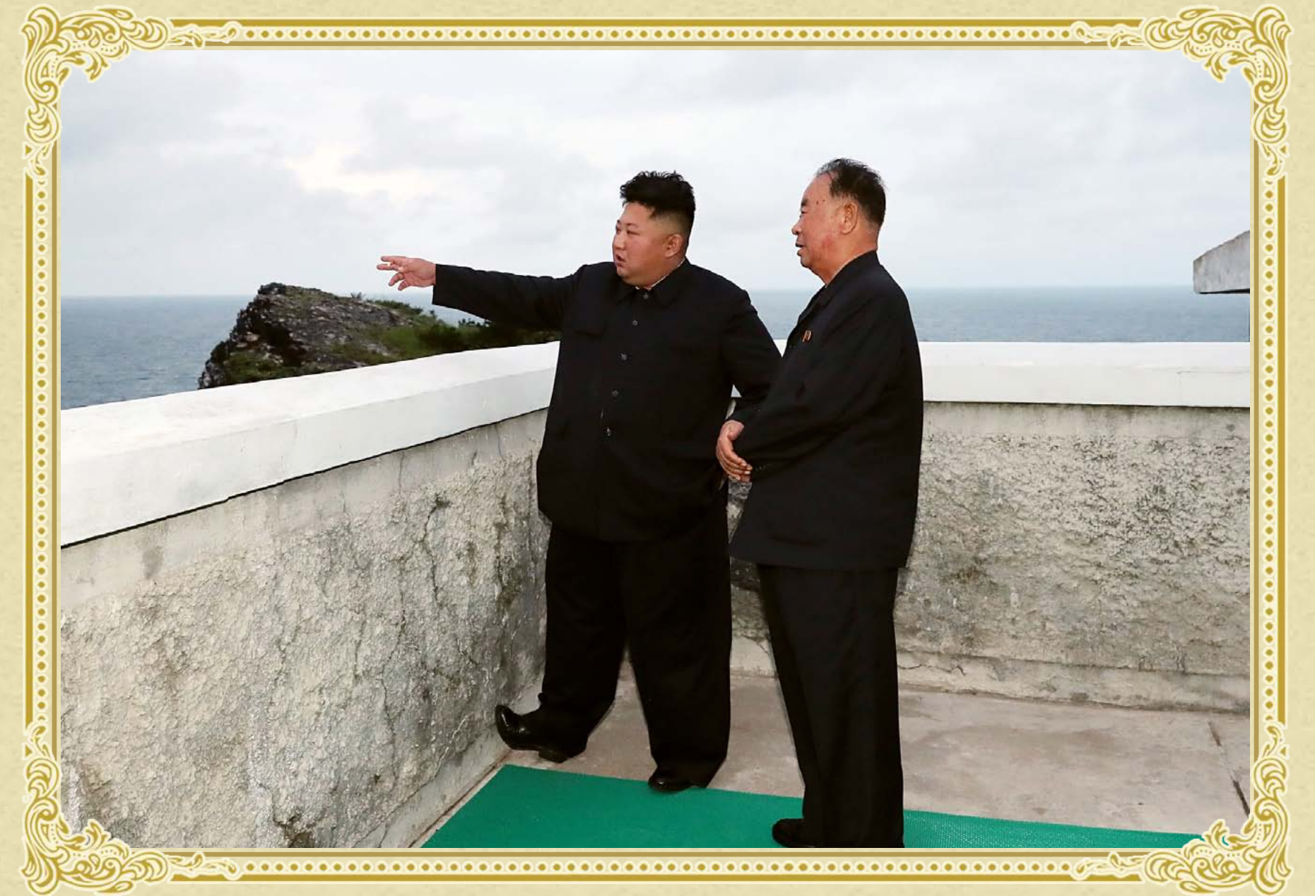
Kim Jong Un guiding a test fire of a new weapon in August 2019