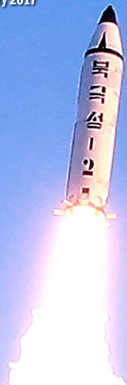
Launch test of ground-to-ground intermediate strategic ballistic missile Pukguksong 2 in February 2017