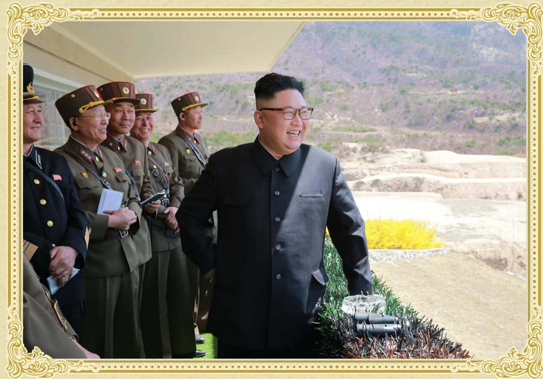
Kim Jong Un guiding the KPA Commando Units' Parachuting and Striking Contest-2017 in April 2017