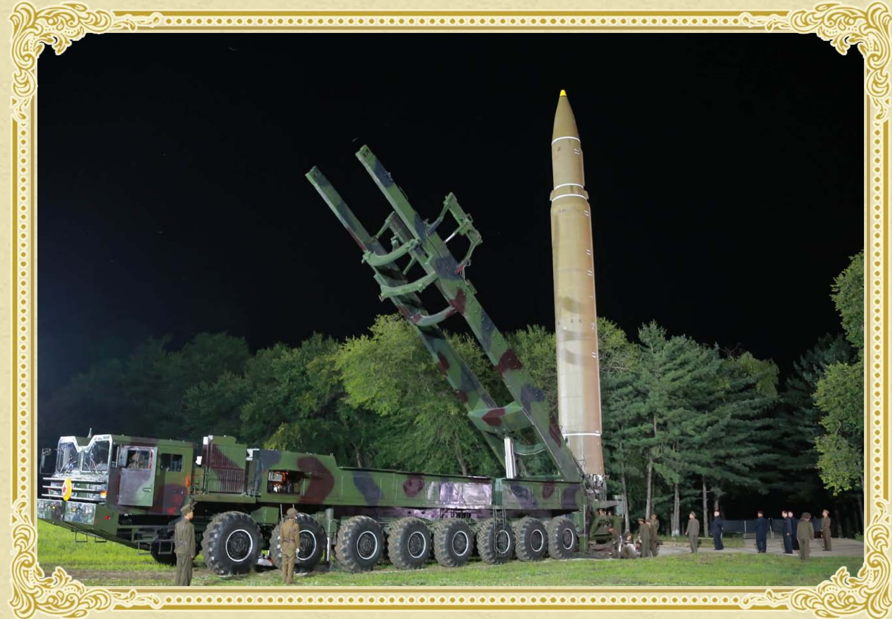
Kim Jong Un inspecting a second test firing of ICBM Hwasong 14 in July 2017