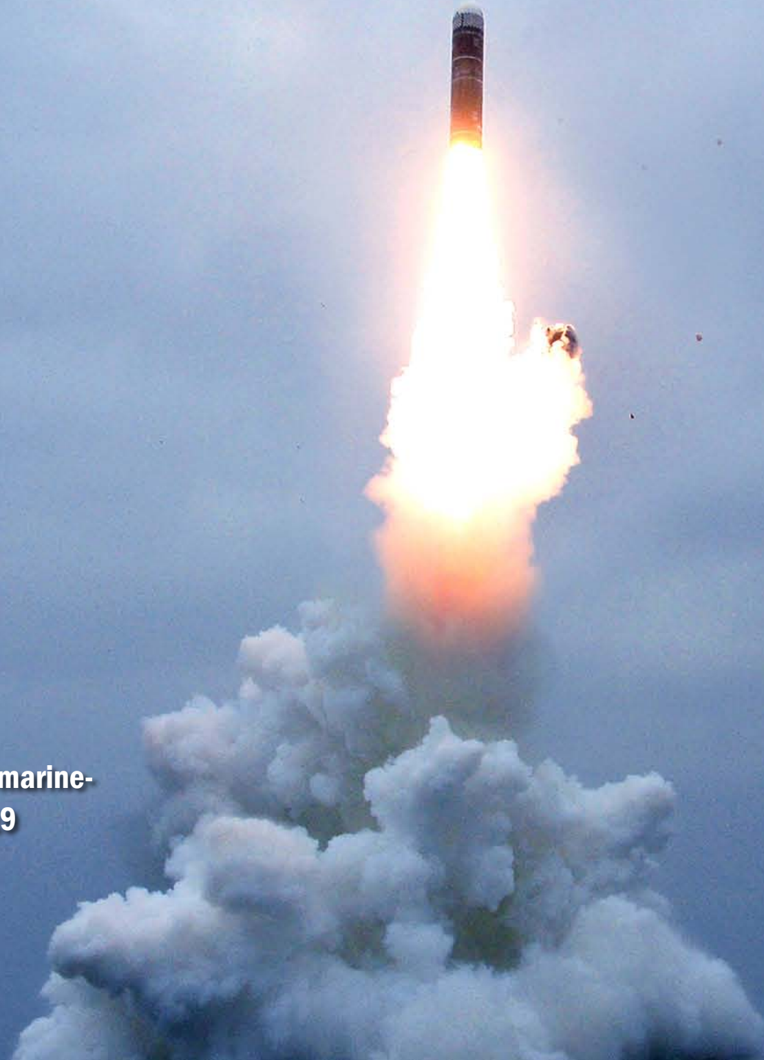
Test firing of Pukguksong 3, new-type submarine-launched ballistic missile, in October 2019