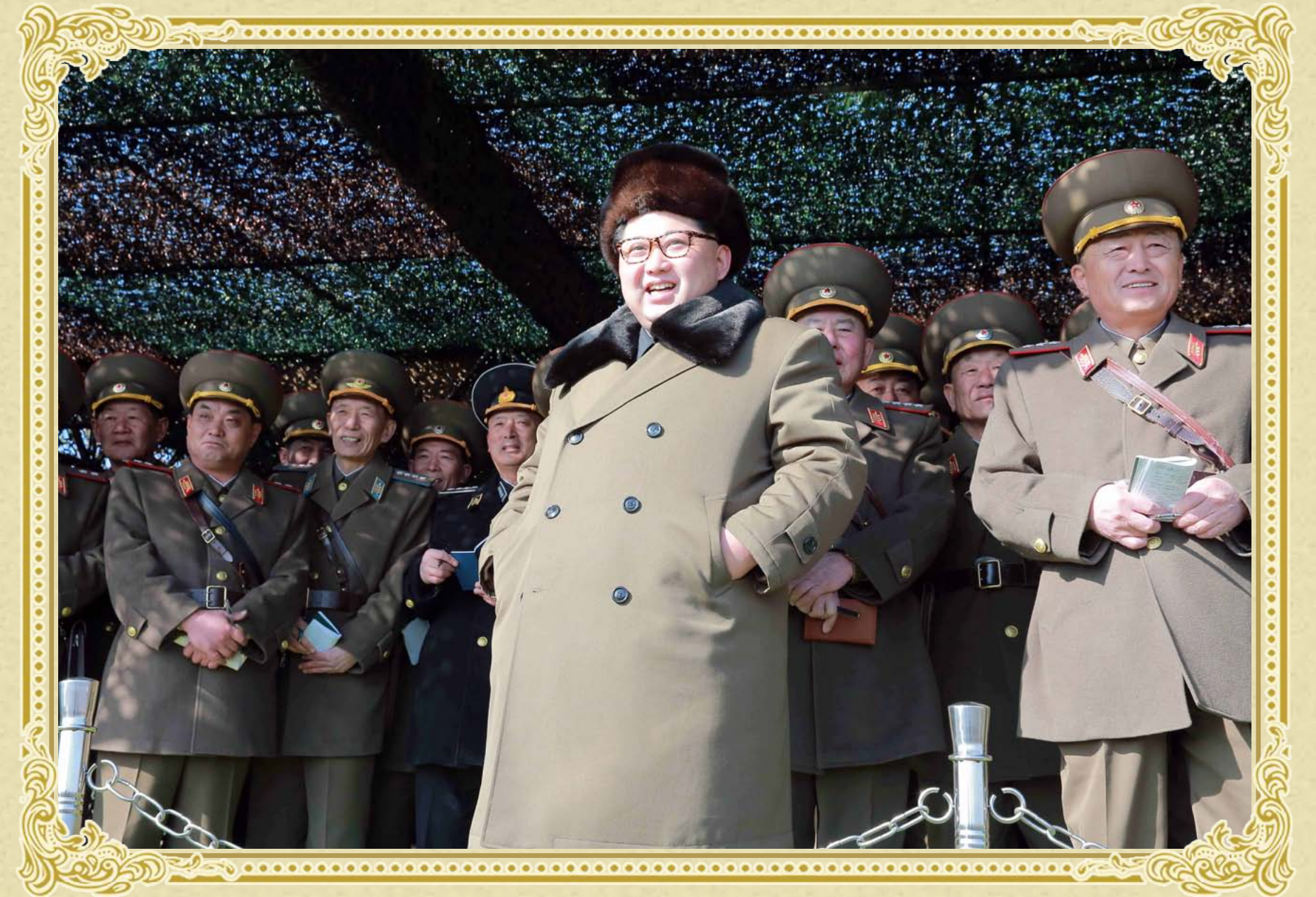
Kim Jong Un inspecting the Korean People's Army Tankmen's Competition-2016 in March 2016