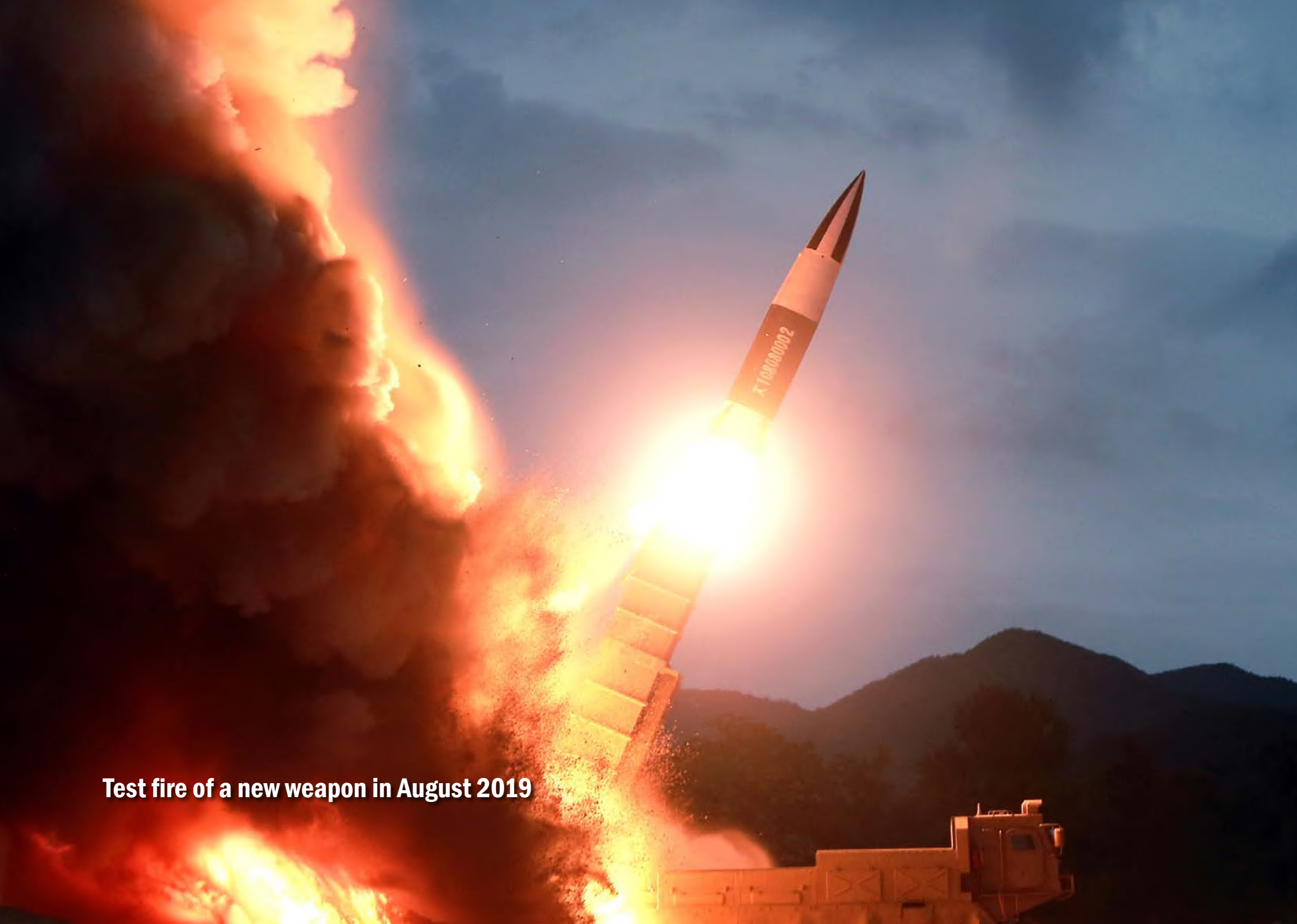
Test fire of a new weapon in August 2019