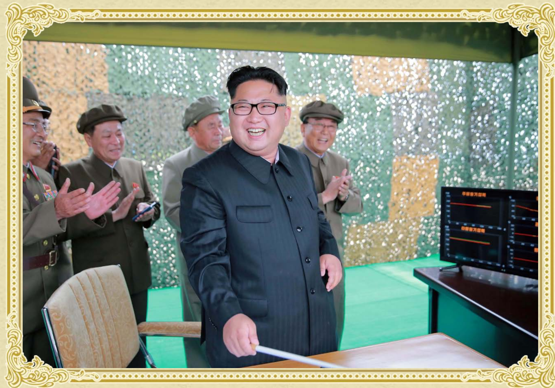
Kim Jong Un overseeing a firing test of ground-to-ground intermediate-range strategic ballistic rocket Hwasong 10 in June 2016