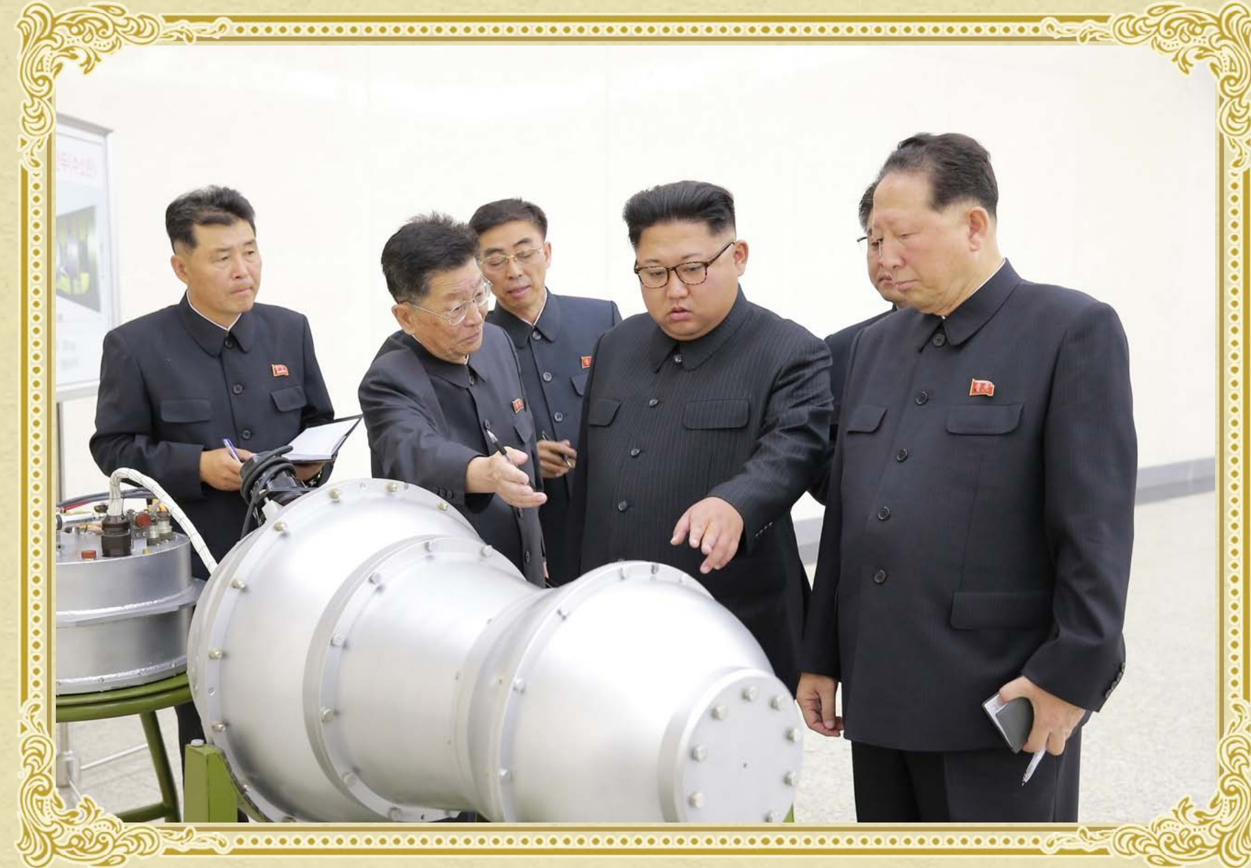
Kim Jong Un seeing an H-bomb to be loaded onto the warhead of ICBM in August 2017