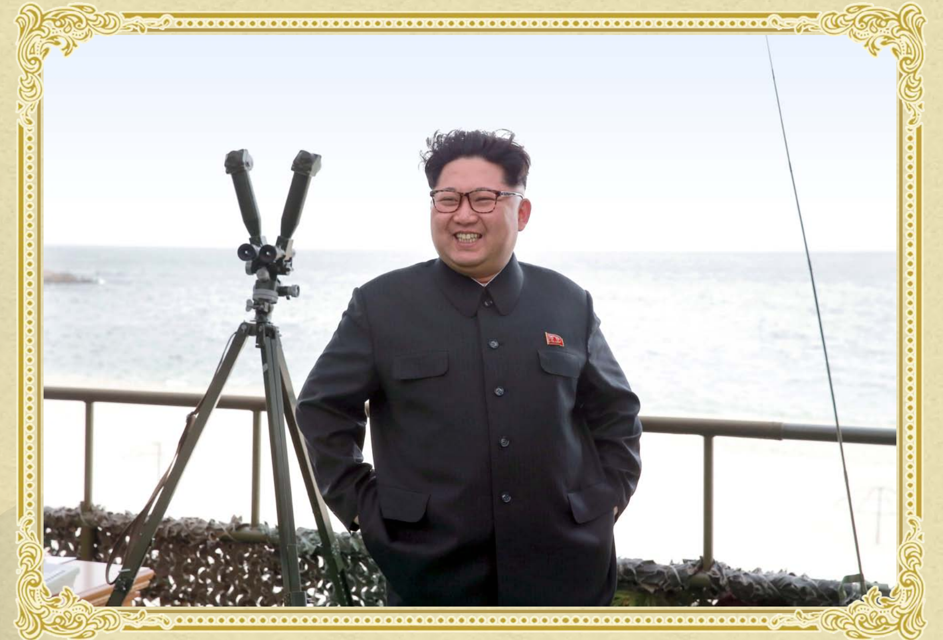
Kim Jong Un inspecting underwater launch test of ballistic missile from a strategic submarine in April 2016