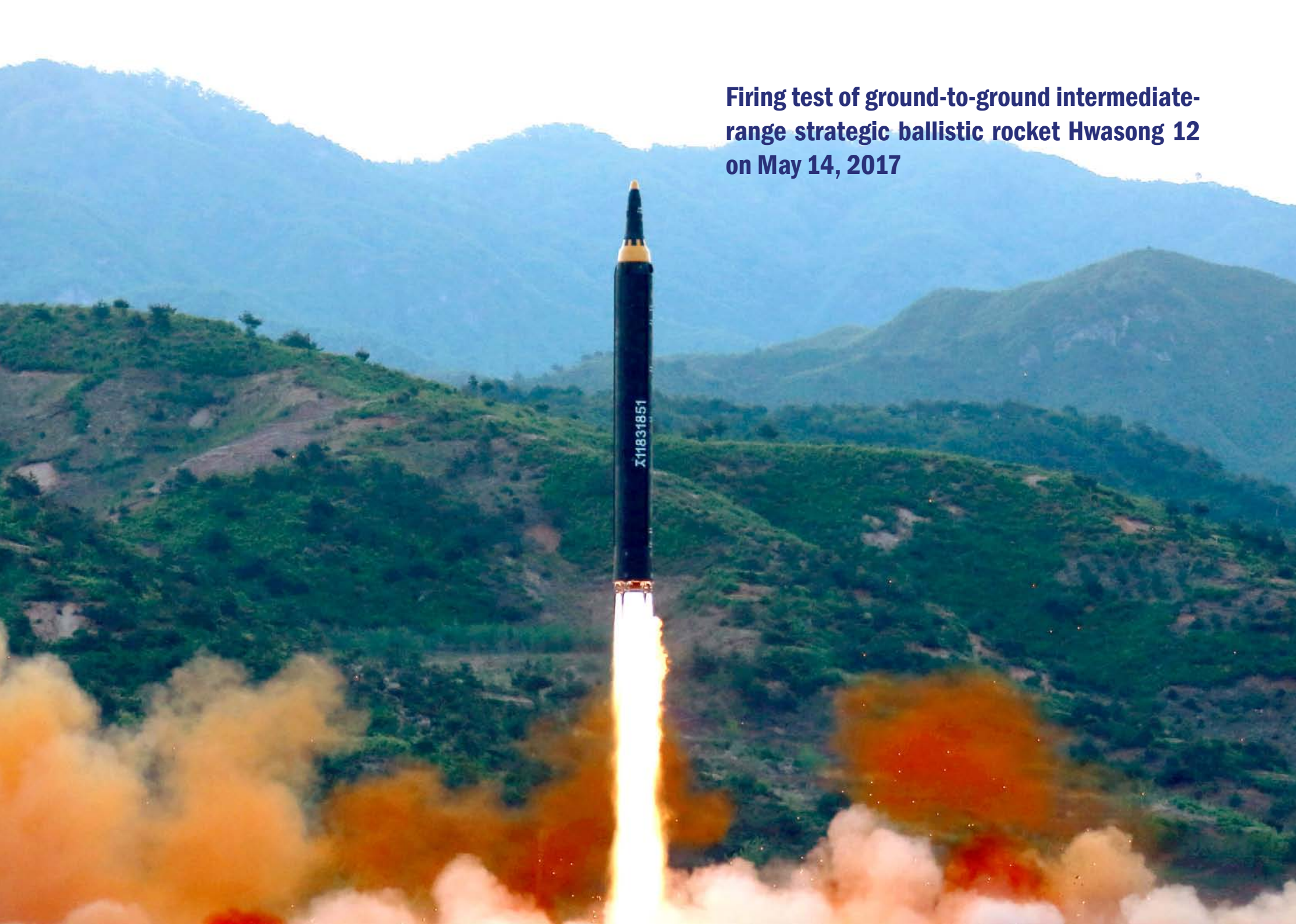
Firing test of ground-to-ground intermediate-range strategic ballistic rocket Hwasong 12 on May 14, 2017