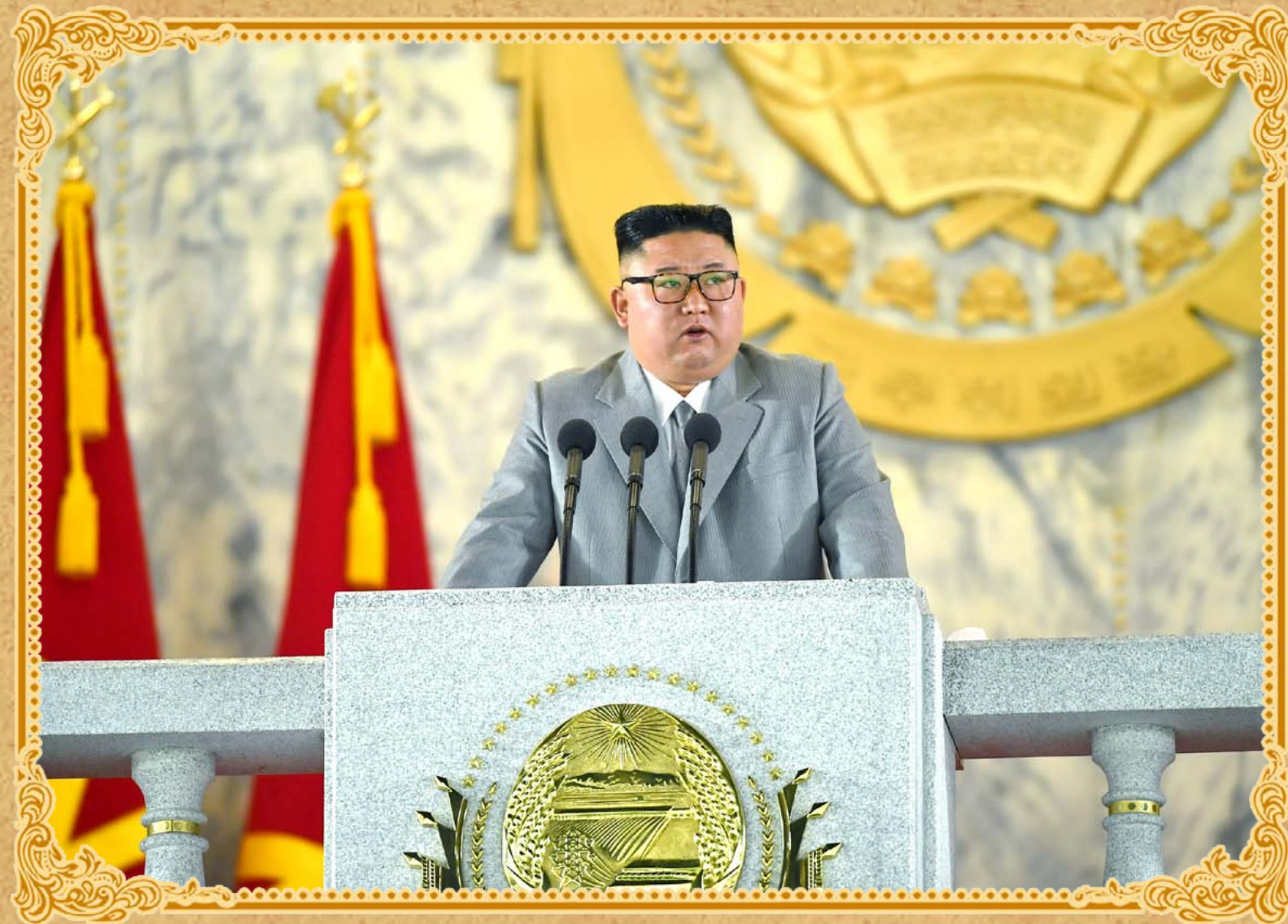
Kim Jong Un delivering a speech at the military parade held in celebration of the 75th anniversary of the founding of the Workers' Party of Korea in October 2020