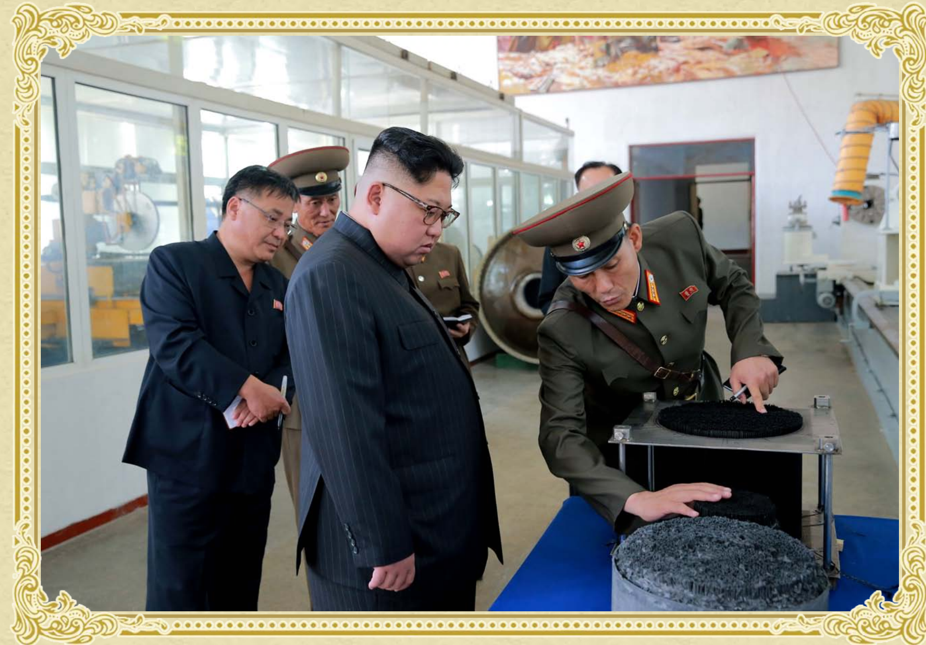
Kim Jong Un giving field guidance at the Chemical Material Institute of the Academy of Defence Science in August 2017