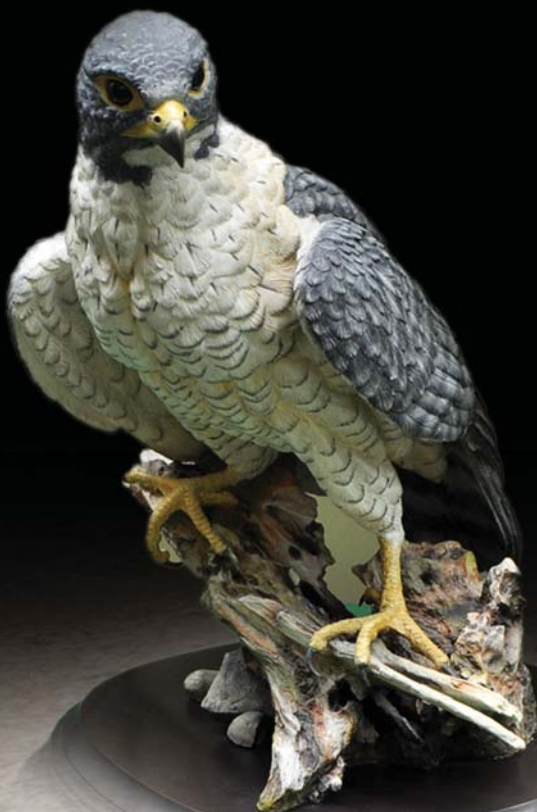
Plastic work “Hawk” From Operations Manager (Egyptian) in charge of projects of Bayan National Trading Co.W. L. L., Kuwait January 2014