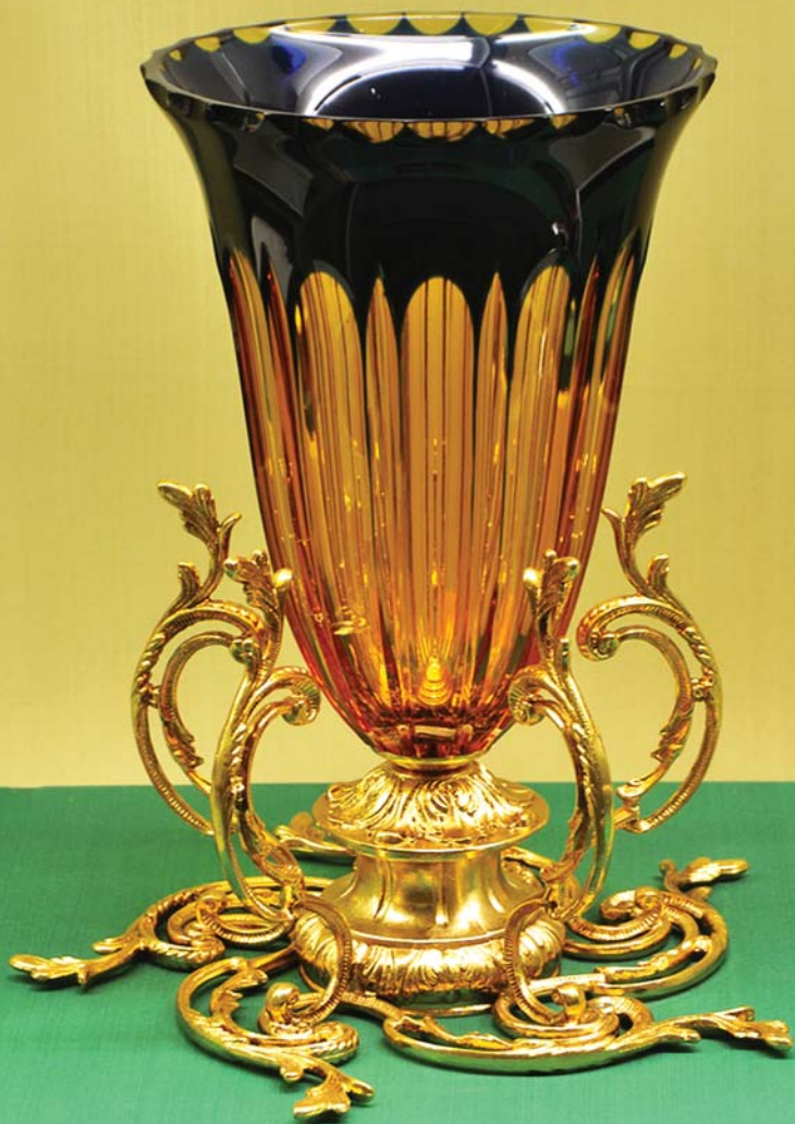
Crystal vase From General Manager (Egyptian) of the Arab Contractors Company, Kuwait January 2013