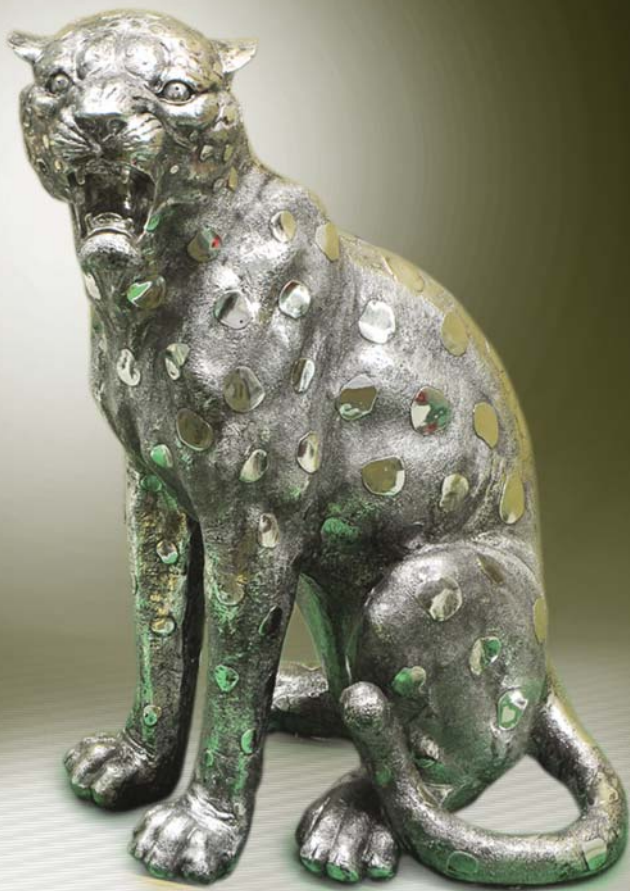
Silver-plated work “Leopard” From Chairman of the South African group for the study of Kimilsungism-Kimjongilism September 2013