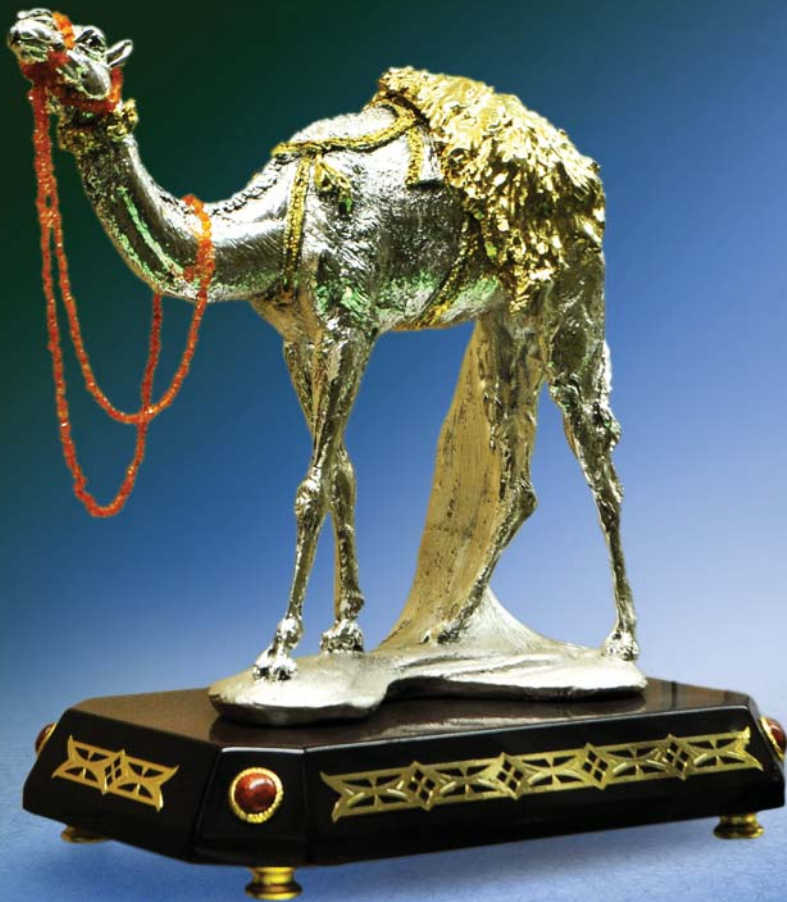
Gold- and silver-plated work “Camel” From General Manager (Indian) of United Operational General Trading Company, Kuwait December 2010