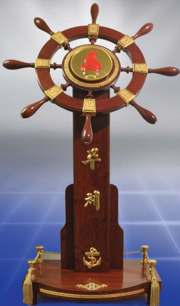
Craftwork “Helm of Juche” From Yingkou Sanhua Group in Liaoning Province, China December 2012