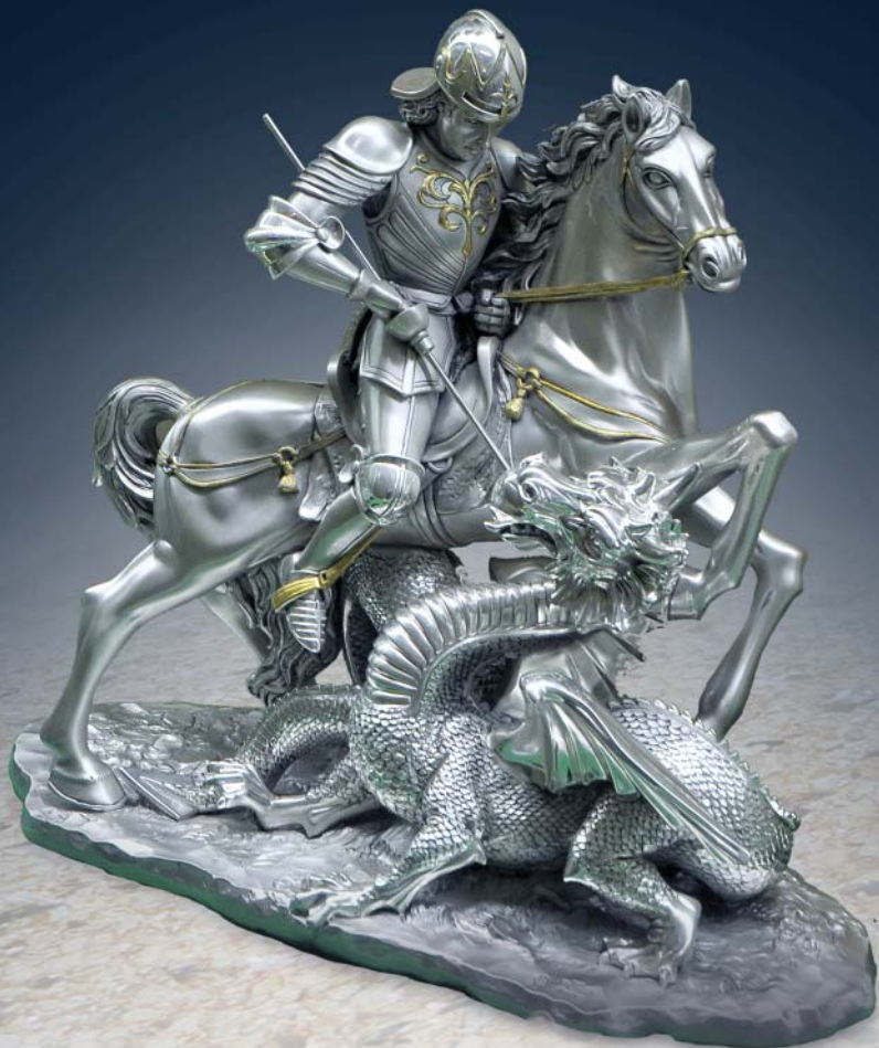
Silver-plated work “St. George the Victorious” From Managing Director of Masterstroy Dewe Co. Ltd., Russia January 2013