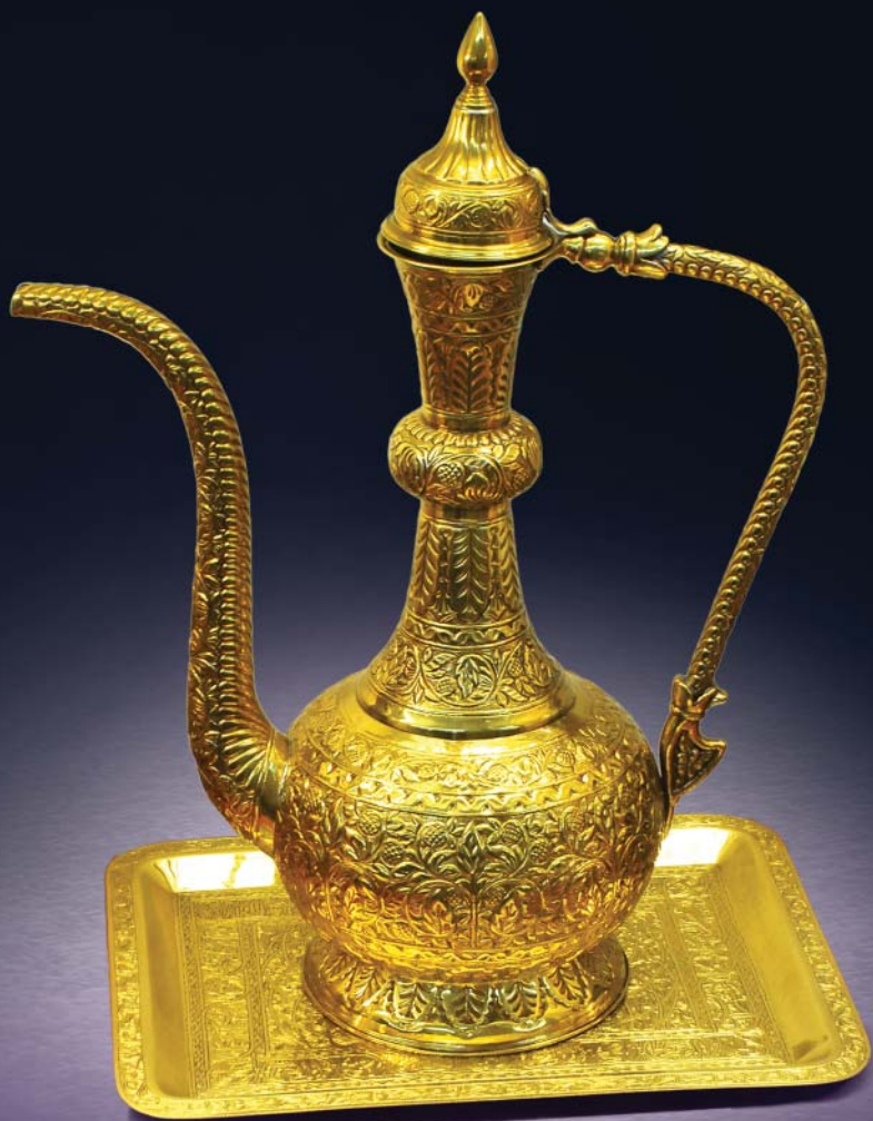
Bronze kettle and tray From President Muhammad Hosni Mubarak of the Arab Republic of Egypt April 1982