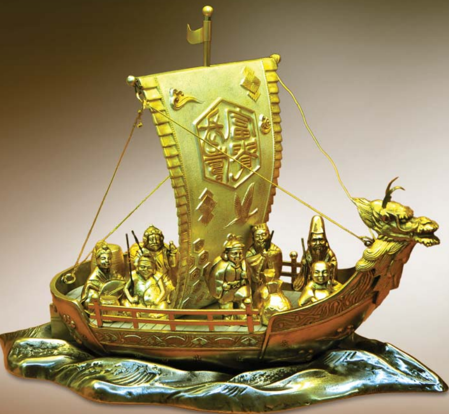
Craftwork “Ship of Seven Blessings” From the delegation of the Teachers’ Union, Japan December 1976