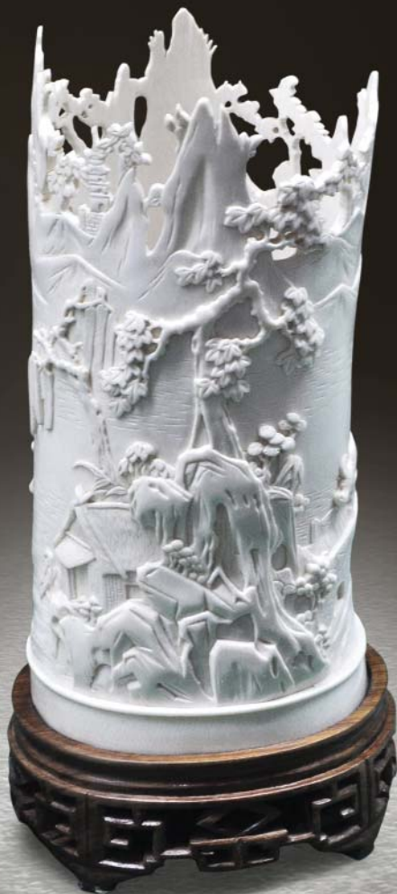
Ivory table lamp From the head of the government economic delegation of the Democratic Republic of Vietnam January 1966