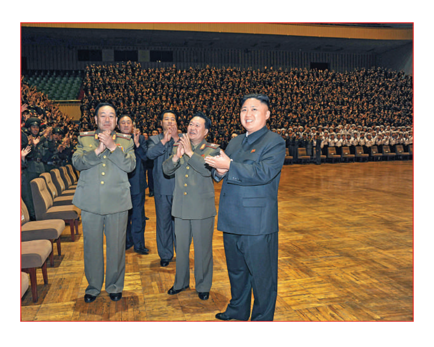
Kim Jong Un with the participants in the Youth Day Celebration Conference (August 2012)