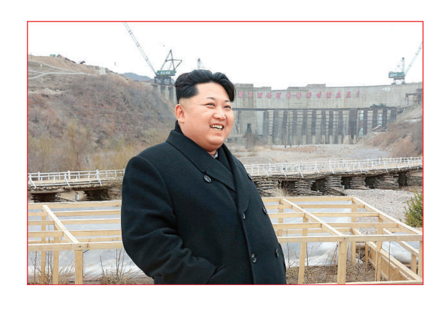
Kim Jong Un giving a field guidance at the construction site of the then Paektusan Songun Youth Power Station (April 2015)