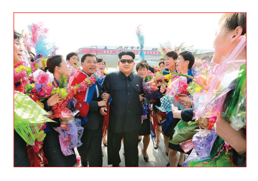
Kim Jong Un greeting at the airport the women footballers who won the 2015 EAFF Women's East Asian Cup (August 2015)