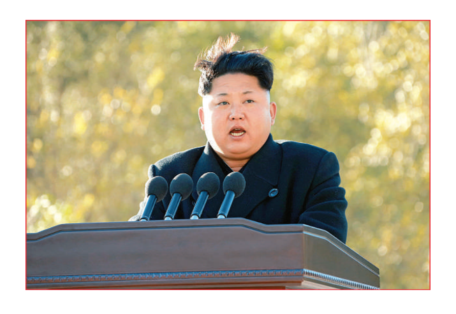
Kim Jong Un delivering a speech at the inauguration ceremony of the Paektusan Hero Youth Power Station (October 2015)