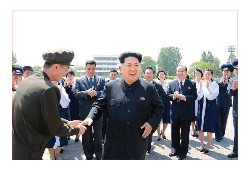
Kim Jong Un with the participants in the Second National Conference of Exemplary Young People of Virtue (May 2015)