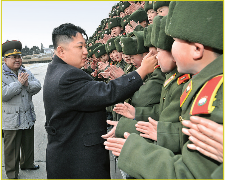
Kim Jong Un visiting Mangyongdae Revolutionary School (January 24, 2012)