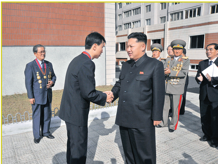
Kim Jong Un attending the inauguration ceremony of the apartment houses for the teachers of Kim Il Sung University (October 9, 2013)