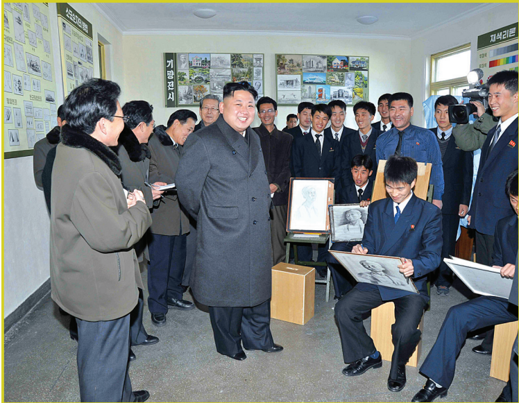
Kim Jong Un visiting Pyongyang University of Architecture (November 26, 2013)