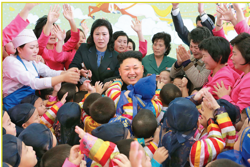
Kim Jong Un visiting the Pyongyang Baby Home (January 1, 2015)