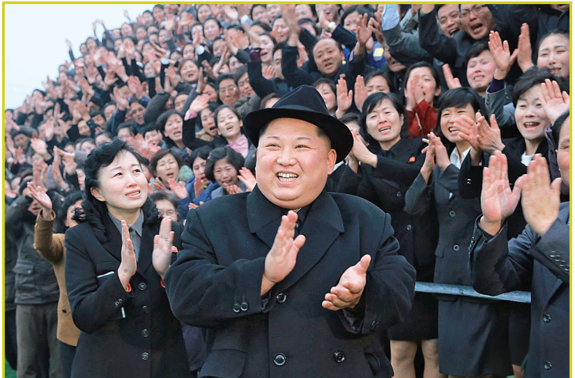
Kim Jong Un coming to pose for a photograph with the students and teachers of Pyongyang University of Education (January 16, 2018)