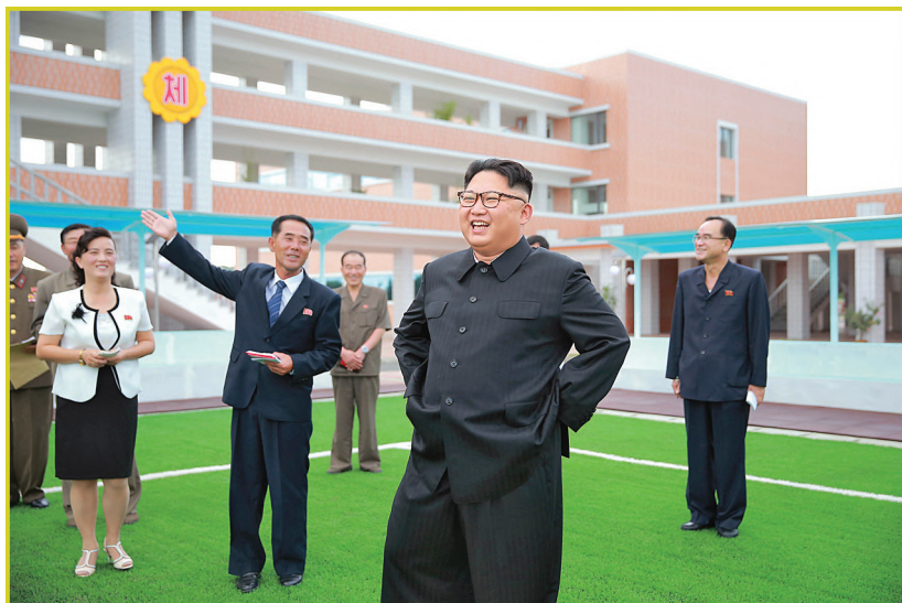
Kim Jong Un visiting Pyongyang Secondary School for Orphans (July 2, 2016)