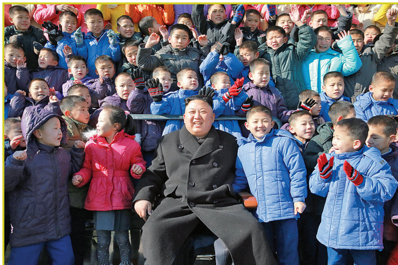
Kim Jong Un among the pupils of Pyongyang Primary School for Orphans (February 1, 2017)