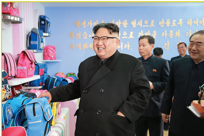
Kim Jong Un seeing the bags produced by the Pyongyang Bag Factory (January 4, 2017)