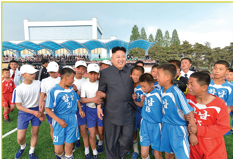
Kim Jong Un visiting the Songdowon International Children's Camp (May 2, 2014)