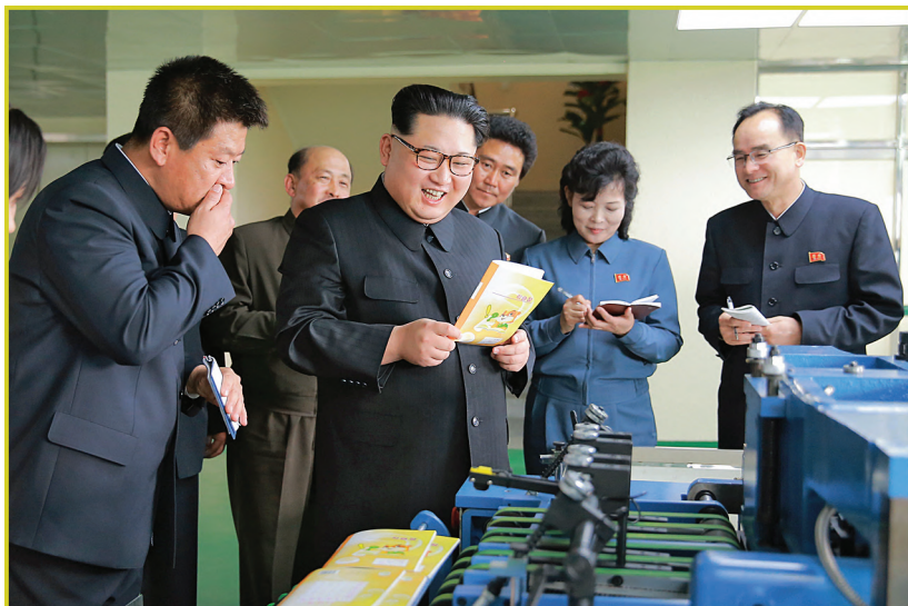
Kim Jong Un visiting the Mindulle Notebook Factory (April 18, 2016)