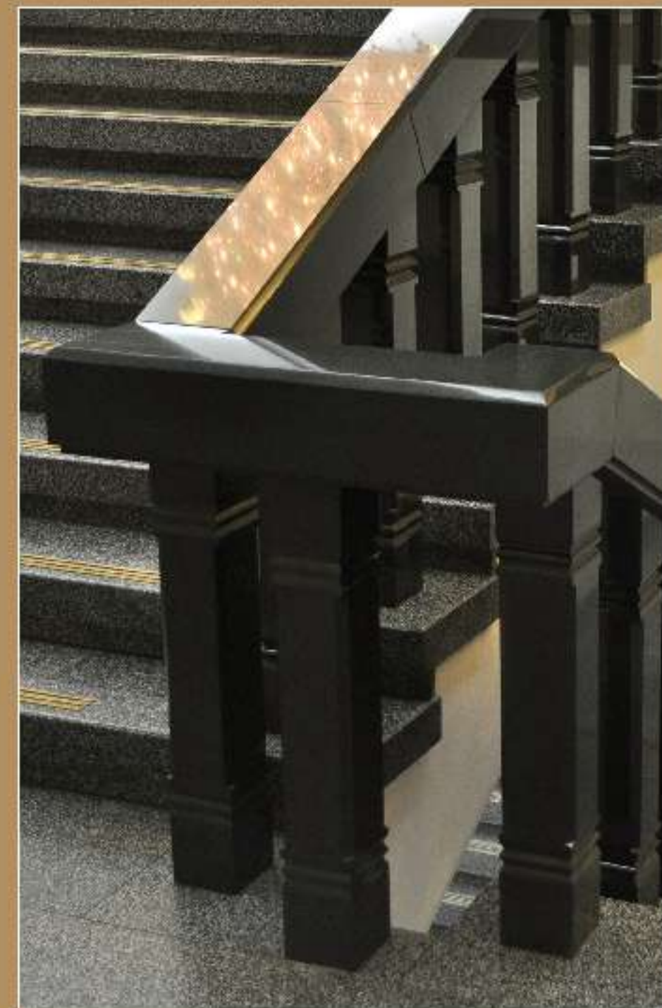
Central division and handrail of the grand staircase