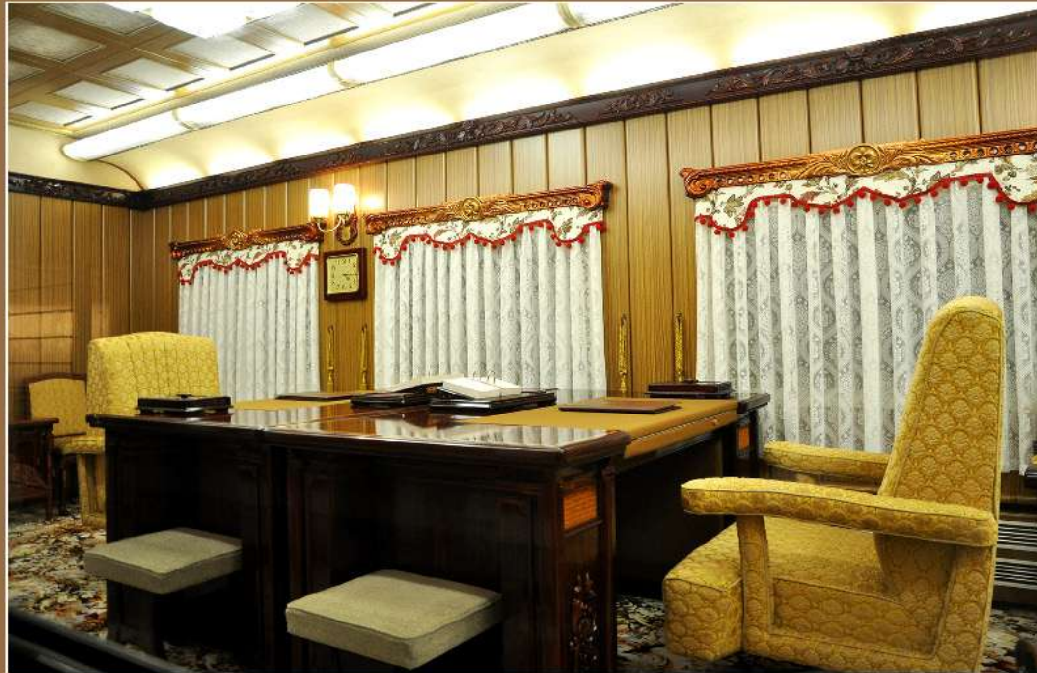
Office in the carriage used by President Kim Il Sung