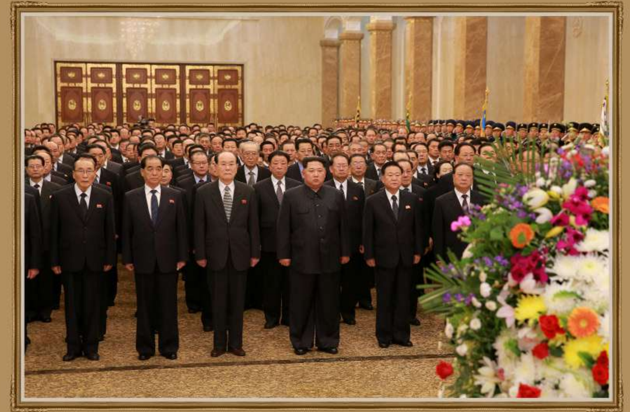
Supreme Leader Kim Jong Un, together with senior Party and government officials, pays tribute to President Kim Il Sung and Chairman Kim Jong Il in front of their statues