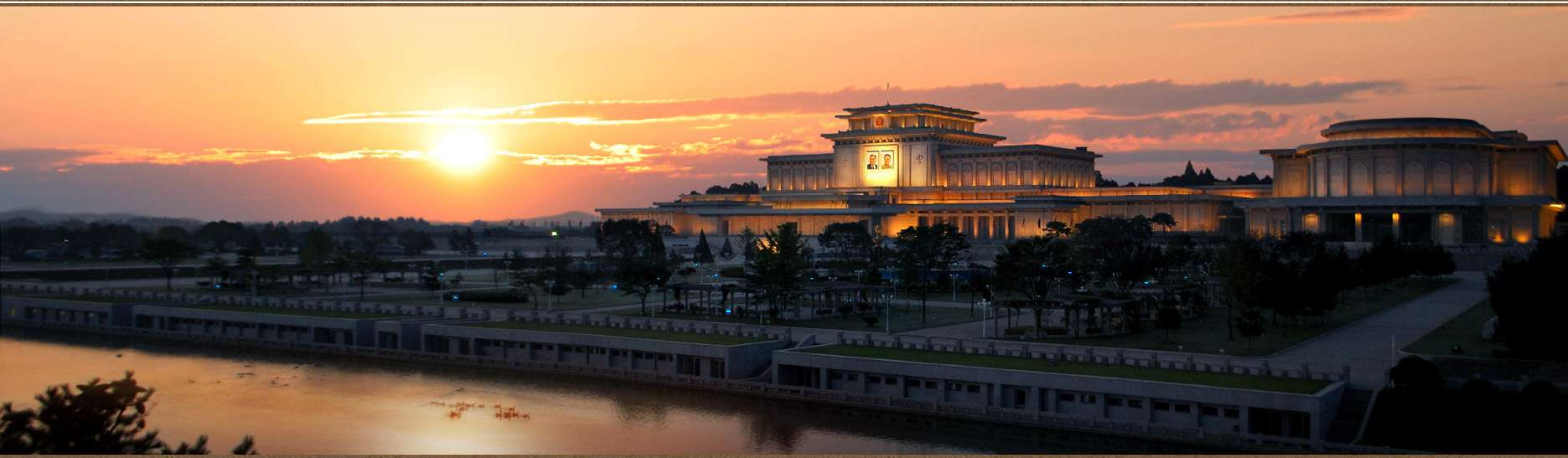
Kumsusan Palace of the Sun in the morning