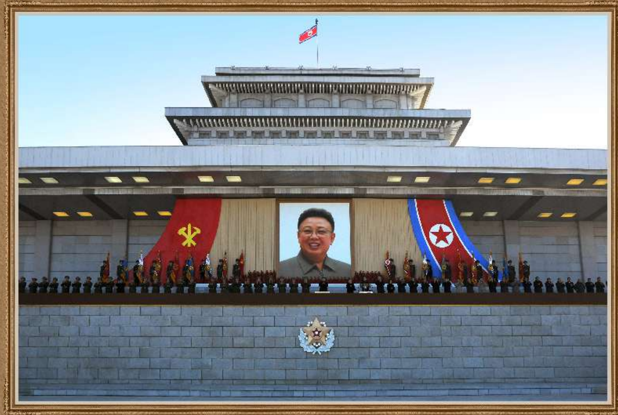
On February 16, Juche 101 (2012), at the Kumsusan Palace of the Sun Plaza, the joint resolution on renaming the Kumsusan Memorial Palace the Kumsusan Palace of the Sun has been made public, followed by a military ceremony of the ground, naval and air forces of the Korean People's Army