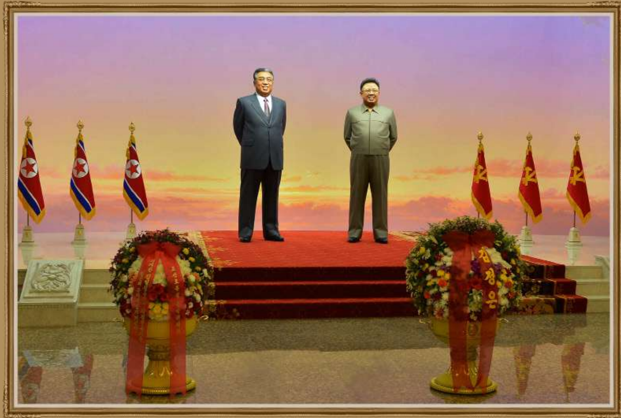
Statues of President Kim Il Sung and Chairman Kim Jong Il