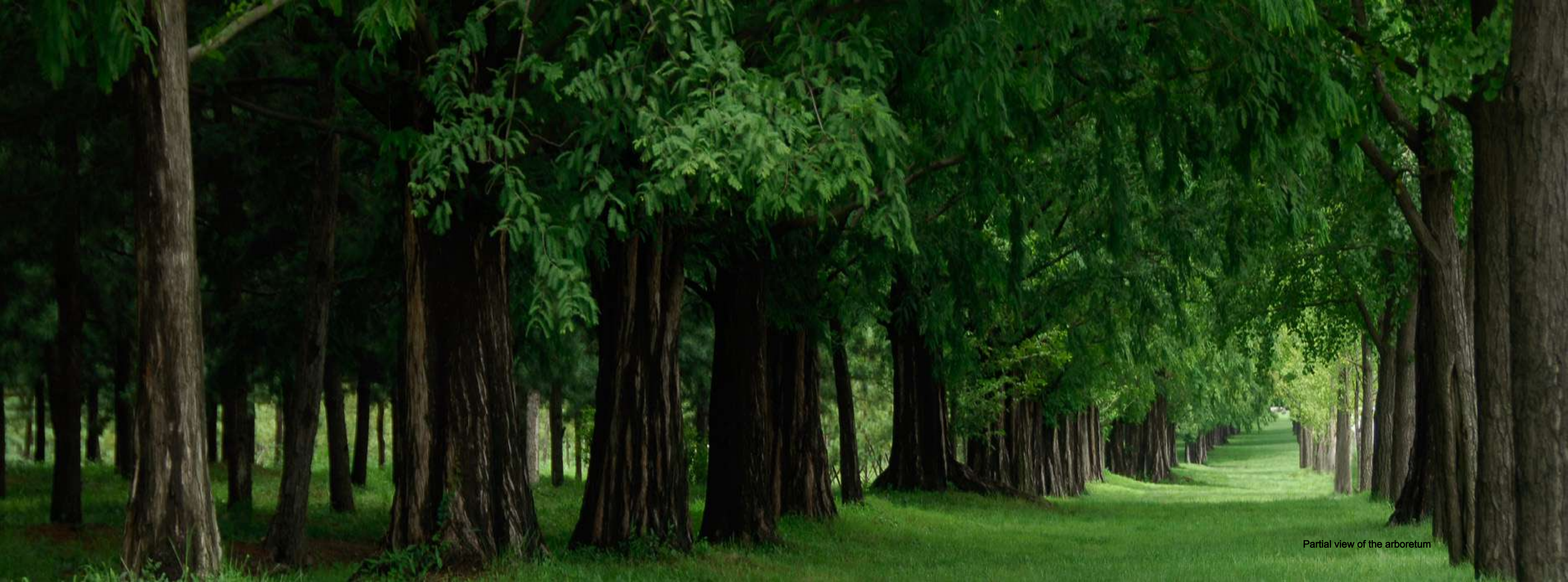
Partial view of the arboretum