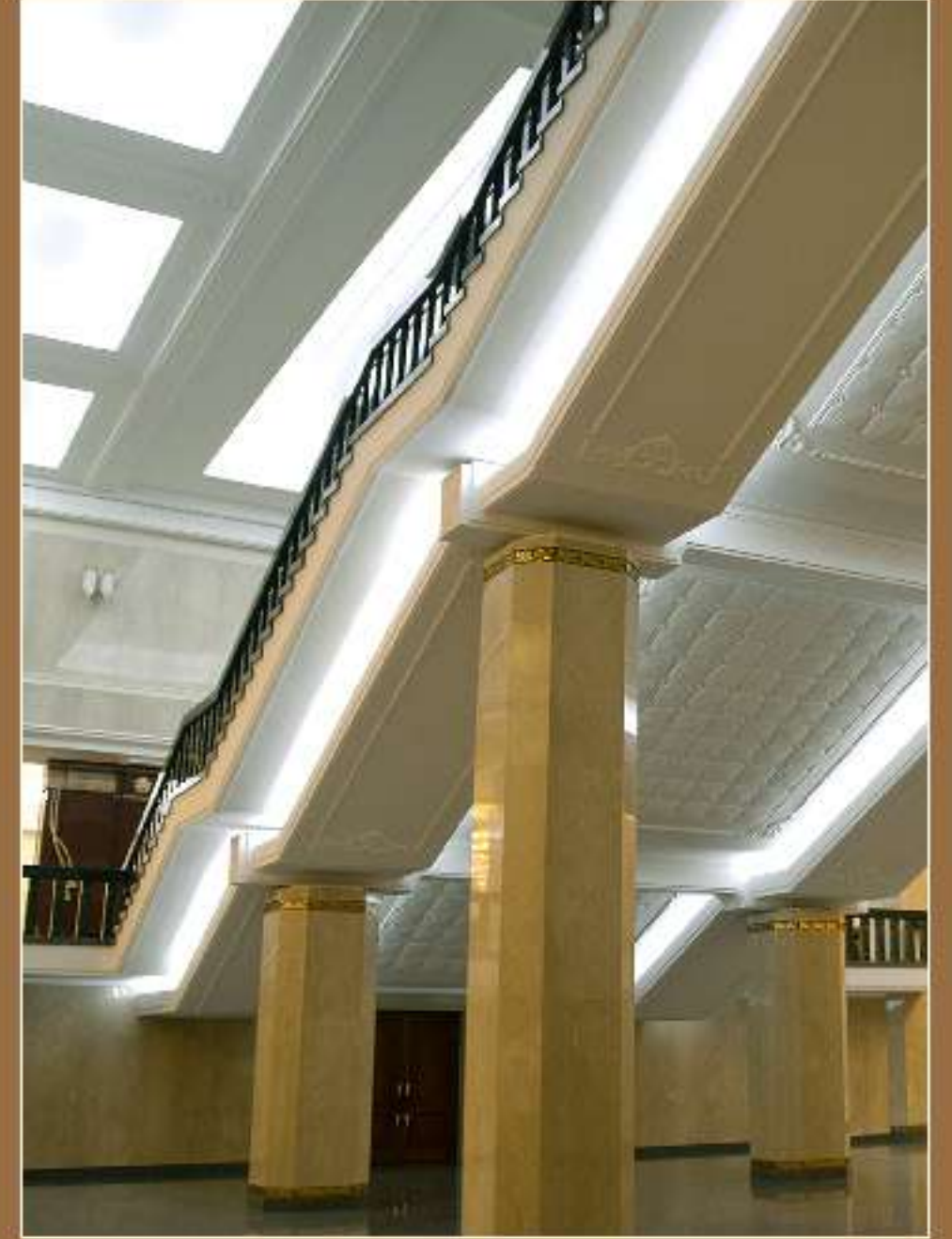
Grand staircase seen from below