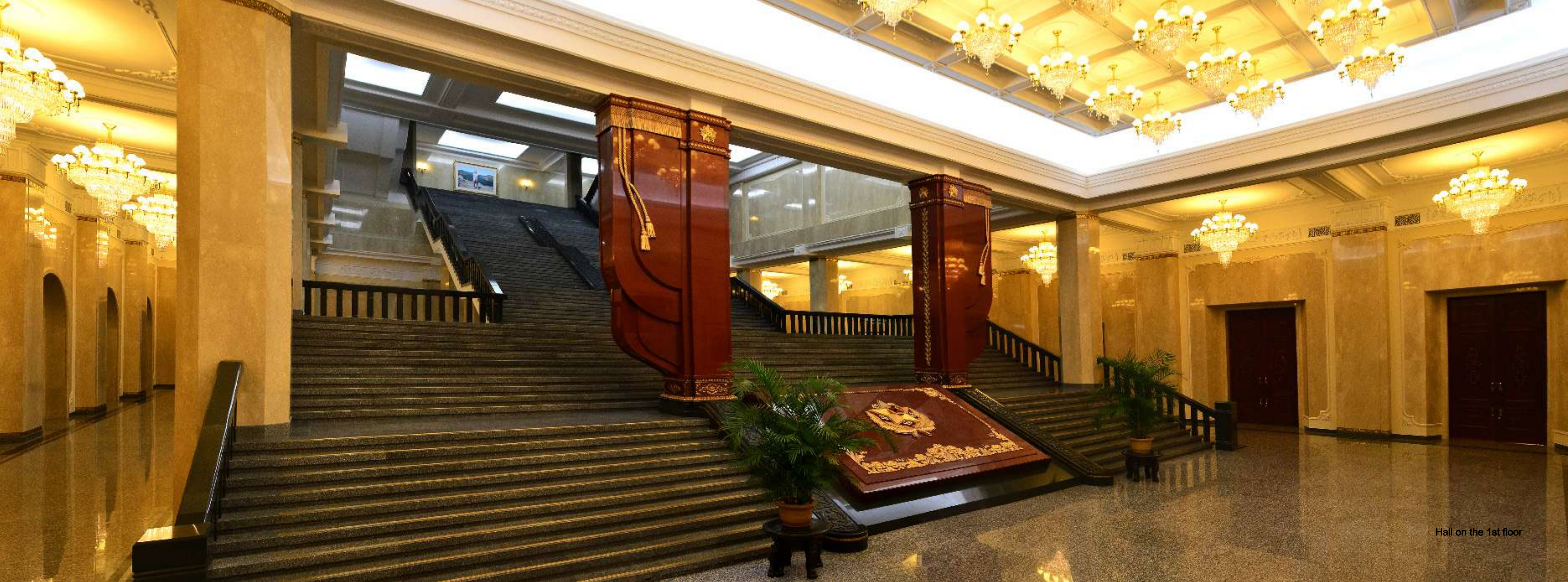
Hall on the 1st floor