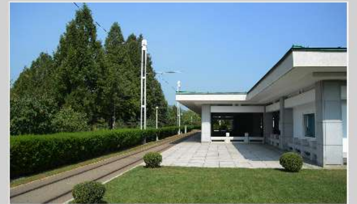
Tram for visitors to the palace