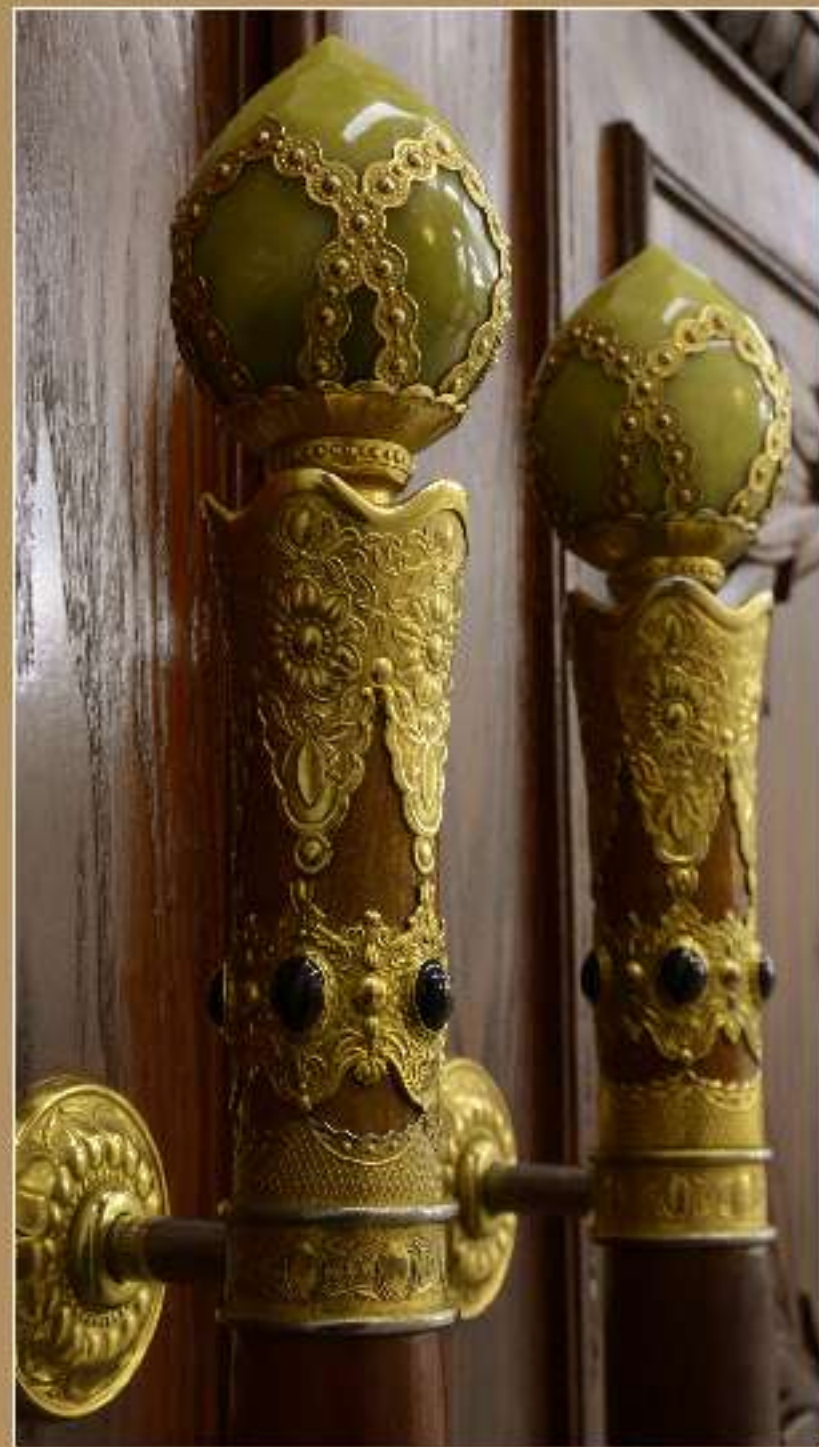
Ornamented door handle