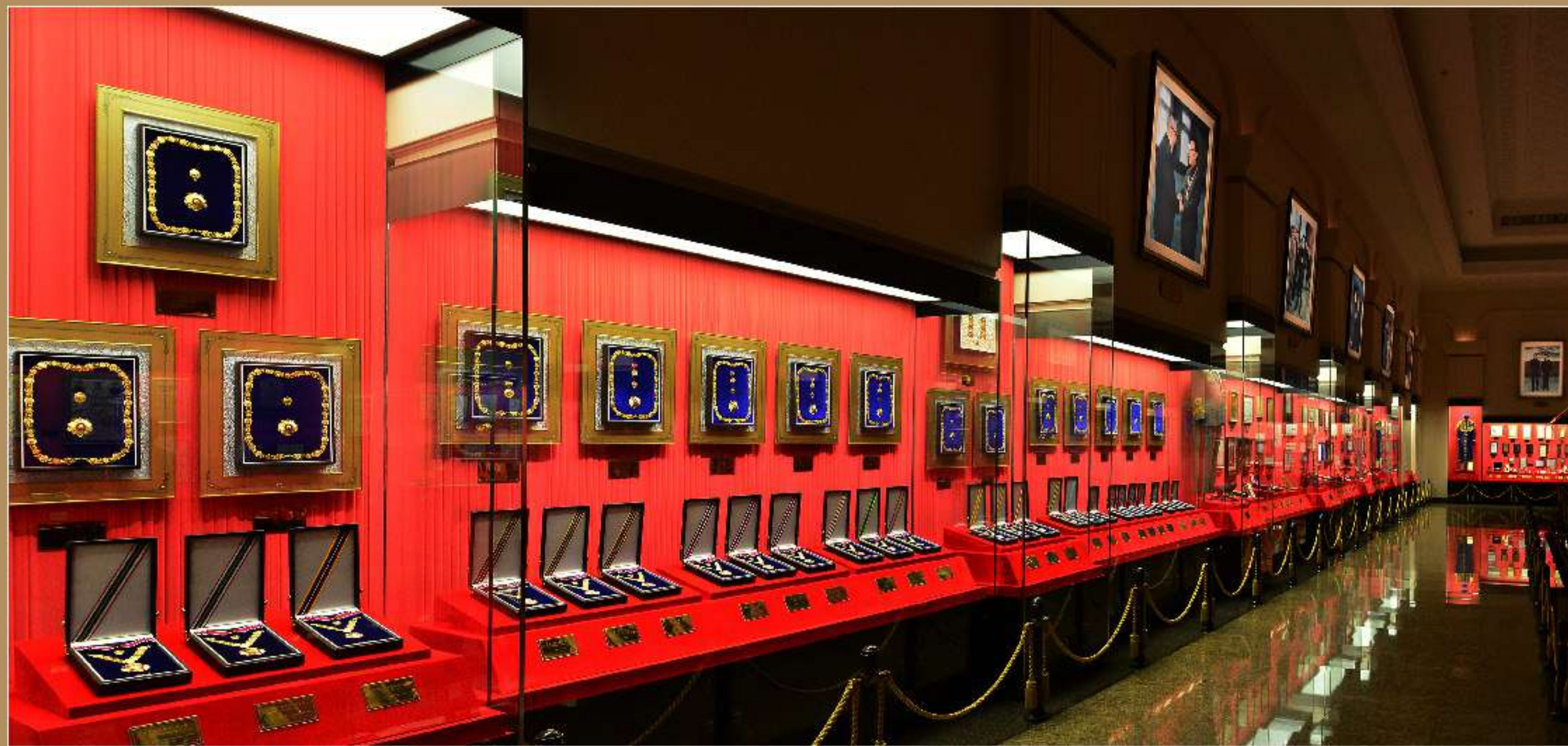
Part of orders, medals and honorary title certificates awarded to Chairman Kim Jong Il