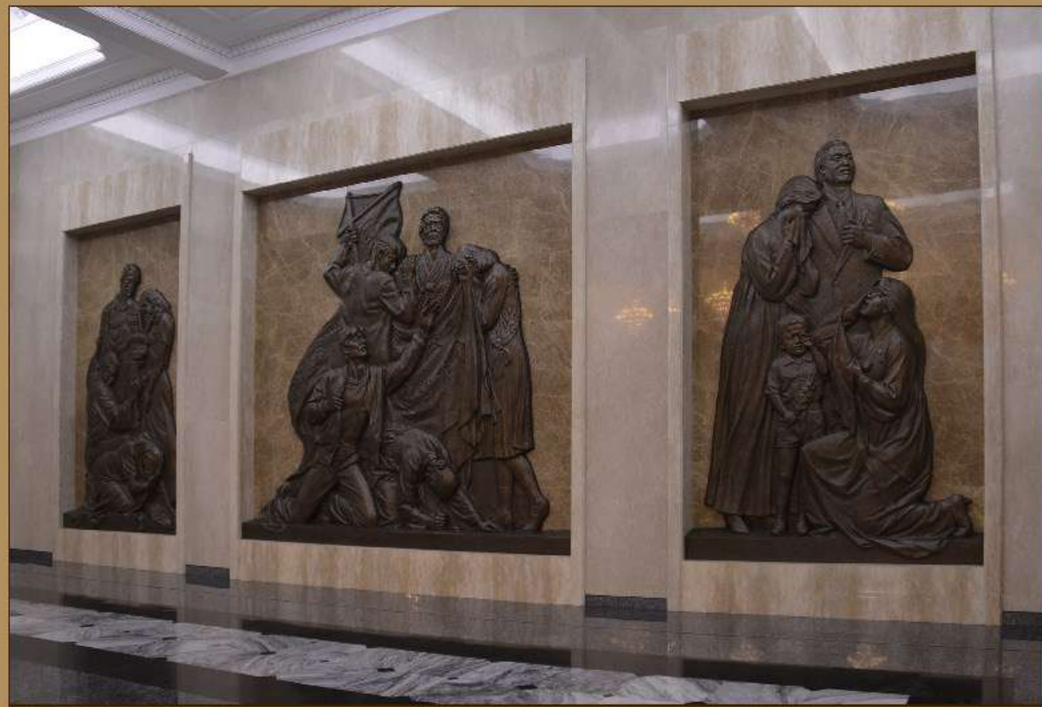
Bronze relief sculptures in the Hall of Lamentation