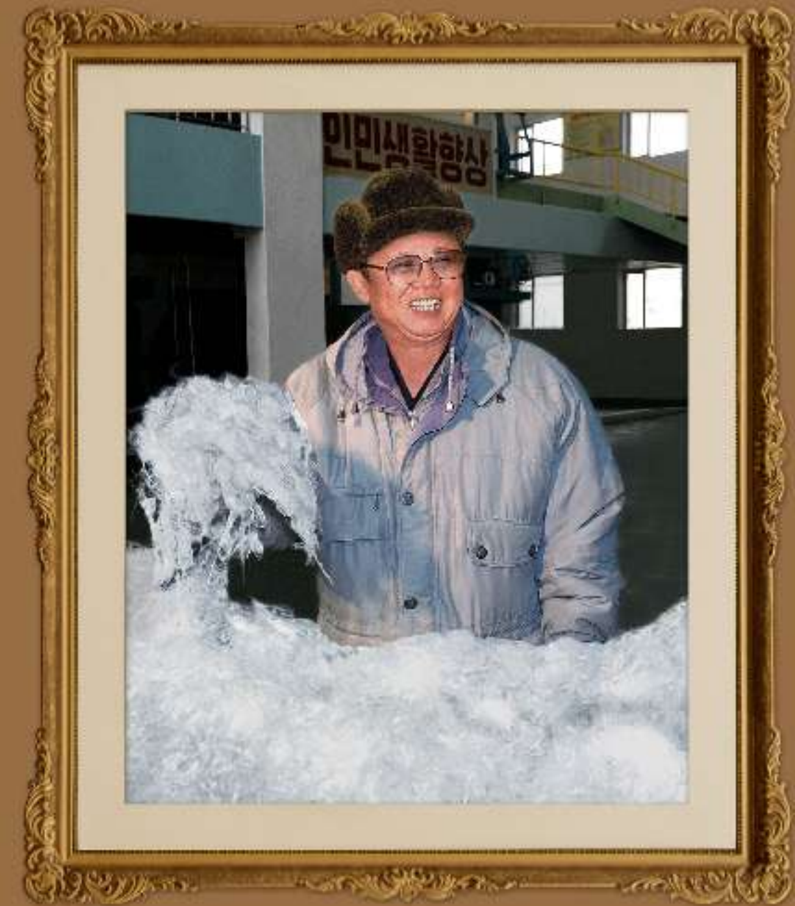
Chairman Kim Jong Il sees vinalon cotton (February 9, 2010)