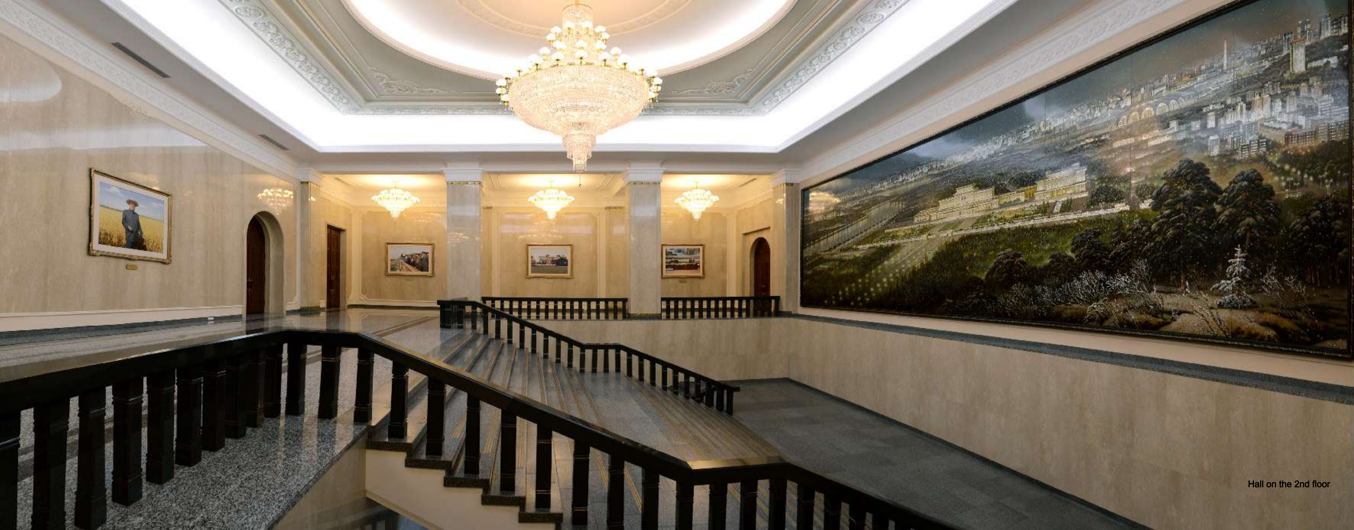
Hall on the 2nd floor