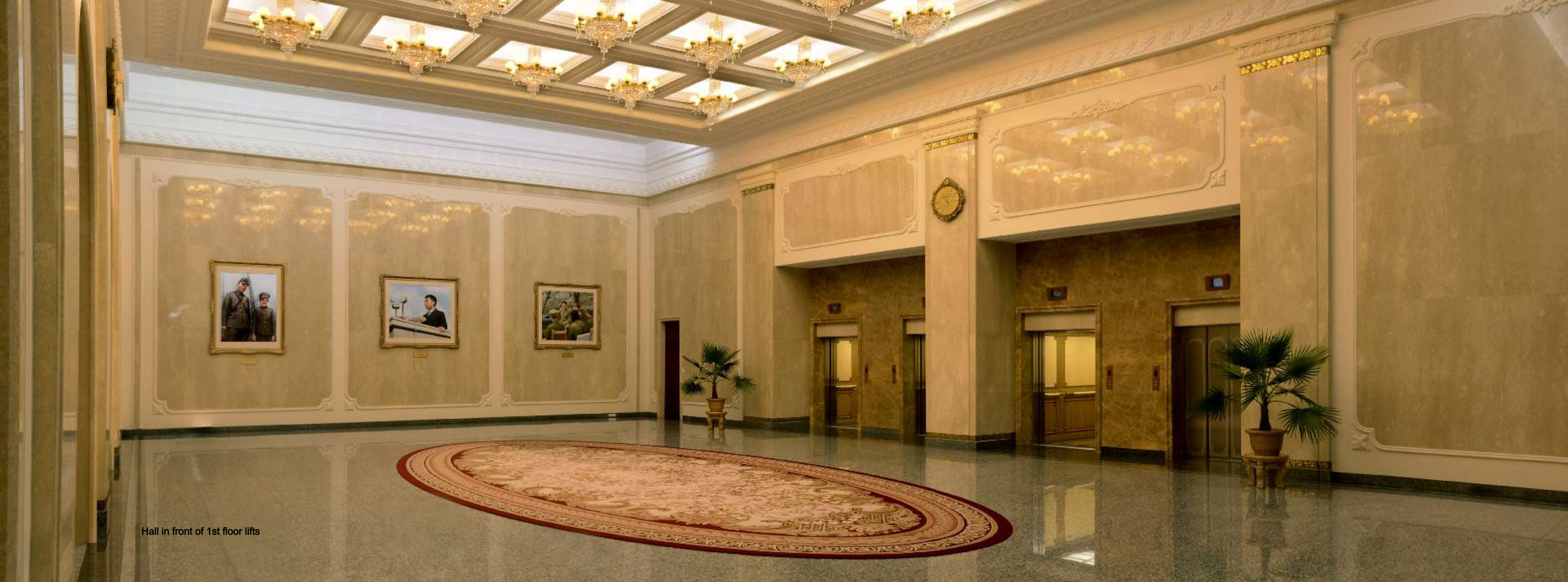
Hall in front of 1st floor lifts