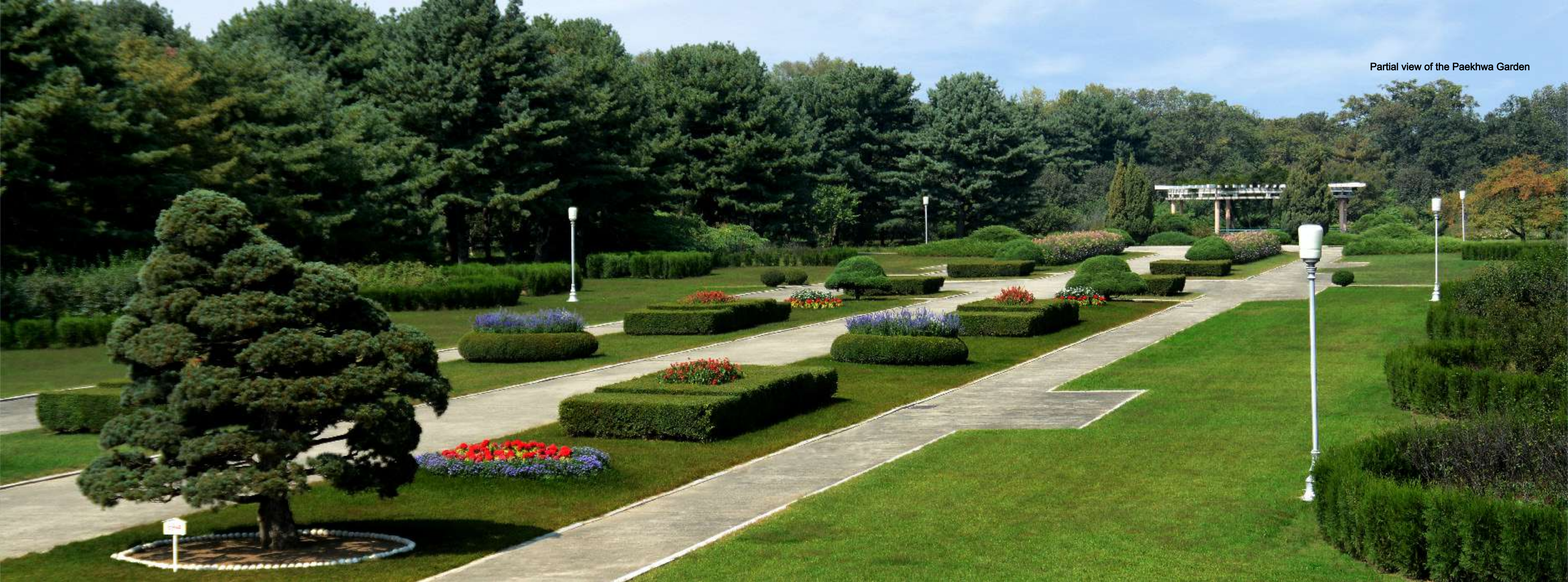
Partial view of the Paekhwa Garden