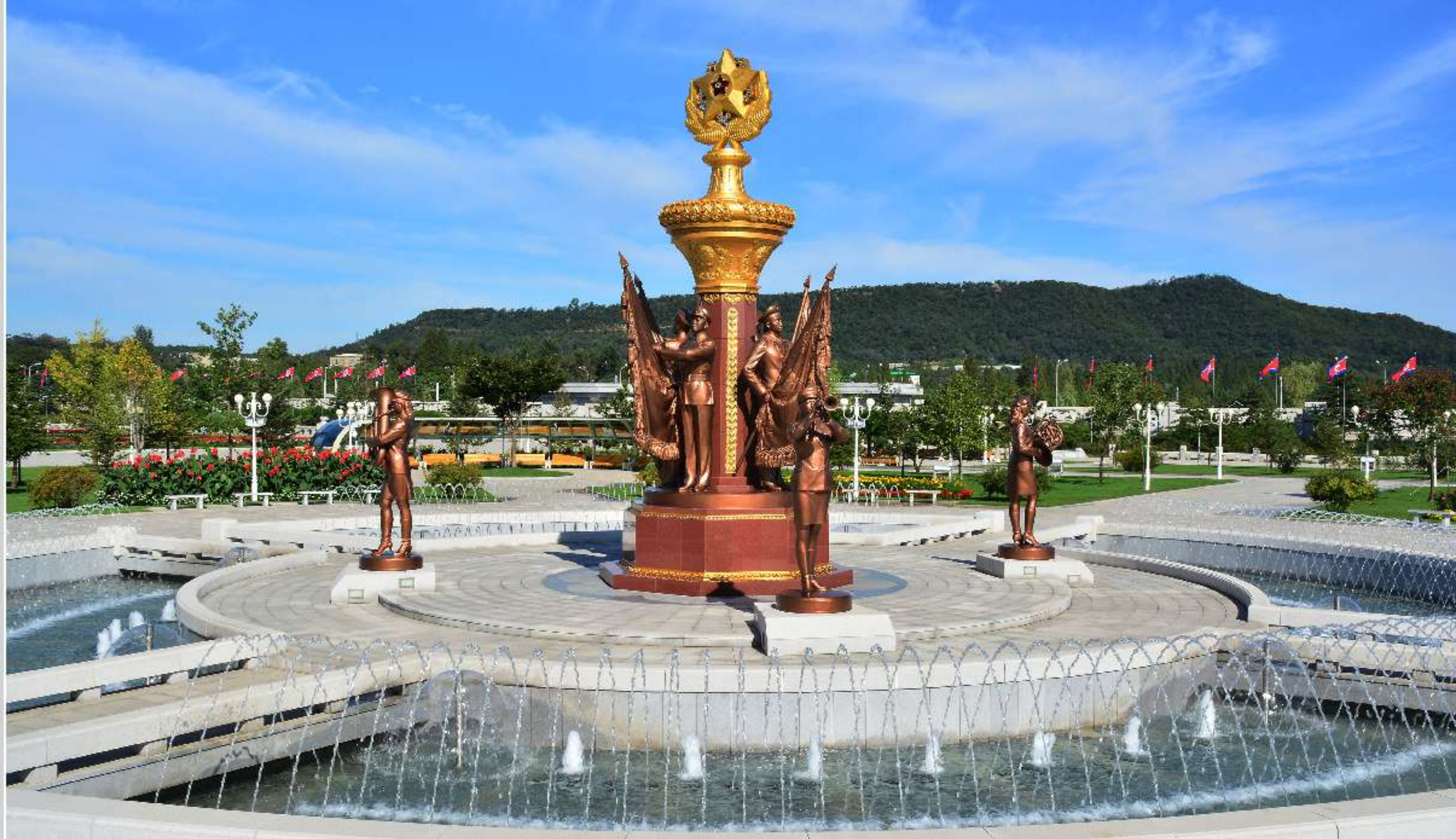
Group sculptures in the plaza park