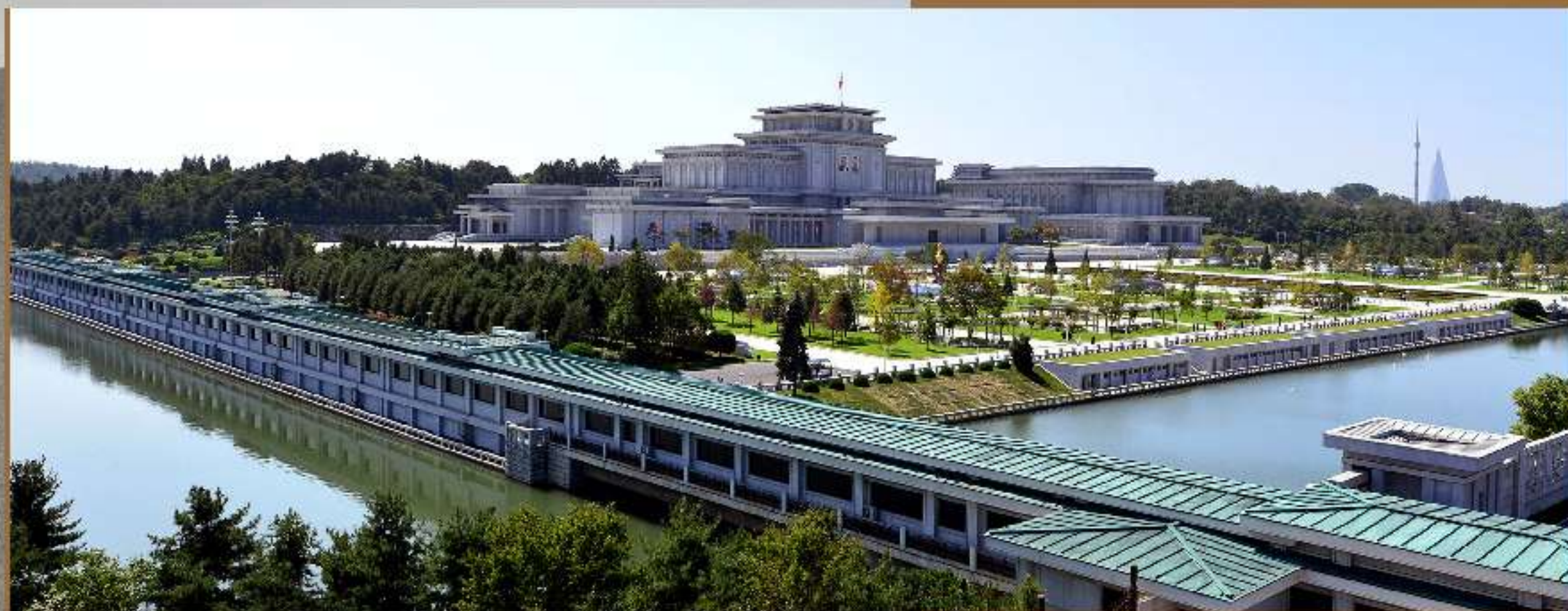
Travelator in the access corridor

The access corridor has been so designed that the Korean people yearning for their great leaders can visit the Kumsusan Palace of the Sun all the year round, irrespective of climatic conditions.