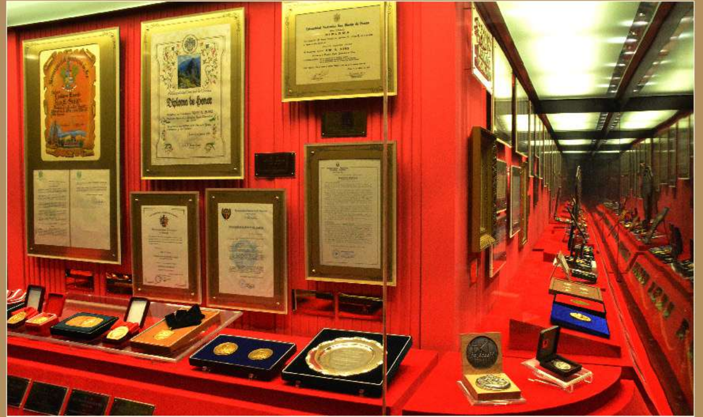
Part of orders, medals and honorary title certificates awarded to President Kim Il Sung