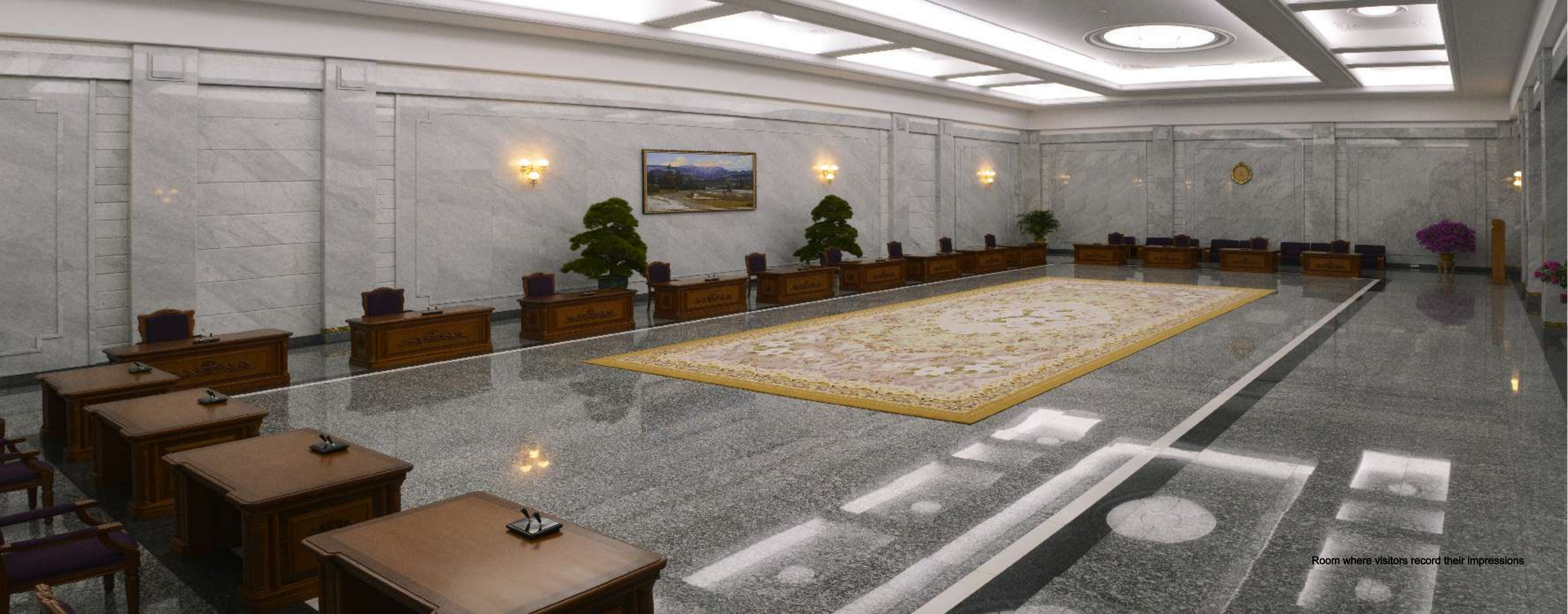
Room where visitors record their impressions