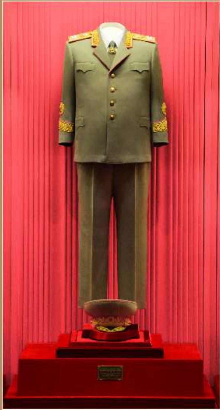
Uniform of Generalissimo of the DPRK