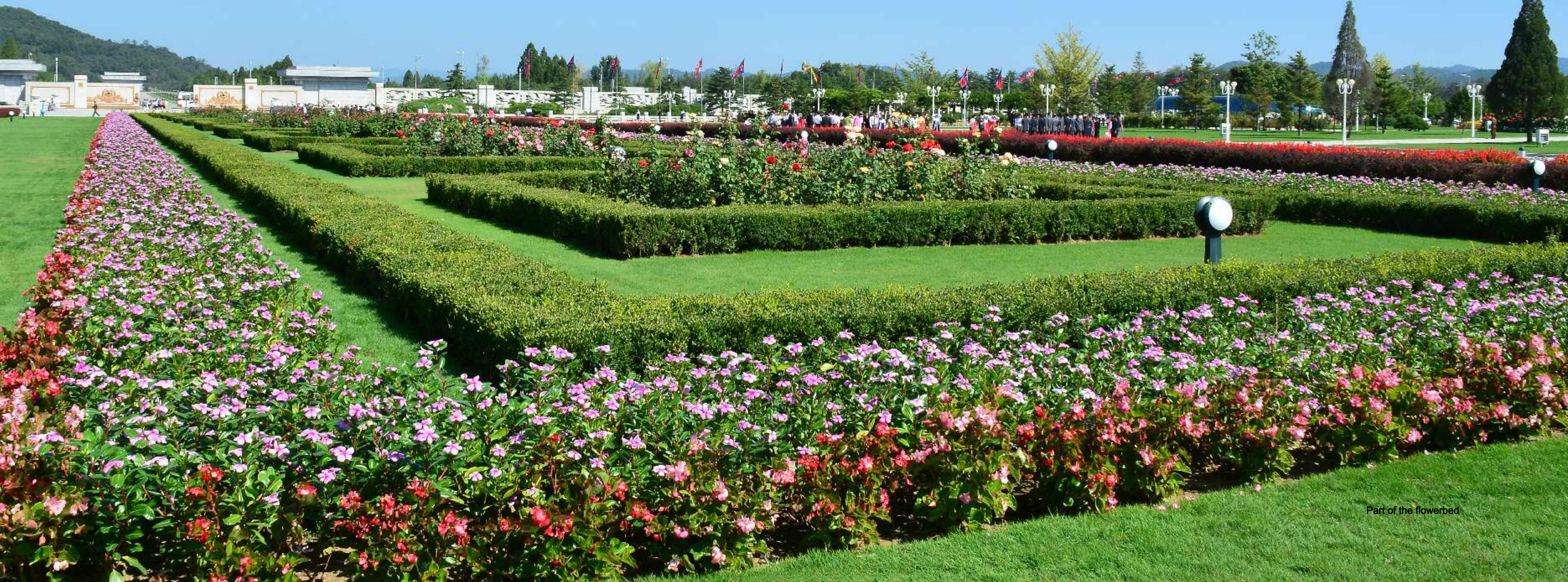
Part of the flowerbed