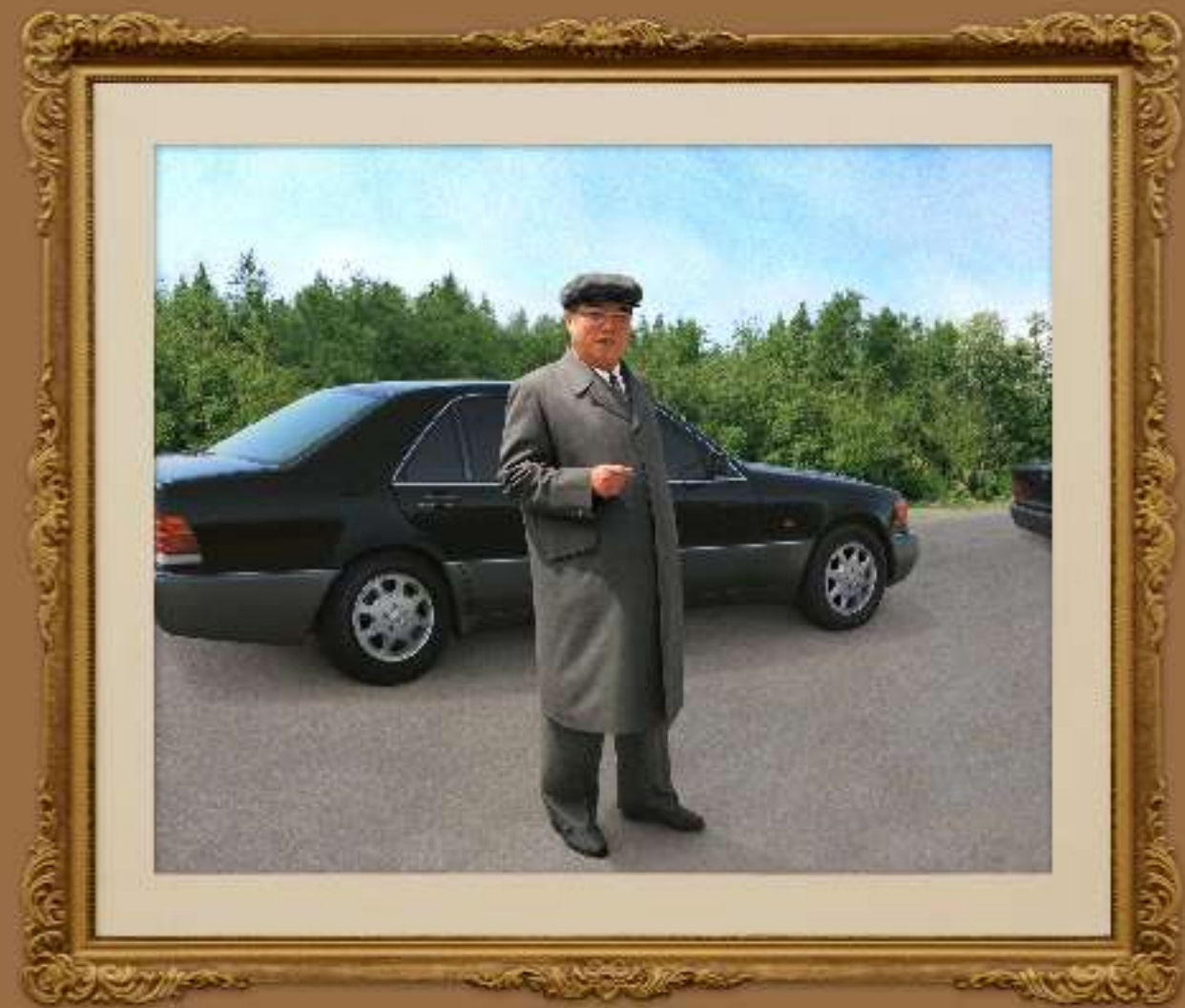
Car used by President Kim Il Sung in the last period of his life