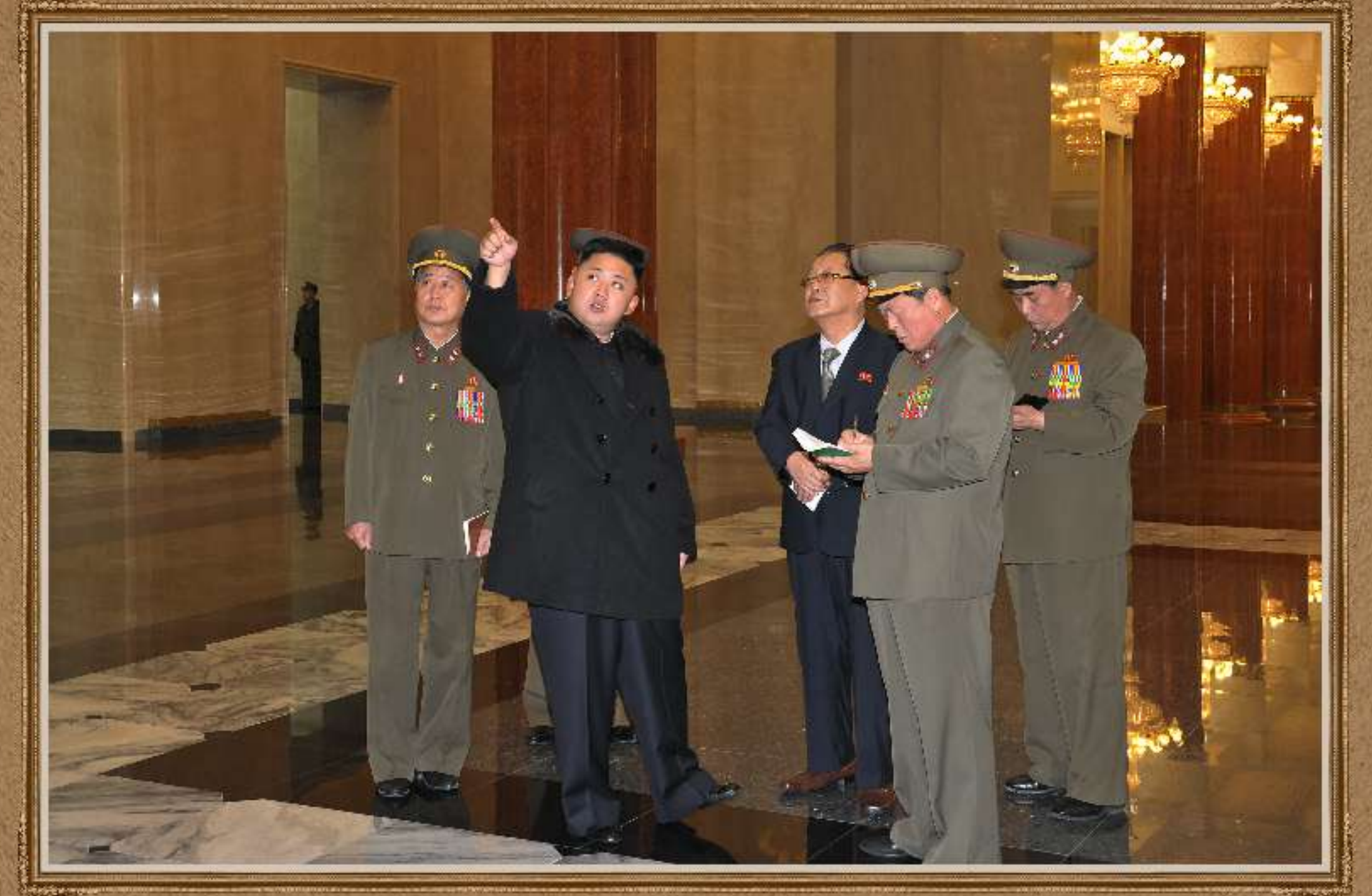
Supreme Leader Kim Jong Un guides the work of laying out the Kumsusan Palace of the Sun splendidly as befits the sacred place of the sun