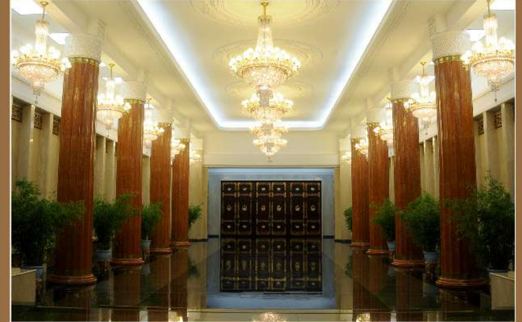
Hall of Lamentation

The Hall of Lamentation tells of the grief and great loss the Korean and world progressive peoples felt for the sudden death of President Kim Il Sung and Chairman Kim Jong Il.