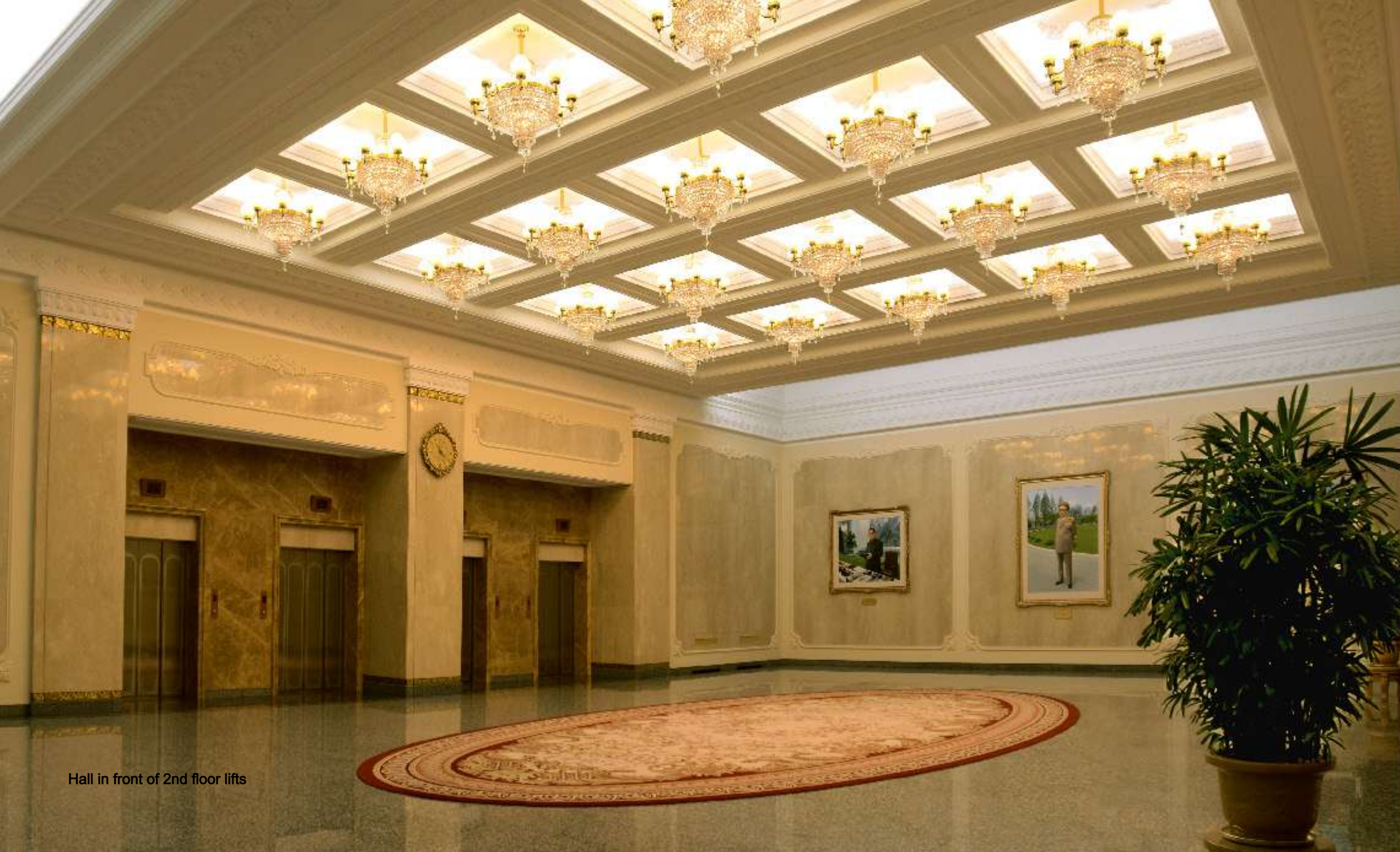
Hall in front of 2nd floor lifts