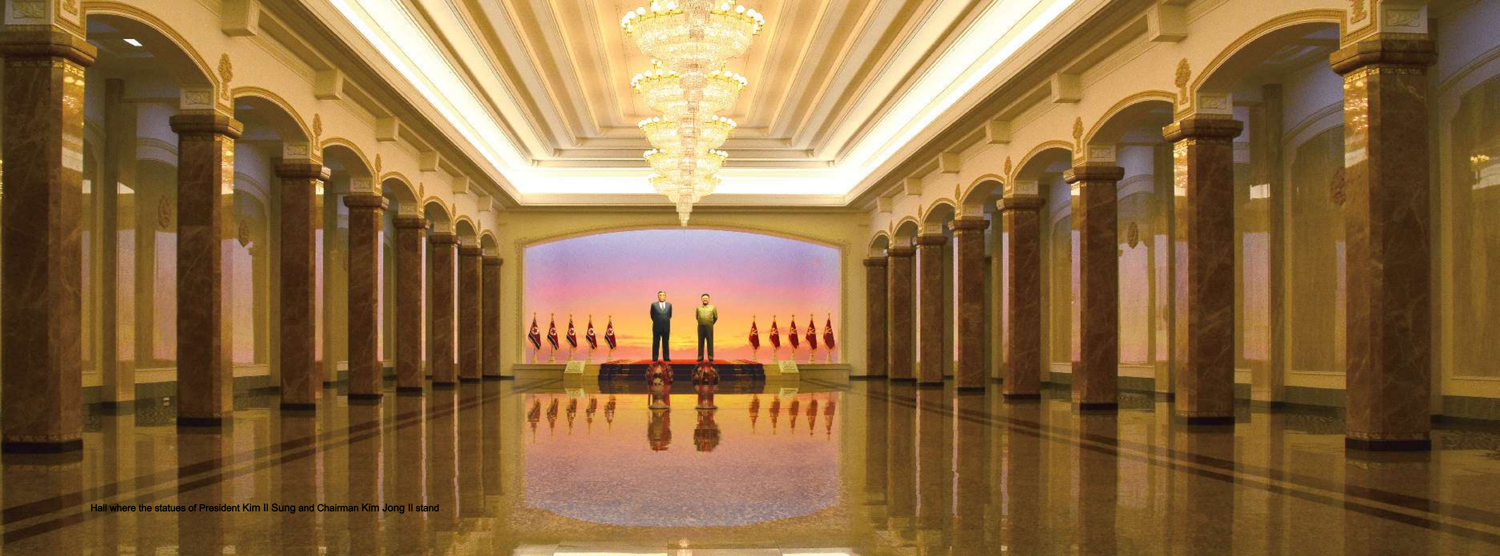
Hall where the statues of President Kim Il Sung and Chairman Kim Jong Il stand