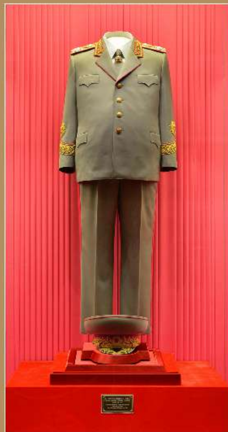
Uniform of Generalissimo of the DPRK