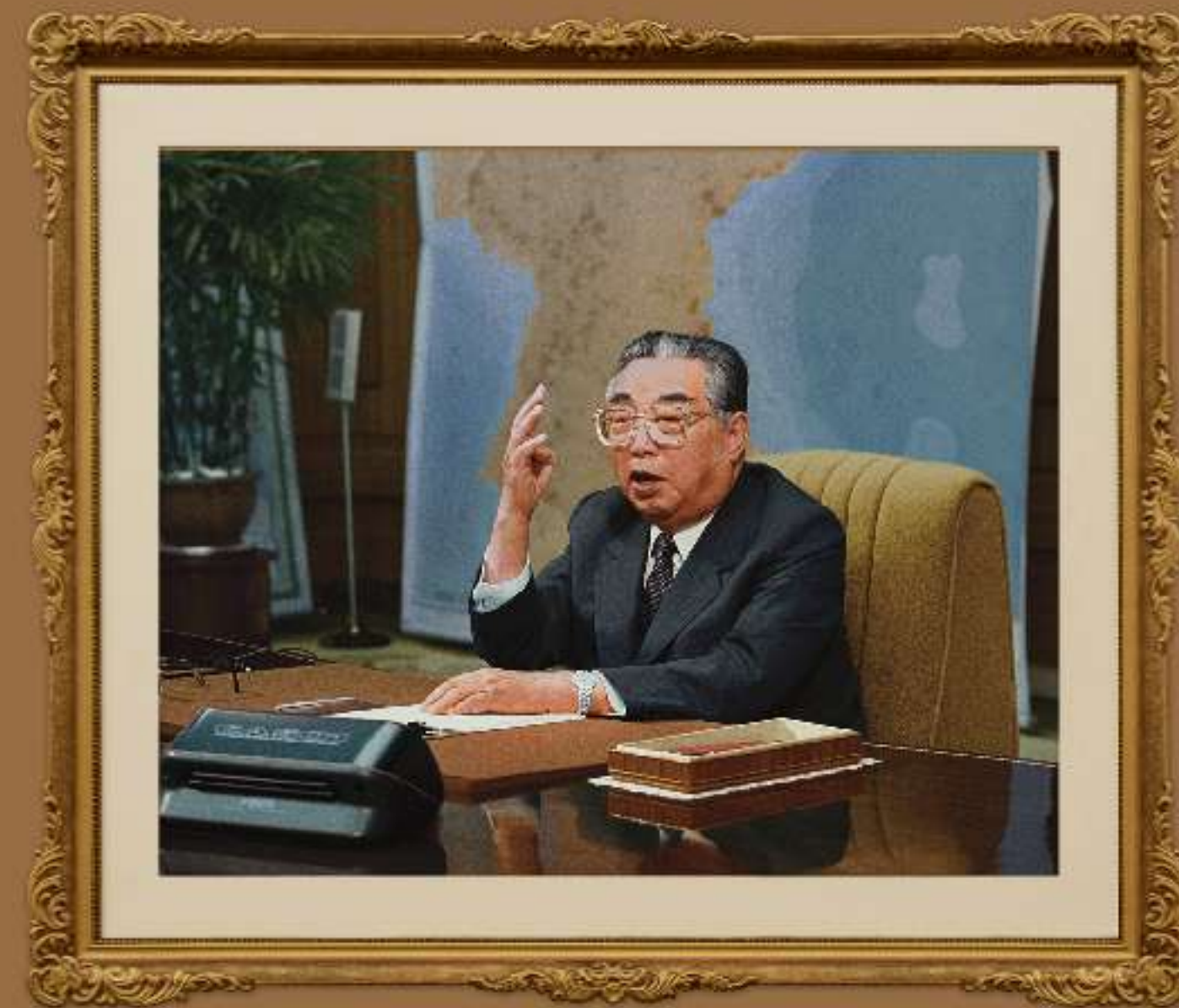
President Kim Il Sung presides over a consultative meeting of senior officials in the economic sector (July 6, 1994)