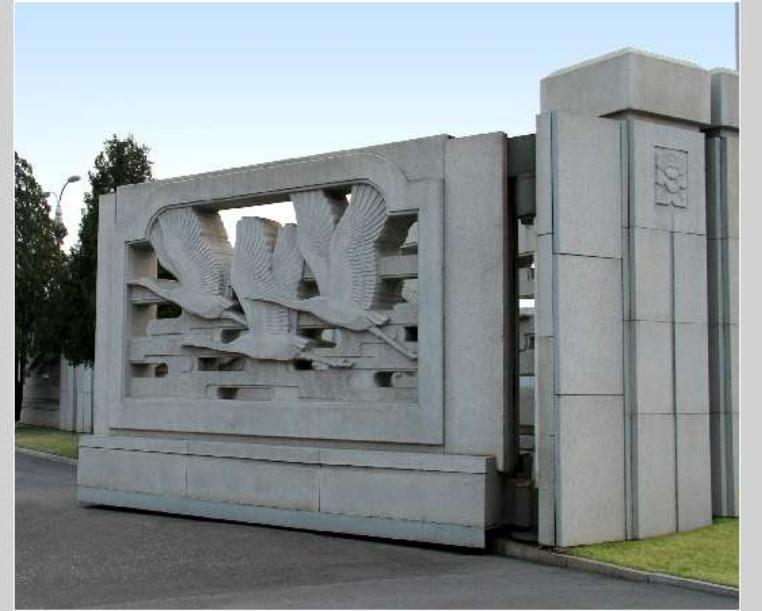
Large granite fence