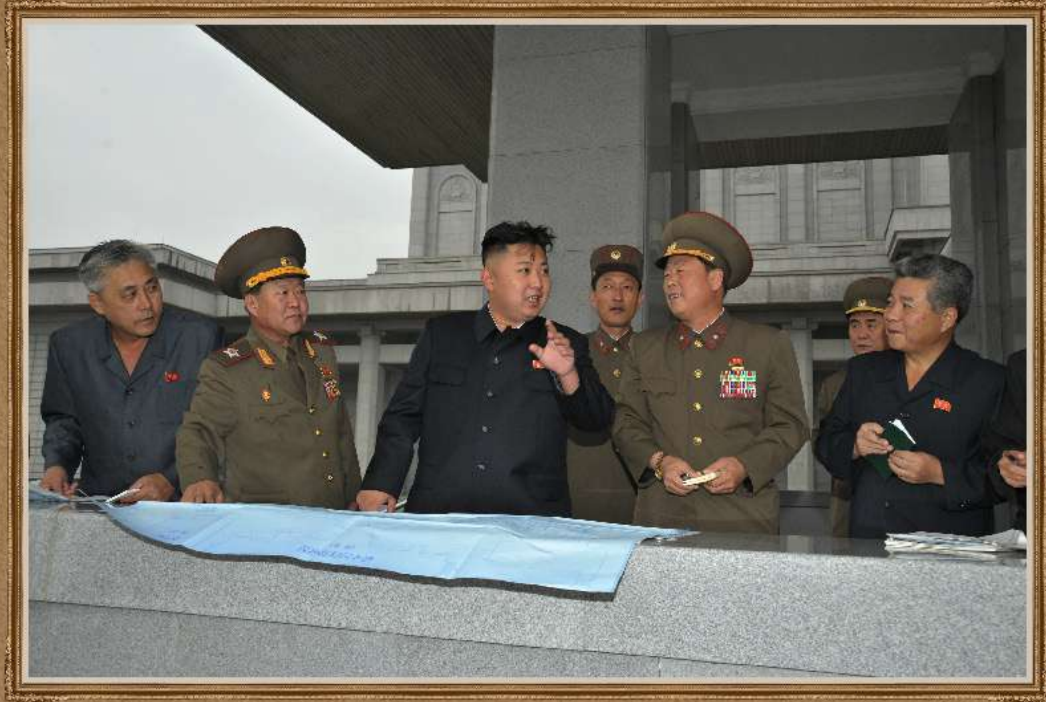
Supreme Leader Kim Jong Un specifies the direction and ways for laying out the Kumsusan Palace of the Sun splendidly as befits the sacred place of the sun