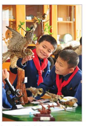
Students at an experimental and practical training lesson