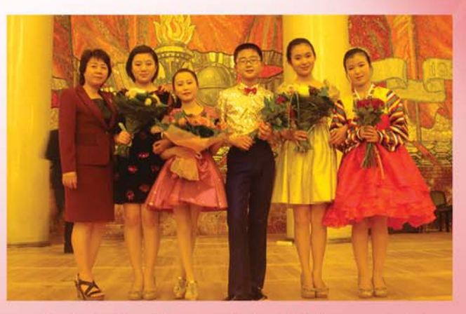
Students from Kumsong School highly appreciated at the 10<sup>th</sup> Moscow Meets Friends International Festival