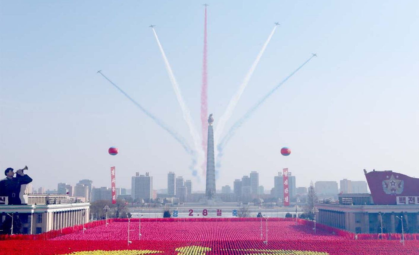
Scenes from the military parade.