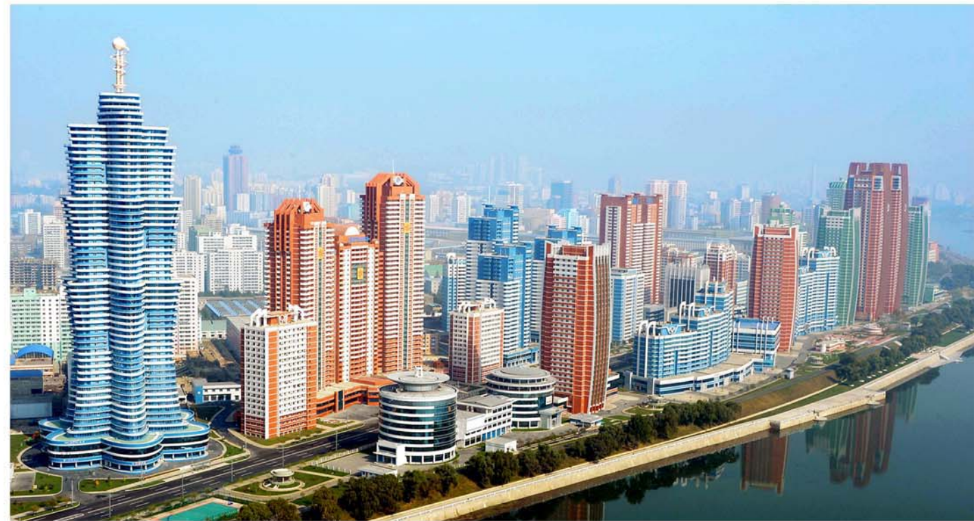
A view of Mirae Scientists Street.