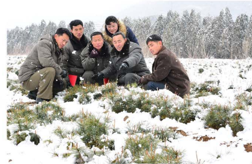
They tend tree saplings on a scientific basis to suit the winter.

The manager says that he feels a lump in his