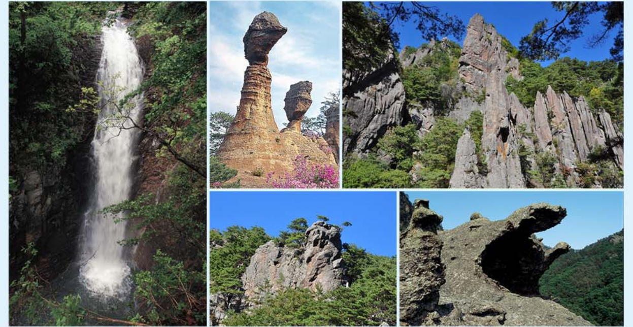
A waterfall and rocks of fantastic shapes in Outer Chilbo.

Outer Chilbo also has lots of big and small waterfalls and pools that are very spectacular, harmoniously surrounded by thick forests. The waterfalls include two-, six- and multistage falls resembling unfolded rolls of silk cloth, tilted Kosok Falls which often appears and disappears while flowing beneath an enormous rock. The pools include Ok Pool in which, it is said, fairies saw themselves dressing their hair like in a mirror and Umnok Pool where, it is said, a couple of deer used to quench their thirst. The waterfalls and pools are those that cannot be seen in other scenic spots, thus drawing tourists.