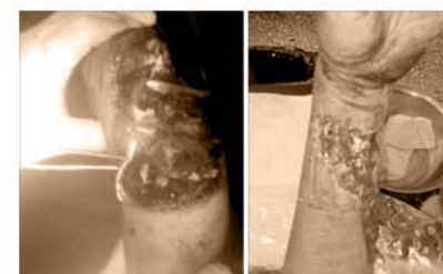
Before operation (left). After operation (right).