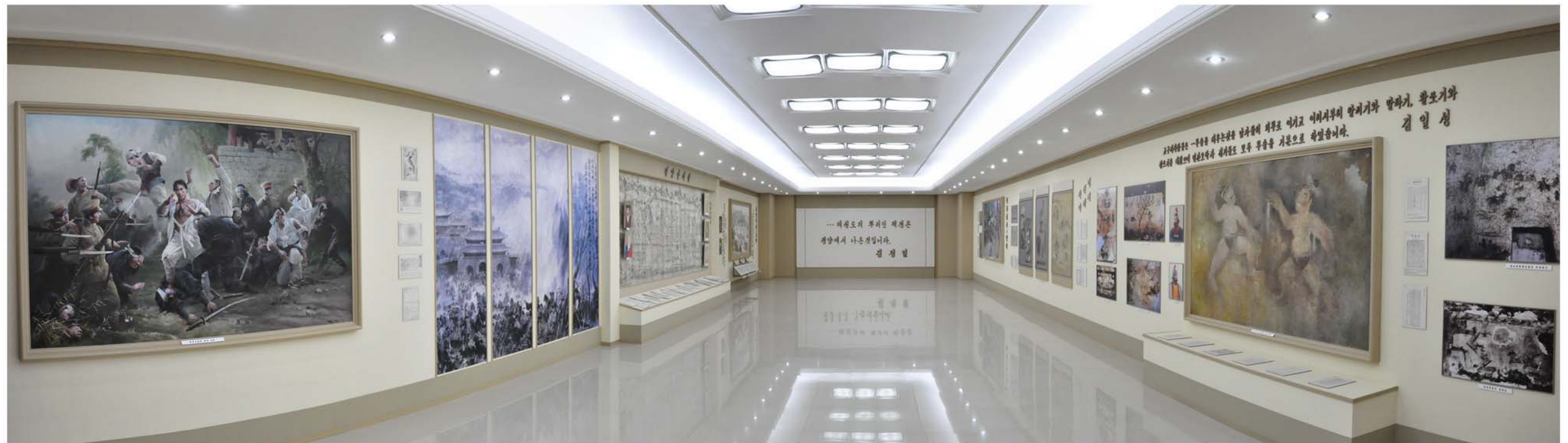
The Hall of the History of Taekwon-Do.