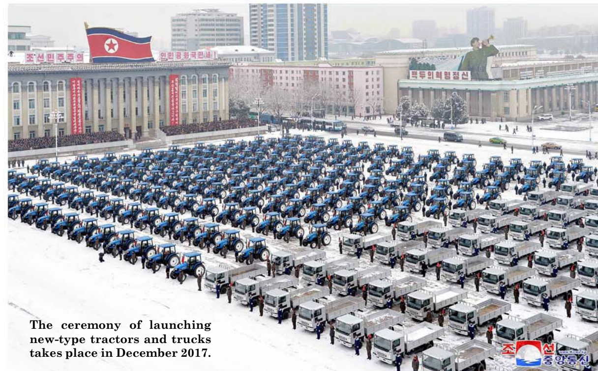
The ceremony of launching new-type tractors and trucks takes place in December 2017.

► servation of them. This is the greatest of the miracles made in pioneering cutting-edge science and technology and developing the country's space science and technology.