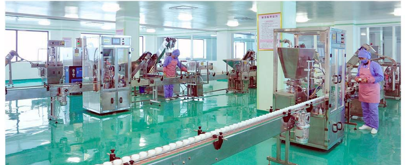
The production of popular cosmetics is on the increase.

Mentioning that the workshop recently developed nearly 40 cream and beauty lotion items of over 20 kinds, the chief engineer said that most of them are functional. She went on to say that a whitening lotion is being produced