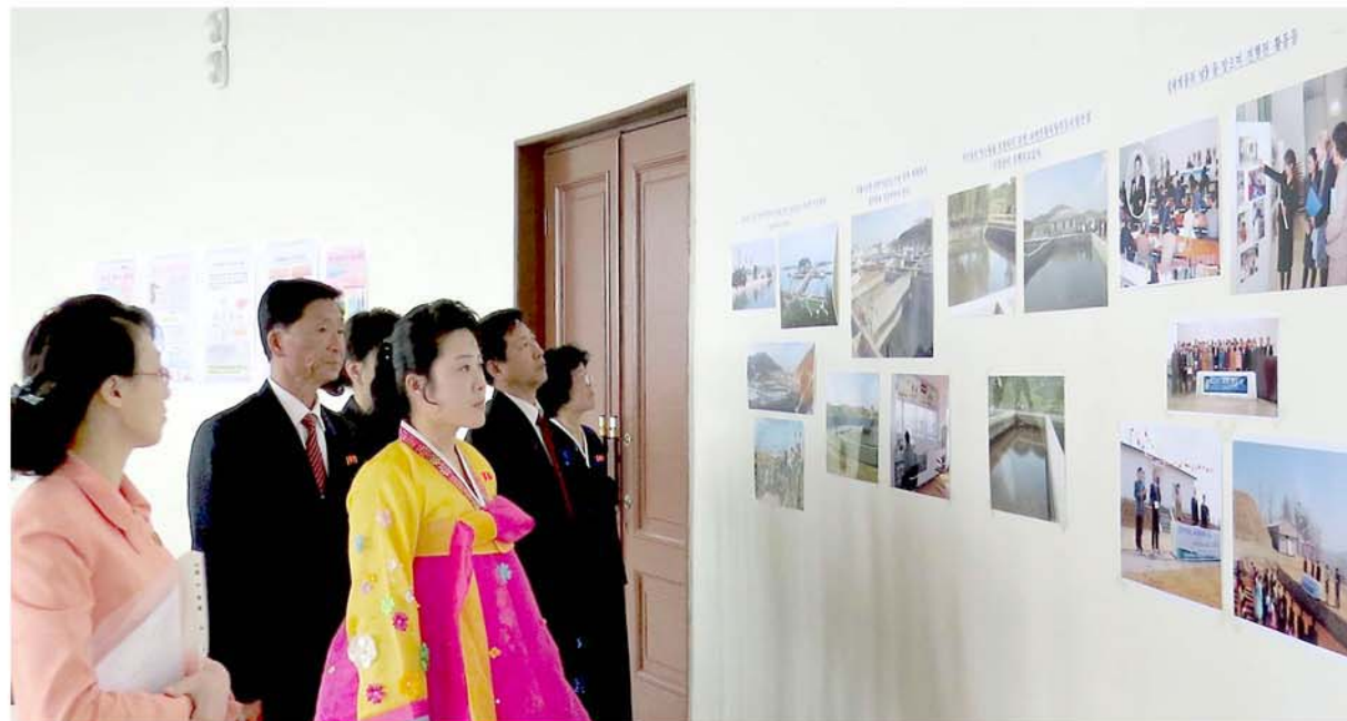
An event to mark World Water Day.

My union is acting as a member of the Global Water Partnership. It also helps the relevant sectors annually do cooperation and exchange with different international organizations including the UN Development Programme, the United Nations Food and Ag-