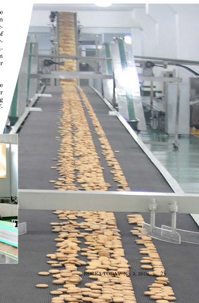
Production is increasing thanks to the modernization of the processes.