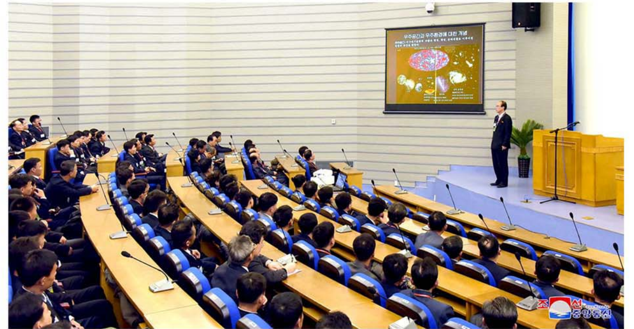
Symposium on space science and technology 2017 takes place.

country made sure that all sectors and units attached importance to science and technology and continued with the mass-based technological innovation drive, and thus solved lots of scientific and technological problems arising in modernizing factories and enterprises and putting production on a steady basis.