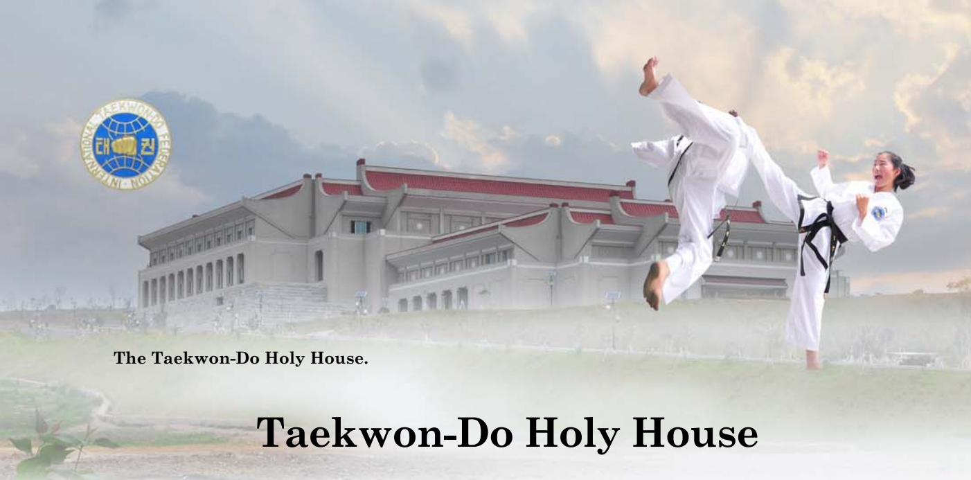
The Taekwon-Do Holy House.