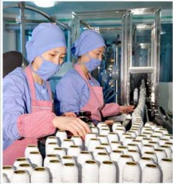
Front Cover: Producers of Unhasu cosmetics at the Pyongyang Cosmetics Factory