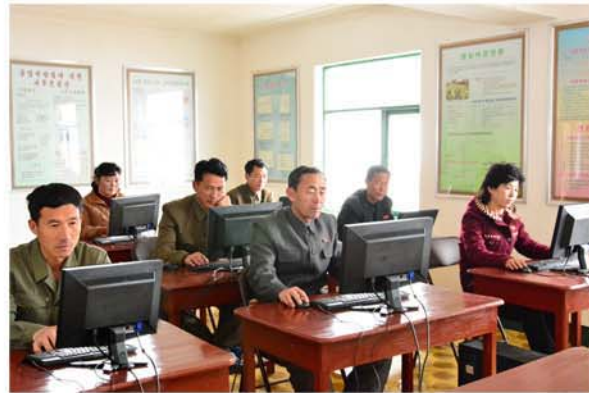
At the sci-tech learning space.

T HAETHAN COUNTY OF SOUTH HWANGHAE Province covers a seaside area. Looking at luxuriant forests in the county, the local people appreciate the effort of the officers and workers of the county's Forest Management Company.