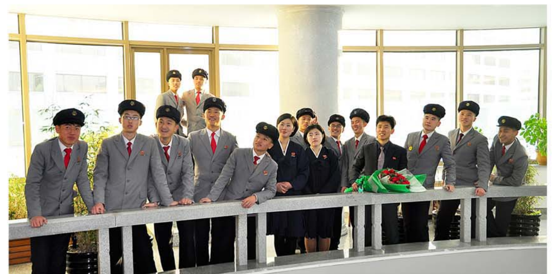
The students prepare to become inventors in their twenties.

son that she was too young and inexperienced. She persistently argued that age does not matter as far as development of the nation's science is concerned. Finally she was admitted into the team.