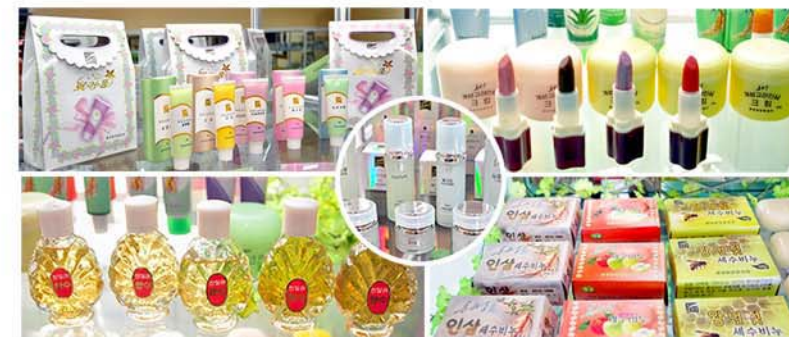
Some of the products.

expressed their pride in their jobs. The chief engineer said, "We will further increase the kinds of popular products with our wisdom and effort to make the name Unhasu more famous."