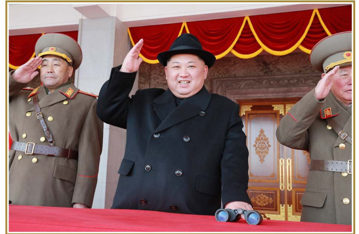
Supreme Leader Kim Jong Un waves back to the participants in the military parade for celebrating the 70 th founding anniversary of the Korean People's Army in February 2018.

She has since accelerated the building of her nuclear forces steadily by her efforts and technology. The course of this has been accompanied by days of severe life-and-death confrontation. The US and its vassal forces, arguing for Korea's "nuclear abandonment," imposed rigorous military pressure and unprecedentedly severe sanctions upon the country, and even big powers, yielding to Washington's pressure, interfered with her building of nuclear forces in every way. Despite sanctions and blockades jeopardizing their