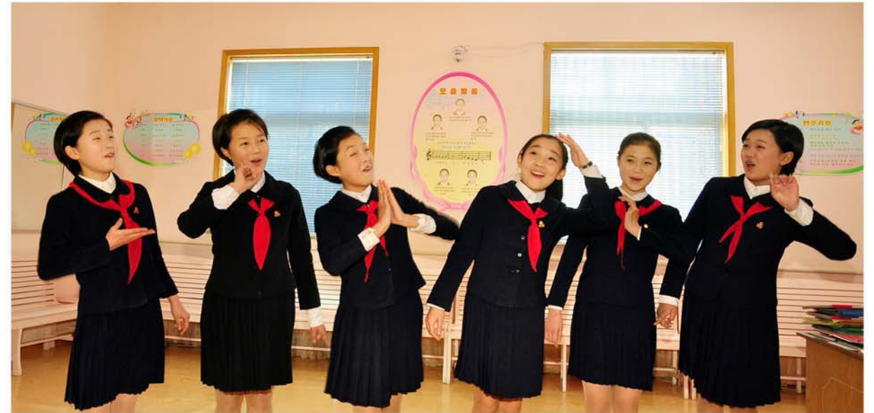
The pupils happily study and sing at the renovated school.

Each teacher selected important and essential contents of