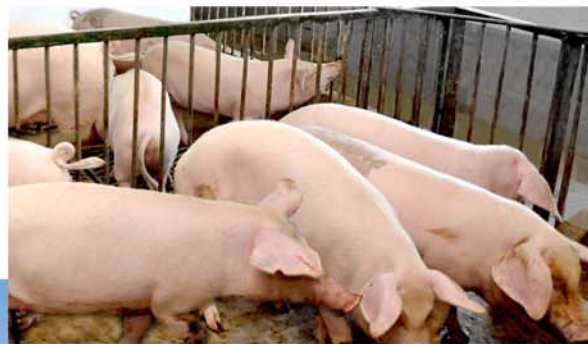
The Kangso Pig Farm.