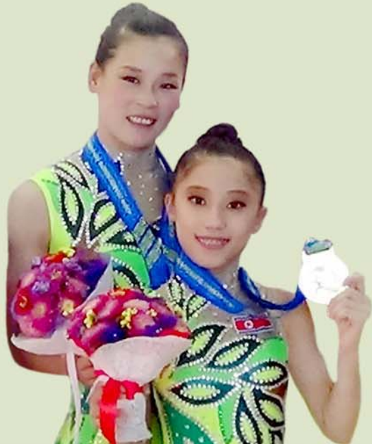
DPRK Ministry of Commerce Sports Club wins the 10 th Asian Acrobatic Gymnastics Championships 2017.

The Korean gymnasts were comparatively green-horns who had never attended such an international competition. They, though, performed difficult move-