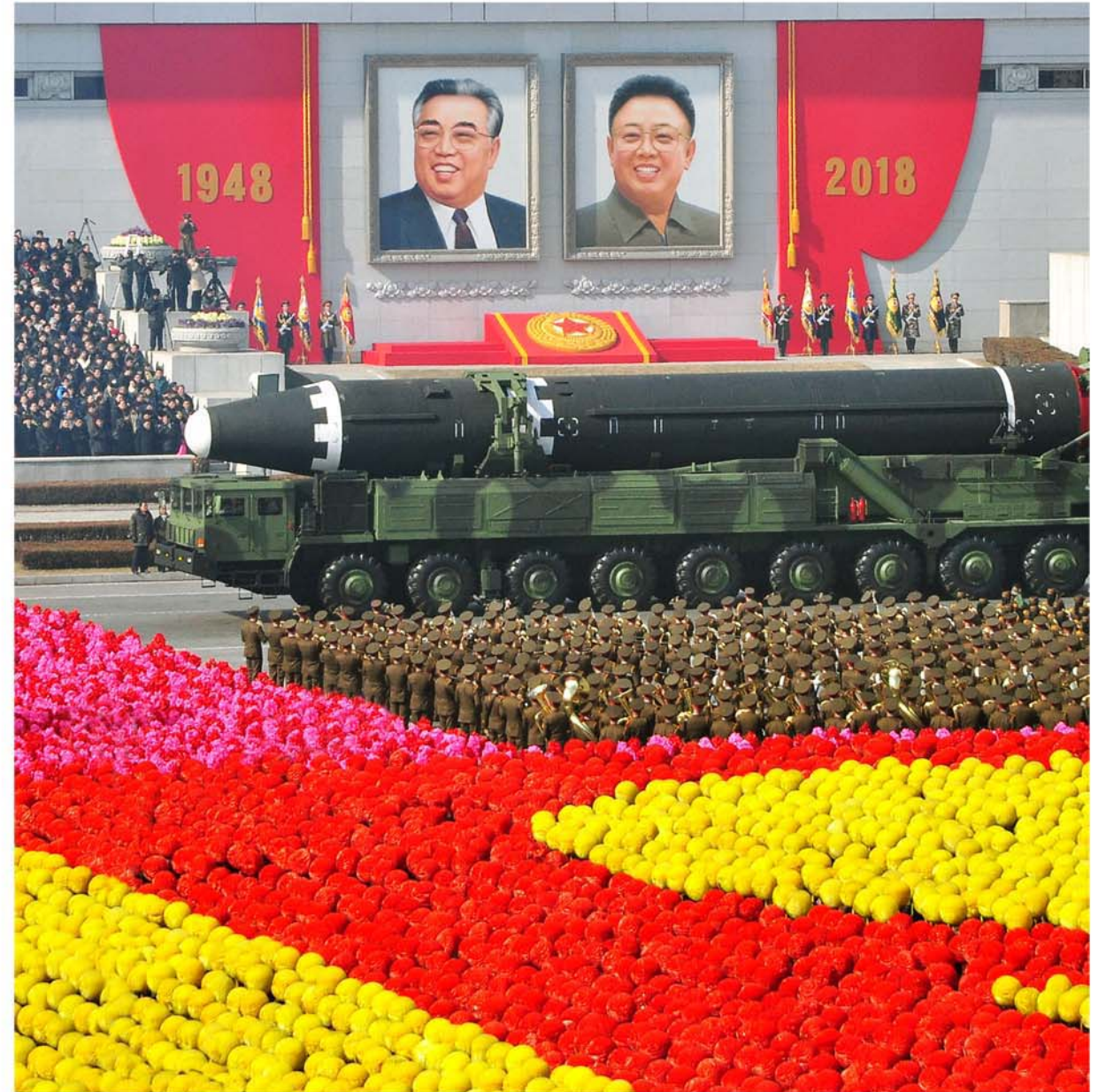
Scenes from the military parade.