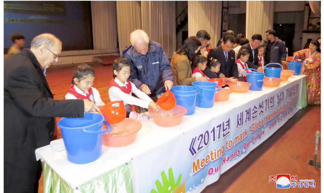
A meeting to mark Global Handwashing Day