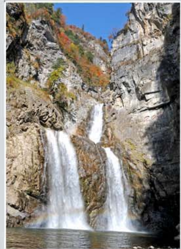
Back Cover: Ullim Falls