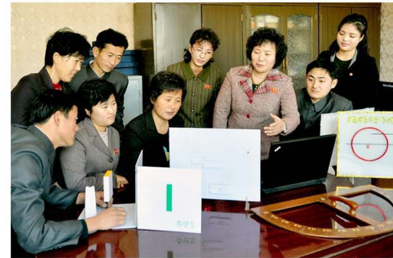
The teachers are in consultation about designs of visual aids.

After looking round the school, teachers and officials from many