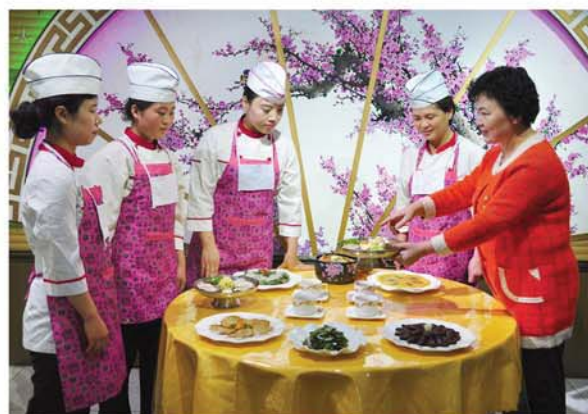
A scene of a dish exhibition.

The popularity of the restaurant is partly attributable to the tastes and quality of its dishes. In the past the restaurant served a noodle made with corn and elm bark powder which is helpful for protect-