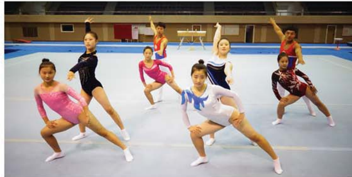
A scene of rhythmic exercises for athletics and a scene of rhythmic exercises for heavy gymnastics.