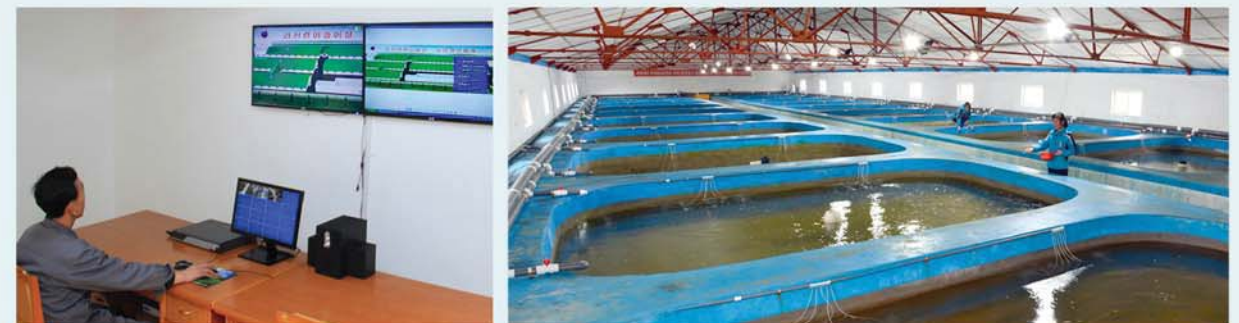
The integrated production control room and the indoor medium-sized fry growing pond of the Rason Breeding Salmon Farm.