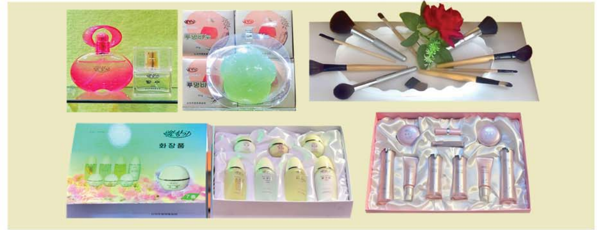
Some of Pomhyanggi cosmetics.

▶ the better we could understand their spirit of self-reliance and self-development.