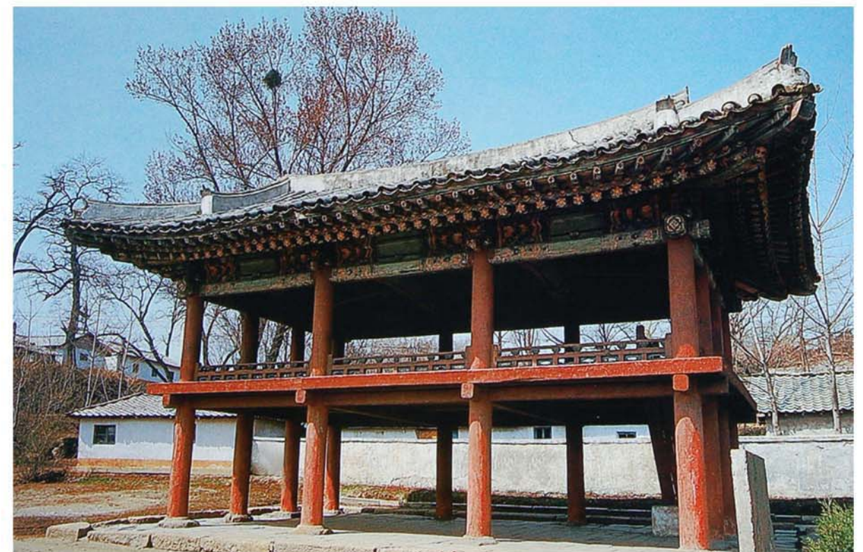
A general view of the Jewol Pavilion.