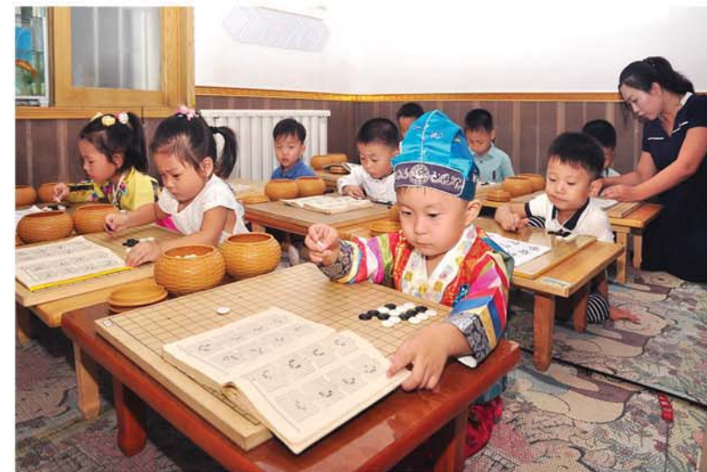
Children are learning knowledge and techniques of paduk .