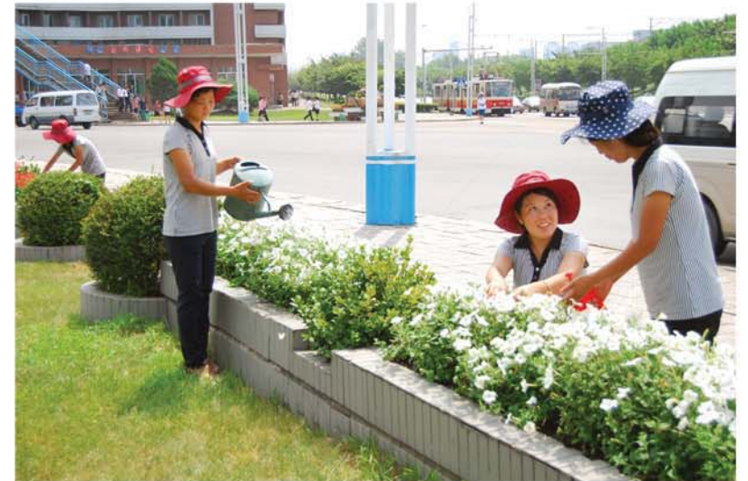
Streets are decorated with beautiful and fragrant flowers.

Now they are expanding the flower bed, making it possible to improve the quality of the river water.