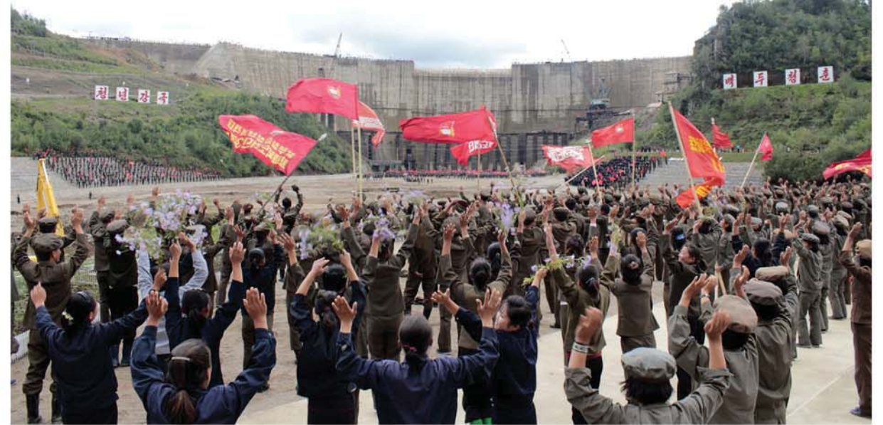
Young builders perform miracles in the construction of the Paektusan Hero Youth Power Station (August 2015).

The young builders engaged in the project unsparingly devoted the strength and passion of their precious youth in the deep, rugged mountain valleys. ▶