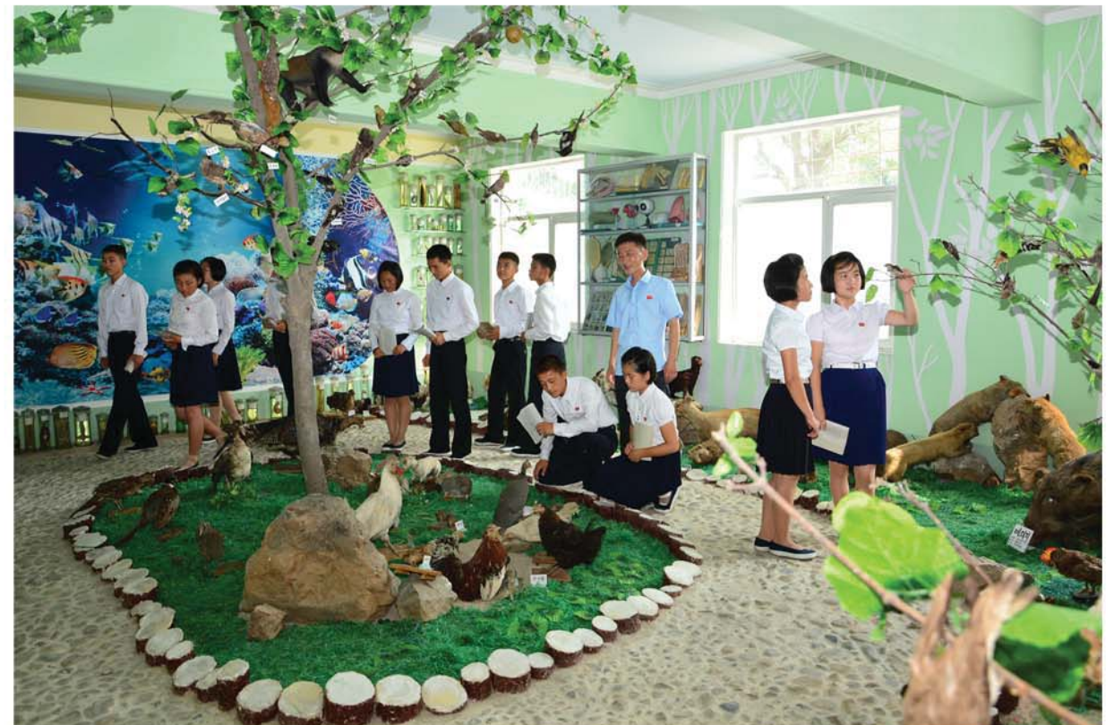
At a specimen room.

We looked round the foreign language, physical and chemical laboratories, and then proceeded to the biological specimen room. A rock covered with lichen, a bear sitting like a door-keeper, birds on