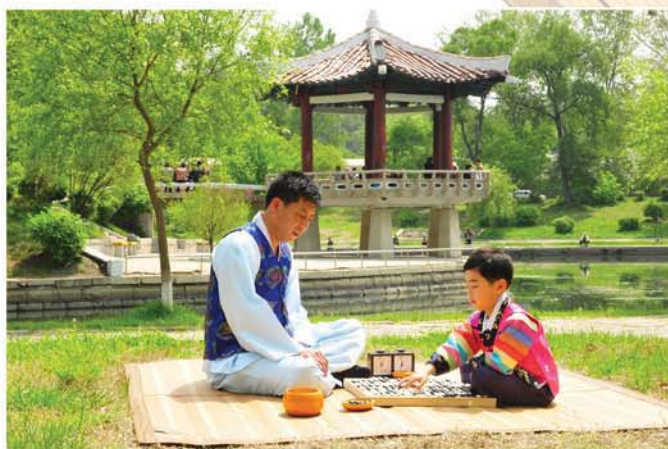
Father and son are in a paduk game.