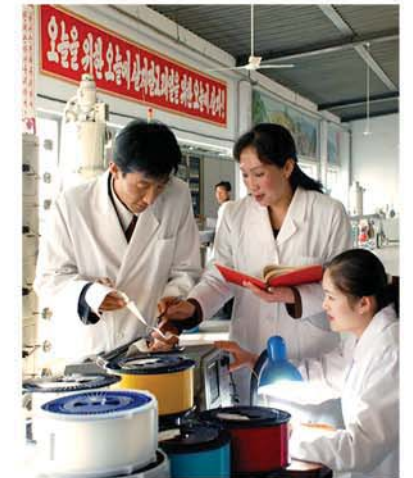
Cable production is accelerated.