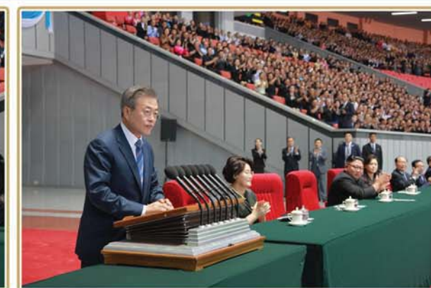
Kim Jong Un makes a meaningful speech after seeing a grand mass gymnastics and artistic performance together with Moon Jae In in September 2018.