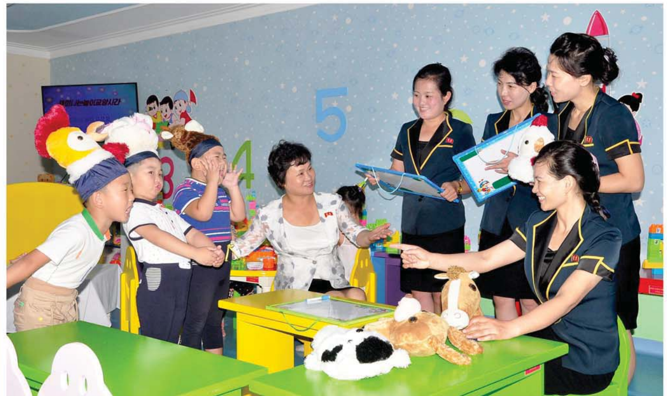
Efforts are made to develop facilities and methods of education and edification suited to children's psychology.