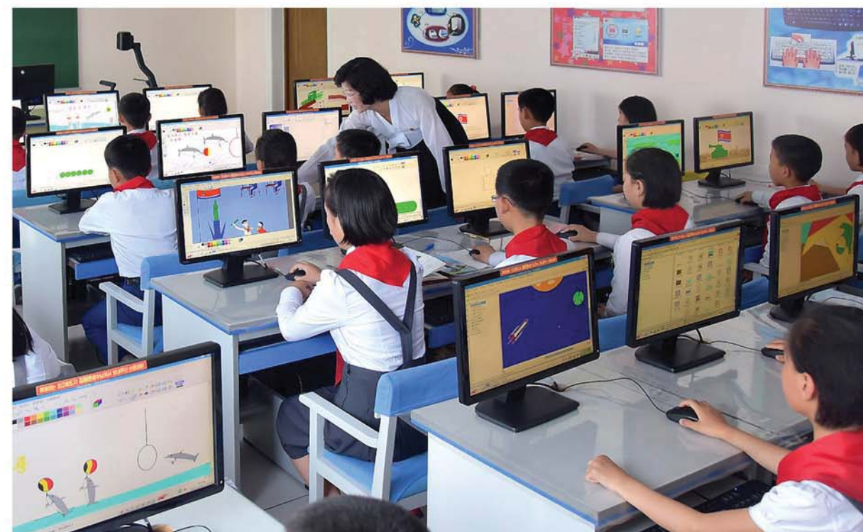
At a computer lesson.

The victory of the socialist revolution and the establishment of the advanced socialist system in the country in 1958 enabled all members of the society to become socialist workers. In keeping with the reality the Cabinet decision "On the universal abolishment of the students' school fees" was adopted in 1959 in order to thoroughly implement the principle by which the state takes full responsibility for education of all the working people, and it was proclaimed that the universal free education system would be enforced from April 1 that year. As a result, all the working people and their children came to be free from all