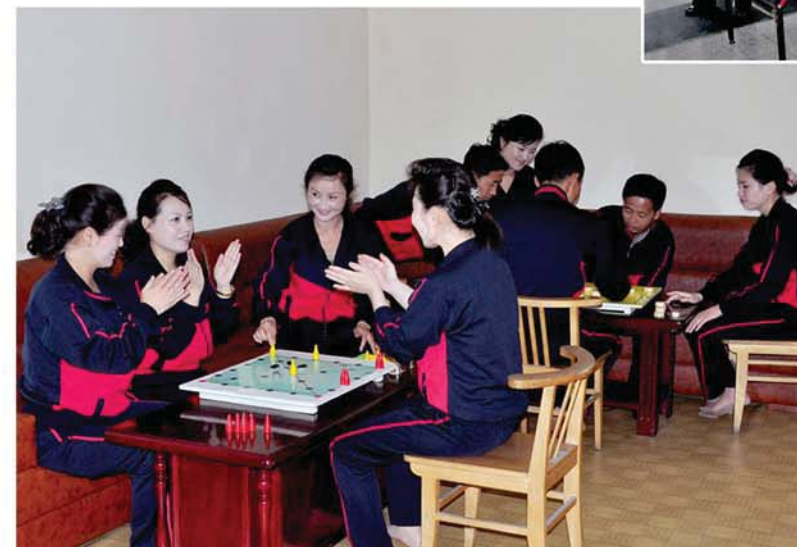
Workers enjoy themselves at the recuperation home.