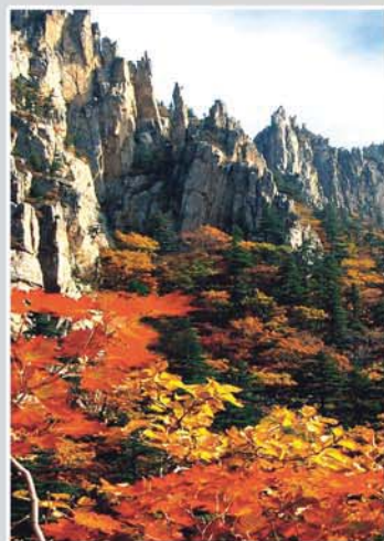
Back Cover: Manmulsang in Mt Kumgang in autumn