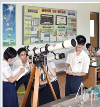
Front Cover: With a dream of becoming a space scientist