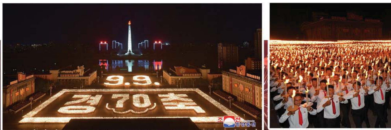
Scenes from young vanguard’s torchlight procession “Youth, forward, demonstrating valiant mettle of heroic Korea!” held in September 2018 in celebration of the 70 th anniversary of the DPRK.