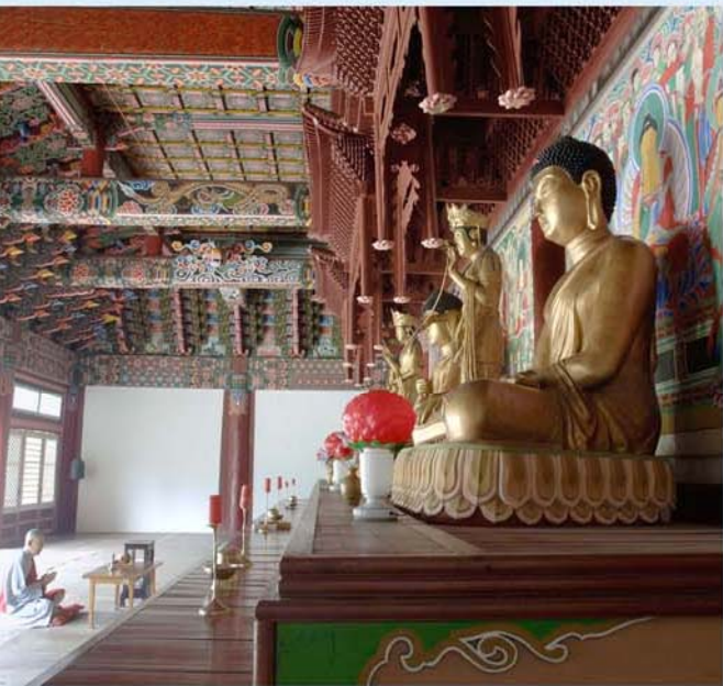
The Taeung Hall in the Pohyon Temple.