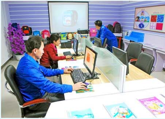
The design office.