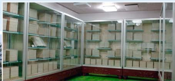
The Pohyon Temple house where the 80 000 Blocks of the Complete Collection of Buddhist Scriptures are preserved.