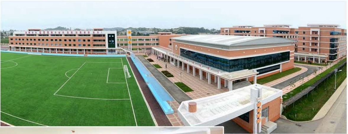
The Pyongyang Middle School for Orphans.