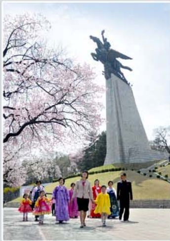
Back Cover: An April spring day