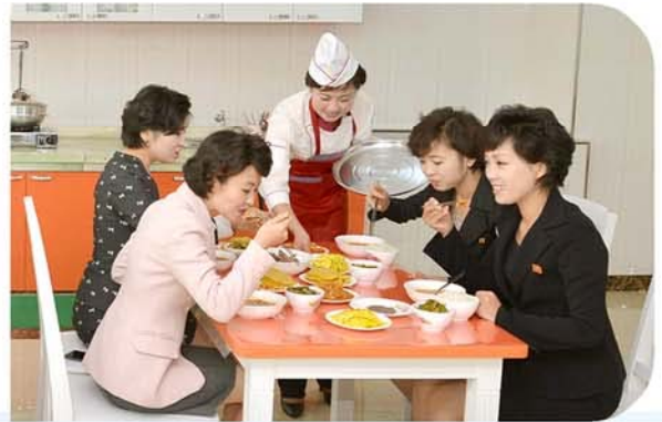
In the cooking practice facility.