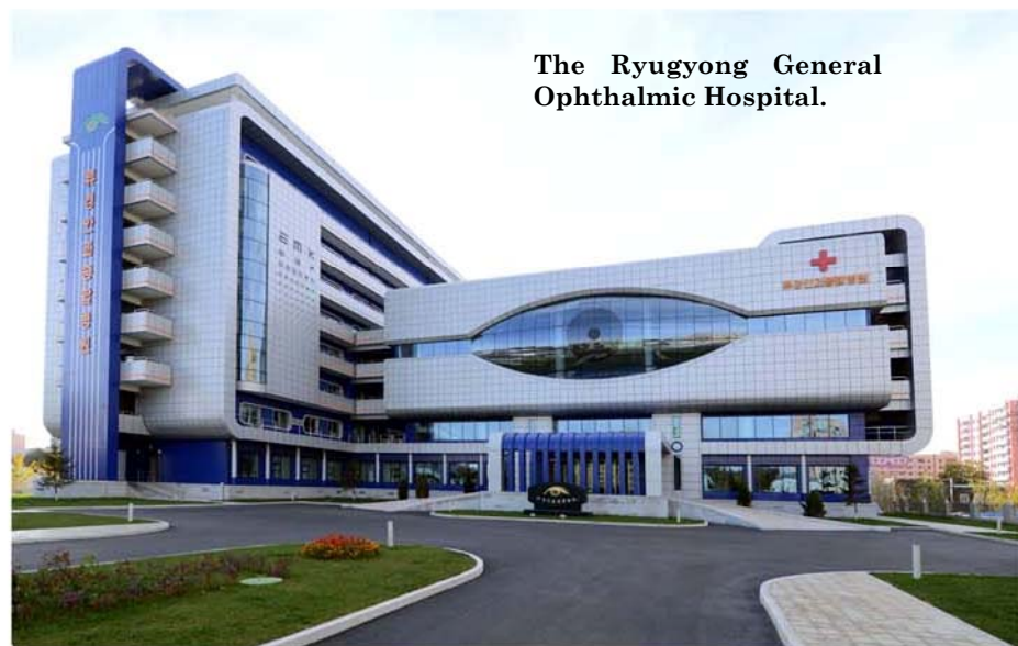
The Ryugyong General Ophthalmic Hospital.

Addressing the First Conference of Chairpersons of WPK Primary Committees held in December last year, Kim Jong Un said that the chairpersons of