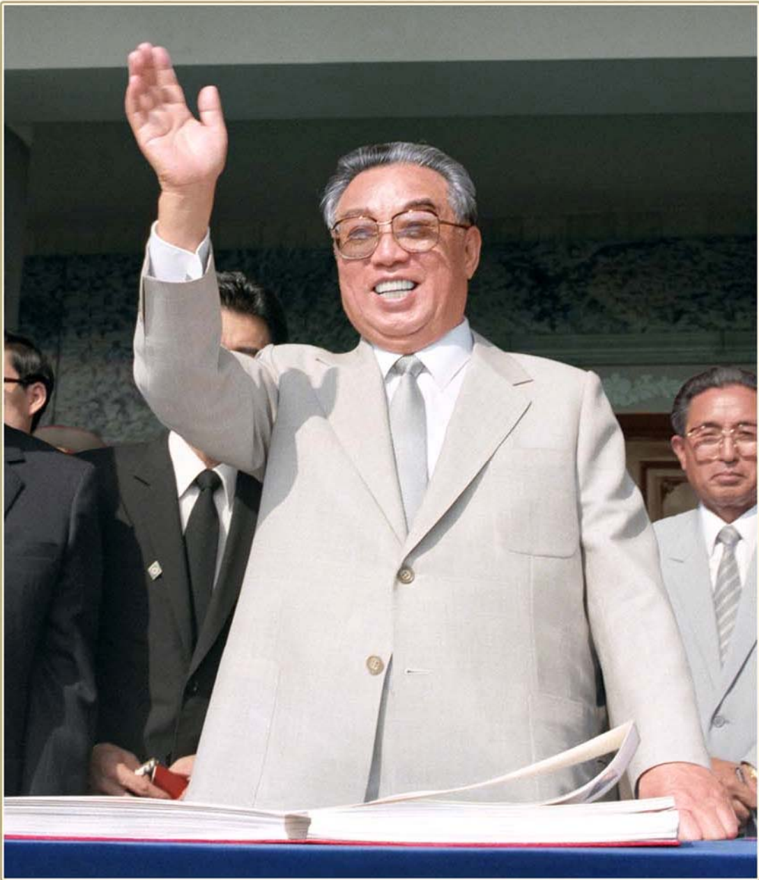
President Kim Il Sung acknowledges enthusiastic cheers of the people in September 1988.