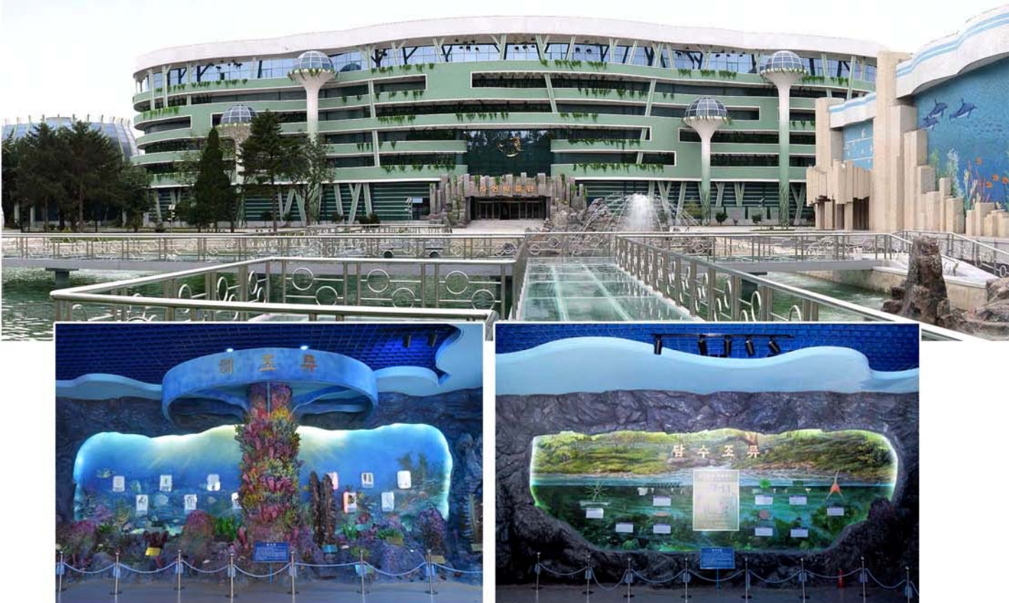
The marine algae and the freshwater algae in the algae district.

GOING UP TO THE second floor, we found a notice indicating the animal hall on the right and the vegetation hall on the left.