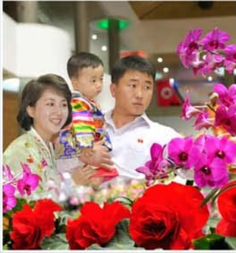
Front Cover: At a Kimilsungia Show