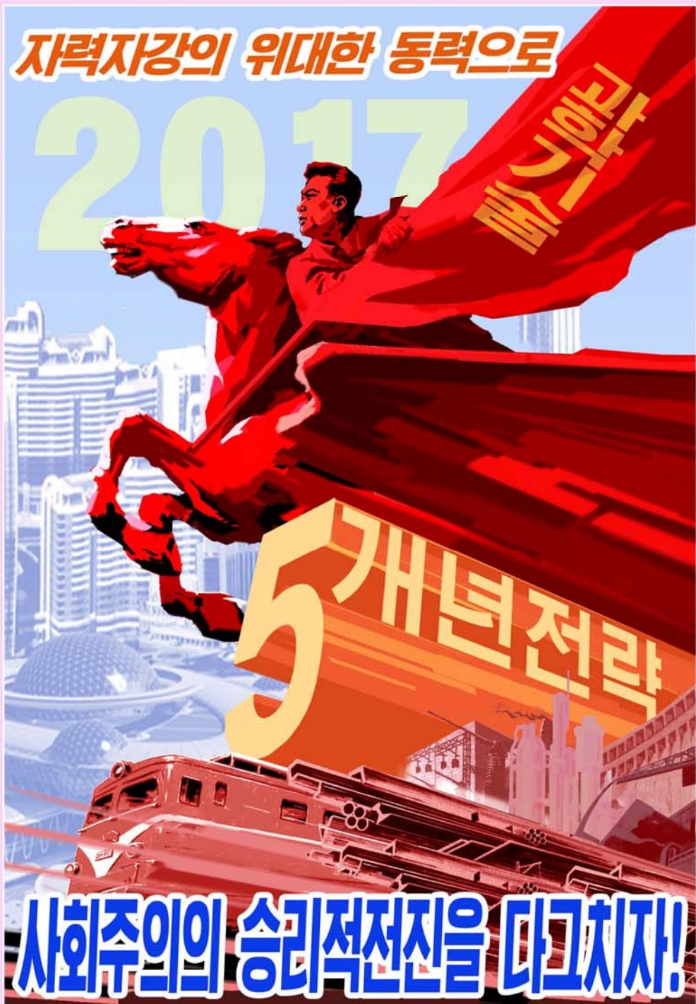
Poster "Let us accelerate the victorious advance of socialism with the great spirit of self-reliance and self-development as the dynamic force!"