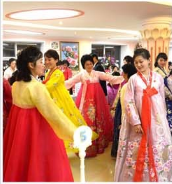
Front Cover: Moving into a new dormitory at the Pyongyang Kim Jong Suk Silk Mill