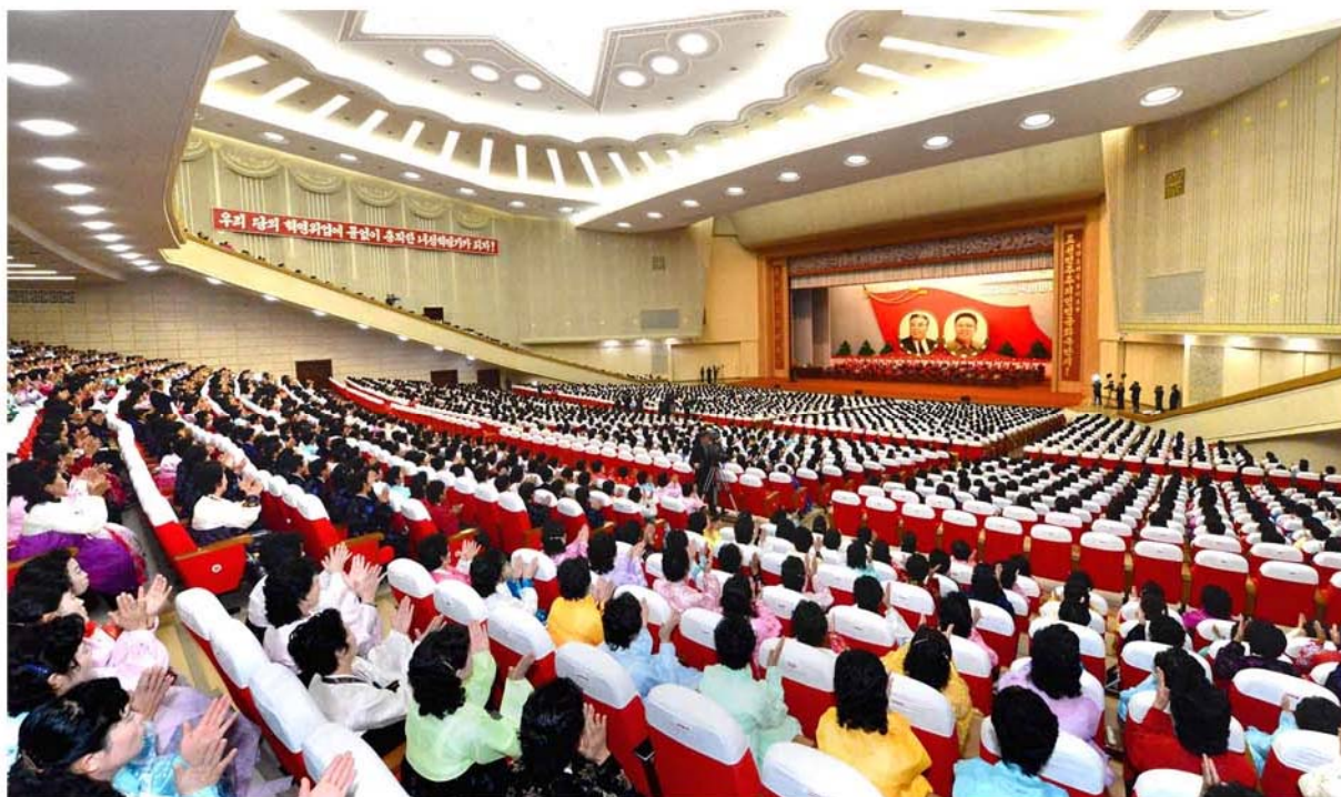
The fourth national mothers' conference held on the occasion of the first Mothers' Day in November 2012.

In early November that year the leader visited the institute again. Stepping into the central hall he said with pleasure that he felt as if he were in a palace. He remarked that all the components of the institute should be of the world standard as it was a determined project for the women, and that there was nothing to spare for the women. He continued to say that as the institute had been fully equipped with ultramodern medical facilities they should establish a regular checkup system to detect mastopathy and breast cancer in their early stage and treat them in time, and that he wanted to leave nothing to regret about the institute as it was to serve the