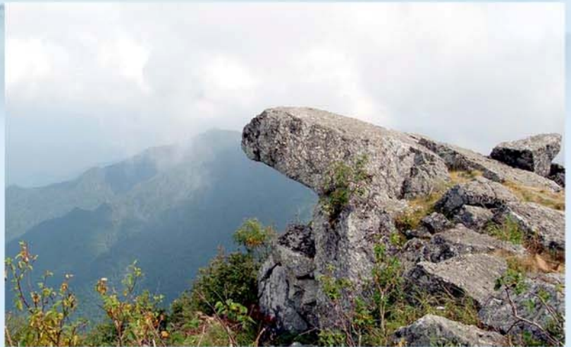
Joyak Rock on Piro Peak.

The Chonthae Falls cascades more than 20 metres down the cliff, the water coming from the rapids flowing off Sokka Peak and over the southern slope of Wonman Peak. The wide waterfalls shoots down the face of the big rock before passing a two-metre deep hollow and falls down the cliff again. At the bottom of the falls is a pool of blue water (over 3