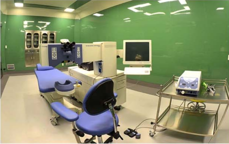
An operating theatre.