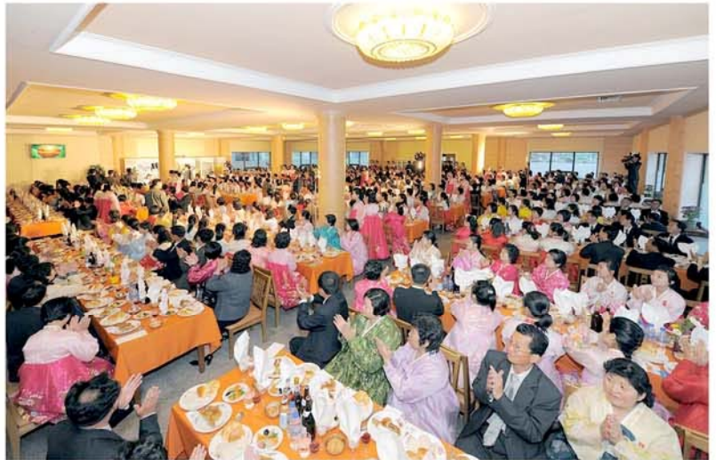
A party is given to workers of the Pyongyang Kim Jong Suk Textile Mill in celebration of the May Day in May 2014.

Thanks to the scrupulous instructions of the leader the conference was held splendidly. It was attended by mothers who had raised their children into stout pillars of the Songun revolution and those who had performed labour merits in the building of a thriving socialist nation. A renowned art troupe gave a congratulatory performance in honour of them. Kim Jong Un had a photo session with the participants. They keenly felt the great expectation of the leader who wished them to glorify their life as