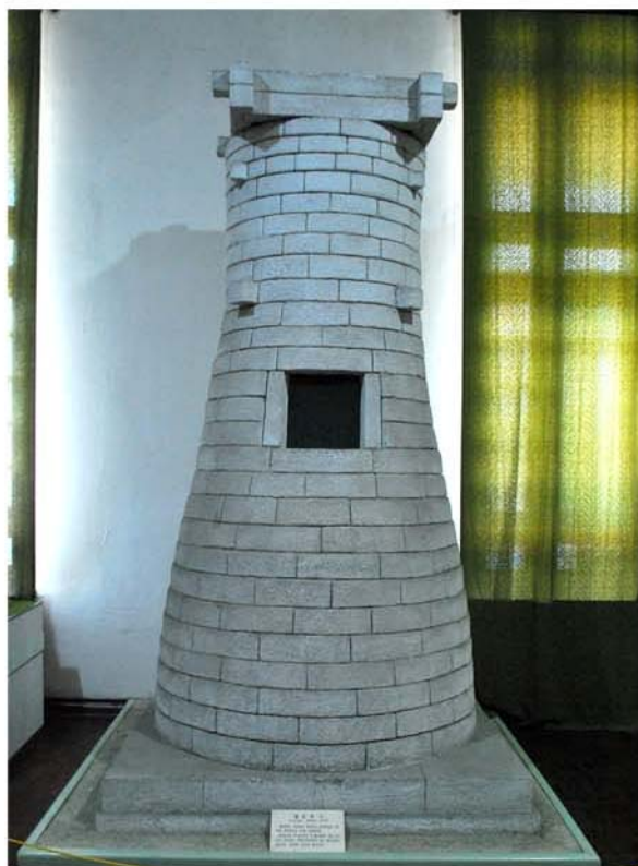
A Chomsongdae observatory (model).

All these achievements made by the Korean people in the past are now preserved as part of the country's invaluable assets according to the policy of the Workers' Party of Korea on preserving national cultural heritage. □