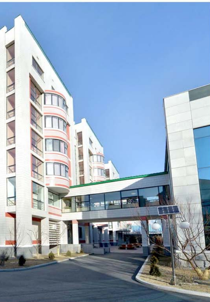
A new dormitory is opened for the workers of the Pyongyang Kim Jong Suk Silk Mill in January 2017.

Hours passed, but he was still unable to leave the company—he saw the soldiers reluctant to part with him. Now he let each of the company soldiers stand by his side one by one to have a photo taken. The appearance of soldiers making a smile with happy tears standing by Kim Jong Un reminded them of a family sealed with blood ties instead of military ranks between the Supreme Commander and soldiers. □