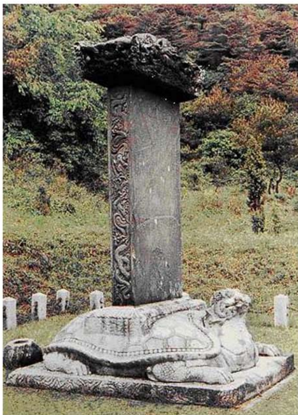
The Monument to the Hyonhwa Temple.

The Korean stone monuments in the Middle Ages (277 BC–1860s) are distinguished in their shapes and refined as objects of formative arts. Typical of the stone monuments of Korea was that the monument body was placed on the back of the stone turtle and then the head decorated with an ornamental dragon was placed on the body. This style was most developed in the first half of the Koryo dynasty (918–1392). The characters carved on stone monuments are of very excellent brush strokes showing vividly the high cultural attainments and artistic skills of the Korean nation. They are valuable legacies of the brush writing art. Therefore, the inscriptions on metal and stone monuments are of great merit as data for scientific research and also as works of formative arts.