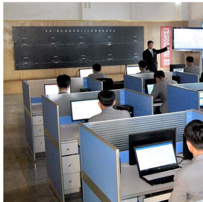
The transport control laboratory.

The university also strives to improve the students' practical ability through experiment and practical training. A building, erected recently in the