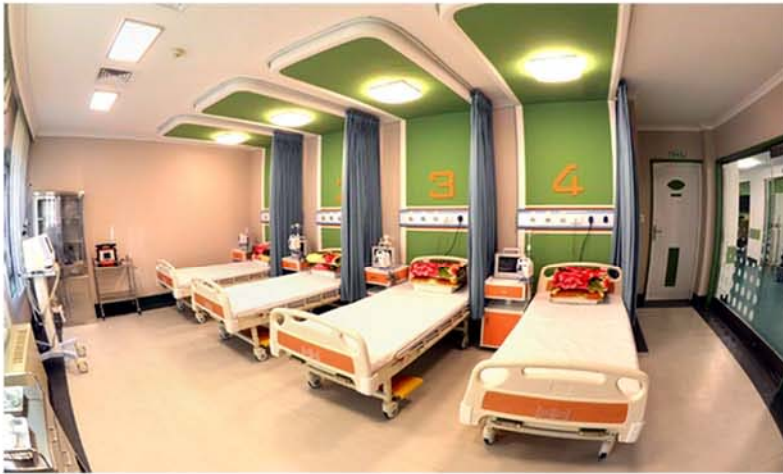
An inpatients' room.