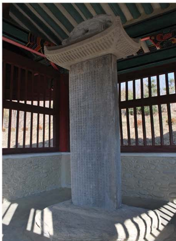
The Monument to the Great Victory in Pukgwon.

Lots of inscriptions on metals and stones—the monument to the mausoleum of King Kwanggaetho of the Koguryo dynasty, carved stones used in the construction of the walled city of Pyongyang, the Pyongyang Bell, the monuments to the Great Victory in Pukgwon and to the Hyonhwa Temple—are important objective reminders of the long national traditions of the Korean people. □