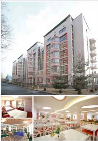
Back Cover: The newly built workers' dormitory at the Pyongyang Kim Jong Suk Silk Mill