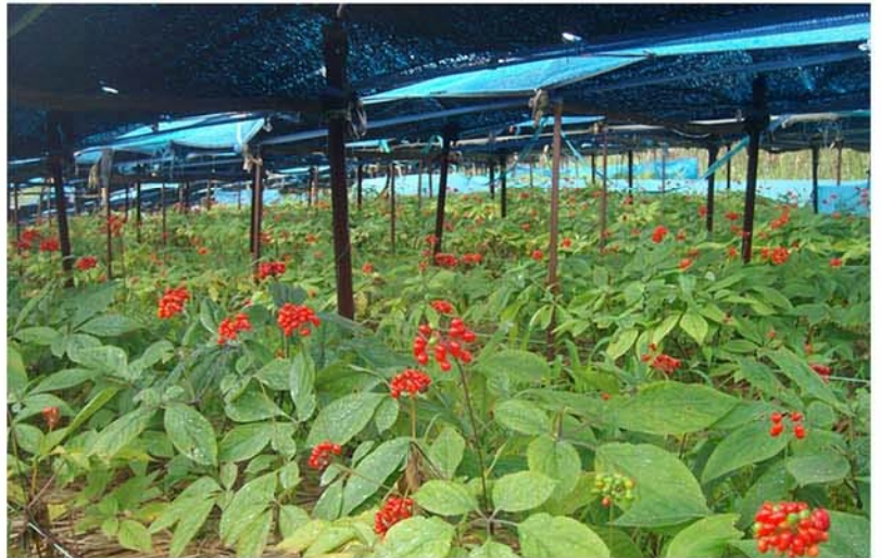
An insam plot.

Insam was widely known as an excellent medicinal material from long ago and used as the best tonic. It has good effects in strengthening restorative and immune functions, stimulating the central nervous system, improving the hematogenous function and the digestion and absorption of foods. It also has nice effects on metabo-