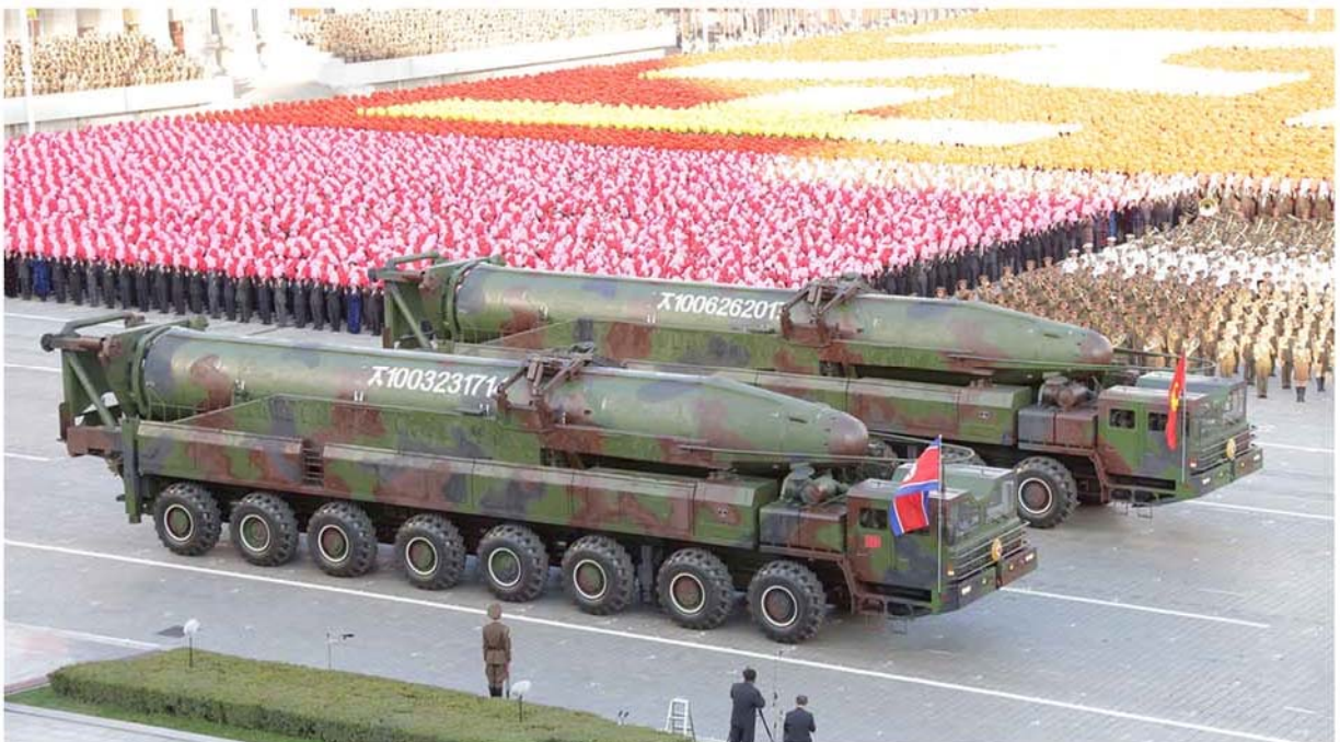
A scene from the military parade and Pyongyang citizens’ mass demonstration in celebration of the 70 th founding anniversary of the Workers’ Party of Korea in October 2015.