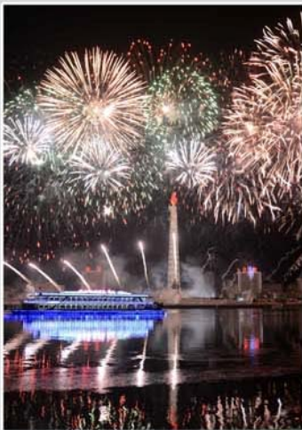
Back Cover: A firework display in celebration of Chairman Kim Jong Il's birthday in February