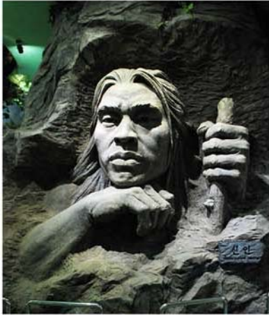
A head model of Neolithic man.