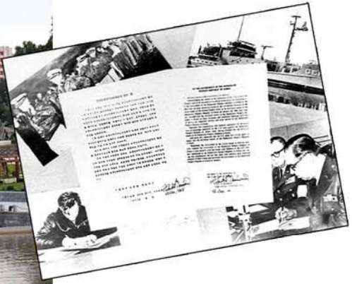
Captured American armed spy ship Pueblo and the letter of apology of the US imperialists.