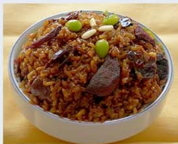
Yakbap (sweet rice).