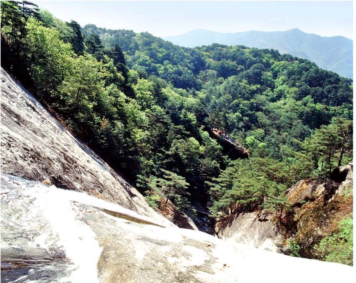
On the Manphok Rock.