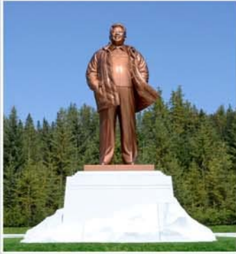
Front Cover: Statue of Chairman Kim Jong Il erected in Samjiyon County in September 2016