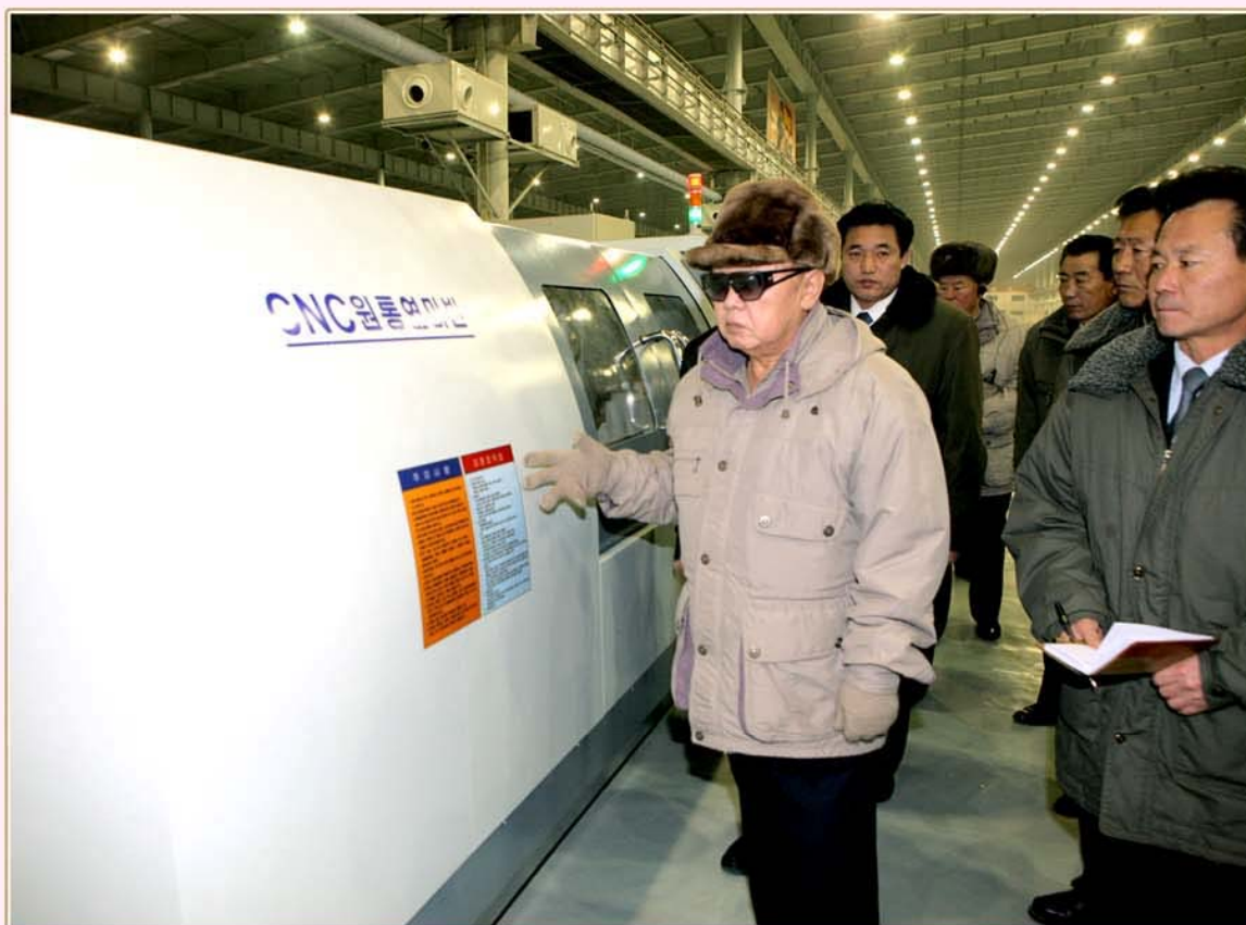
Chairman Kim Jong Il sees new models of CNC machine tools in December 2010.

T HE DEMOCRATIC PEOPLE'S REPUBLIC of Korea's cause of building a socialist power is suffering all sorts of difficulties due to atrocious anti-DPRK schemes of hostile forces. Despite the difficulties the Korean people are advancing vigorously on the strength of their own resources, their scientific and technological potentialities.