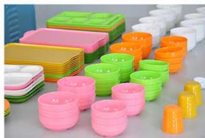
Different kinds of zips and melamine resin products.

phisticated to save time and labour while checking the quality of zips accurately. The annual production capacity can fully meet the national demand for zips needed for production of necessities of life.