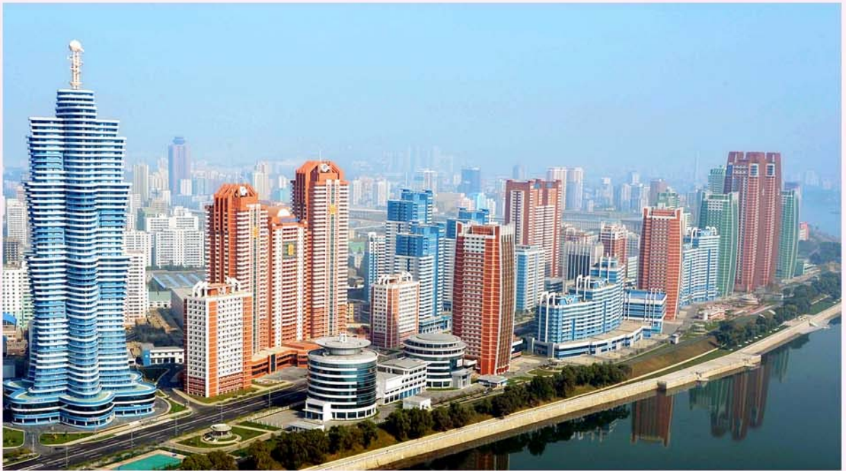
The Mirae Scientists Street.