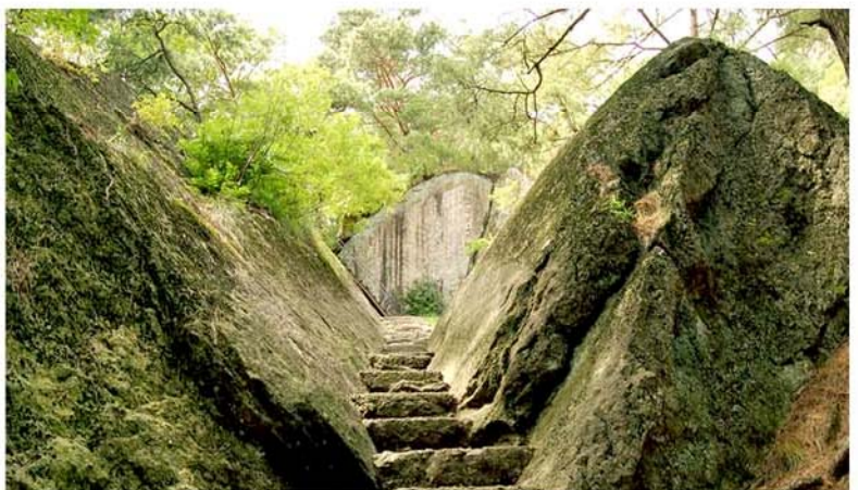
The road to Ssang (couple) Rock.