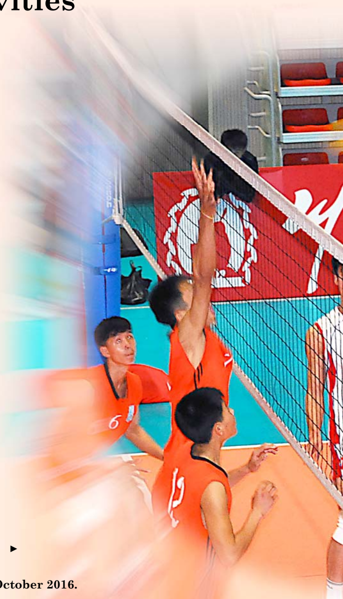
Scenes from the 13 th People's Games in October 2016.

In the tennis event, the South Phyongan Province team was ranked high. Having learned a lot of experience and lessons from the National Inter-provincial Games-15, they achieved an unprecedented success at the last People's Games. The coach organized the team with industrial and farm workers from the lowest echelons who had practiced tennis while engaged in everyday sports activities. And he trained them strenuously. He concentrated on the