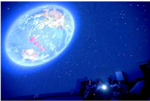
The outer space hall.