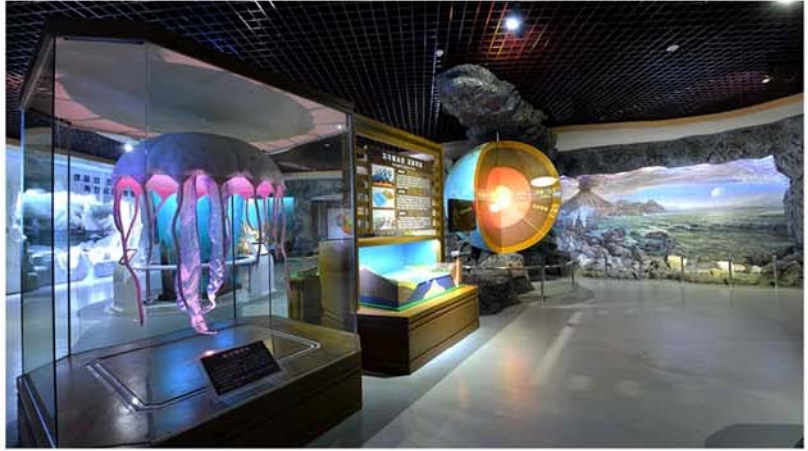
The general hall of ancient life.

► modern man was born through the stages of Pithecanthropus, Palaeolithic man and Neolithic man, the guide concluded that lots of fossils of mankind and their stonework as well as mammal fossils were discovered in the Taedong River basin centring Pyongyang, vividly proving that Korea is one of the cradles of