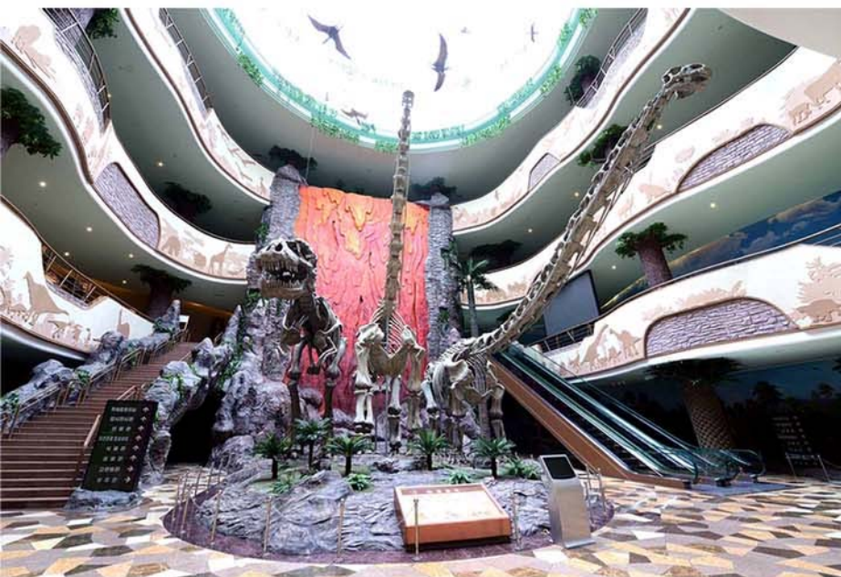
The central hall.