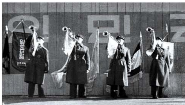
Scenes of the first military parade of the Korean People's Army in celebration of its development into regular revolutionary armed forces in February 1948.

The leader Kim Il Sung, who had defeated by guerrilla warfare the Japanese imperialists—who were swaggering as "leader of Asia"—and accomplished the historic cause of national liberation, regarded the construction of regular armed forces as a vital problem related to the construction of a new Korea and the future of the nation and accelerated the building of a regular army purposefully. In 1945 the Pyongyang School was established and in 1946 the Central Security Cadre School was founded. The Marine Security Cadre School and the Flying Corps were set up in 1947. Thanks to the energetic guidance of the leader who paid deep attention to the training of military and political officers, founding of different services, arms, special units, and deciding military ranks and uniforms, and developing Korea's