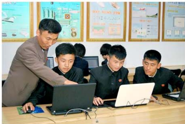
The IT circle.