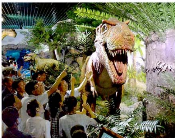
Working people and schoolchildren look round the Mesozoic hall.

Saying that the animal ancestor of the human being was a monkey with two legs and the