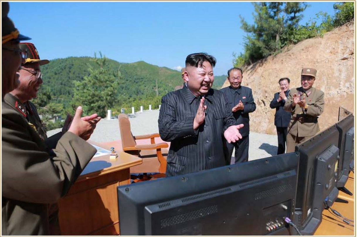
Supreme Leader Kim Jong Un gives guidance to the test fire of ICBM Hwasong 14 in July 2017.