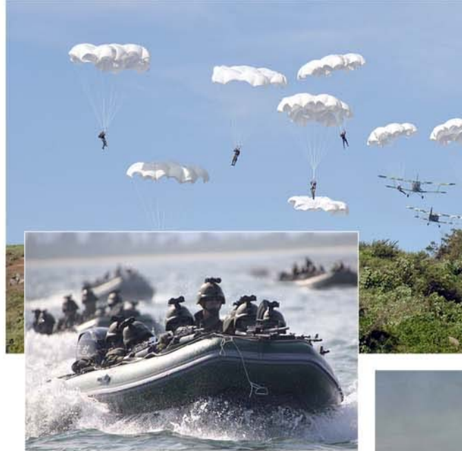
Striking exercises of the KPA arms and services to cope with war moves of the US imperialists and its vassal forces.

Before the US could get out of the shock, the KPA Strategic Force, in three months, succeeded in the first test-fire of Hwasong 12, a new model of ground-to-ground intermediate-range strategic missile which can carry not only standard nuclear warheads ►