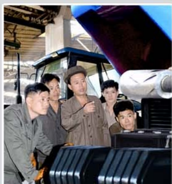
Front Cover: Producers of 80hp Chollima-804 tractors of a new type.