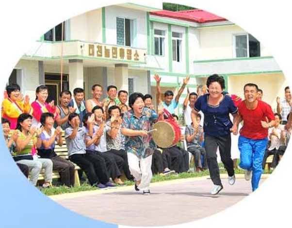
Holidaymakers enjoy themselves.

The rest homes each have welfare and medical service facilities, a library, a gym, an amusement hall and a cinema, and the compound of each of the homes is designed for elderly people to take a walk and have a meal outdoors. And the homes are characterized by rooms provided with underfloor heating systems or beds to the elderly's liking. Each of the homes also has a hydroponic greenhouse and a vegetable garden where they can raise vegetables to be used for their own meals. Foreigners can go there to see the elderly leading a happy life under the care of the State. □