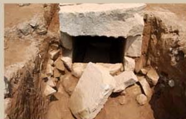
The entrance to the burial chamber.