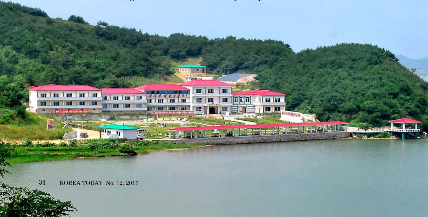
The Thaechon Agricultural Workers' Holiday Camp.

receive through holiday camps and sanatoria. Our country has hundreds of holiday camps and sanatoria, where hundreds of thousands of people enjoy themselves every year. In December last year holiday camps for farm workers across the country went into operation, and this year all other holiday camps were crowded to capacity in summer and autumn which are called recreation days. Of course the State takes thorough measures to support the holidaymakers, and most of the relevant expense is borne by the State. The holiday camps run greenhouses, mushroom farms and livestock and fish farms they built by themselves, and their fresh products are used for holidaymakers' meals free of charge. The camps draw up diversified recreation schedules in accordance with their own geographical characteristics—the schedules include sea bathing, climbing, field trip and amusements—so as