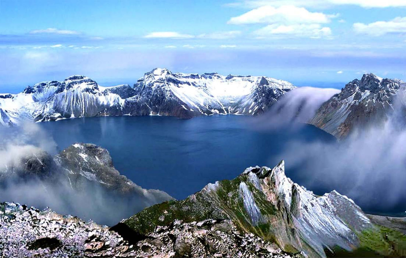
The thrilling yet graceful scene of Lake Chon.