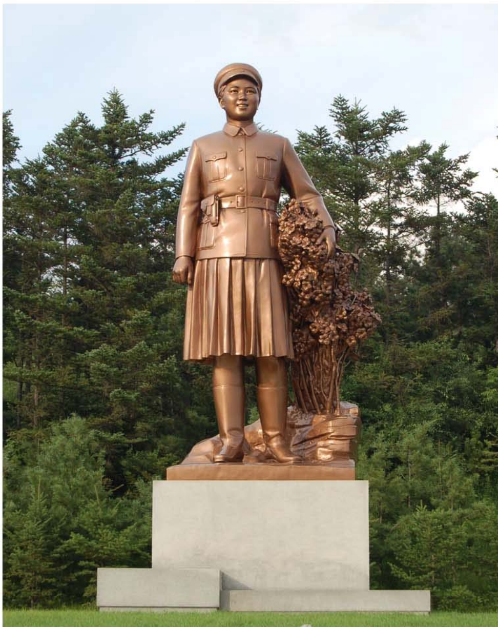
A bronze statue of the anti-Japanese war heroine Kim Jong Suk.

T HE ANTI-JAPANESE WAR heroine Kim Jong Suk was an indomitable revolutionary, commander of Paektu and versatile socio-political activist who