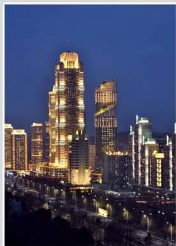
Back Cover: Ryomyong Street at night.