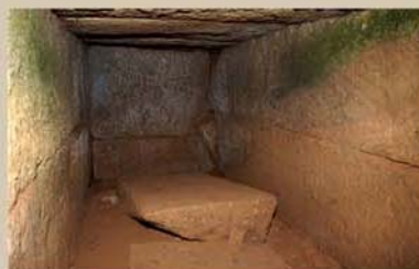
The interior of the burial chamber.

I T IS AN INVARIABLE policy of the Workers' Party of Korea to enrich the national cultural heritage and preserve them well by unearthing more historical relics and remains. Accordingly, the Democratic People's Republic of Korea is intensifying the relevant surveys and studies to find out new historic relics and remains. In the course of this, the tomb of Sukjong, the 15 th king of Koryo (918–1392), was unearthed in August 2017.