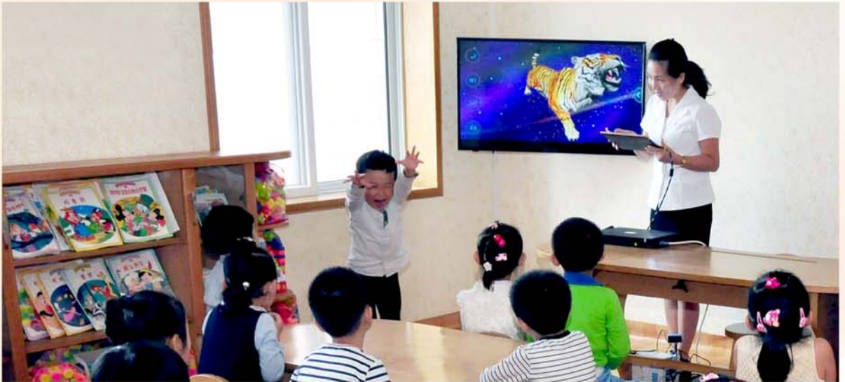
Lessons are given using the education-support program “A Land of Mystery” (fauna).

T ODAY KOREA IS RAPIDLY improving pre-school education along with enforcement of universal 12-year compulsory education. Kyongsang Kindergarten has set an example, its educational conditions attracting public attention. In the past it was well known across the country for creating a lot of good models of kindergarten education: for example, stars pasted on walls of corridors, footprints carved on stairs to show the rule of walking on the right side facing traffic and big red star-shaped ceiling to the liking of children—all of them demonstrate its teachers' efforts made to develop the intelligence of children and cultivate their emotions and feelings and morals. So all visitors to the kindergarten said in admiration that they felt as if they had been in