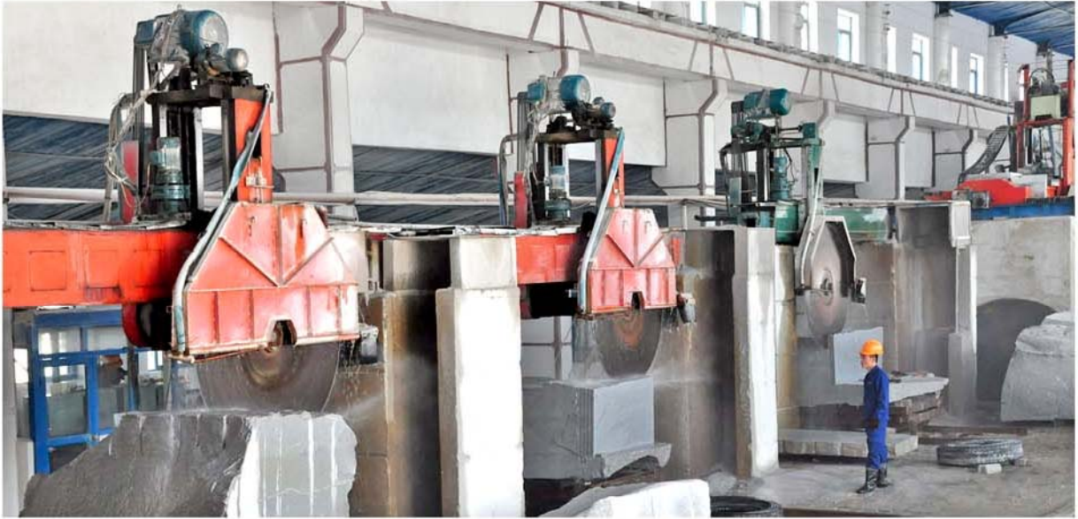
Medium-sized rough stone cutters.

Rough stone production is on the increase through timely solution of problems in operation of the self-propelled cutter.