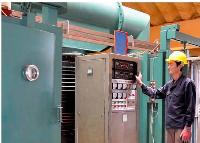
Mirrors are produced for major construction projects.

T HE MIRROR WORKSHOP of the Pyongyang Metal Building-materials Factory produces quality mirrors of various sizes.