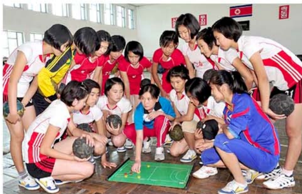
At a tactics discussion.