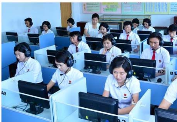
A foreign language lecture.