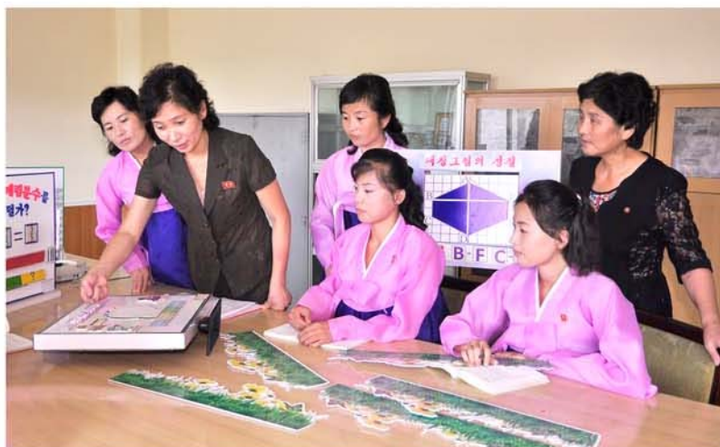
A discussion on education and visual aids.

ing a teaching aid, titled, Be a Well-mannered Pupil . There was a repeated discussion on representing the aid manners in the bus, over the phone, and between friends as suited to children's mentality. They decided to represent these scenes in cuts like a film. As those which pupils learn were portrayed in different styles and methods on the corridor and stair walls, pupils were attracted