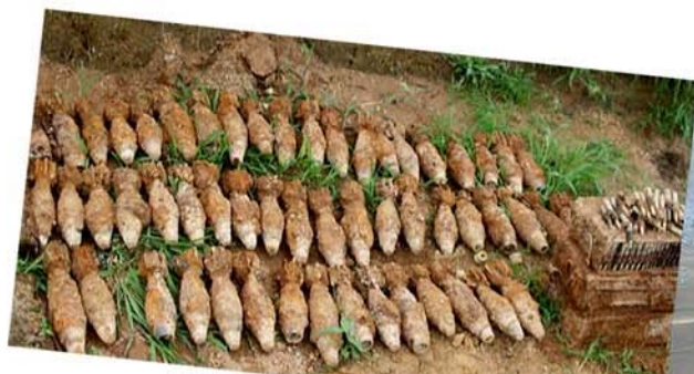
Some of the cleared US-made explosives.