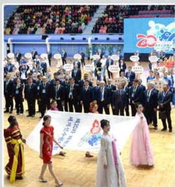
Front Cover: The 20 th Taekwon-Do World Championship takes place splendidly in Pyongyang in September 2017.