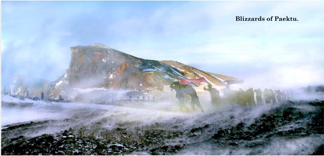
Blizzards of Paektu.