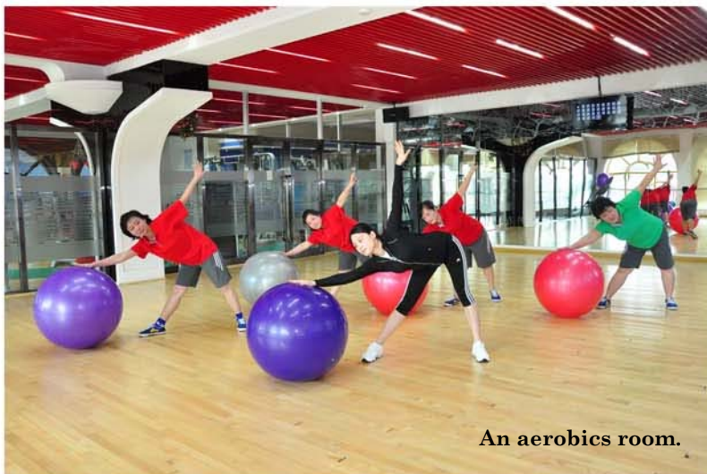
An aerobics room.