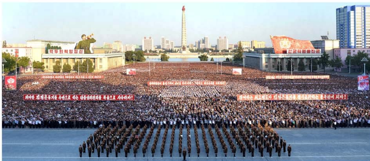
Pyongyang citizens pledge to win final victory in the showdown against the US by means of an all-out effort of the nation (September 2017).

T HE WHOLE LAND OF THE DEMOCRATIC People's Republic of Korea is burning with hatred and wrath. All the service personnel and people are fully determined to revenge themselves on the US, their century-old enemy, through a sacred war. Trump, holding the prerogative of supreme command of the US, shocked the whole world by going so far as to express at the recent session of the UN General Assembly his will to "totally destroy" the DPRK, unsatisfied with his wild talk about "maximum pressure and engagement" and "fire and fury." But the old American lunatic's absurd speech could neither frighten nor stop the country in the very least. The Koreans are the kind of people who hold their dignity and sovereignty dearer than their lives, and their country is a socialist power that voices what it wants to say and is advancing along the road of its own choice laudably and rapidly.