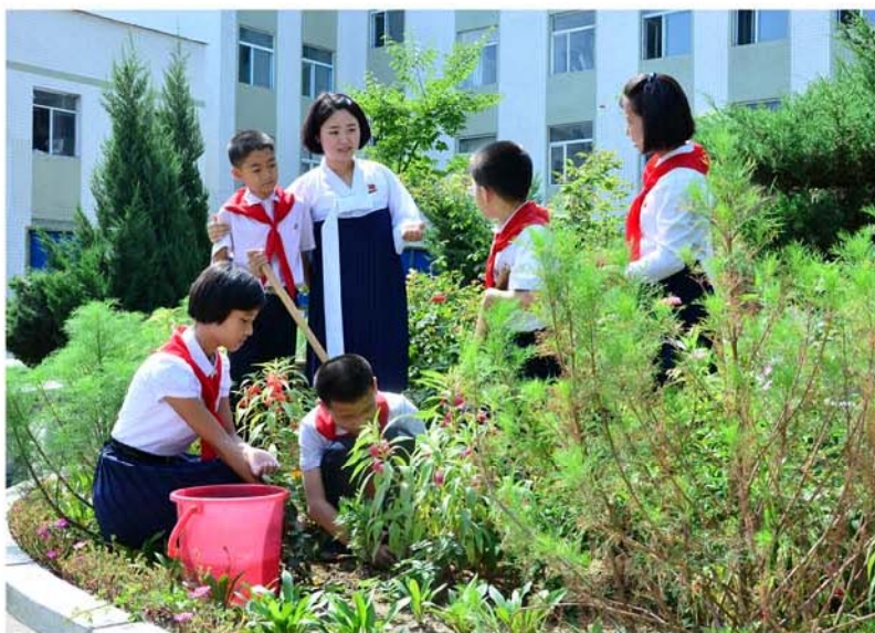
Practice in education.

senior middle schools. We have only made efforts to become models for the future teachers."