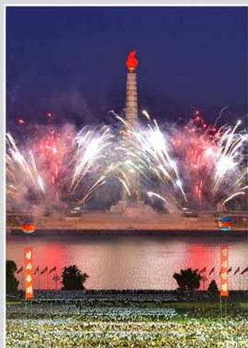
Back Cover: Service personnel and Pyongyang citizens jointly celebrate the complete success in the ICBM-ready H-bomb test.