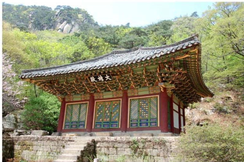
The Taeung Hall at the Kwanum Temple.

The observatory testifies to Koryo's high astro- ►