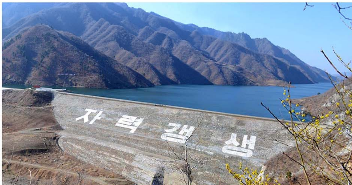
The Wonsan Army-People Power Station built on the strength of the spirit of self-reliance and self-development.

I N KANGWON PROVINCE THERE IS A POWER station the local people call Wonsan Army-People Power Station with pride. It was completed last year.