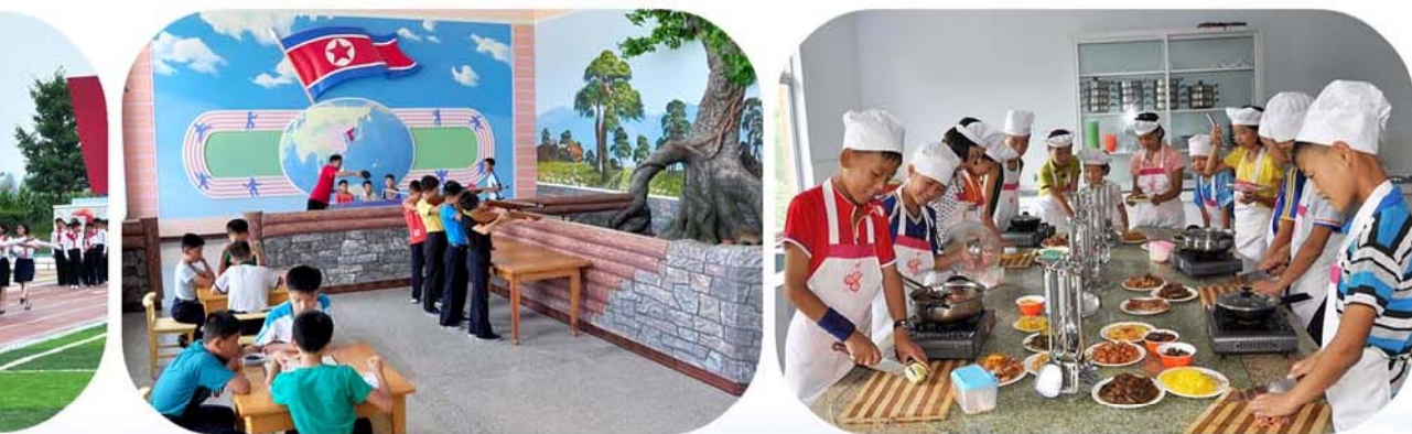
They enjoy camping days.