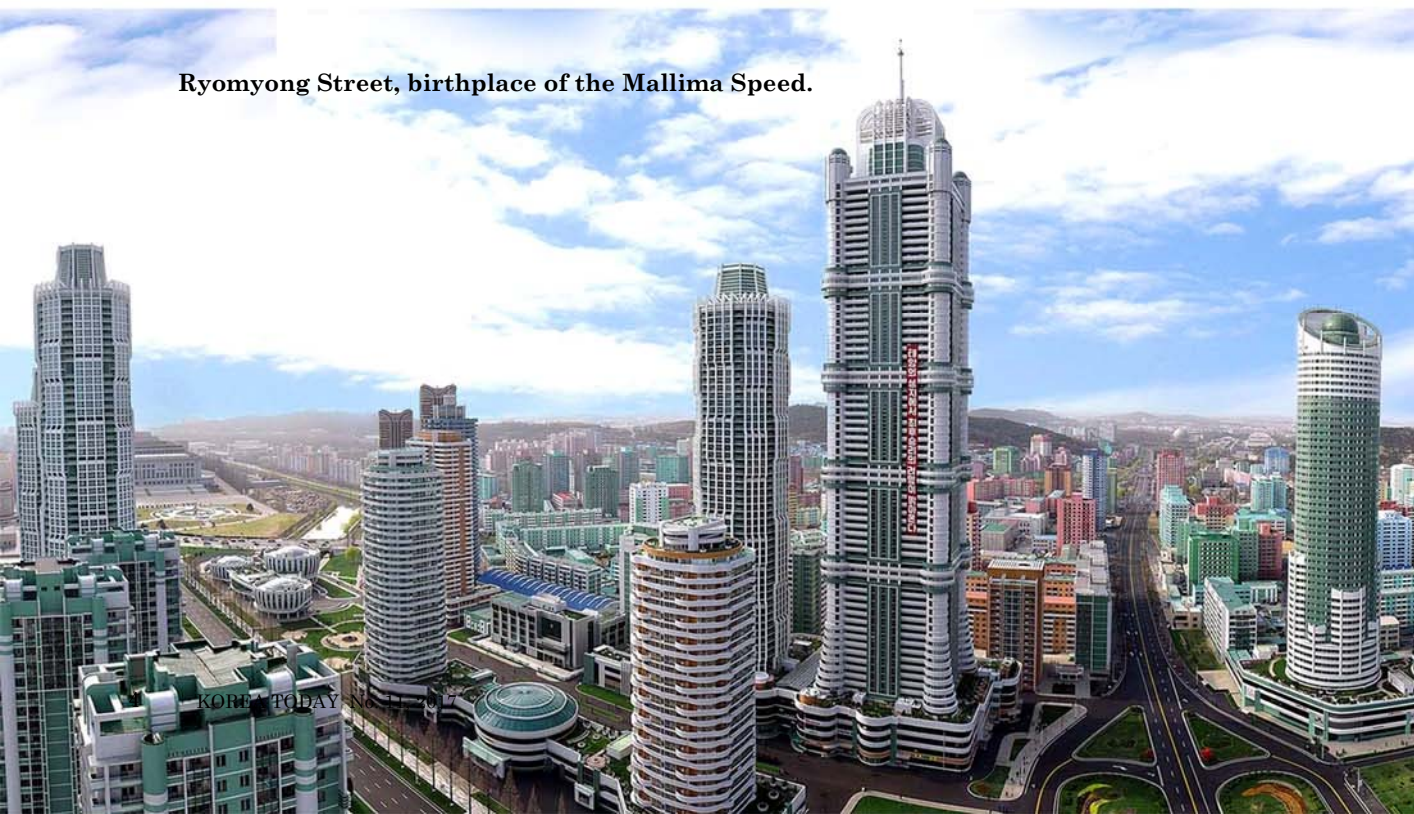
Ryomyong Street, birthplace of the Mallima Speed.

During his visit to the Pyongyang Kim Jong Suk Textile Mill, Supreme Leader Kim Jong Un earnestly said that they should live and struggle in such a way as to answer the question of Are you a Mallima ►