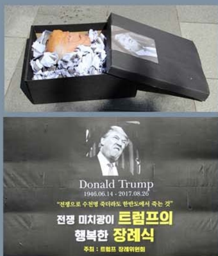
The happy “funeral” of warmaniac Trump held in front of the US embassy in Seoul, south Korea, in August 2017.