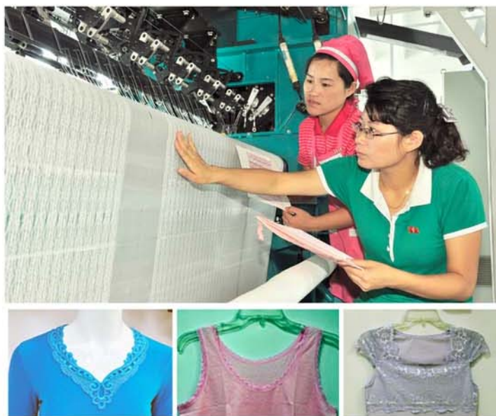
Varieties of laces are made.