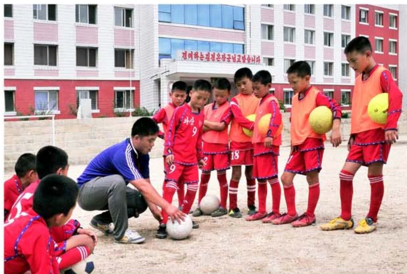
They learn dribbling skills.

Then the school proceeded to create new teaching methods. One day the vice-headmaster inspected O Myong Hui's mother tongue lesson at work. The pupils were attracted unawares to the teacher as O showed several species of bean plants, explaining what kind of crop bean is and how good it is for human health. Then she organized groups of pupils and encouraged them to play a game of finding words with the