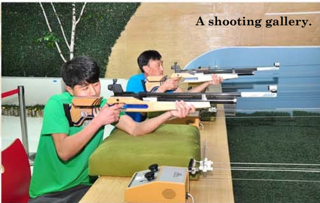
A shooting gallery.