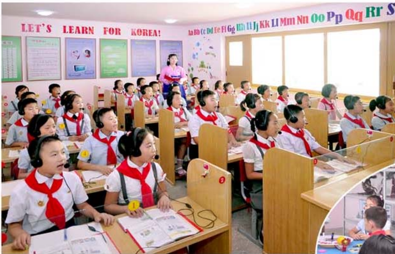
The cognitive faculty of the pupils is rising thanks to the radically improved educational environment.