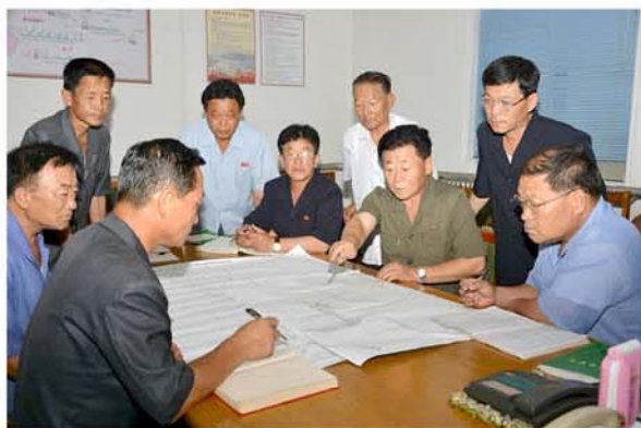
A consultation of officials on construction of a power station.

► working, and all of them joined in the dangerous work to pull down the watertight section.