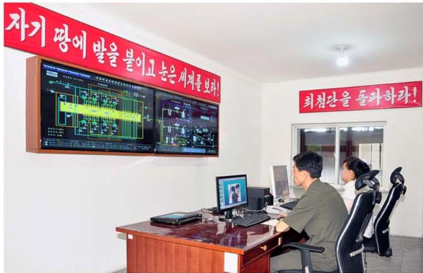
The control room for anthracite gasification and high-temperature air combustion calcination processes.

This, however, required many scientific and technical problems to be solved. Above all, they had to build a process for production of coal briquettes. What mattered was to solve the problem of the relevant bonding agent. There