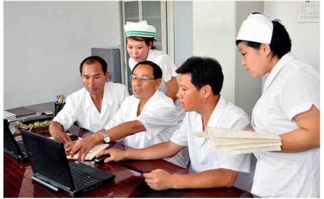
A consultative meeting to save a critical case.

E ARLY IN MAY LAST AN emergency case was rushed to Chollima District People's Hospital in Nampho City.