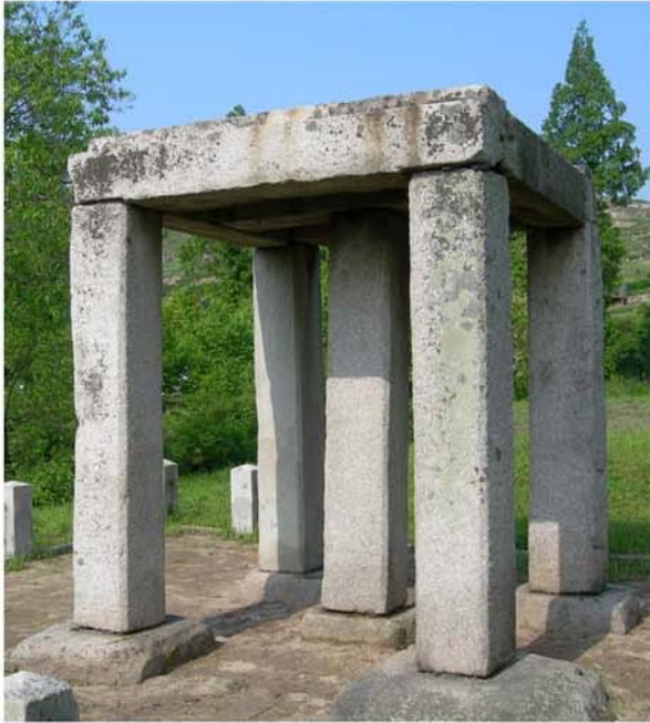
Kaesong Chomsongdae Observatory.

The Koreans made astronomical and meteorological observations from ancient times. During the period of Koryo they established a relevant professional agency that employed the observatory to observe meteorological phenomena and recorded the results in detail. There are over 50 records on observation of sunspot from 1105 to the late period of Koryo, and those on detailed data on solar eclipses, comets, falling stars and a strange celestial object.