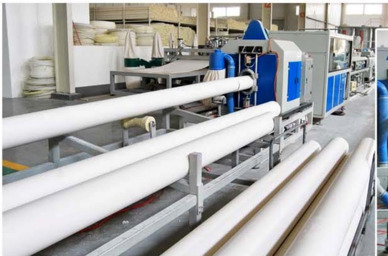
The plastic building materials workshop.