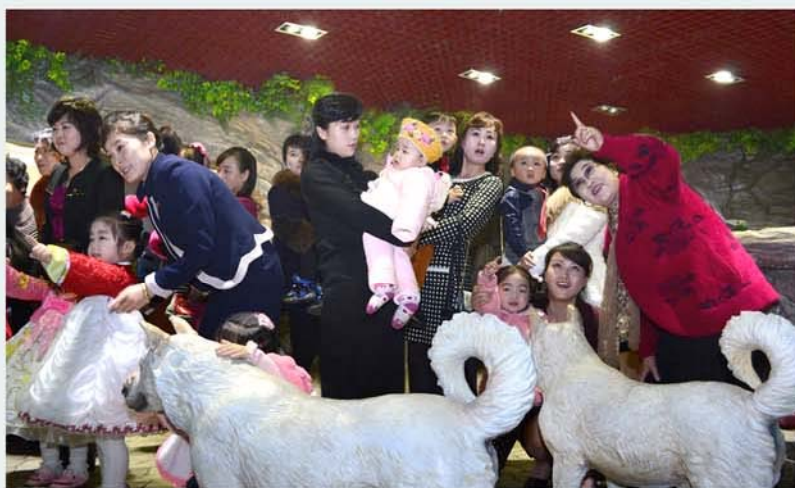
The dogs house.