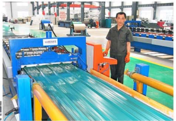
The sheet-metal roofing materials workshop.

The first-stage project finished on October 4, 2012 and thus the factory laid a foundation for production of lots of building materials such as varieties of blocks, light steel structures, plastic boards, foamed plastic, plastic sashes and so on. To further the success the factory decided to conduct the second-stage project from November that year fully to meet the increasing demand for building materials relying on their own efforts and technology. It wasn't easy at all to carry out the project relying on their own efforts while ensuring the production of building materials