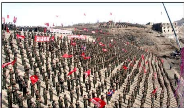
Members of the Paektusan Hero Youth Shock Brigade built the dam of Paektusan Hero Youth Power Plant No. 3 in less than three months.

The Korean people are conducting the Mallima movement in a far from peaceful environment. The aggressive manoeuvres and economic sanctions of the US imperialists and its vassal nations have