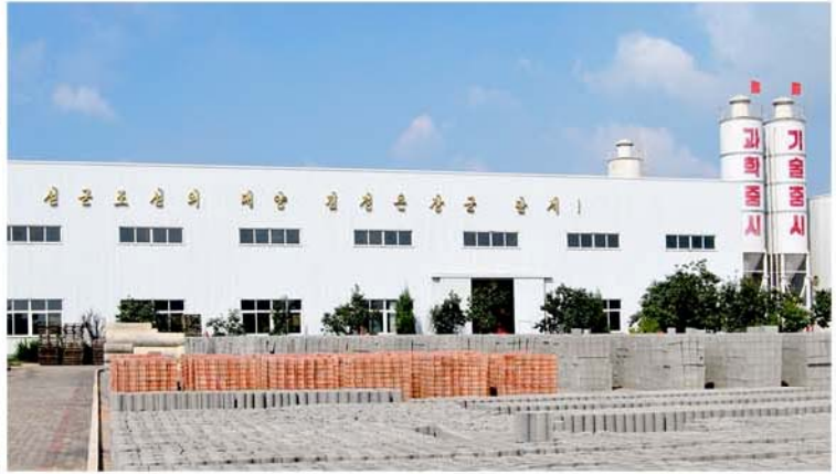
The block workshop.

► needed for major construction projects. Some asked to take it easy as they had just done the first stage and others were of the opinion to get support from the State for building force. But Chief Engineer Kim Hyok Chol argued, "If we are to realize the Workers' Party of Korea's far-reaching plan to provide our people with the most civilized and happiest life and turn our country into the most thriving paradise, we should develop our factory into a comprehensive building materials producer by carrying out the project asap relying on our own efforts." And he pushed ahead with the project vigorously.