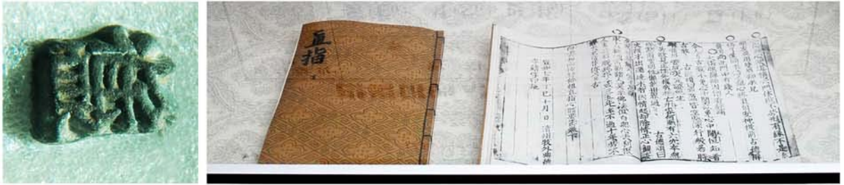
Metal types unearthed in Manwoltae and Jikjisimgyong printed with metal types.

T HE FIRST METAL TYPE OF THE WORLD belongs to the creation of the Korean nation. It is associated with the history and culture of Koryo, the first unified state of Korea. In the course of uninterrupted, intensified survey and excavation of historical sites and remains a metal type was unearthed in 1956 at Manwoltae in Kaesong, Korea, where the royal palace of the Koryo dynasty stood. Another one was dug out in November 2015, which is 6mm high, and 13.5mm long and 14mm wide on the side of an embossed letter; the back side of it has a semi-globular gouge.