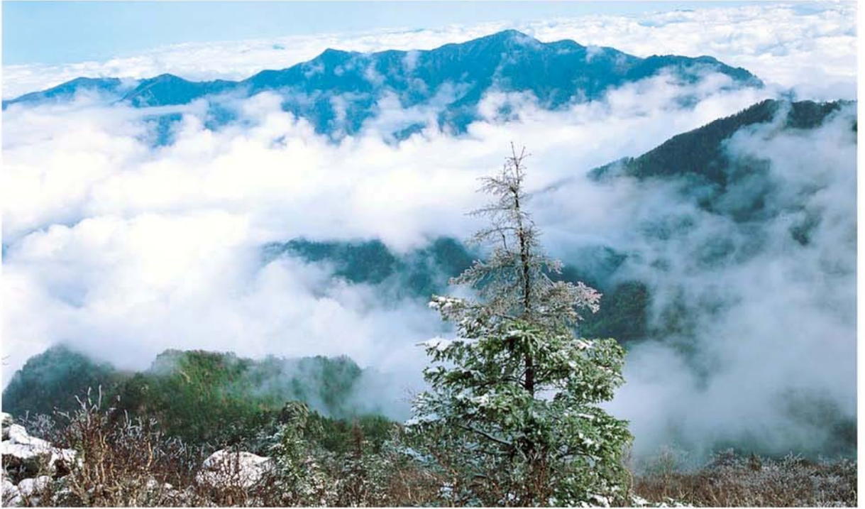
Mt. Myohyang wrapped in clouds.

M T. MYOHYANG, ONE OF the celebrated mountains in Korea, embraces a wide area of Hyangsan and Kujang counties in North Phyongan Province, Nyongwon County in South Phyongan Province and Huichon City in Jagang Province.