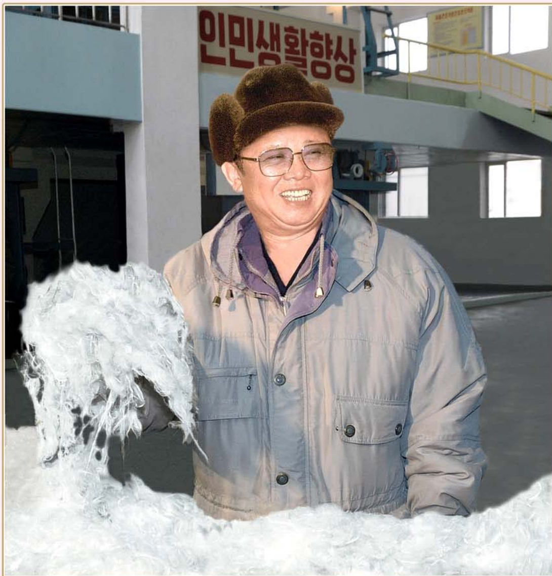
Chairman Kim Jong Il sees vinalon cotton in February 2010.

C HAIRMAN KIM JONG IL was a peerless patriot who not only firmly defended the independence of the country, the national dignity and the socialist system of Korean style but also provided priceless material assets for the building of a powerful