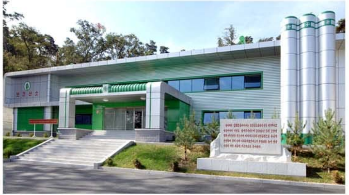
The Medical Oxygen Factory.

► reached an extreme to stop the progress of the Korean people and stifle their idea and system. Nevertheless, the more desperate the enemies' manoeuvres become, the stronger the aspiration and desire of the Korean people become who are determined to build a socialist power, one with great national strength that is ever-prospering and whose people live happily without envying anyone in the world. And the revolutionary spirit and enthusiasm of the Korean people are increasing day by day to prevail over the capitalism in all the aspects—not only in political and military spheres but also in economic and cultural fields—relying on their own efforts and technology as well as resources.