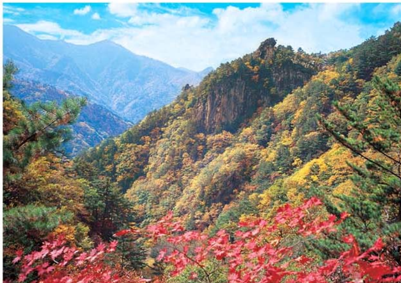
Poryon Rock in autumn.

► one with both the fantastic and magnificent qualities. Renowned for its “eighty four thousand peaks” from ancient times, it has distinguished sceneries—lots of magnificent and fantastic peaks, giant rocks, deep ravines and high cliffs, crystal clear water, many waterfalls, thick forests, luxuriant trees throwing cooling shades