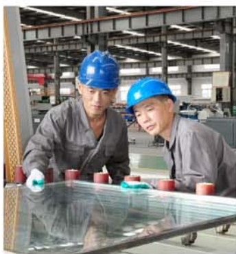
Front Cover: Efforts are made to improve the quality of building materials (at the Chollima General Building Materials Factory)