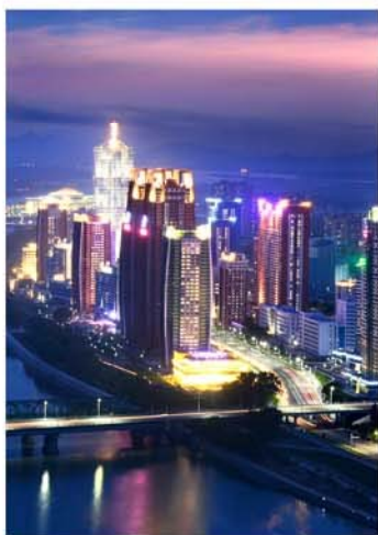
Back Cover: Nocturnal scene of Mirae Scientists Street