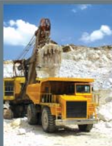
Production of Magnesite Ores