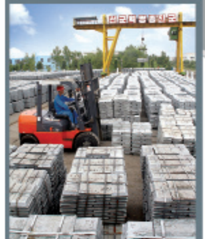
Shipment of zinc products