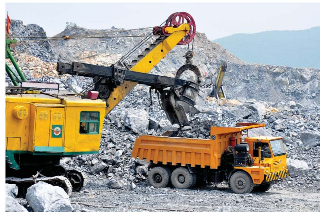
The Sangwon Limestone Mine is boosting production by operating mining machines and vehicles at full capacity

The other units taking charge of supplying steel castings and machine