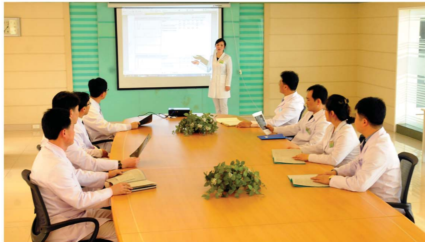
Medical workers at the clinic devoted their sincerity