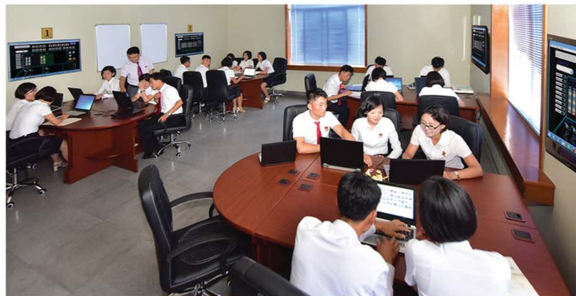
At the laboratory for economic management simulation