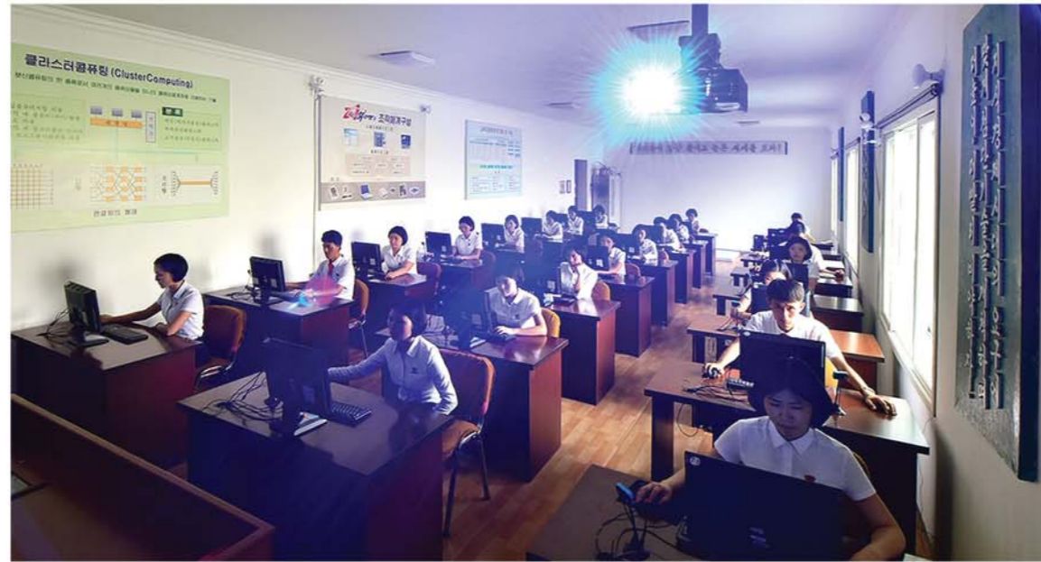
Acquiring IT knowledge

Not only lecturers and researchers but also postgraduates and students are encouraged to take an active part in research activities, thus achieving brilliant successes.