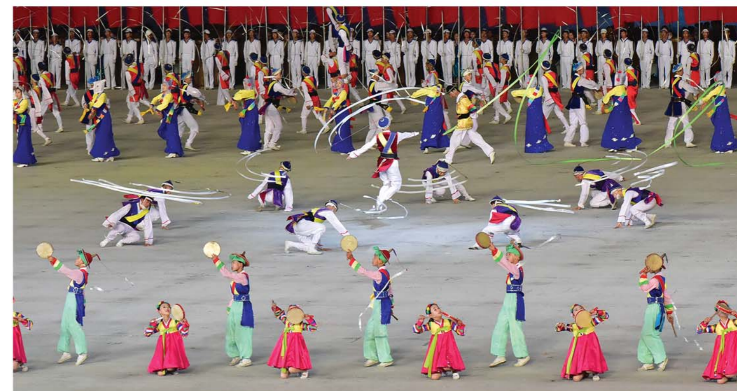
A scene of their performance in the grand mass gymnastics and artistic performance The Land of the People

Article: Kim Son Gyong