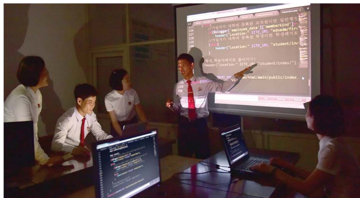
Discussions on programming

All the teaching staff and students of the university are heightening their zeal for giving strong impetus to the development of light industry by implementing the intention and plan of