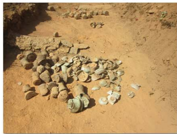
Porcelains, shelf and bricks unearthed in Muchang-dong, Rason