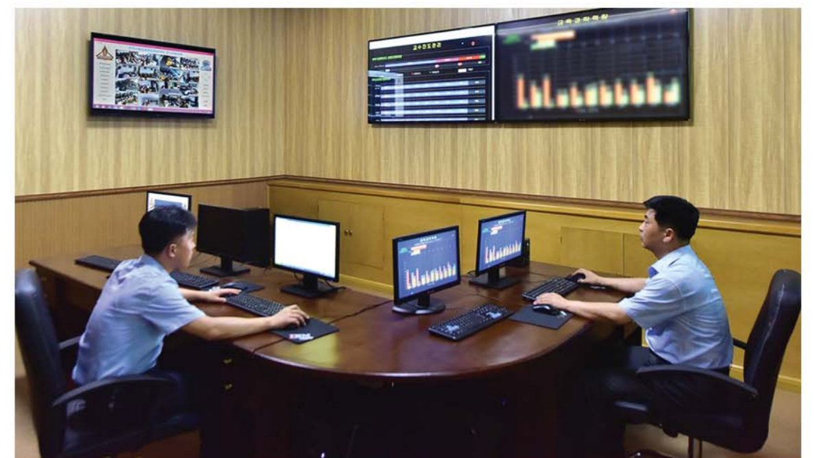
Efficient methods are developed and generalized in teaching and environment for education is improved