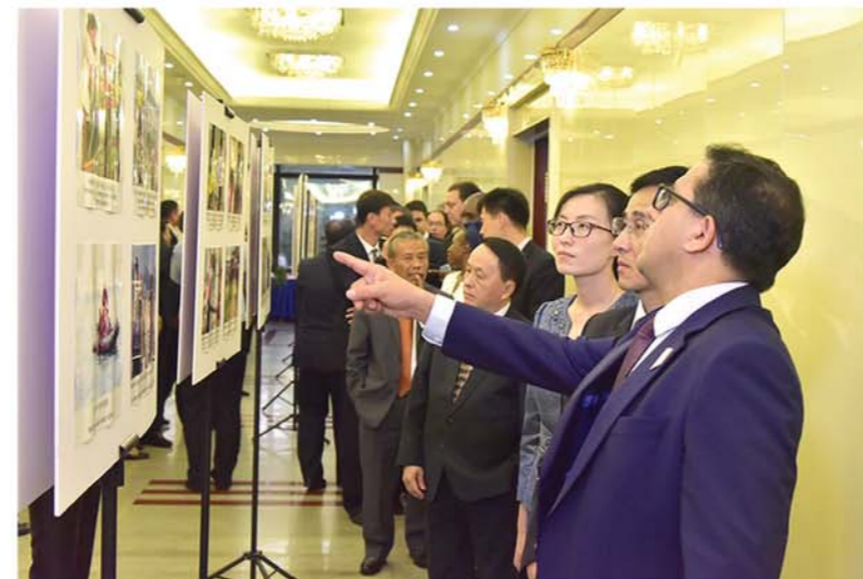
Photo Exhibition of China's Achievements

A photo exhibition took place at the People's Palace of Culture in Pyongyang between August 6 and 8 to show the achievements China gained in building socialism with Chinese characteristics.