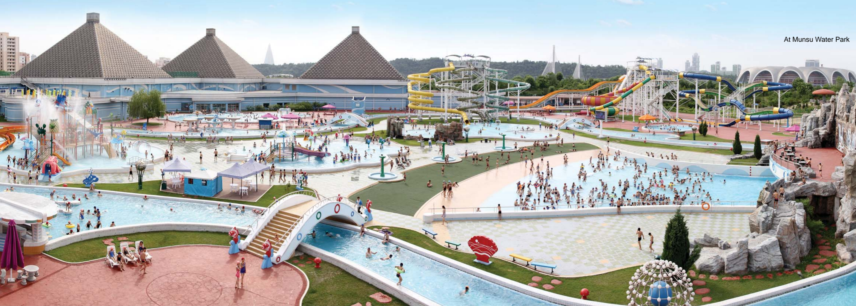
At Munsu Water Park