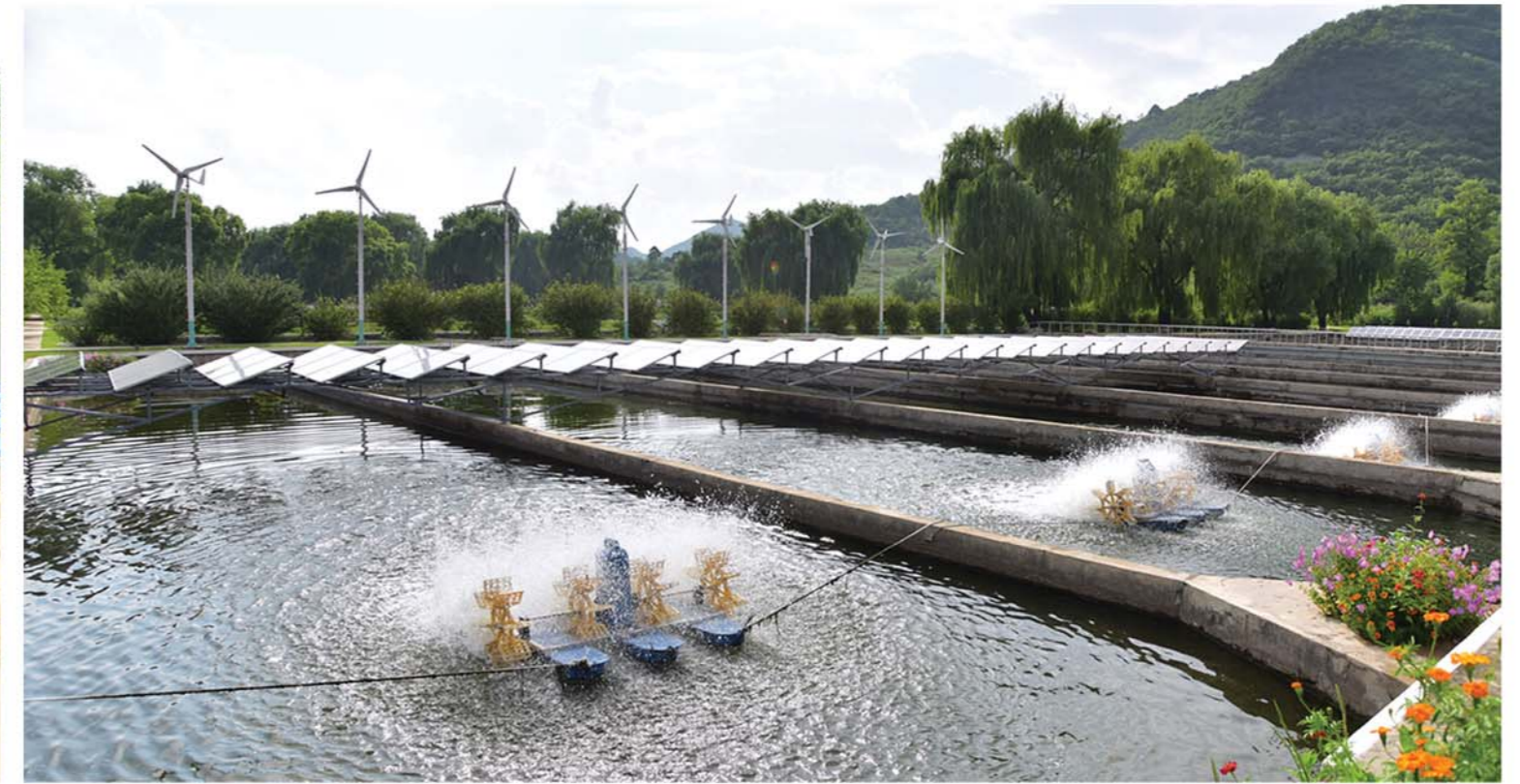
Renewable energy sources are employed