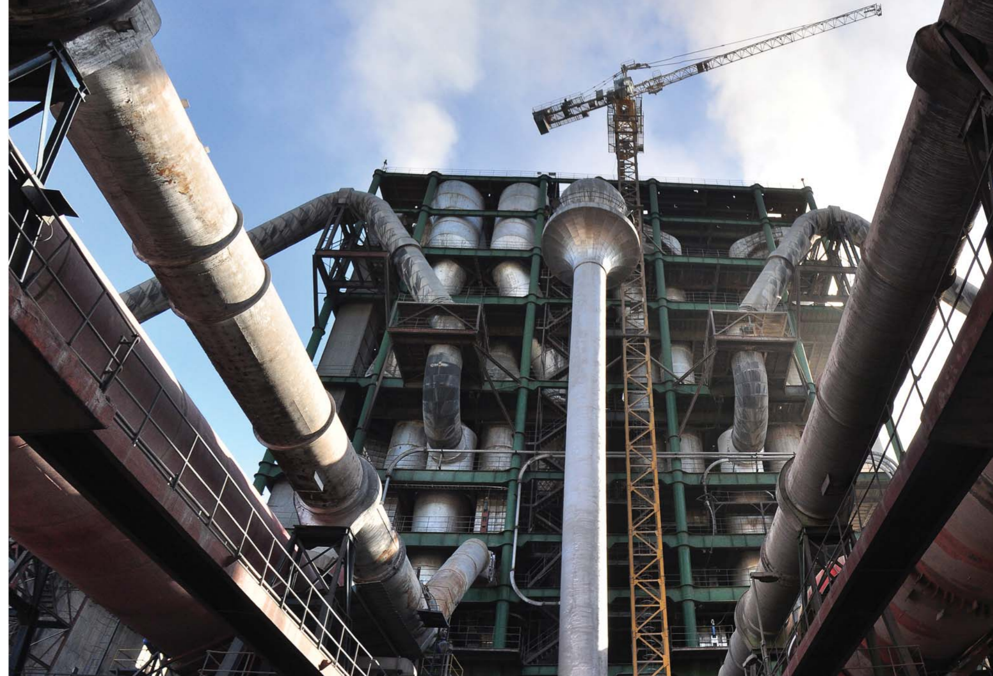
The advanced continuous process control system established in the complex greatly pays off in production