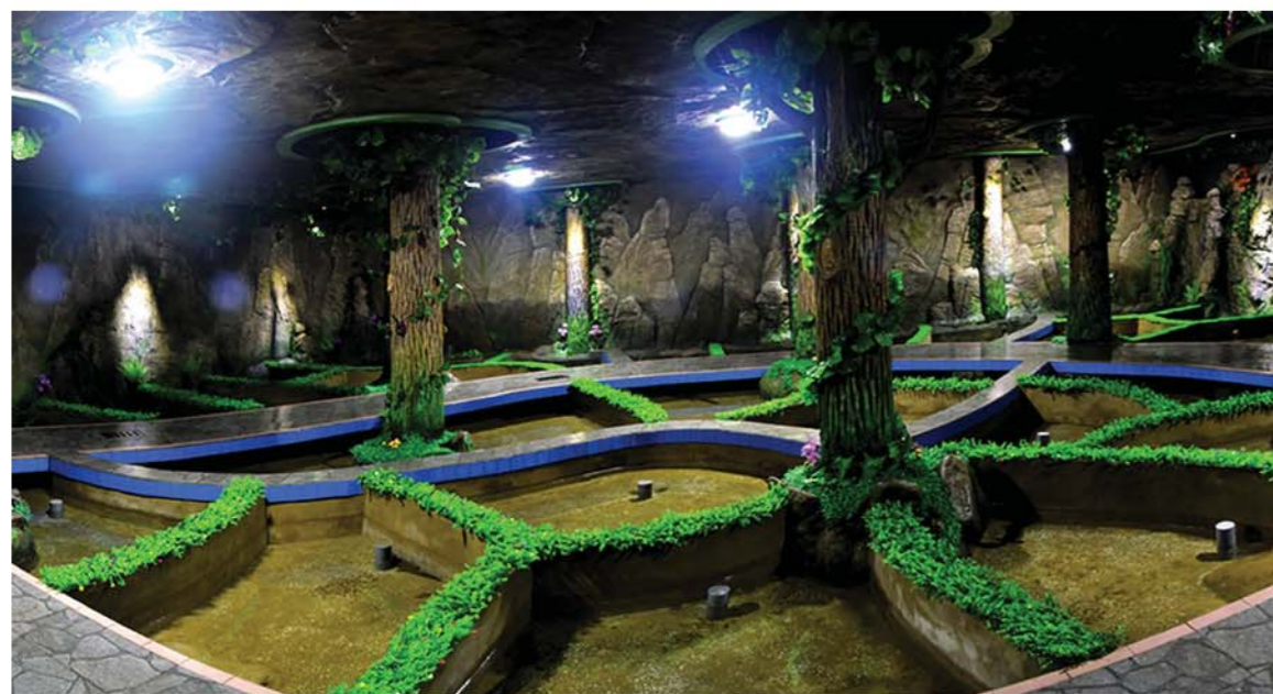
Ground for breeding Jangsu fish