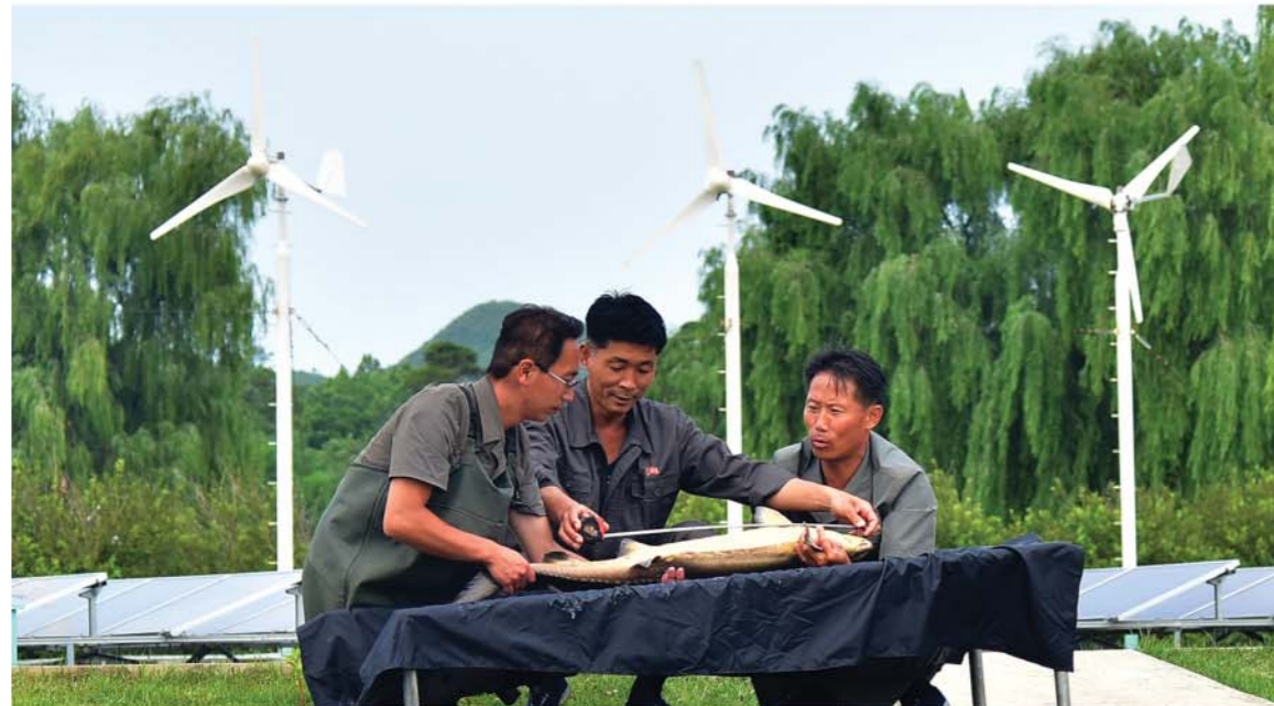
Fish farming is put on a scientific and technological footing