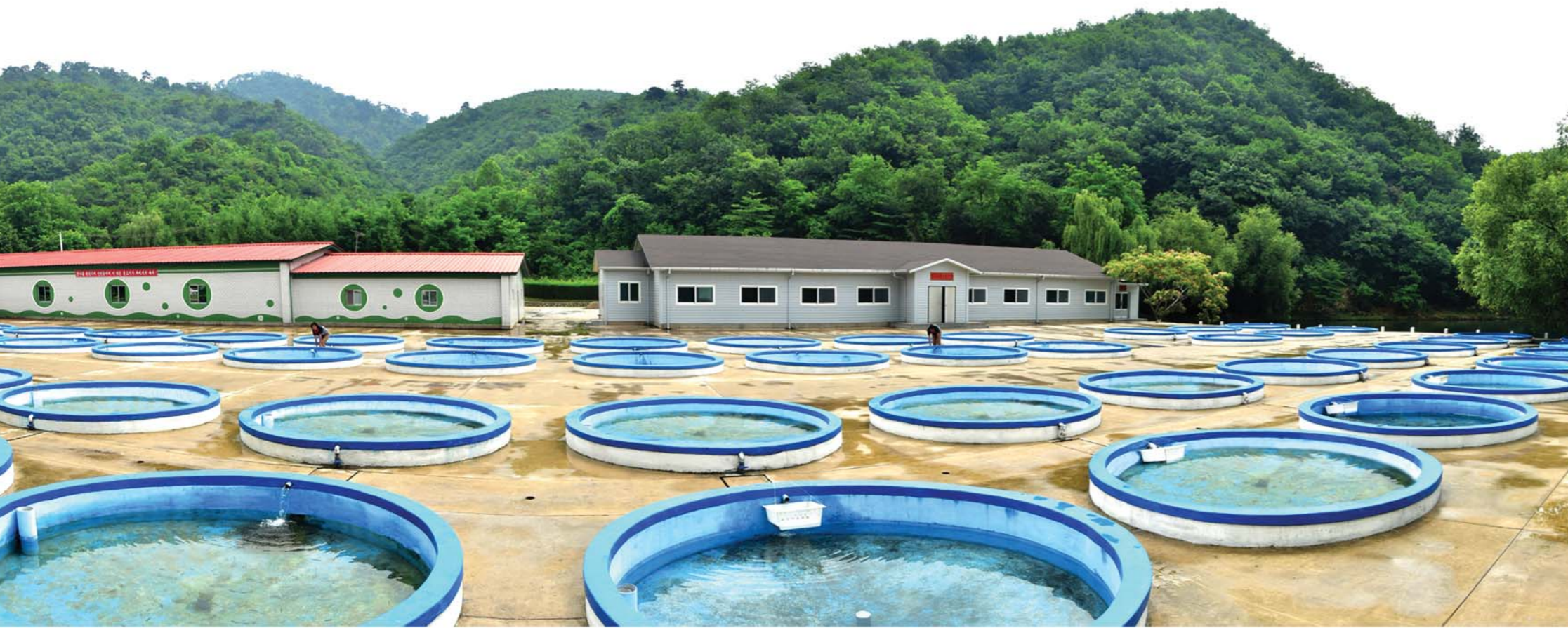
Circular ponds for the fish fry