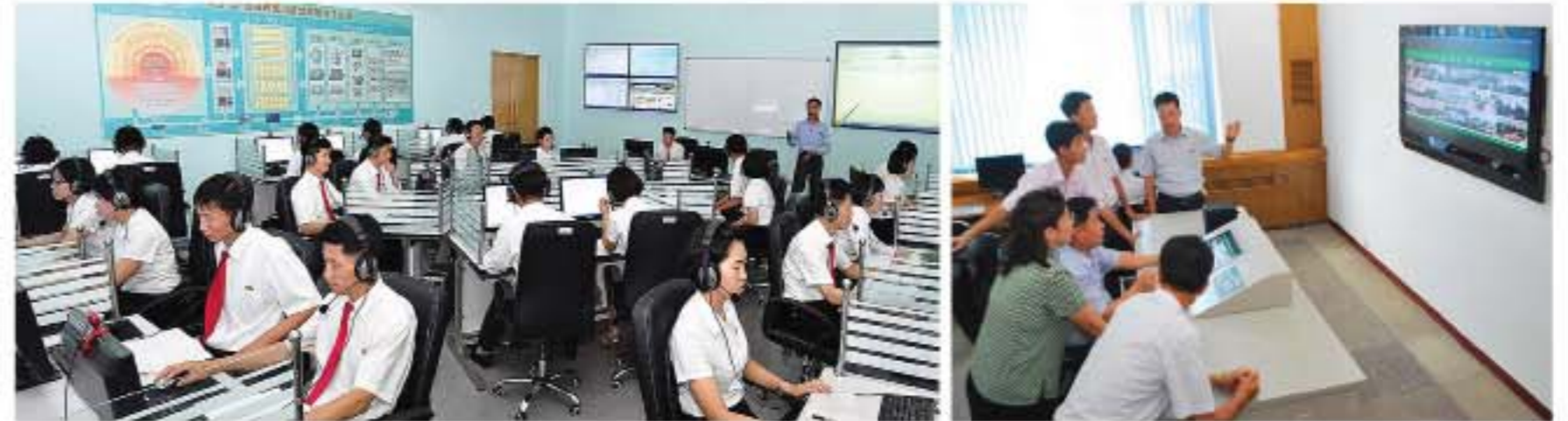
Many universities in the capital city and other provinces have been promoted to sectoral and regional universities, and the bases for the distance education system and sci-tech dissemination furnished creditably, being conducive to making the entire people well-versed in science and technology