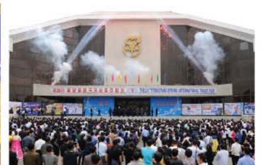
The 20th round of the Pyongyang Spring International Trade Fair