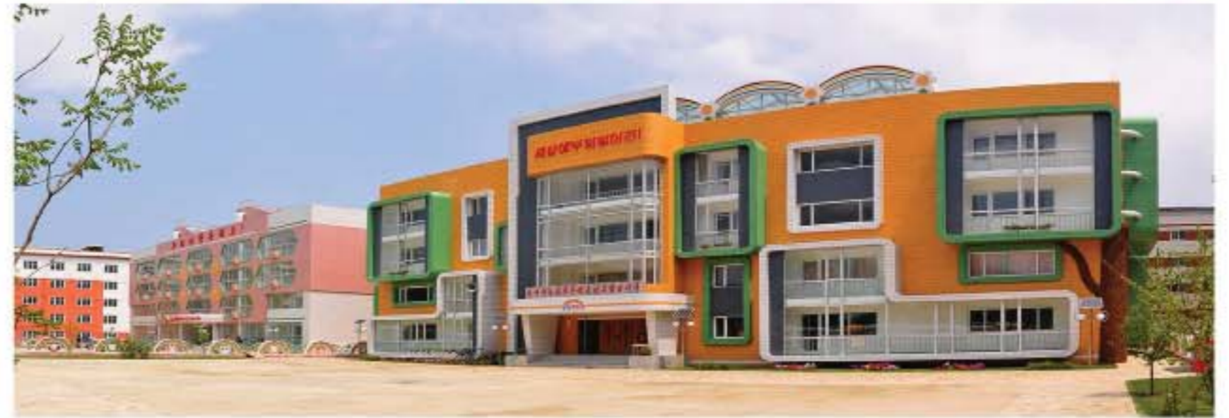
Kindergarten and nursery in the street