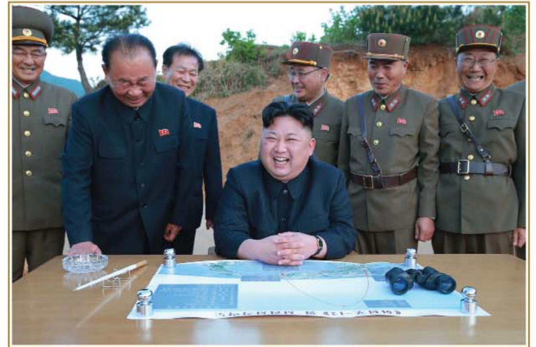
Supreme Leader Kim Jong Un gives on-the-spot guidance to the test-fire of a new-type rocket [May Juche 106 (2017)]