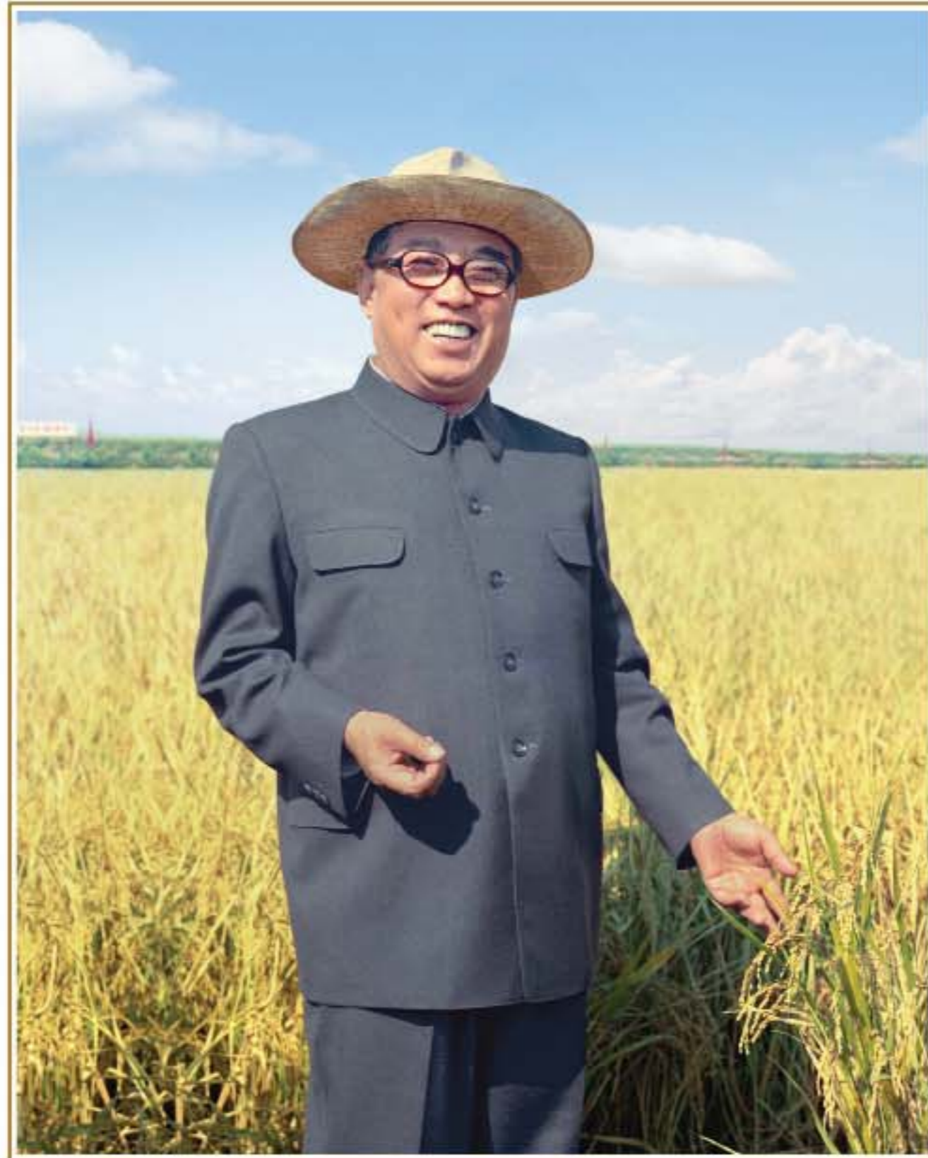
Kim Il Sung visits Samjigang Cooperative Farm in Jaeryong County [September Juche 65 (1976)]