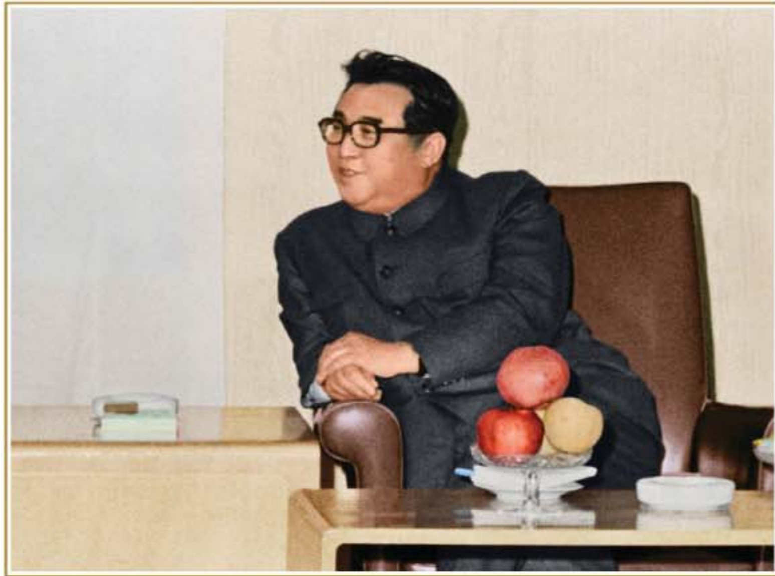
Kim Il Sung clarifies the three principles for national reunification [May Juche 61 (1972)]