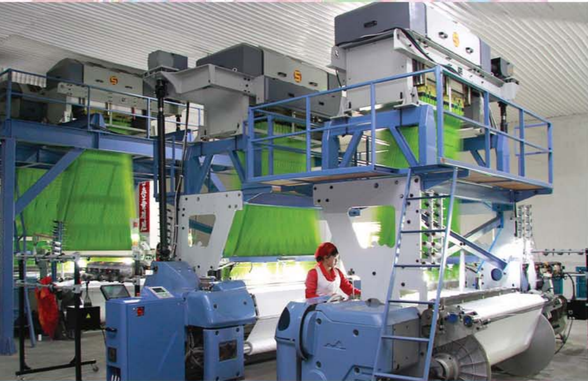
Towards the Conference of Mallima Pioneers