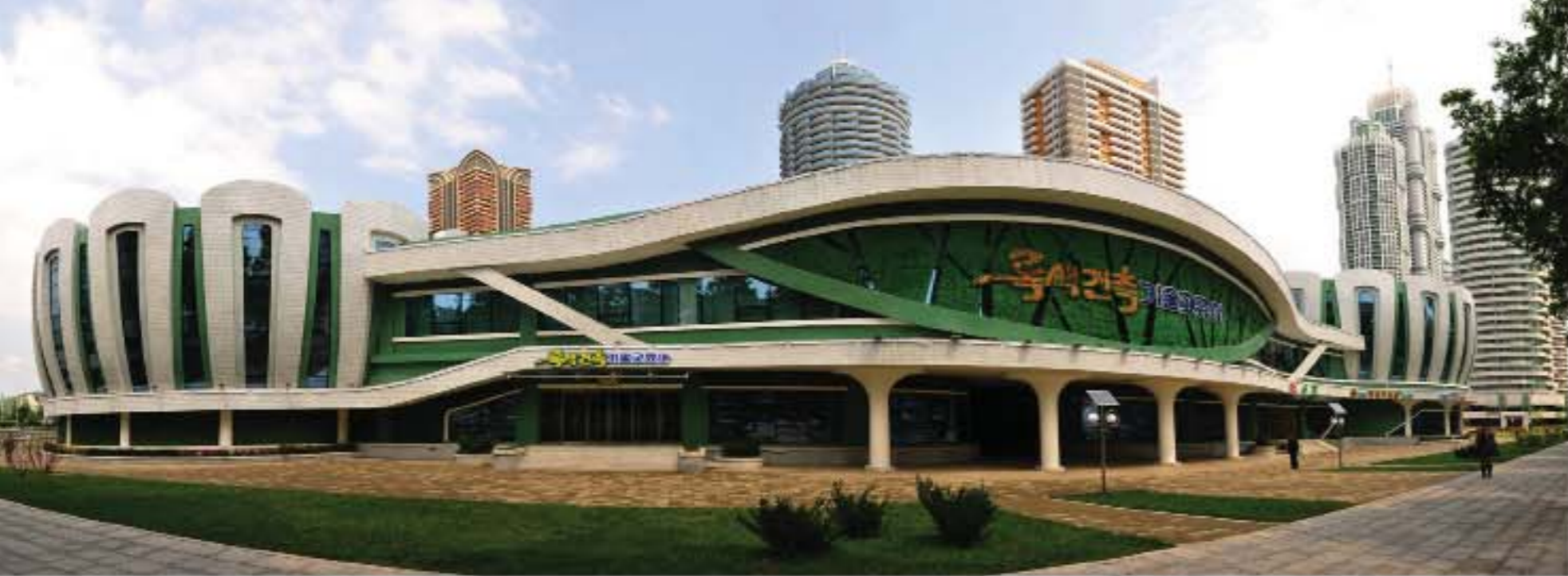
Green Architectural Technology Company