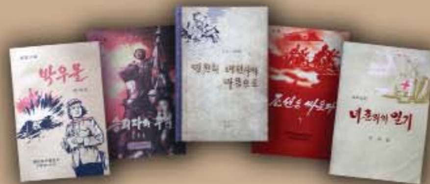
Publications carrying Ri's works