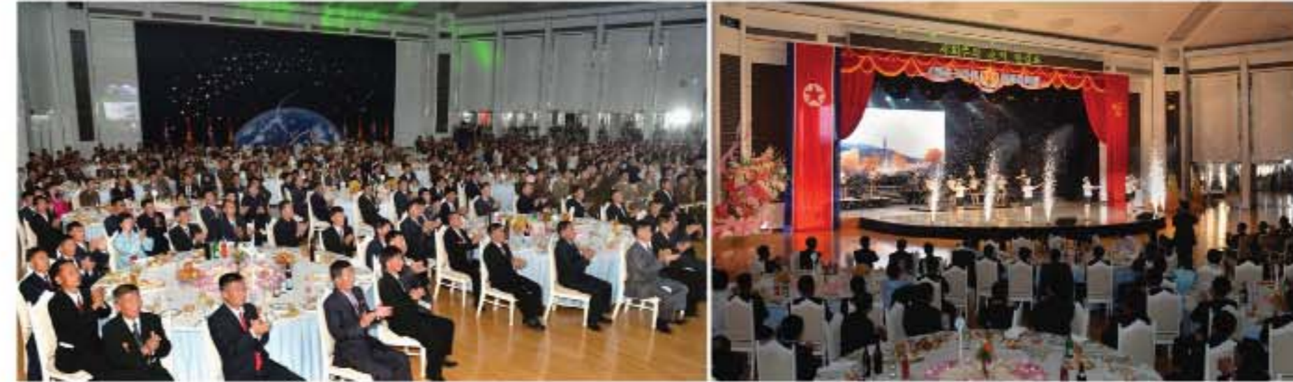
Scientists and technicians in the defence science sector who have manifested once again the might of the self-reliant defence industry of Juche Korea enjoyed themselves in Pyongyang amid great concern of the Party and the state and hearty welcome of the people across the country