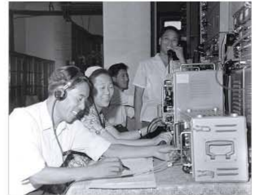
A test call made after setting up the direct telephone line between the north and the south of Korea for the first time since its separation

Article: Kim Jong Ung