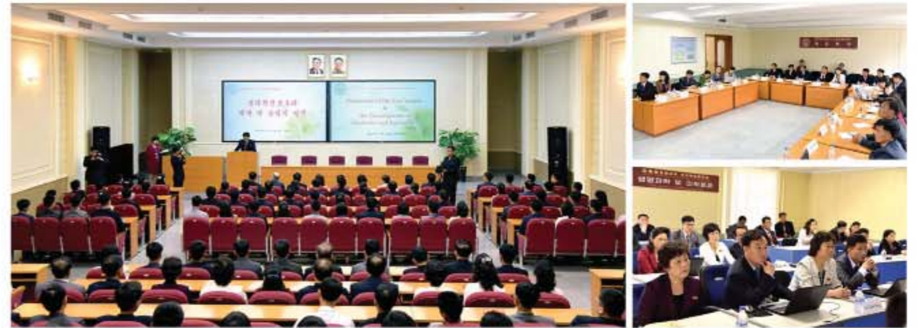
International seminar held at Kim Il Sung University