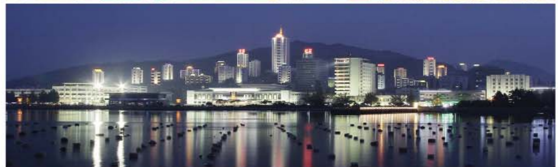
Electricity generated at the power stations is of great benefit to the economic development and the improvement of the people's living standards in the province