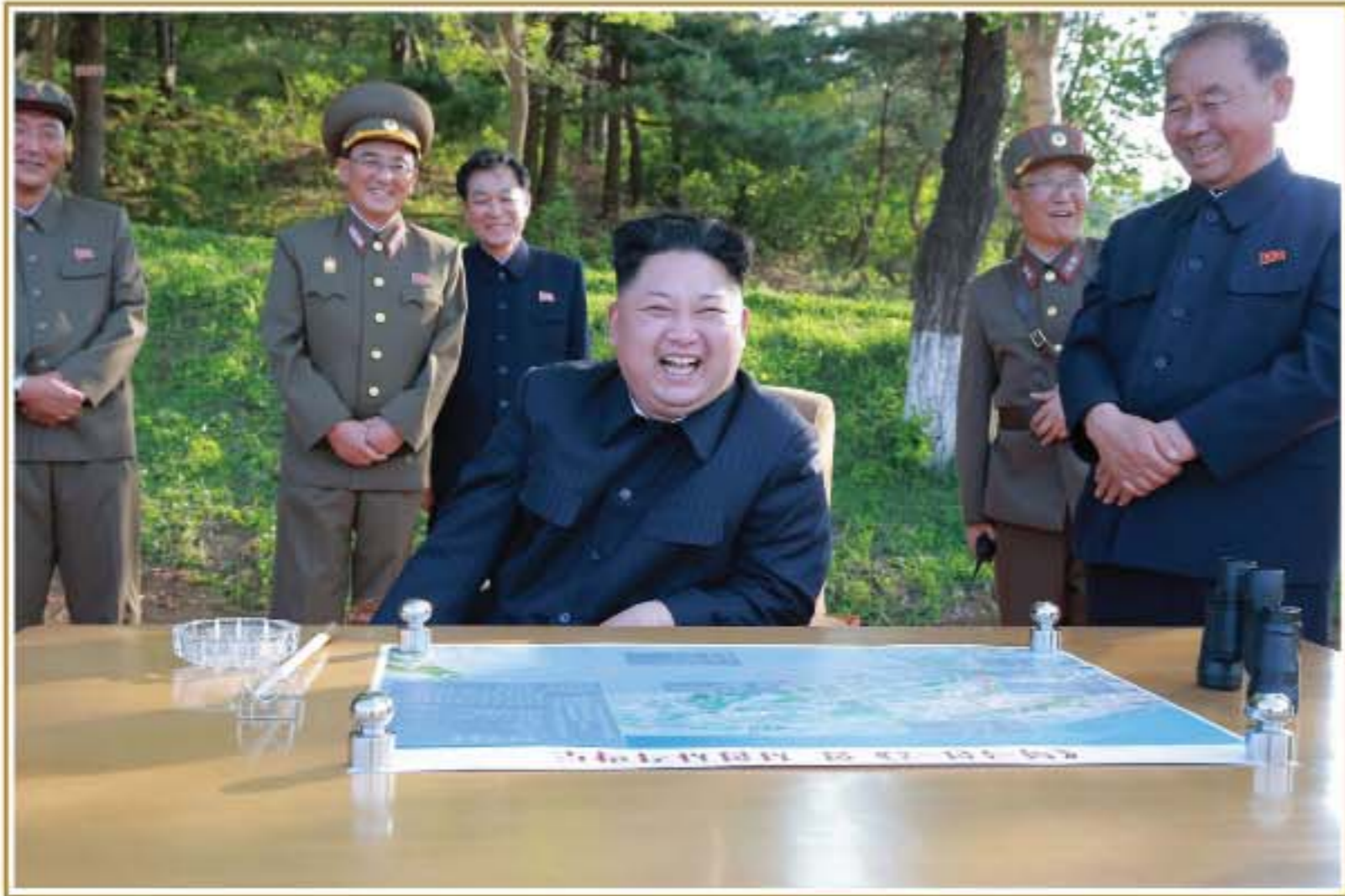
Supreme Leader Kim Jong Un sees the test-fire of ground-to-ground intermediate-range strategic ballistic rocket Pukkuksong 2 [May Juche 106 (2017)]