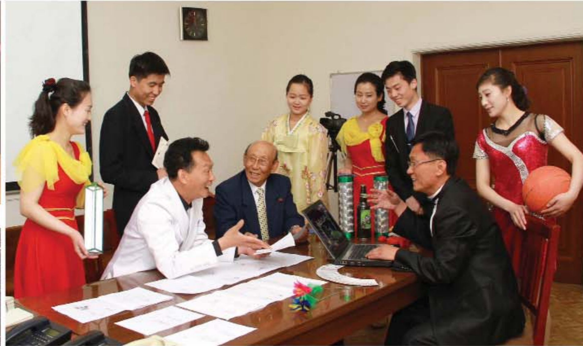
Lively discussion about new magic art pieces

The National Acrobatic Troupe of the Democratic People's Republic of Korea has three famous magicians, father and his two sons, who have made a considerable contribution to the development of magic art of the country.