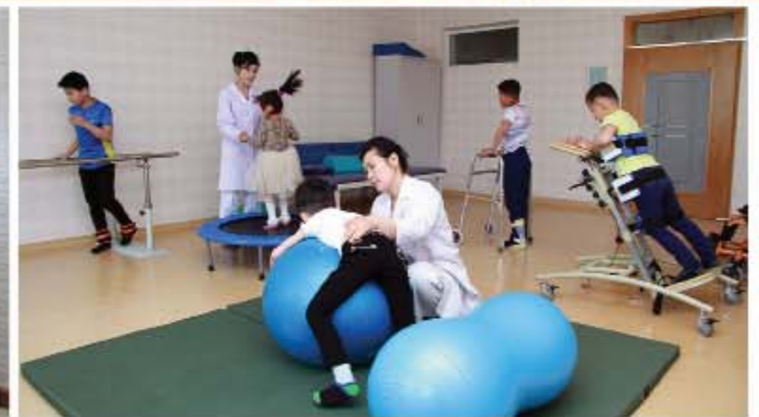
Rehabilitation facilities and apparatuses for various types of disabilities help the disabled children