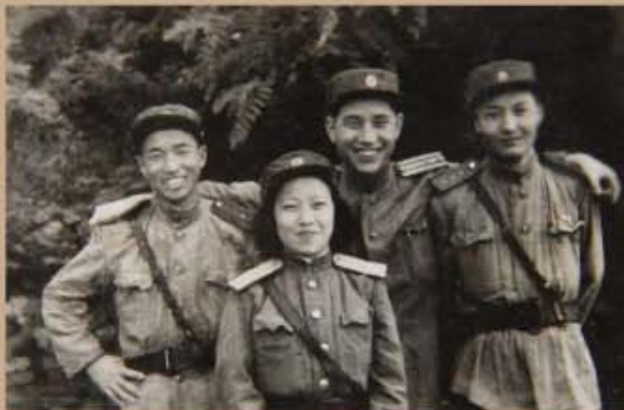
Together with her comrades-in-arms

Living in the mind of an eternal woman soldier , her collected poems, carries medium-length novels, poems and essays based on the wartime life, which makes an active contribution to hardening the spirit of defending the country unto death as the faith and will of all the Korean service personnel and people.