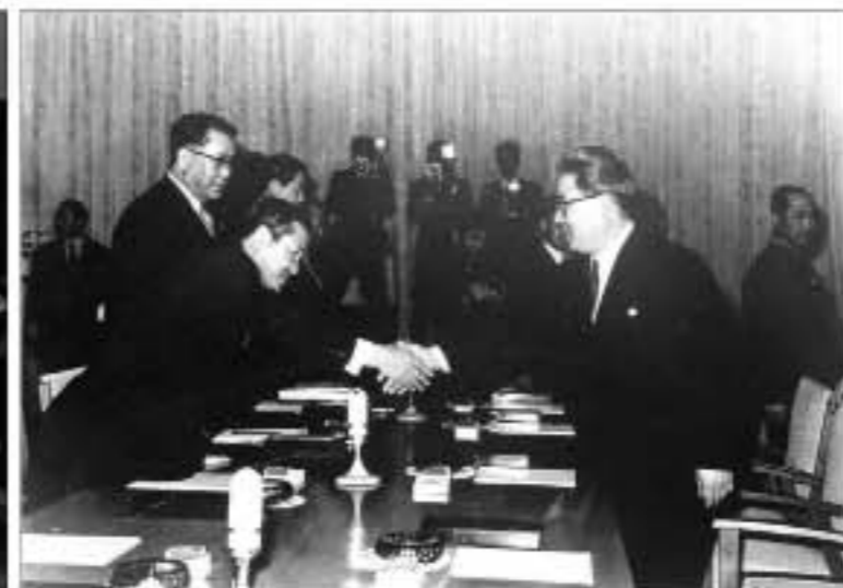
Second meeting of the north-south coordination commission was held in Pyongyang in March Juche 62 (1973)