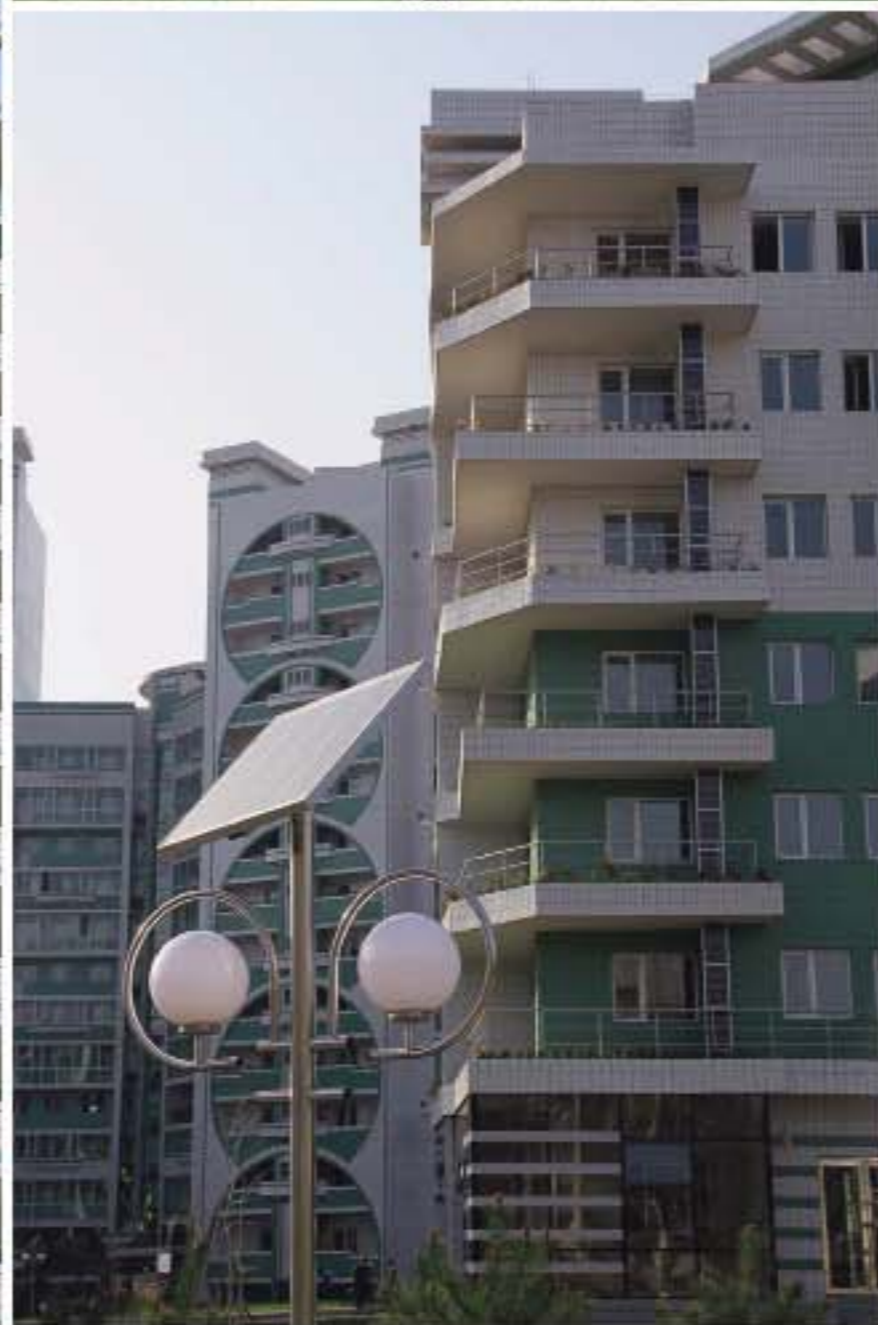
Solar panels and solar water heaters are attached on the walls of the apartment buildings and to lamp posts, and installed on the rooftops of the public buildings in order to make effective use of natural energy resources