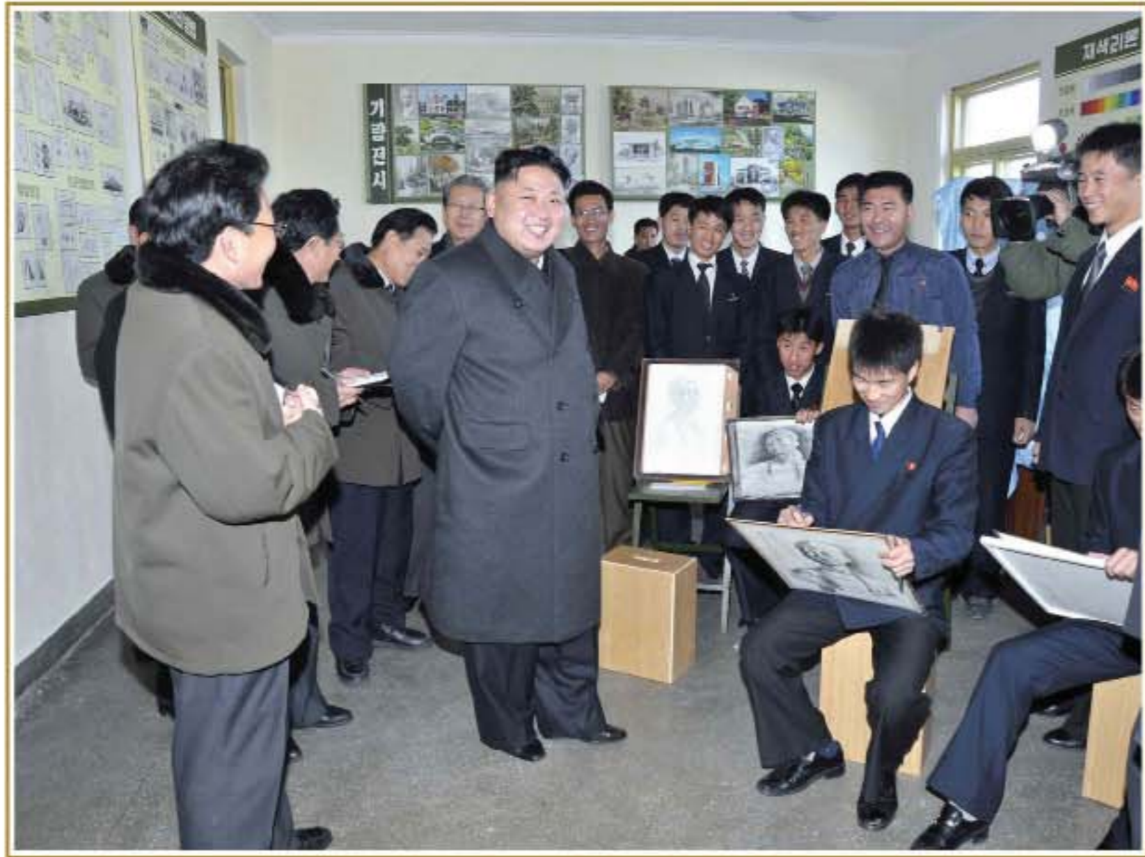
Supreme Leader Kim Jong Un visits the Pyongyang University of Architecture [November Juche 102 (2013)]

demanding by the era of the knowledge economy in the new century.