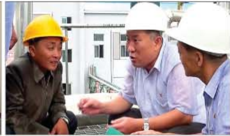
In the days when the acrylic acid production process was being established at Suncheon Chemical Complex