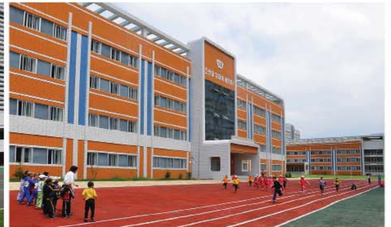
Ryomyong Primary School in Taesong District