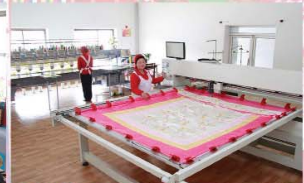
The mill is making strenuous efforts to establish a new method of silk production and make the products better and various