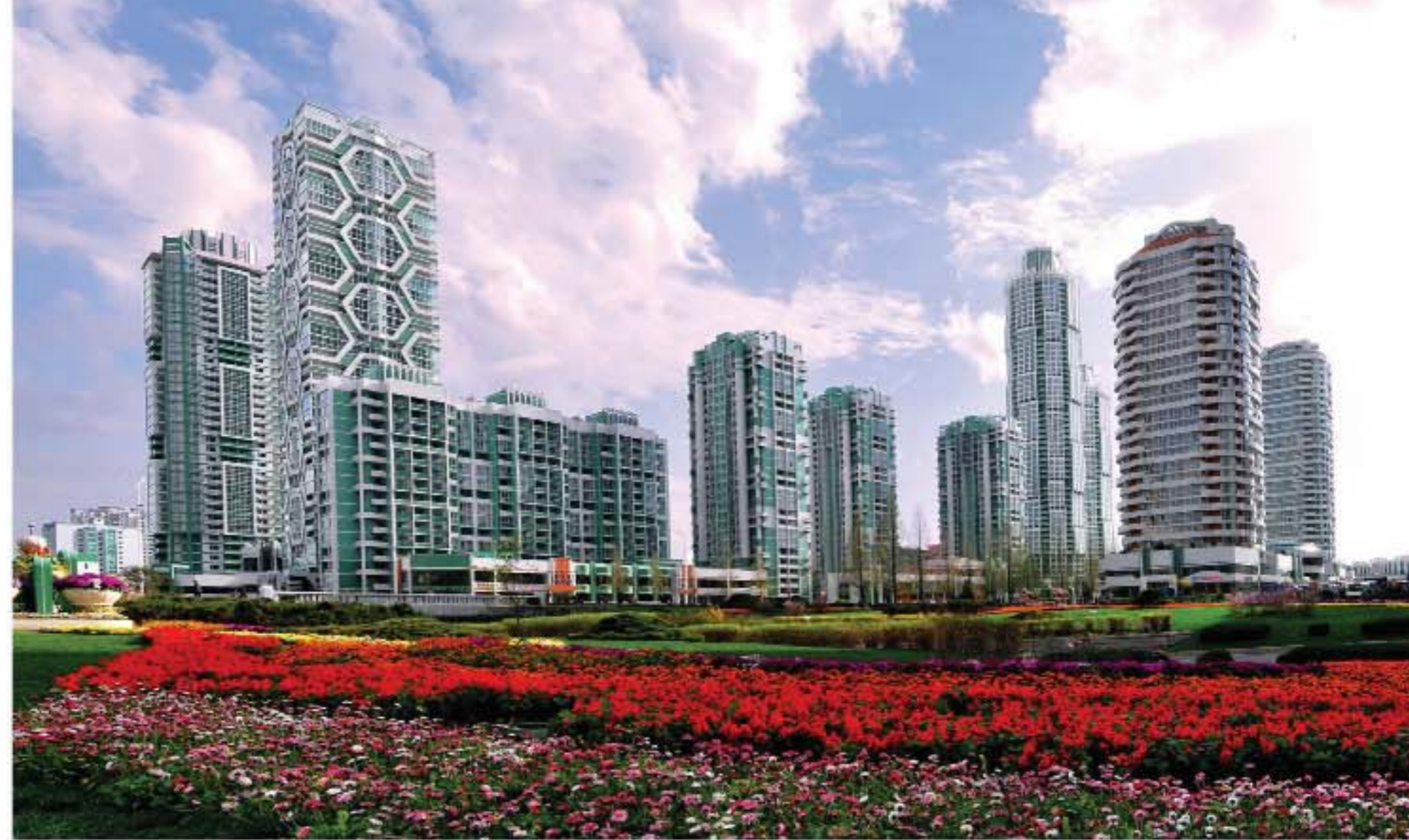
Green architectural techniques, including the greening of rooftops and walls of the apartment and public buildings, are widely applied and the street landscaping realized with its own distinctive features