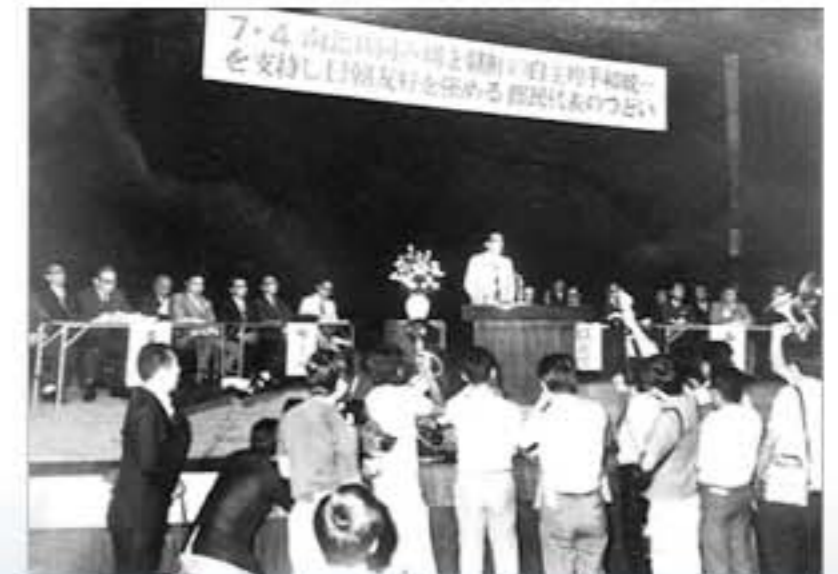
Representatives from Japan-DPRK friendship association met to express their support for the historic July 4 Joint Statement and independent and peaceful reunification of Korea