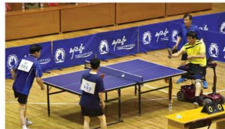
The 2017 spring table tennis competition of persons with disabilities and amateurs