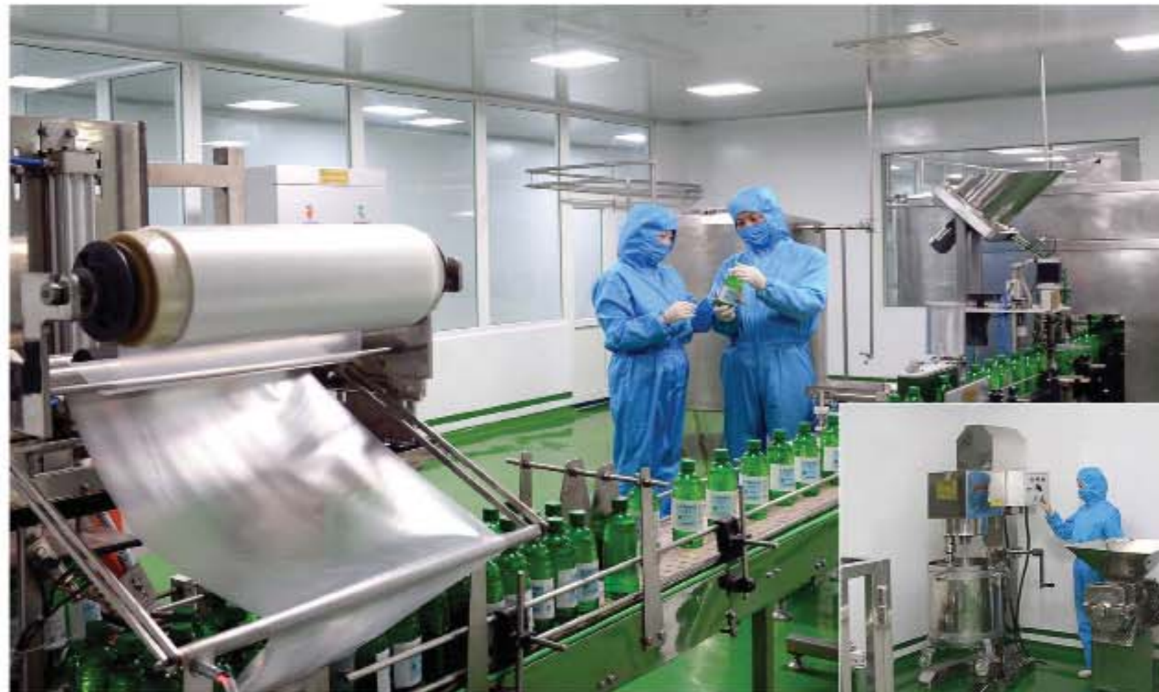
Several production lines and equipment underwent technical reconstruction, thereby turning out medicines in larger amounts