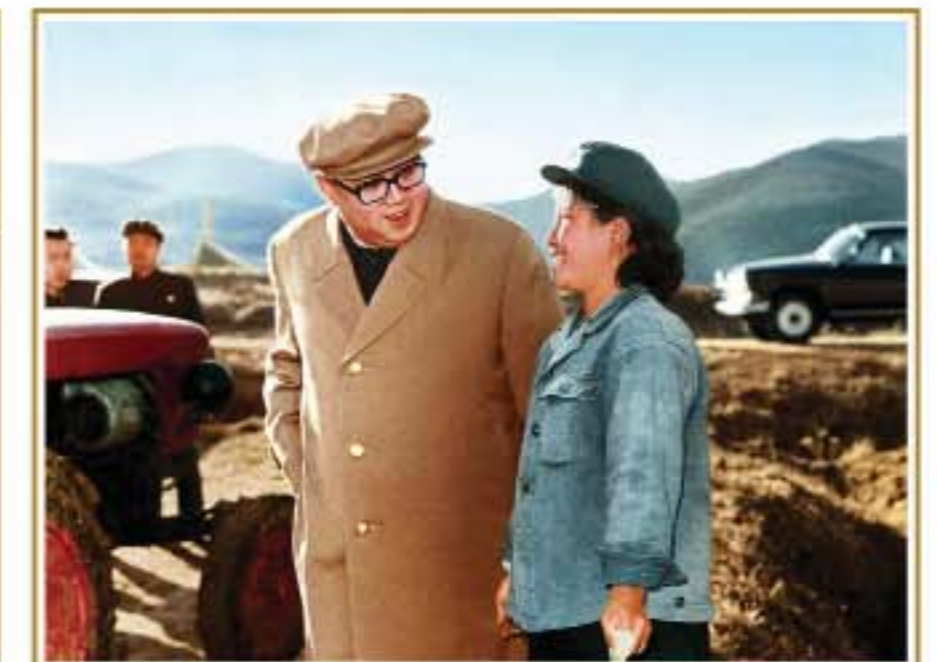
Kim Il Sung meets a female tractor driver at Oeso Cooperative Farm in Kaechon County [November Juche 62 (1973)]