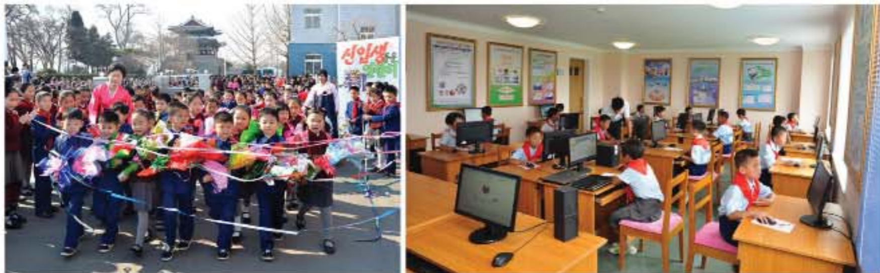
A universal 12-year compulsory education is introduced and radical changes have been brought about in the general secondary education

education, made public such works as Let Us Build Ours into a Country of Education, a Talent Power, by Bringing about a Revolution in Education in the New Century and On the Basic Tasks Facing Kim Il Sung University in the New Era of the Juche Revolution . In his works he clarified the orientation and means for developing the country's education onto a new, higher stage as