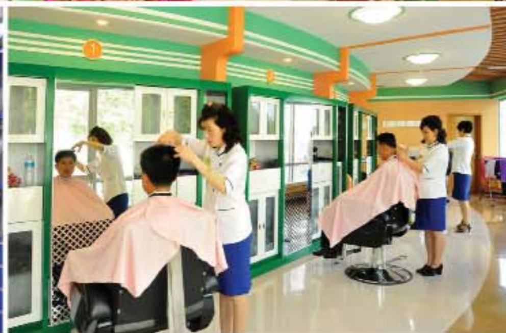
Commercial, public and welfare service amenities in the street provide the residents with the maximum convenience