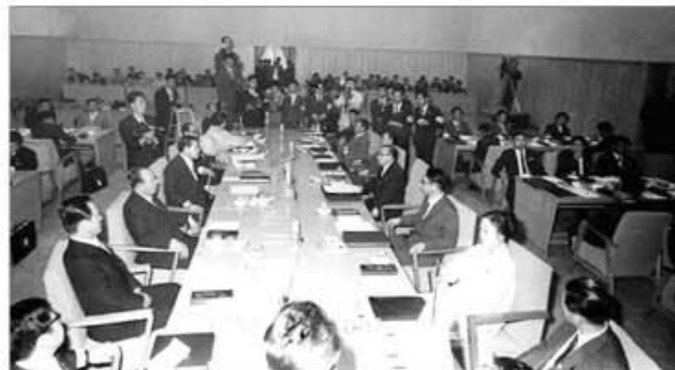
First session of the inter-Korean Red Cross talks was held in Pyongyang between August 30 and September 2 in Juche 61 (1972) amid the great expectation of the entire Korean nation