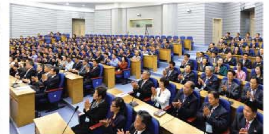
The 19th round of Pyongyang Medical Science Symposium of Korean medical workers at home and abroad