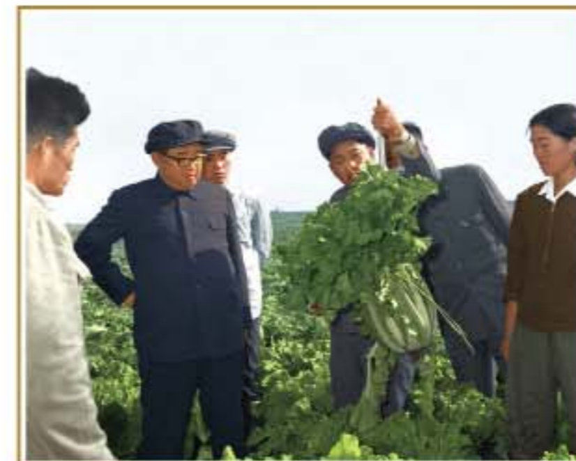
Kim Il Sung gives field guidance at Jangchon Cooperative Farm in Sadong District [October Juche 58 (1969)]