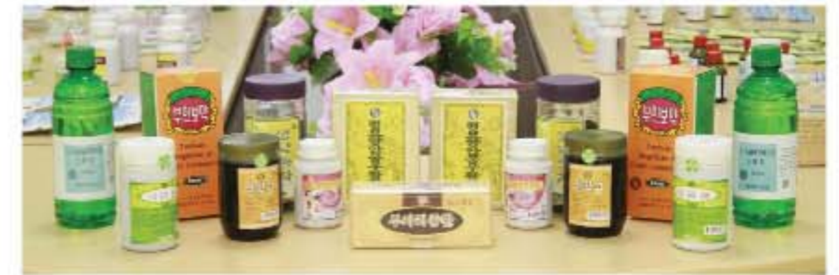
Some of the products