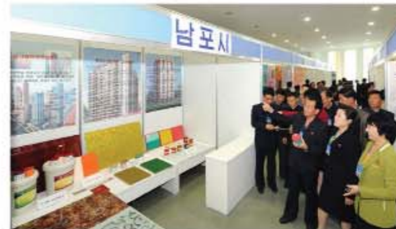
The 17th round of May 21 Architectural Festival