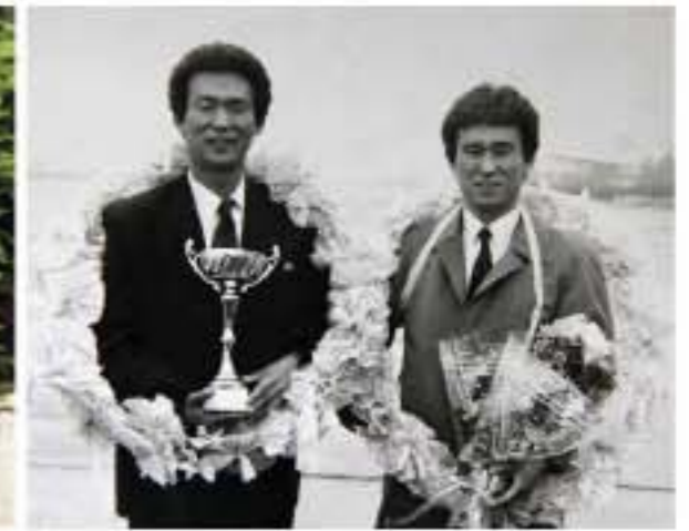
The sons were awarded the top technical prize at the international magic festival held in Monte Carlo, Monaco, in Juche 85 (1996)