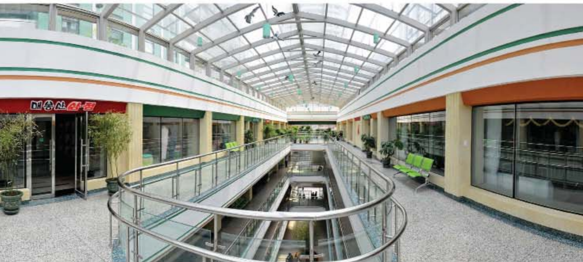
General commercial outlet furnished on the ground floors linking the 70-storey skyscraper with the 55-storey one