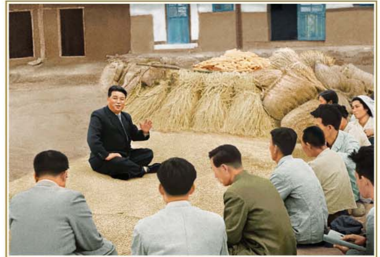
Kim Il Sung talks with the farmers in Chongsan-ri, Kangso County [October Juche 47 (1958)]

He became an honour member of a cooperative farm, selected the site of a reservoir and discussed farming methods with the