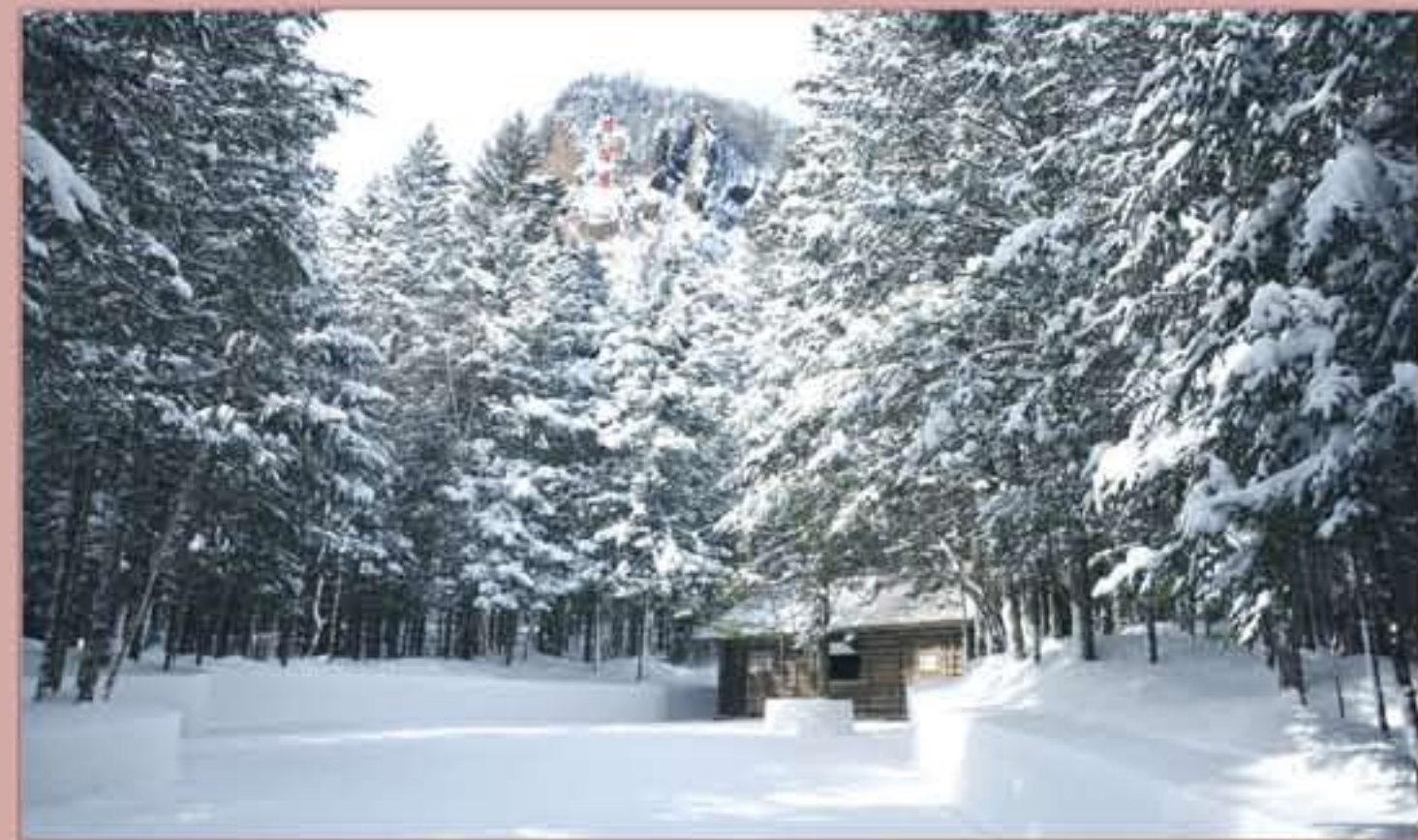
Snowscape of the Native House.