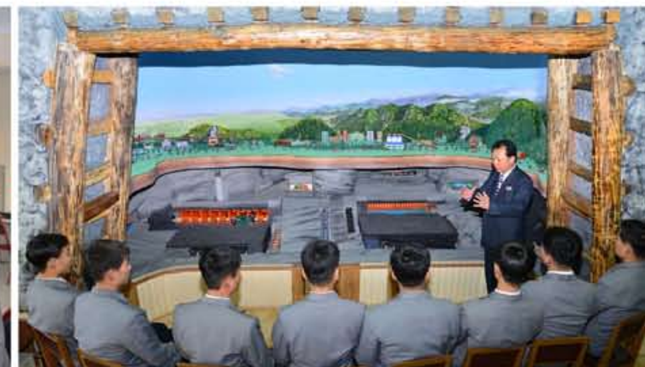
Students prepare their practical abilities to solve all the problems arising in reality.