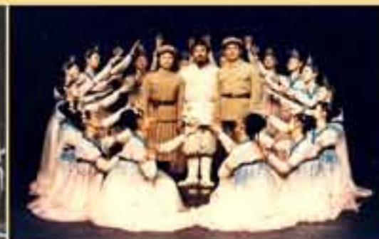
A scene from the revolutionary opera Tell O Forest [Juche 61 (1972)].