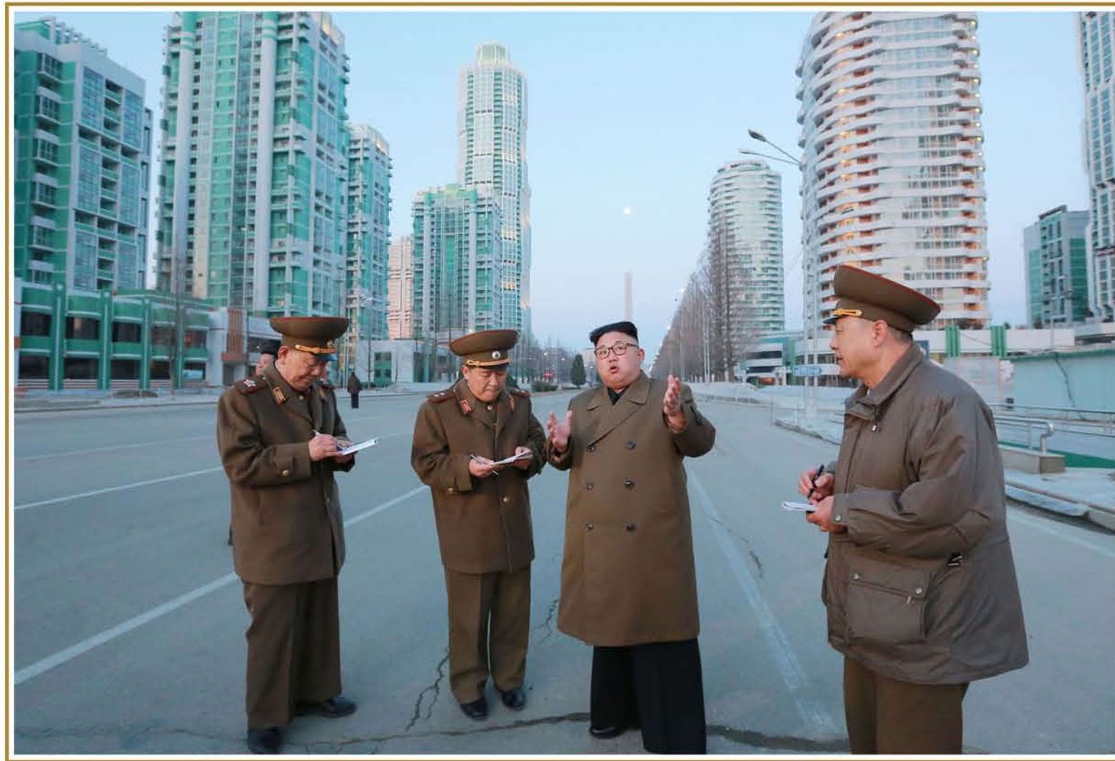
The respected Supreme Leader Kim Jong Un inspects the construction site of the Ryomyong Street [March Juche 106 (2017)].