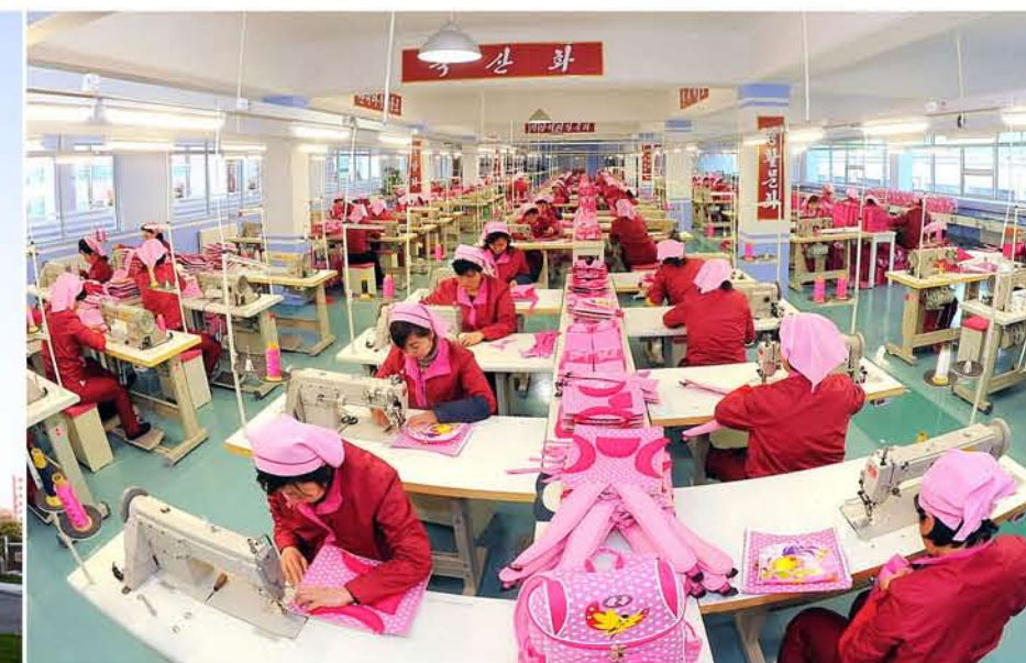
Under the sagacious leadership of Supreme Leader Kim Jong Un the Korean people are achieving world-startling, miraculous successes with the spirit of self-reliance and self-development as the dynamic force.