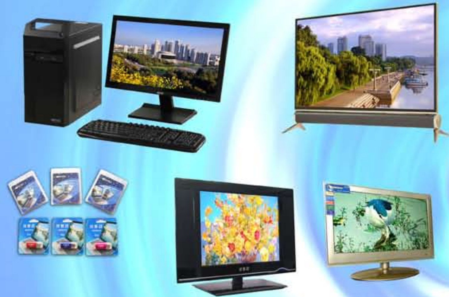
Some of the factory's products.

The Pothonggang Electronic Goods Factory renders a contribution to making the national economy IT-based and providing the people with a better cultural life. The factory started its operation in June Juche 102 (2013) with the assembling of the LED TV sets. It has undergone a tremendous change thanks to the sincere efforts of its officials and workers to make their products win favour among the people.