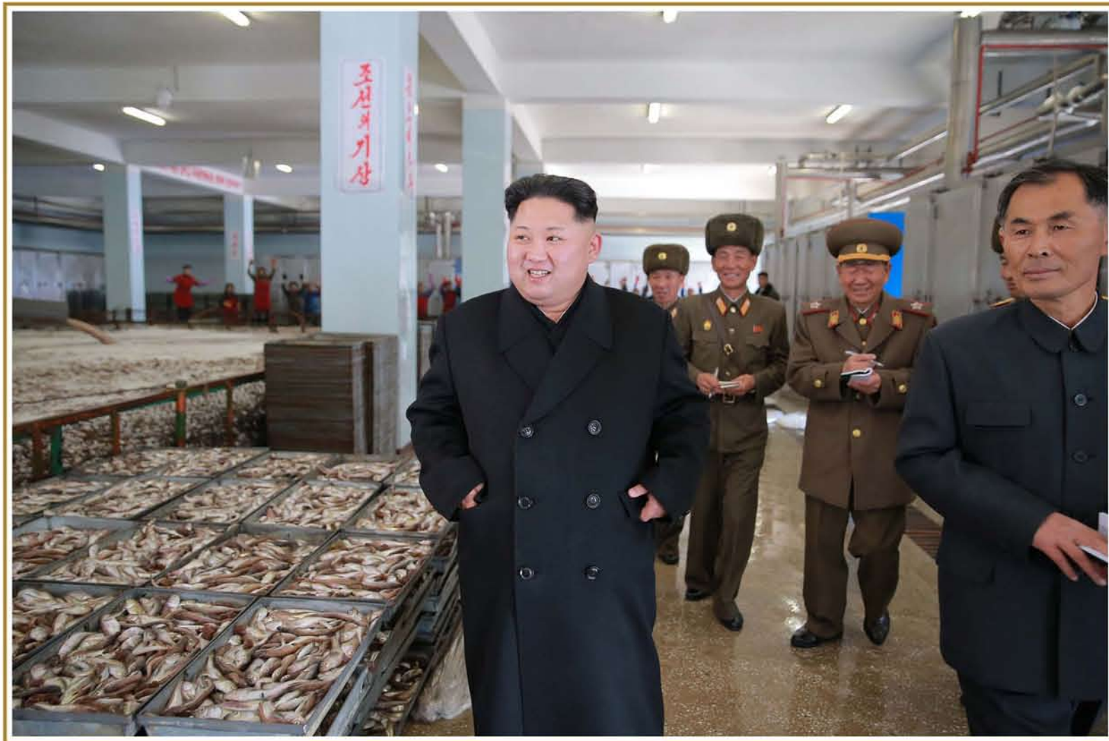
The respected Supreme Leader Kim Jong Un inspects the August 25 Fishery Station of the Korean People's Army [November Juche 105 (2016)].