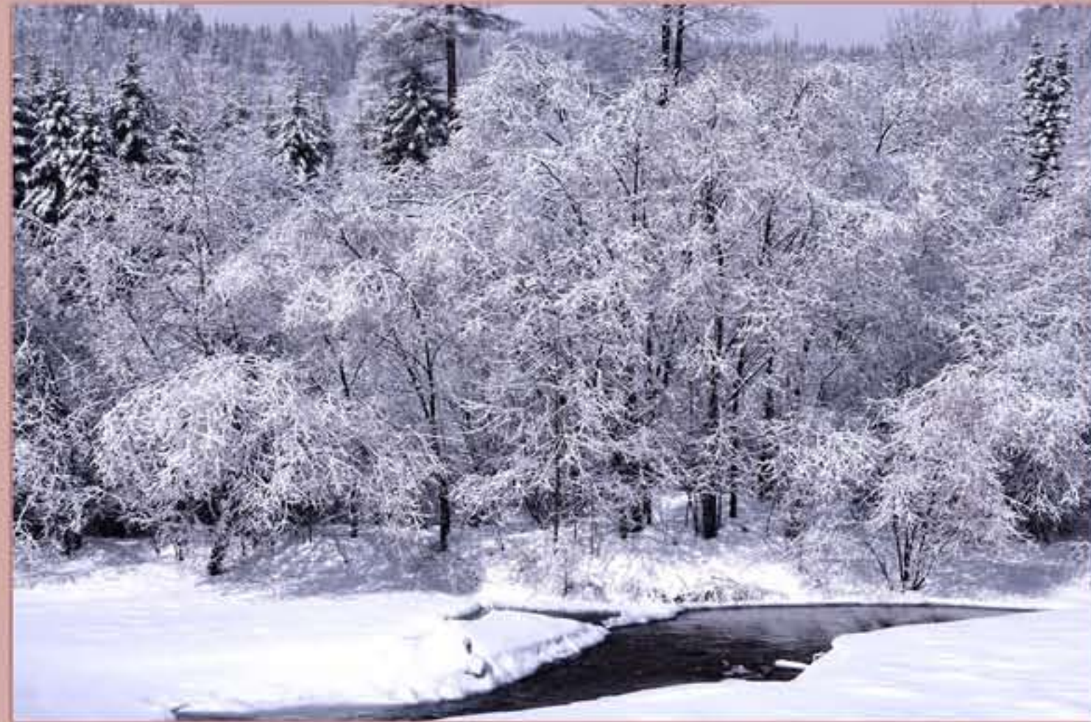
Hoar Frost in the Sobaeksu Valley.