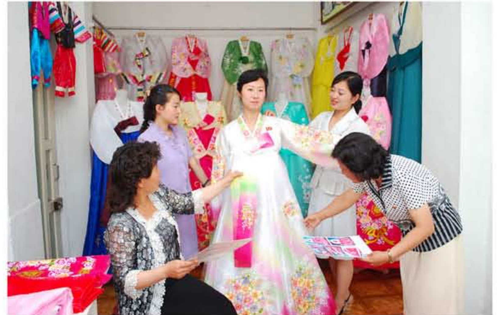
Discussions are held to promote the excellence of the ennobling and beautiful Korean costumes.