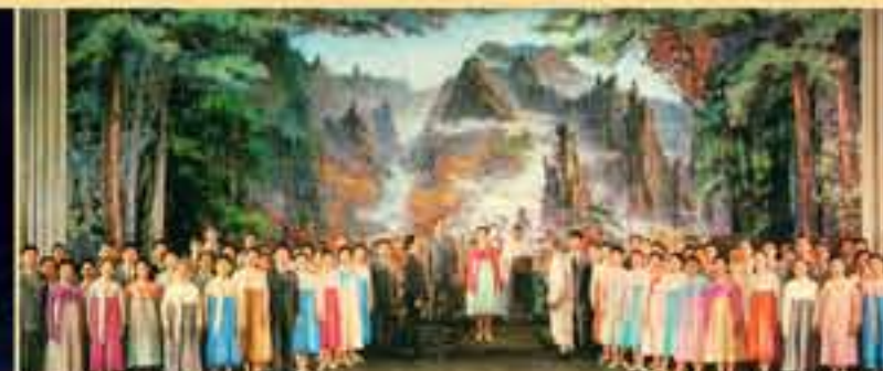
A scene from the revolutionary opera Song of Mt Kumgang [Juche 62 (1973)].