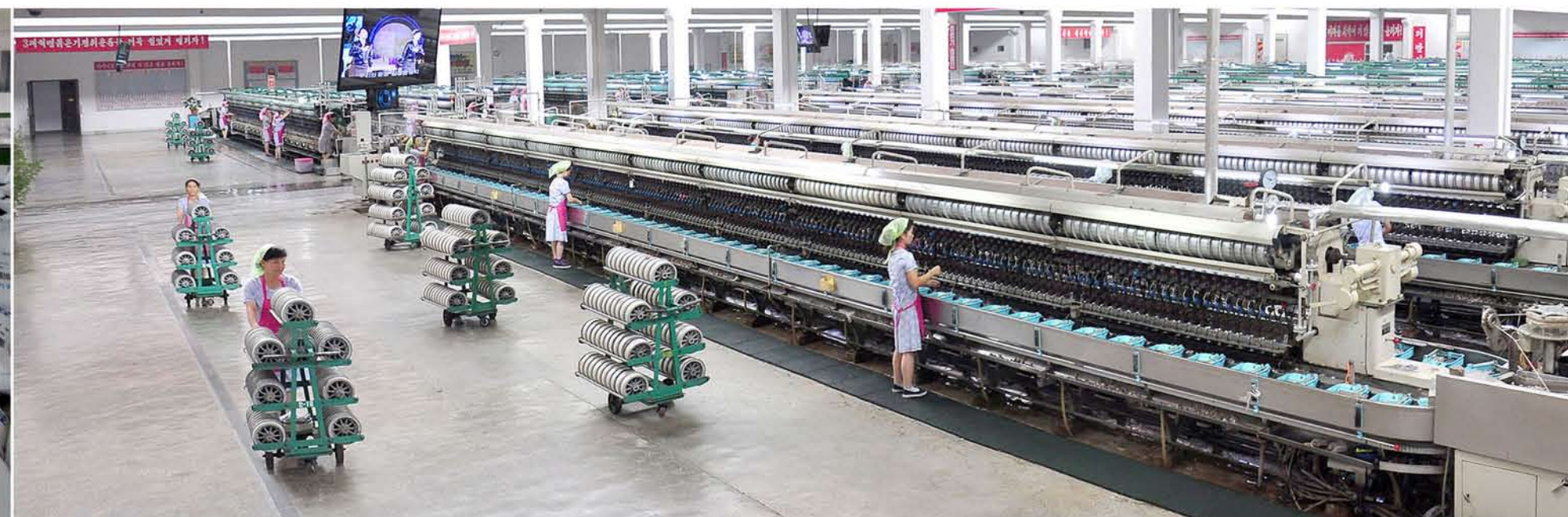
Miraculous innovations have been made in metal, chemical, light industry and other sectors of the national economy in the fierce flames of creating the Mallima speed flaring up across the country.