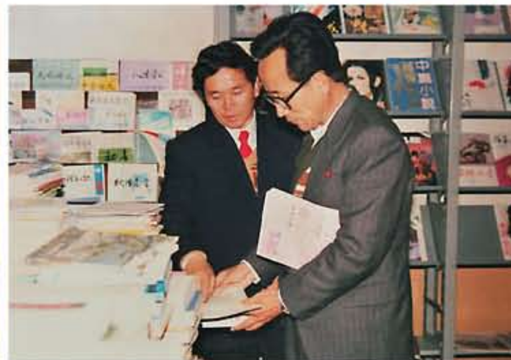
Exchanging his experience in compilation with an official from Chinese Yanbian Publishing House.