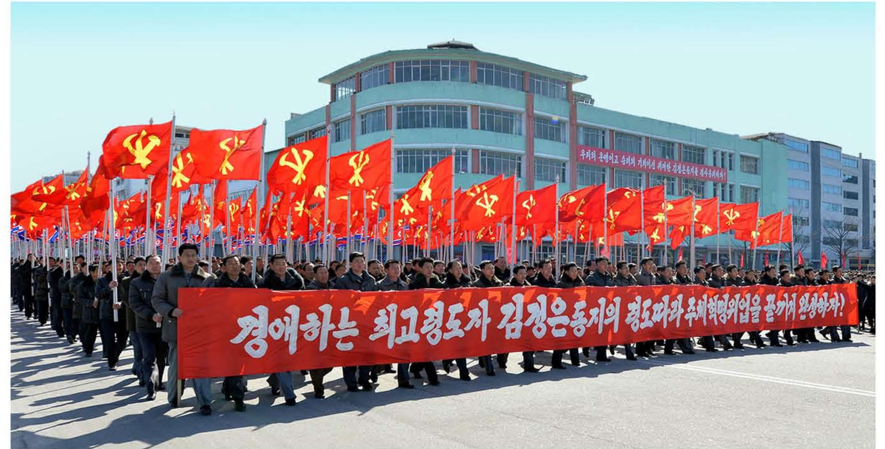
The people in Kangwon Province, who have created the spirit of Kangwon Province, exemplary spirit of the Mallima era, by staging a daring campaign to carry through the leaders' lifetime instructions and defend Party policy, appeal to the working people throughout the country to celebrate the conference of pacesetters in the Mallima era to be held at the end of the year as the meeting of victors by waging a vigorous all-people, general offensive under the unfurled banner of self-reliance and self-development.