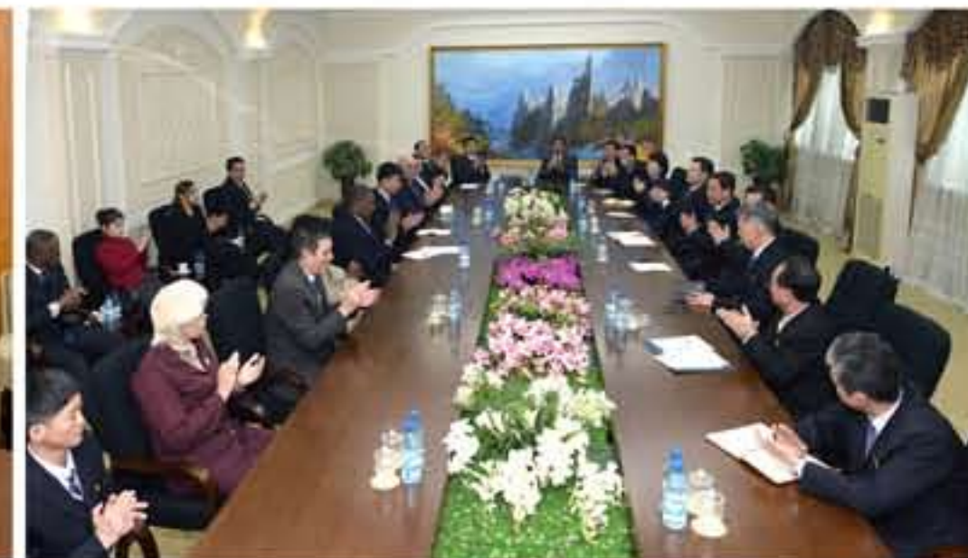
Korean Committee for Solidarity with Cuba held its annual meeting.