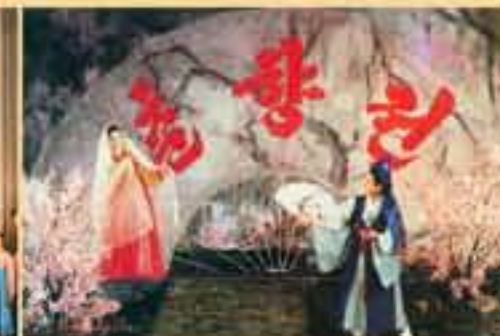
A scene from the folk opera The Tale of Chun Hyang [Juche 77 (1988)].