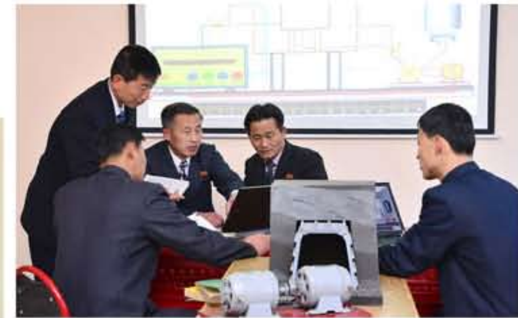
Lecturers discuss scientific teaching methods.

Inaugurated in October Juche 57 (1968), the Phyongsong University of Coal-Mining Industry is a base for training technicians and specialists in the sector of coal-mining industry.