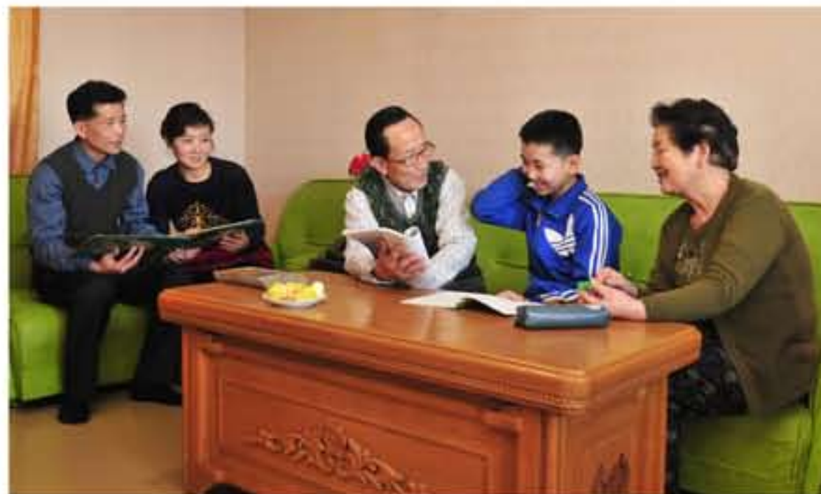
At home he is a careful teacher to his grandson.