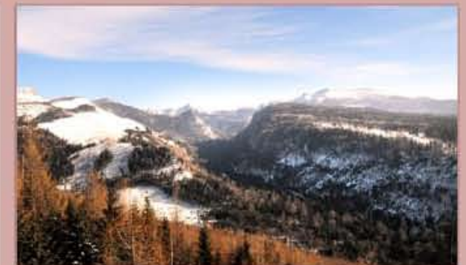
Terrain Features Appropriate to a Natural Fortress.

Article: Kim Son Gyong