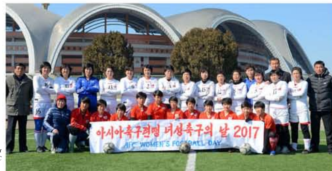
A workshop, a preview and other functions are held to mark the AFC Women's Football Day.