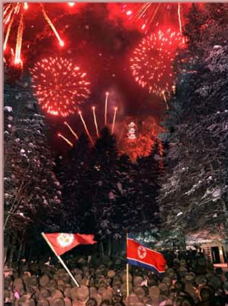
Nocturnal View of Fireworks Display in February.