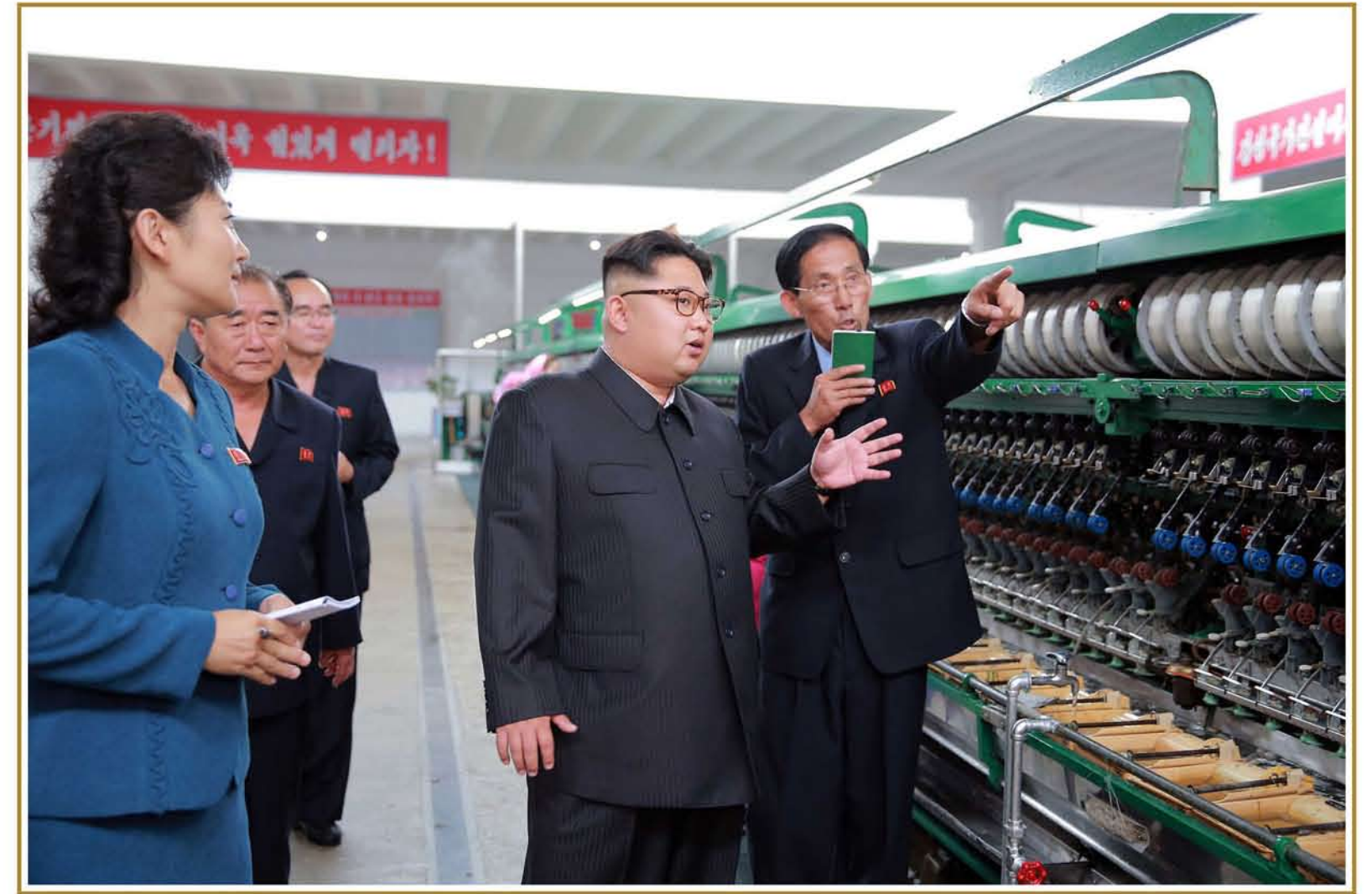
The respected Supreme Leader Kim Jong Un visits the Pyongyang Kim Jong Suk Silk Mill [June Juche 105 (2016)].