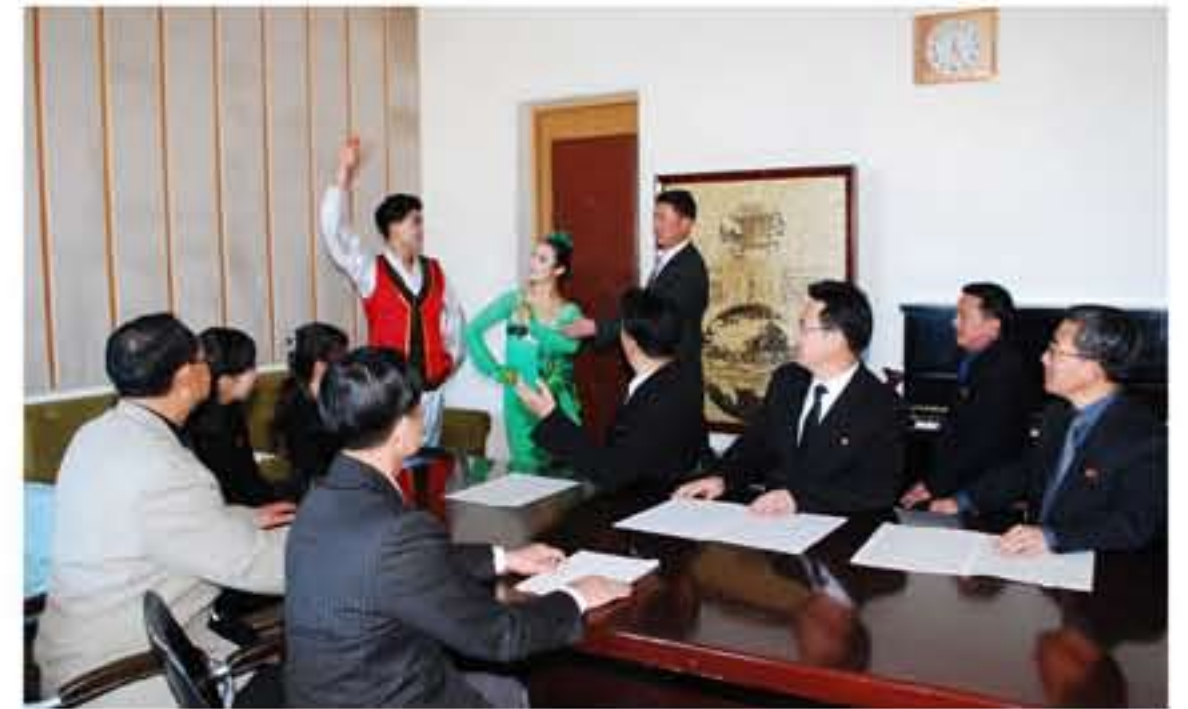
Creators and artistes devote their efforts to produce excellent pieces rich in national sentiments.

Article: Choe Ki Song