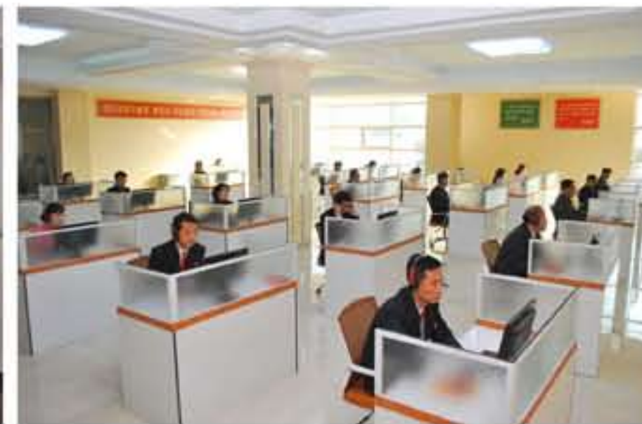
They acquire advanced science and technology at the sci-tech learning space of the factory.