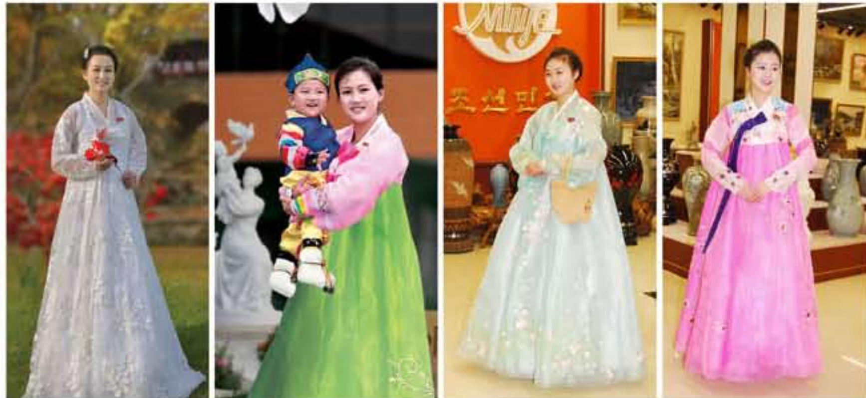
Traditional costumes for Korean women are being developed in line with the socialist lifestyles and modern aesthetic sensibilities.