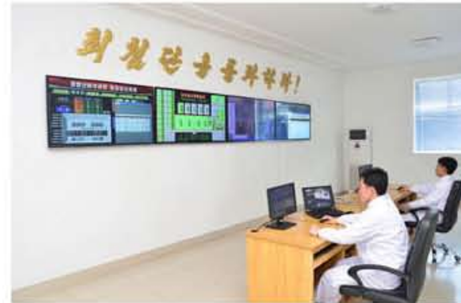
Main business strategy of the farm is the scientification of mushroom cultivation.