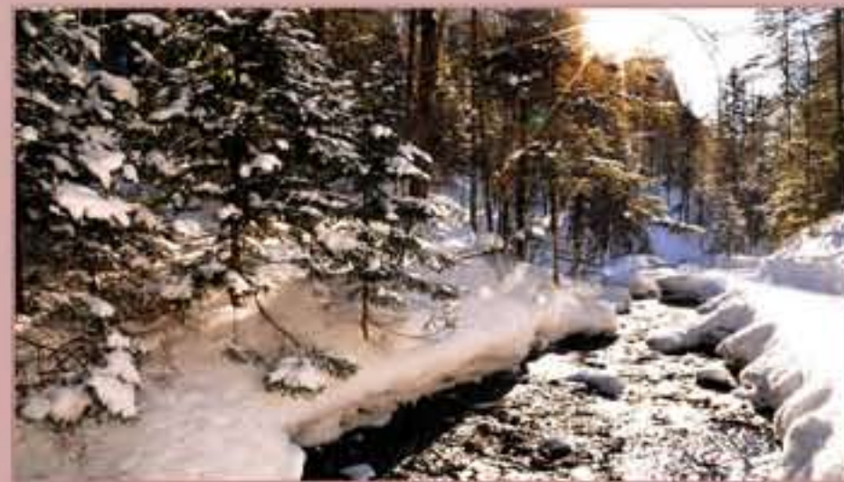
Sobaek Stream Flowing All the Year Round.