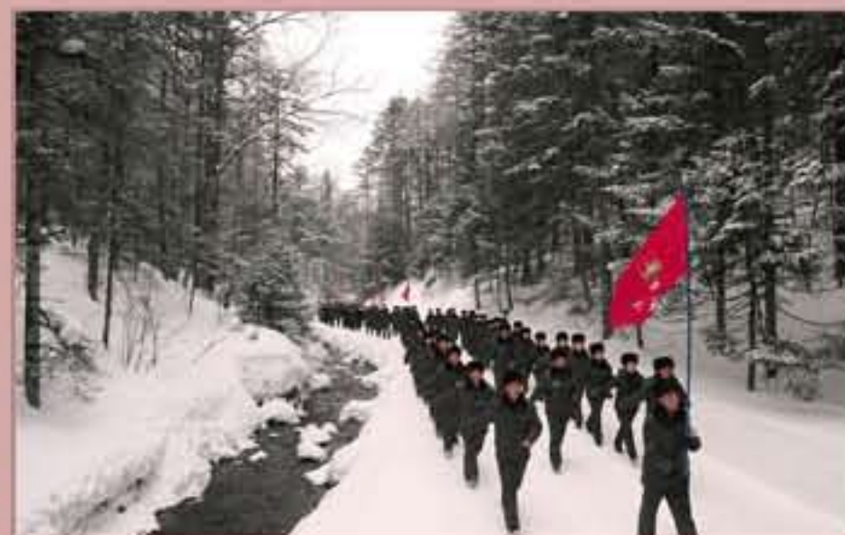
Endless Stream of Visitors.