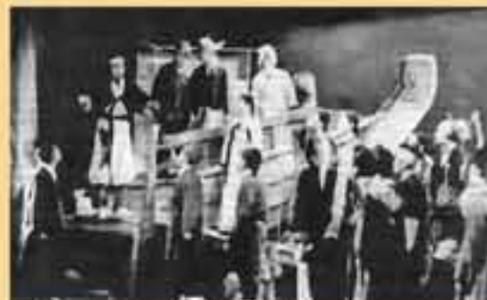
A scene from the opera The Tale of Sim Chong [Juche 36 (1947)].