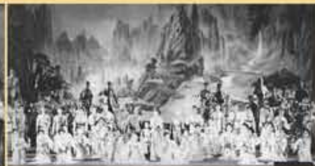
A scene from the folk opera Eight Fairies in Mt Kumgang [Juche 57 (1968)].