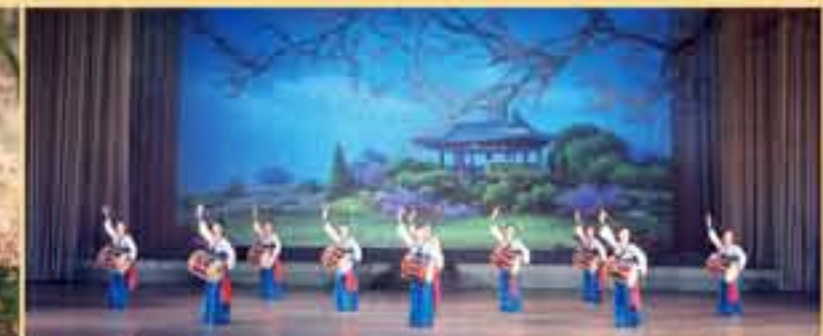
A scene from the folk dance suite The People in the Walled City of Pyongyang [Juche 86 (1997)].