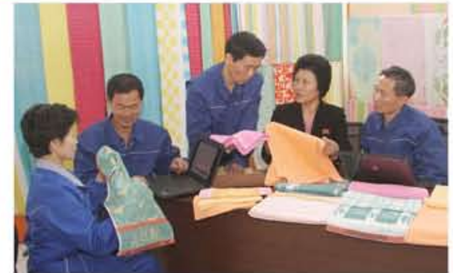
Creative opinions of the workers realize in product designs.