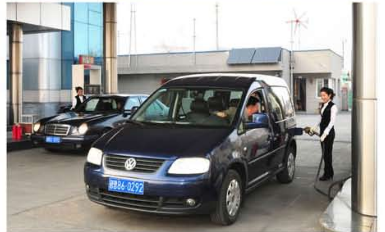
They produce electricity for business management by making use of natural energy sources.