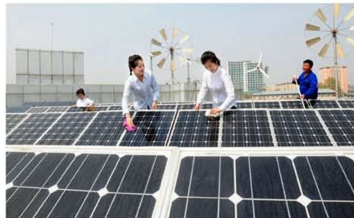
Efforts for raising efficiency of wind and solar energy resources are made.

Numerous factories, enterprises and institutions in the DPRK generate electricity by solar and wind power, in an effort to implement the WPK's policy to ease the strain on electric supply by making proactive use of natural energy.