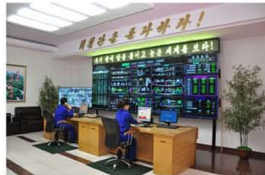
IMS control room.