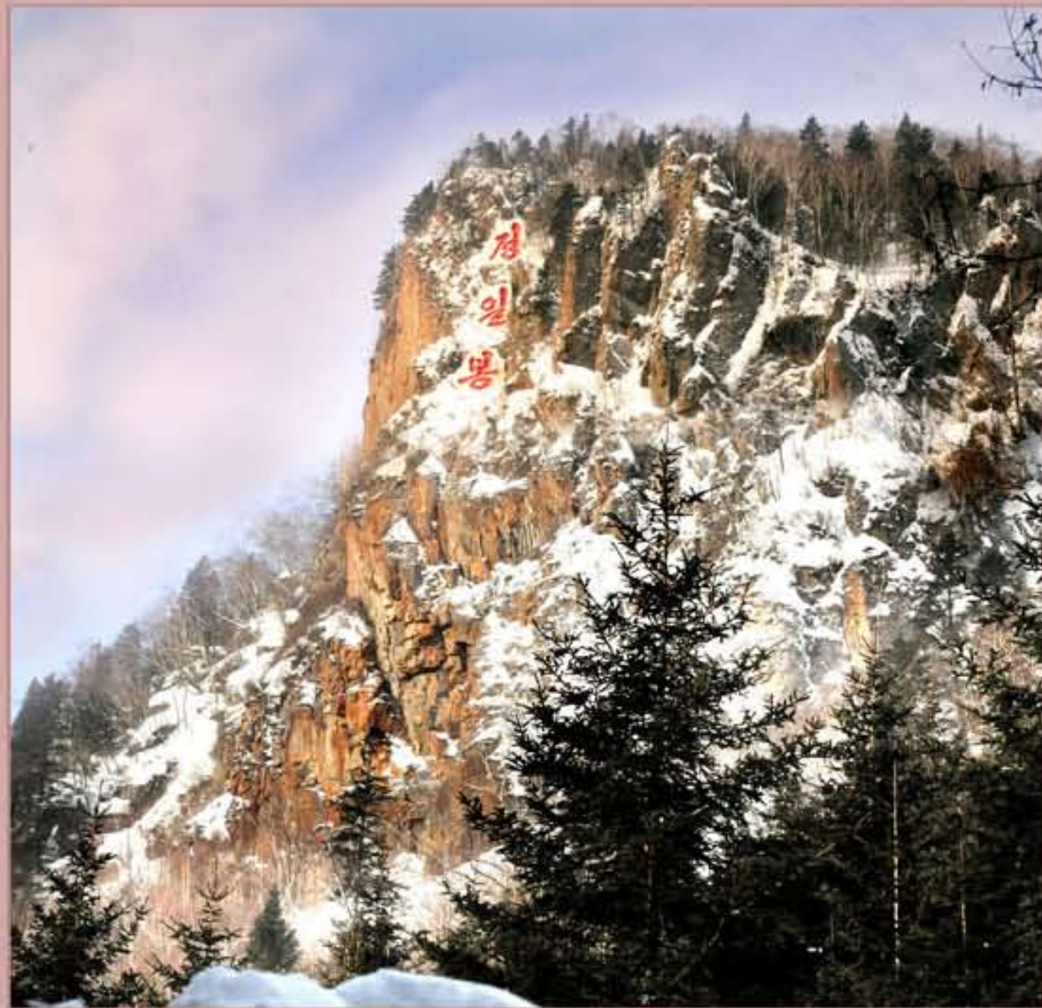
Most Sublime Jong Il Peak.