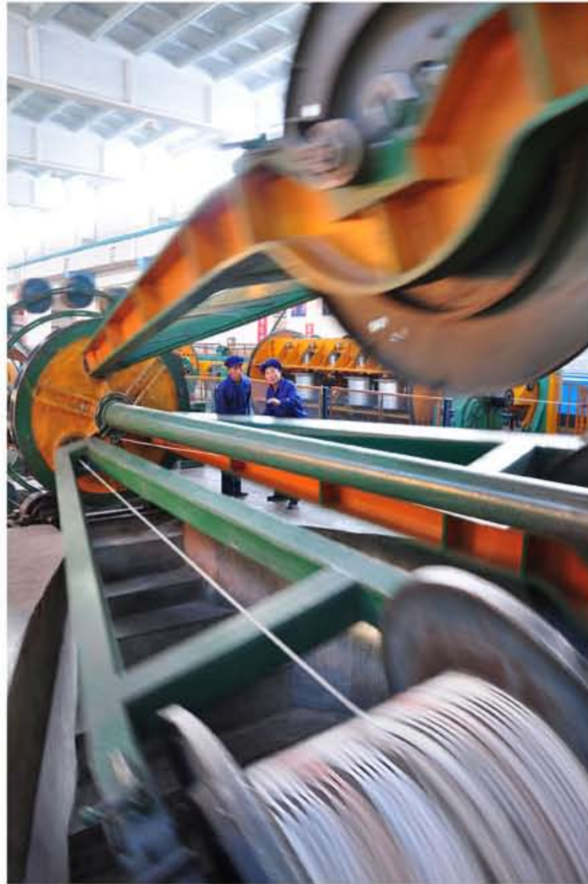
The factory turns out a variety of electric cables to meet the urgent demands of the several sectors of the national economy.

Article: Kim Thae Hyon