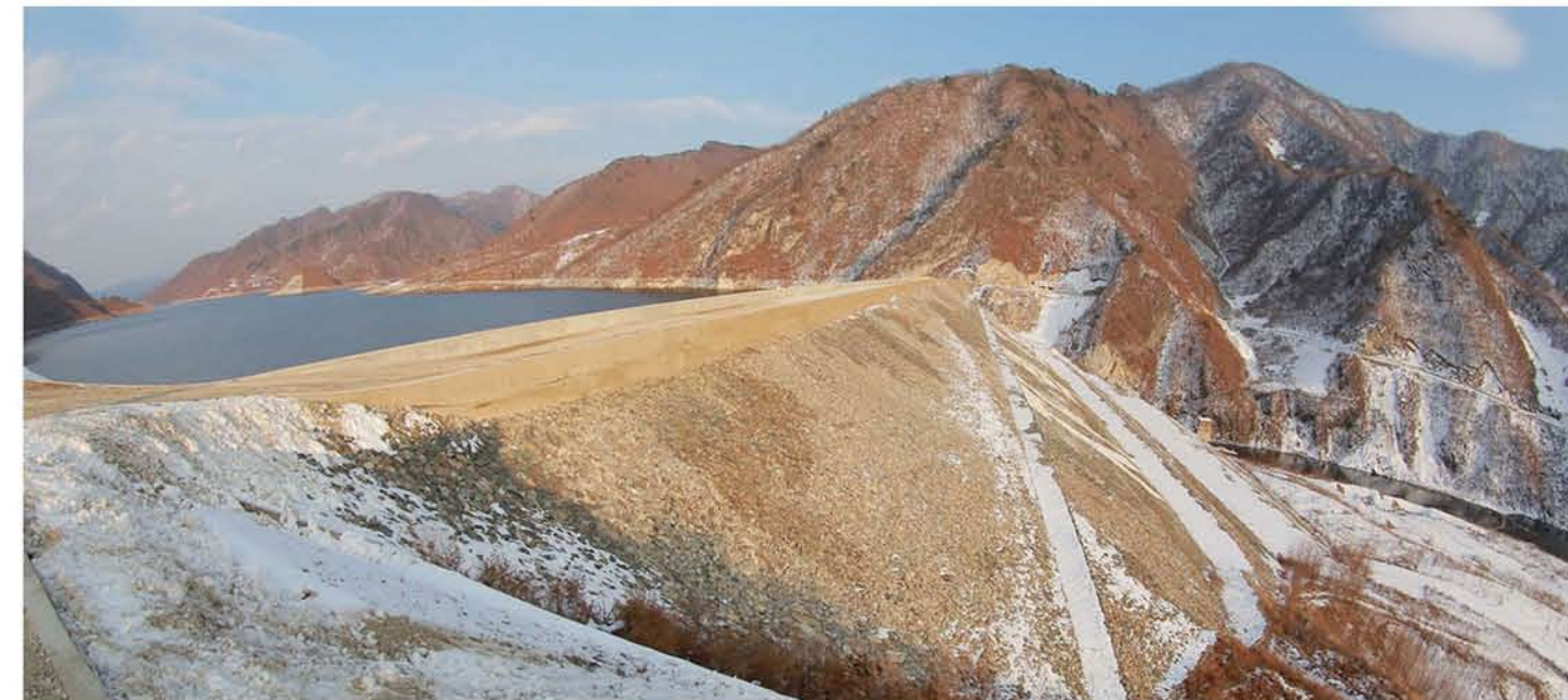
The Wonsan Army-People Power Station showing great vitality of self-development-first spirit.