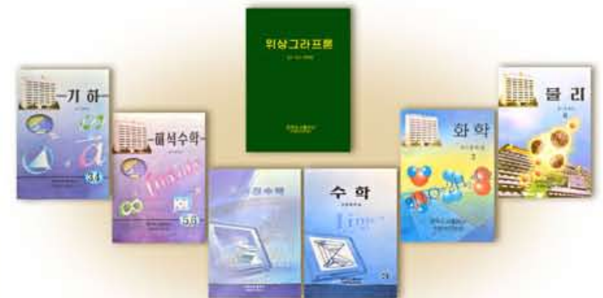
Some of textbooks and reference books written by Ryu.