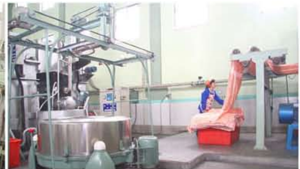
Modernization of the production lines is carried out by dint of spirit of self-reliance and self-development to improve the quality of the goods.