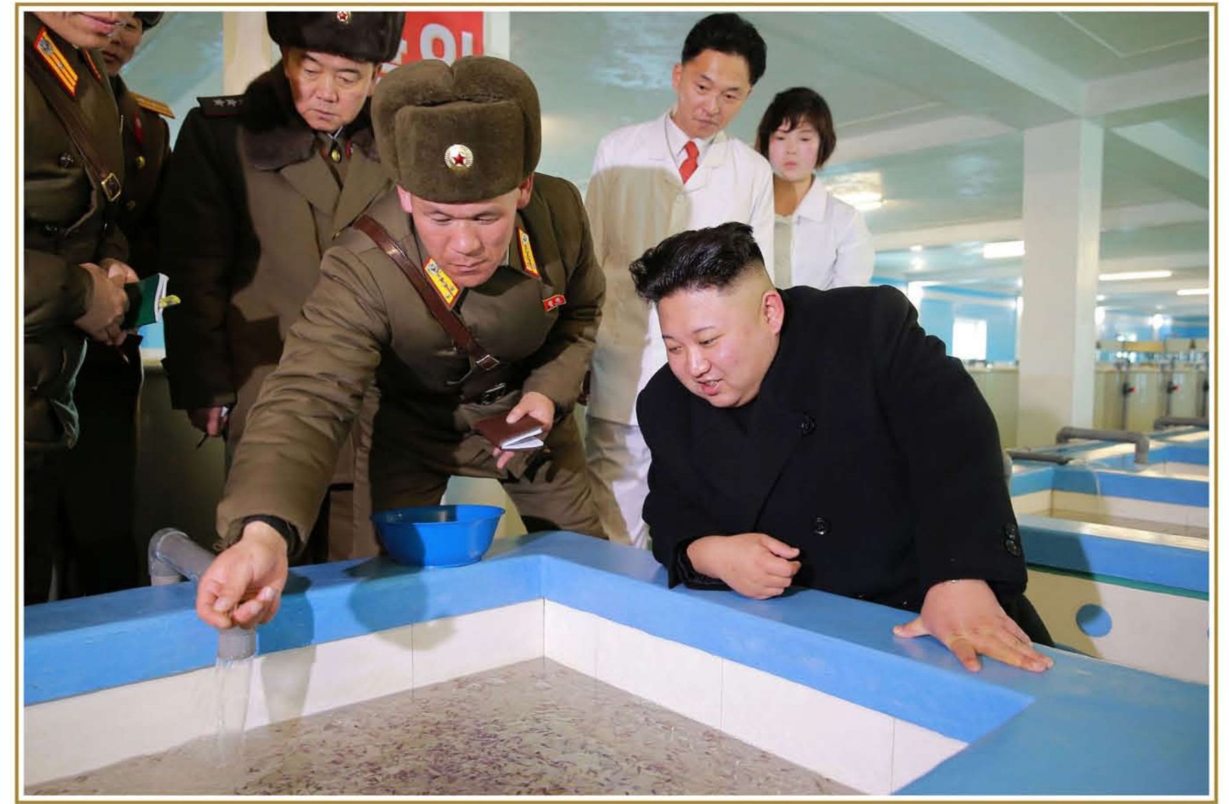
The respected Supreme Leader Kim Jong Un looks round the Samchon Catfish Farm [February Juche 106 (2017)].