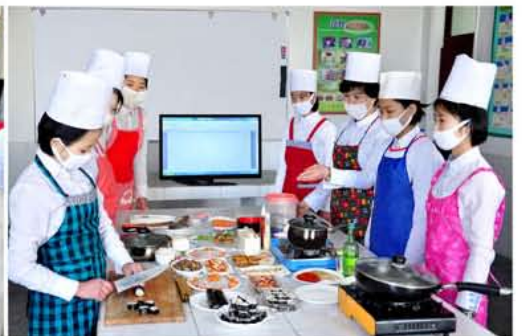
Students acquire versatile knowledge in the improved educational environment.