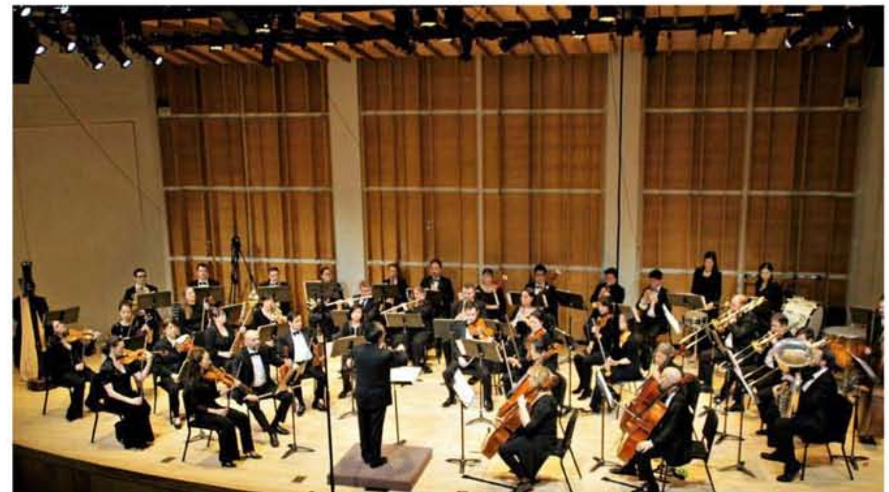
Koreans in the US and local artistes performed a concert "Spring in February" at a concert hall in New York to celebrate the 75th birth anniversary of the great leader General Kim Jong Il.