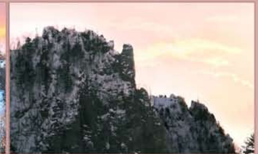
Sunrise Rock, Winged-Horse Rock and Sword Rock.