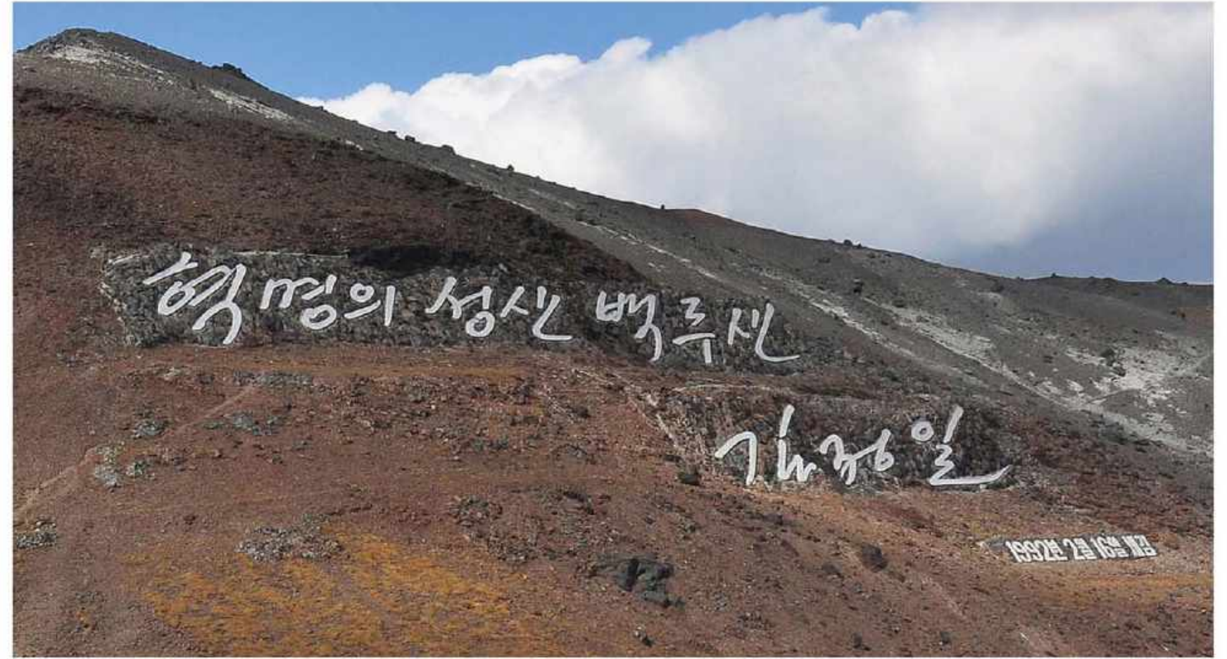
Autographic Writing Inscribed on Hyangdo Peak