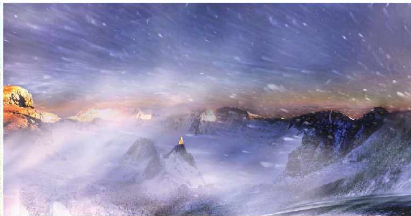
Blizzards of Paektu