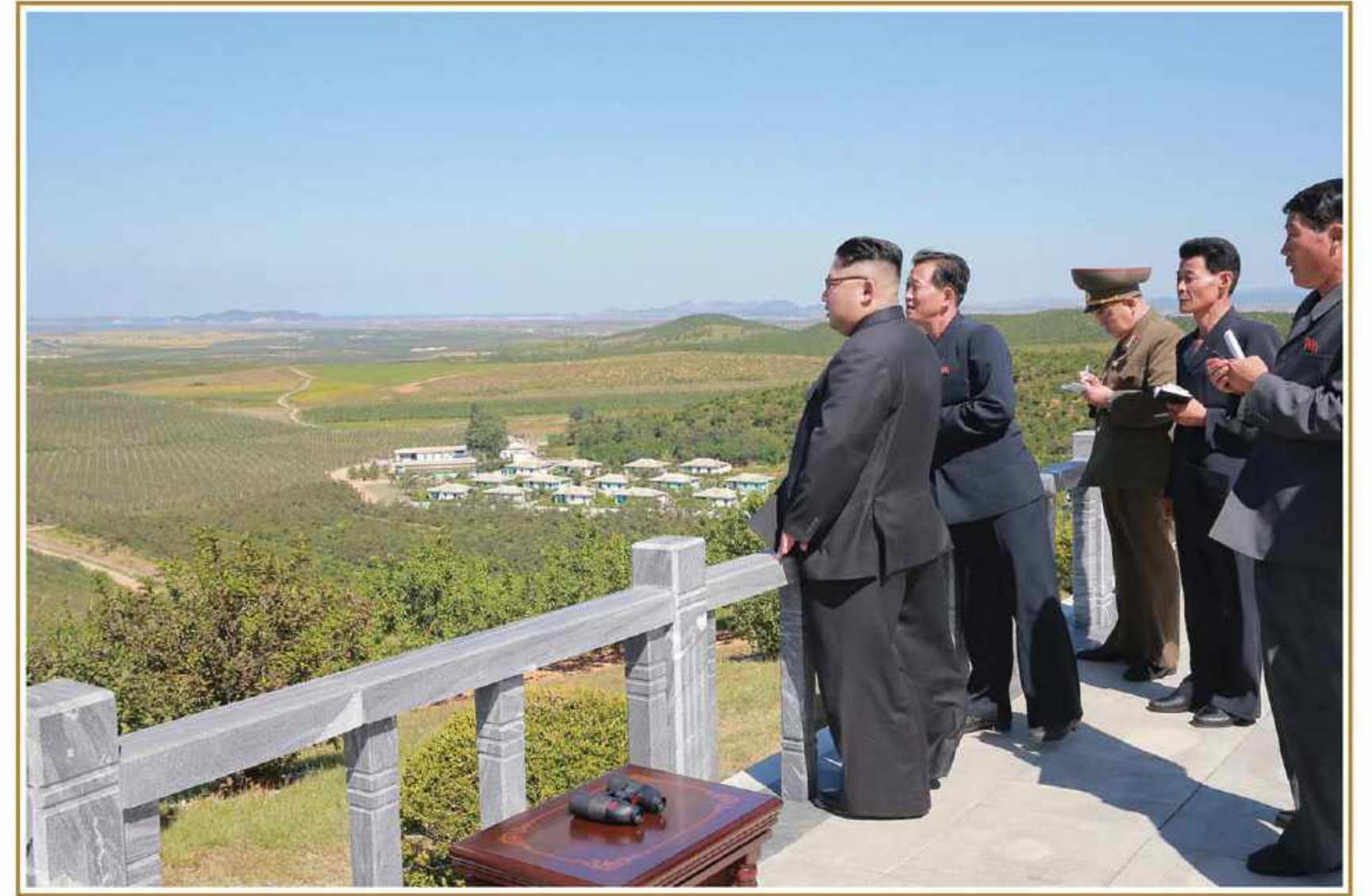
The respected Supreme Leader Kim Jong Un commands a bird's-eye view on the platform [September Juche 106 (2017)]