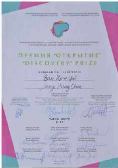
Diploma of special prize at the first category of the Second Moscow Krainev International Piano Contest