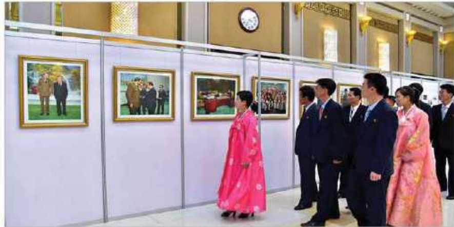
Photo Show Marks the Birthday of Fidel Castro and the Month of Solidarity with the Cuban People

A photo show was held at the Taedonggang Diplomatic Club to mark the 91st birthday of Fidel Castro and the month of solidarity with the Cuban people. The participants looked round the photos showing the immortal exploits of President Kim Il Sung and Chairman Kim Jong Il who had forged and developed the traditional bilateral relationship, and the life of Fidel Castro.