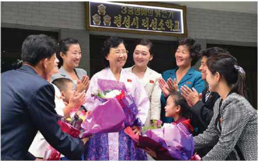
Choe's children express their respect and love for the mother