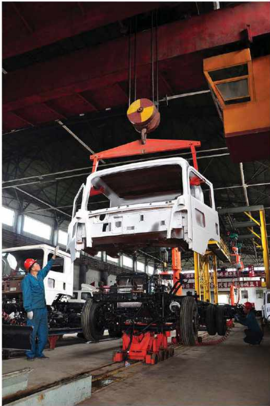
They solve scientific and technological problems arising in the lorry production on their own efforts while hastening the assembling of lorries

The Sungni Motor Complex is making great innovations in the production of a new type of lorry in this year that is of key importance in carrying out the five-year strategy for national economic development. During the past decades the complex manufactured the Sungni 58-type lorry and other vehicles to make a contribution to the economic development of the country. Last year on the occasion of the Seventh Congress of the Workers' Party of Korea it built a production line of a new type of lorry and set to its serial production from the beginning of this year. Officials, workers and technicians at the complex were full of