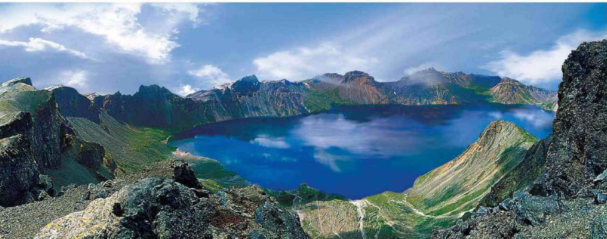
The Thrilling yet Graceful Scene of Lake Chon