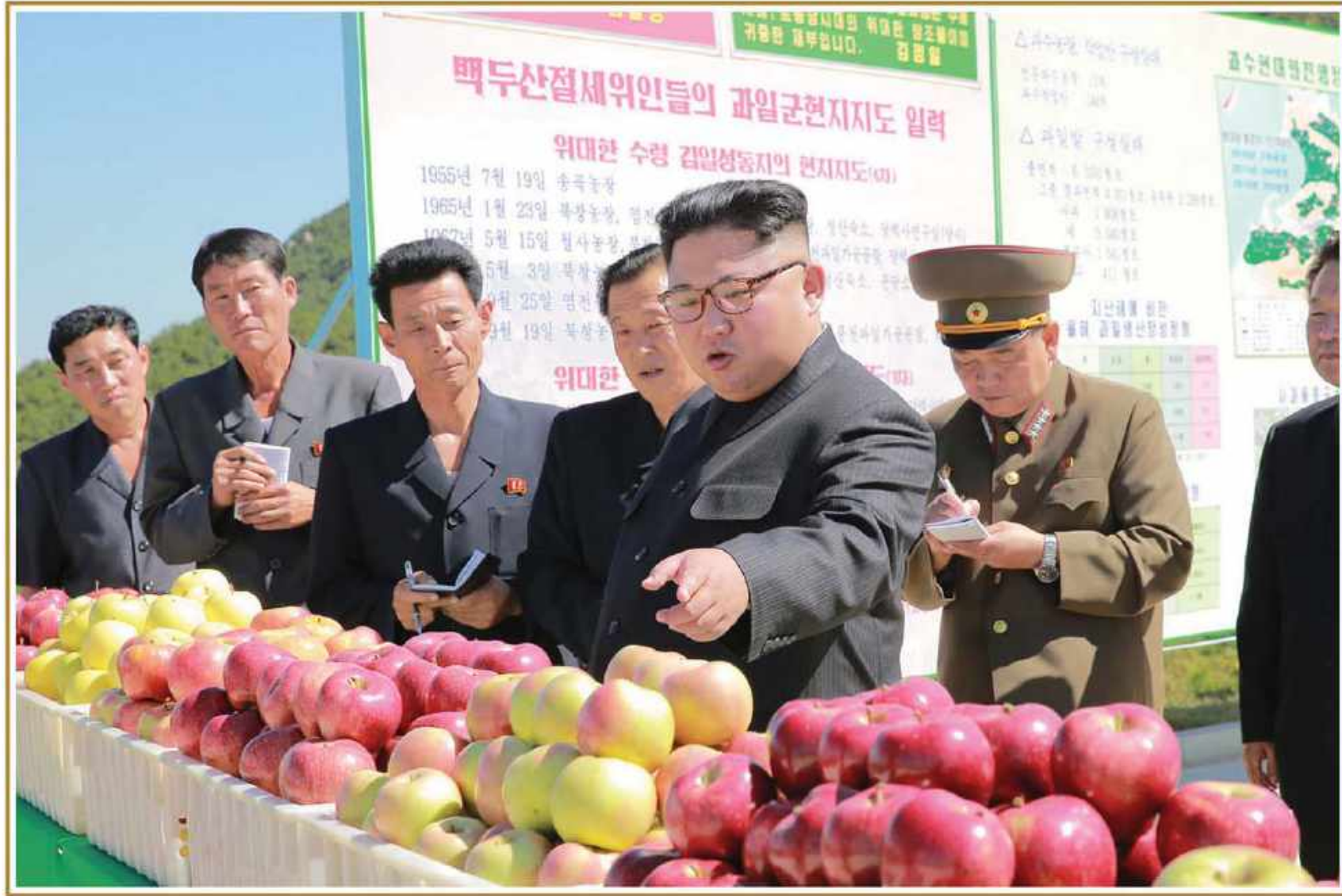
The respected Supreme Leader Kim Jong Un sees a variety of fruit [September Juche 106 (2017)]