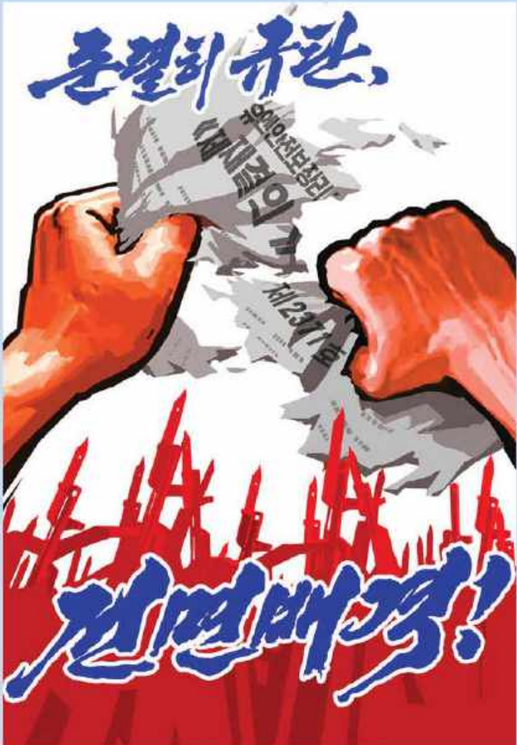
"Strong Denunciation, Total Rejection!"