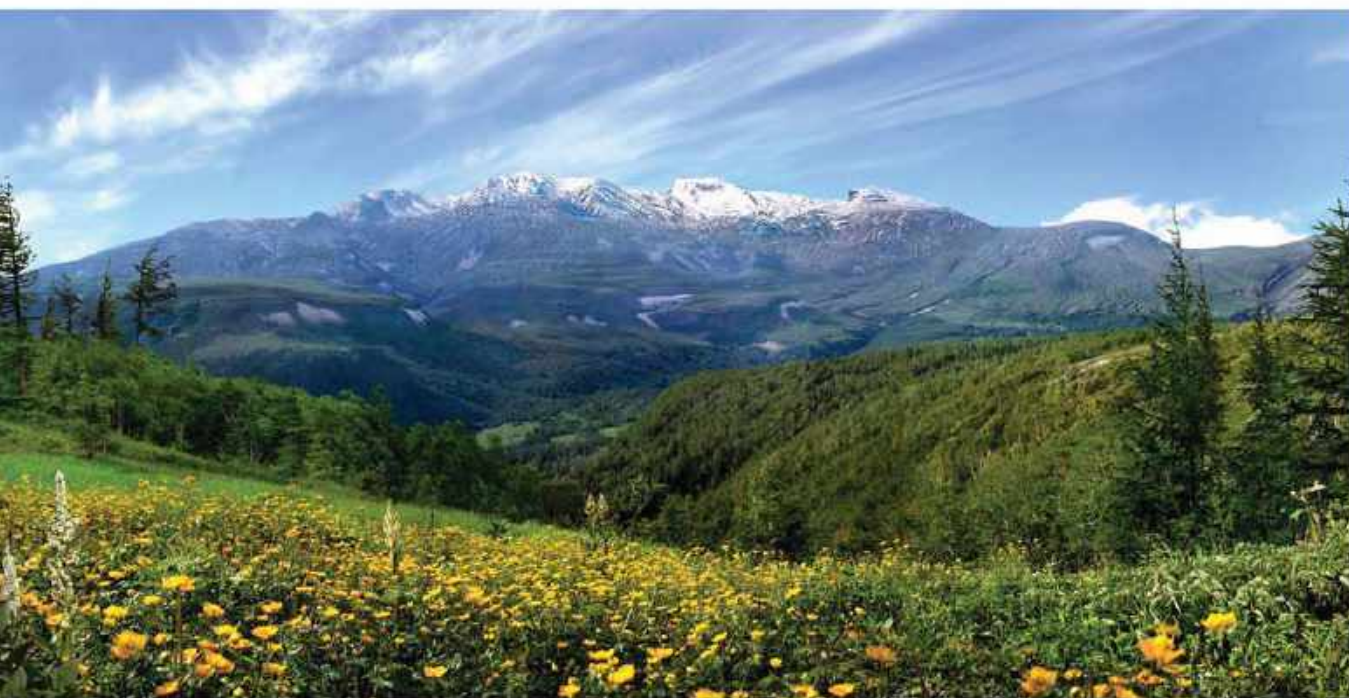
Majestic Appearance of the Peaks on Mt Paektu