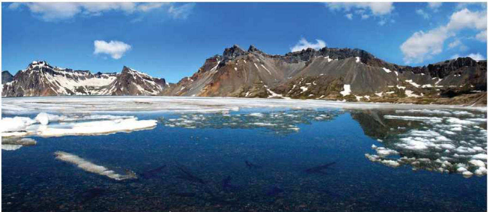
Lake Chon Teeming with Chars