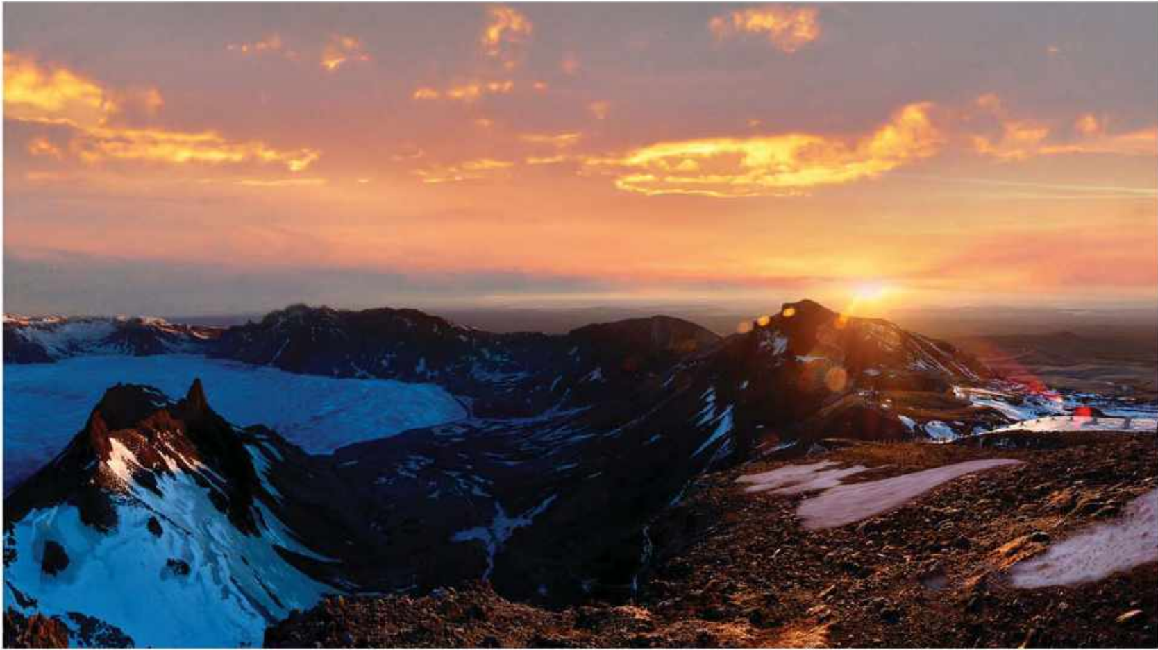
Sunrise on Mt Paektu