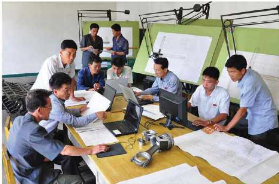
Precedence is given to designs for new-type lorry