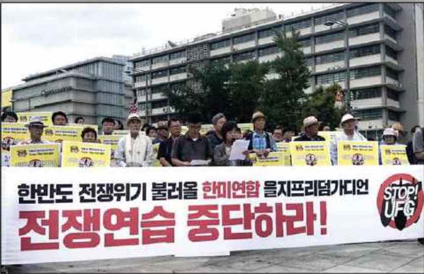
South Korean people criticize US president Trump for uttering reckless remarks and driving the situation on the Korean peninsula to the crisis