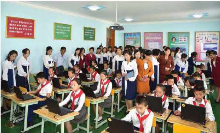
Teachers look round the educational establishments with excellent conditions and environment