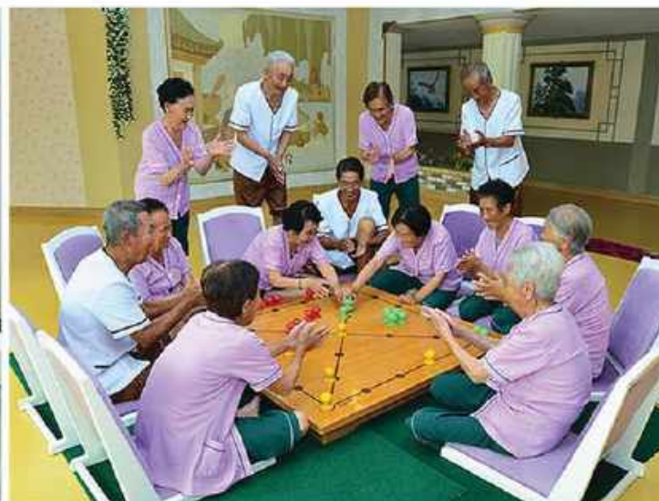
Pleasant time at recreation and fitness rooms