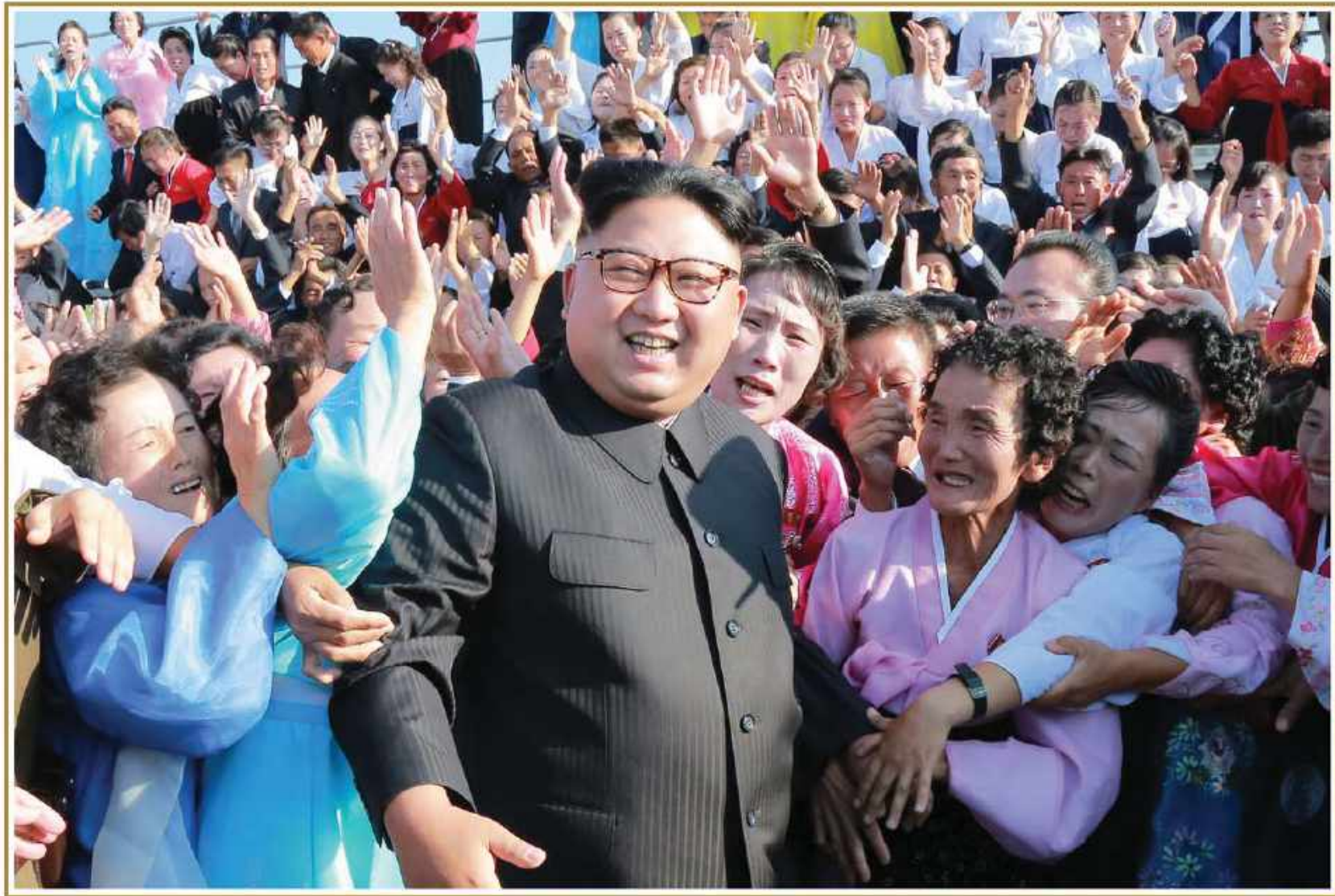
The respected Supreme Leader Kim Jong Un meets the teachers who volunteered to work at schools on islands and in frontline areas and mountain villages [September Juche 106 (2017)]