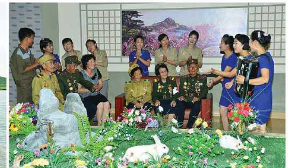
They feel rejuvenated with each passing day