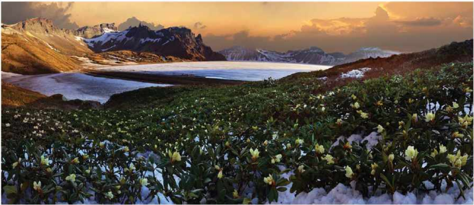
Rhododendron Blooming in Snow