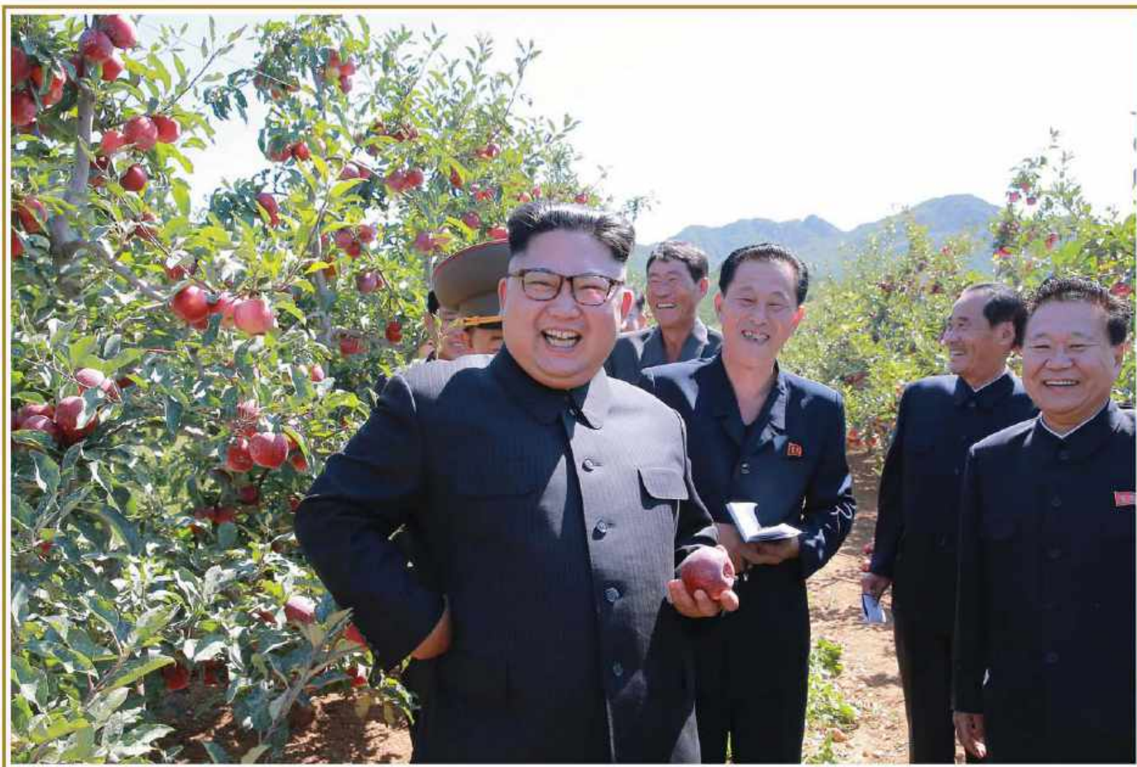
The respected Supreme Leader Kim Jong Un gives on-site guidance at Kwail County, South Hwanghae Province [September Juche 106 (2017)]