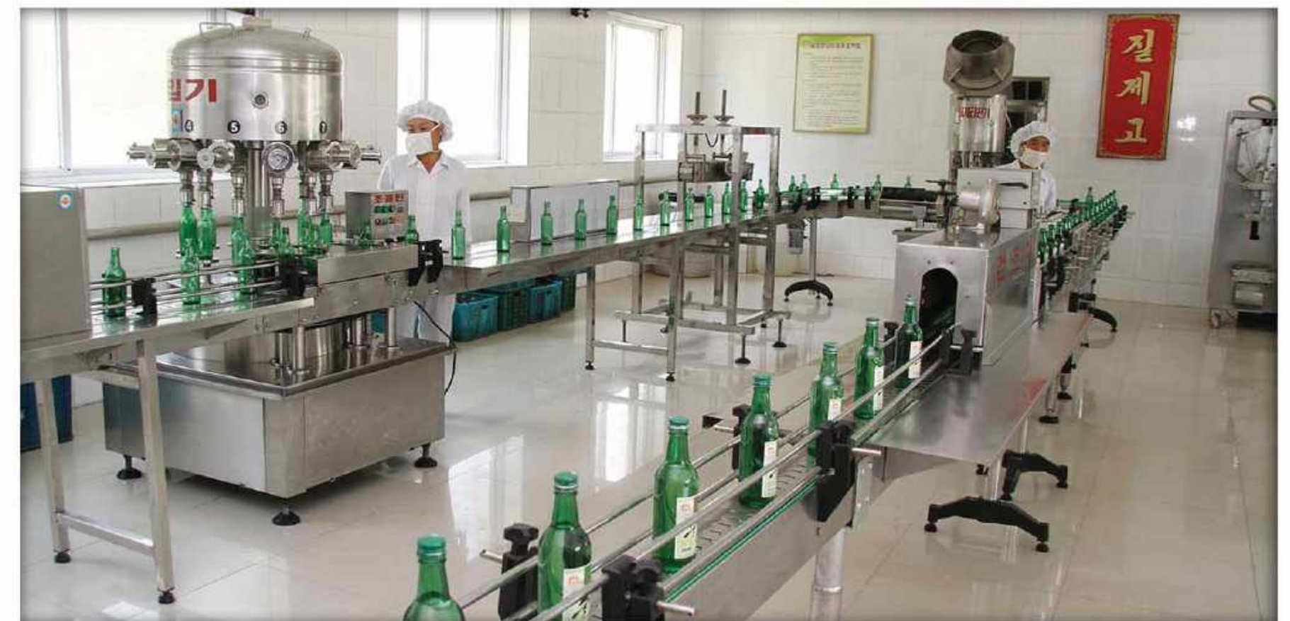
Changsong Foodstuff Factory turns out natural health drinks and foods of high quality with fruits and wild edible greens available in the county