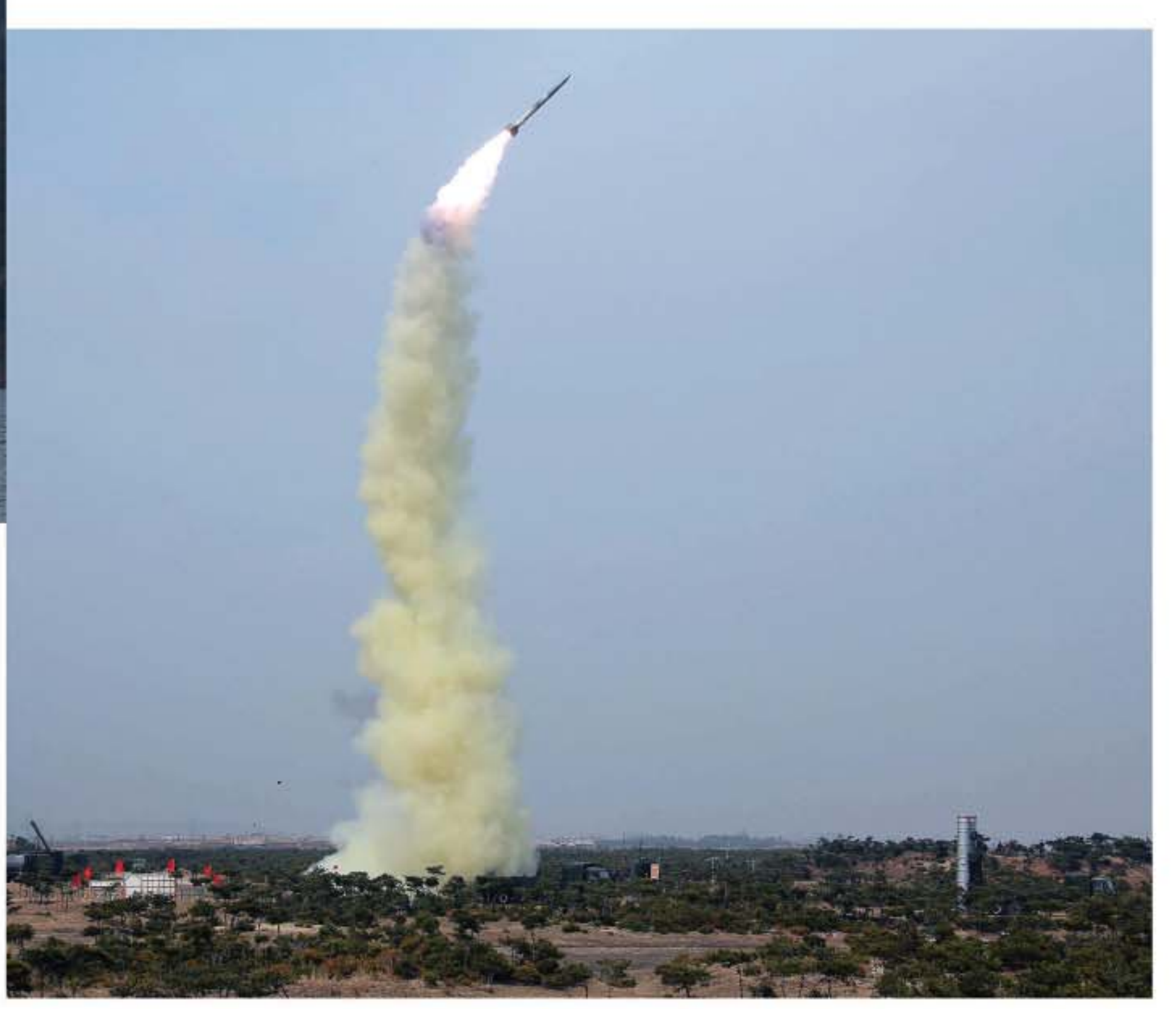
Test-fire for the judgment of combat performance of new anti-aircraft guided weapon system is being successfully conducted