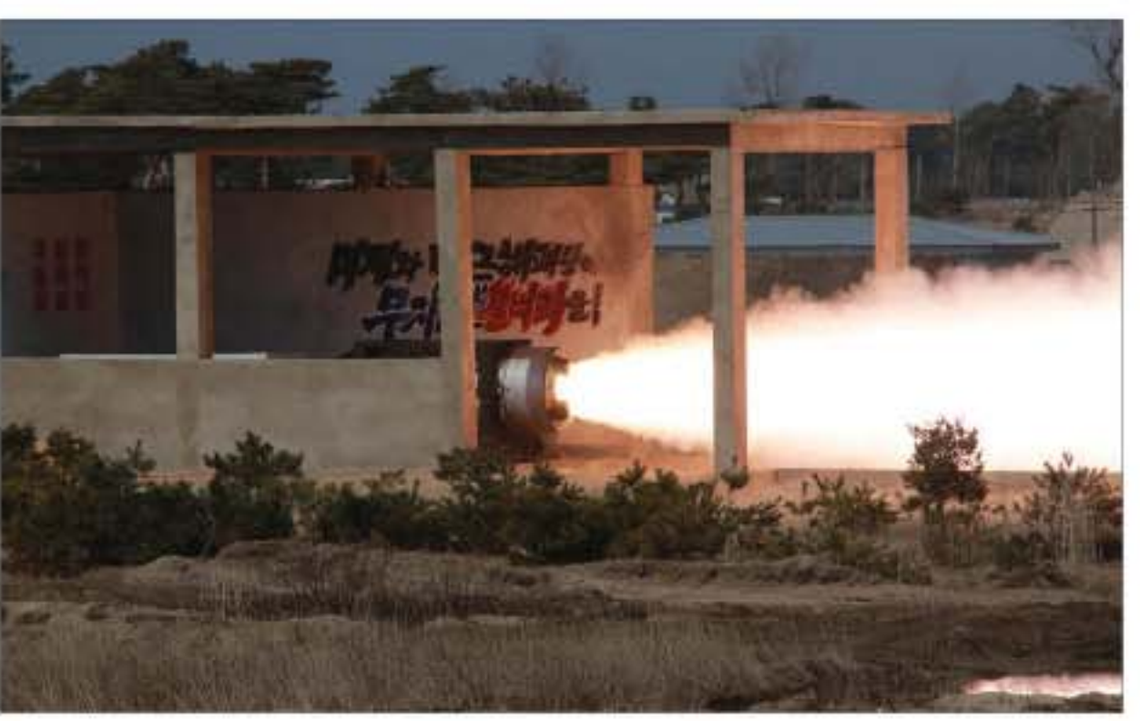
Successful on-the-ground jet test of high-powered solid-fuel rocket engine and its cascade separation provides a new springboard for the development of the country's rocket industry