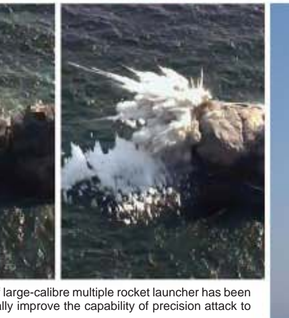
A new generation of large-calibre multiple rocket launcher has been developed to radically improve the capability of precision attack to enemy targets