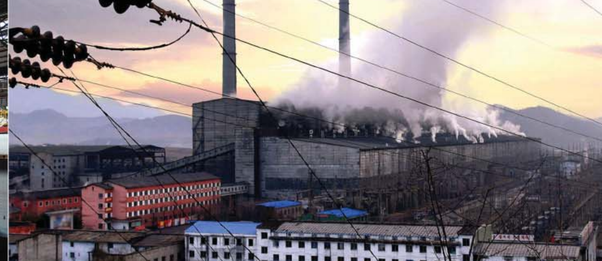
The production system of iron by Juche-based method has been completed and innovative successes achieved in the production of heavy rail at Hwanghae Iron and Steel Complex