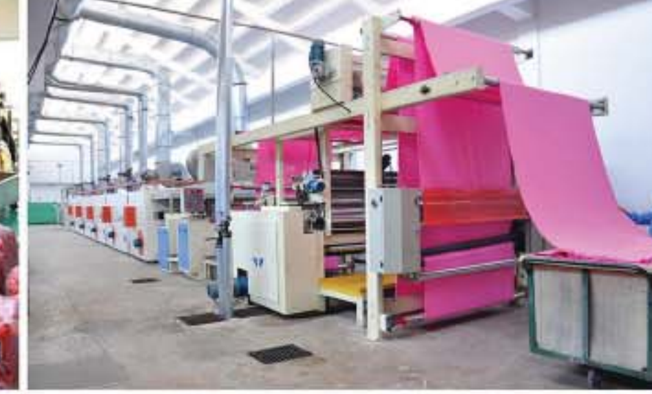
Light-industry factories maintain regular production