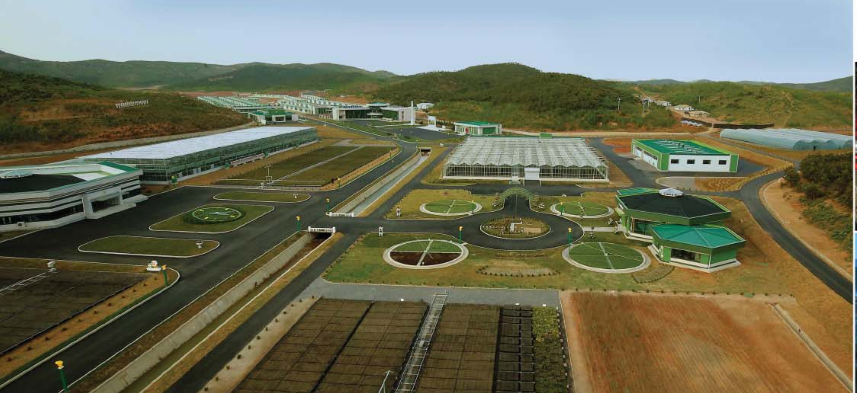
Newly-built Tree Nursery No. 122 of the KPA puts farming on a scientific, intensive and industrial basis at a high level in line with the age of knowledge economy