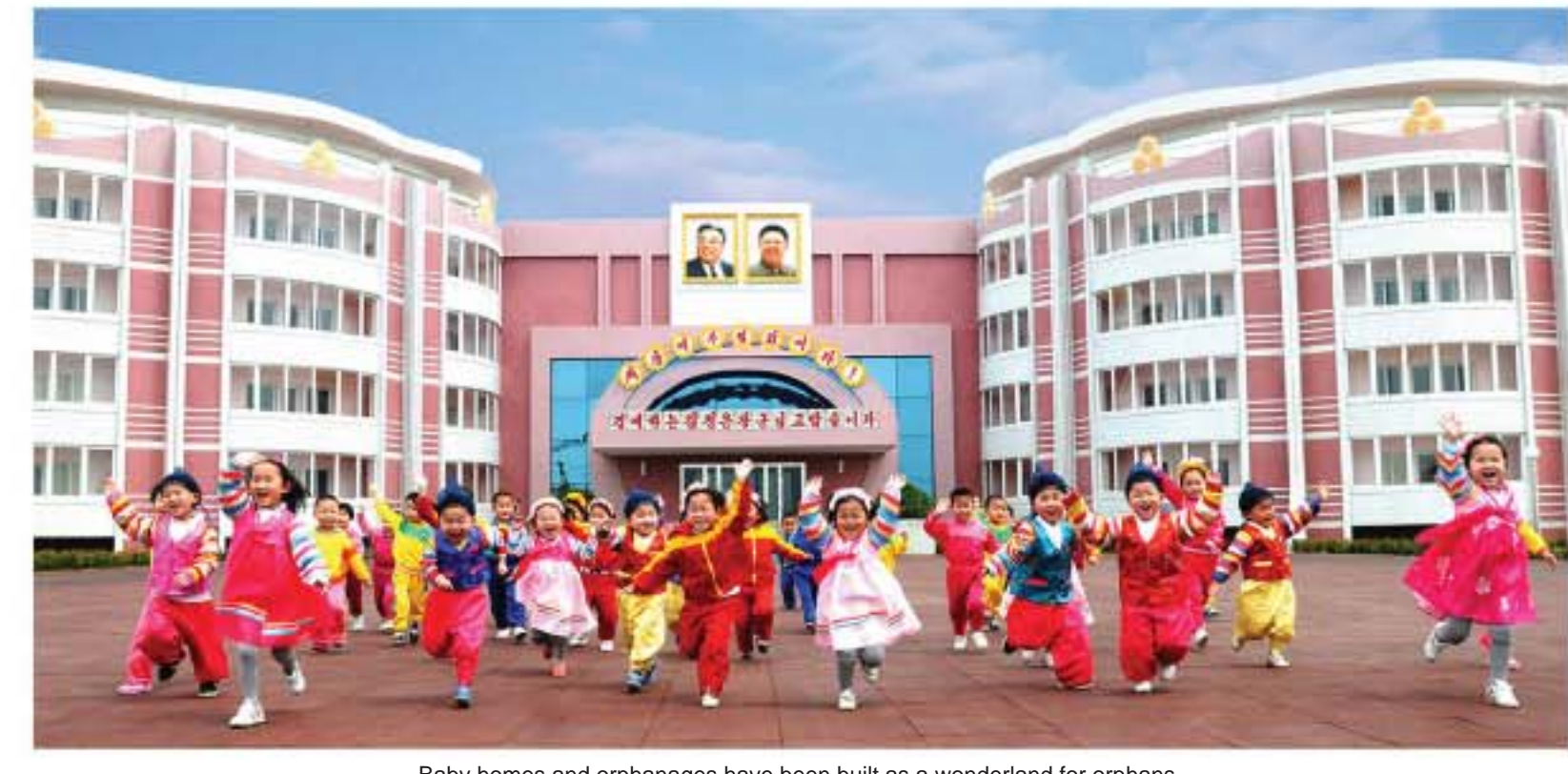
Baby homes and orphanages have been built as a wonderland for orphans