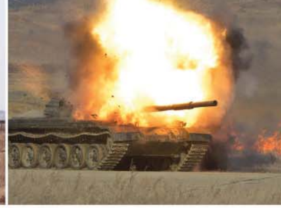
Light laser-guided anti-tank rocket with a surprising armour-piercing and explosive capability has been developed