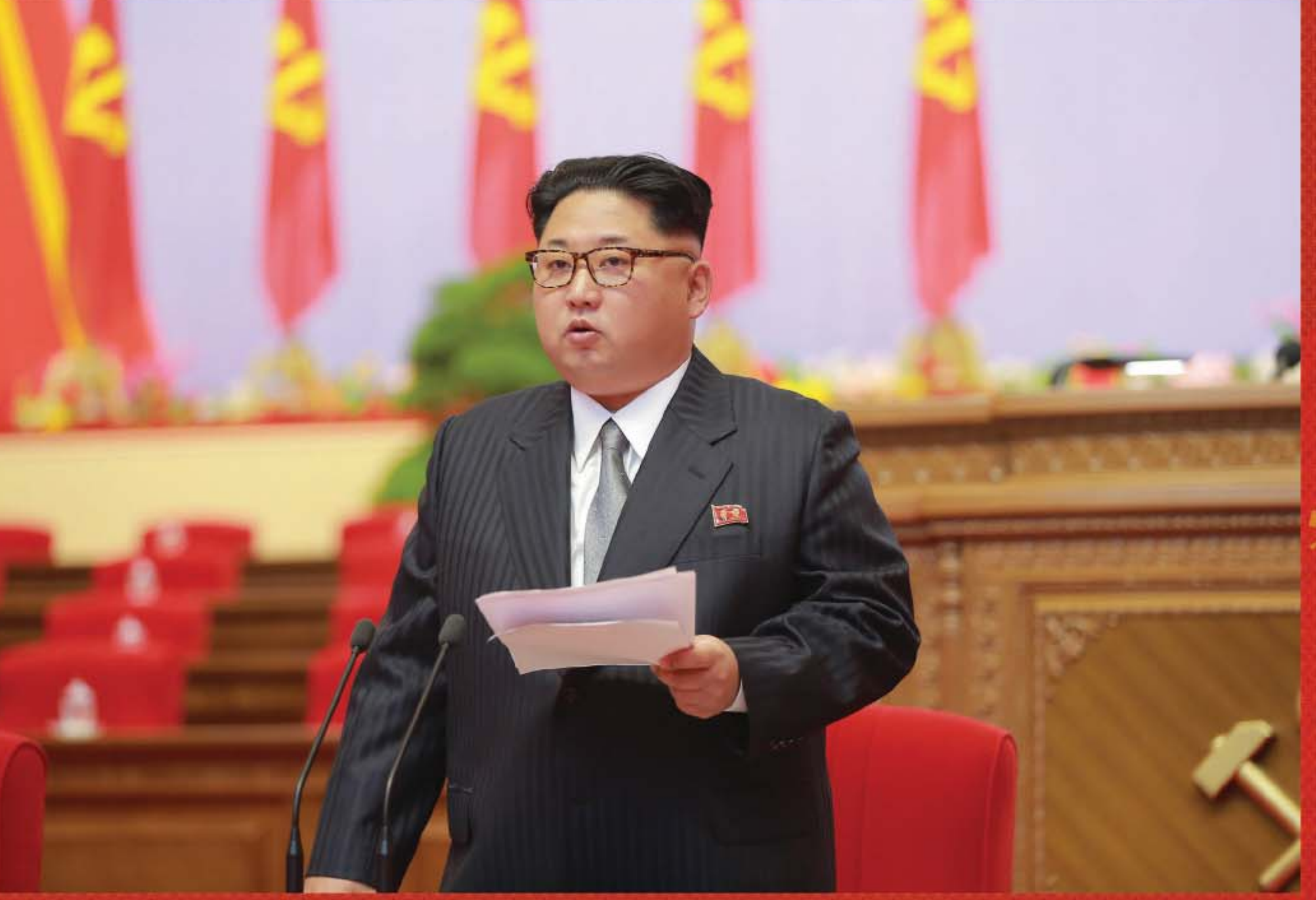
Kim Jong Un, First Secretary of the Workers' Party of Korea, delivers opening address at the Seventh Congress of the Workers' Party of Korea

im Hon Sik, Kim Kwang Thaek and other unforgettable During the period under review, the WPK embodied