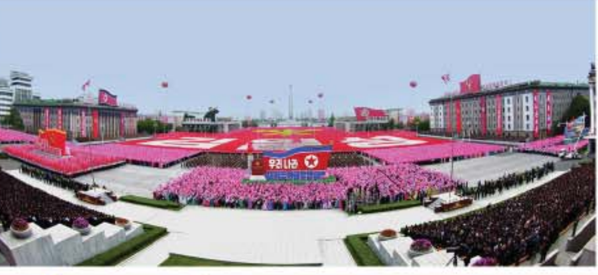
Shots of the mass rally and public procession