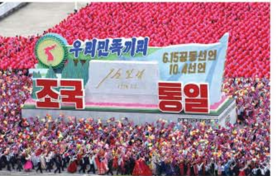
Pyongyang citizens in the public procession march past demonstrating the unshakeable faith and will to carry on the revolution following Kim Jong Un