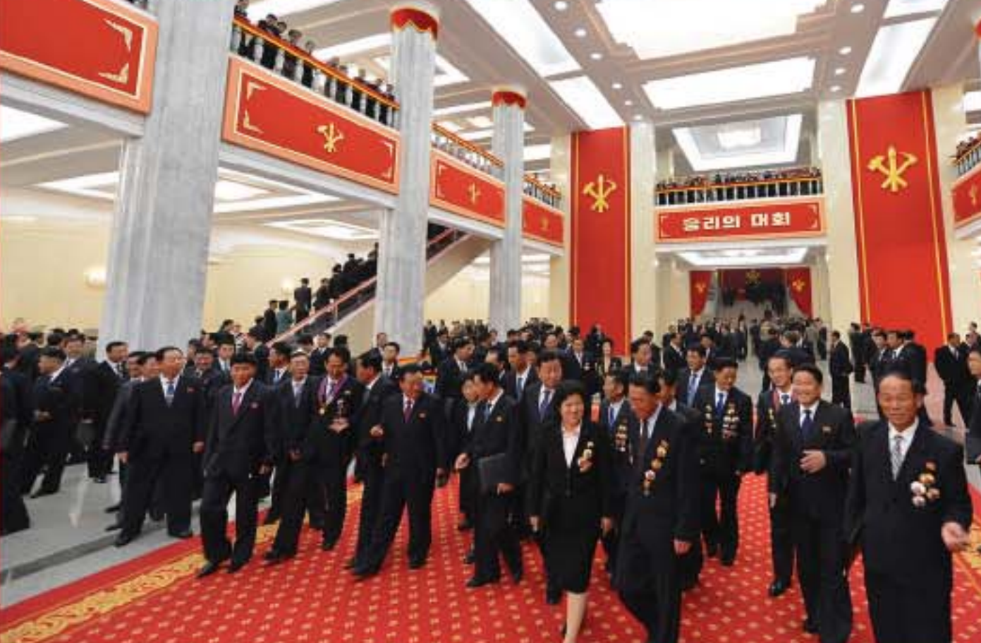
Those who attended the Congress are fully determined to inspire all the service personnel and people to implement the decisions of the Party Congress